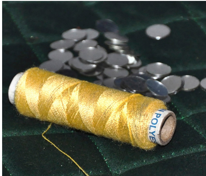
Threads, Needle and mirrors for stitching and decorating.