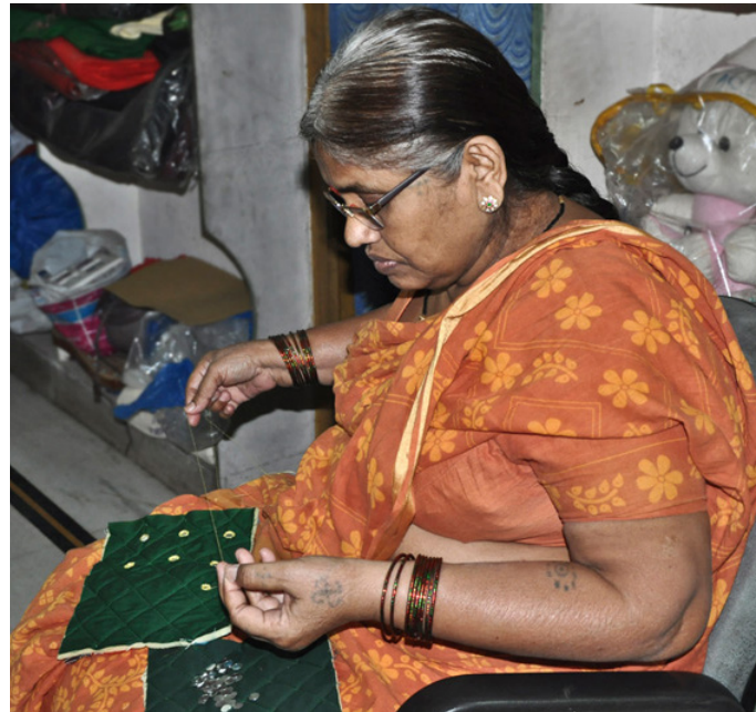
Vardhaman thread is used for embroidery.