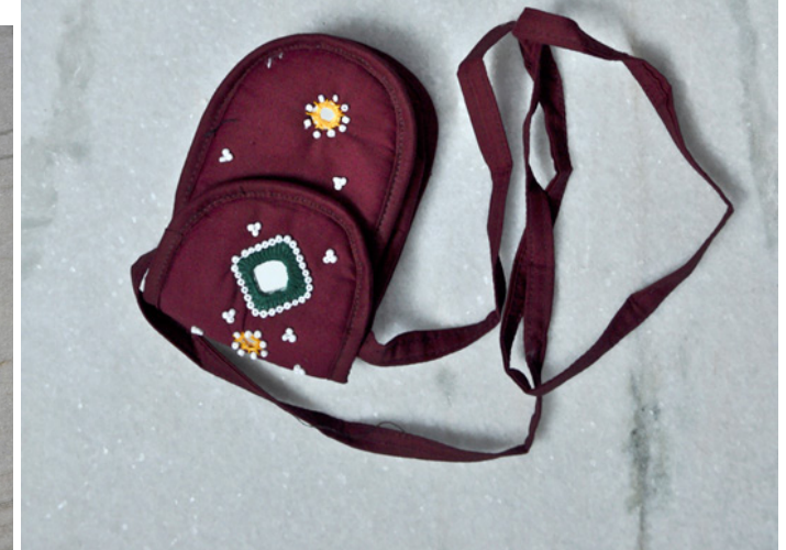
Purse and mobile pouch.