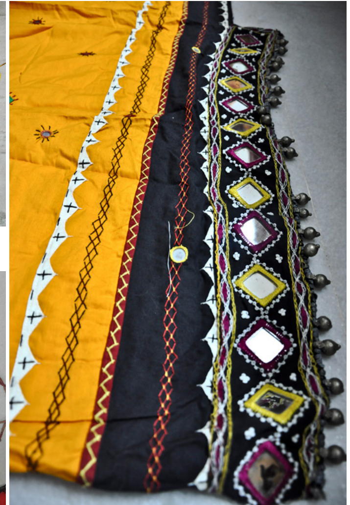
Border decorated with big mirrors and beads.