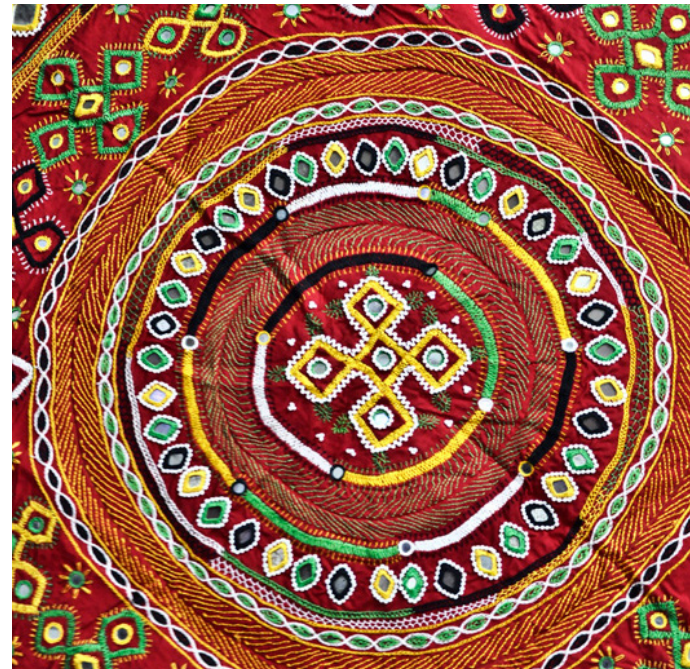
Banjara embroidery is done in intricate motifs with beads, mirrors and shells.

Banjara apparel with excessive mirror work and pleasing color combinations in perfectly balanced and blended way is a treat to the eyes. The Choli and the Skirt intricately embroidered with beads and shells are the main attraction for tourists. Despite their gradual absorption into the mainstream of life, the Banjaras still continue to keep in touch with their age-old customs, traditions and beliefs. Now this work is practiced in Sanjeev Reddy nagar in Hyderabad. They/Banjara artists run a shop named Rani Bhai Banjara Garments. They also take orders from government, which is exported around the world.