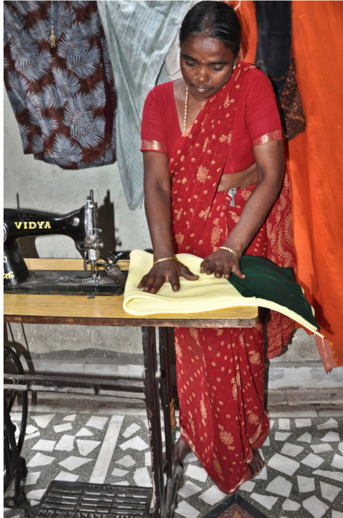
Sponge is kept under the cloth for stiffness.