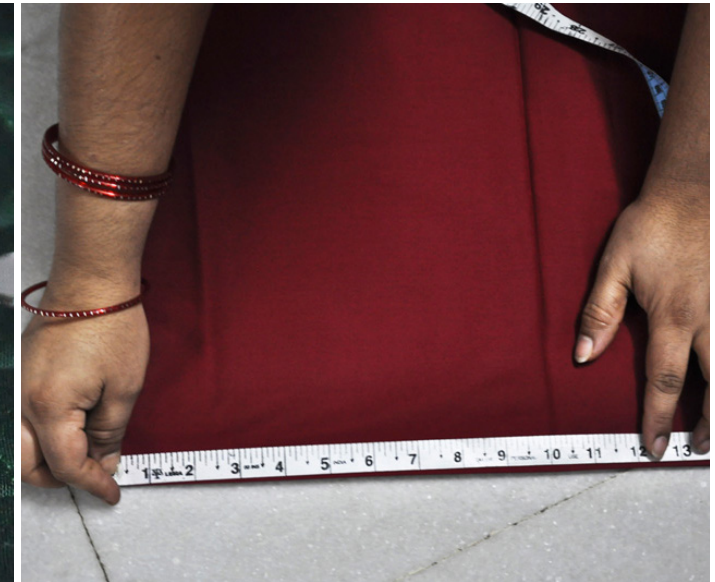
Clothes are measured using a measuring tape.