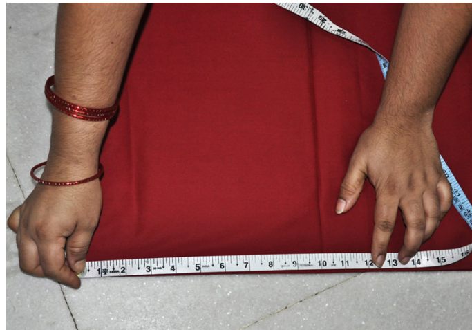
Cloth is measured and marked.