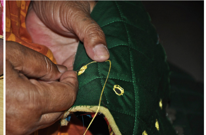
Thread is stitched around the glass piece.