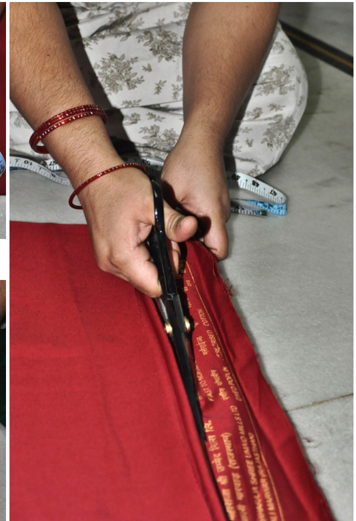
The measured cloth is then cut in required size and shape.