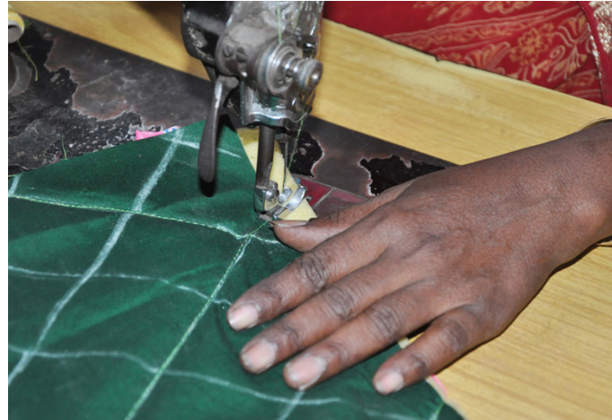
Cloth is stitched on drawn lines.

http://www.dsource.in/resource/banjara-embroidery-hyderabad/making-process