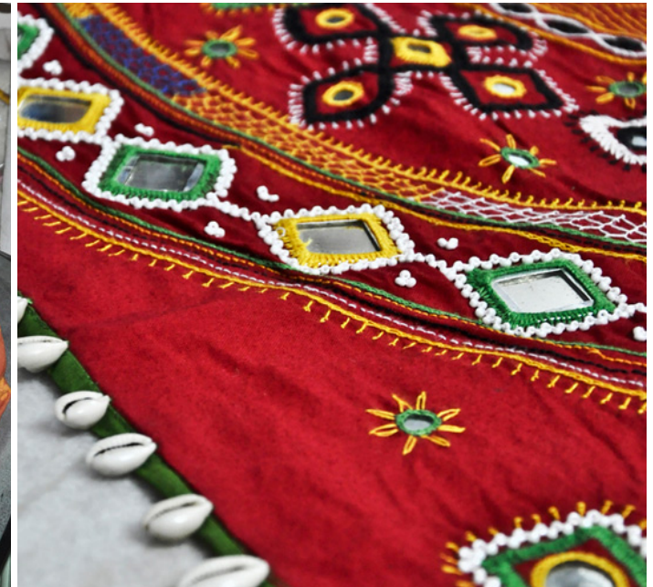
Final product with colorful threads and detail designs embroidered and decorated with beads and glass pieces.