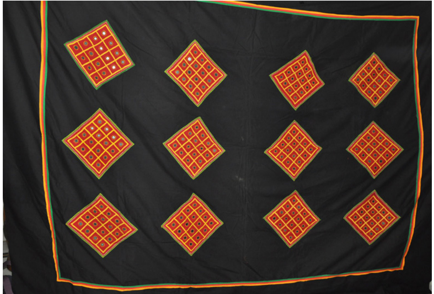
Embroidery design is stitched on Bed spread decorated with glass pieces.

Banjara artists make beautiful quilted rumals, bags and purses, usually on brown or sometimes blue cloth.