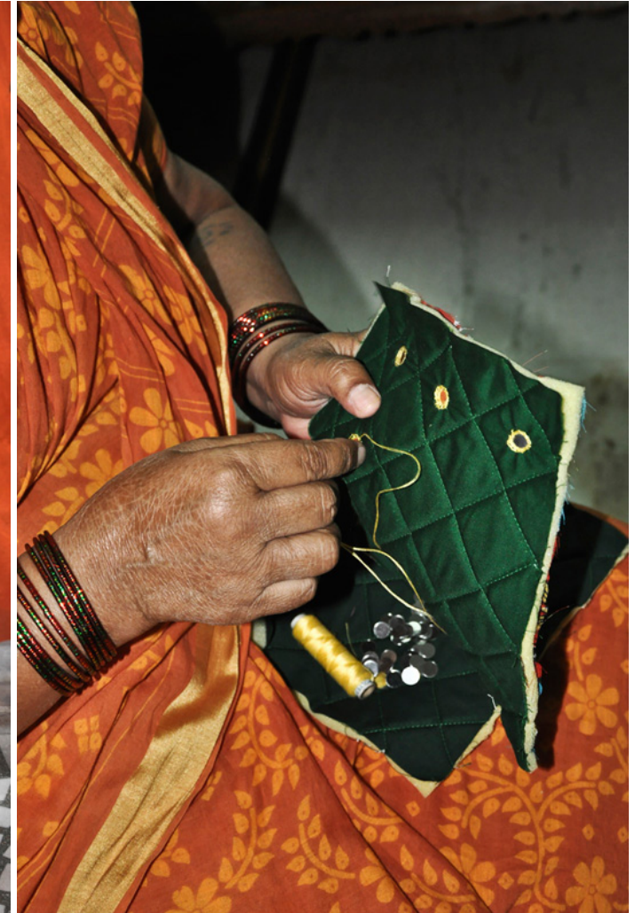
Artisan embroiders glass pieces on the cloth.