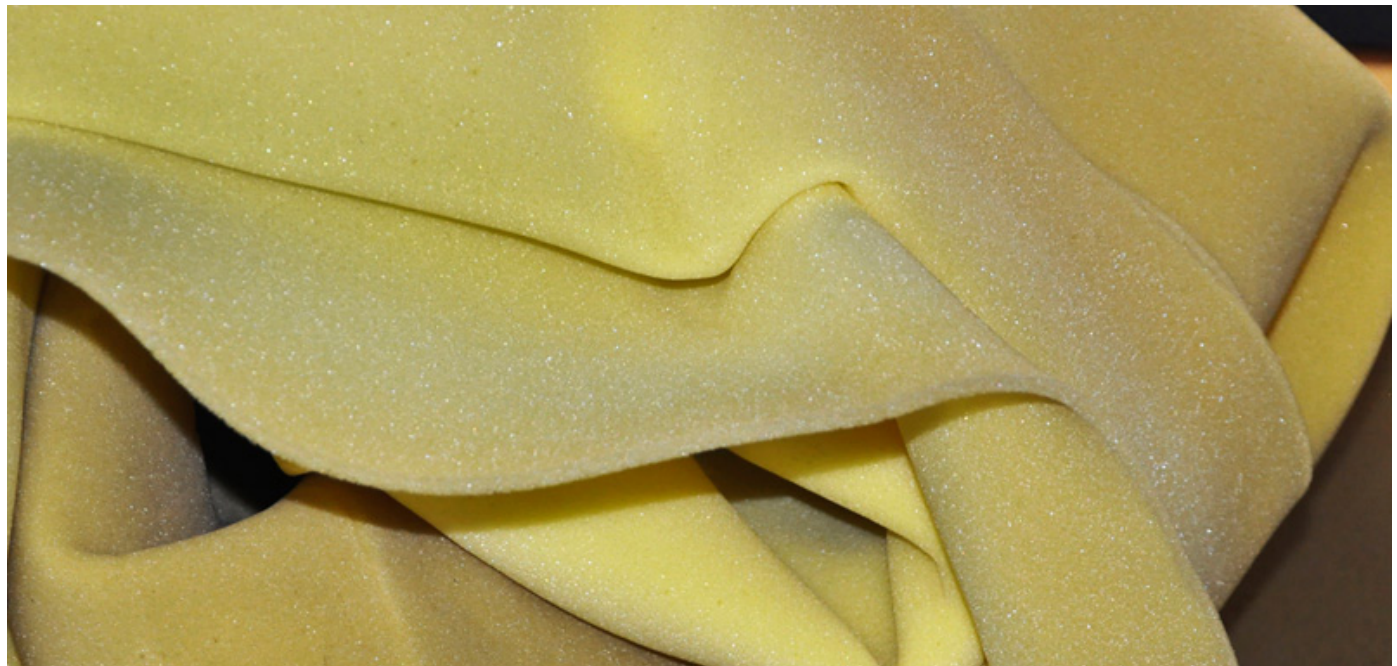
Sponge is kept under the cloth and stitched.