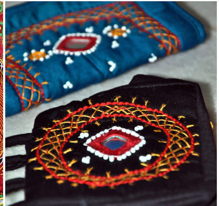
Bags and purses in bright colors embroidered with decorative beads.