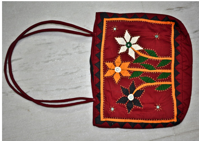
Bag with floral design embroidery.