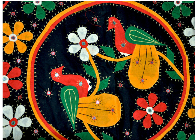
Patch work inspired by peacock.