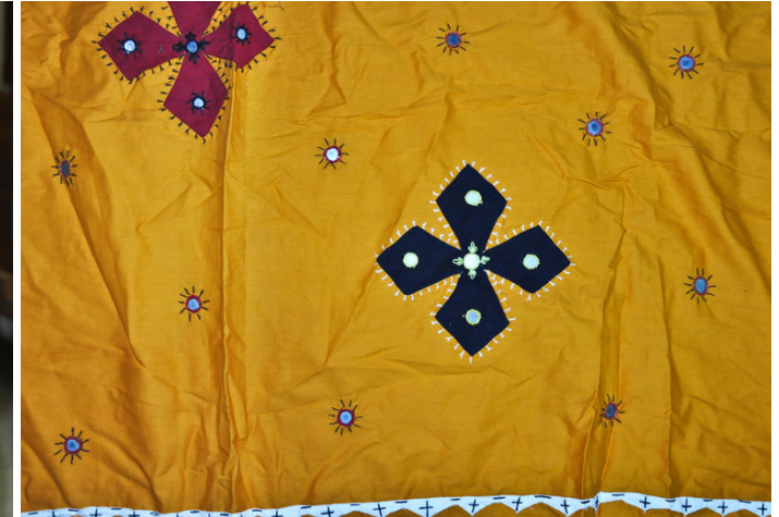
Different color cloths are cut into pieces and stitched on the clothes and decorated with beads.