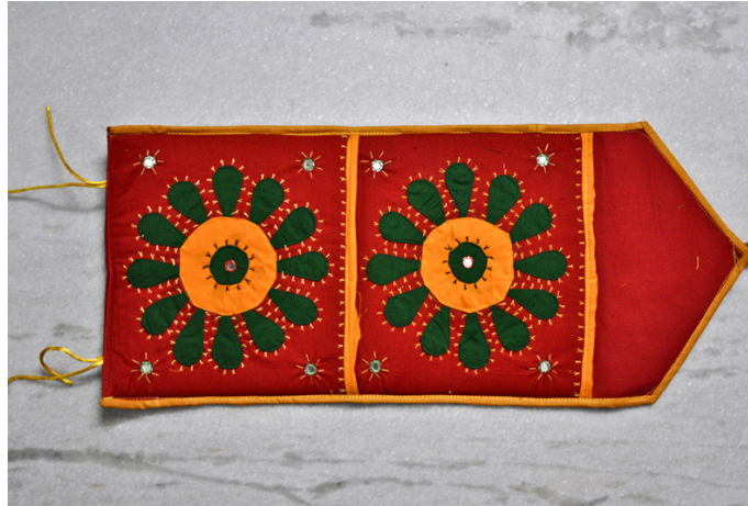
Letter pouch stitched with patch design.