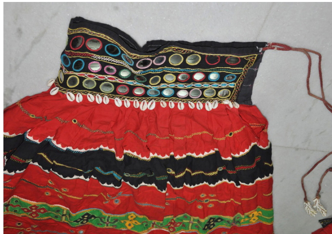
Typical Banjara skirt- a traditional wear for Lambadi women.