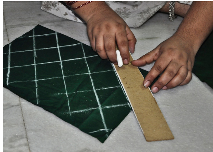
Pattern lines are drawn on the cloth.