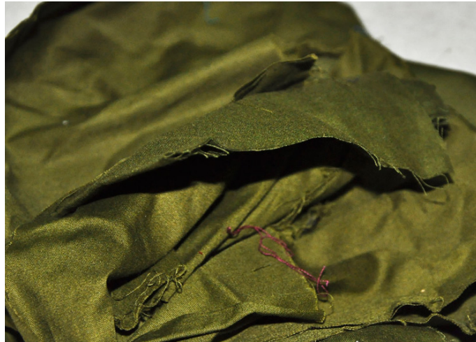
Poplin clothes are used for stitching.

http://www.dsource.in/resource/banjara-embroidery-hyderabad/tools-and-raw-materials