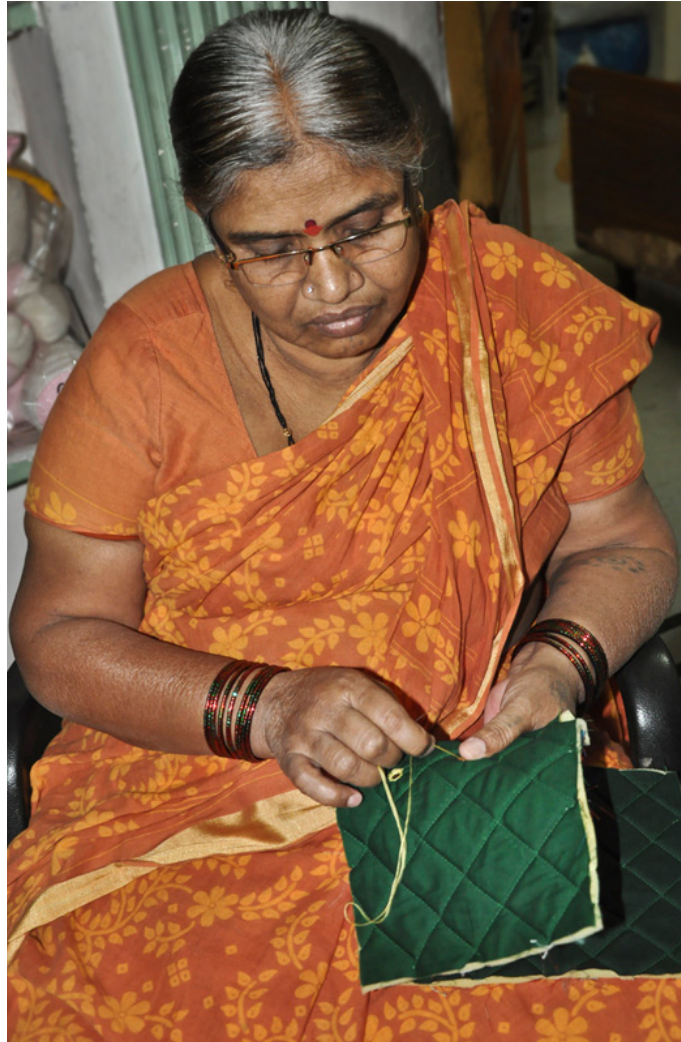
Artisan stitching the mirror on the cloth.