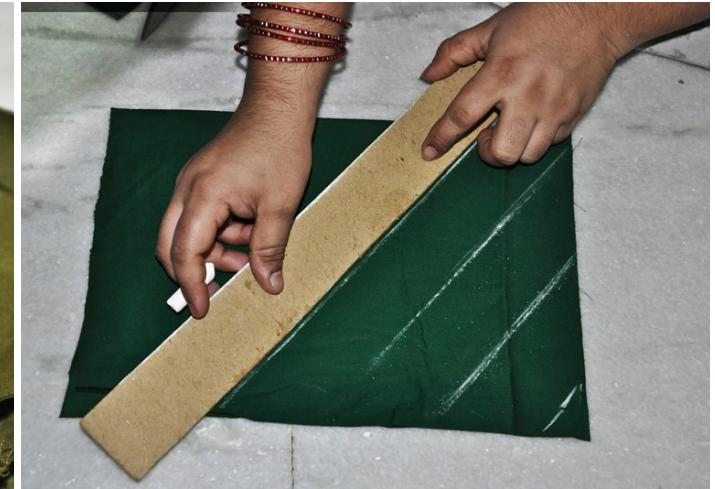
Ruler and Chalk piece is used to draw lines on the cloth.