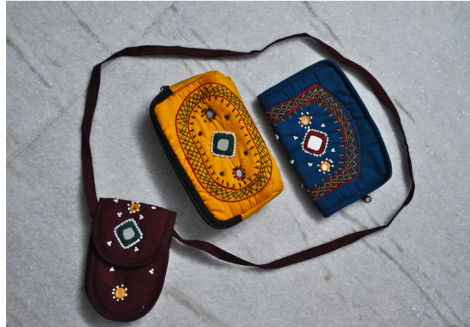
Small purses and mobile pouch decorated with glass pieces and beads.

http://www.dsource.in/resource/banjara-embroidery-hyderabad/introduction