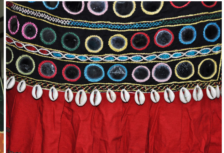
Shells stitched on the skirt.