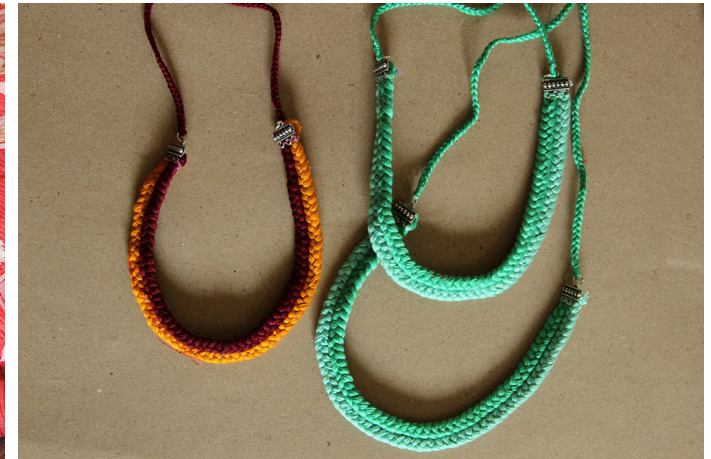
The base of the jewellery is created and kept aside.