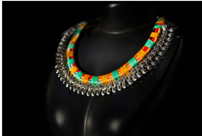
Colorful strips of threads are knotted together to create different pattern.