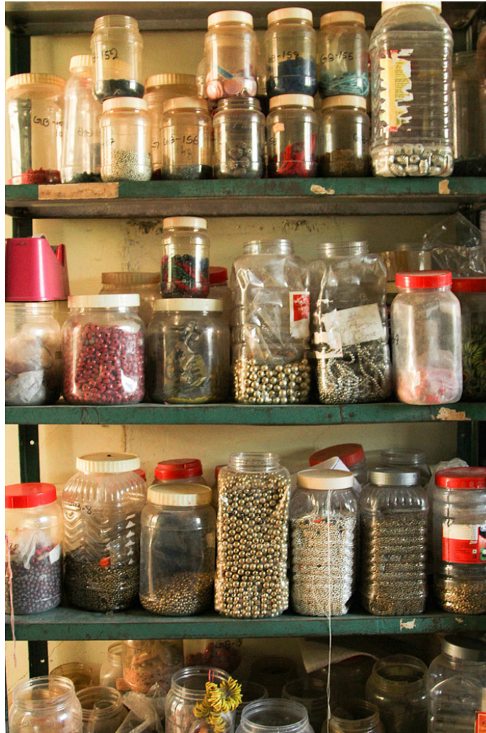
Beads of various designs are used in decorating the jewellery.