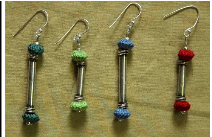
Earrings made of colorful beads.