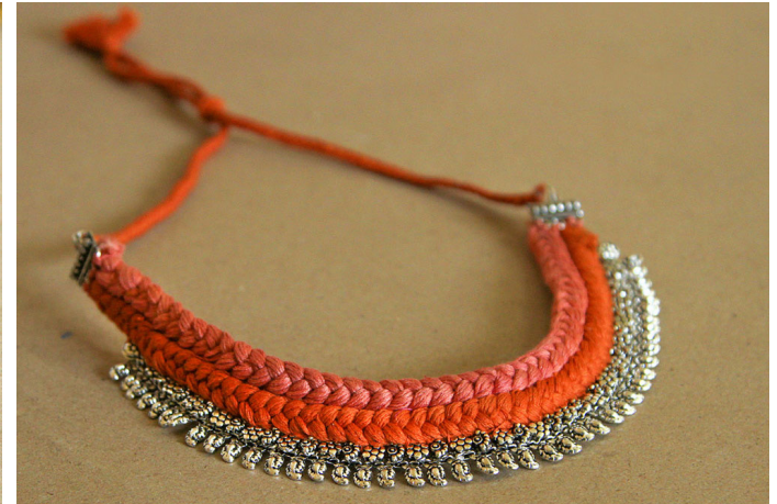
Silver jewellery is transformed into a necklace.