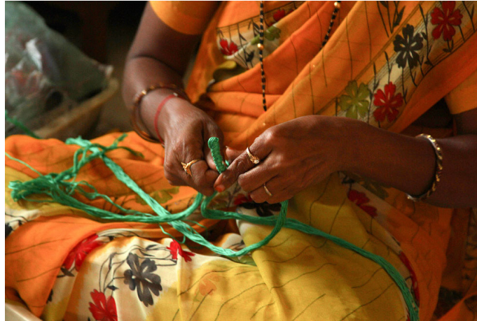
The threads are then braided into a pattern.