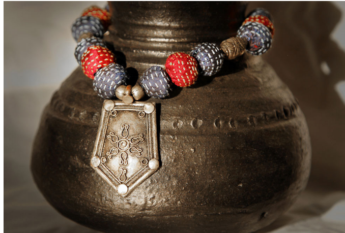
Necklace embellished with embroidered beads along with a silver pendant.