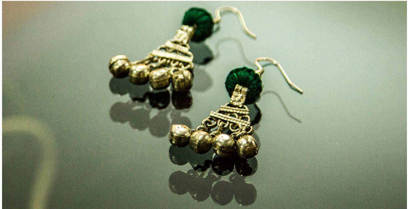
Earing embellished with beads made out of thread.