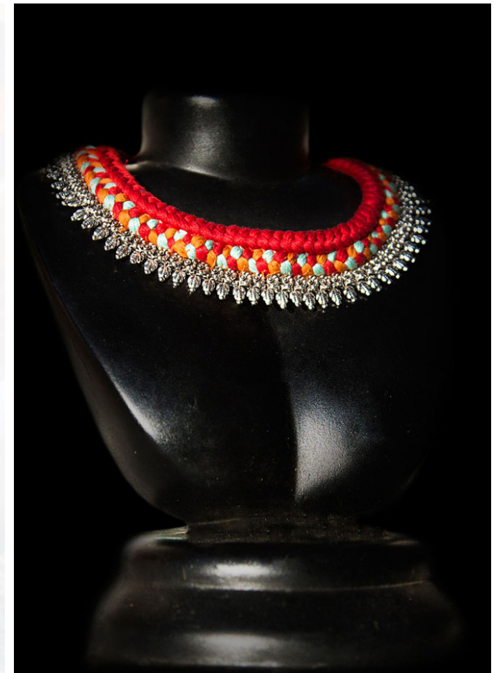
Intricately designed floral decorative jewellery.