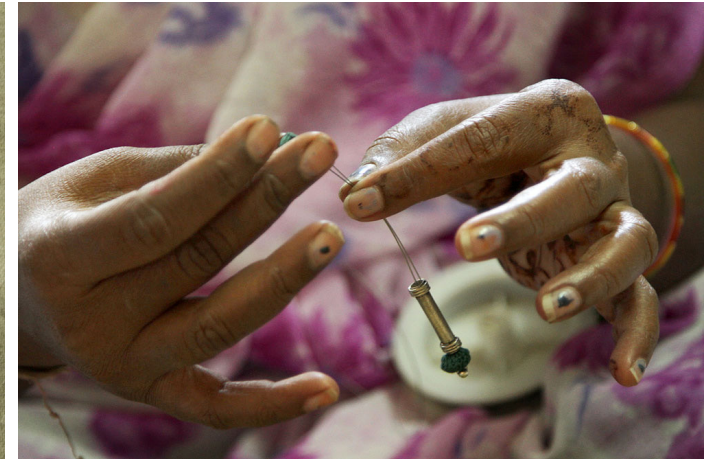
Steel string is doubled and the metal pieces are inserted along with cotton beads.