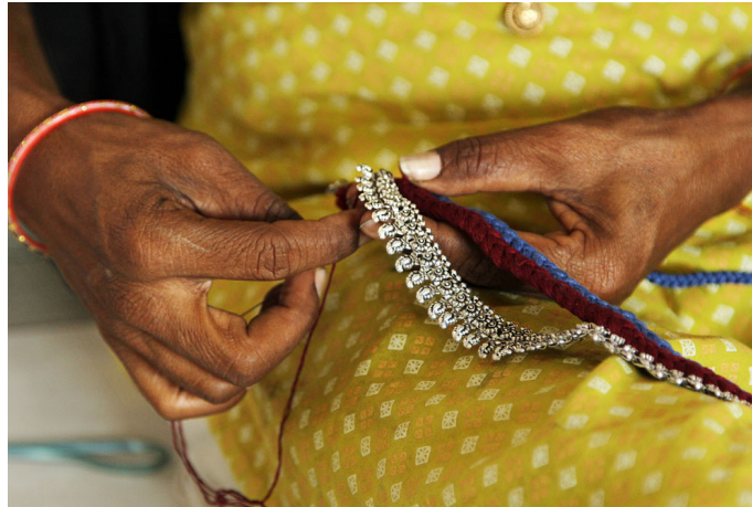
Designs made out of silver metal is sewed to the braided strips.