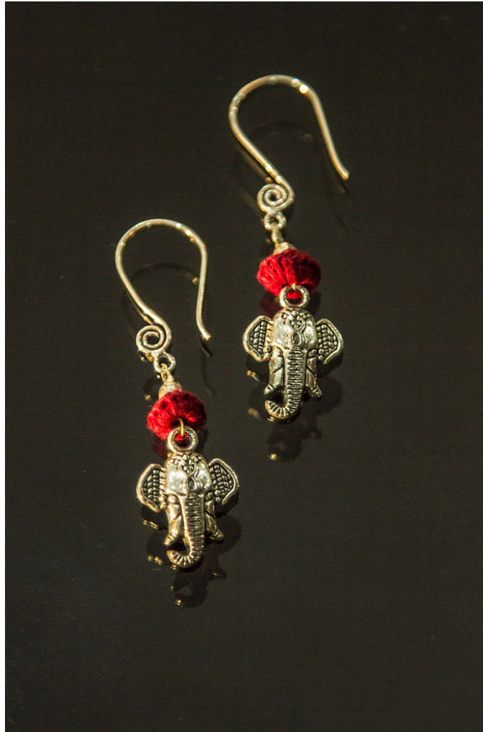
Pair of earrings depicting an elephant decorated with red beads.