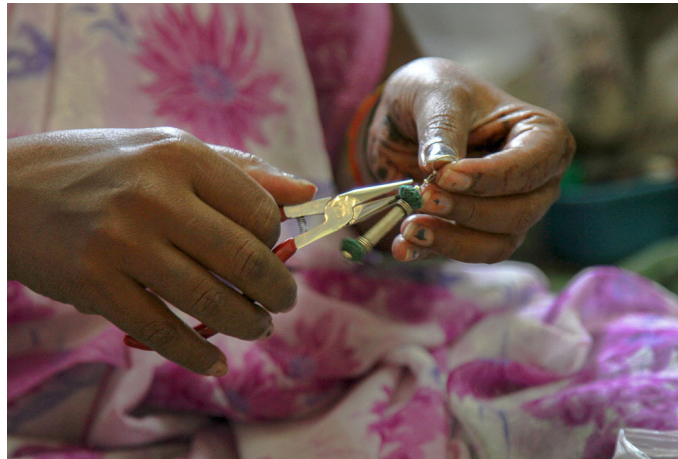
A hook is attached to the earring.