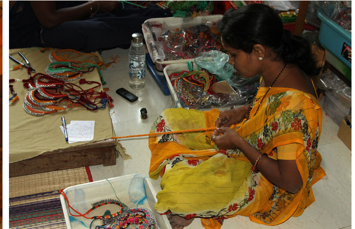
Strips are braided till the required length.