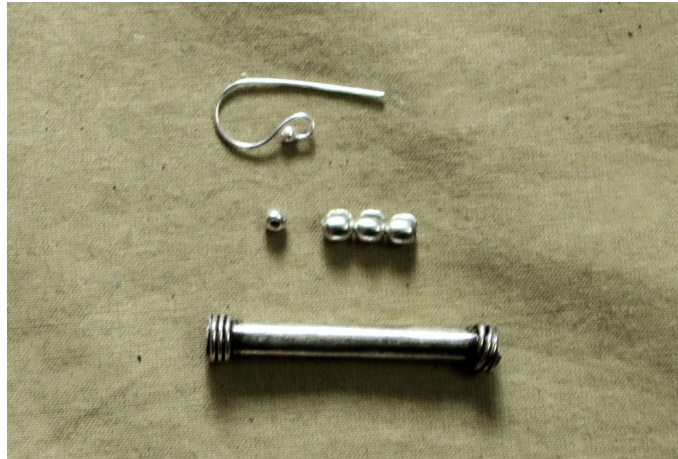
Designed pieces of jewellery used in making earrings.