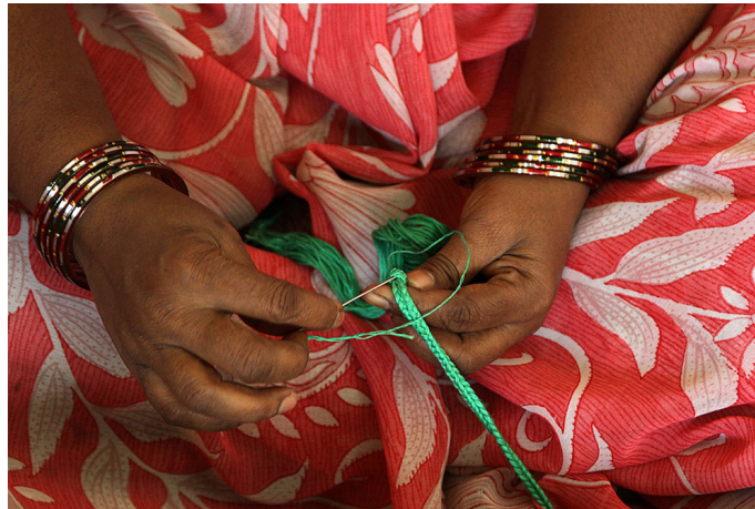
A small bead made of thread is weaved around the braided strip to loosen and tighten the necklace while wearing.