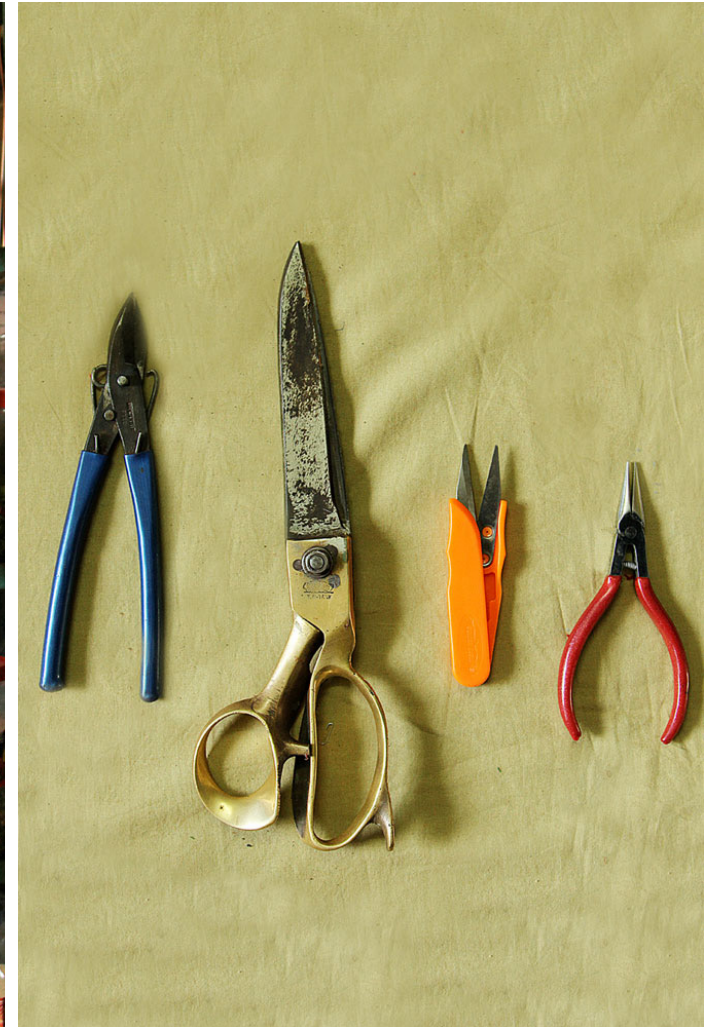
Few tools used by the craftsmen while making the jewellery.