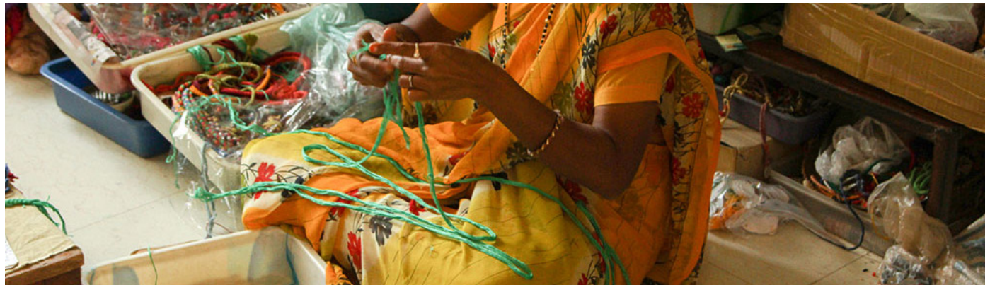
Threads are arranged and divided into three strips.

Needle is nailed to the wooden surface on which the threads are spread in opposite manner and plaited, knotted till the end portion to keep the threads held together. This further attached with thinner plaited threads and over hand knot to adjust the length of the chain when placed on the neck. Some of the products made are as follows. Necklaces, Earrings, bracelets, beads, amulet, stamp seals, head ornaments, toe rings, earrings.