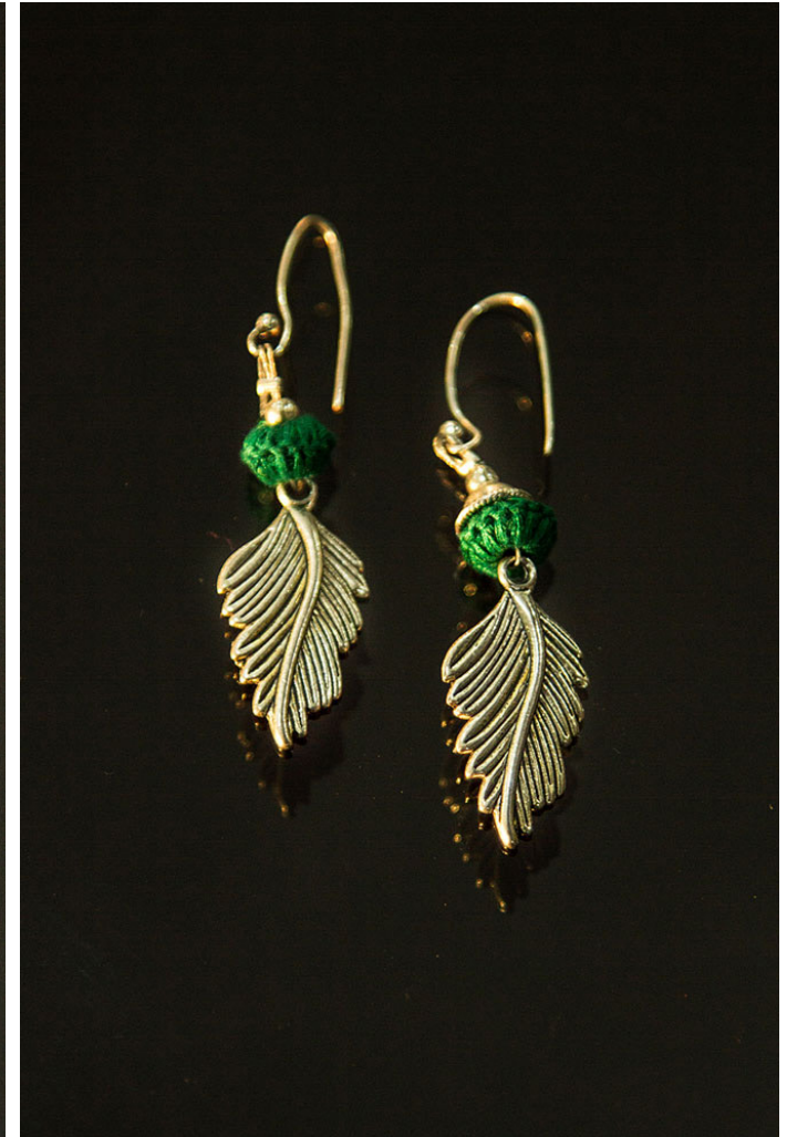
A pair of earrings displays the pattern of a leaf.