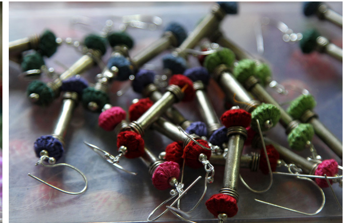
Dangling Earrings of different colours with a uniform pattern.