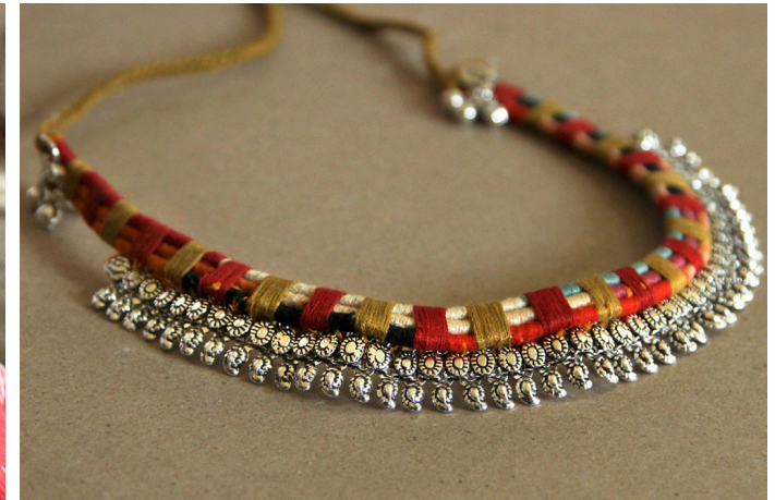
Mango design jewellery stitched with colorful braided thread.