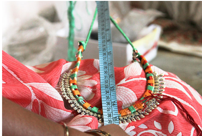
Finished product is measured to ensure the length of necklace.