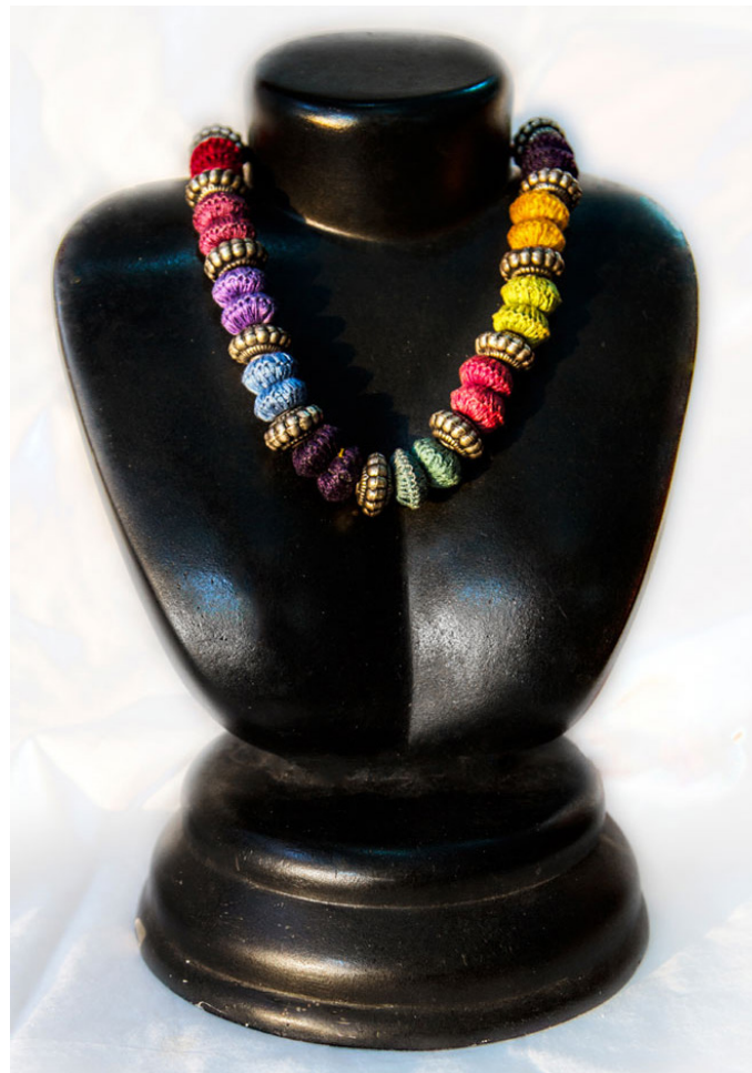
Necklace decorated with embroidered cotton beads.

The typically made Banjara jewelries of Bijapur are ear ornament, ear pendent, nose ring, nose pendent, head and forehead ornaments, hair ornaments, arms and hand ornaments, neck ornaments, waist bands, anklets, toe rings, (necklace) necklet, lockets, brooch, bracelet, wristlet, bangle, ring, chains. Generally more of necklace or amulet are made the people of Bijapur who sell it with basic starting from Rs.350 to above depending on the type of the material used in making. Varieties of earrings are made with the available sources with the initial cost of Rs.60 and above.