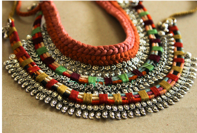
Banjara Jewellery is generally made out of silver.

http://www.dsource.in/resource/banjara-jewellery-making/introduction