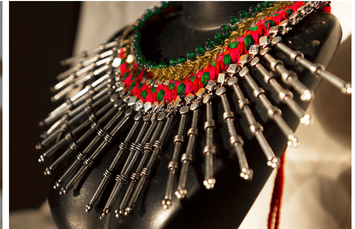
Jewellery designed with silver spikes attached with colorful braided thread.