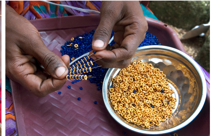
Simultaneously few more needles are been sewed with beads to save time.