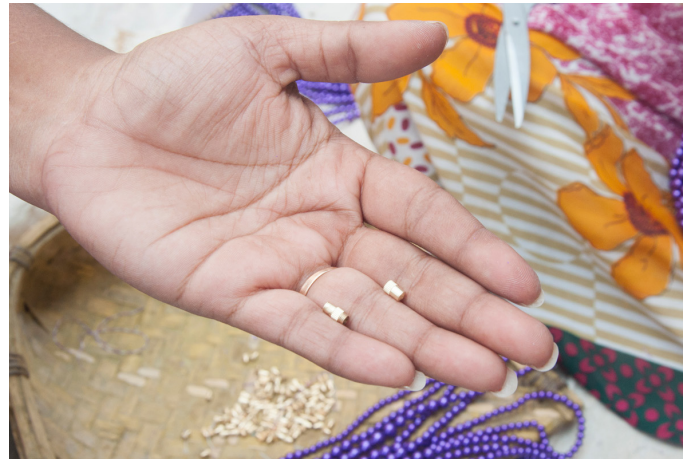
Barrel Clasps are used in each ends to secure the jewellery.