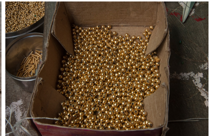
The golden round beads adds charm to the jewelries.