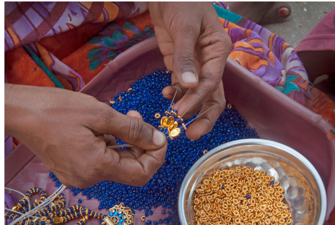
Different pattern is created between two same patterns.