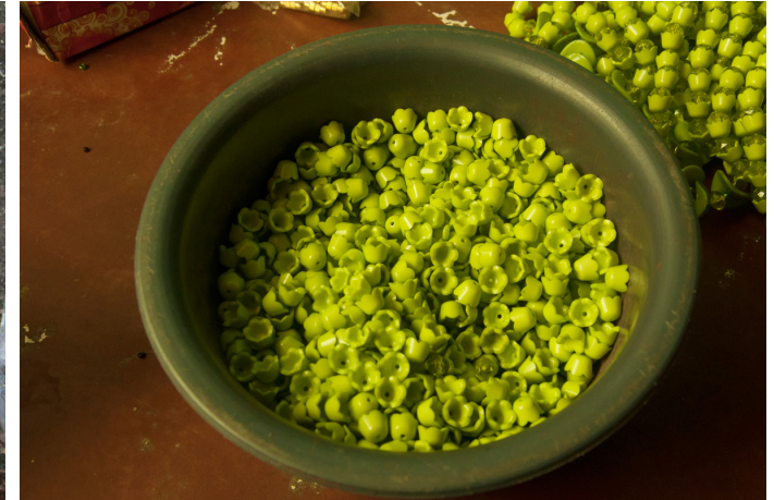
Green plastic beads are used to create different designs.