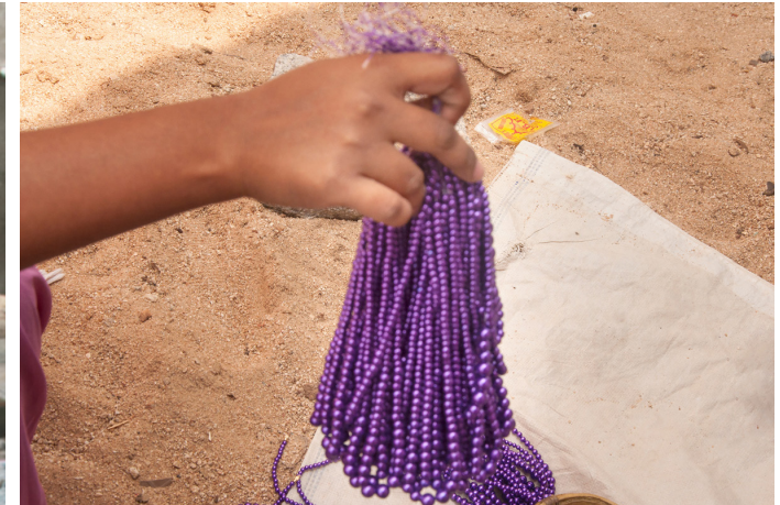
Purple beads are used to decorate the necklaces.