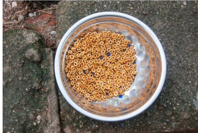
Decorative beads are purchased from local shops.

http://www.dsource.in/resource/bead-jewellery-making-srikalahasti/tools-and-raw-materials