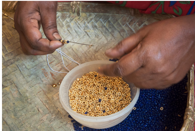
Decorative beads along with blue beads are placed alternatively.