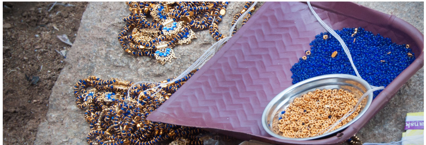
All the raw materials are gathered in a place.

Thick cotton thread with needle is passed through the needle and then passed through the bigger sized beads as the pattern is completed to the size of the normal neck measurement size of a lady, girl or for a child it is to be made for. At the corners the hooks are passed and tied tightly either with the fusible plastic bead or by the repeated knots.