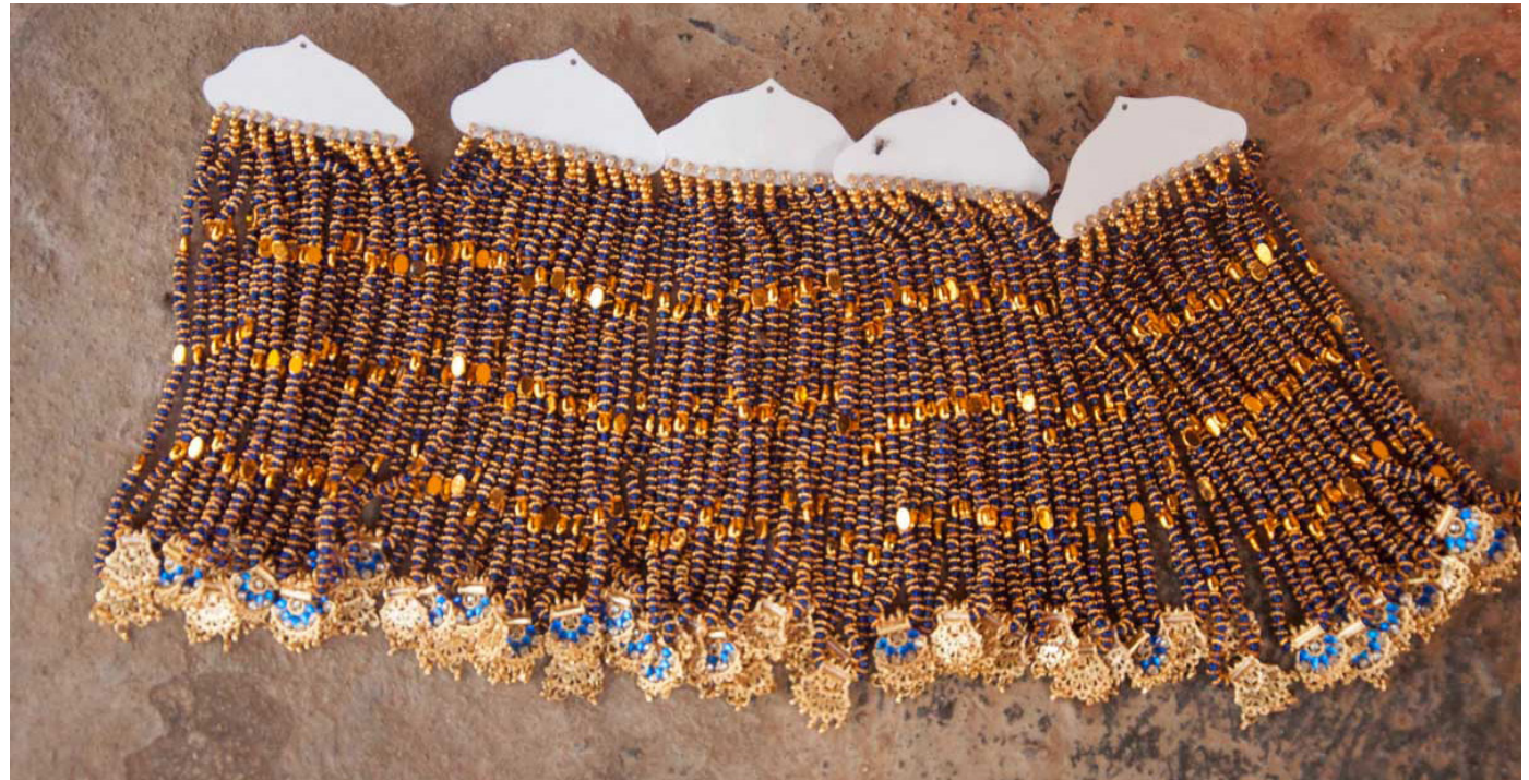
Jewelries are mostly made in clusters.