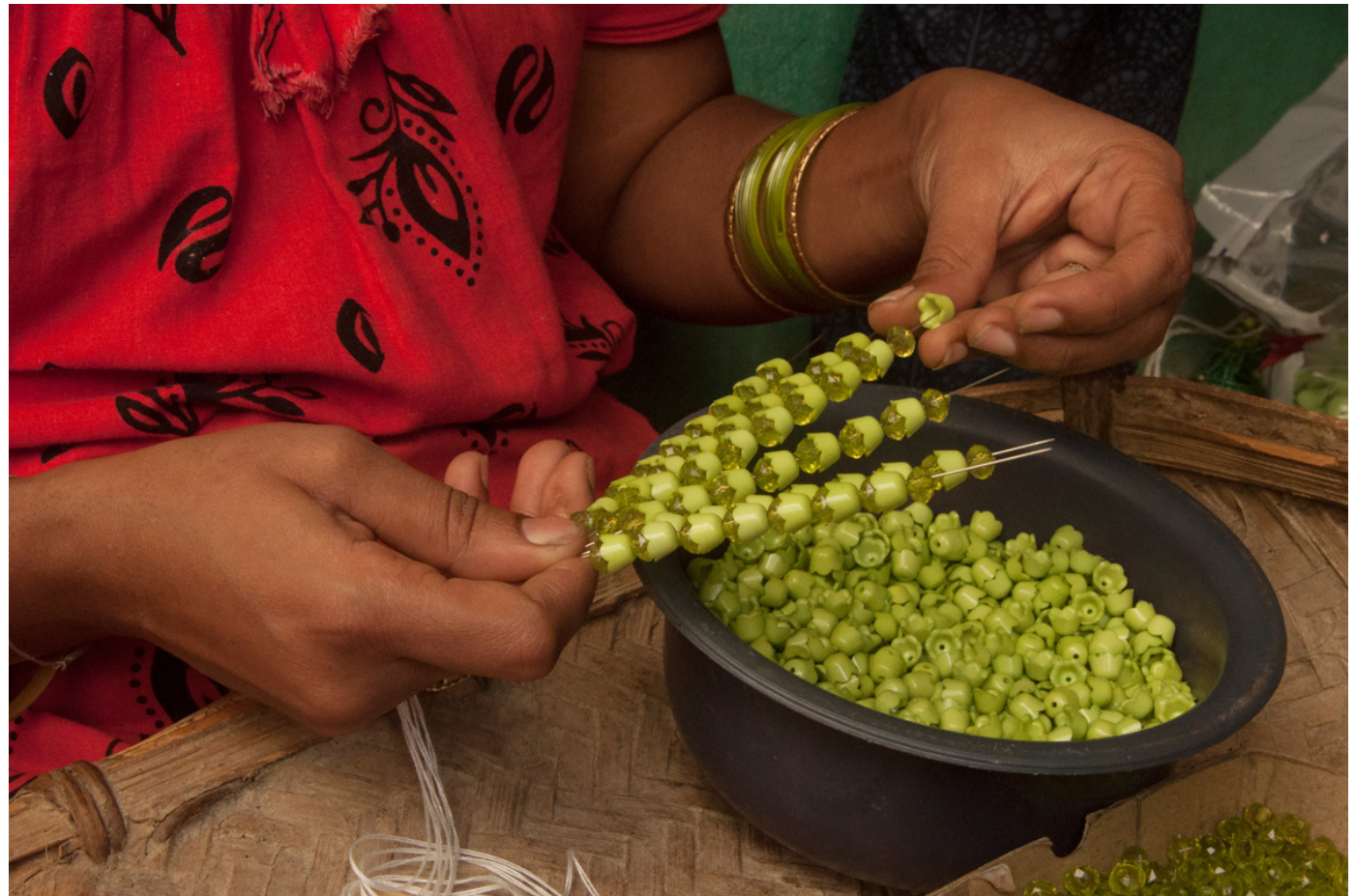
Many jewelries are woven at a time.