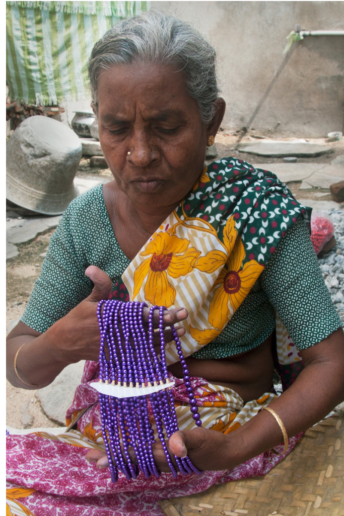
Simple purple beads jewellery.

http://www.dsource.in/resource/bead-jewellery-making-srikalahasti/introduction