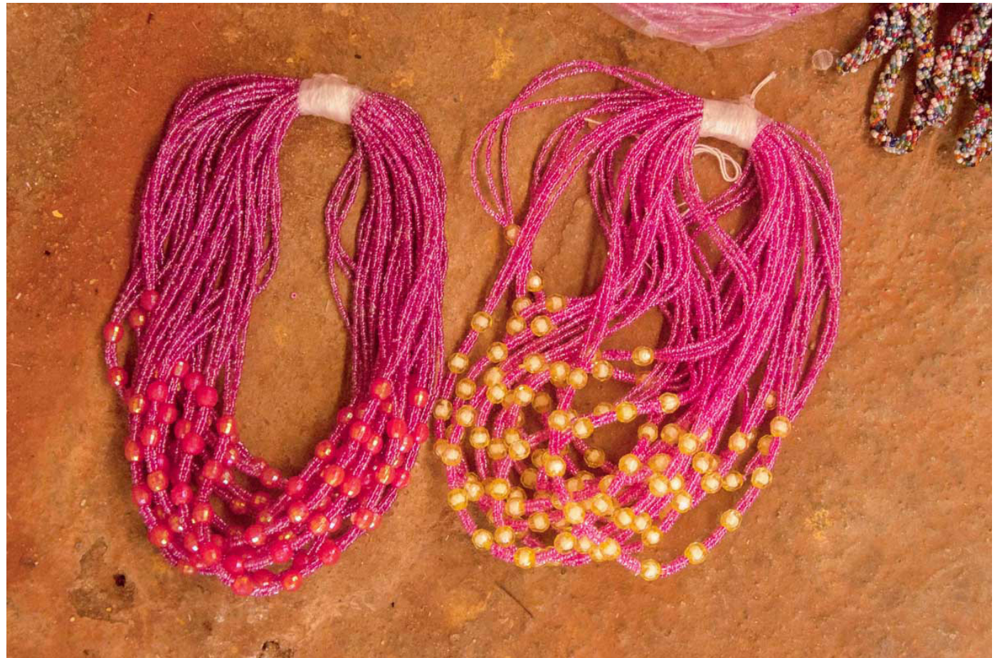
Pink beaded jewellery.

The beaded jewellery of Srikalahasti is the products seen with the people who visit the place as a place of worship. These are the handmade jewellery products sold more at this place and also in the neighbouring areas. Pilgrims visiting this place generally buy these articles and take it to the places where they have travelled from. The cost generally ranges with a small earring of Rs. 5 to Rs. 200 to a chain/ necklace. The sizes generally vary from a studded ear ring to a neck size chains with vibrant colours.