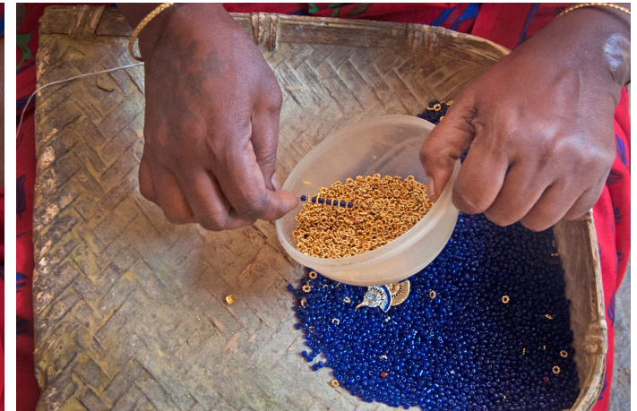
Pattern is created with two different coloured beads.