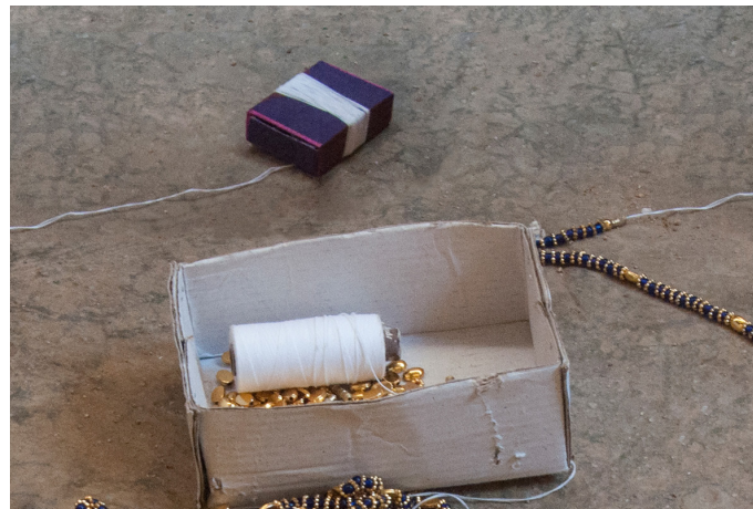
Sewing thread is used to arrange the beads accordingly.