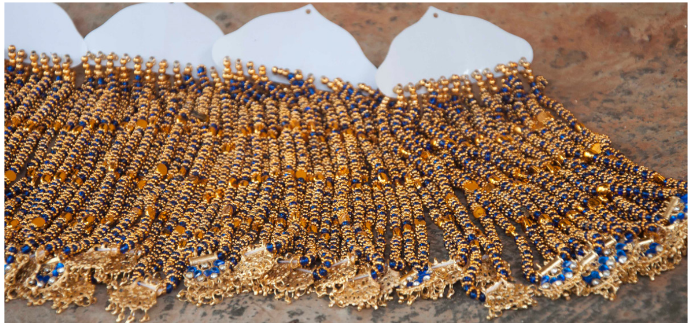
Variety of beads are woven together to make jewellery.

As per the craftsmen, previously the beads were made in this place, nowadays it is exported from China therefore referred to as China beads. Small, medium, large, differently designed pattern beads are generally preferred for the making of this jewellery. It is made in the available space in and around house and by women of this place also accompanied by the males in few stories. Varied patterns of earrings, bracelets, chains/ necklace are made here.