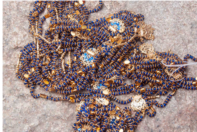
The blue golden handmade jewellery.

http://www.dsource.in/resource/bead-jewellery-making-srikalahasti/products