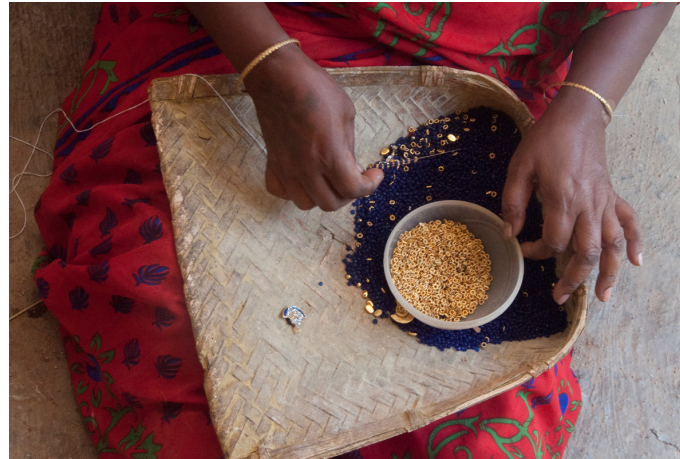
Rice Sieve is used to evenly spread the beads.

http://www.dsource.in/resource/bead-jewellery-making-srikalahasti/tools-and-raw-materials