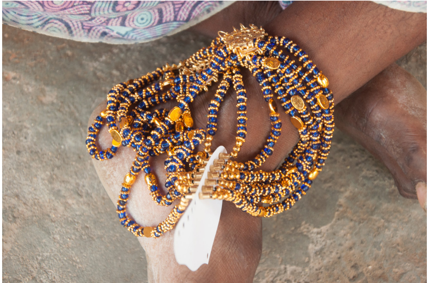
A bunch of completed jewellery.