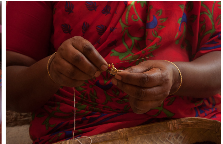
The pendent is sewed.