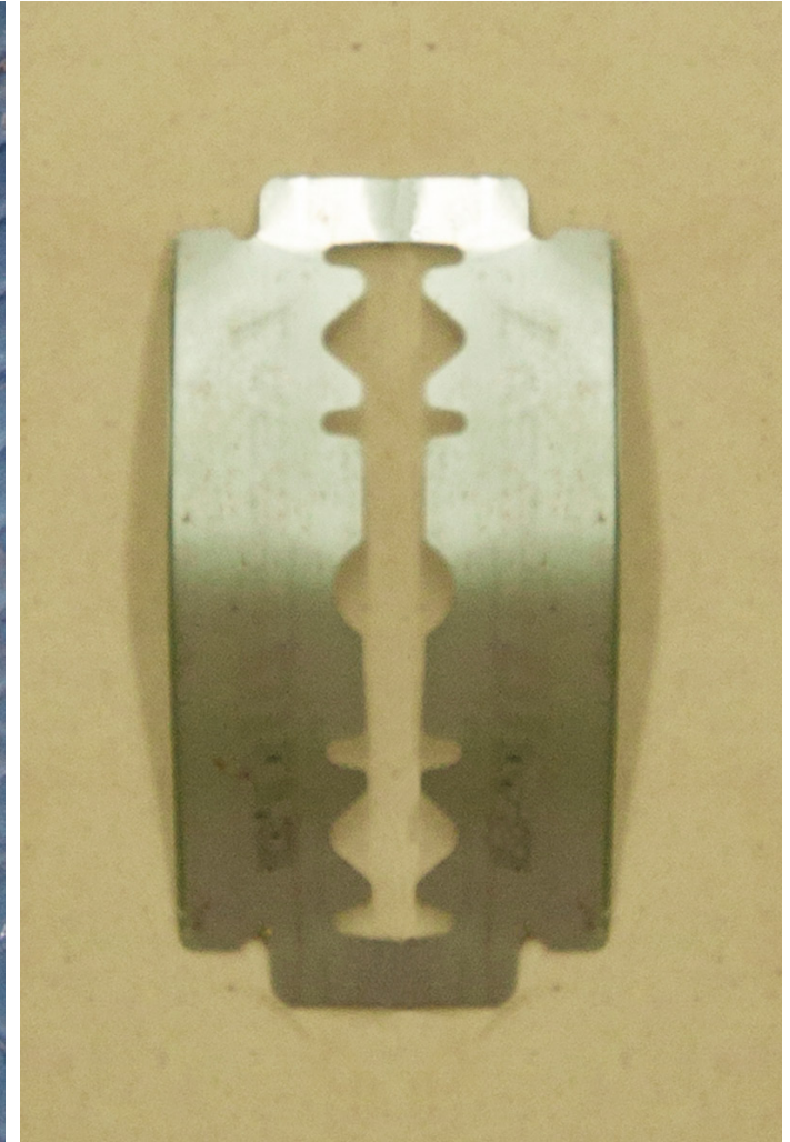
Blade is used to cut the thread.