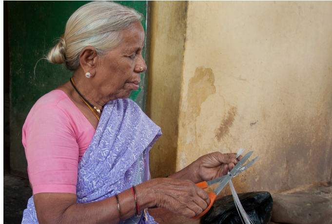
Nylon threads measured and cut into equal lengths.

http://www.dsource.in/resource/bead-jewellery-making-srikalahasti/making-process-0