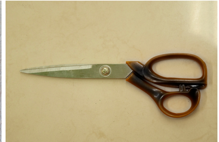
Scissors are used to cut the thread in a required length.