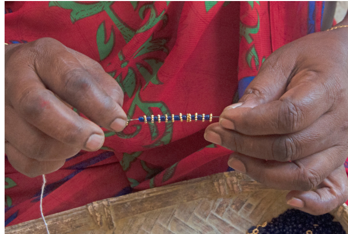
The length of the pattern is ensured.

http://www.dsource.in/resource/bead-jewellery-making-srikalahasti/making-process-0