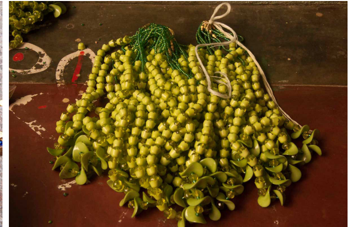
Unique kind of beads are used to make varied neck pieces.