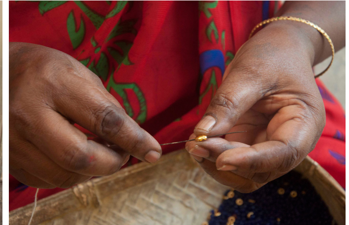
Beads are selected in a pattern to make the jewellery.