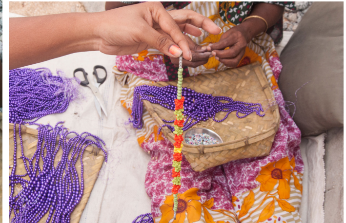
Different coloured beads are also used to make a bracelets.