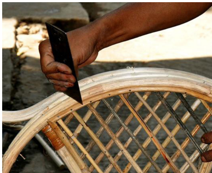
Surface of cane furniture is being smoothed before polishing.