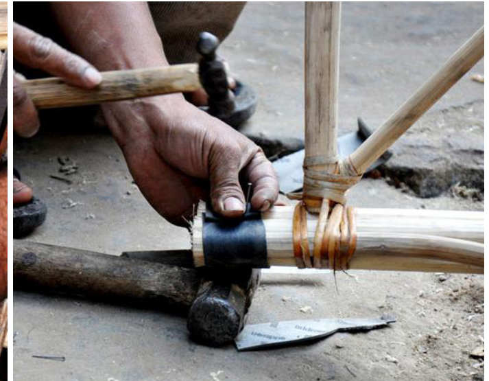
Rubber strips are tightly tied to enhance the outer look and also to strengthen the lower/ base structure