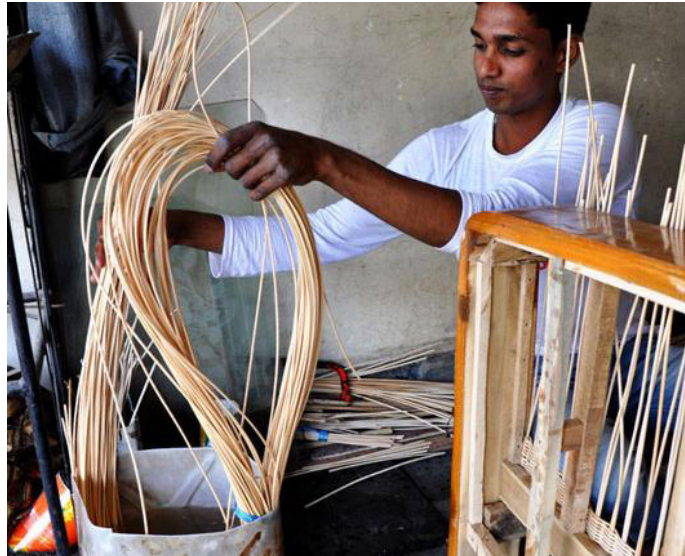
Thin processed cane is soaked in water to start weaving process.