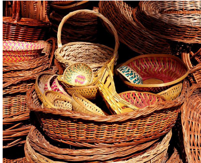
Different types of baskets and trays made of cane.

http://dsource.in/resource/cane-furniture-bangalore/introduction