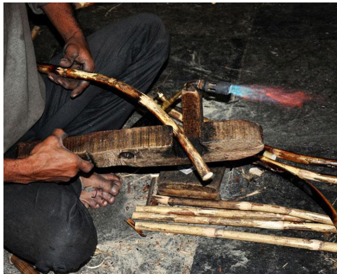
A wooden shaping tool used to bend and shape the heated cane.