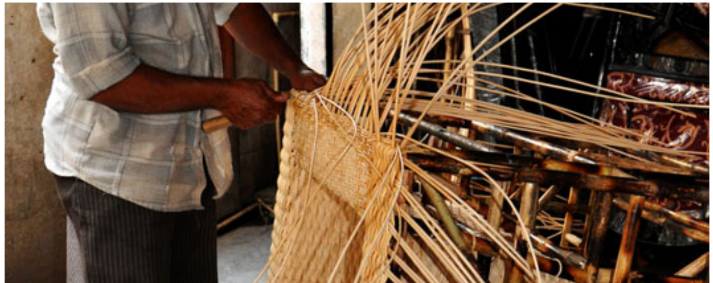
Soft thin cane is flexible for weaving and creating patterns.