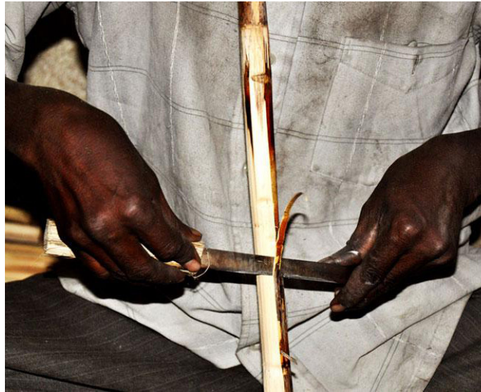
Artisan smoothening the outer surface of cane- peeling off the outer skin