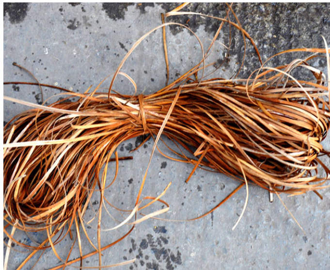
Thin flattened cane used for binding purposes.