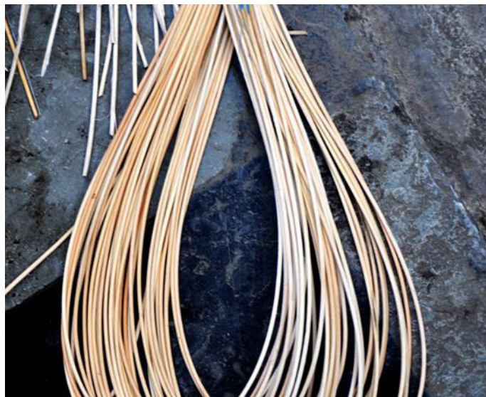
Thin processed cane.