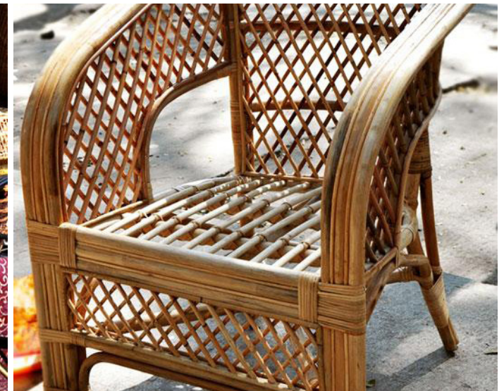
Chair made of thick cane.