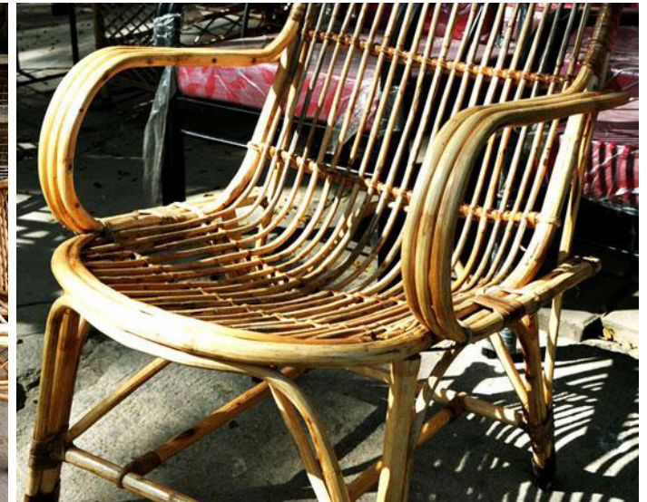
A perfect eco-friendly cane chair.