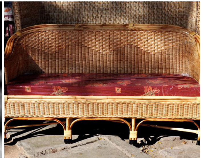
Sofa with different internal weaving pattern.