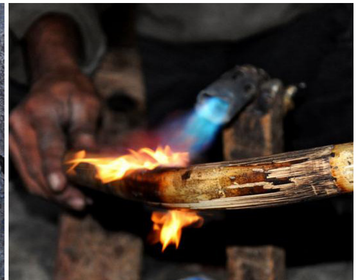
Kerosene lamp used for heating the thicker cane.