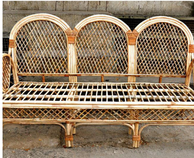
Sofa made of cane with a style of Jaali motif.

The ranges of cane products include sofas, chairs, vegetable and fruit containers of different shapes and sizes. Cane containers are available in circular, oval and swan shapes. Roti containers, stools and other creative and trendy products are also available. All these containers are weaved with cane and colored with rose wood (color polish) for good outer look and classy appeal.