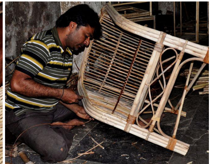
Thin flattened cane is used to bind the cane furniture frame.