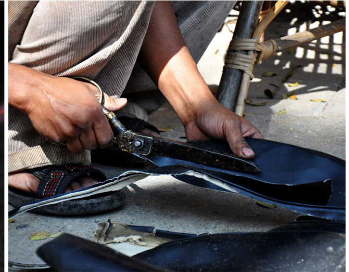
Strips of leather are cut and tied to the legs of the furniture to strengthen the structure and enhance the outer look.