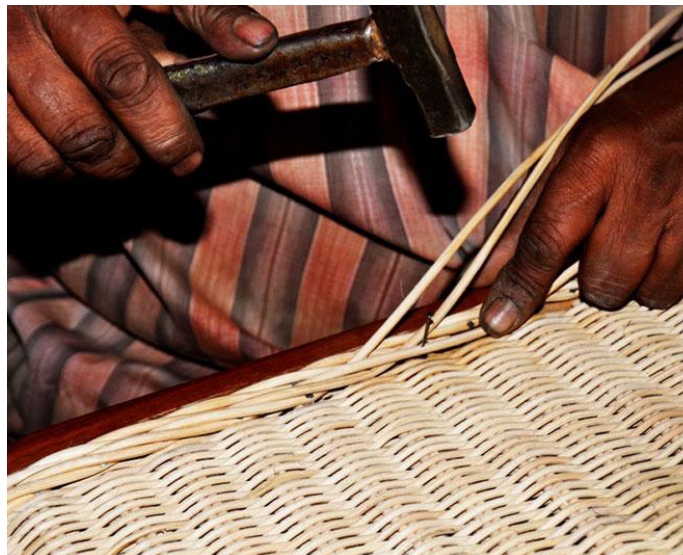
After weaving, the edges/ ends are joined by nailing.