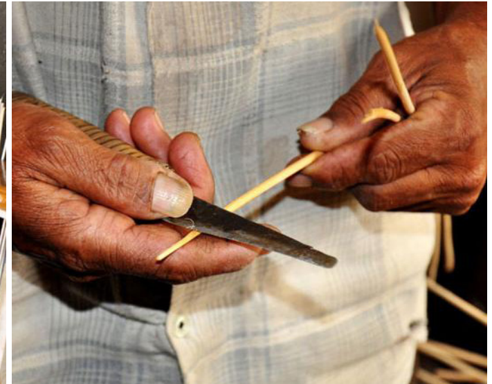
The edge part of thin cane is being sharpened slightly.