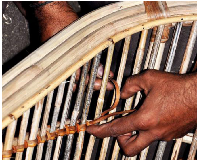
Adding flattened cane to furniture gives better support/ strength to the entire structure