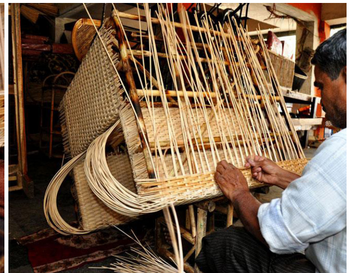
Cane is weaved around furniture frame.