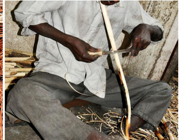
Artisan involved in removing the outer surface (skin) of cane after heating it.