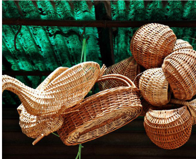
Cane baskets and fruit containers of different shapes.

http://dsource.in/resource/cane-furniture-bangalore/products