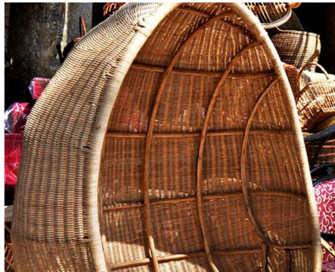
Cane furniture displayed for sale.

Malleswaram, Shivaji Nagar, K. R. Market and Jeevan-bheema Nagar in Bangalore are the well noted areas with availability of cane furniture and other cane products. Bangalore being a modern market, cane artisans regularly improve their creative skills to produce new range of cane products in unique patterns to meet the latest trend.