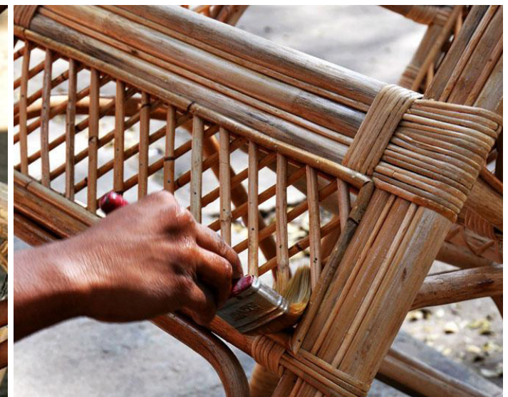
Natural polish is applied for glossy look.