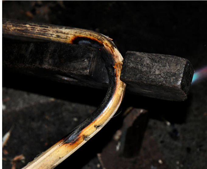
Wooden tool used to bend the thicker cane.