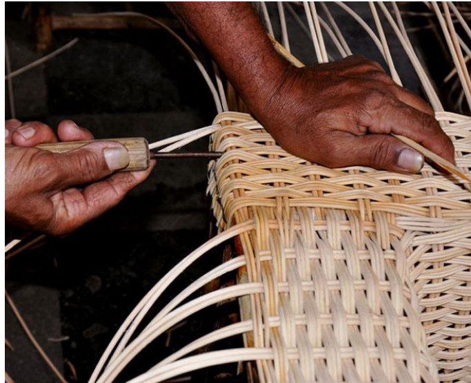
Artisan creating a unique pattern by adding three strands of cane together.