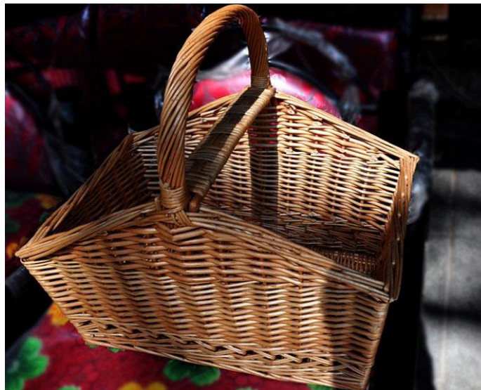
Huge fruit basket with handle in unique style.