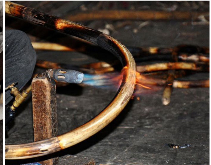
Cane is being bent by heating it with the help of kerosene lamp.