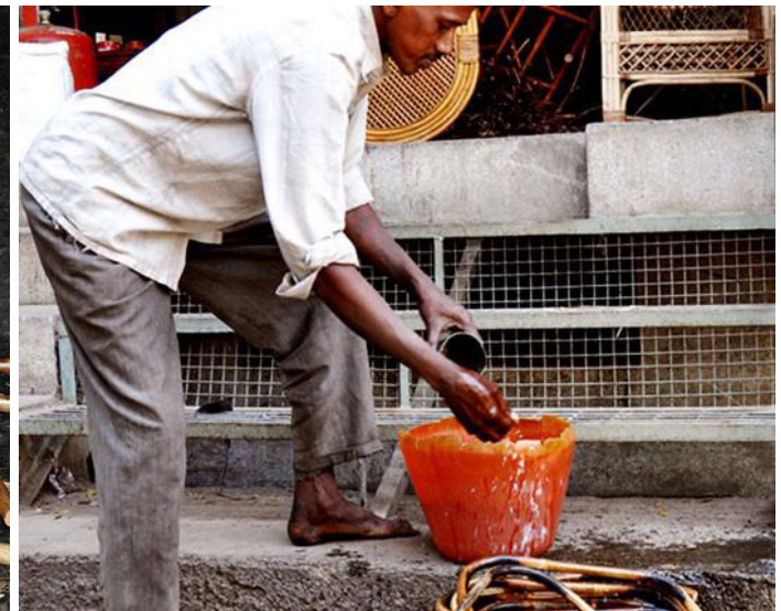
Water is frequently sprinkled to retain the moisture.