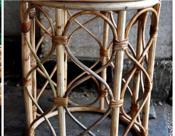
Stool made of cane.