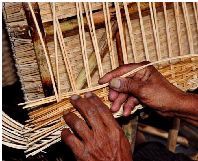
Three-ply cane is being inserted in criss cross manner.