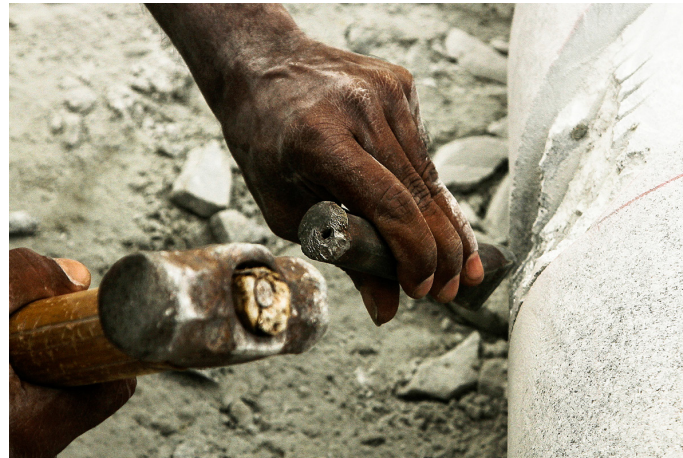
Craftsmen uses hammer along with chisel carves the marked areas on the stone.