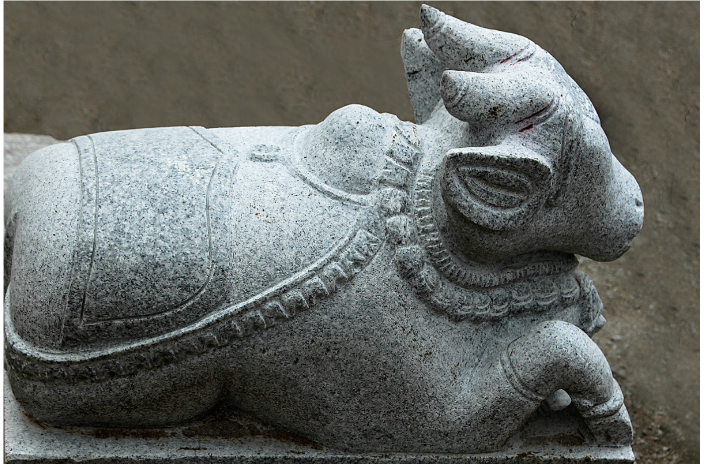
Decorative carved out Sculpture of Nandi.