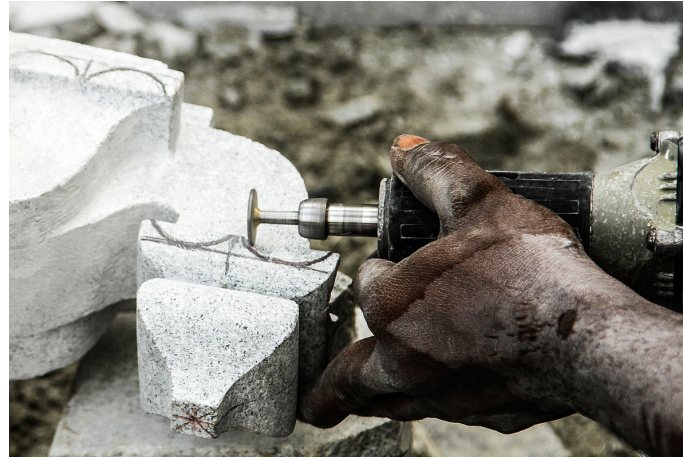
Designs are carved out using small size diamond blade electric cutter.