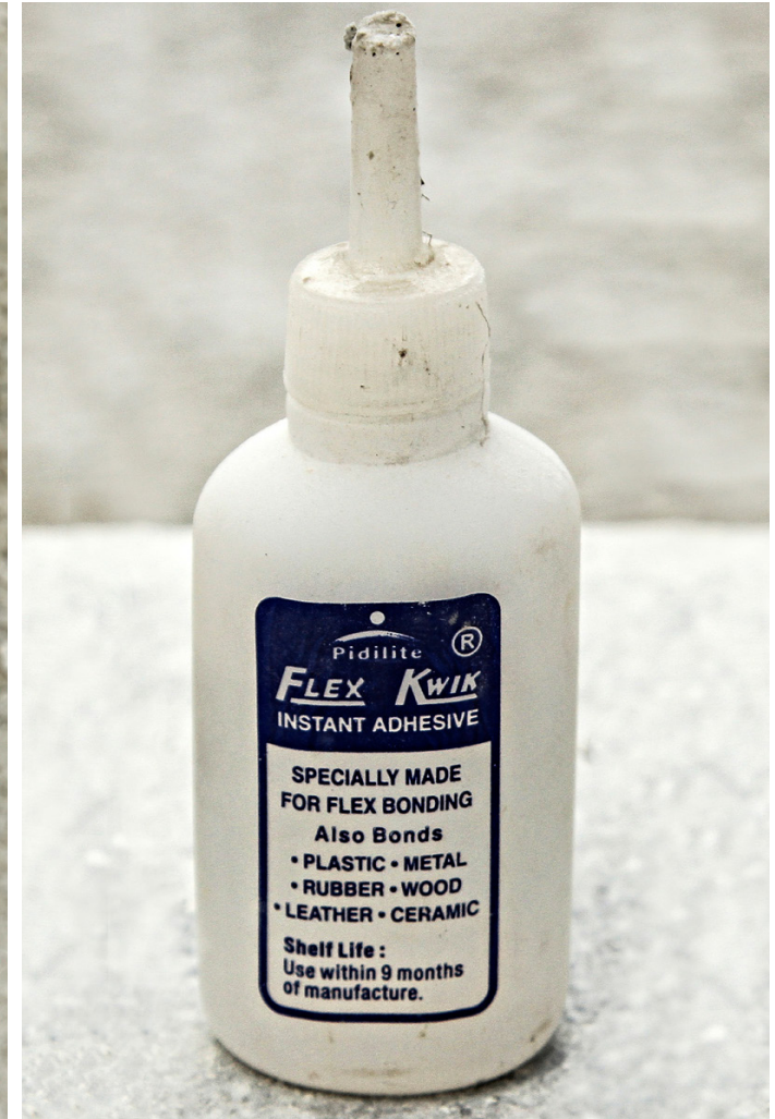
Adhesives are used to join separated parts together.