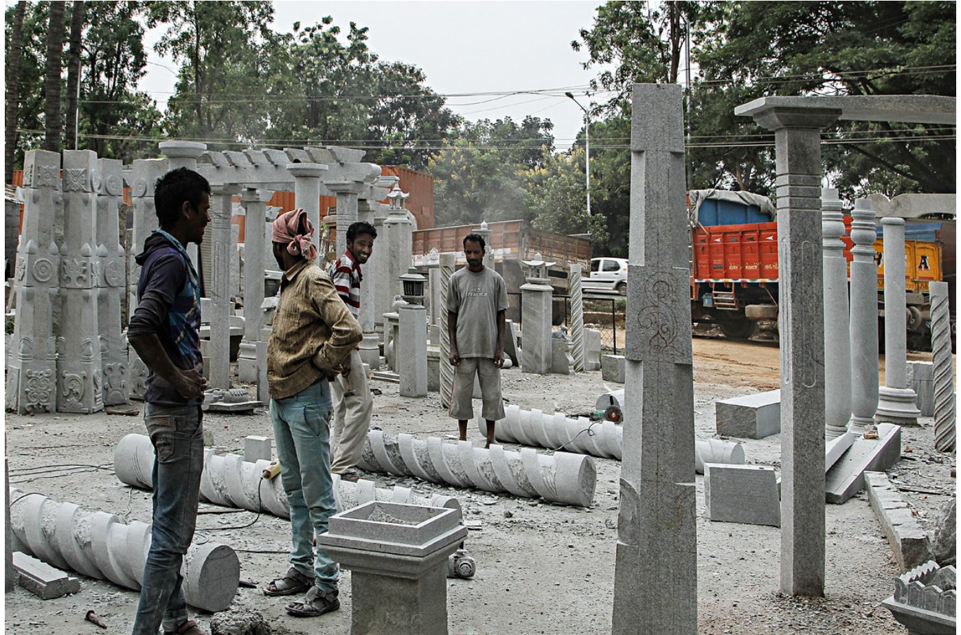
Decorative pillars carved out for household furnishing.