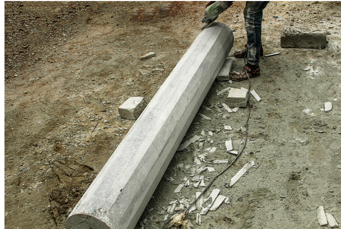
A block of Koira stone is roughed out into a required length.

http://www.dsource.in/resource/carving-stone-pillars/making-process