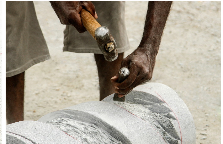
The unwanted parts of stone are hammered and removed.