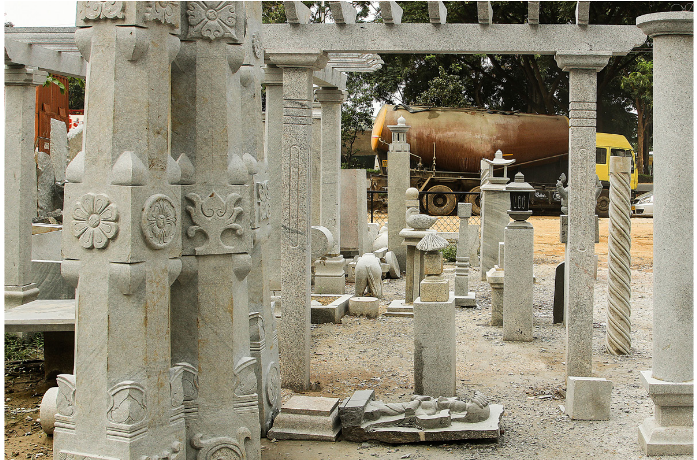
Variety of pillars and decorative columns carved out of stone.