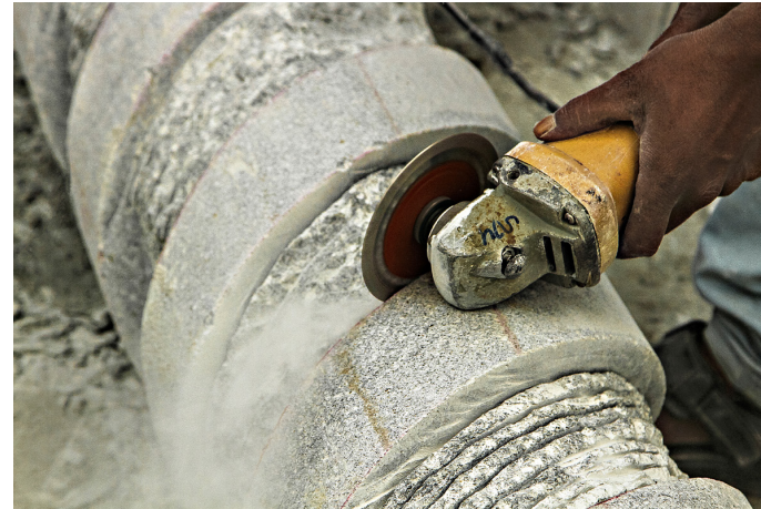
Electric cutter is used to cut the edges of the design.