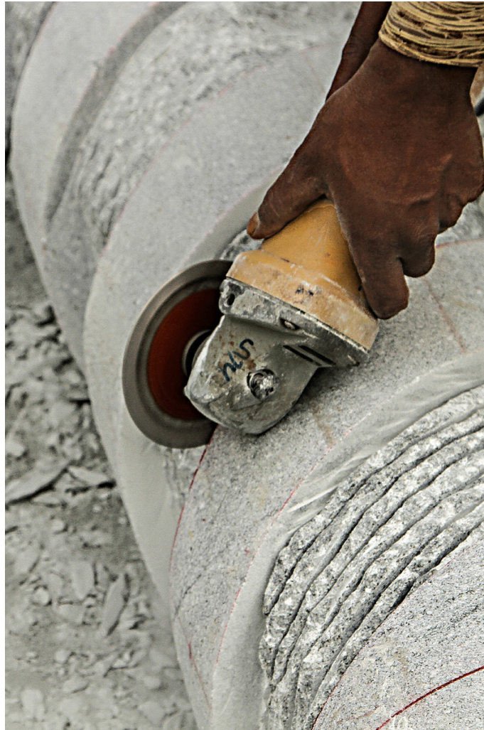
The pillar is carved and shaped with the help of Diamond blade electric cutter.