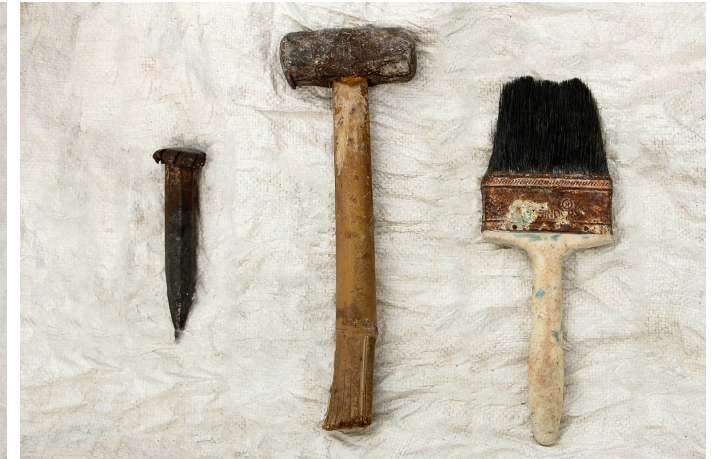
Square head hammer is used along with chisel to hammer out the unwanted parts.