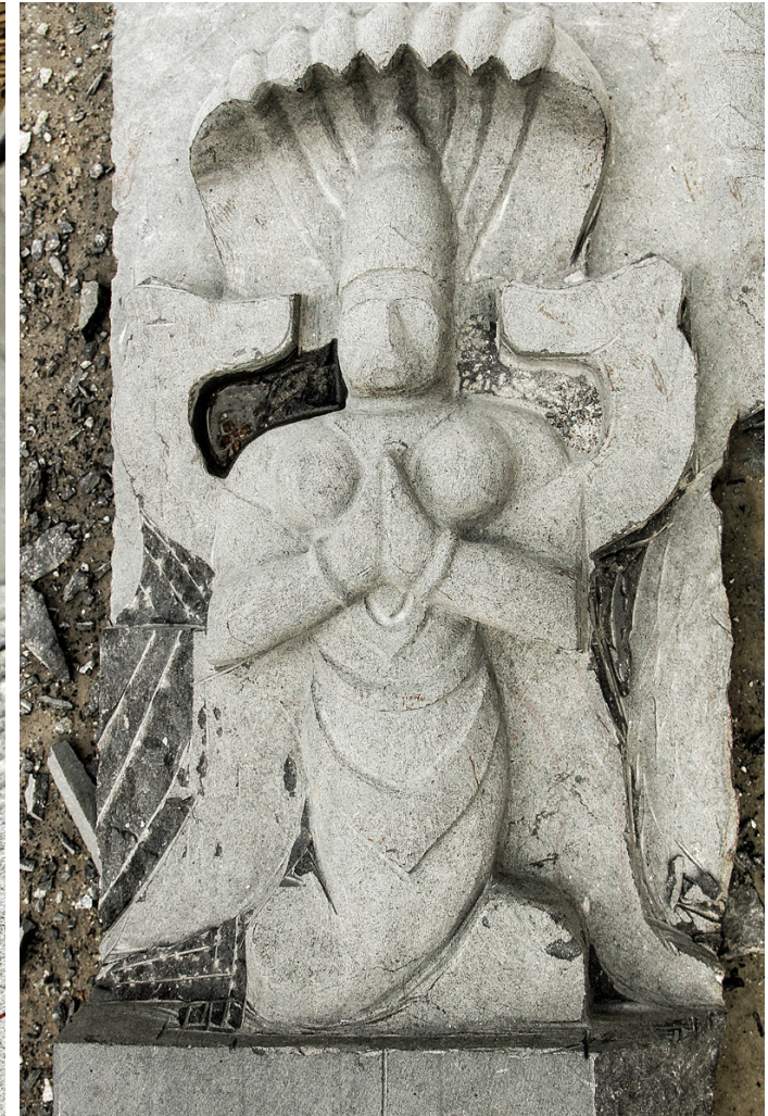
An unfinished idol of a Lord Vishnu.