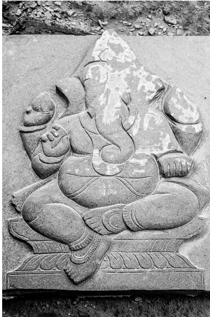
Ganesha idol carved with an embossing effect.