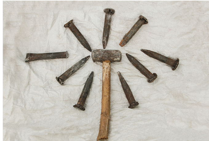
Hammer and different types of chisels are used to carve out the stone.

http://www.dsource.in/resource/carving-stone-pillars/tools-and-raw-materials