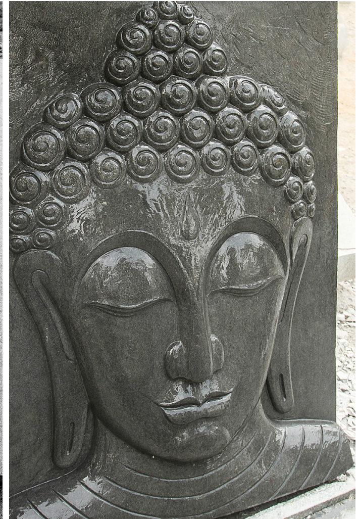
Intricately carved out portrait of Lord Buddha.