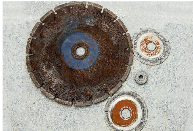
Different sizes of Diamond blades are used for carving.