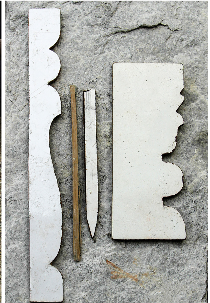
Stencils are used for reference of the design to be marked or traced on the stone.