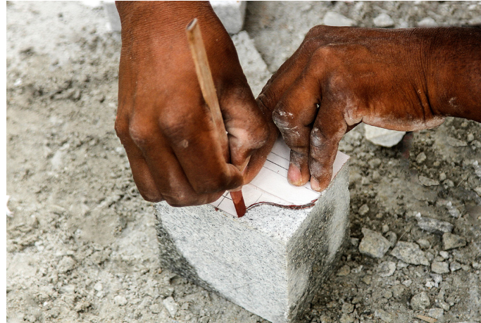
Design is traced using red oxide solution.

http://www.dsource.in/resource/carving-stone-pillars/making-process