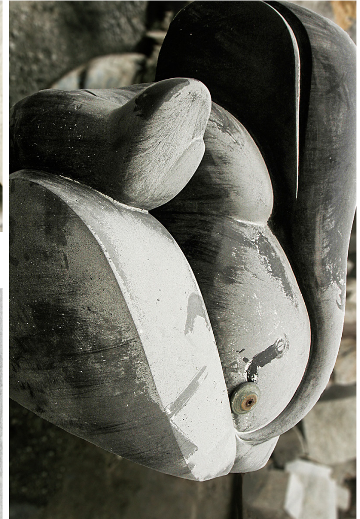
Modern art carved out of stone portraying Lord Ganesha.