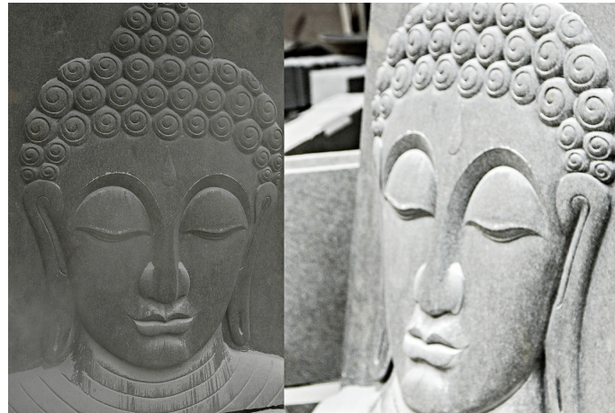
Portrait carving of Lord Buddha.