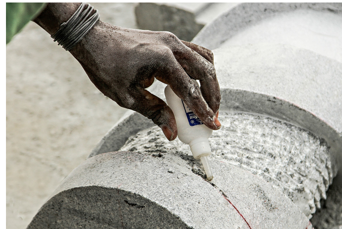
Adhesive is applied to join the breakages.