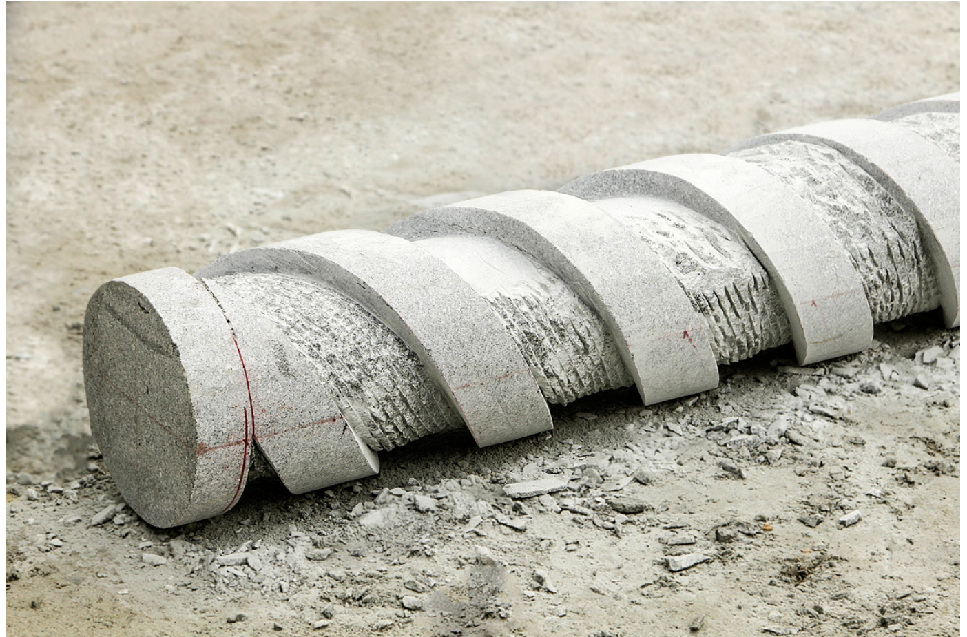
Customized pillar kept for buffering.