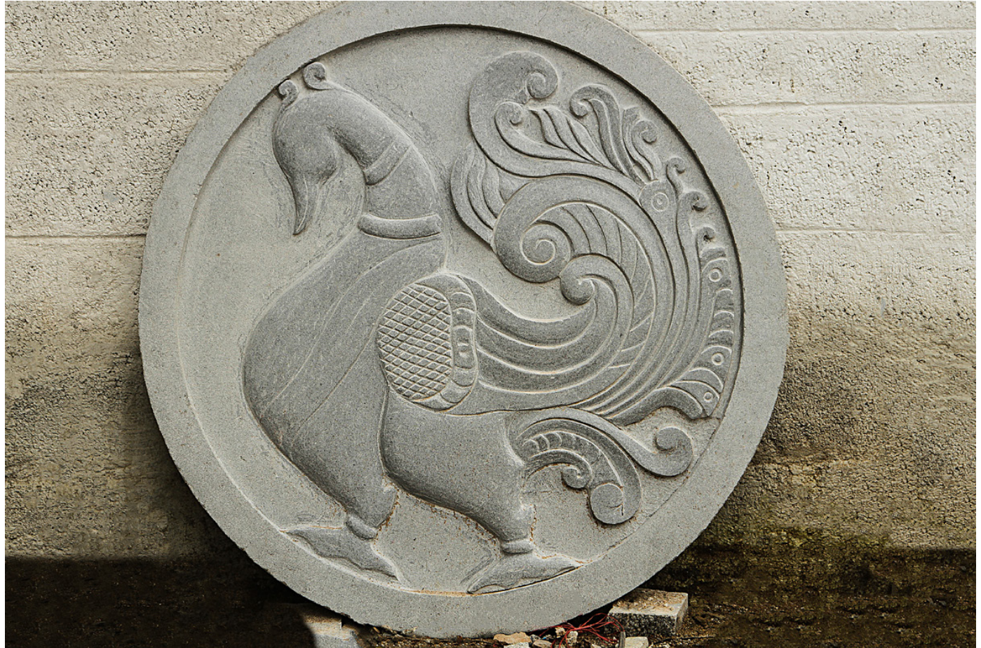
Outdoor stone décor depicting a peacock.