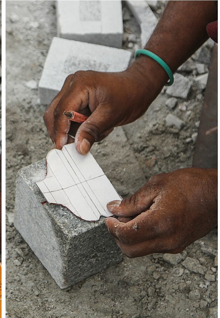
Stencil is used to trace the design for carving.