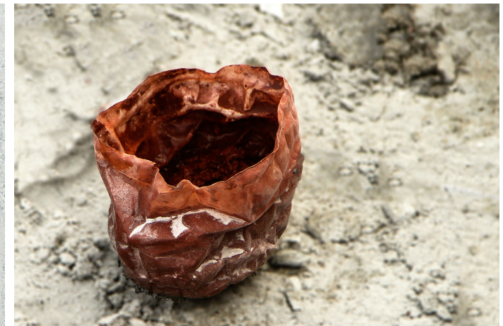
Red oxide solution is used to mark the design on the stone.