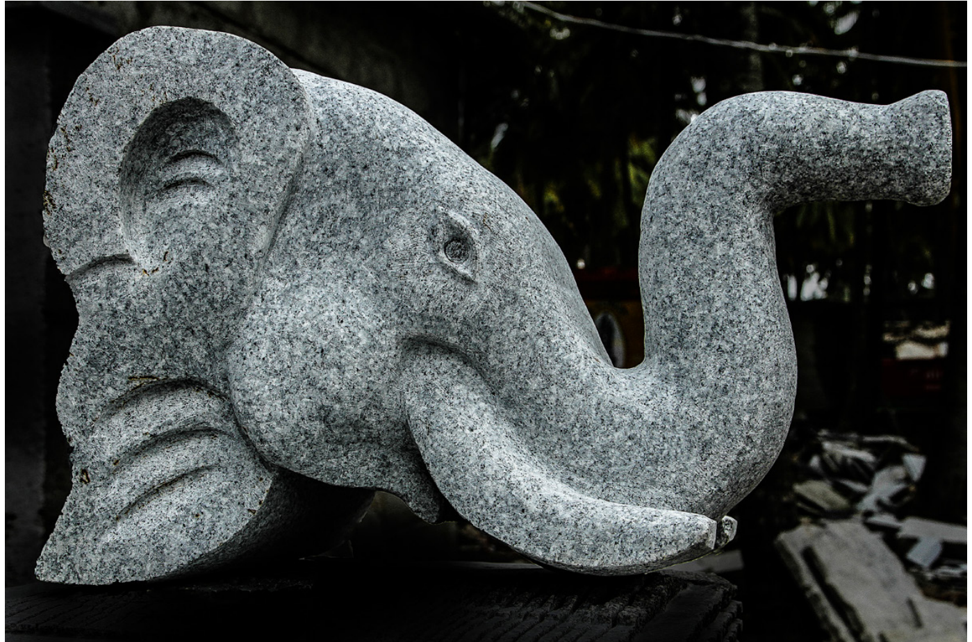
Head of an elephant carved out of stone used for decorative purpose.