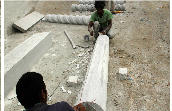
A string of yarn is dipped in red oxide solution which is used for marking the design.