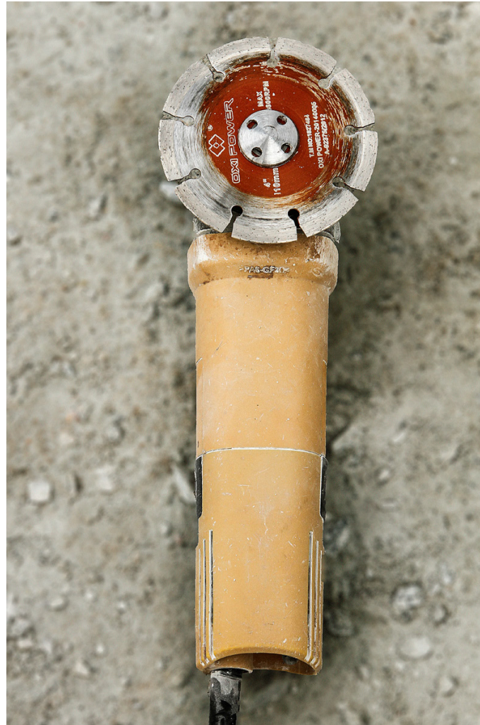
Diamond Blade Electric cutter is used for designing and carving out the stone into a form.