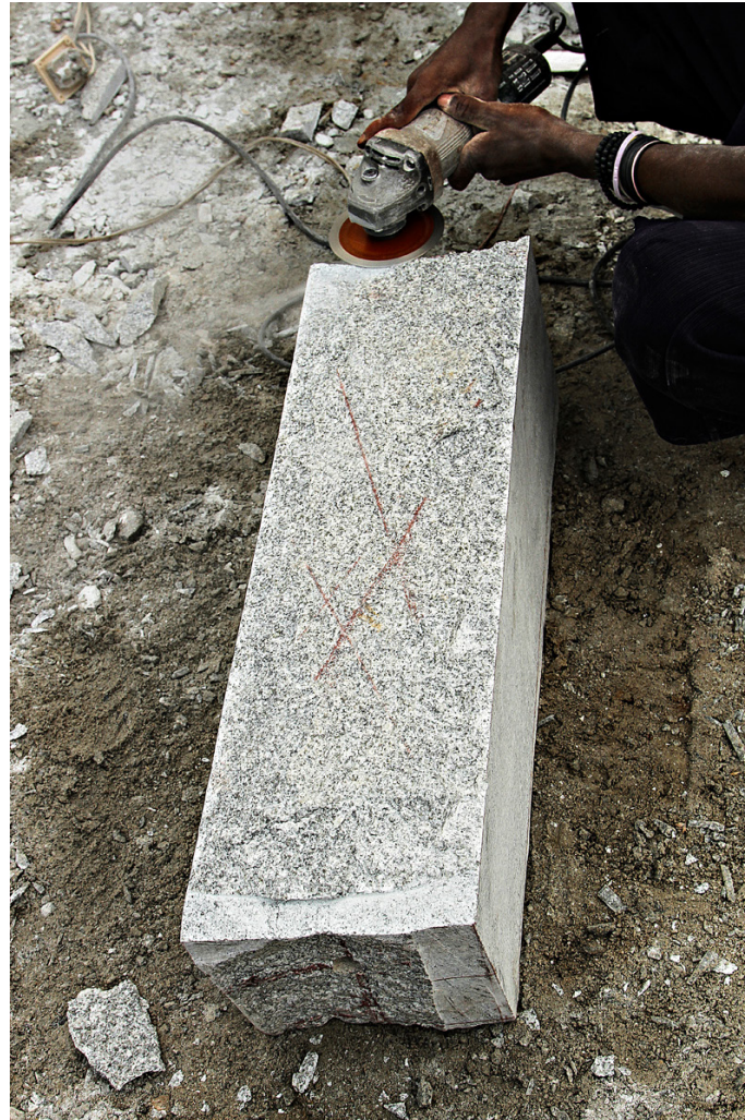
Koira stone is the stone used for carving the desired shape.