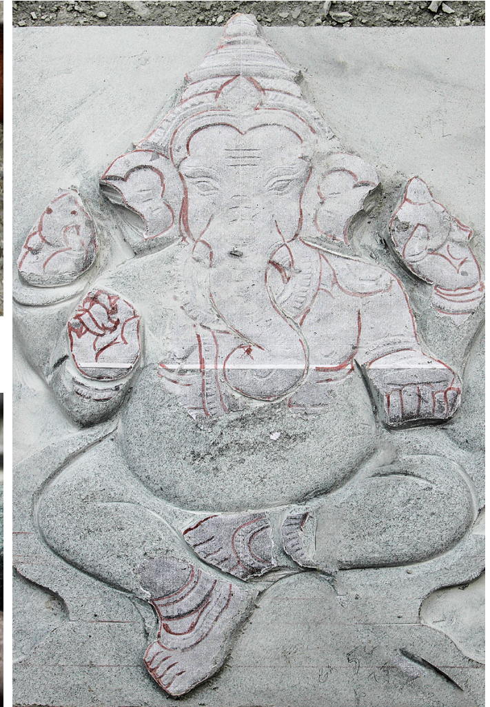
Carving of Lord Ganesha in process.