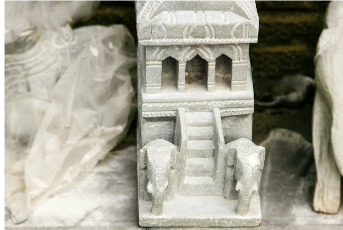
Miniature of a temple intricately carved.

http://www.dsource.in/resource/carving-stone-pillars/products