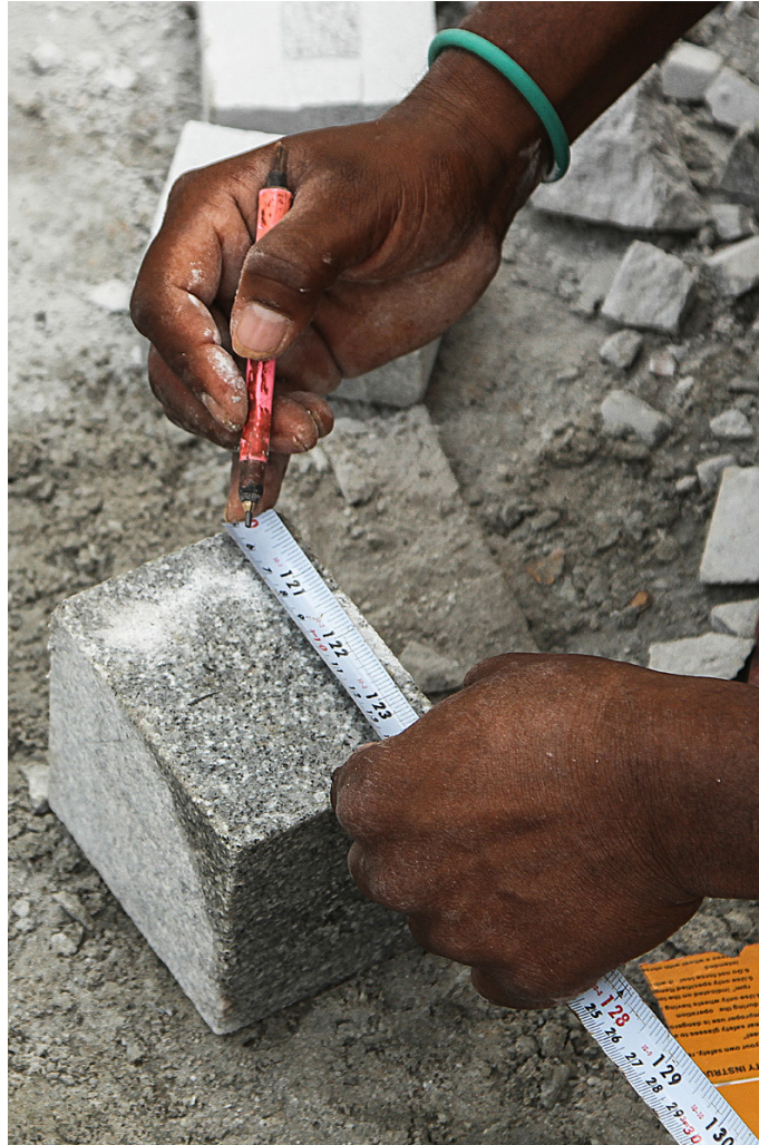
Required measurements are marked for the design.