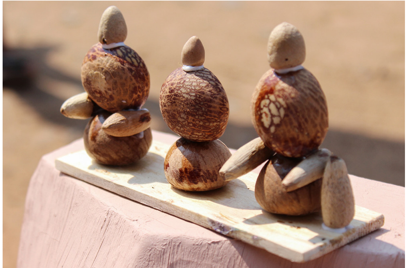
Beetle nuts are stuck to each other to form a pretty doll and are kept for drying.