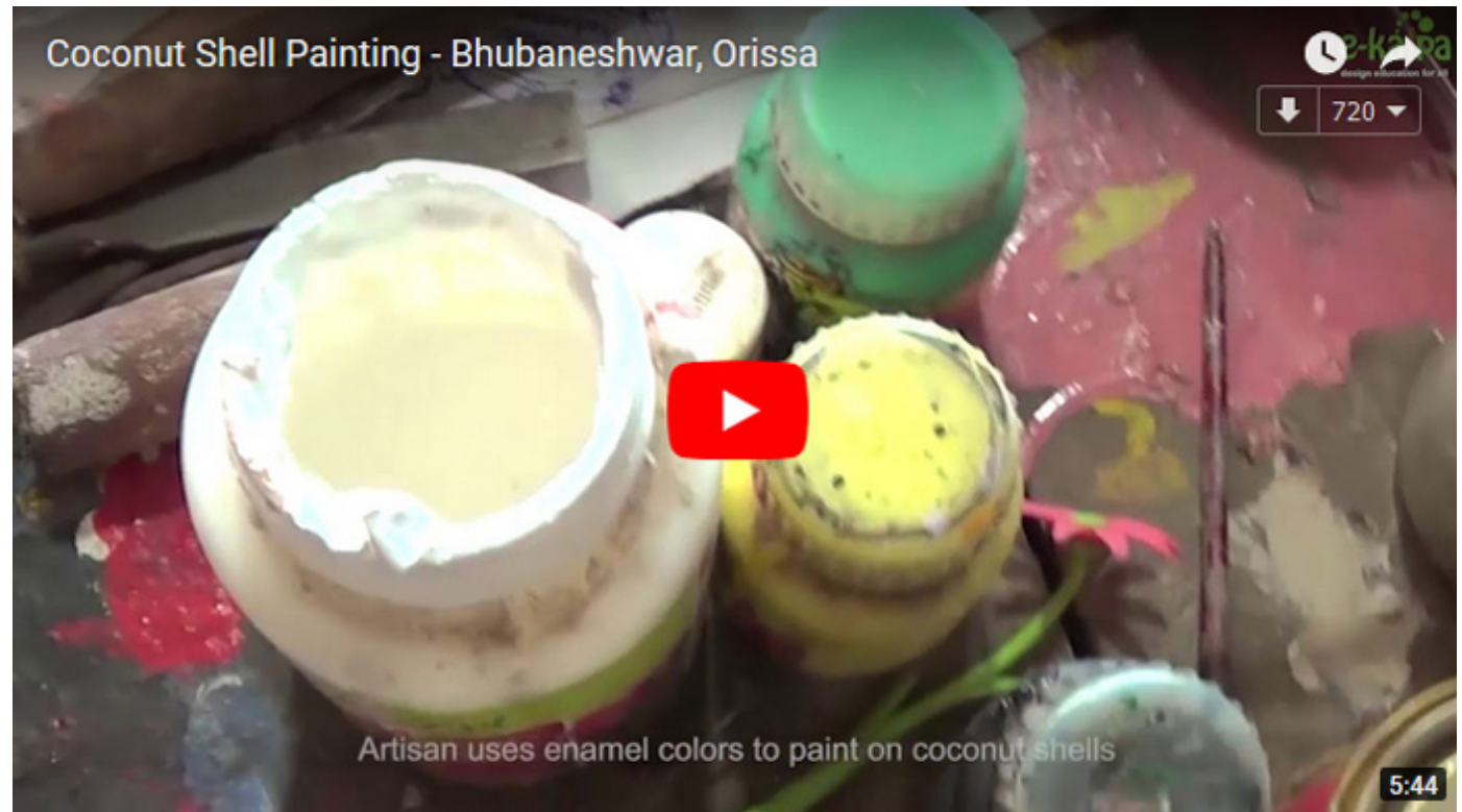
Coconut Shell Painting - Bhubaneshwar, Orissa