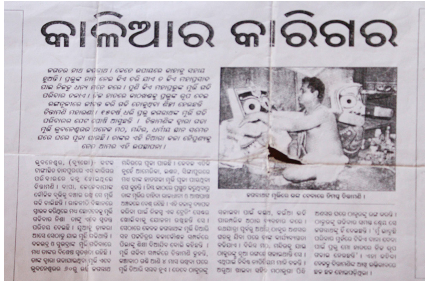
The article that has been published in print media regarding the artisan and the craft they work upon.