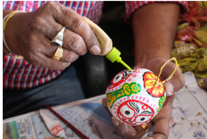
Sometimes 3D outliners are used for decorative purpose.