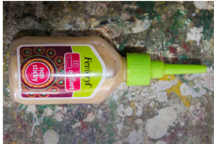
3D outliner is used for the beautification purpose.