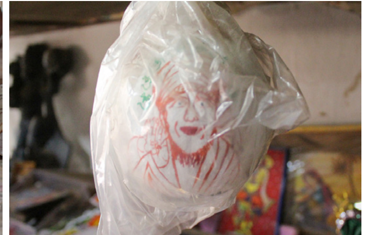
Sai Baba painted on the coconut shell and is packed for sales.