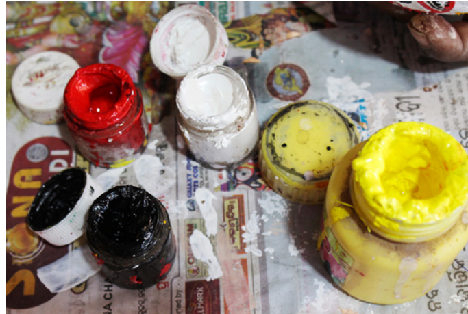
Paints are used for enameling the coconut shells.

http://www.dsource.in/resource/coconut-shell-painting-bhubaneshwar-orissa/tools-and-raw-materials