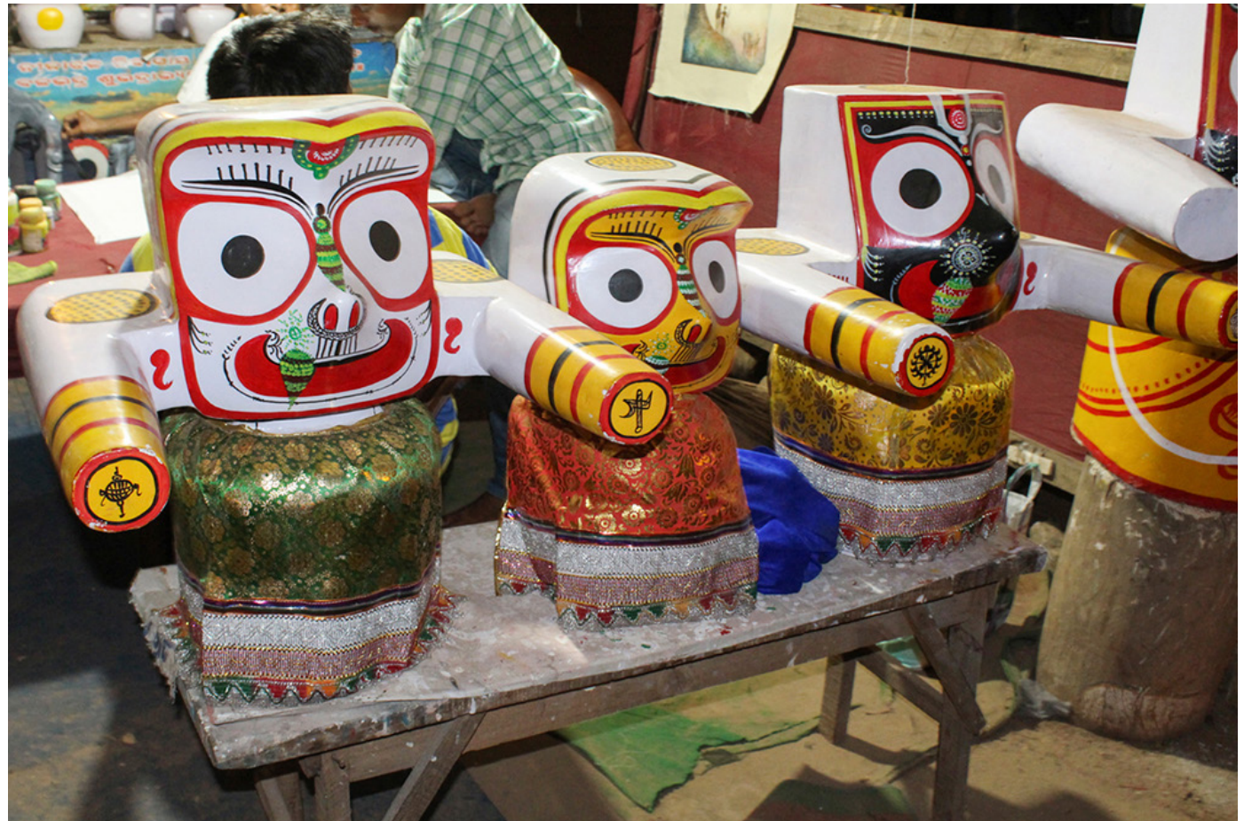
Lord Puri Jagannath idols made of wood.