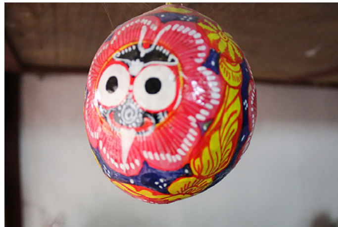
A unique pattern of Lord Jagannath painted on the coconut shell.