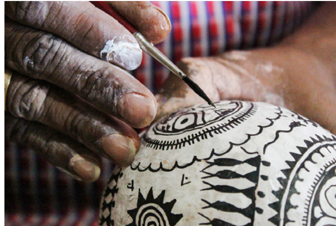
Monochrome work on coconut shell.