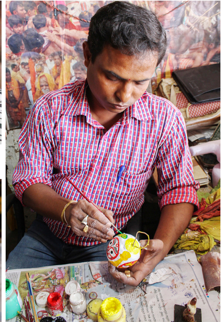
Artisan engrossed in making a wonderful coconut shell artwork.