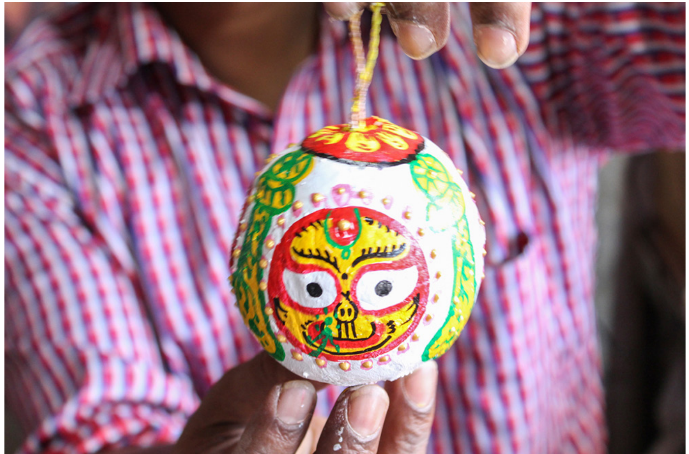
Multicolored coconut shell artwork.

Another product namely patachitra on three sides of coconut which involves tales from the beginning of Ramayana.