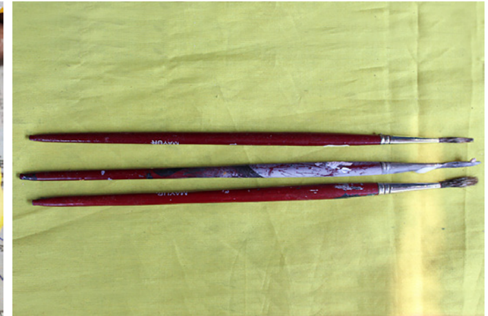
Painting brush is used while applying the paint on the shells.