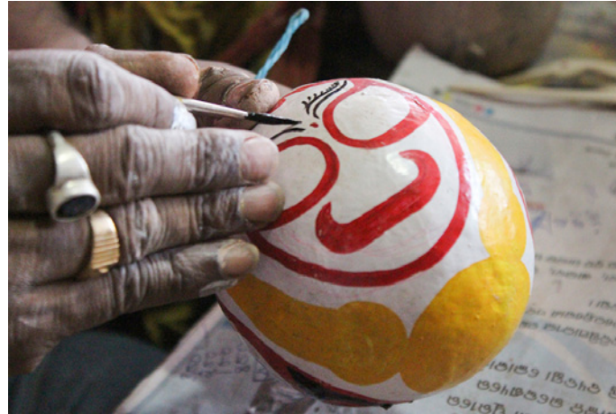
The fine detailed outlines are drawn.

http://www.dsource.in/resource/coconut-shell-painting-bhubaneswar-orissa/making-process