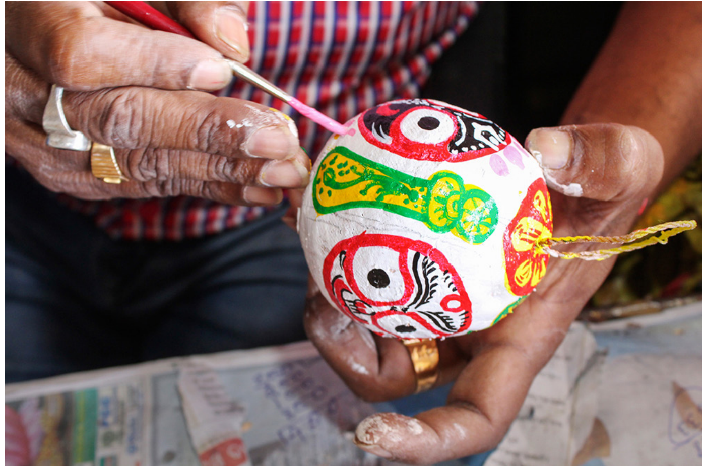
Coconut shell being enameled in multicolor.