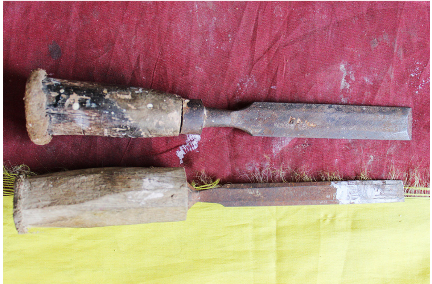
Chisel is used for smoothing the surface of coconut shells.