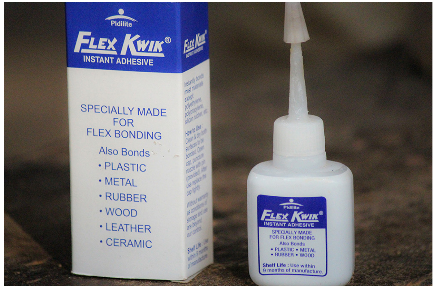
Synthetic adhesive is used for attaching the shells of coconut.