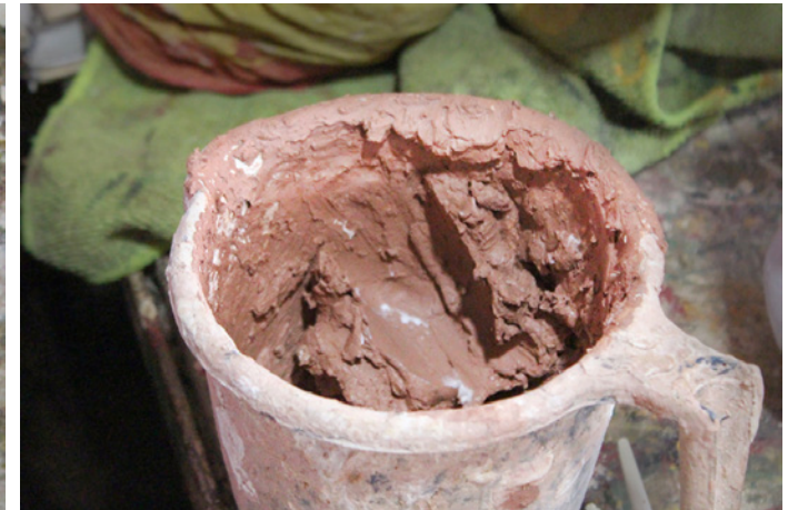
A paste of tamarind seed and synthetic adhesive.