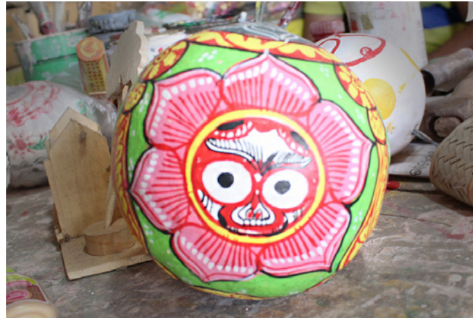
Flower designed border that encircles the painting of Lord Jagannath on coconut shell.

http://www.dsource.in/resource/coconut-shell-painting-bhubaneswar-orissa/products