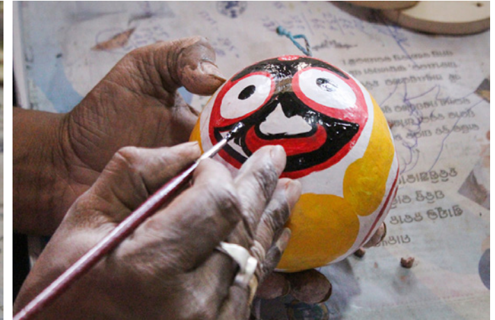
Colors are further filled inside the border area.