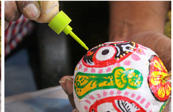
A close-up of the 3D outlining.