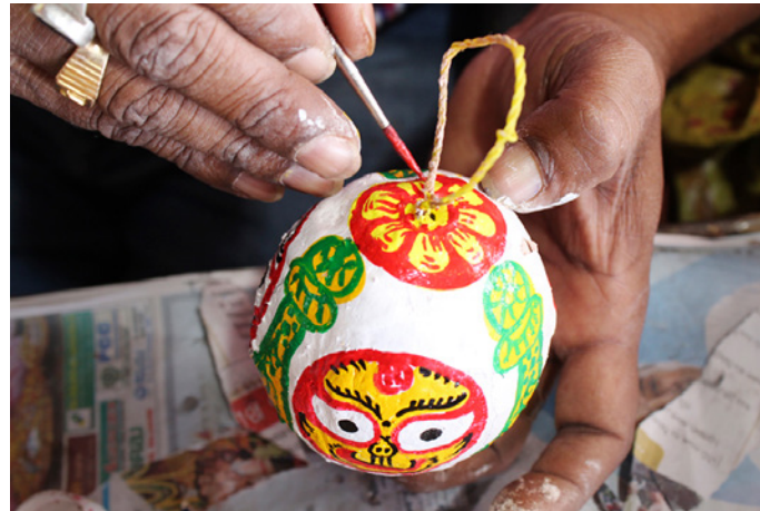
Artist renders the fine details of the craft.