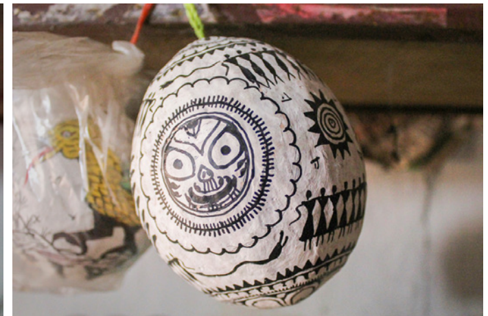
Coconut shell beautified by drawing only the outlines on it.