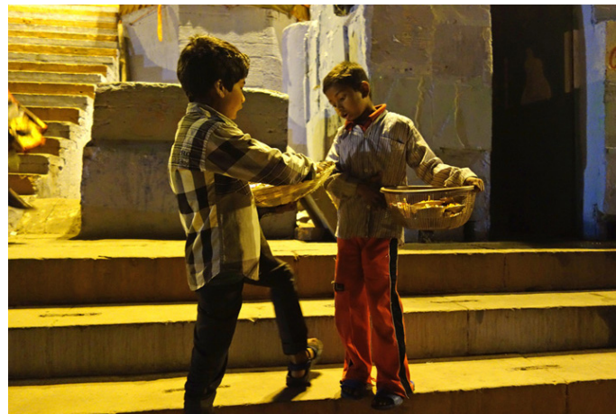
Little boys selling flower bowls and candles, animatedly compare their earnings for the day.