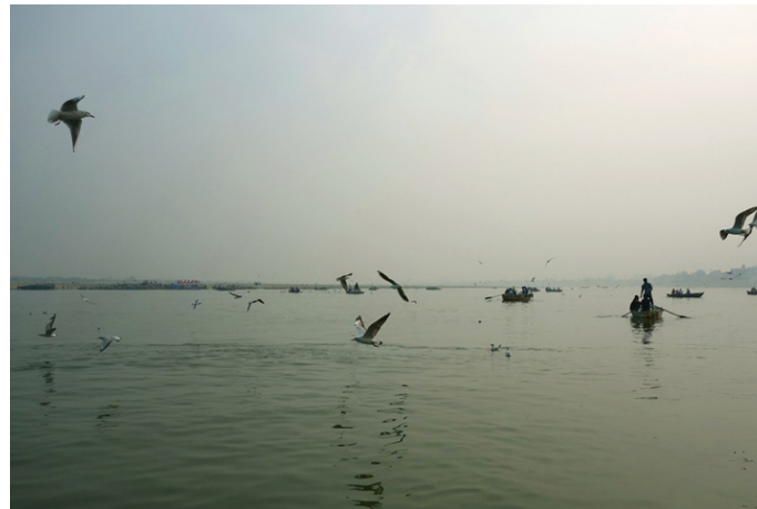
Screeching, flying, distracting, diving, and grabbing a quick bite of 'sev', are flocks of Seagulls flying over the Ganga.