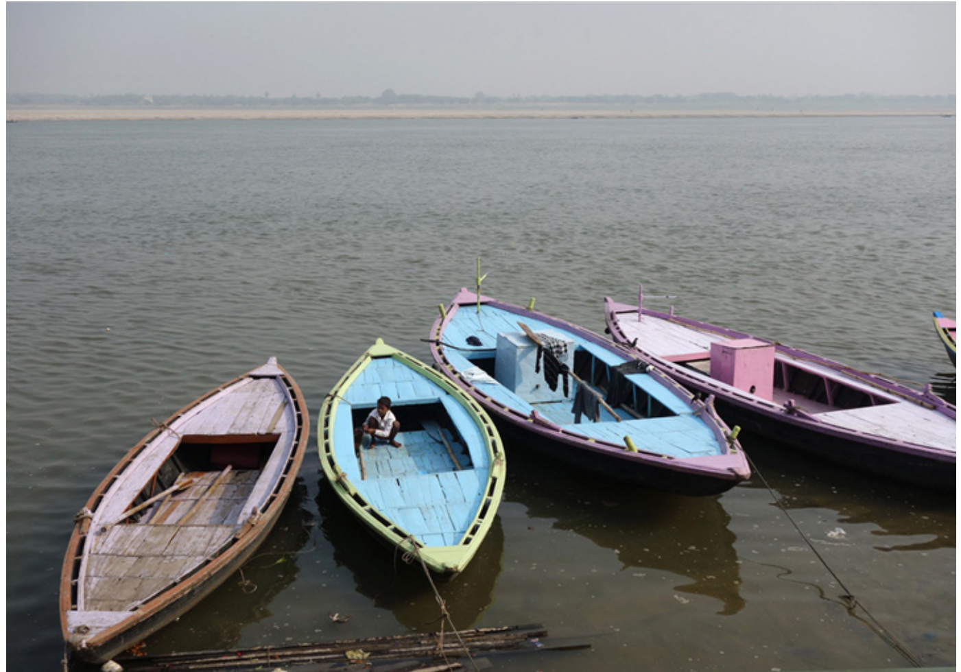
Boats tethered on the Ghats make a pretty picture, whilst a tiny boatman untangles the net within the boat.

Constant death is compensated by creation. Children can be found celebrating the birth of newly born puppies. And sometimes lone walkers walk, ignoring everything around, aimlessly. Ghosts also play their part to perfection within abandoned monuments, keeping away the locals and befriending the junkies. In action or non action every being is performing its intended role.