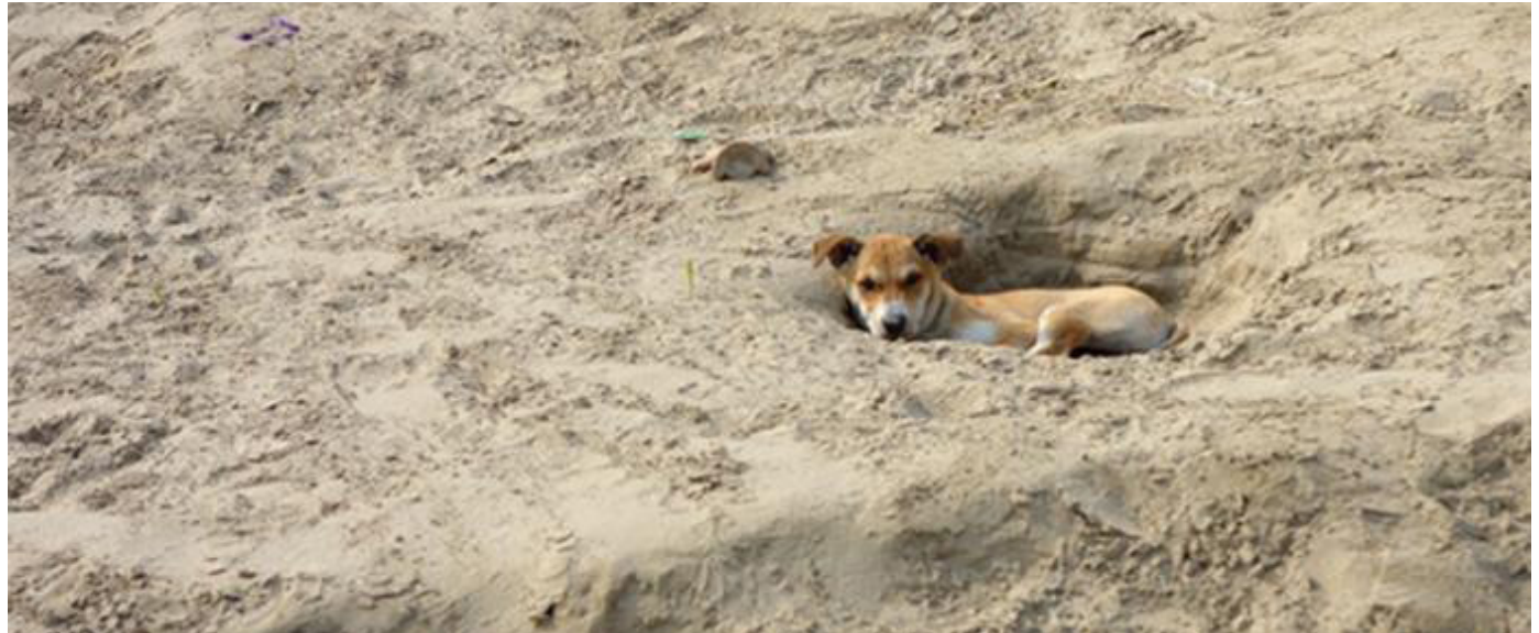
A dog burrowed in the sandy bank of Assi Ghat on an early Monday morning.

Each person glimpses Varanasi through their own coloured glasses, and each of them is offered a different shade from the city's palette. This small city has a wide acceptance for people from all walks of life, all parts of the world and creatures big and small.