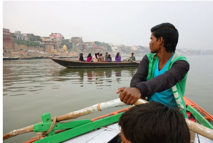
Sailing across the River Ganges from one end to the other.

http://www.dsource.in/resource/daily-life-varanasi/daily-activities