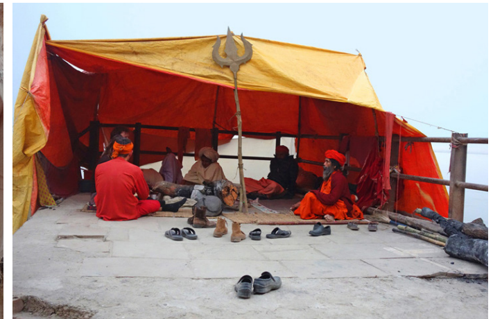
Sadhu's, sages Shiv - bhakts and spiritual seekers remain meditative with a makeshift abode by the river front.