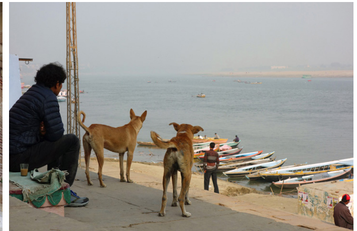
The man in this picture runs the guest house on Pandey Ghat, nicknamed as the Korean Ghat owing to the number of Korean tourists living here. He was invited to Korea to learn the language, which he did. Fluently. Sipping Chai, playing with the stray's, flying a kite, chewing paan, and conversing in Korean he remains an dynamic example of crossed cultures.