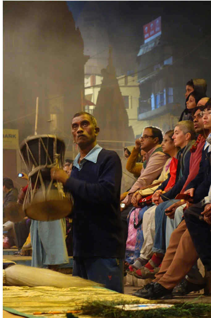
The drummer looks euphoric and seems to be in another world of his own, while the onlookers remain in raptures over the performance of the puja.