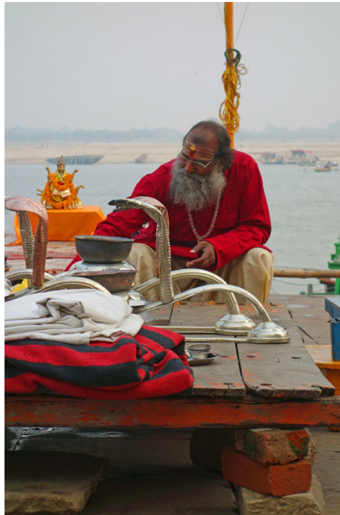
An old pundit making the preparations of the serpentine lamps, oil, camphor etc. for the Ganga aarti.