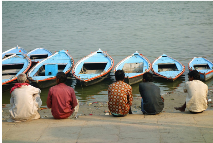
A boatman for each boat. Sitting on the Ghats the boatmen await the stream of tourists to begin their day with a boat ride on the Ganga.