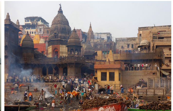
Quiet, mournful, chatty and wise - crowds descend upon the Harishchandra Ghat for the continuous cremation of the dead bodies. Logs of wood, stray cattle, and ash-en faced structures dominate the grim but well accepted reality of life.