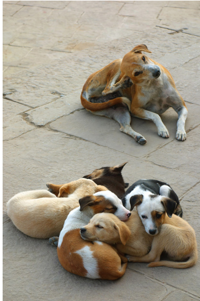
Another five creations rest peacefully while their mother looks on unperturbed.