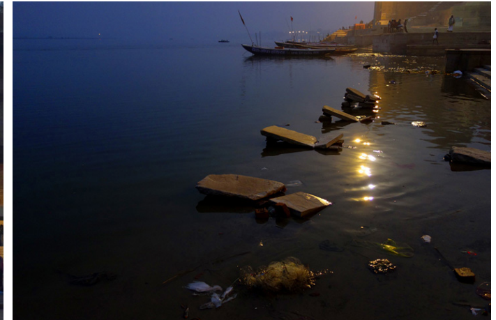
Offerings, ashes and rubbish get washed ashore on the banks of the River Ganga.