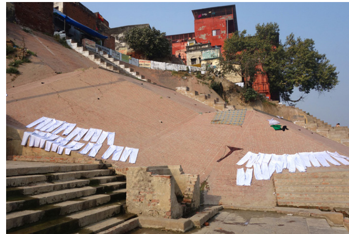
Washed, starched and stretched perfectly over the slopes of the Ghats, these clothes wait passively to be dried under the afternoon sun.

http://www.dsource.in/resource/daily-life-varanasi/daily-activities