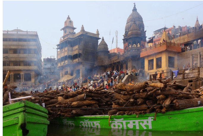
'Bank of Commerce' sponsored boats ironically are overfilled with wood used on the pyre.

http://www.dsource.in/resource/daily-life-varanasi/daily-activities