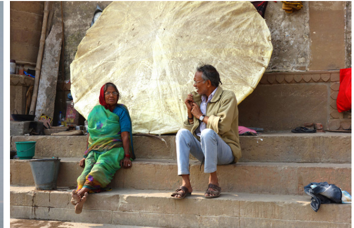
Elderly local's who live on the Ghats enjoy a leisurely conversation.