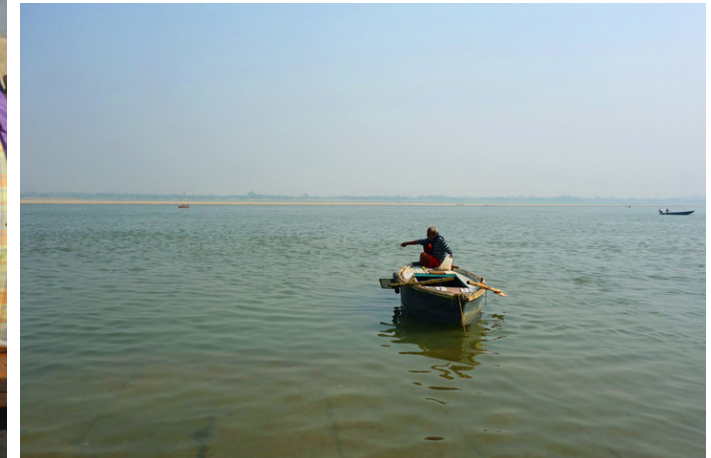
A boatman enjoying his peace.