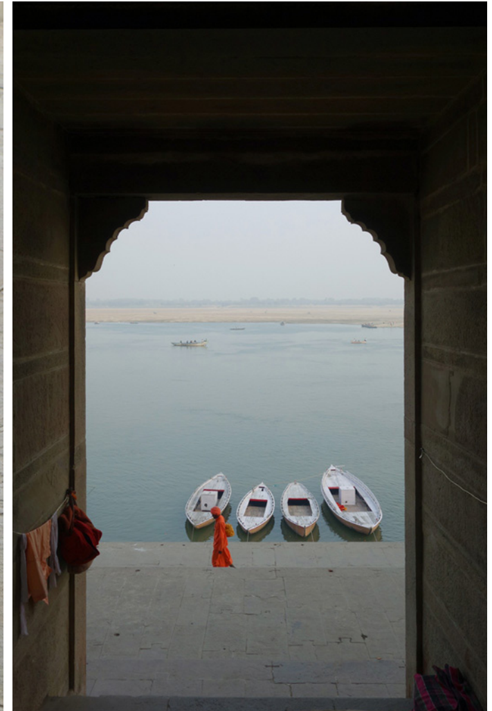
The most beautiful journeys are made alone.