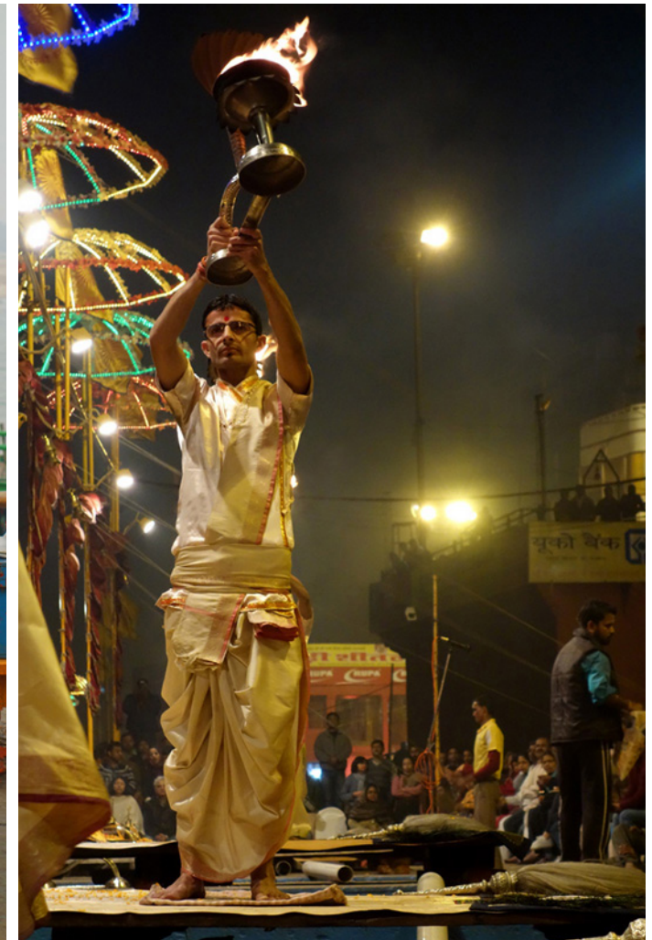
Young pundits skilfully twirl in perfect harmony the traditional serpentine diya, while onlookers remain enthralled during the chanting of the Ganga aarti.