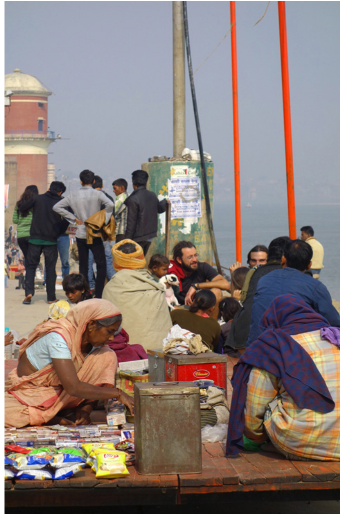
A Ghat-side stall, where a woman sells beedi's, cigarettes, packs of chips and an odd assortment of products. Just behind her is a group of foreigners interacting with local children.