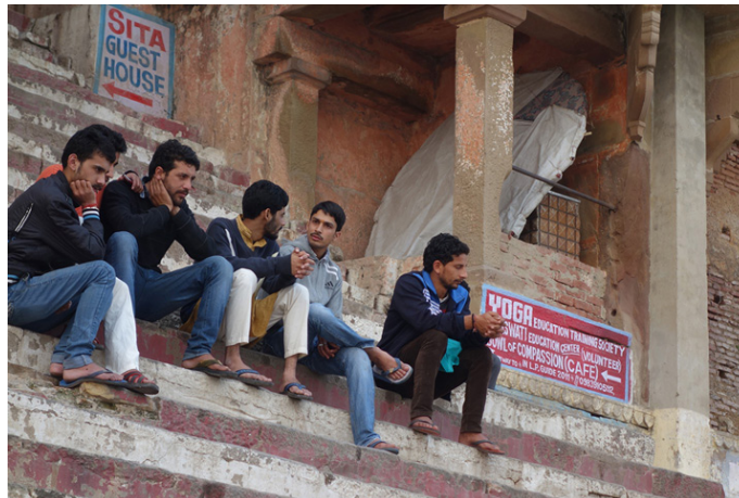
Young men in their early twenties dressed typically in jeans, kurta's, sweaters and two - patti slippers, sitting on the steps brooding over a deep conversation on a light hearted morning by the Ganges.