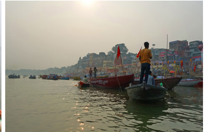
Boatmen get busy lining up the boats, and call encouragingly to the travellers to hire one for the spectacular Ganga Aarti in the evening.