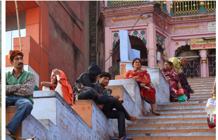
Devotees sitting outside the Sri Ram Krupeshwar Mahadev Mandir after their morning prayers.