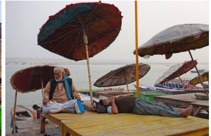
While some people sleep their 'Final Sleep', others choose to grab a quick nap under the shady cloth umbrella's characteristic of the Ghats in Varanasi.