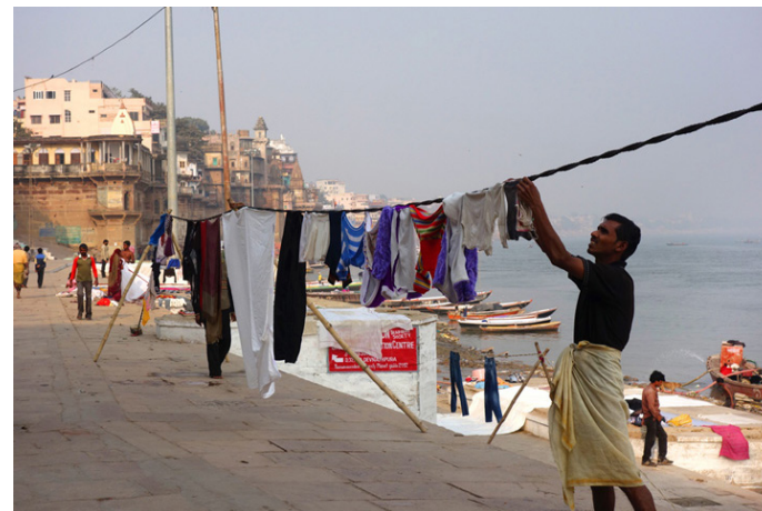
Makeshift clotheslines are used by the locals who live and work on the riverside.