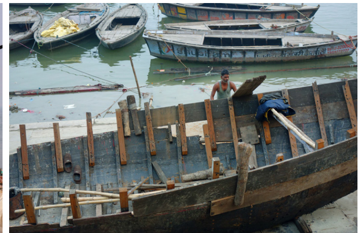
A boatman gets busy making a boat. Here he is firing the wood in order to make it bend and fit around the boat's shape perfectly before securing it with nails.