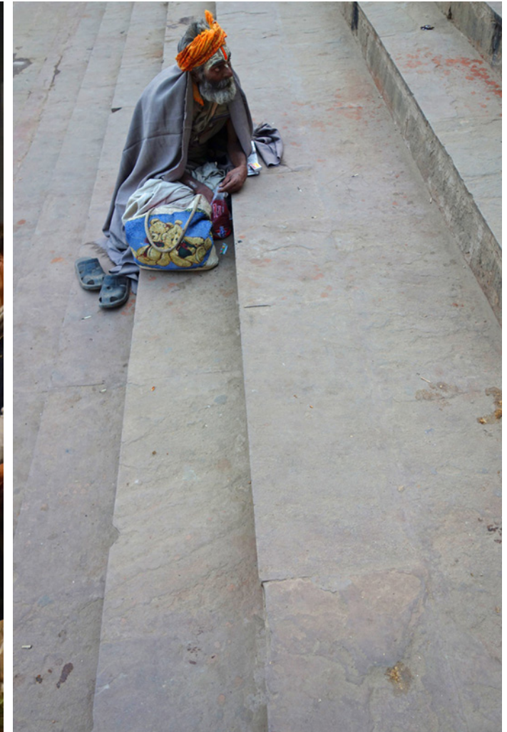
A Sadhu lost in thought, or stoned after a few puffs of charas.