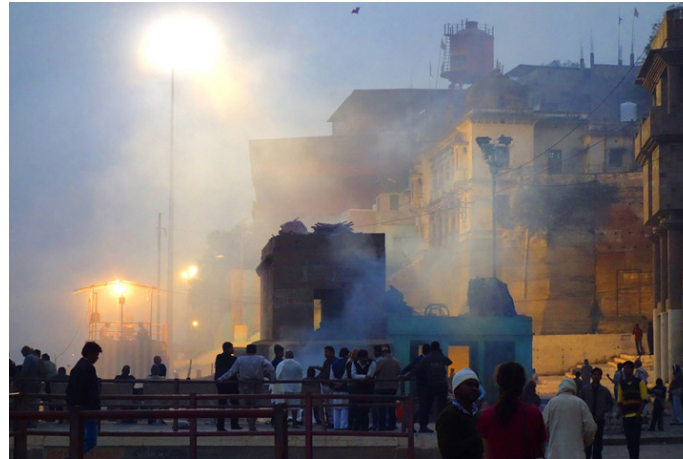
A smoke filled evening sky hangs low over the burning remains over the last few bodies, that eventually burn alone into the night.

http://www.dsource.in/resource/daily-life-varanasi/daily-activities