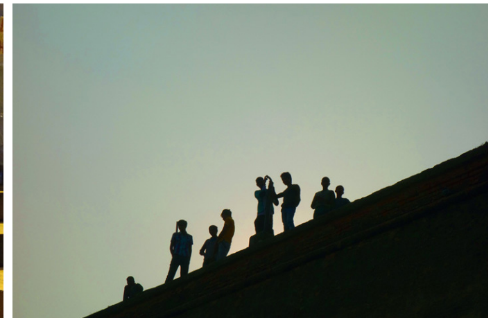
A new day begins at dawn with young boys waiting to fly kites over the Ghats.