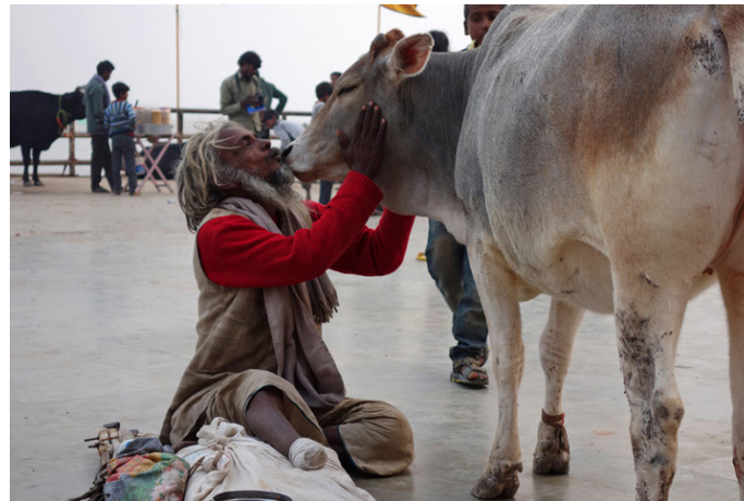
On the Ghats you will meet extraordinary and eccentric folks. This vagrant is totally in love with every creation of god, animals are intuitively drawn towards him.