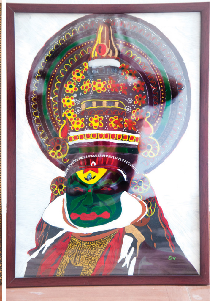
Glass painting portraying a classical Indian Kathakali dancer.