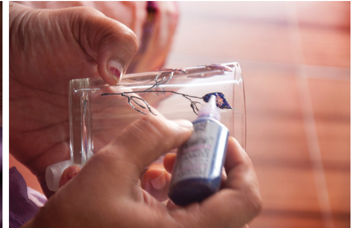
Blue glitter glass color is also used on the leaf.