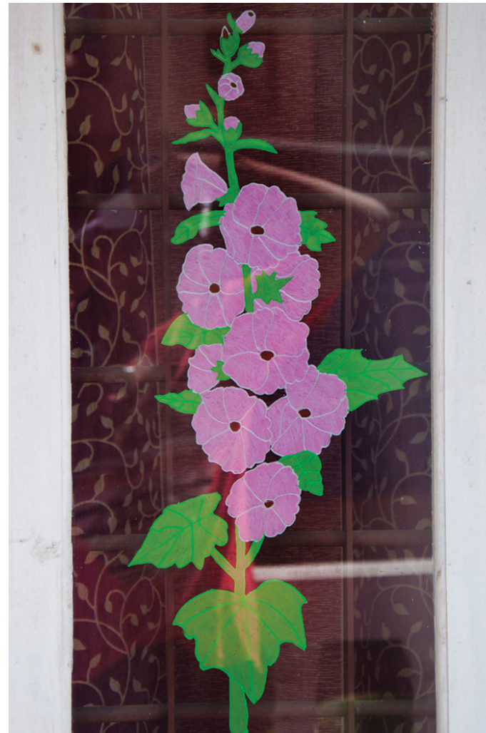
Floral painting made on the glass attached to the window frame.

http://www.dsource.in/resource/glass-painting-tripunithura-kerala/introduction