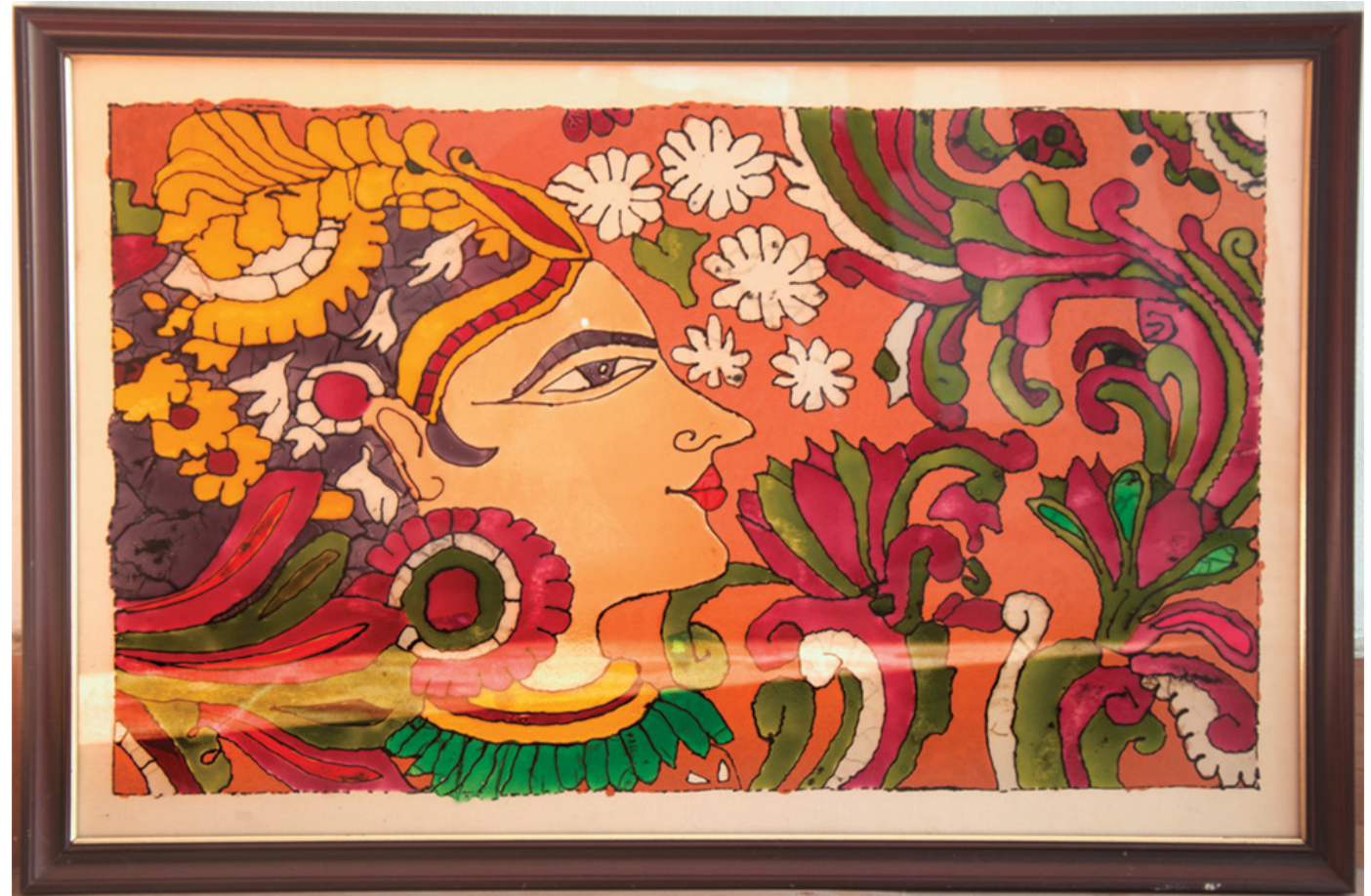
A beautiful depiction of a lady surrounded by colorful flowers.

Glass painting is affectionately referred as a highly valued art that has cherished for many years. Glass paintings are the most popular artifacts. The language of the artistic glass painting of Kerala is very expressive, lively and understandable. The complete appearance of glass with the semi-transparent paints on it provides an ethnic look. These glass paintings allow an expressive mix of form and dimension to glass. Glass paintings are used as the decorative articles and enrich the look of wall hangings, showpieces, napkin holders, cutlery and etc. Now a days the painters are coming up with more creative ideas of contemporary designs on variety of topics for glass painting. These glass paintings deserve the place as an antique collection for their beautiful designs and its craftsmanship.