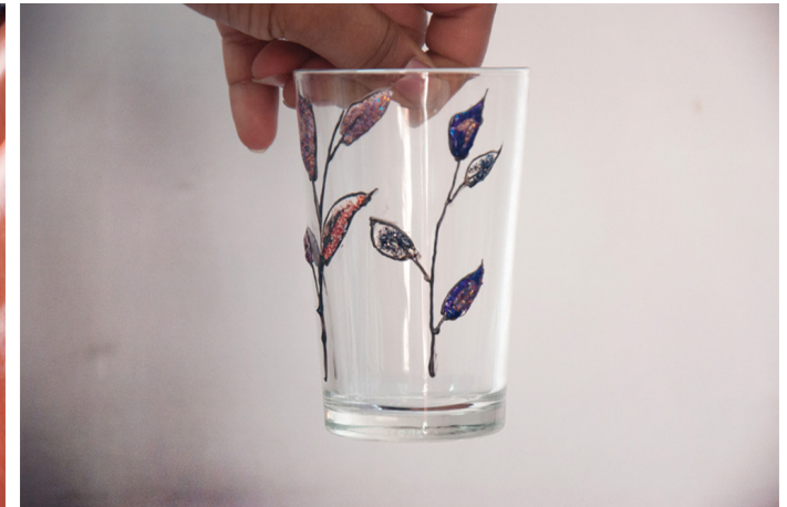
Glass tumbler is enhanced with decorative glass glitter colors.