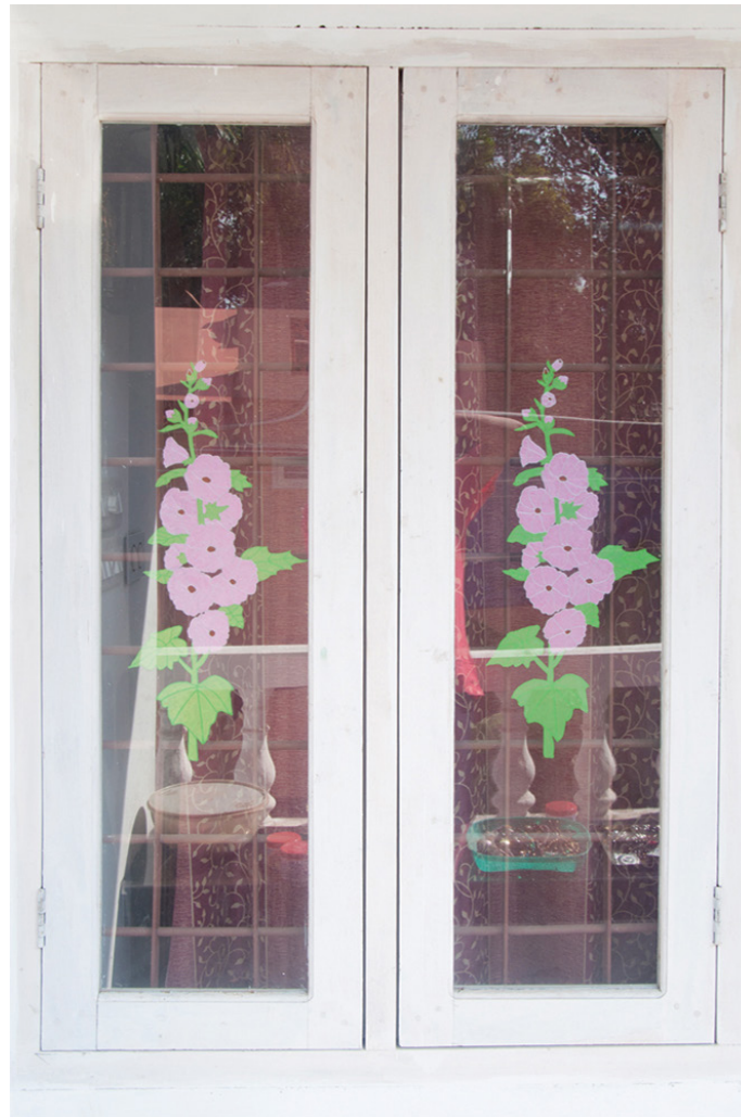
Glass windows painted with floral design with glass colors.