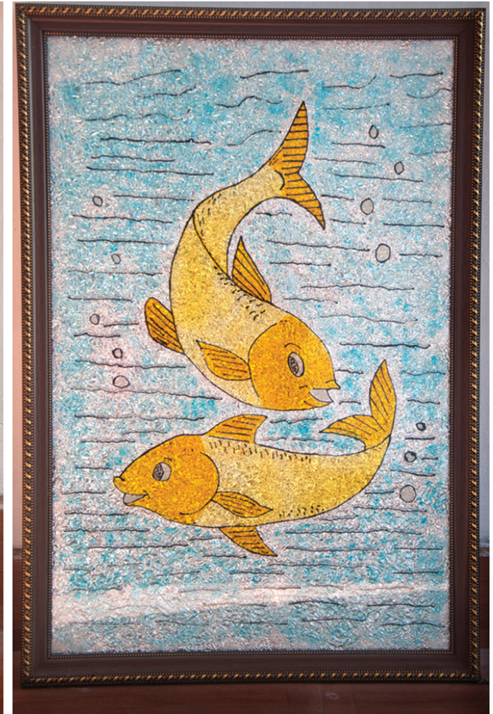
Depiction of two gold fishes with gold and yellow glass paints finished a lustrous effect from the aluminum foil stuck behind the painting.