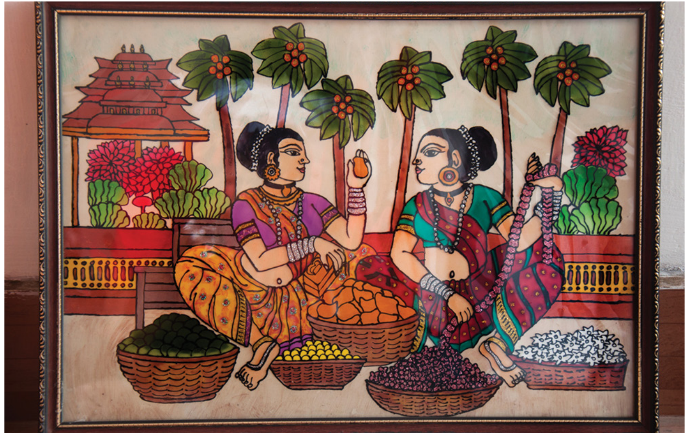
Glass painting of two women selling flower and fruits.

Glass painting themes vary from region to region. In Bihar, the glass paintings are very different in form and theme, when compared to other regions. They are usually large pictures of religious themes and are illustrated by their fine line work with vibrant colors. Bengal glass paintings can be recognized by the distinguishing figures and costumes and the soft pastel shades that are used. The tradition of glass painting in Thanjavur of Tamil Nadu is still carried out. Here the artisans create the paintings of Thanjavur sacred icon. The other major centres of glass painting that are located in India are Andhra Pradesh, Awadh, Deccan, Hyderabad, Karnataka, Kerala, Kutch, Mumbai, New Delhi, Tamil Nadu and Satara.