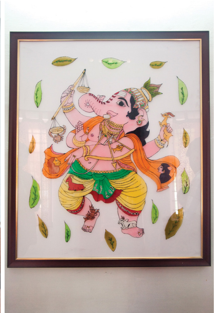
Lord Ganesh depicted with animals and insects in a theme composed by the artisan through glass painting.