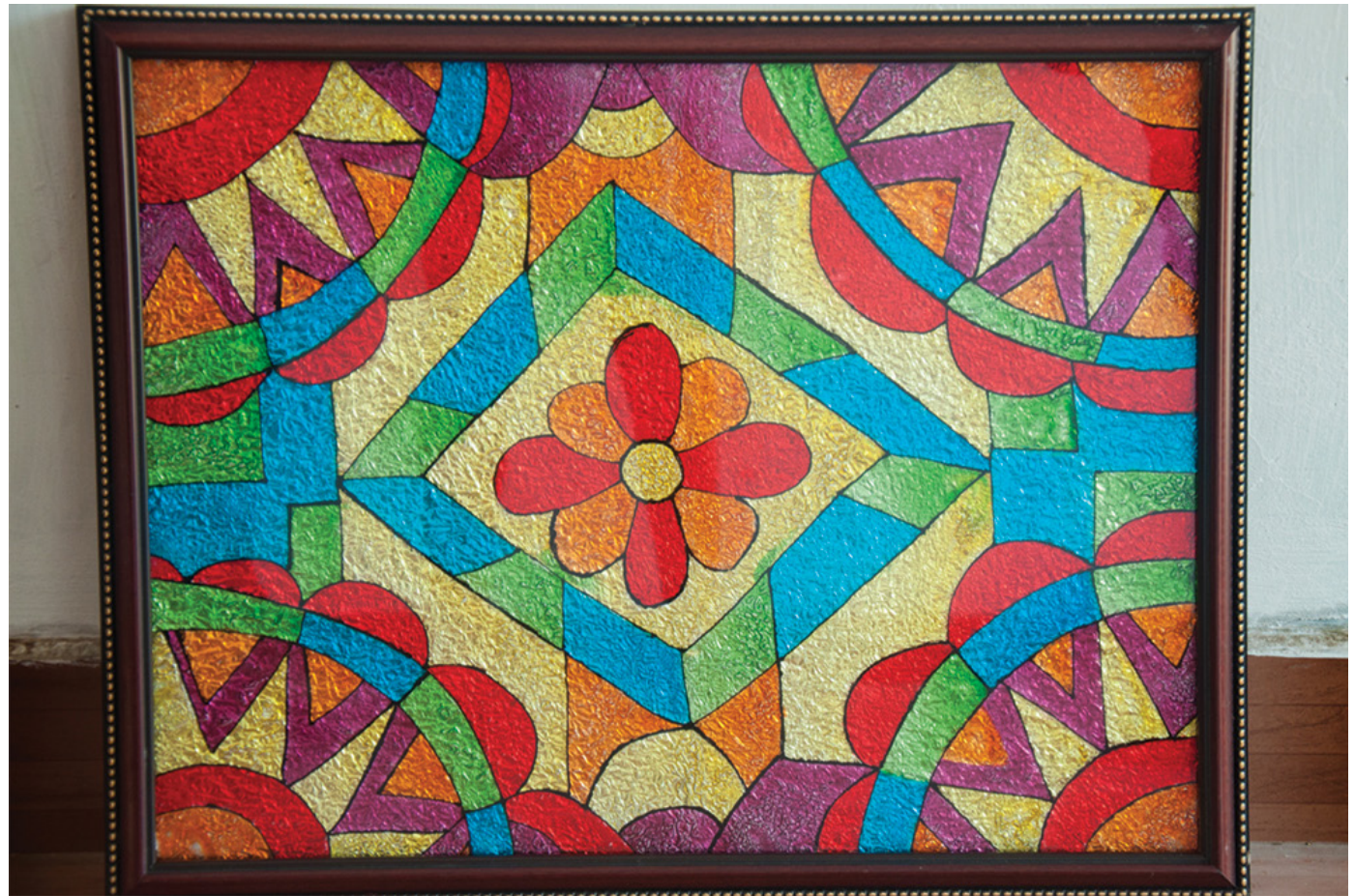
Glass painting of an abstract form made of a combination of floral and geometrical figures with bright colors.