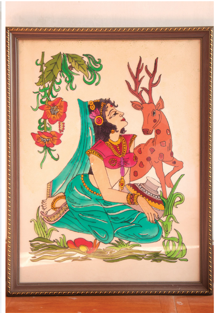
Painting of a women fetching water and gazing at the deer interpreting to an epic character Sita from Ramayana.