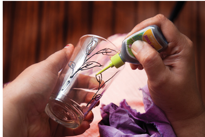
Outline of design of the plant is drawn on the glass.