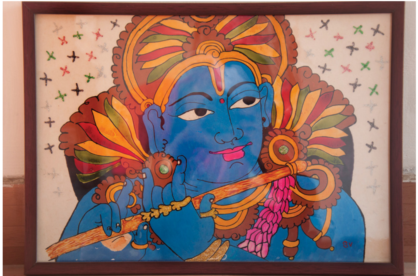
Glass Painting of Lord Krishna with bright colors.