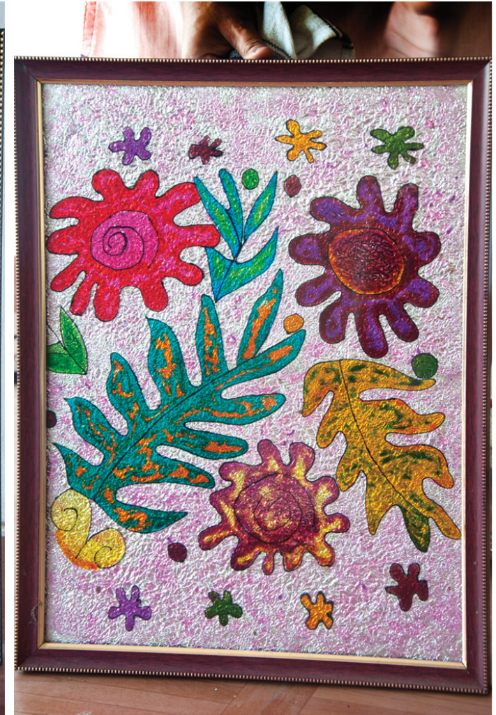
Multi-colored Abstract painting portraying nature.