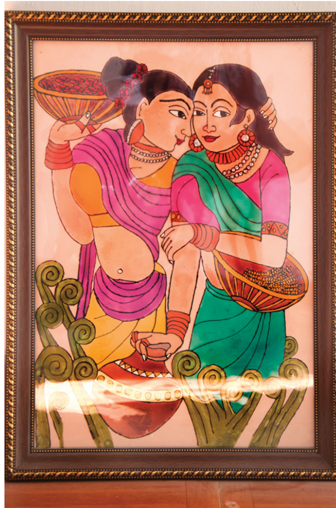
Depiction of two women gossiping in glass painting.