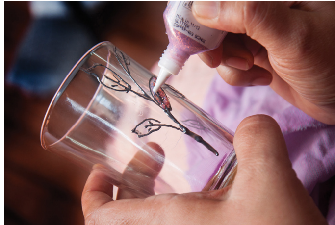
Copper pink glitter color is filled into the drawn design.

http://www.dsource.in/resource/glass-painting-tripunithura-kerala/making-process