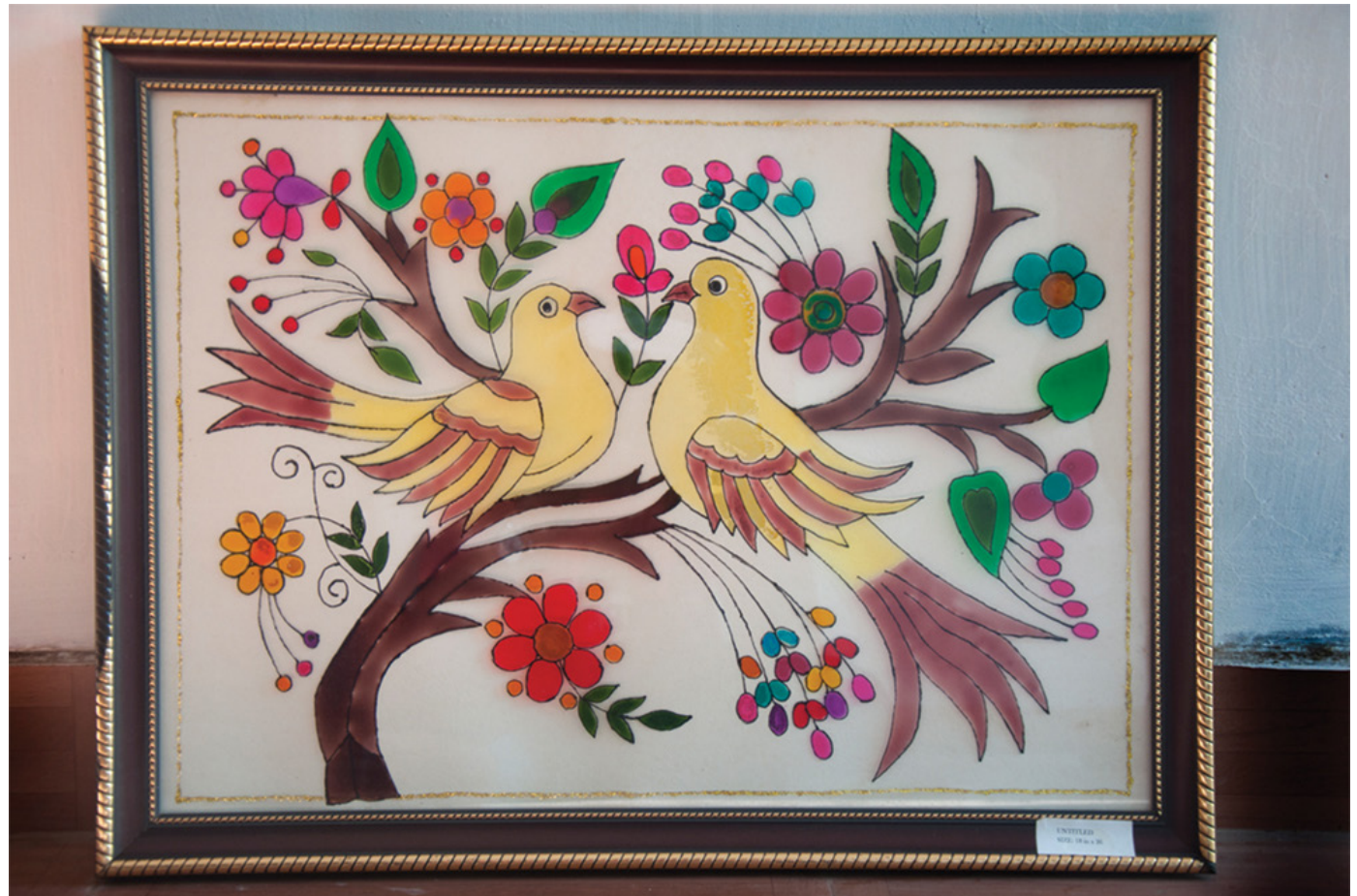
Glass painting of two birds sitting on a tree branch full of colorful flowers.