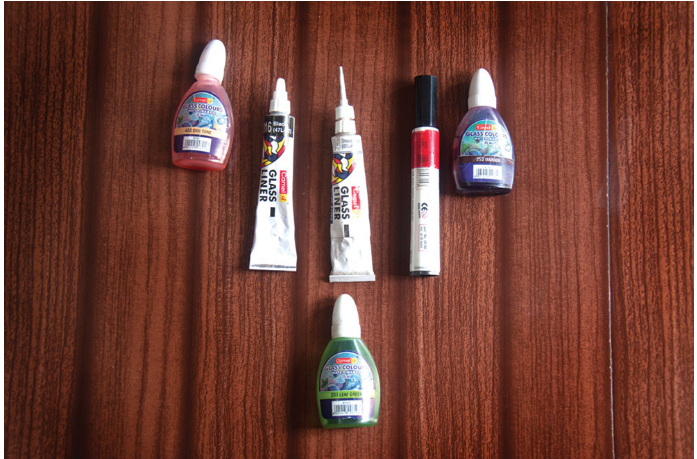
Glass liners are used to draw the outlines of the design on glass.