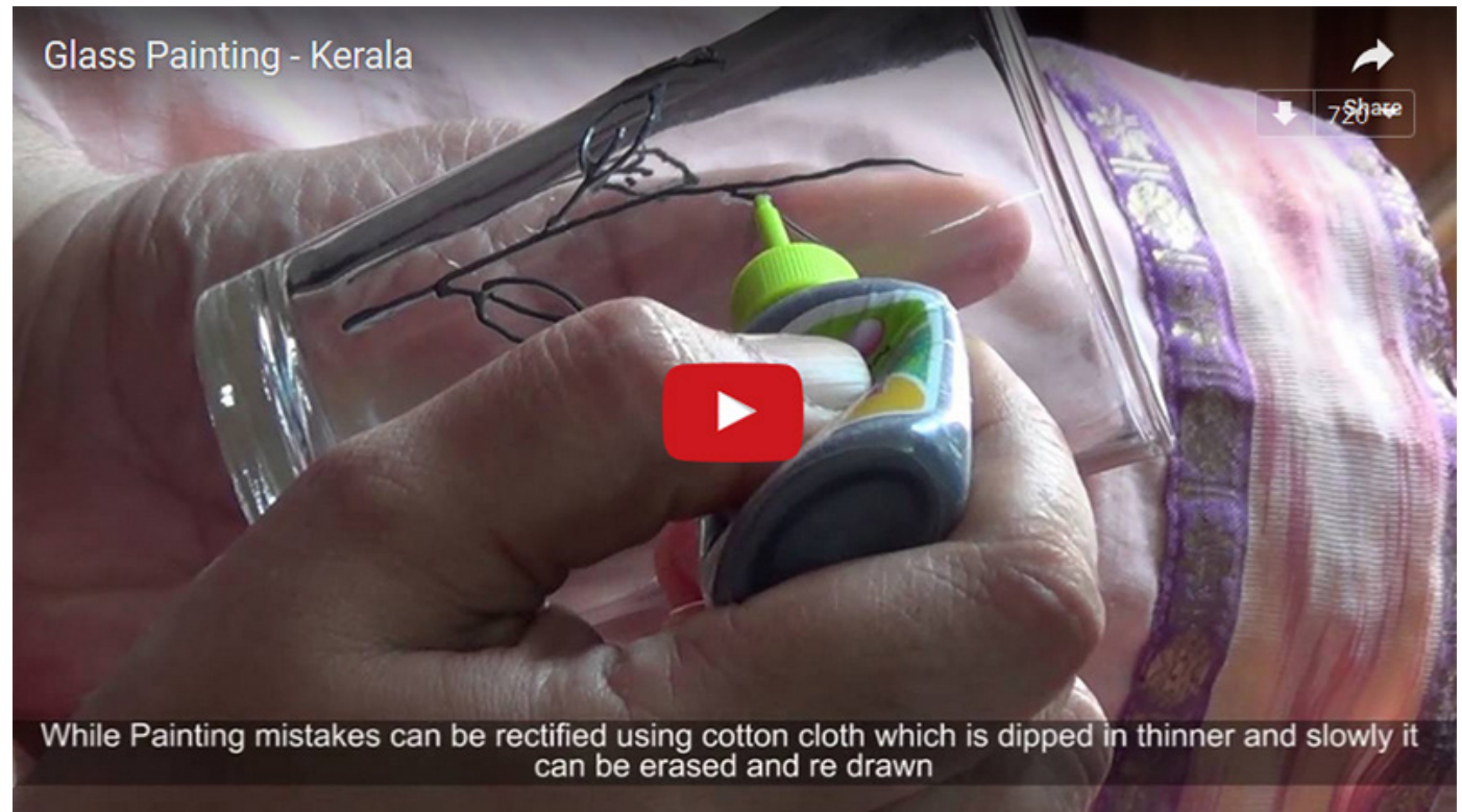
Glass Painting - Kerala