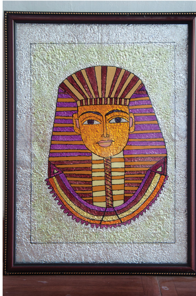
Portrait glass painting of an Egyptian mummy with a creative foil background.