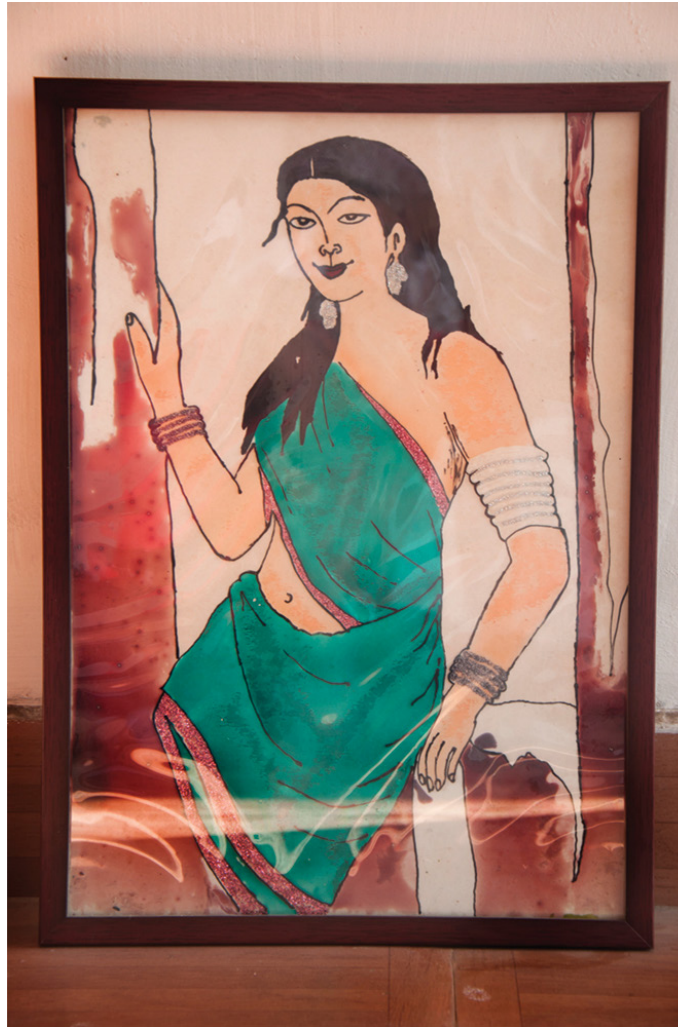
Glass painting of a women dressed in a tribal attire.