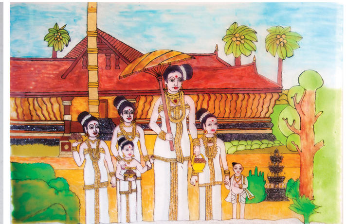
Painting of women and children in the traditional Kerala attire painted on Glass.