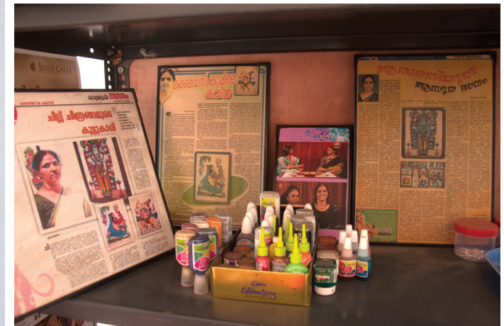
Artisan's information and her craft work published in a native newspaper articles.