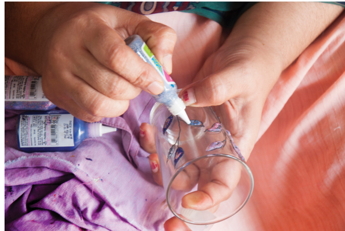
Overlapping of glitter colors with another color is done to make the painting more effective.