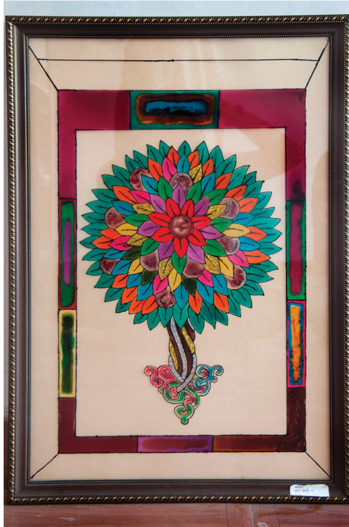
Abstract colorful painting by the artisan with a mind tree concept behind.