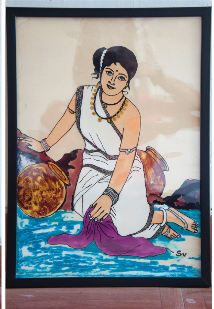
Portrait of a village woman painted on glass interpreting to an epic character Shakunthala from Mahabharata.