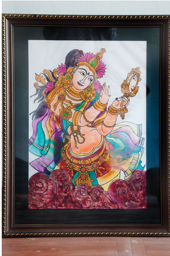
Glass painting depicting of an Apsare (a beautiful lady) looking herself in mirror and getting adorned oneself.