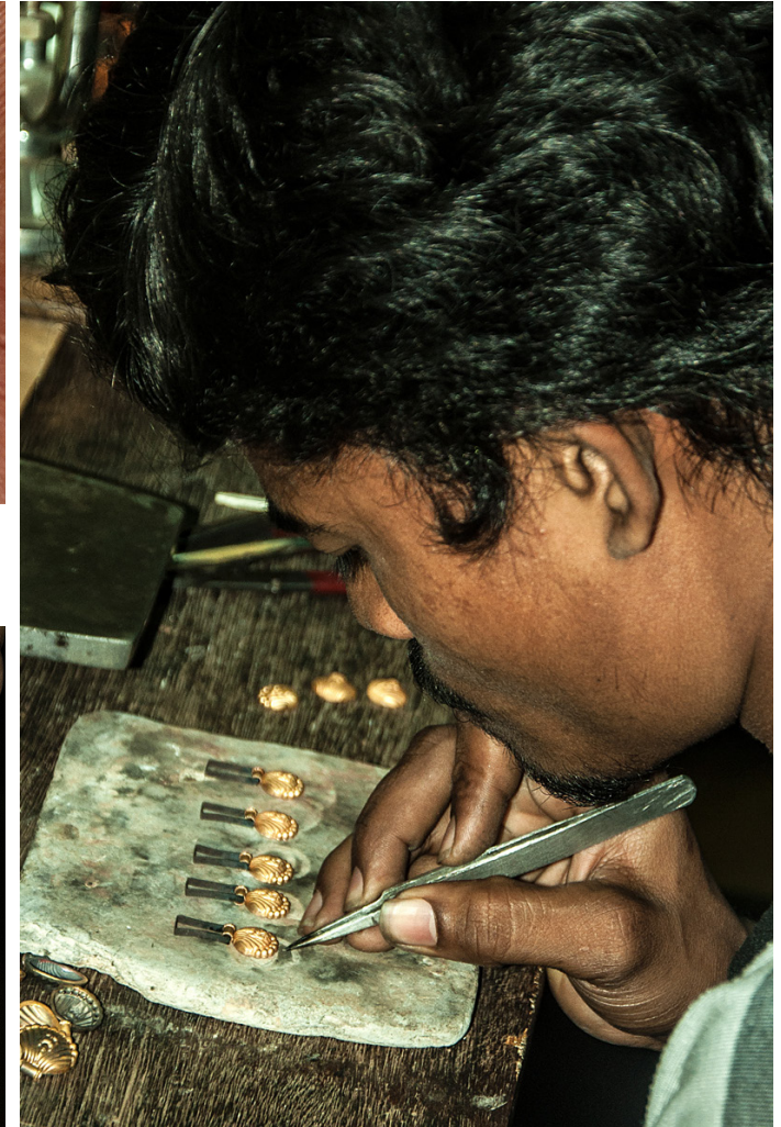
Different design pieces are arranged together to form one article.