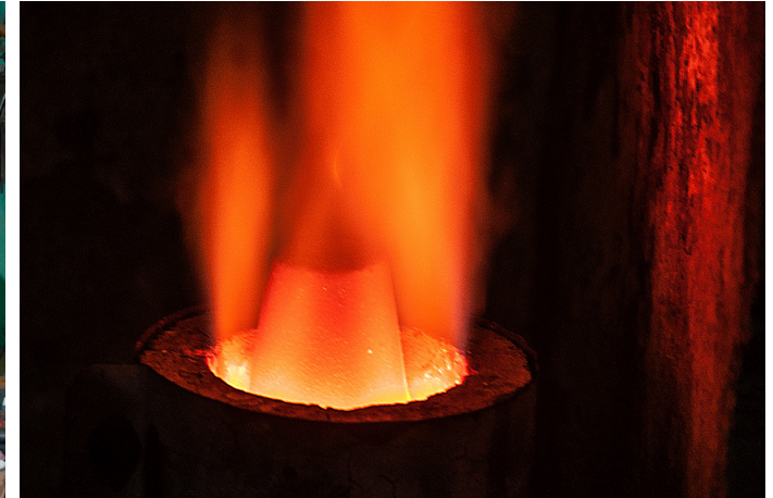
Gold is casted in the mini crucible cup.