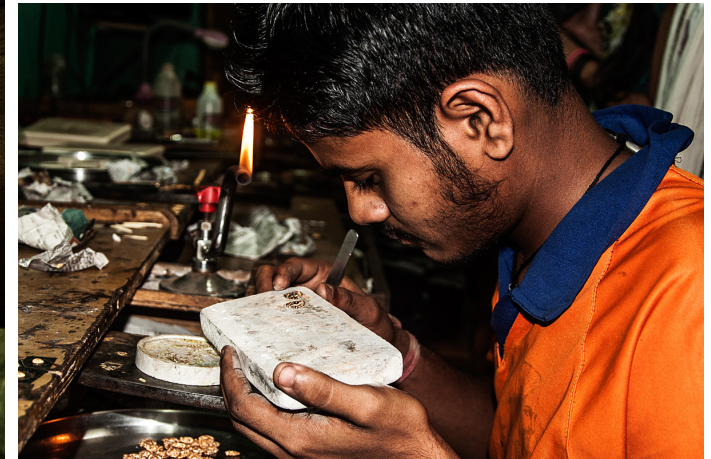
The artisan checks gold articles for any changes to be made after soldering process.