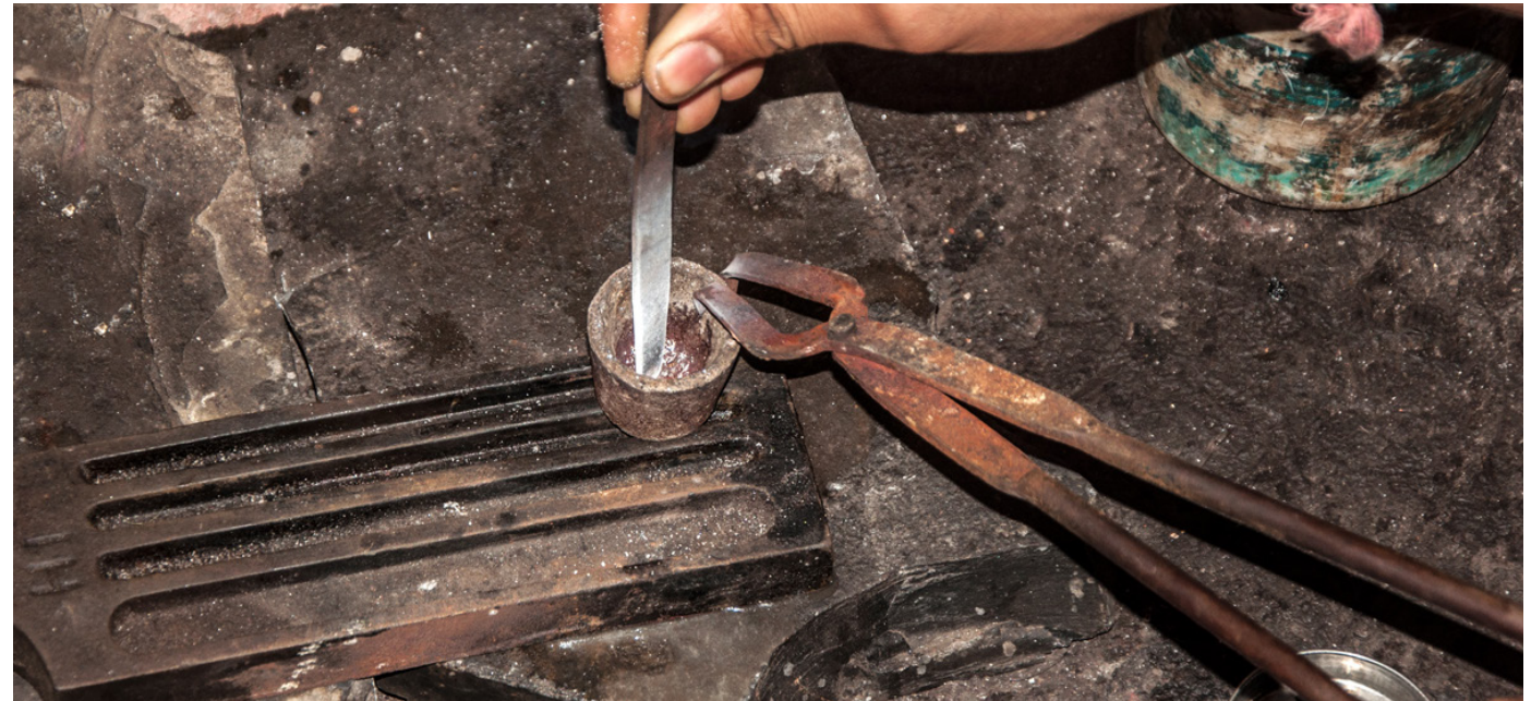
Gold biscuits are placed in a crucible for melting.

Gold articles are checked for alterations required after soldering process. Rough edges are filed and the surface is smoothened. Completed articles are washed in nitric acid and polished using machine, locally known as drum polishing machine which consists of small metal pins and polishing shampoo which runs for 20 to 25 minutes. The polished articles are weighed and packed for delivery.