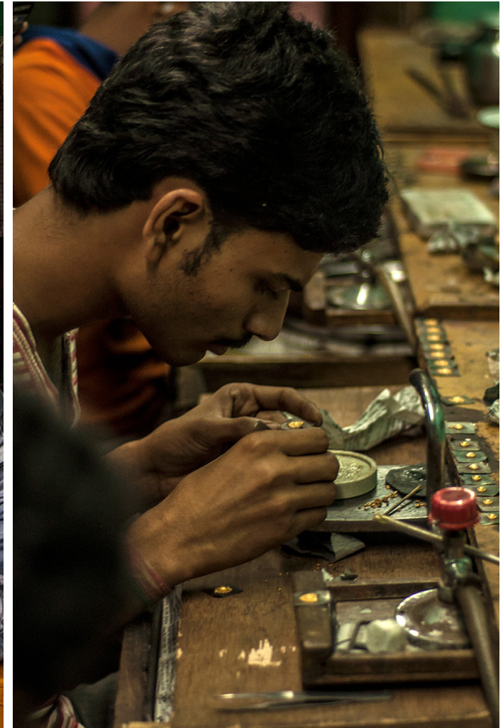
Pieces of gold are dipped in soldering solution to join the parts.