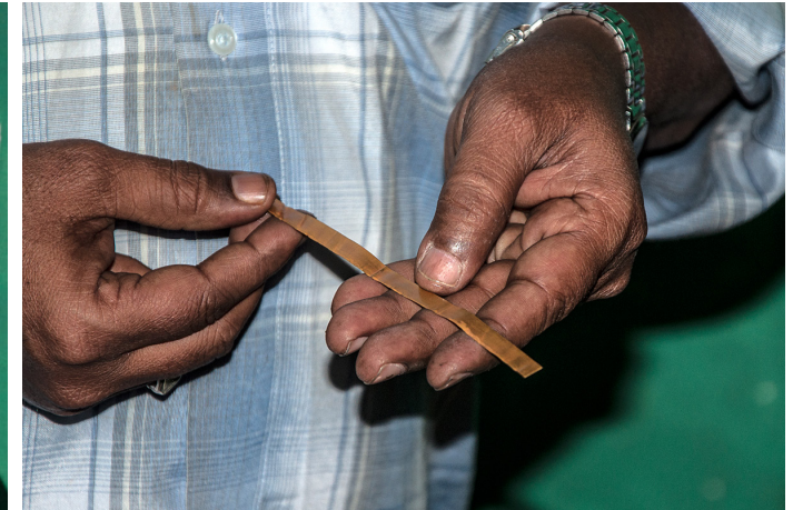
The gold strips are further used in pressing (shaping) process.