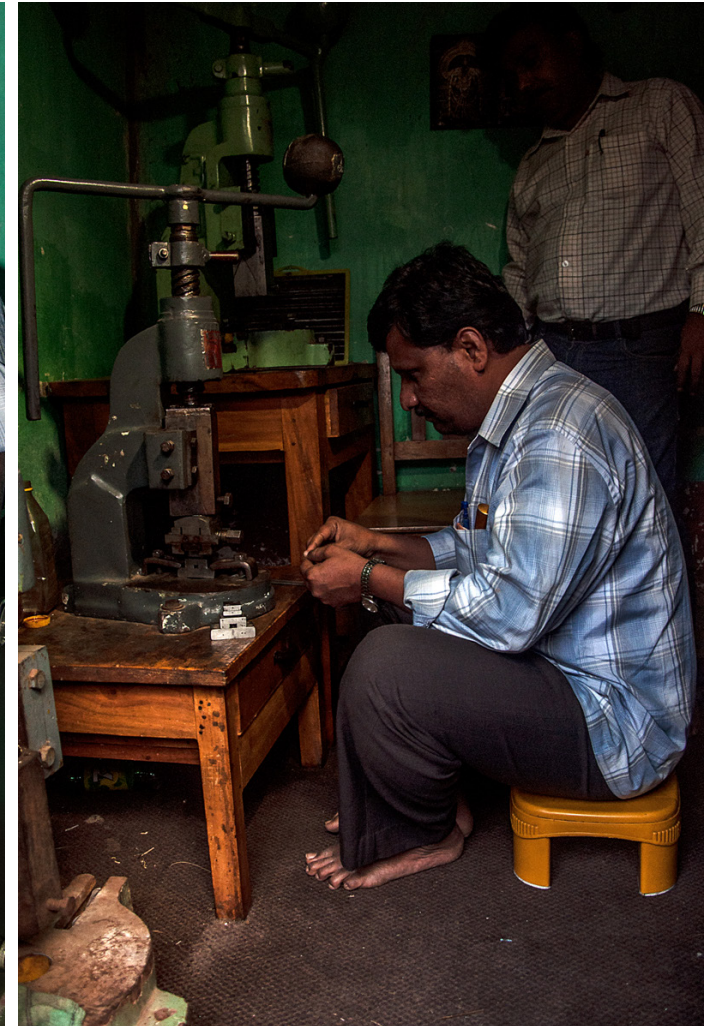
Die machine is used to cut the gold sheet to required shape and form.