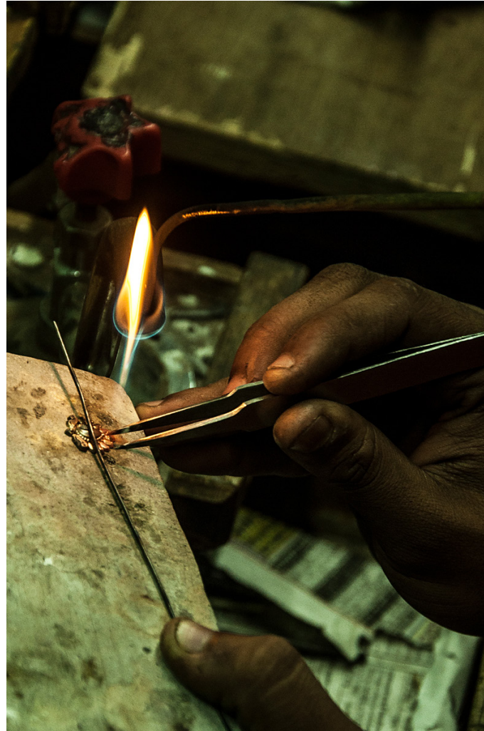
Gas lamp is used to provide heat for soldering process.