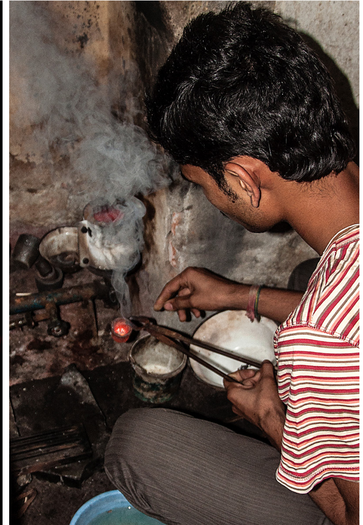
Molten gold is poured in a mould for converting them into thick gold rods.