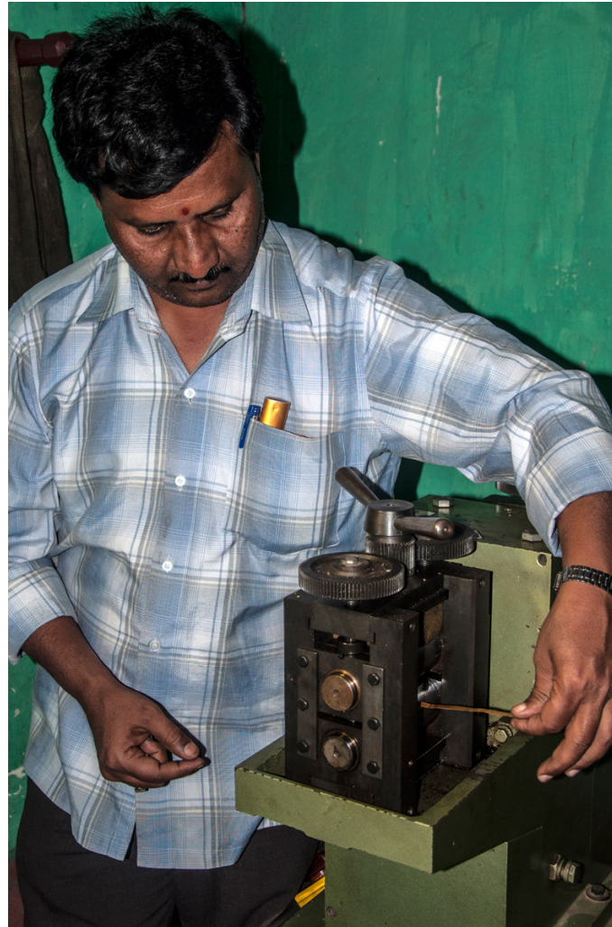
The thick rods are passed through rolling machine to convert them into strips.