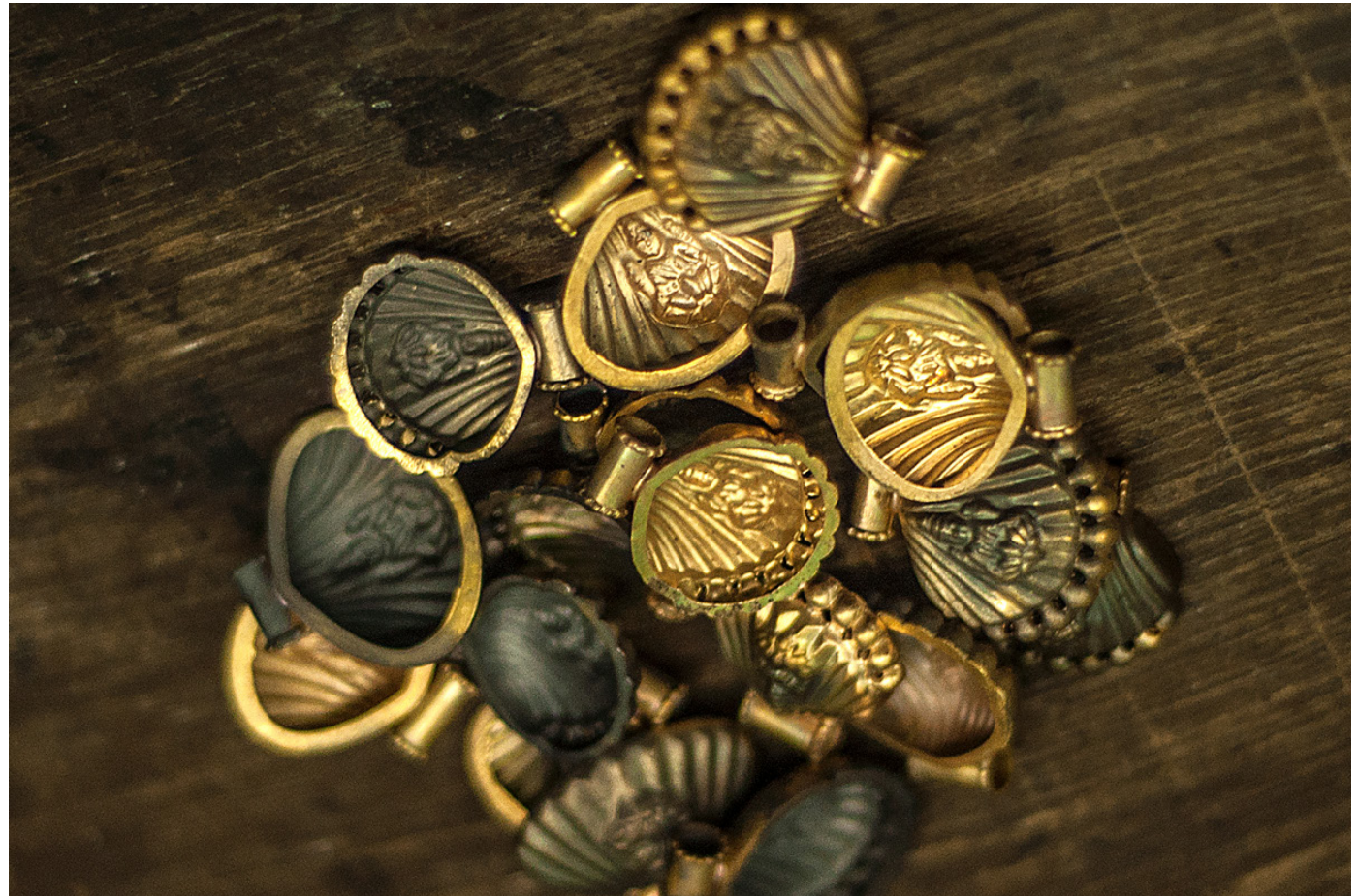
Pendant called as Thali (Mangalsutra) with goddess Lakshmi carved on it.

Marriage and religious functions are major motivation in Indian culture for the use of traditional ornaments. The designs of the jewels are made according to the customers demand and different types of gold ornaments like as Jumki (earrings), bendwali, necklace and rings etc. The ornaments are made both in traditional as well contemporary designs. The products have huge demand in Bagalkot and Belgaum districts and neighboring states as well. The most demanded products are Bendwali, Jumki, Matii, Mangalsutra and rings.