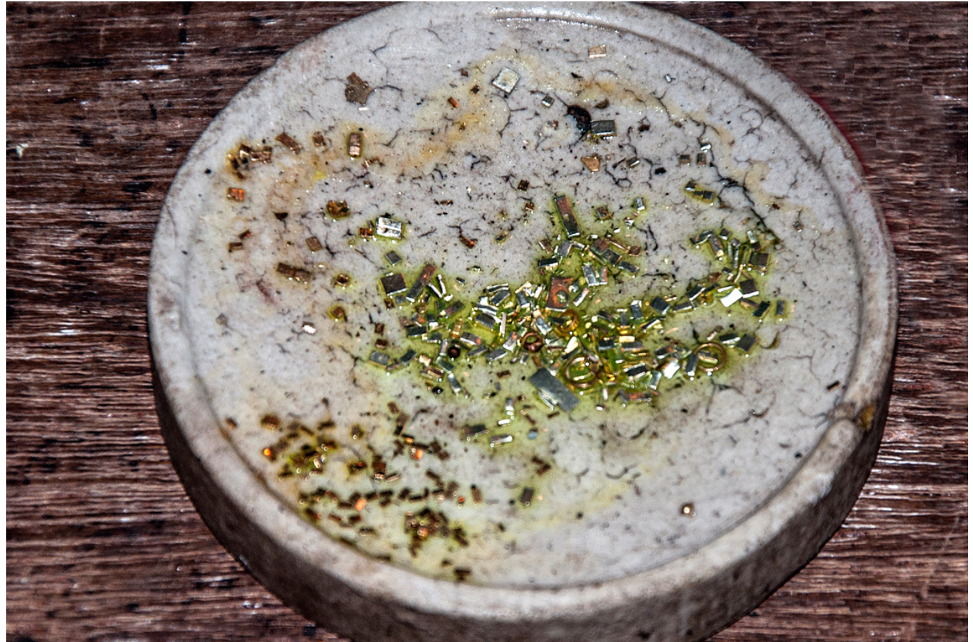
Pieces of silver and bronze are soaked in soldering solution for soldering process.