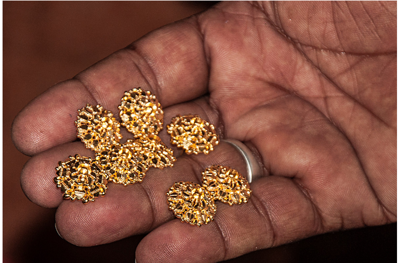
Final product of gold ornaments.