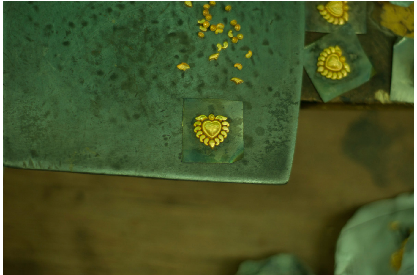
Stunning gold pendants made of heart shape which is covered with an elaboration of swirl design.