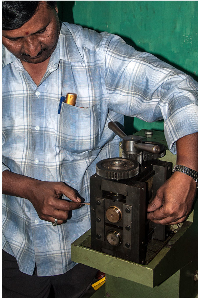
The gold wire is turned into thin sheets by using rolling machine.