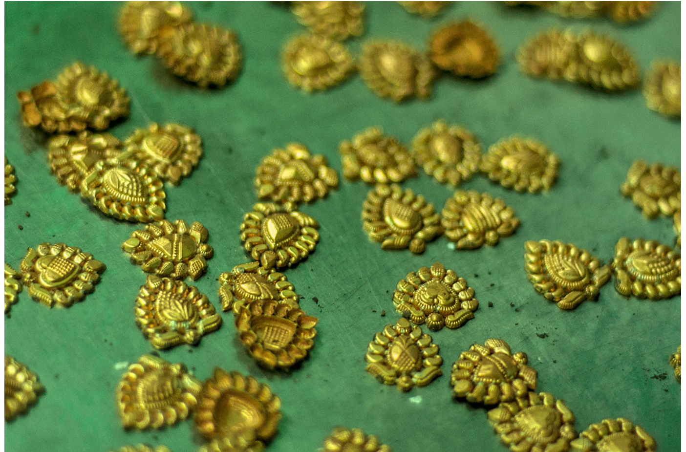
Gold pendants of different designs are made in large number.