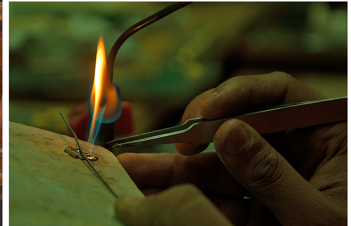
Tweezer is used to hold the gold pieces.