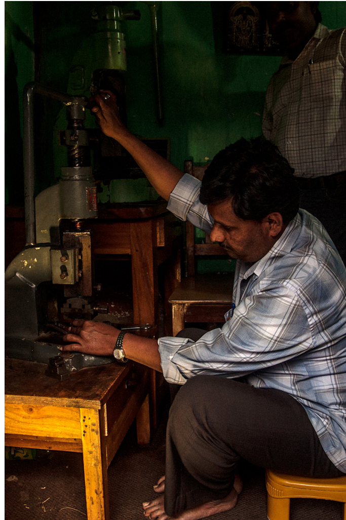
Flattened gold sheet is inserted into die machine to give required design and shape.