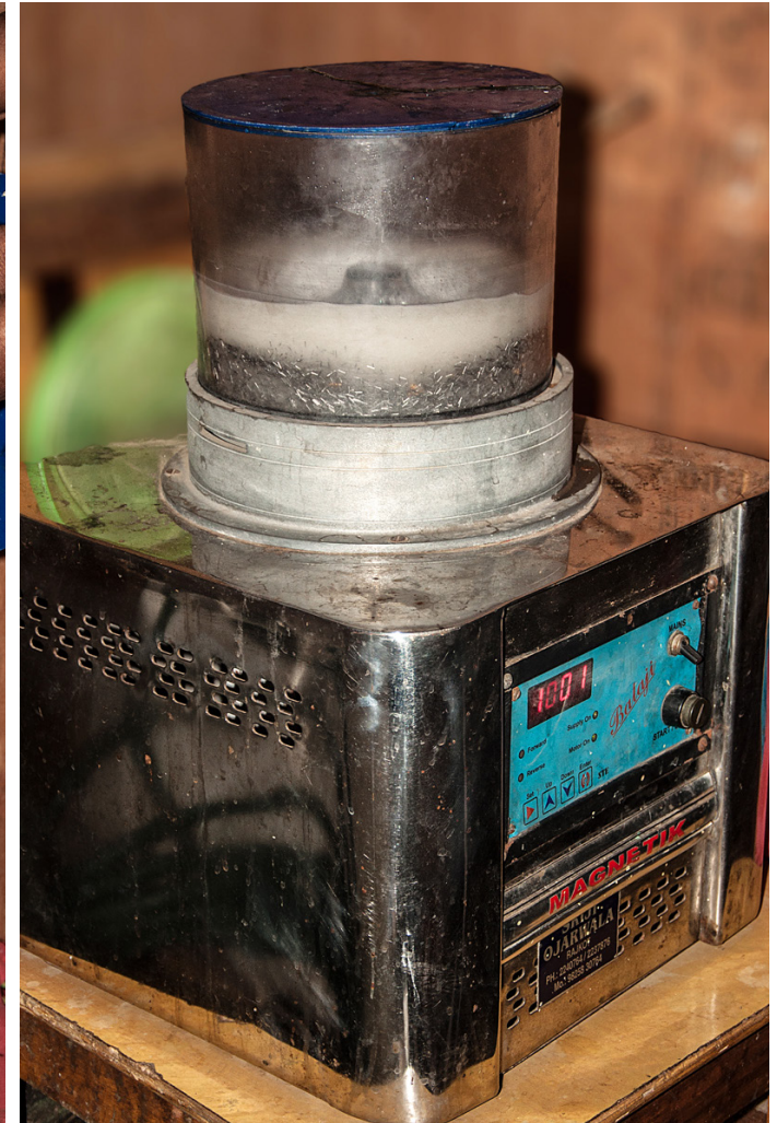
The machine contains of silver pins which rubs with the gold articles that helps to smoothen the rough edges and polish the articles.