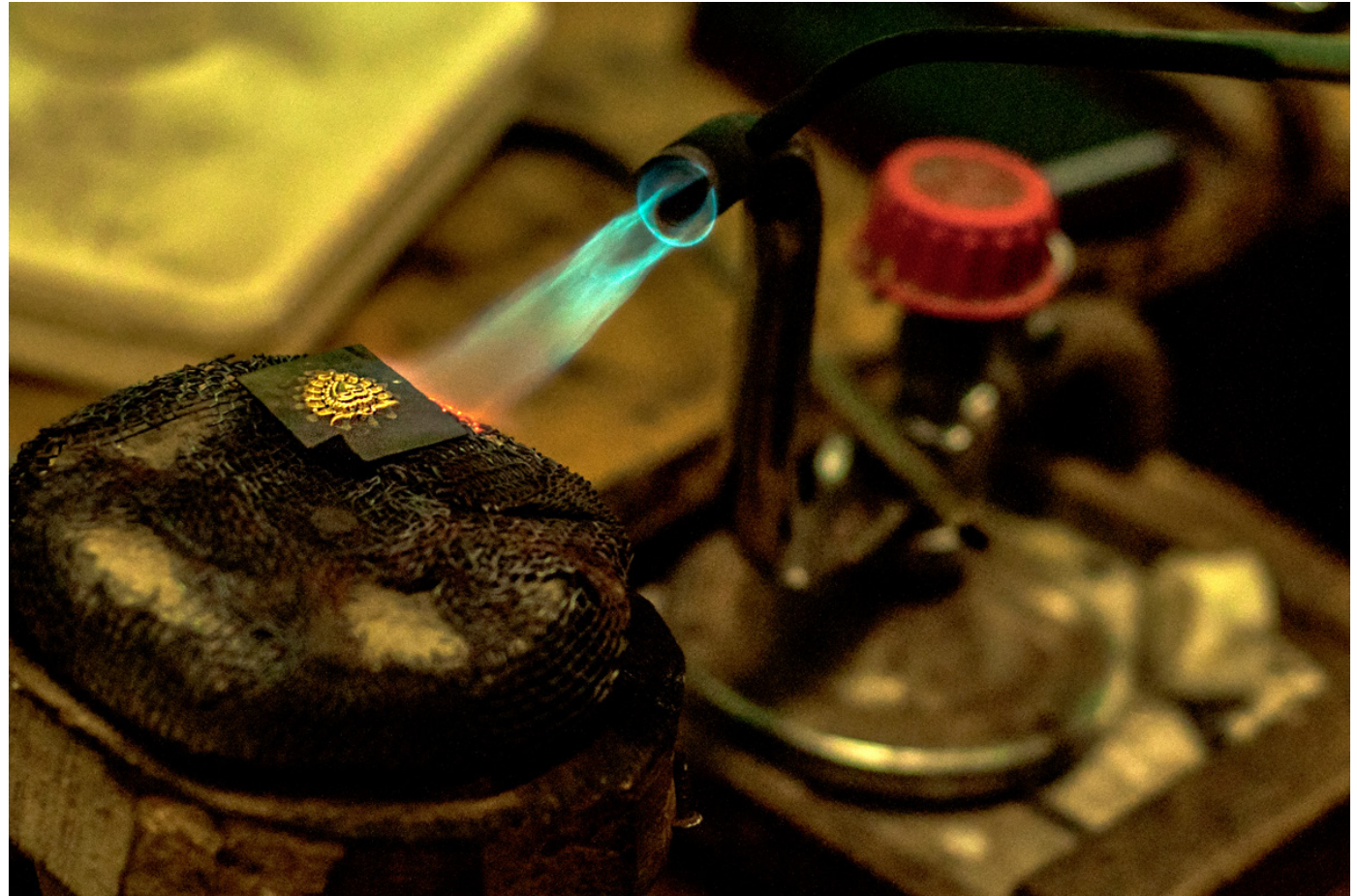
Articles are soldered using flame torch.