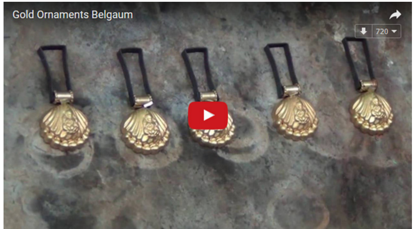
Gold Ornaments – Belgaum