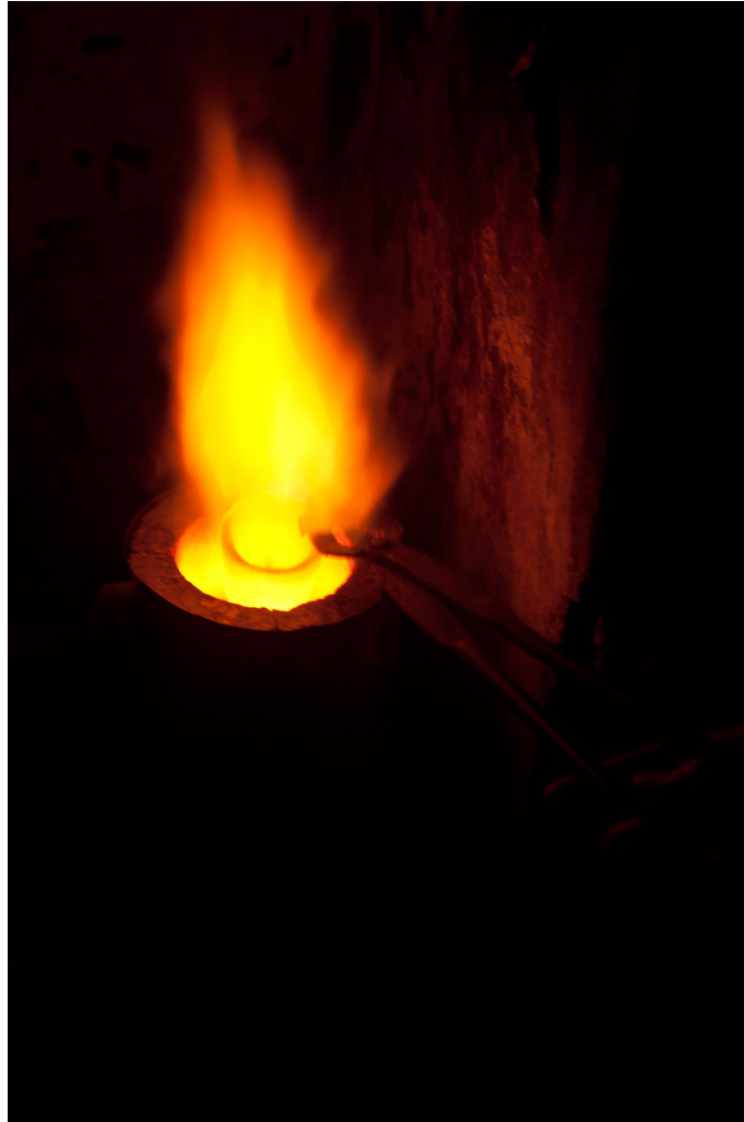
Gold biscuits are heated at high temperature in a crucible .