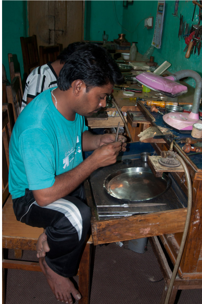
Work environment of the craftsmen involved in gold ornaments making.