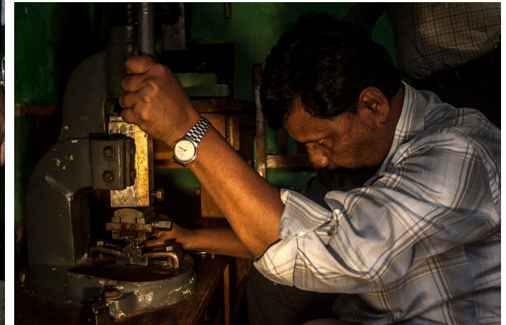
Gold strips are inserted in the dye-pressing machine to cut into required designs.