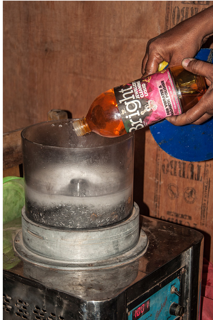
Liquid jewelry cleaner is added in the drum-polishing machine for cleaning and to remove impurities.