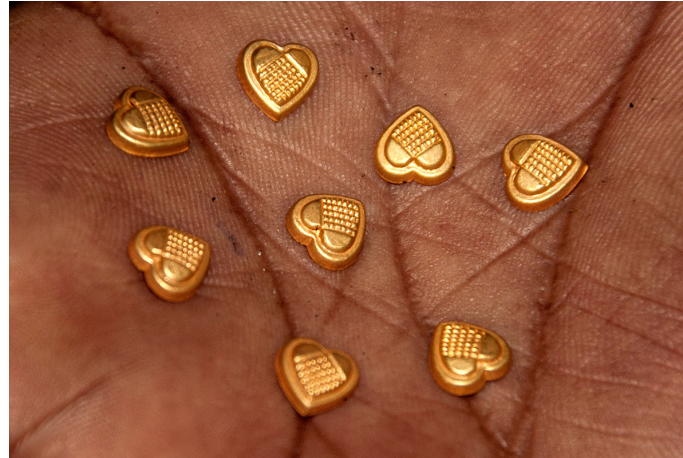
Heart shape pieces cut from the strip.

http://www.dsource.in/resource/gold-ornaments-belgaum/making-process