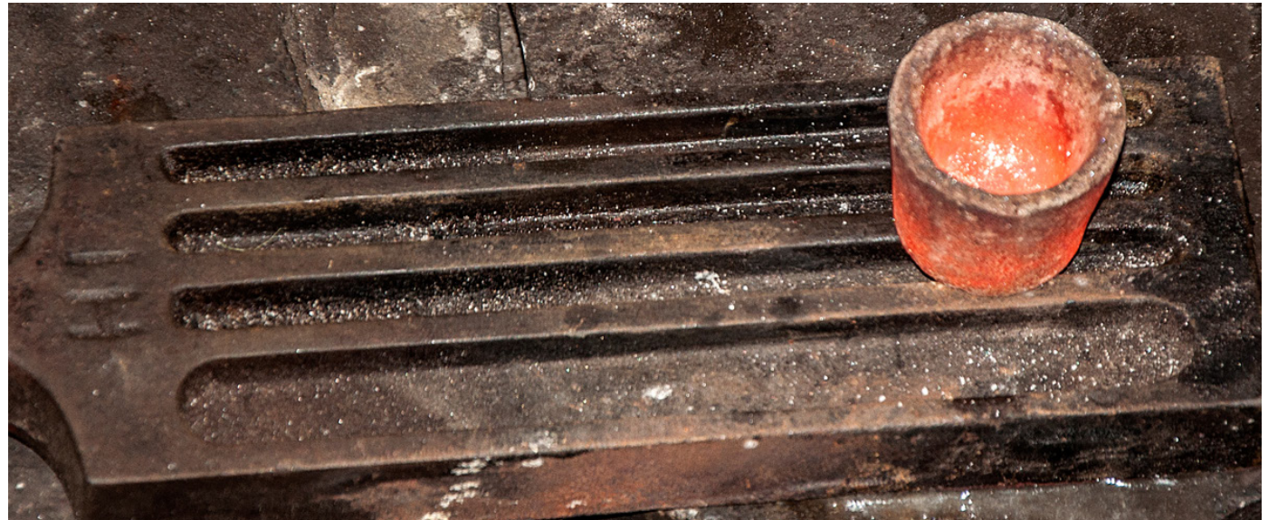
Gold is melted in Crucible and poured in an iron mold to obtain gold rods.