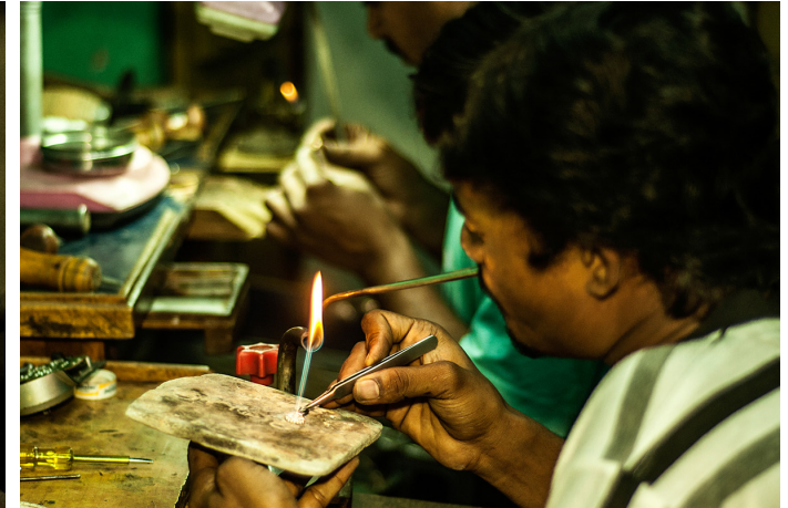
The assembled pieces are soldered together.