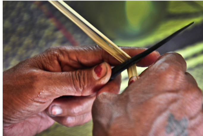
Grass strand is made even with the help of iron awl.

http://www.dsource.in/resource/grass-basketry-sitargang/making-process