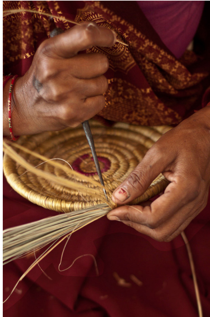
Sharp iron tool is used to pierce for creating gap in the coil.