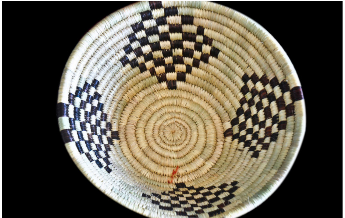
Inner view of basket with geometrical patterns.

Large varieties of all-size baskets are weaved for several uses. Ranges of flat trays are used in the ceremonial occasions to serve.