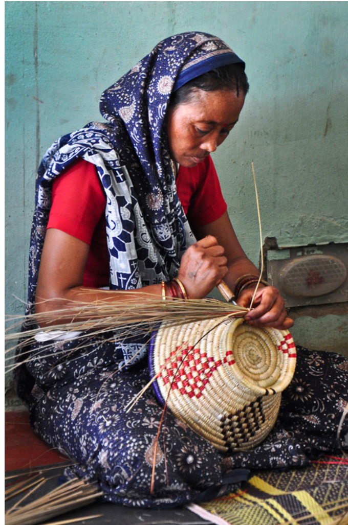
Women engaged in making basket base stand.