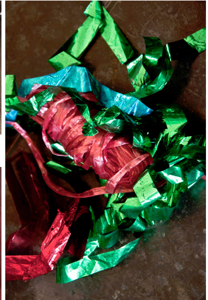
Grass is dried in shade for weaving process.