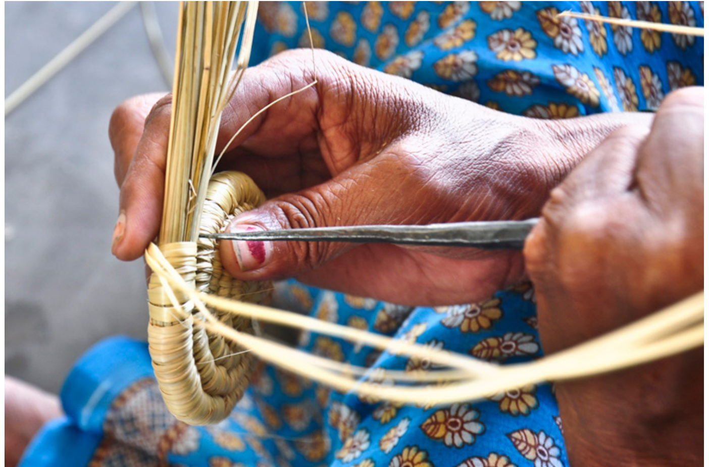
The closer view of winding and coiling.