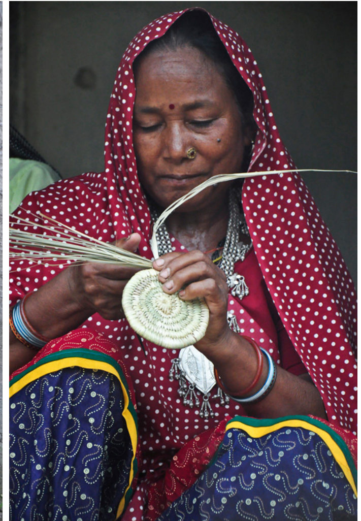
Weaving technique differs as per the product and pattern to be made.