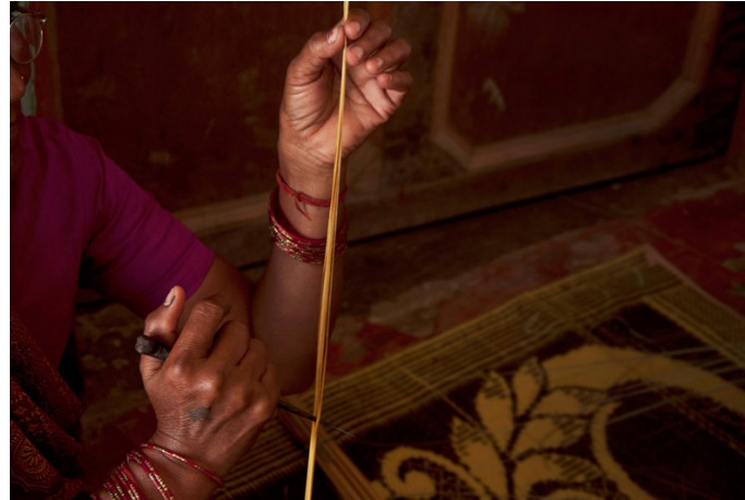
Different types of iron awl used in weaving.

http://www.dsource.in/resource/grass-basketry-sitargang/tools-and-raw-materials