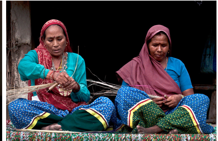
Skilled artisans beautifully create motif patterns by their own imagination while weaving.