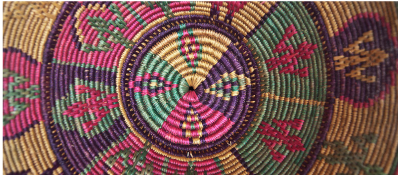
Geometrical motif patterns in striking color combinations.

Different patterns and designs are made according to their traditions practiced. Apart from Sitargang in Uttarakhand, Dehradun and Delhi are the major areas producing these grass baskets.