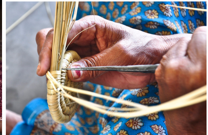
Punja (thick rough grass) is inner stuff; Khaas is the outer covered grass.