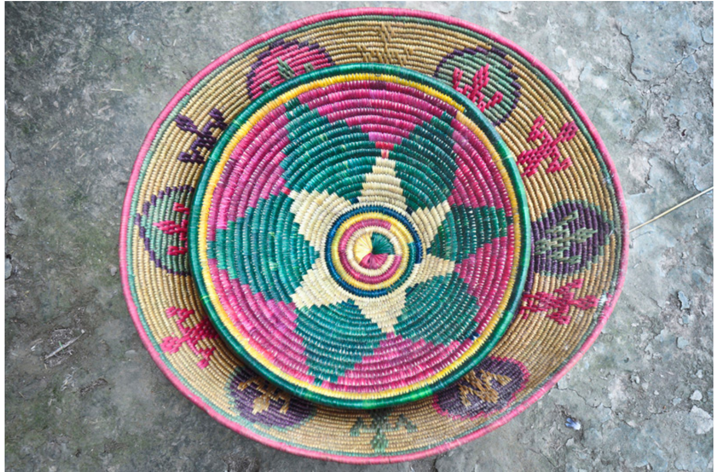
Basket of the similar form with different sizes.