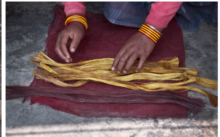
Thin cotton cloth is placed and fiber is arranged.