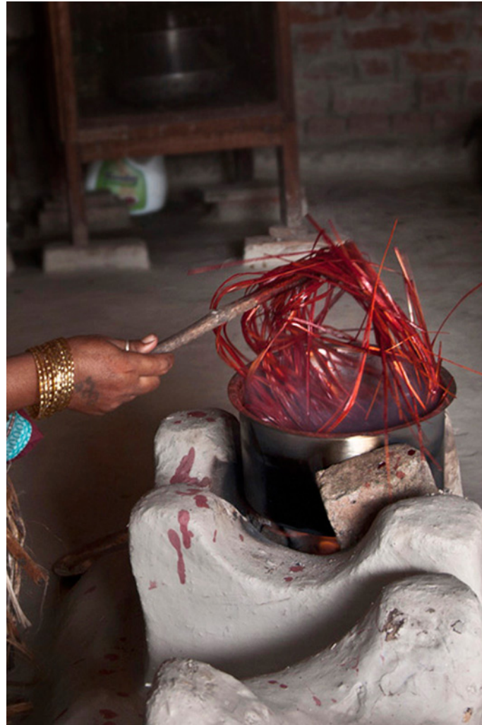
The grass is dipped in color water at high temperature.