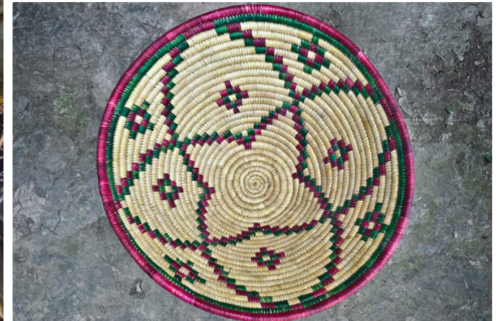
Darker colors stand out over lighter natural color of grass.