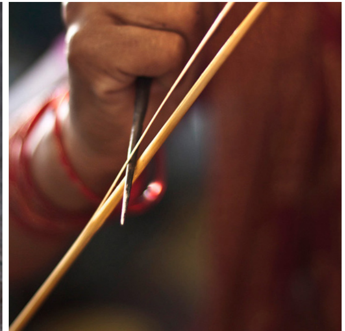
Grass is split into two parts.