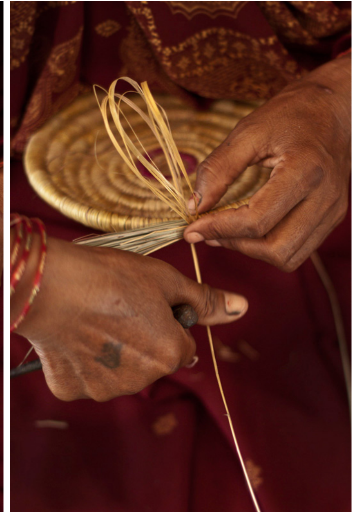
Thick grass strands are passed through the gap created in the coil.