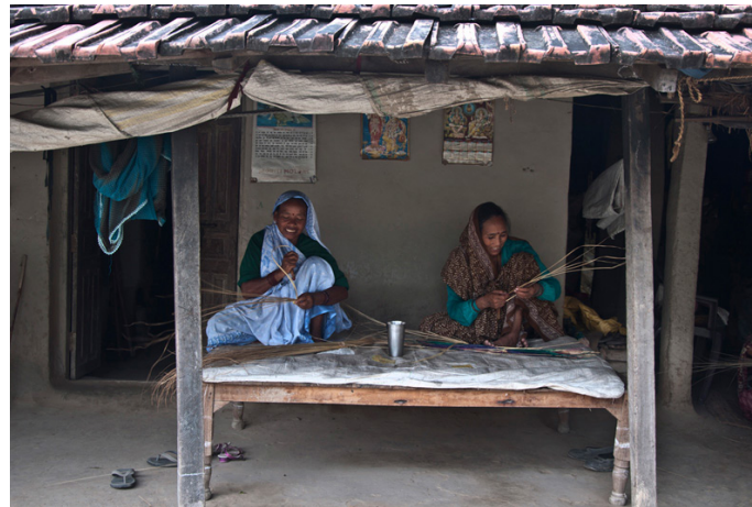
Experienced women and their work environment.

http://www.dsource.in/resource/grass-basketry-sitargang/introduction