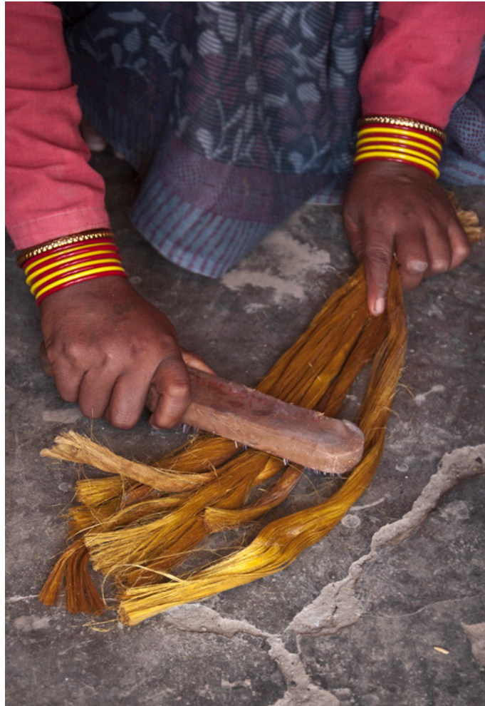
Fiber is brushed to clear knotted threads.

Natural fiber bags are the beautiful creations and best alternatives when compared to other material bags. These bags are made of natural fiber and cloth. De-fibered natural grass is first cut as per the required size and colored. Bunch of fibers are placed on the thin cotton cloth and stitched. Different parts that are required to make bag are prepared separately and then patched together.