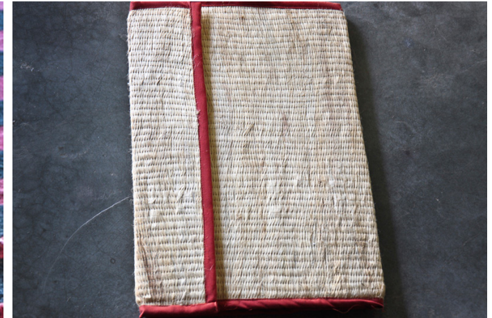
A unique folder made of grass mat.