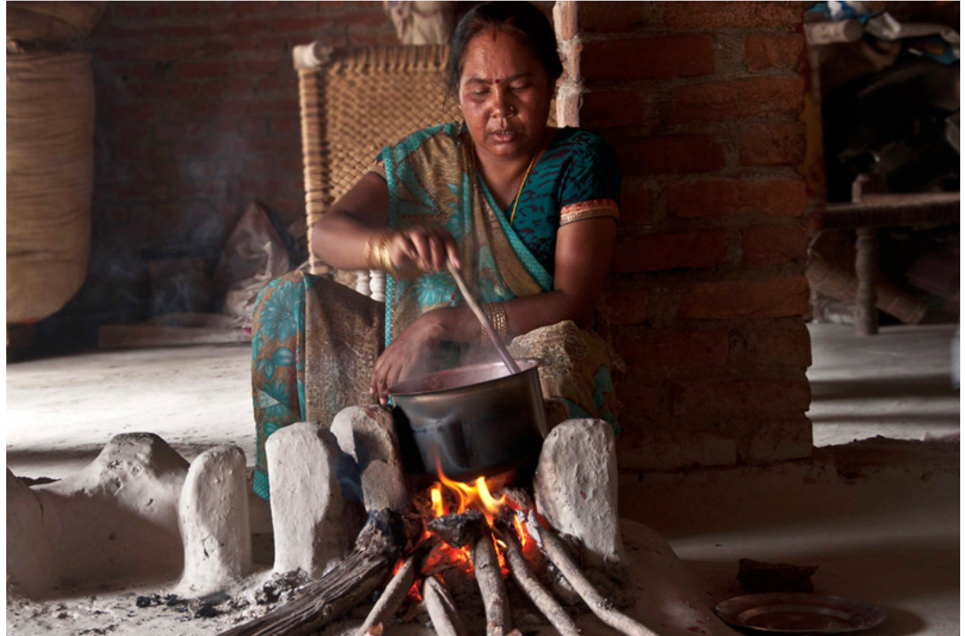
Dyeing process is done in traditional method by using natural fuel.