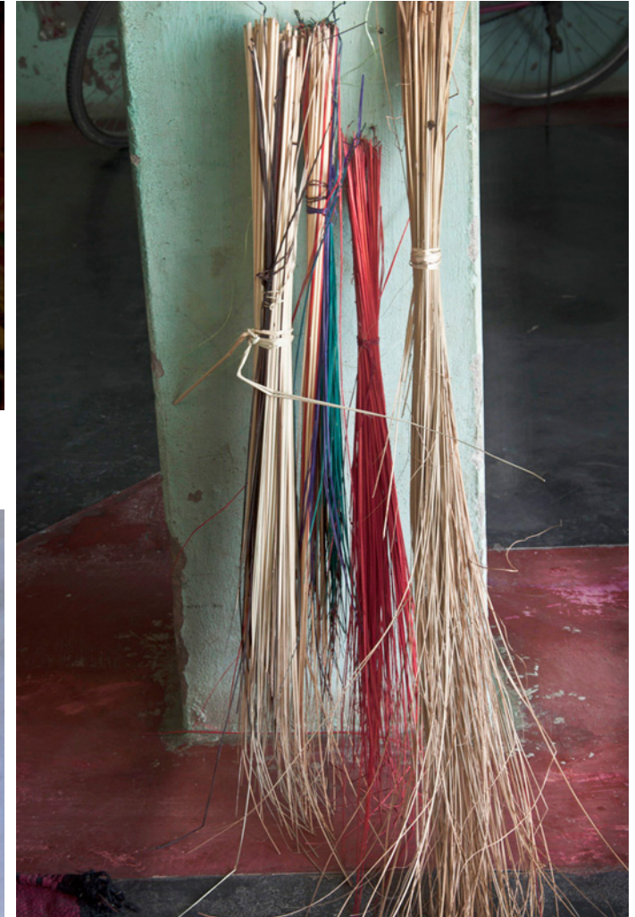
Iron awl helps in splitting grass.