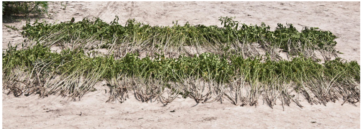
Natural dyed grass in intense color.

Dye Colors: The artificial raw color powder which is available in local markets is used to color the grass.