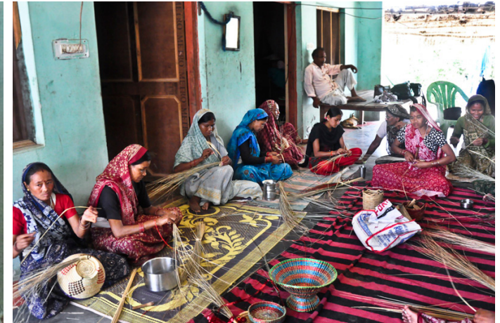
Grass basketry is majorly done by women folk.