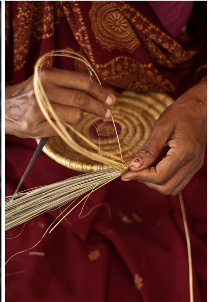
Thickness of the coils depends on number of grass strands taken while winding.