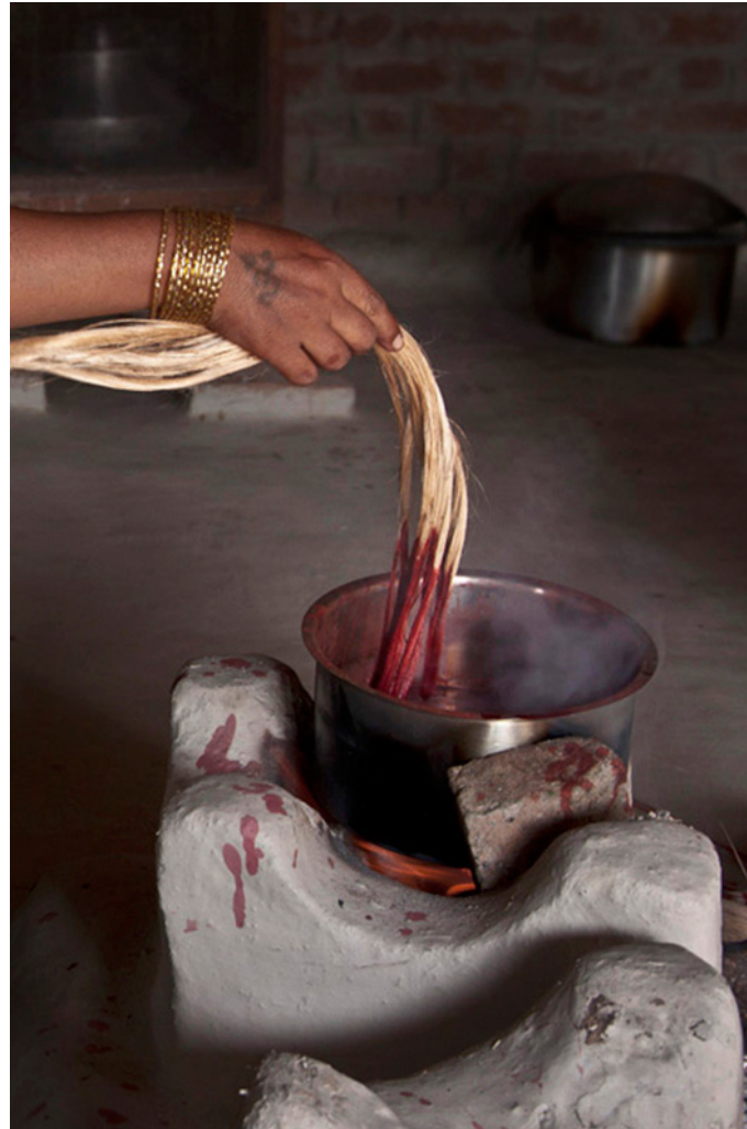
This is natural fiber used in making hand bags, dyed in required colors.