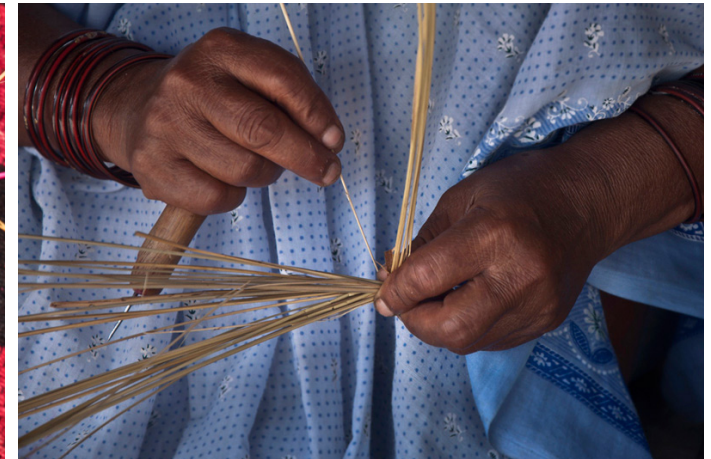
Punja (local language) is a grass used for inner stuffing.