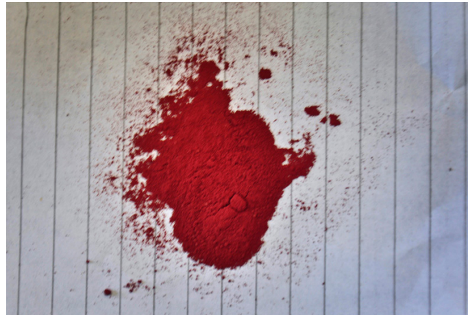
Colored powder used for dyeing.