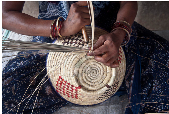
Adding extra coil makes the base stand.