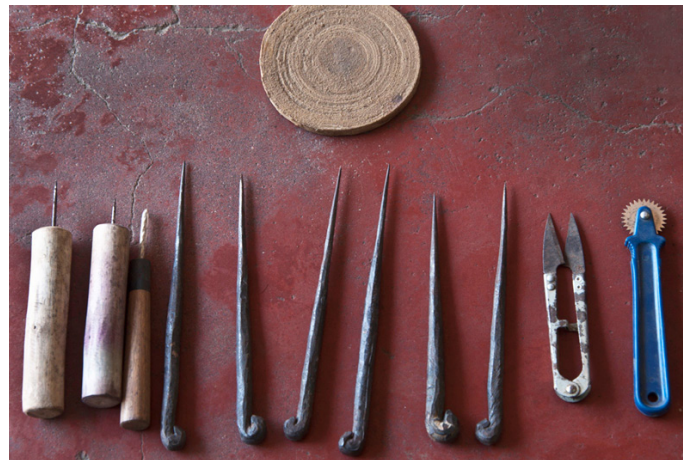
Colored plastic strips to embellish designs.