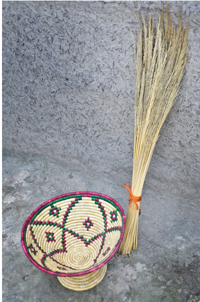
Grass is beautifully turned into attractive storing object.