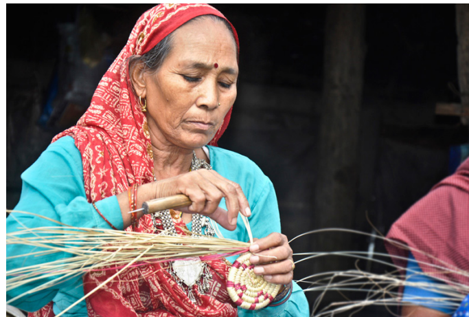
Minimum tools used in basket making process.