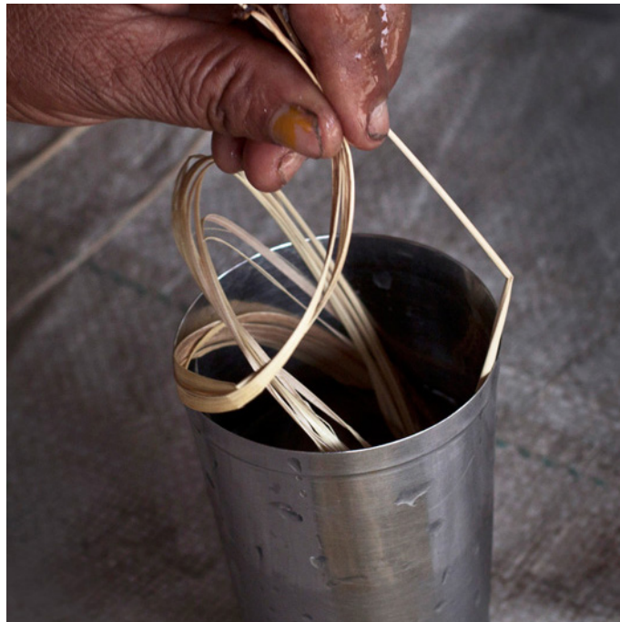
Dry grass is dipped in water to make it soft.