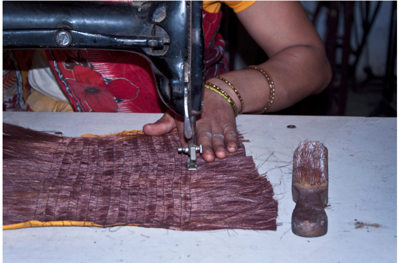
Stitches are made at equal length.