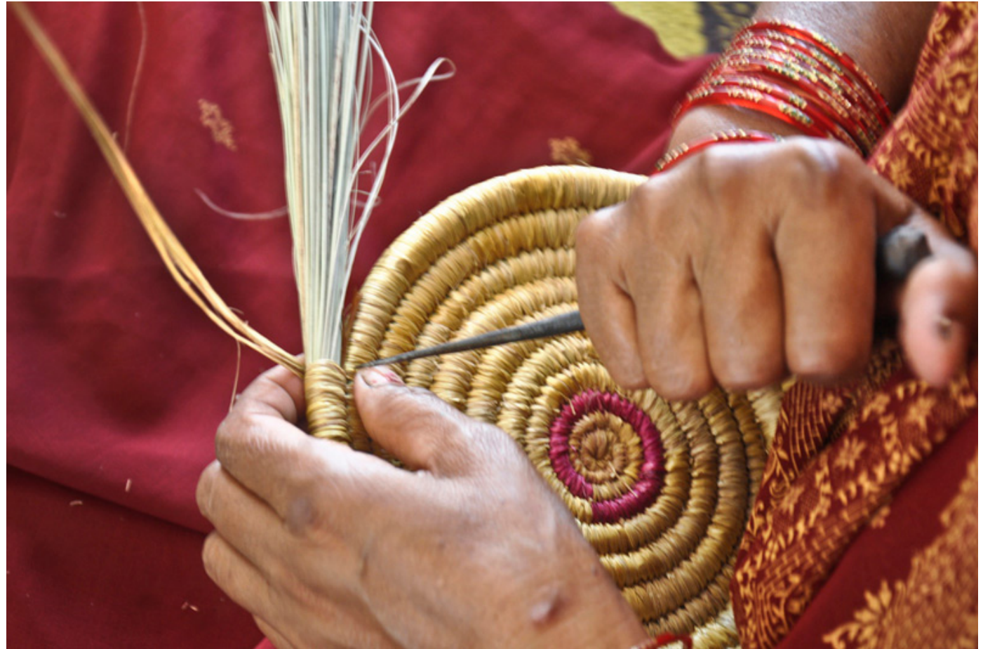
Coiling process continued until the required length is obtained.