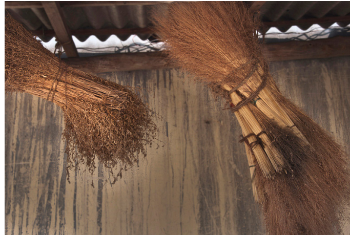
Grasses grown in the grounds which is available in plenty.

http://www.dsource.in/resource/grass-basketry-sitargang/tools-and-raw-materials