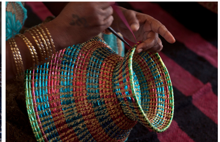
Multi colored basket with stand.