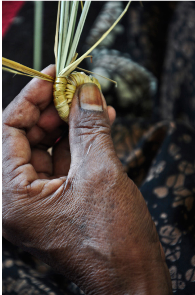
Khaas is lighter grass used to cover punja grass by winding.