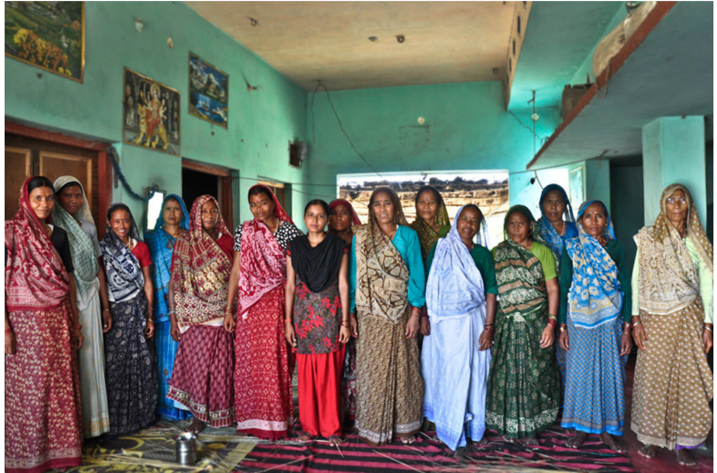
Group of artisans work together to create innovative design products.