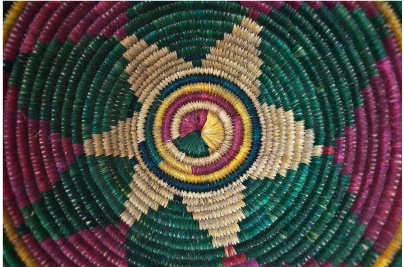
Floral motifs in geometrical patterns.