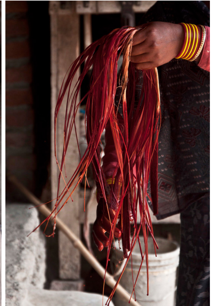
Dyed color grass is then kept for drying in shade.