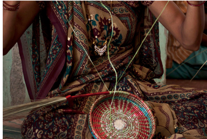
Color grass and plastic strips are added in between to create design pattern.

http://www.dsource.in/resource/grass-basketry-sitargang/making-process