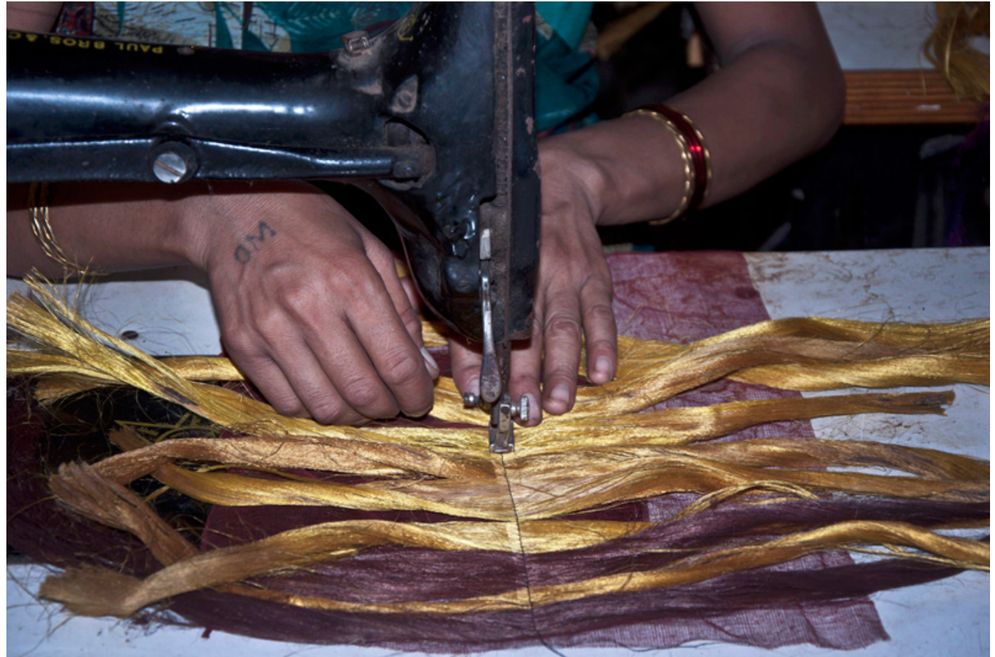
An initial stitch to fix the fiber with base cloth.