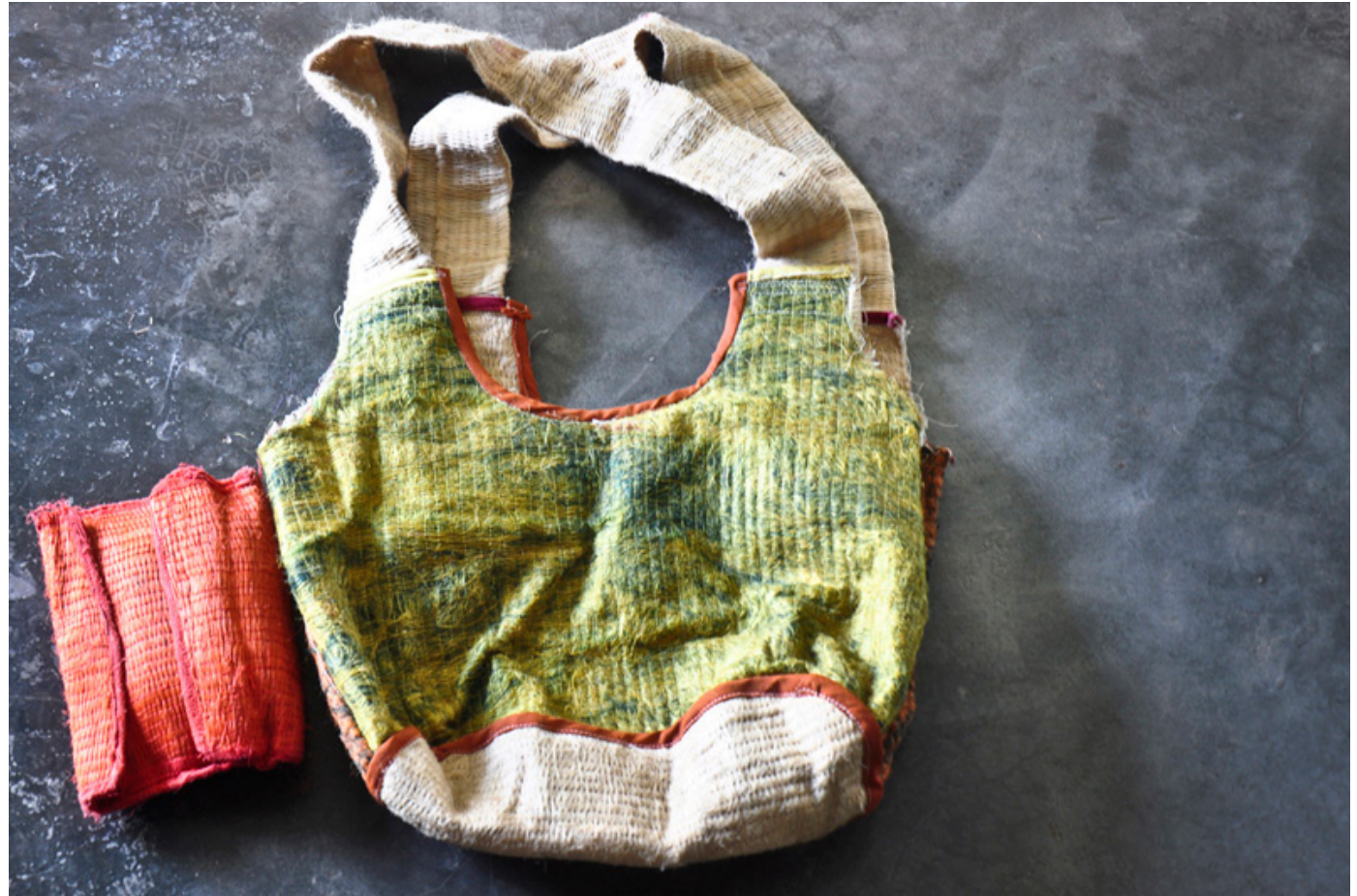
Bags made of natural fiber.