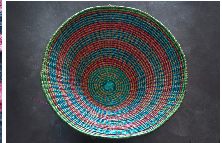
Circular design pattern is created with two combination colors.