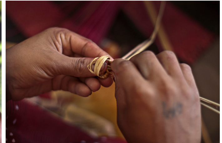
The grass is knotted to make base of the basket.