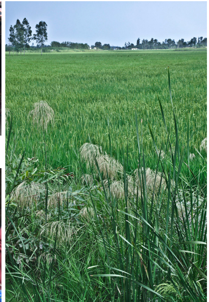
Species of wild grass fibers grow abundantly near rice fields.