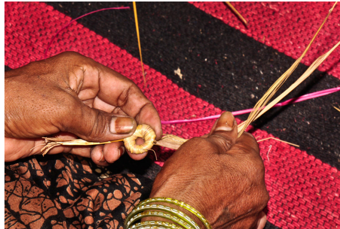
The grass strands is stretched tightly to make base strong.