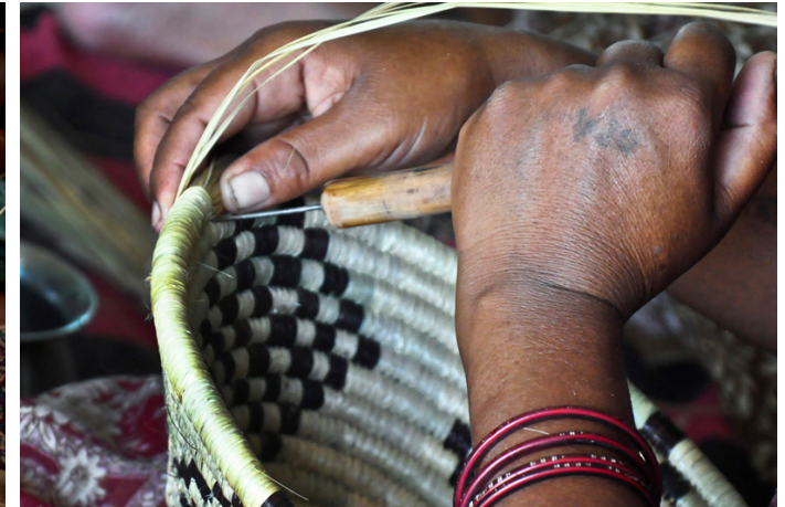
The weaving is stopped and edge point is interlocked.