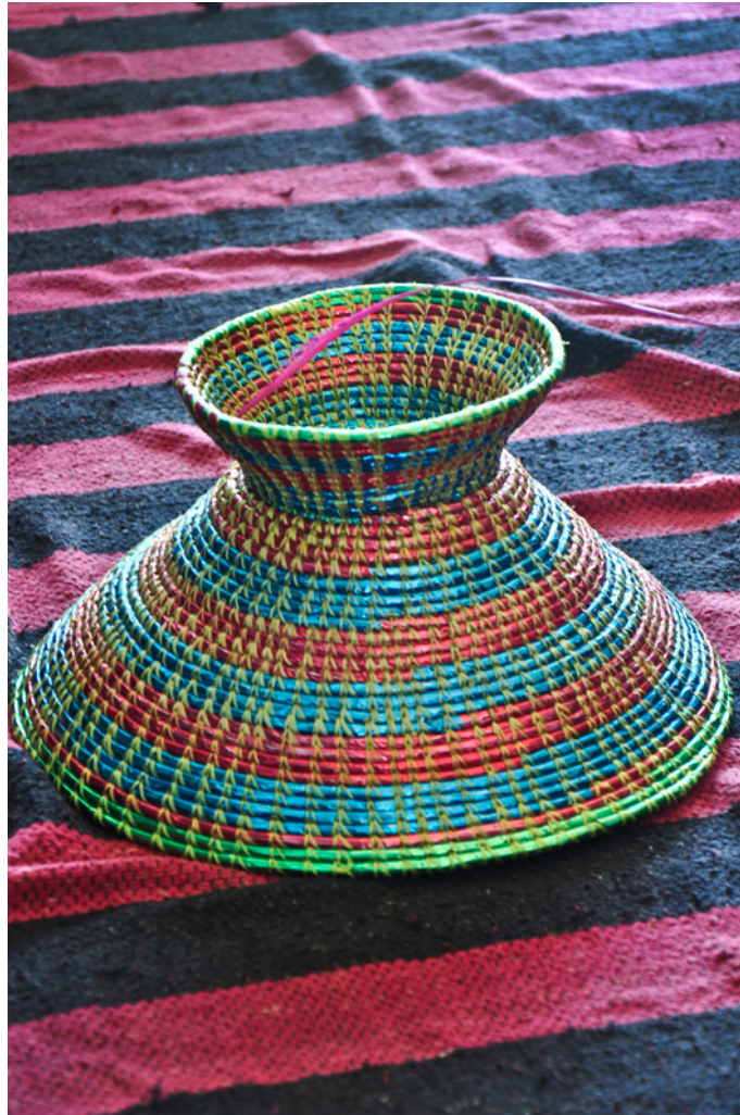
Multi colored basket with base stand.