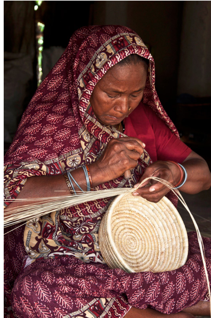
A basic plain basket weaving is being done by uncolored grass.

http://www.dsource.in/resource/grass-basketry-sitargang/introduction