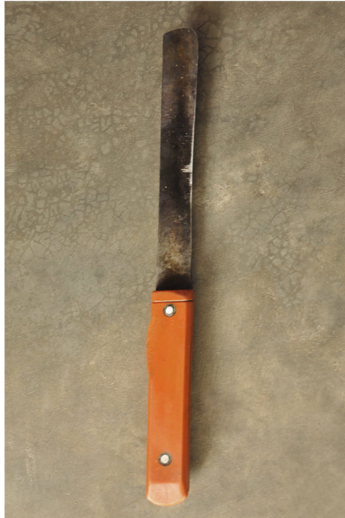
Knife used to cut sisal fiber.