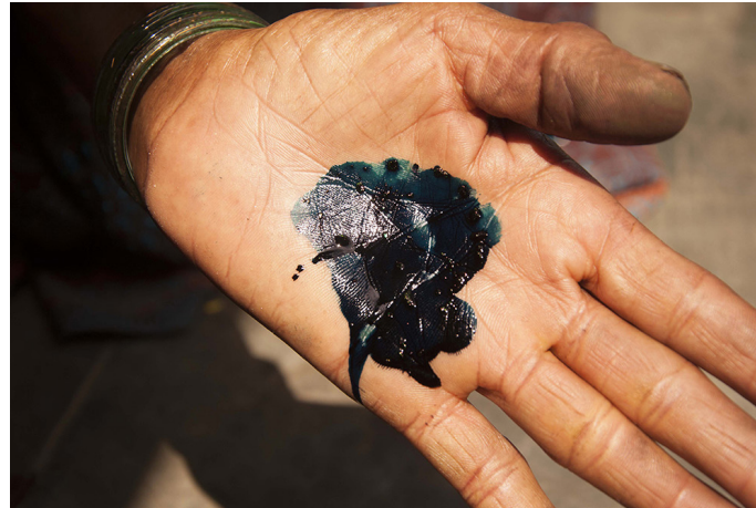
Color mixed with water to dye the Kora Grass.

http://www.dsource.in/resource/kora-grass-mat-weaving-handloom-vellore/tools-and-raw-materials