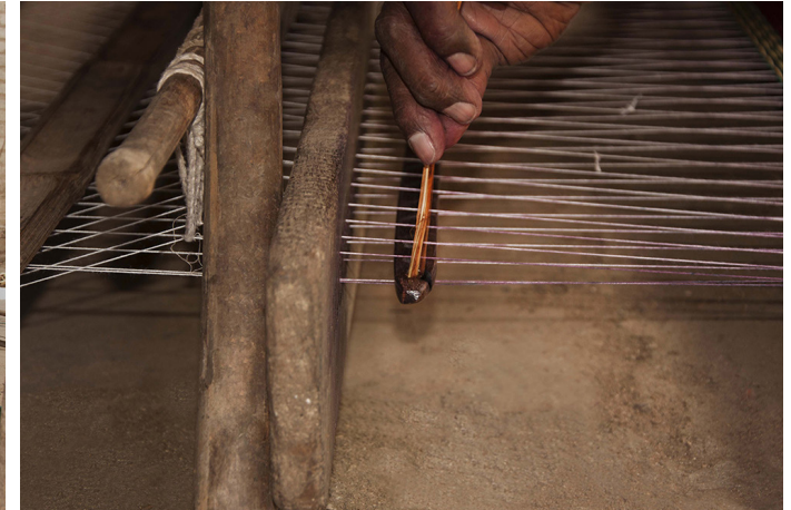
Inserting the Kora Grass to the hole in the shuttle.