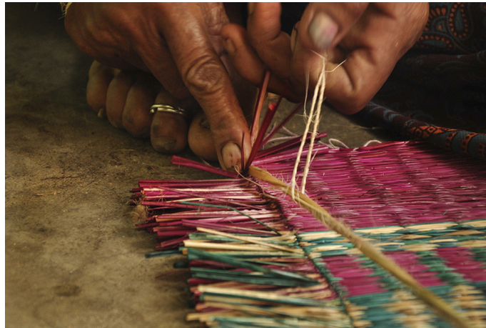
The mat's edges are tied to give a finished look.