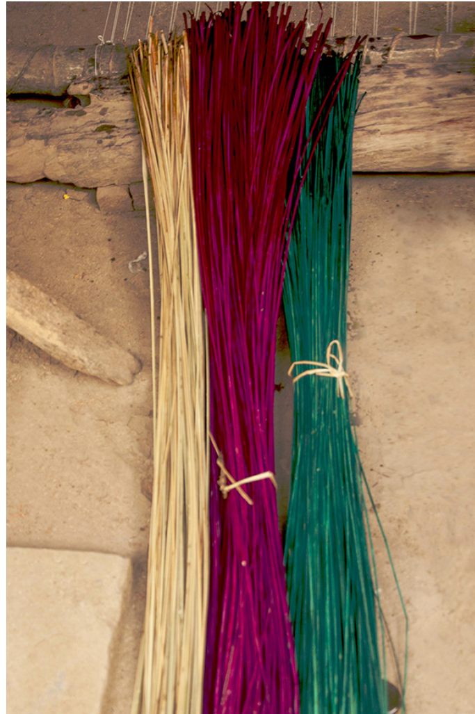
Plain and dyed Kora Grass in pink and green colors.