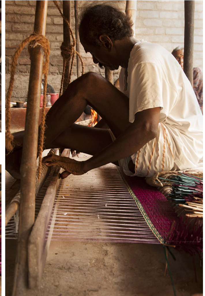
Artisan weaving the Kora grass mat.