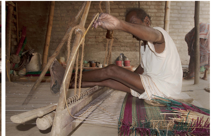
The Kora Grass is passed across the threads.