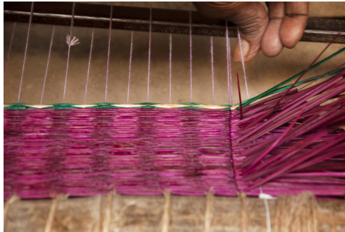
The Kora grass mat getting weaved.