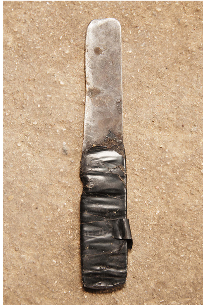
Custom made knife used to cut threads.