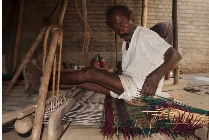
Artisan picking up a Kora Grass to begin the weaving.