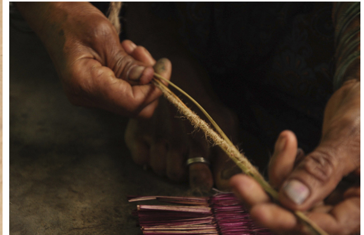
Kora grass and Sisal fiber put together to stitch along the edges.