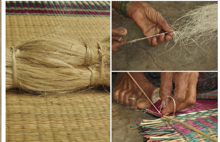
Extracted sisal fiber, rolled to threads and stitched at the edges of the mat.