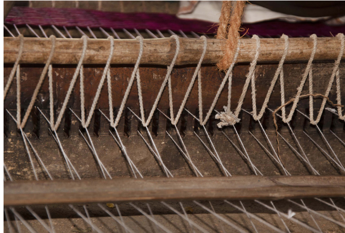
The cotton threads segregated to start the weaving.