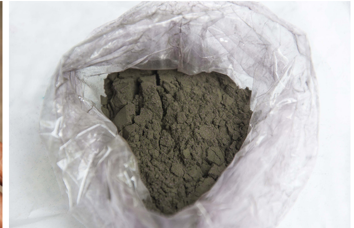
The dye in powder form before mixing it with water.