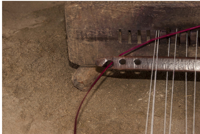
The holes in the wooden shuttle where the Kora Grass is passed.