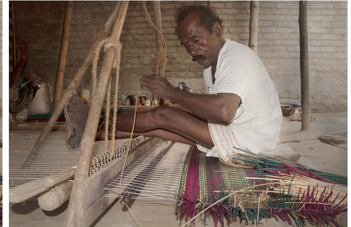
Artisan putting a Kora Grass into the hole in the shuttle.