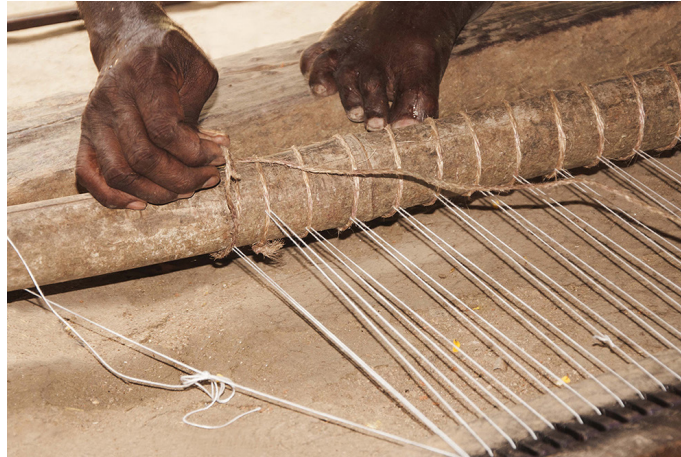
Artisan tightening the pull of threads.