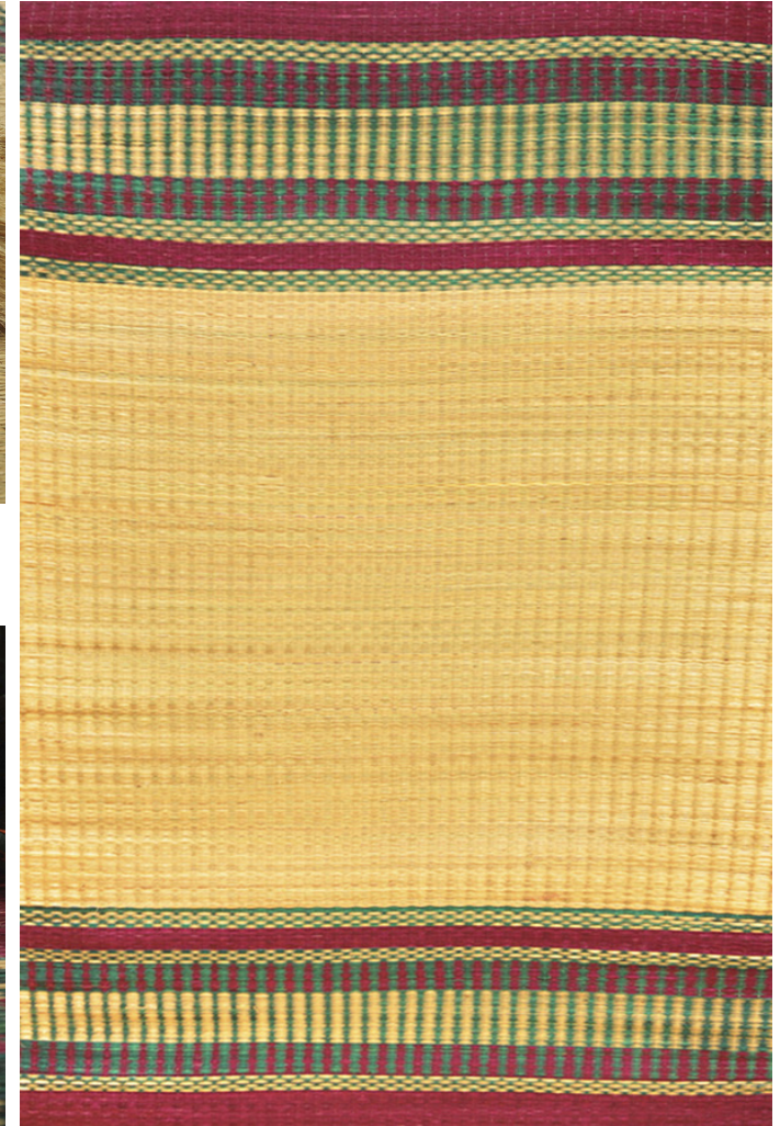
The Kora Grass mat weaving is completed.