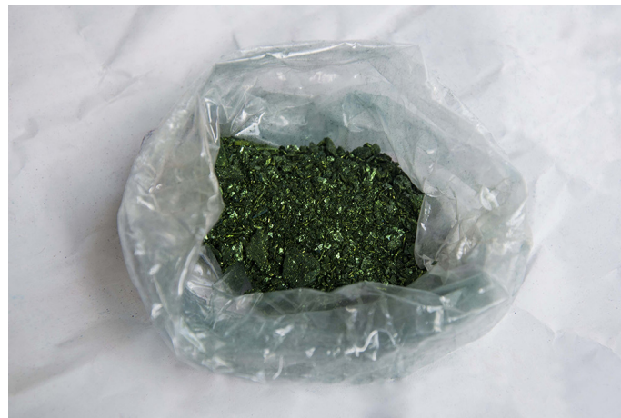
The green dye in powder form.