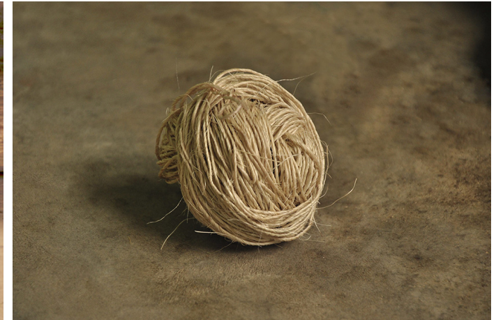
A ball of sisal fiber thread.