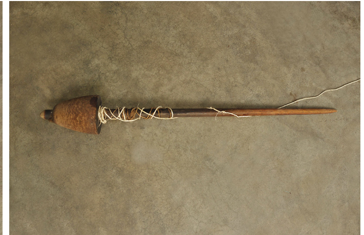
Spindle used in rolling sisal fiber.