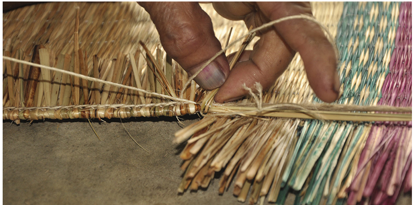
The folding of Kora Grass at the sides and stitching with sisal fiber to give a finished look.