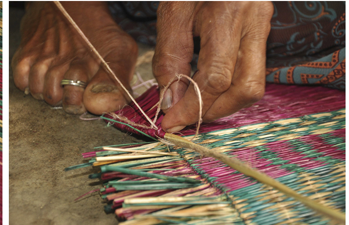
Kora Grass and sisal fiber are placed at the sides of the mat, the Kora Grass are folded and stitched with sisal fiber.