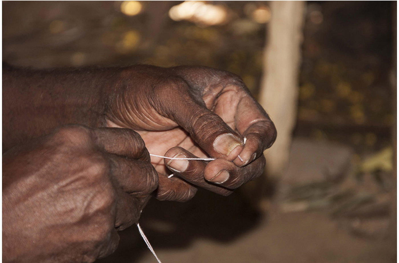
Tying new thread to the previous thread attached to the loom.