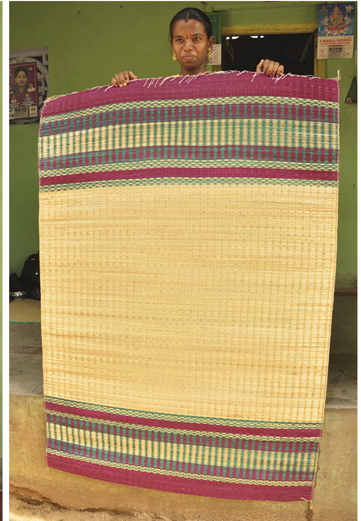
The Kora Grass mat held to display the complete mat.