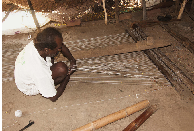
Artisan pulls the threads to exceed its length.