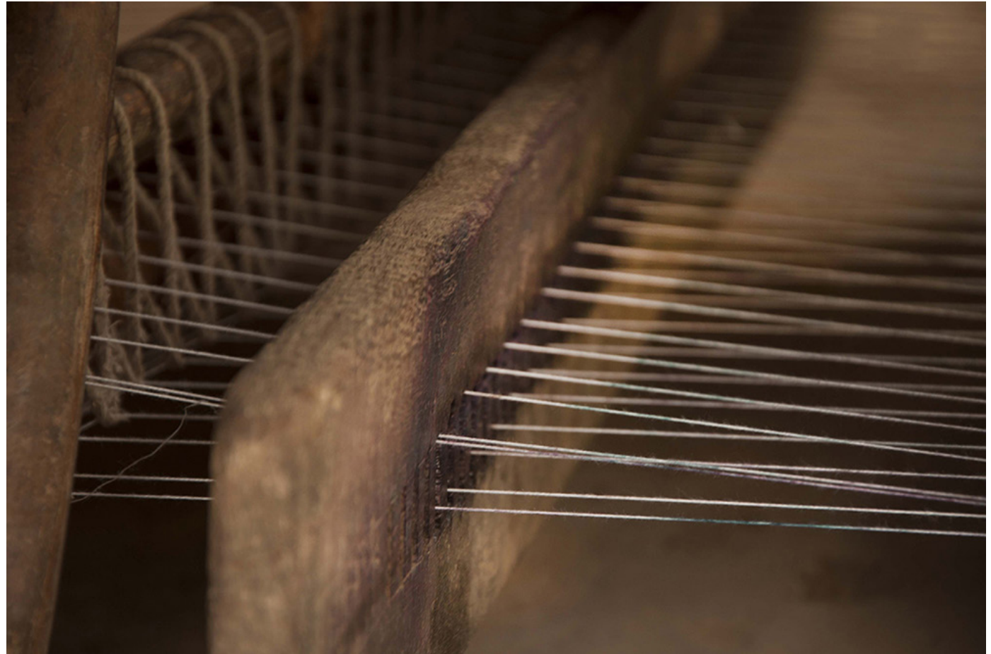
Each yarn passed through reeds.