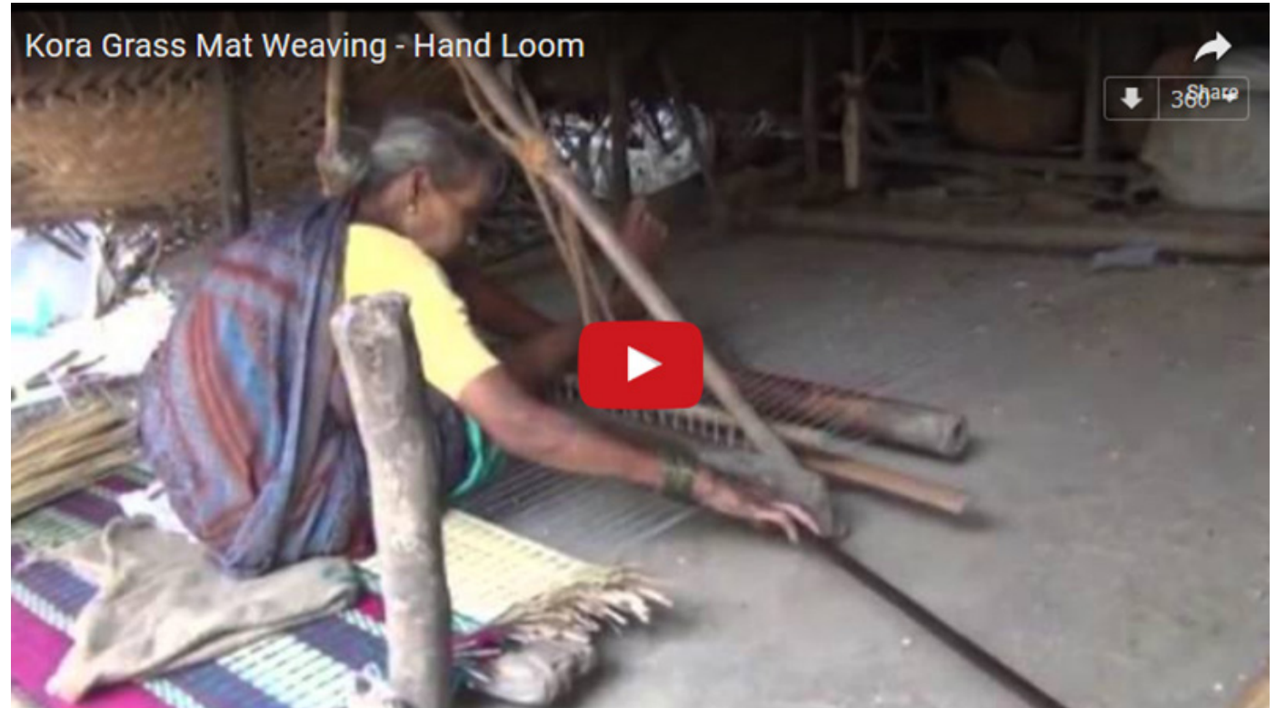
Kora Grass Mat Weaving - Hand Loom