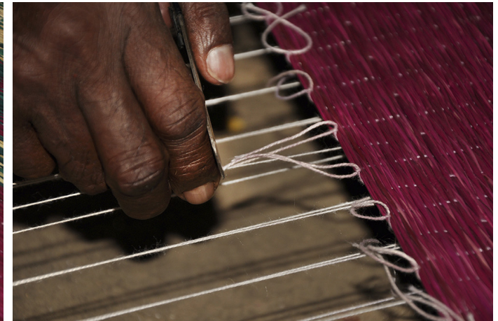
Artisan cutting the threads after knotting.