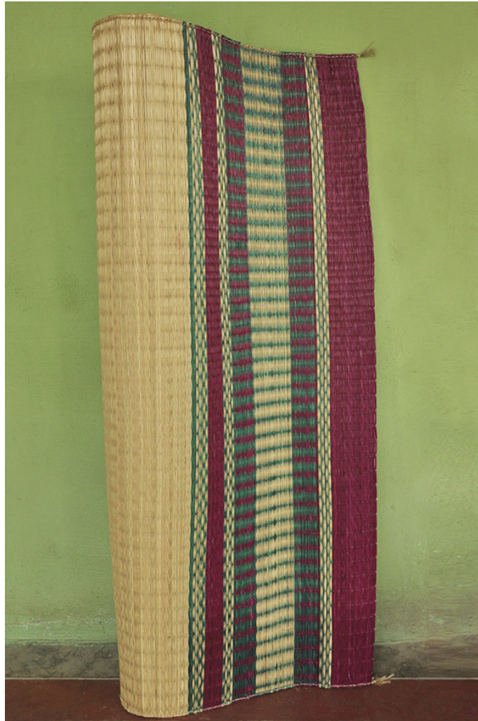
The finished Kora Grass mat.