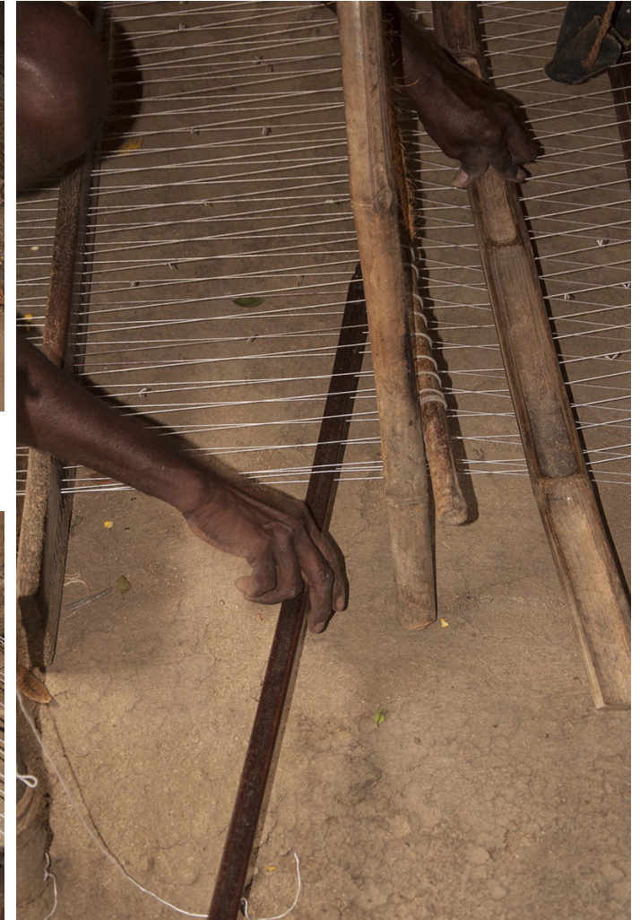
Wooden shuttle is passed across the threads.