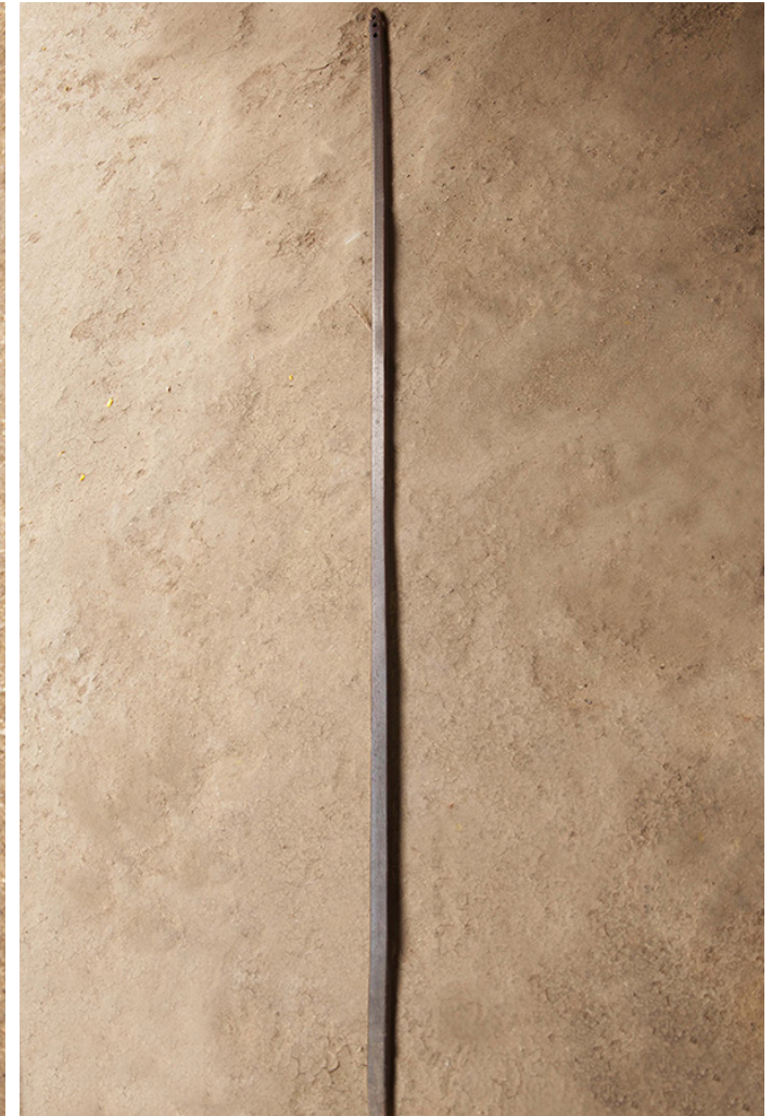
Wooden shuttle with holes to pull the Kora grass.