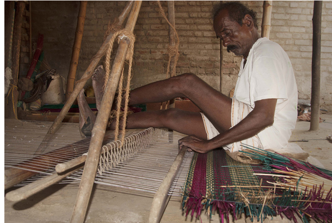
The reed is pulled to tighten the Kora Grass mat.

http://www.dsource.in/resource/kora-grass-mat-weaving-handloom-vellore/making-process