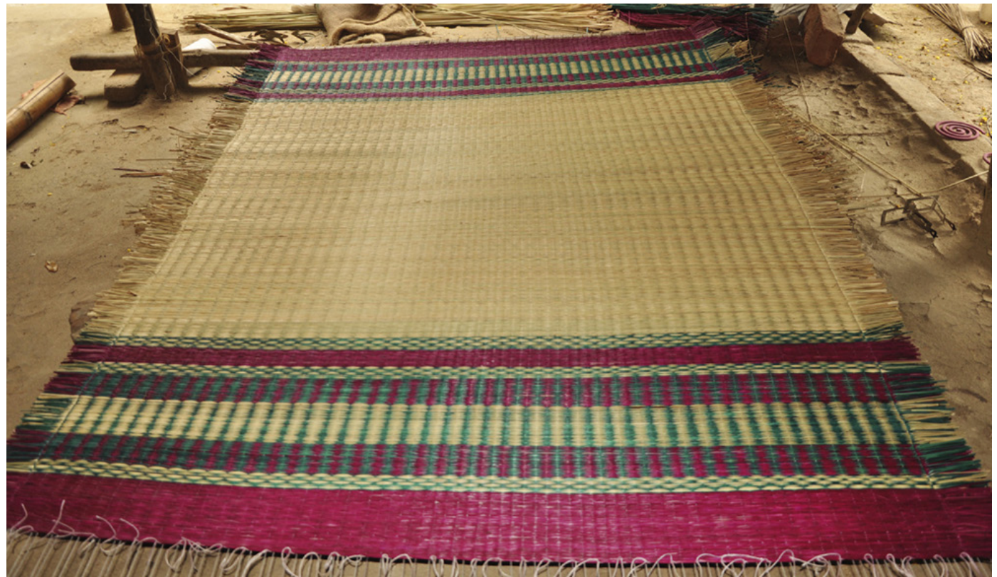
The finished Kora Grass mat with its sides yet to be cut.