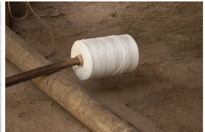
A roll of cotton thread used in weaving.