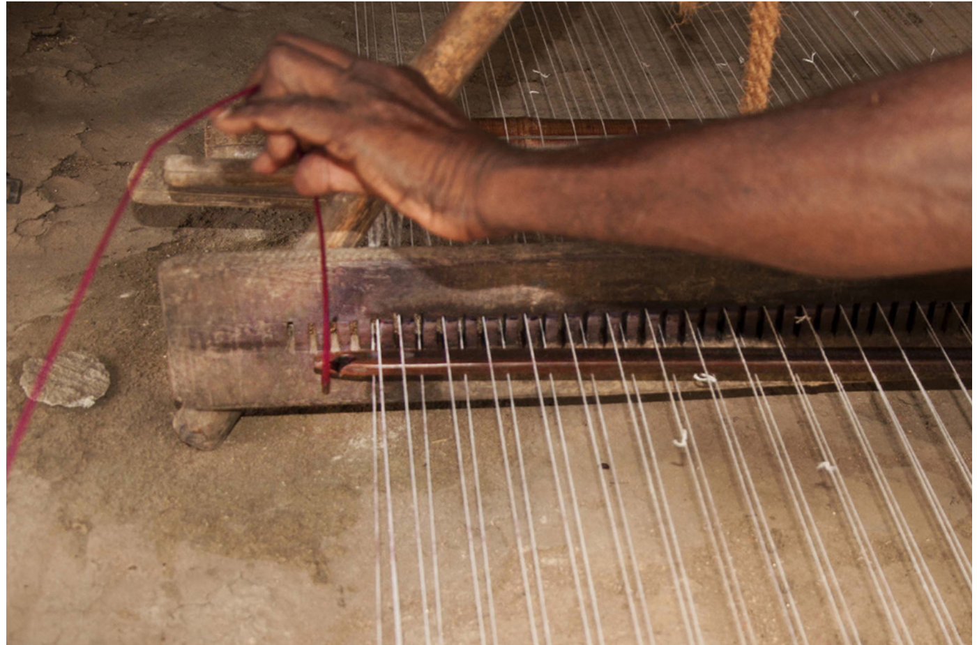
Placing a Kora grass into the hole in the shuttle.