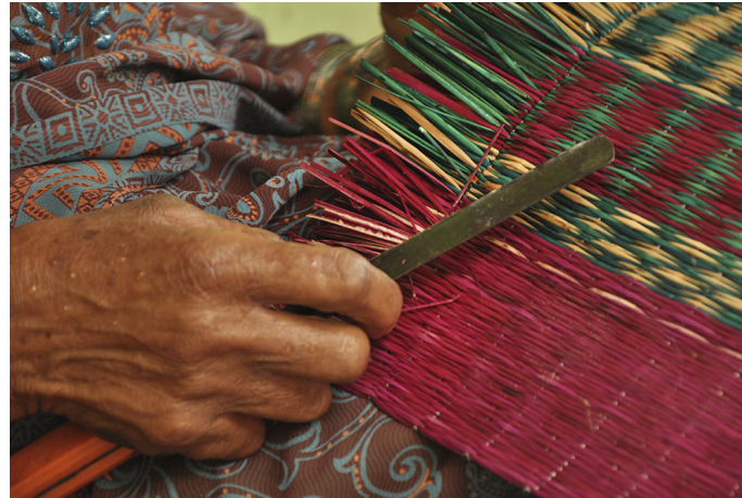
The sides' Kora Grass is ripped with the help of knife.

http://www.dsource.in/resource/kora-grass-mat-weaving-handloom-vellore/making-process