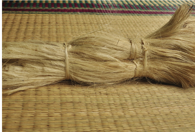
Sisal fibre extracted from Agave Sisalana.