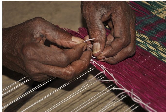
Knotting the threads at the end of the mat.