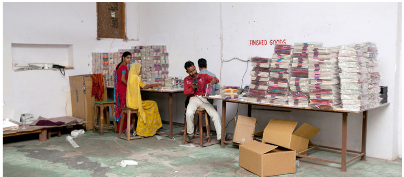
Packaging area in the industry.