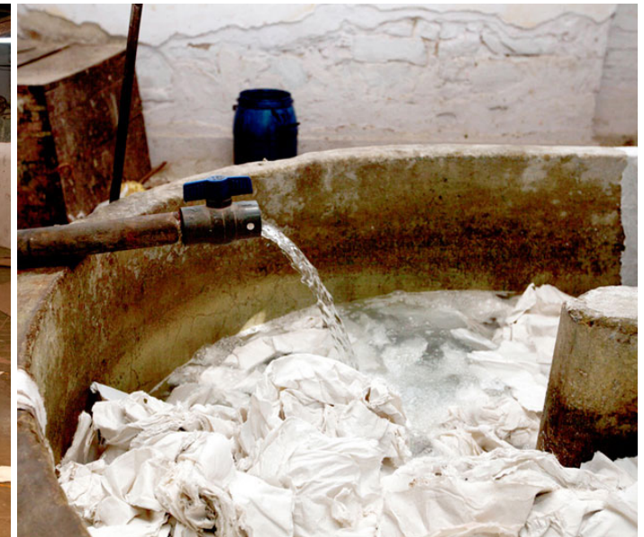
Paper and the cloth pieces are soaked in water.