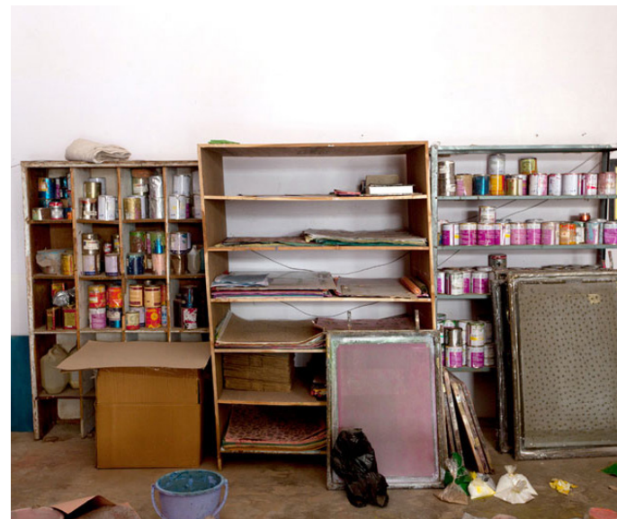
Different types of colors used in screen printing.