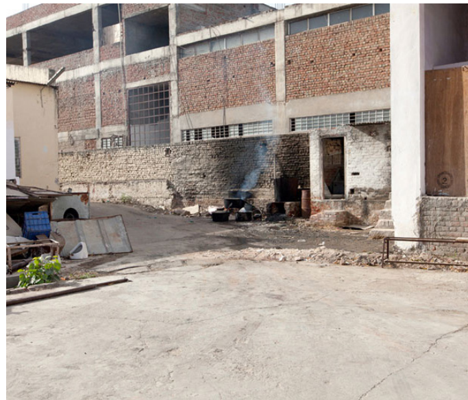
Boiling and heating process are carried out in an open space.