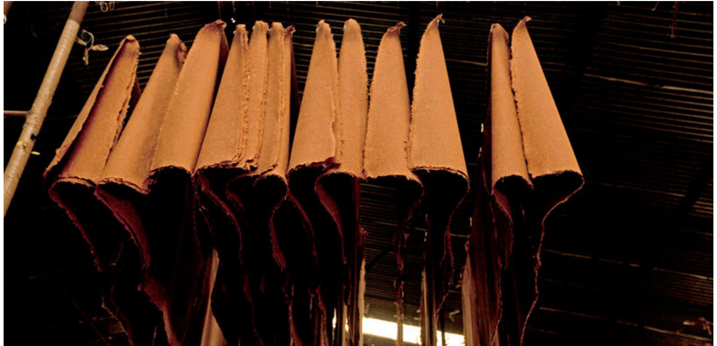
The pressed papers are hanged to dry in shade.