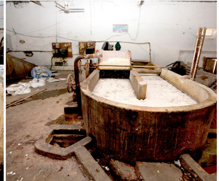
The paper pulp is ready for pressing process.