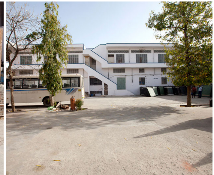
The outside view of paper industry.