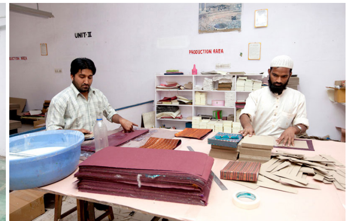
Kagzi's mainly belong to Muslim communities. Therefore a majority of workers are Muslim.