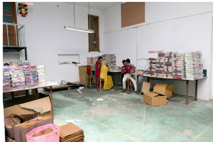
Group of men and women involved in packaging of final handmade paper products.