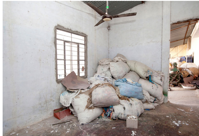
Sacks of cloth stacked in the factory.

The artisans who came from Turkey settled in Rajasthan, Gujarat, Maharashtra and some parts of Pakistan. In Rajasthan, Jaipur became the main center due to the patronization of the rulers. Sanganer in Jaipur was best for the handmade paper industry as it had water and open spaces that are essential for paper making. The craftsmen belong to Kagzi community who traditionally specialized in handmade paper production. The term Kagzi is derived from Kagaz (paper).