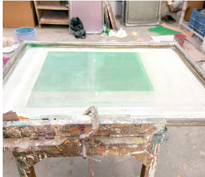
The papers are screen printed to create the patterns.

http://www.dsource.in/resource/handmade-paper/making-process