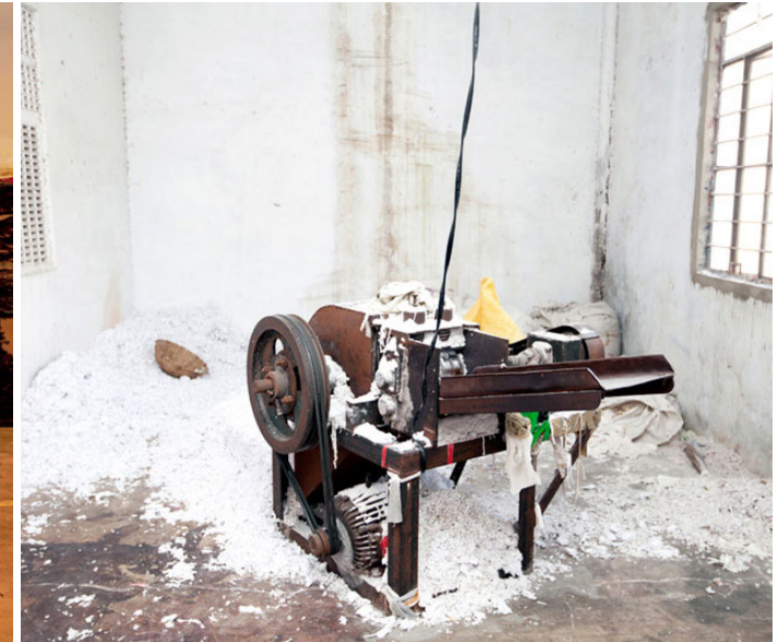
Machine used to crush the raw materials.