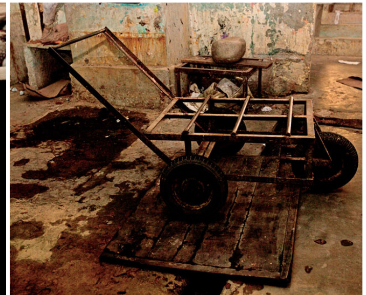
Trolley used to transfer the raw material.