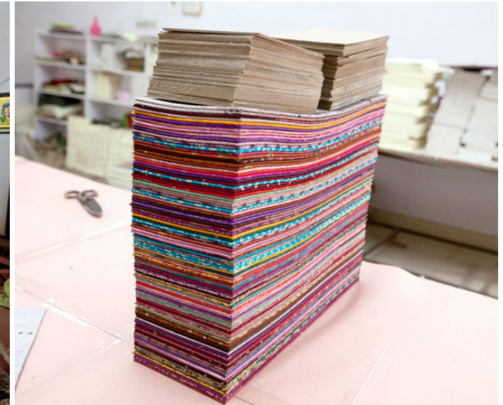
Handmade paper coated with brocade material to be used to make diaries.