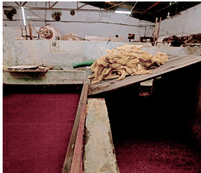
Dye colors are added to the pulp.