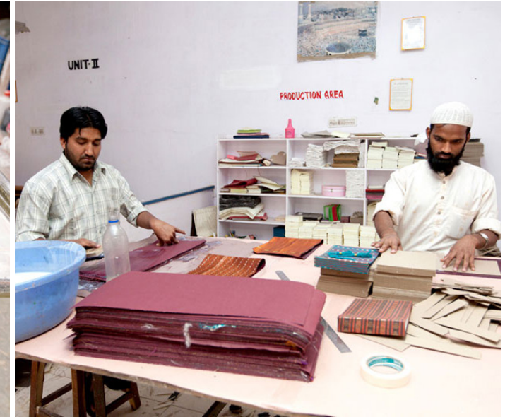
The artisans involved in creating products out of paper.