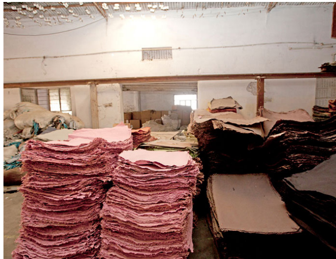
The dried papers are stacked according to colors.