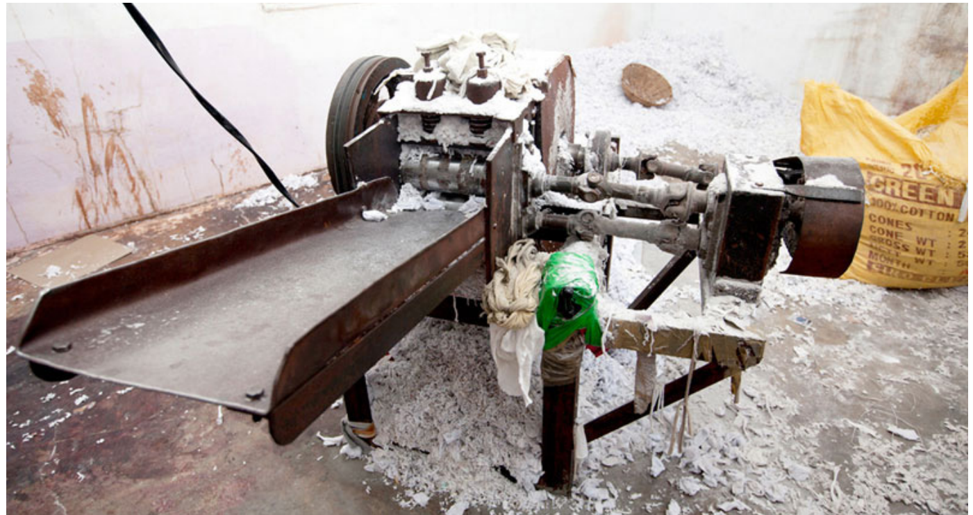
Rag chopper used to chop the clothes into small pieces.

The raw materials such as waste paper and hosiery cloth are the main raw material for making paper. Natural materials like, flower petals, grass and silk waste are added to obtain the textures. Different colors are obtained by adding dye stuff to the paper pulp. Some colors are obtained by natural pigments. Fresh river water used in paper making process.