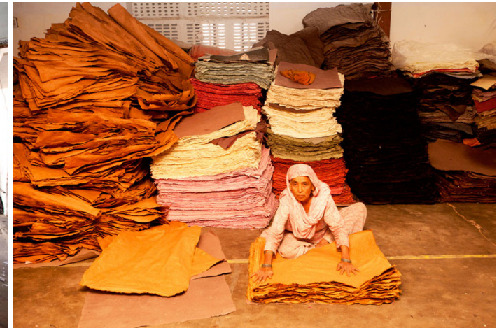
Artisans involved in different stages of making paper.