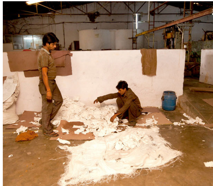
Gathered raw material is checked to clear the impurities.

The making process involves several stages including rag chopping, beating, pressing, drying and cutting. The collected raw material is first bleached as to remove color and whiten the hosiery cloth. The bleached cloth is finely chopped into small pieces. Then the waste paper and the cloth pieces are mixed together with water in a beater. The beater machine finely beats the raw material to make the pulp. The pulp is evenly poured in a mold which contains two frames. The screen holds the pulp and the water drains out. The wet pulp is transferred onto a cloth and pressed to make the thick sheet. This process is repeated until the required uniformity is achieved. The sheets are dried after squeezing the water. The thickness of the sheet depends on the quantity of pulp taken in the mold. For the colored sheets the dye stuff is added in the pulp during the beating process. Some papers are colored externally after the paper is dried. Motifs are created by adding flower petals, leaf and grass during the pressing process. The dried papers are inspected for the quality and then smoothened.