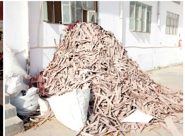
The waste material after paper cutting.