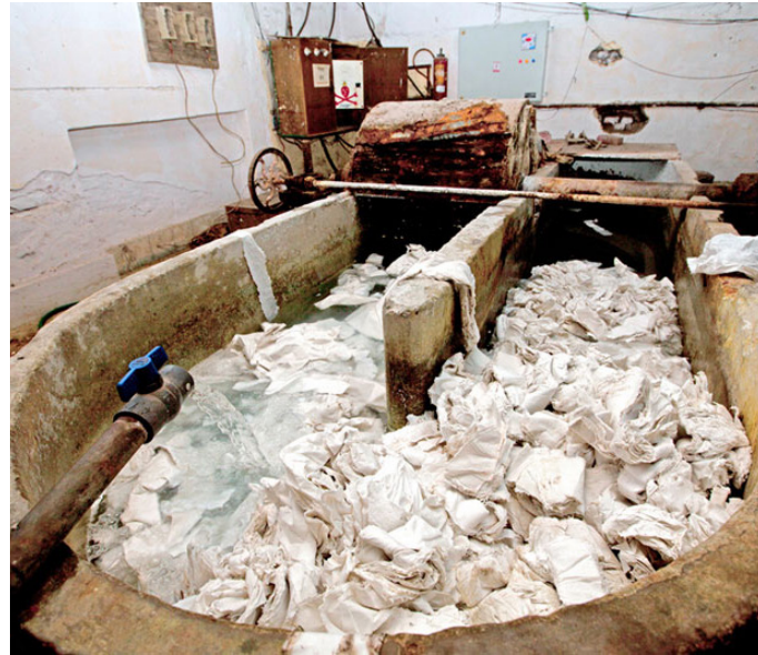
The beater makes the material into soft pulp.

http://www.dsource.in/resource/handmade-paper/making-process