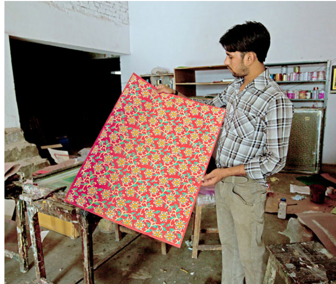
Screen printed paper.

http://www.dsource.in/resource/handmade-paper/products