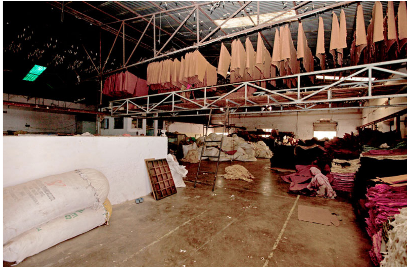
The prepared papers are allowed to dry naturally.

Sanganer is located 30 Km away from Jaipur city in Rajasthan. Handmade paper craft was traditionally practiced in Sanganer. The history of handmade paper crafts dates back to Mughal era around 16th century and continues till date. It was brought in India by Mughal from Turkey. The early paper artisans used to make special paper for the Mughal court. In Jaipur, the craft was patronized by Maharaja Sawai Ishwari Singhji. In Jaipur special paper makers were appointed to work for the royal family. These people used to make paper to write manuscripts. The craft flourished due to its constant demand and new interventions made by the artisans. Sanganer in Jaipur became the main center for making handmade papers.