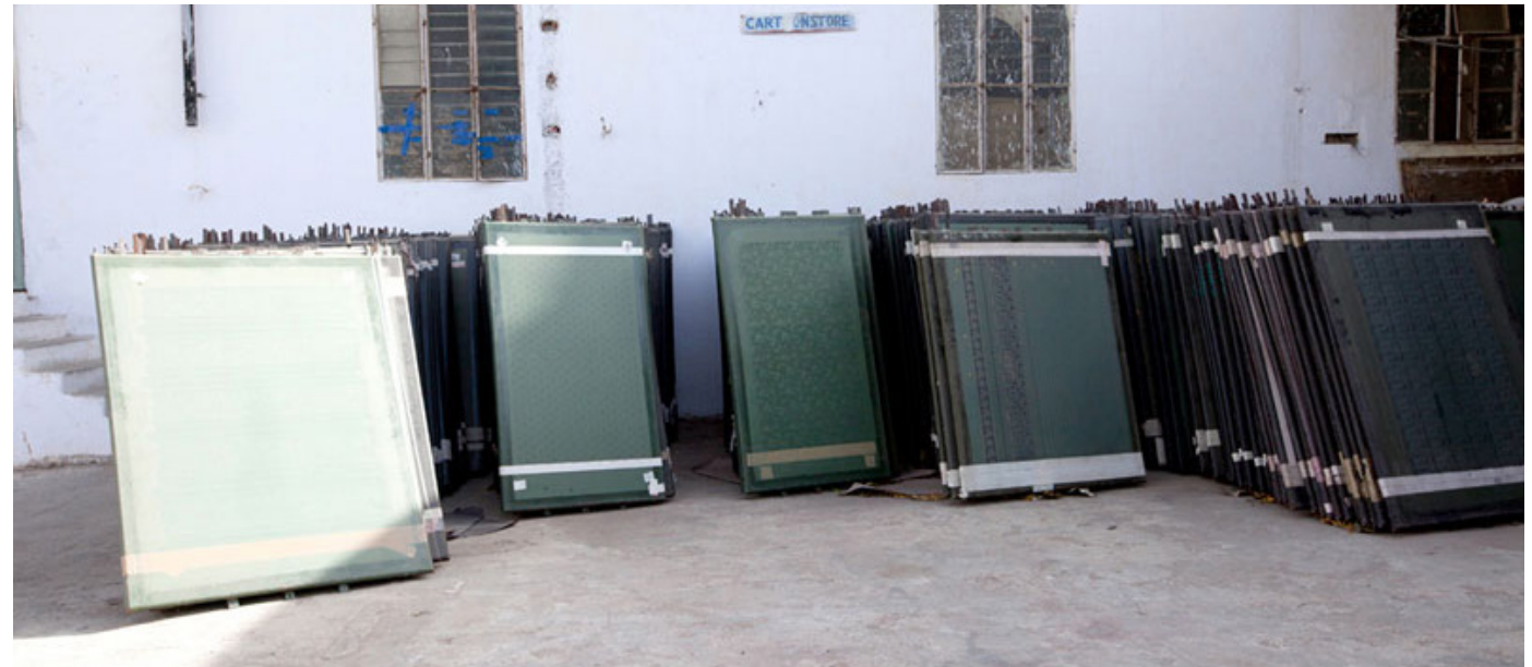
Sieves used in making process.

http://www.dsource.in/resource/handmade-paper/tools-and-raw-materials