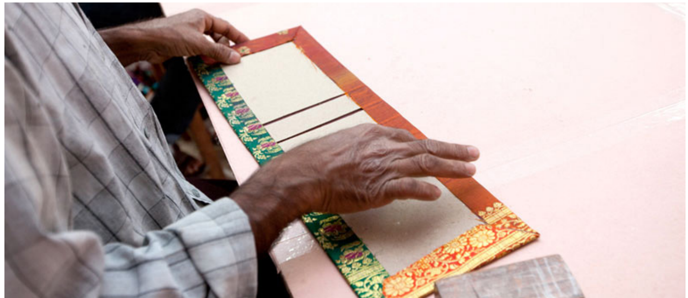
Embellished paper used for book binding.