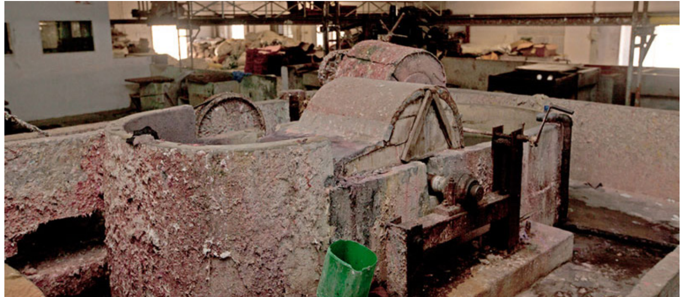
Machine used for further crushing the raw material and converting it into pulp.

http://www.dsource.in/resource/handmade-paper/tools-and-raw-materials