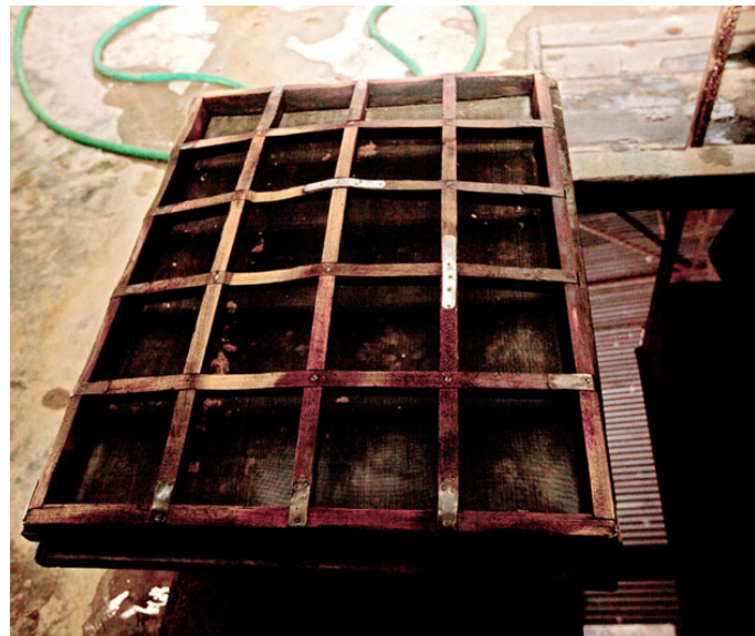
Wire mesh structure used to press the paper pulp.