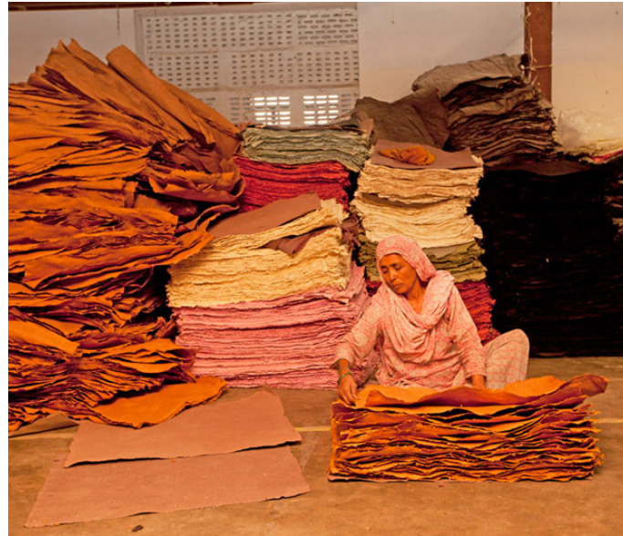
Women collecting and piling the dried paper.

http://www.dsource.in/resource/handmade-paper/introduction