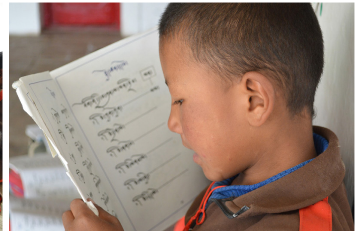
A student studying reciting verses from his Bodhi textbook.