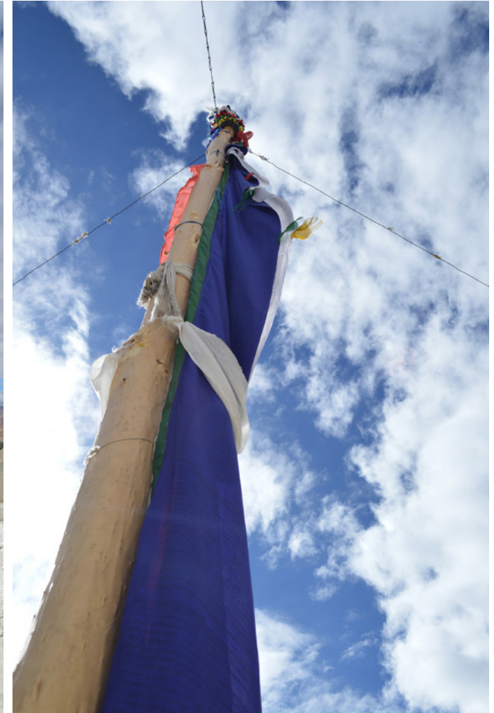
The tallest dhwaja is in the courtyard, just outside the temple. It has the 'Darchor' a vertical prayer flag tied to the length of its pole.