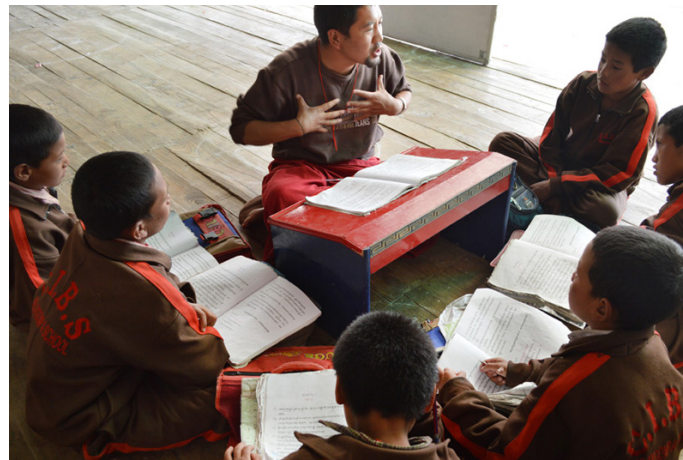
A teacher taking a Bodhi (Tibetan) class in the monastery school.