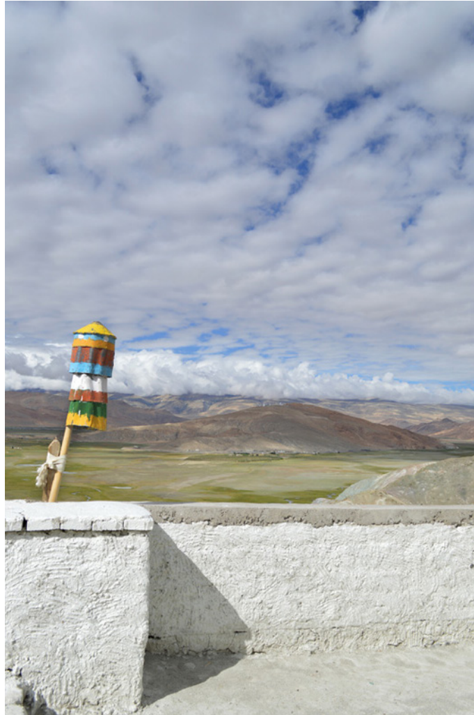
Dhwaja's can be seen all over the monastery.