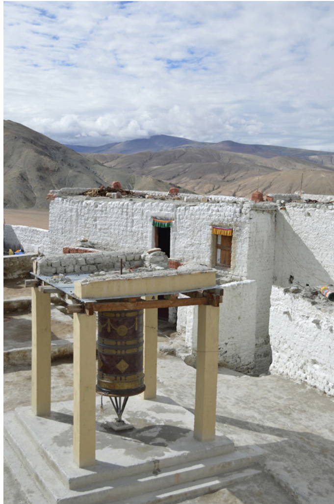
A huge old and traditional prayer wheel sits in the centre of the courtyard.