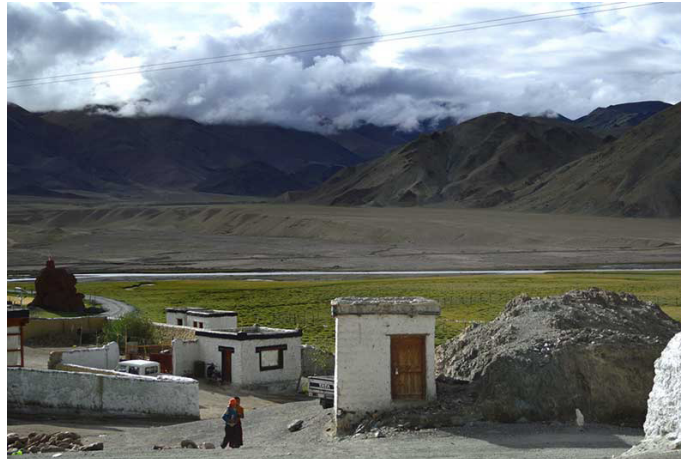
Stupa's, Small rooms, store rooms, local dry toilets and the school area can be seen in these images.