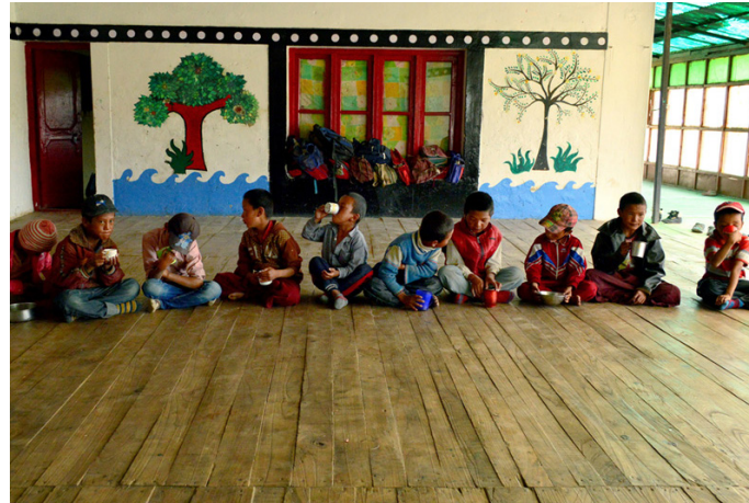
The students of Hanle Gompa, CIBS School - having their morning tea.

http://www.dsource.in/resource/hanle-monastery/life-hanle