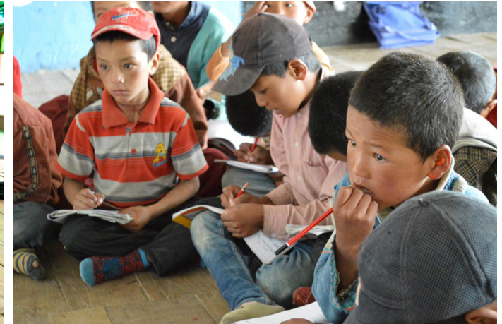
The students working hard in an English class.