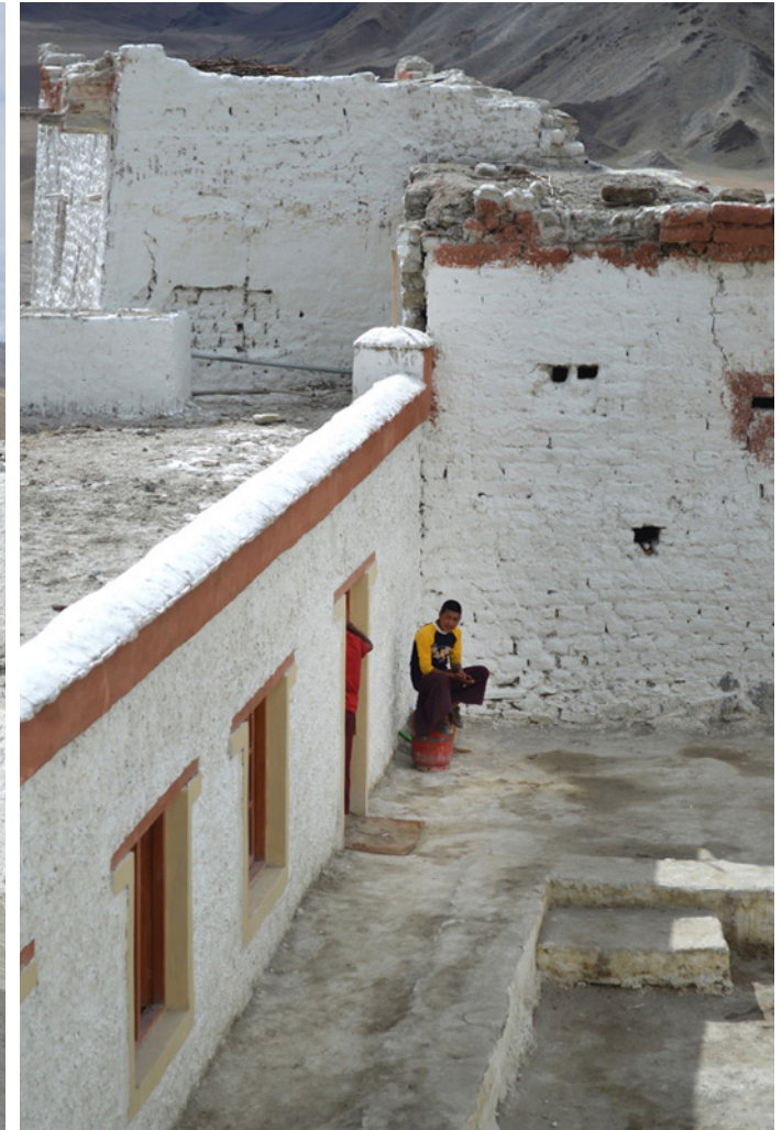
Rooms belonging to different monks open into this courtyard.