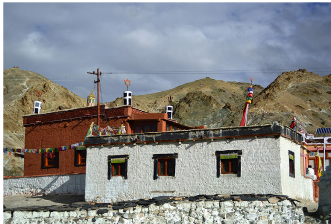
Trishul's on the roof indicate that the latter room is a temple. The white building in the forefront houses the monks looking after the administrative work of the monastery school.