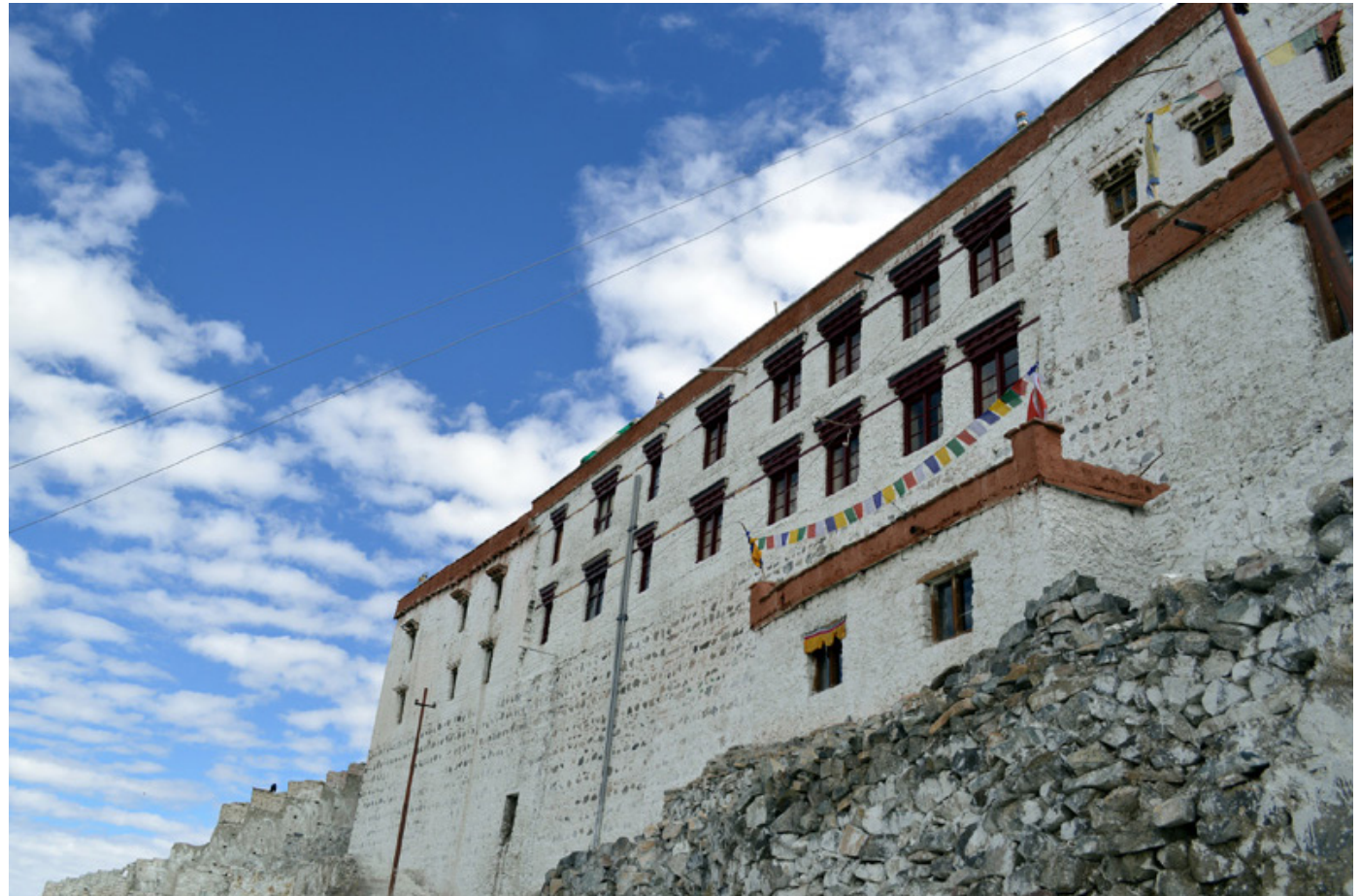
The Hanle Monastery is built on a high hill, it dates back to the 16th century.

Located at a steep height, a visitor has to climb it in the clockwise direction. High set, white walls are visually broken with splashes of bright color seen on the 'dhwaja's or flags, temple entrances and painted roofs.