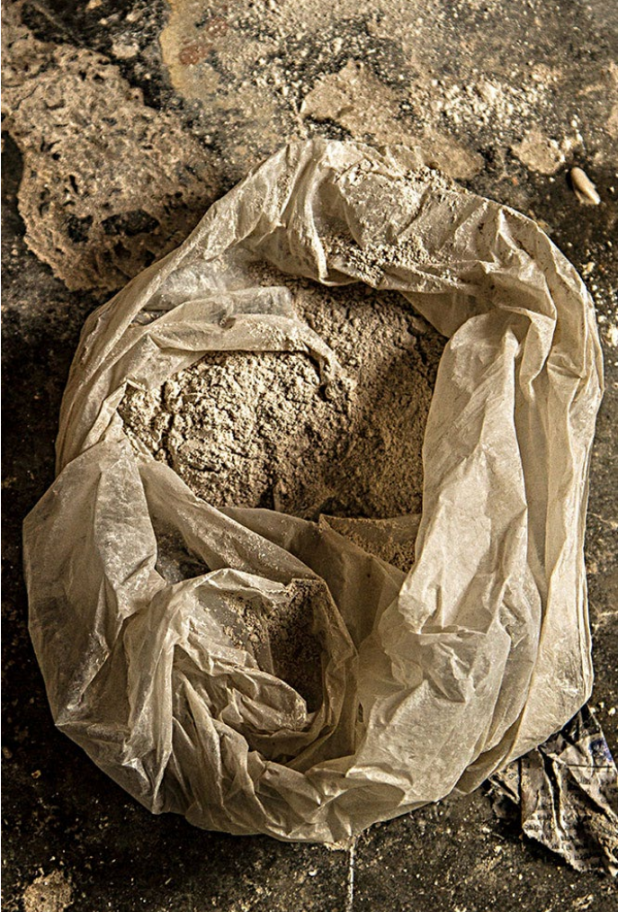
PoP is the main material used to make PoP idols.