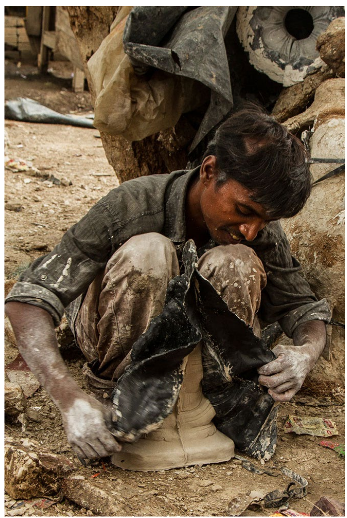
Once dried the formed idol is removed from the mold.