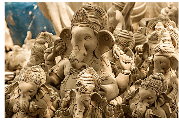
Verities of Ganesha idols are prepared and colored to make the look colorful and eye catchy.