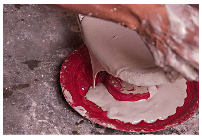
To make wall decorative the mixture is poured in a plastic mold.