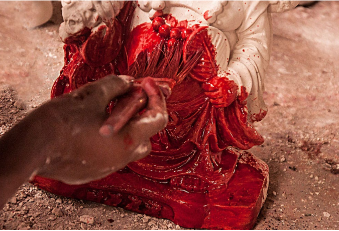
Articles are then painted with required shade of poster color solution mixed with adhesive.