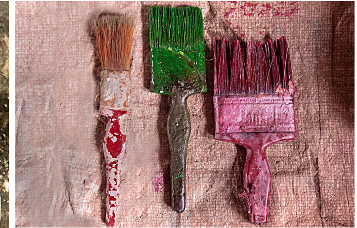
Big flat brush is used to paint big idols.