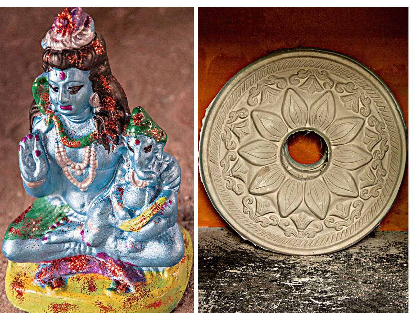
Small idol of lord Shiva and Ganesha colored and embellished with glitters.

Idols of various sizes are made which are distributed throughout India. The size of the idols are about 1ft. to 7 ft. in length and cost of the idols varies from Rs. 50/- to Rs. 250/-. The products of Aligarh made of plaster-of-Paris (POP) are generally Ganesh, Lord Shiva and Pots for flower vases. During the festivals like Shivaratri, Ganesh Chaturthi more of Idols of Lord Shiva, Ganesh, Krishna Idols are sold out.