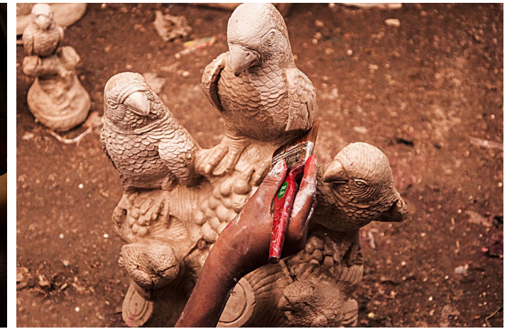
Dry articles are brushed with water once to remove the dust particles.