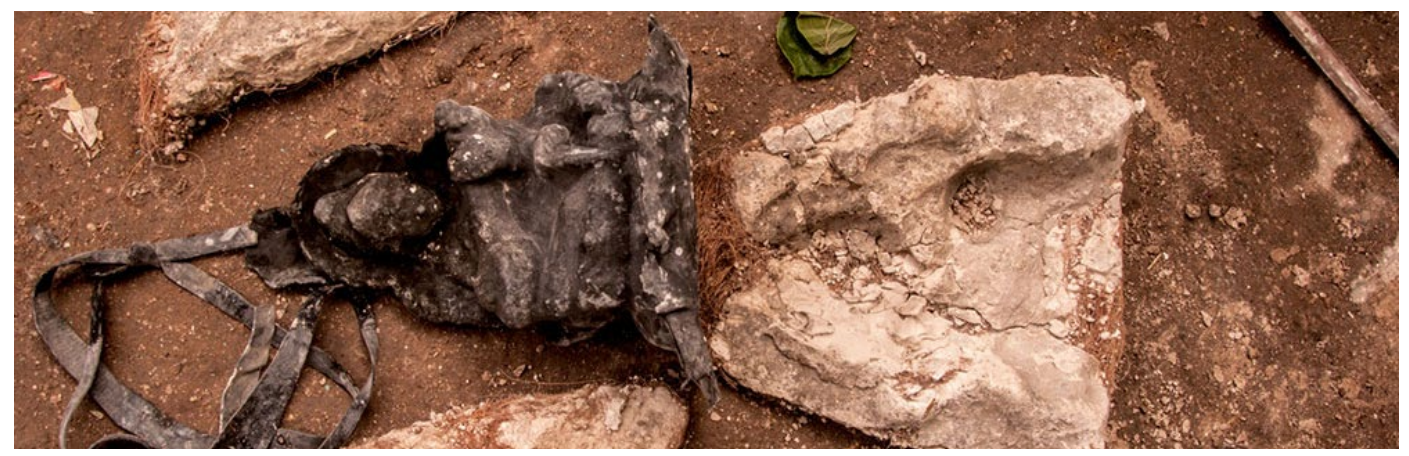
PoP and rubber mold is used to make the articles.