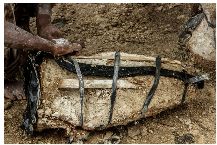
The mold is tied firmly with a rubber strip.