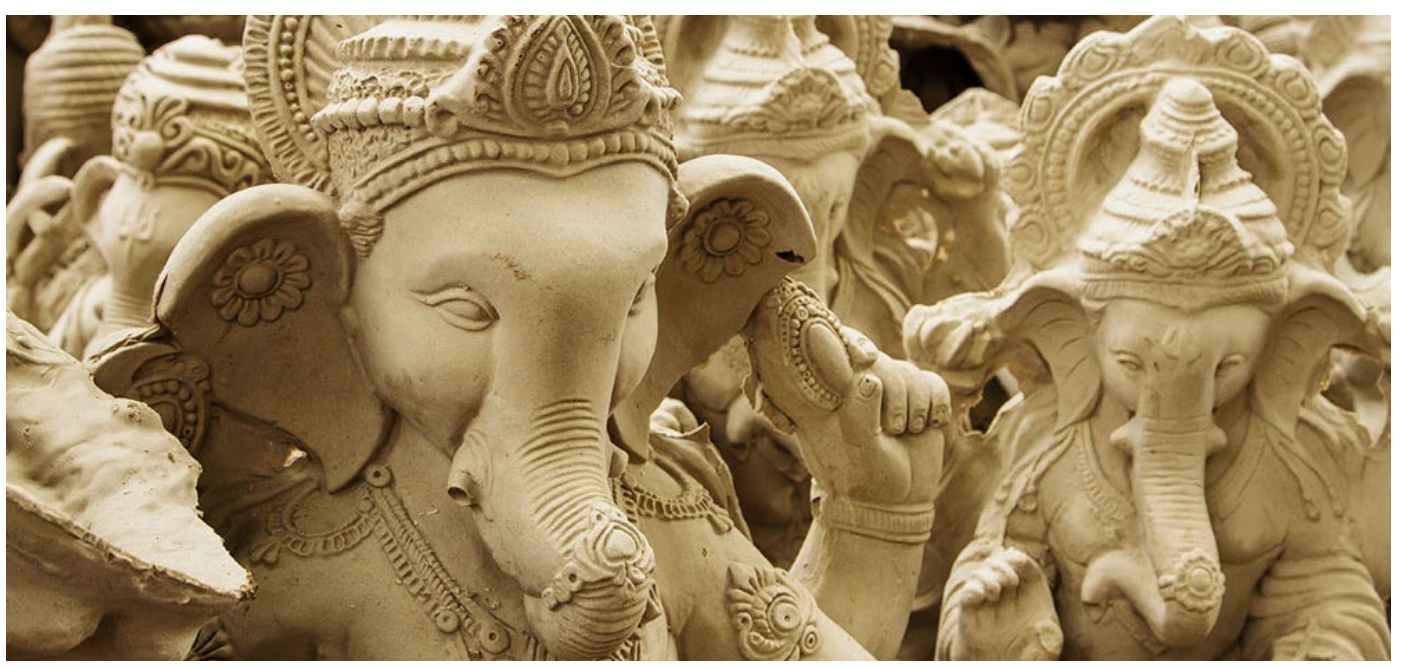
Demand for these idols are majorly at Ganesh festival season.

The religious figures of the traditional classical style are usually seen in sculptures and in small sizes such as dolls. Mouth and eyes are generally drawn with black lines that put life into eyes and expressions with mouth, it also has its share of jewellery. These dolls are secular as well as religious that represent the different Hindu deities with diverse postures and symbols with different characters.