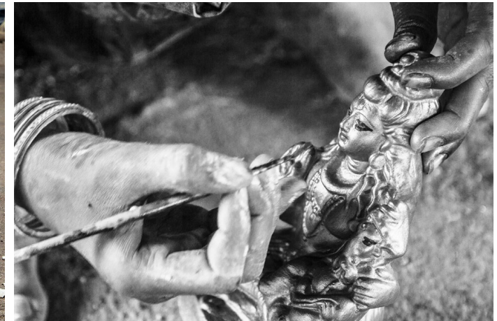
Idols are painted with bright colors to highlight the details of the product.