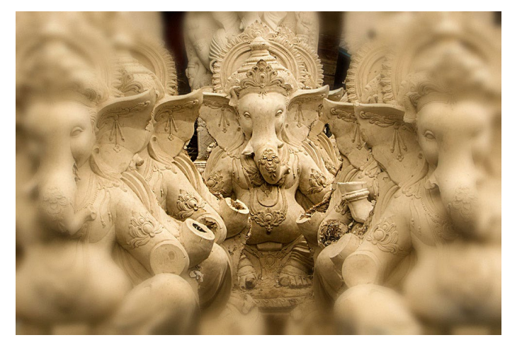
Big size Ganesha idol made of POP.