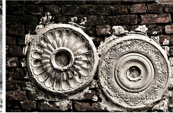
Wall decorative made of POP.