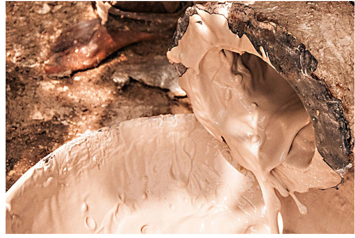
Excess mixture is poured back to the container and the mold is kept in the sun to dry.