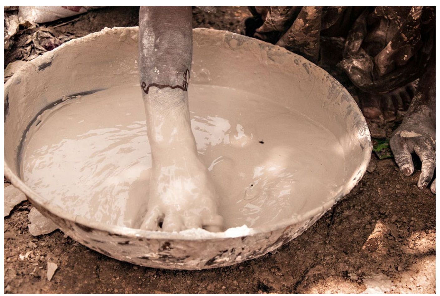
Mixture of POP and water is prepared in a ratio.