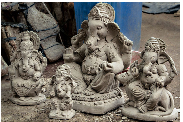
Plaster of Paris (POP) Ganesha idols made in different sizes and forms.