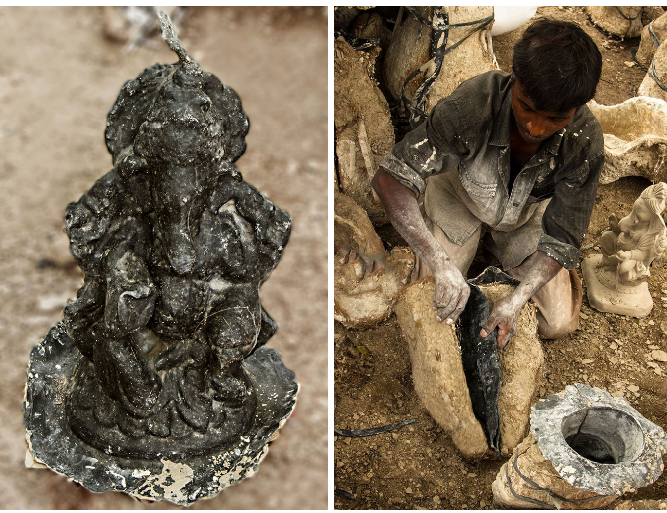
Rubber mold of desired design is used to make the idols.