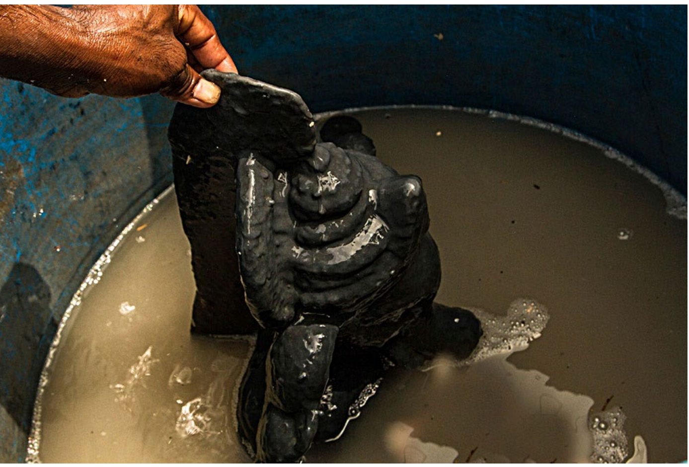
The rubber mold is first washed in the water to remove dust particles.