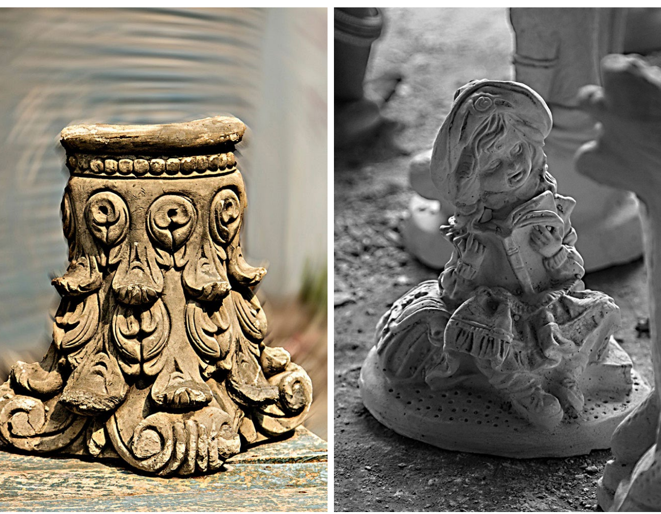
Pillar base made of PoP.