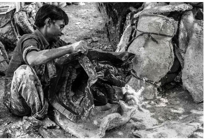
All the products are made using POP and rubber mold.