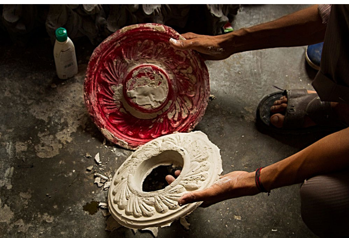
Once dried the article is removed from the mold and the edges are sanded to smoothen and level the edges.