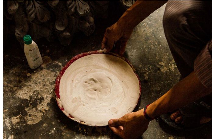
The mixture is kept to dry.