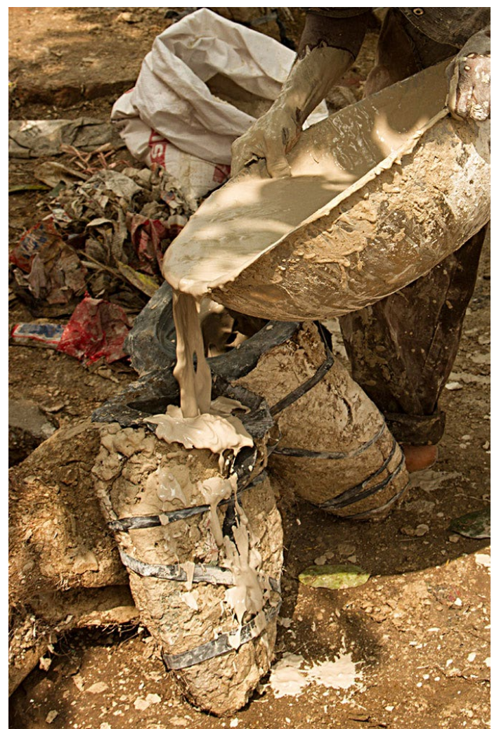
Mixture of pop is poured into the mold.