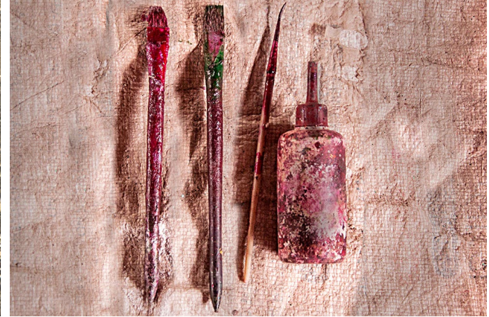
Small brushes are used to paint colors on small idols and to paint details.