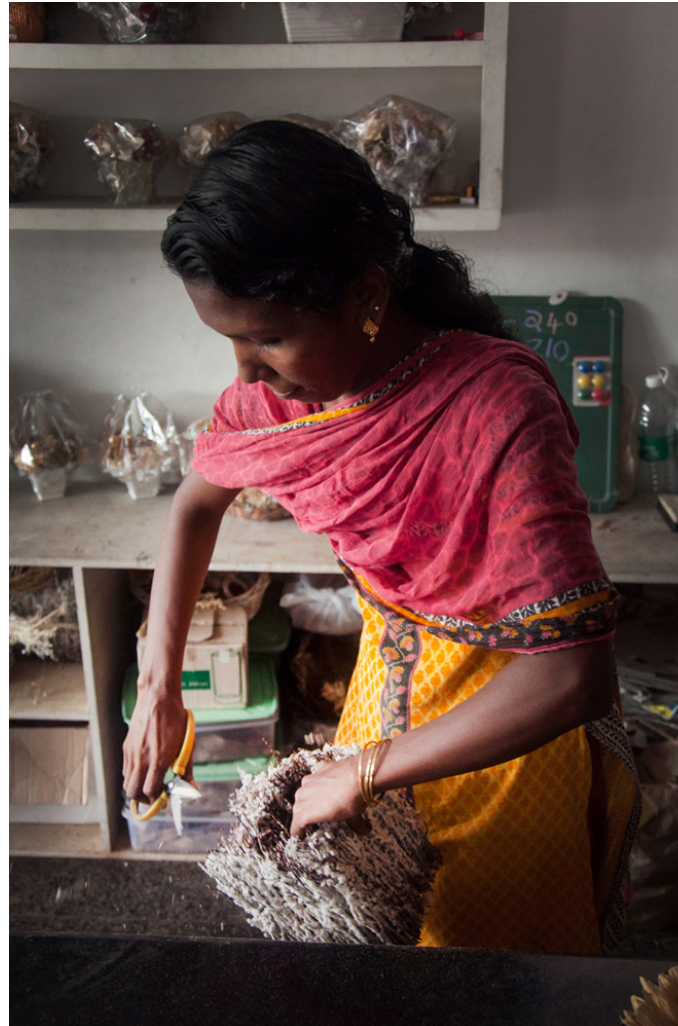
Artisan trimming and leveling the fancy weaved pot edges.