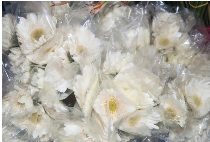
White daisy flowers freshly brought from farm, which is used, in bouquet.