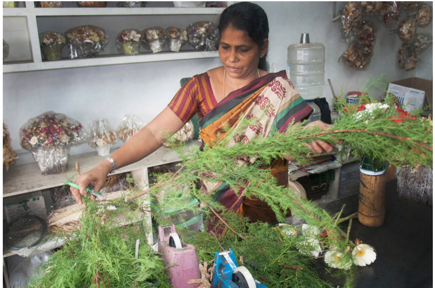
Cedar branches are used in filling up the gaps between flowers, which embellishes the outlook.