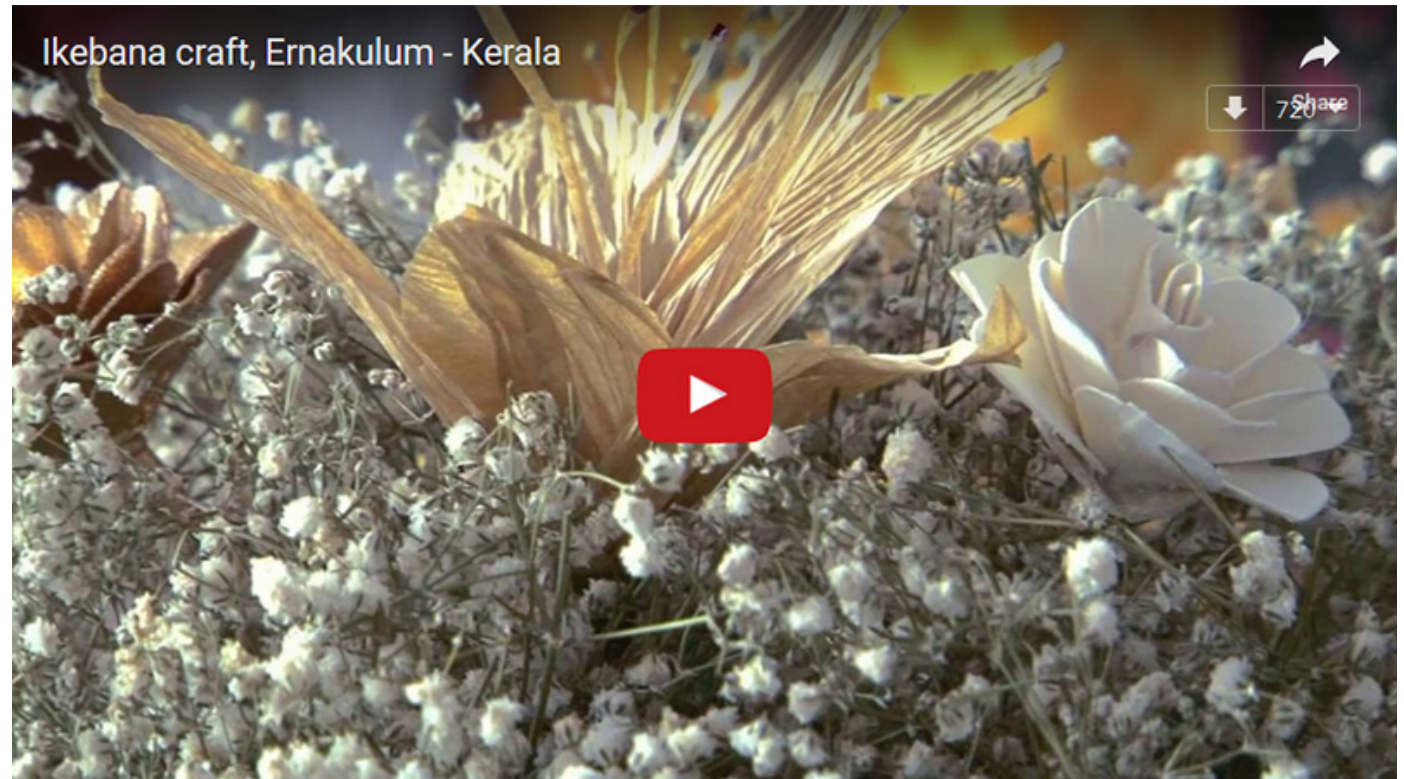
Ikebana craft, Ernakulum - Kerala