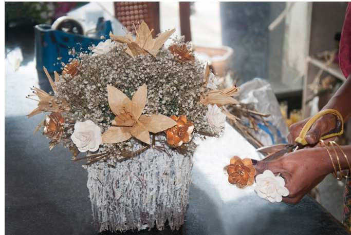
The coconut broomsticks are cut in an angle, which obtains a sharp edge at the end, which apparently helps in piercing the article into the foam easily.