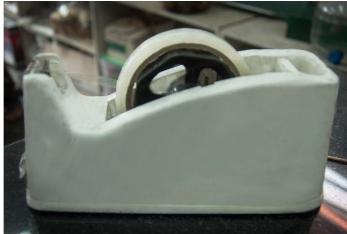
Tape dispenser used in packing and wrapping the flowers.