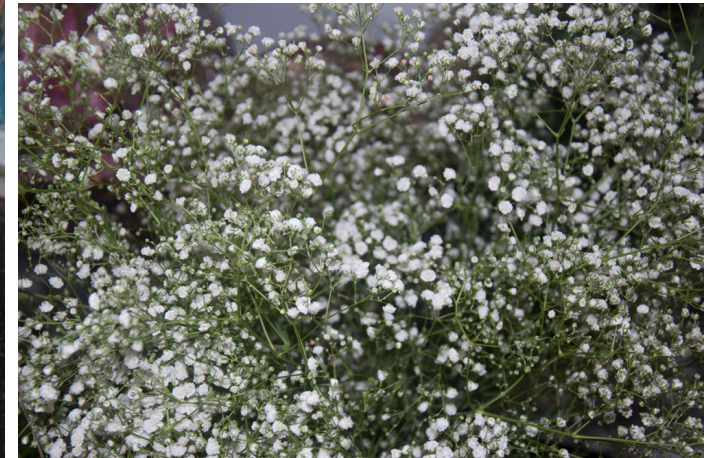
A bunch of fresh Gypsophila used as adornment in Ikebana craft.