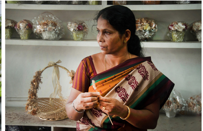
Skilled artisan with her attractive creations for well-wishers.