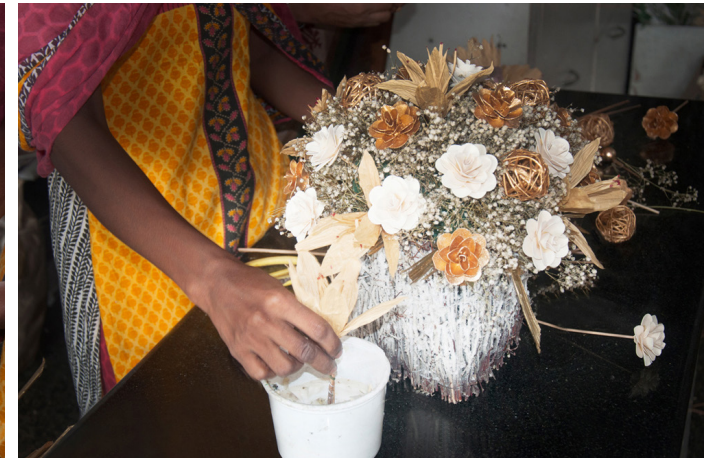
Artisan dips the flower and articles every time into the glue before emerging it to the foam.