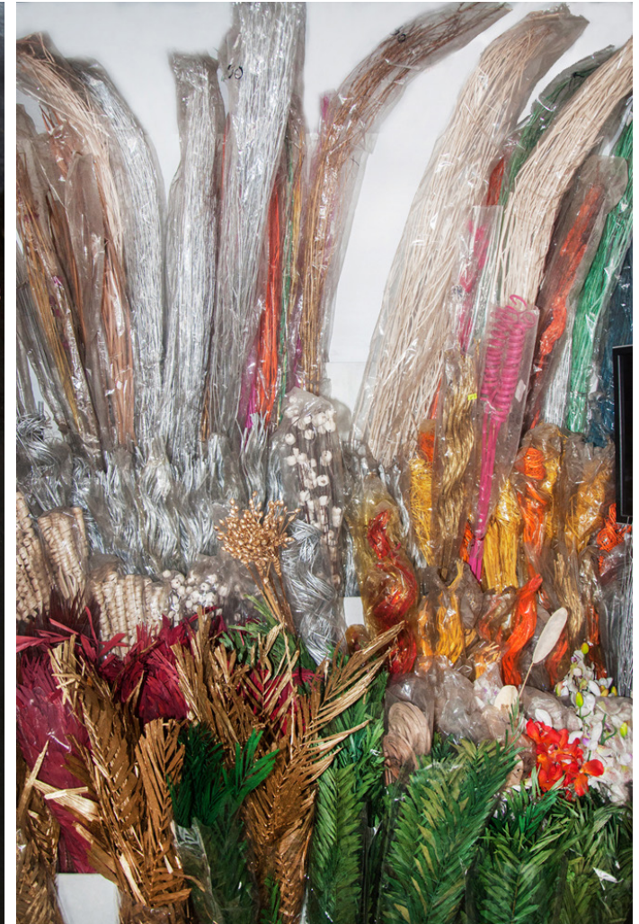
Varied articles used in Ikebana flower arrangement craft for embellishment.