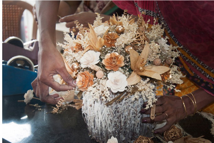
A fancy decorated spring like articles is also used in embellishing the arrangement.