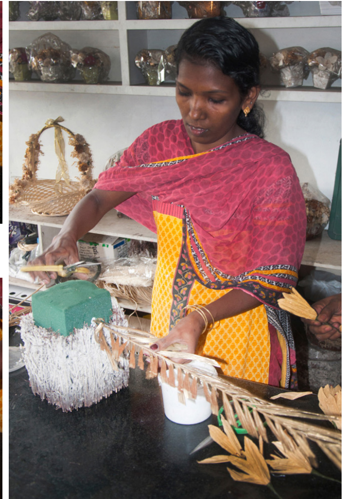
Gold painted palm leaves are dipped into the glue and emerged to the foam.