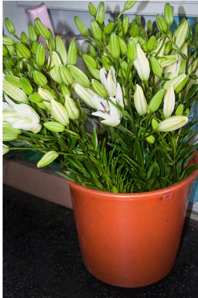
Fresh Lilly flowers nurtured with water in a bucket.