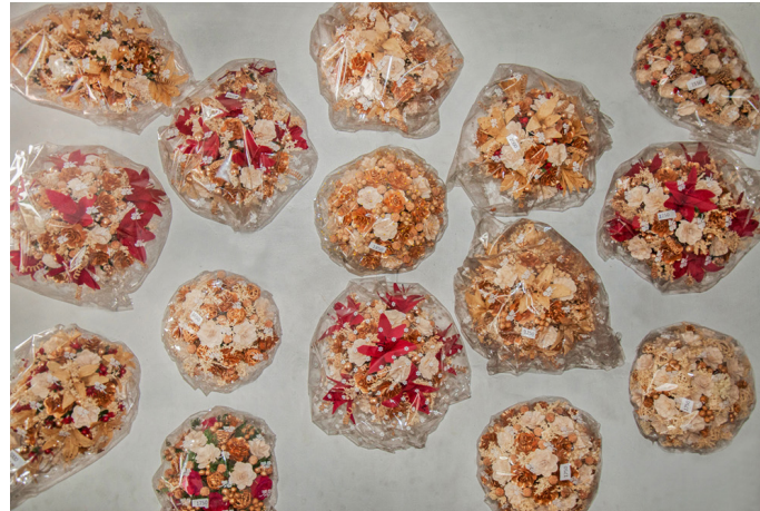
Variety of wall hanging decorative bouquets for home extravaganza.

http://www.dsource.in/resource/ikebana-craft-ernakulum-kerala/products