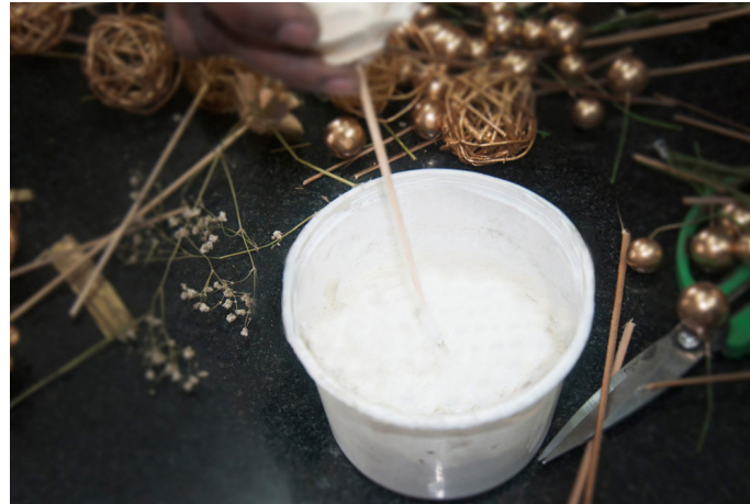
A plastic container is used to put the glue for better ease at work.

http://www.dsource.in/resource/ikebana-craft-ernakulum-kerala/tools-and-raw-materials