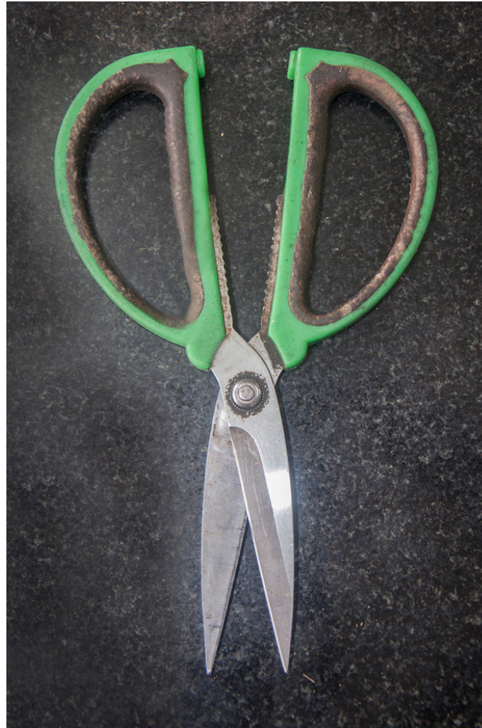
Professional stainless steel scissors used in trimming and cutting of flowers and articles.