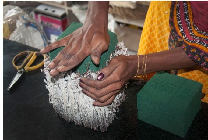
The oasis floral foam is placed on the pot and pressed half into the pot.

http://www.dsource.in/resource/ikebana-craft-ernakulum-kerala/making-process