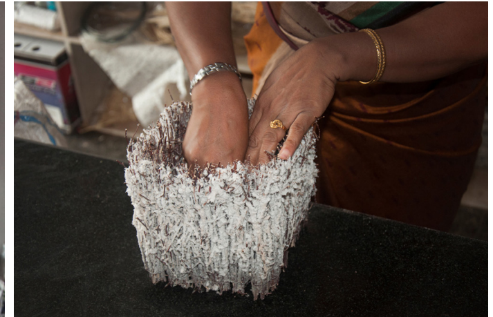
Artisan ensuring the strength and the arrangement of the pot.