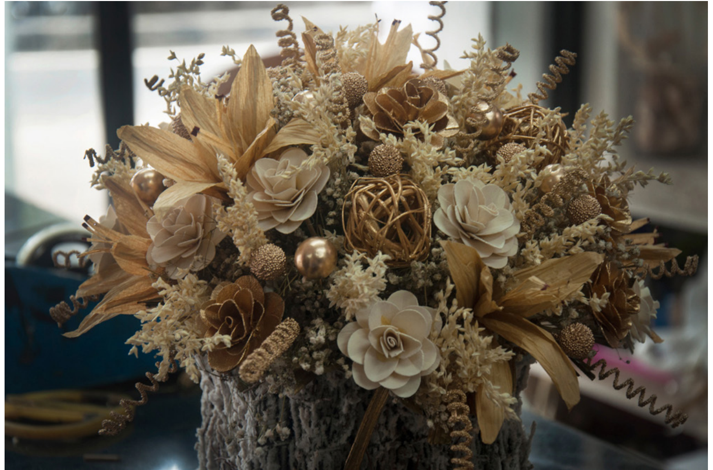
Artisan attains a beautiful dried flowerpot after a long process of arranging the substances in a manner.