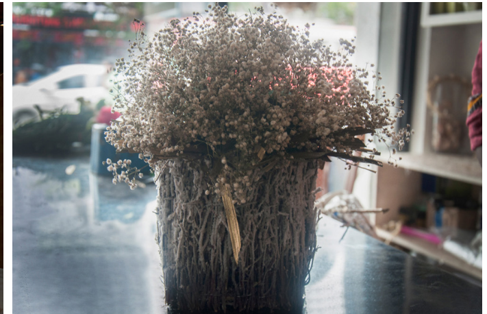
A beautiful Gypsophilia flowerpot acquired in between the flower arrangement process.