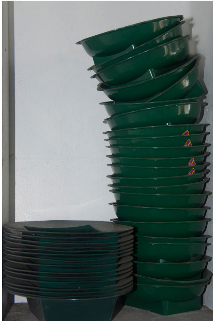
Oasis designer bowls are used as a base for flower arrangement.