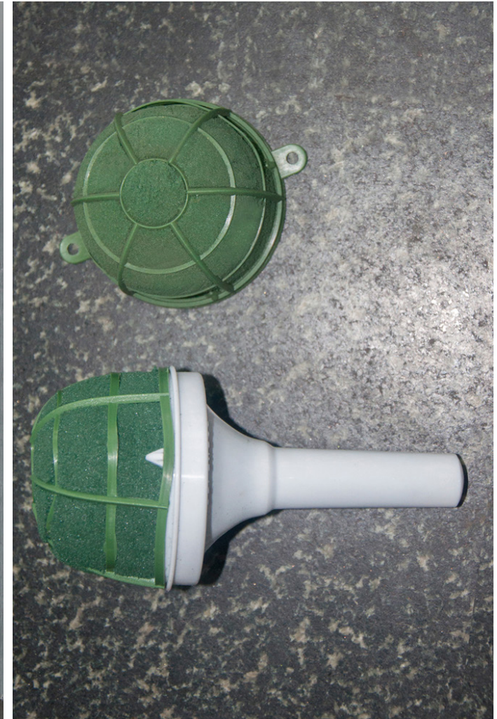
Oasis bouquet holder is used as a base for the bouquet flower arrangement.