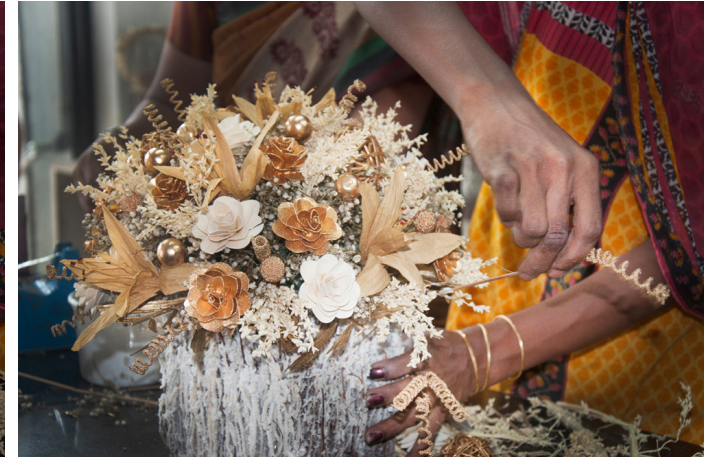
Artisan ensuring the arrangement by filling the empty spaces with the varied decorative articles.