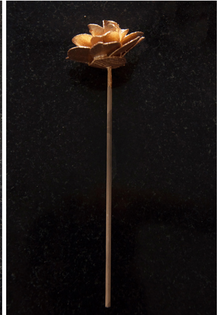
Birch wooden shavings are used in making wooden roses and it is painted gold for embellishment of flower arrangements.