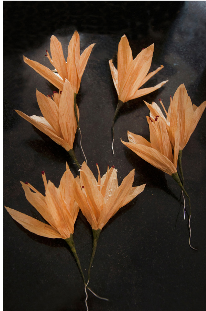
Beautiful flowers made out of dried Lilly flowers.