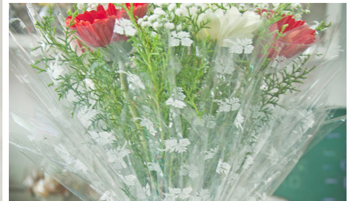
Artisan stuffing the plastic covers wastes inside the pot to fill the air gap.