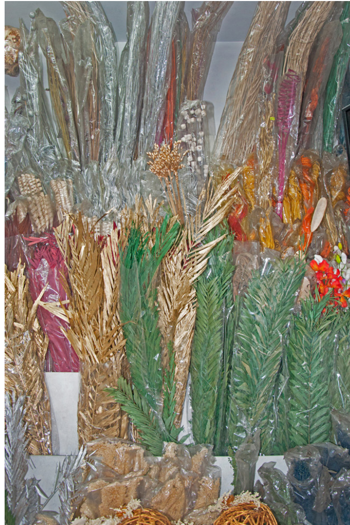
Dried palm leaves painted gold and green along with the other decorative articles used in Ikebana.