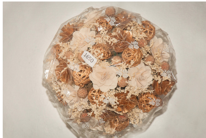
A close up of a delightful floral wall hanging.