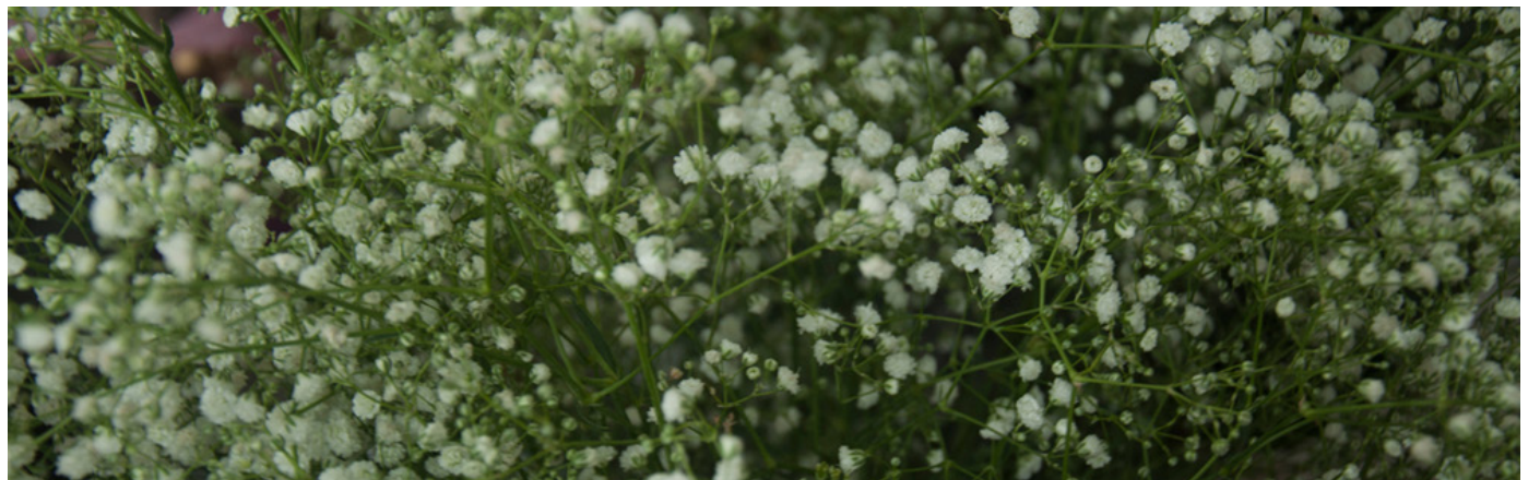
Gypsophila white small flowers used placed in between the big flowers to embellish the arrangement.