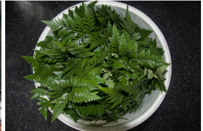
Ferns, a type of flowerless plant with feathery leaves is cut and used in between the arrangement of flowers.