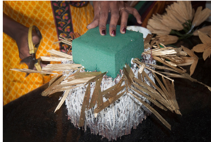
Artisan is ensuring the palm leaves and trimming them in a level.