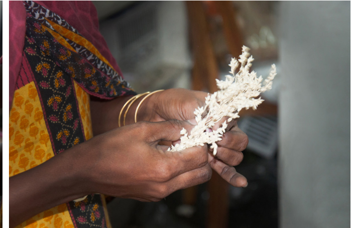
Heap of small dried white buds used in beautifying the arrangement, which gives contrast to the craft.