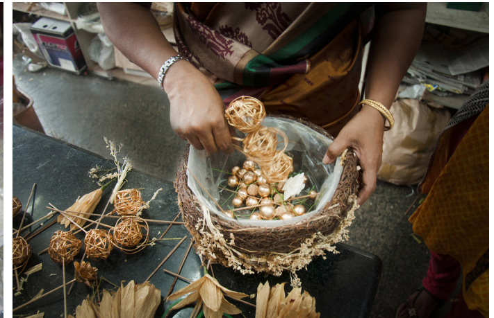
Cluster of artificial articles used in arrangement of dried flowers.