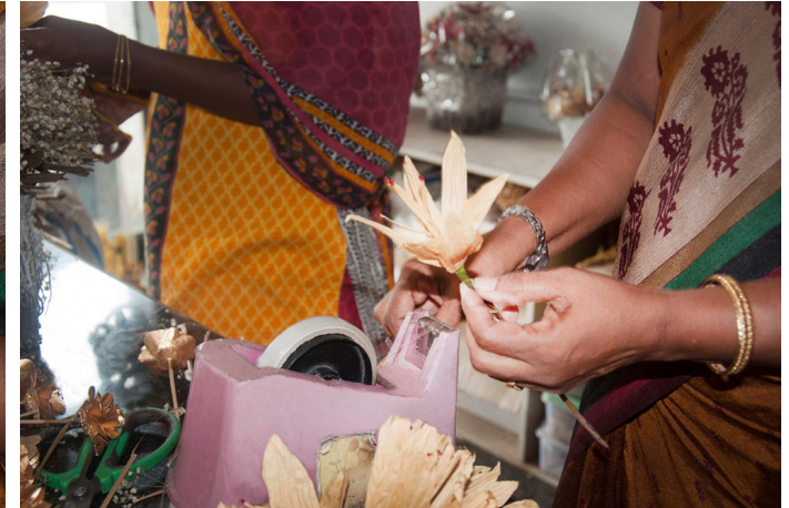
Artisan tapes the piece of unused fresh coconut broomsticks to the flower, which gives strength and stability.