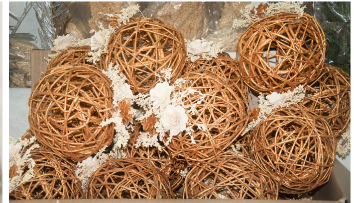
Bridesmaid's pomander beautifully made out of cane sticks and wooden flowers and other decorative articles.