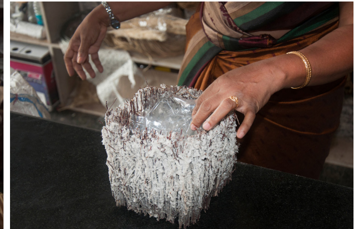
Artisan stuffing the plastic covers wastes inside the pot to fill the air gap.