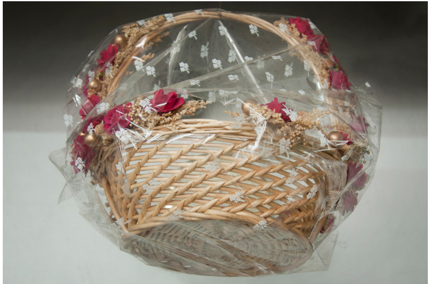
Flower girl Basket adorned and decorated for weddings.