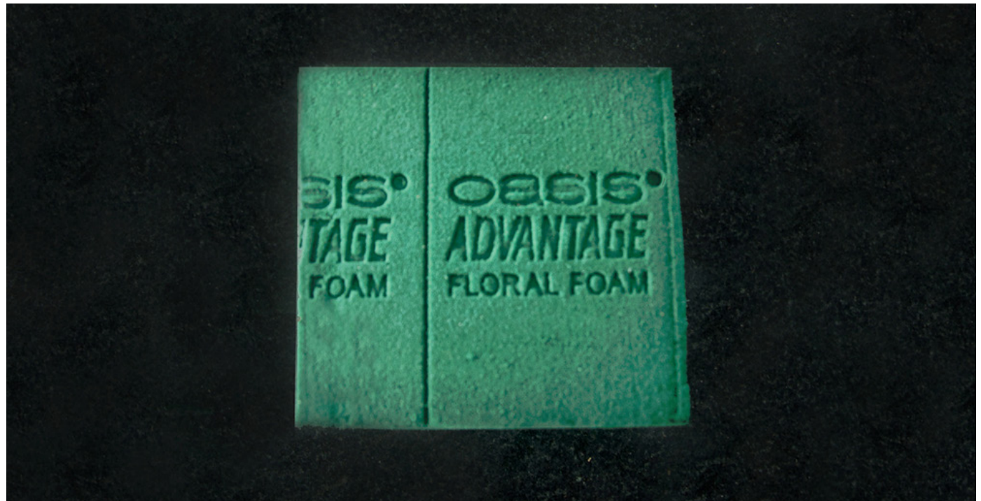
Oasis floral foam used like a base, which holds the postures of the flowers and articles stable.