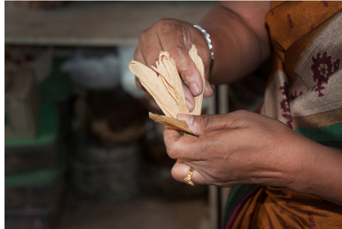
Artisan spreading the petals of dried crumbled artificial made tulip flower.

http://www.dsource.in/resource/ikebana-craft-ernakulum-kerala/making-process