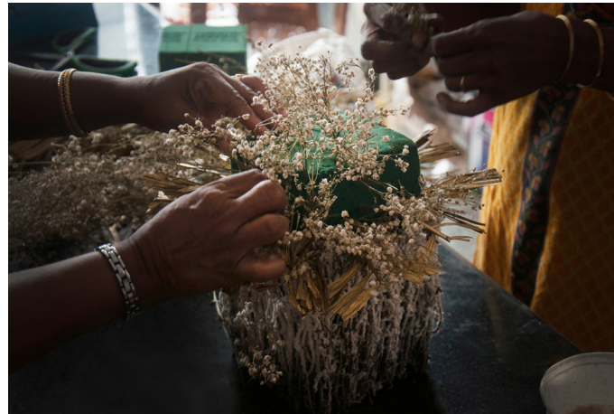
Gypsophilia flowers are arranged onto the foam in a equal rhythm.