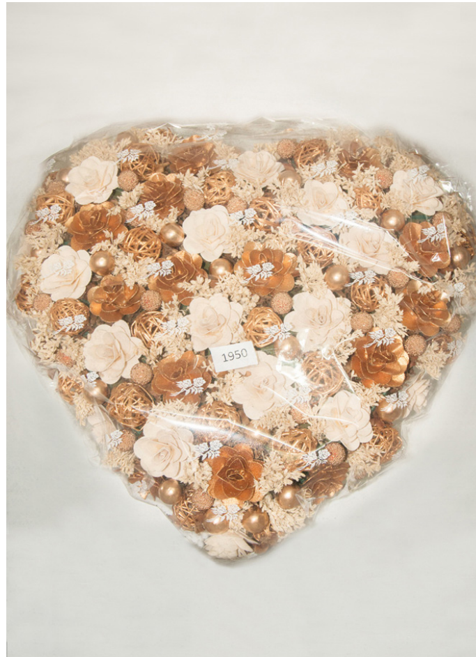
A heart shaped floral car decorative for wedding celebration.

The Ikebana, an art of arranging flowers in an aesthetic form to bring the feeling of closeness with the nature, the products obtained are flower vases with beautiful flowers arranged in various manner. They are arranged in various sized vases, in small baskets, and custom shaped containers like that of a heart and round shapes. The bright colors of flowers and stems make them gorgeous and elegant. The products are hand tied bouquets, flower basket bouquets and custom shaped bouquets which can be kept at homes to bring harmony, gift to close ones and relish.