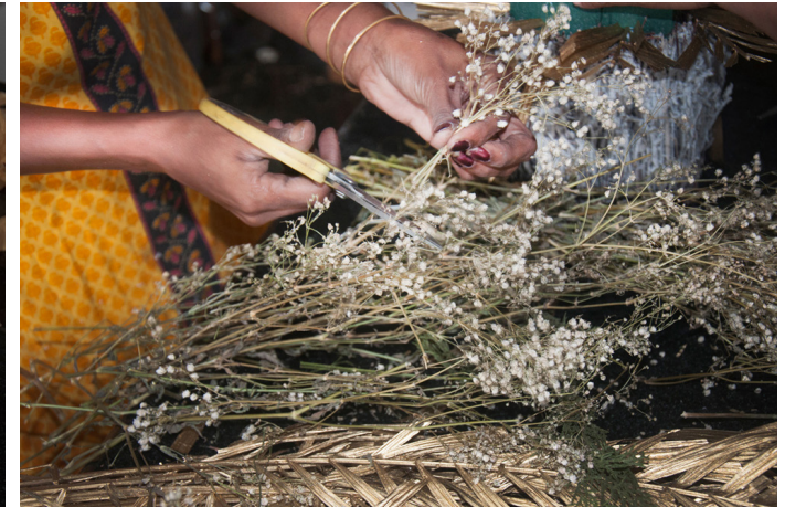
Gypsophilia flowers are chosen in a bunch and it is cut for the arrangement process.