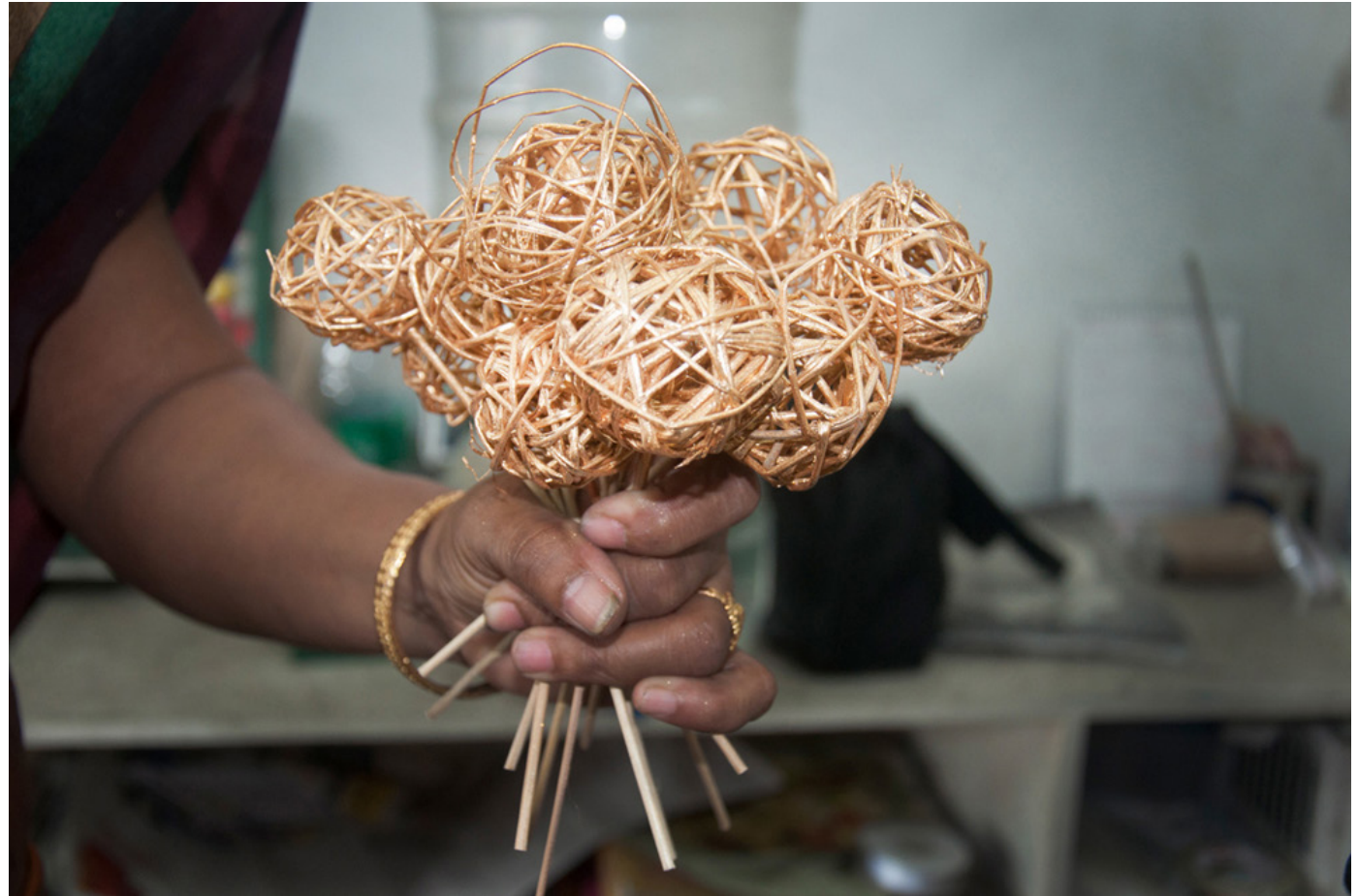
An article beautifully made out of cane thin cords and painted gold which gives elegance to the final product.