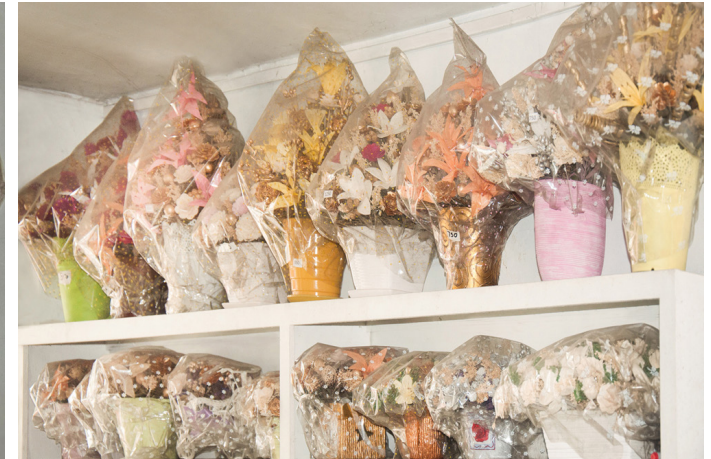
Variety of floral embellished non-perishable flowerpots to gift.