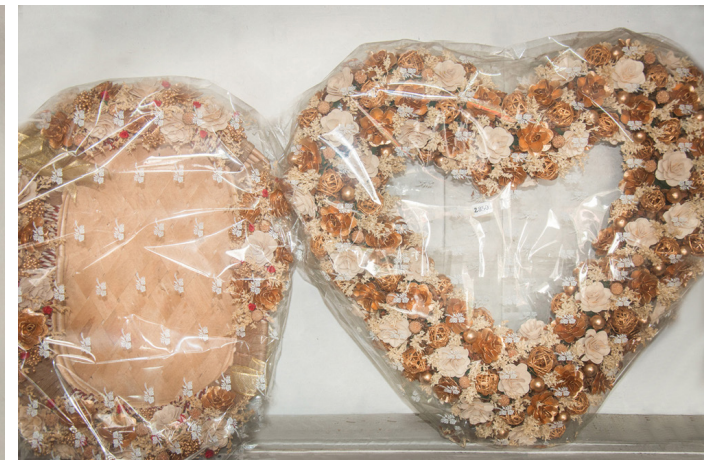
A heart shaped floral garland and decorated floral tray for wedding orders.