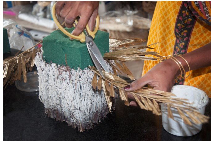
Palm leaves are cut up to a level and it is dipped again into the glue and emerged to the foam and it repeated till the strand of palm leaves is over.