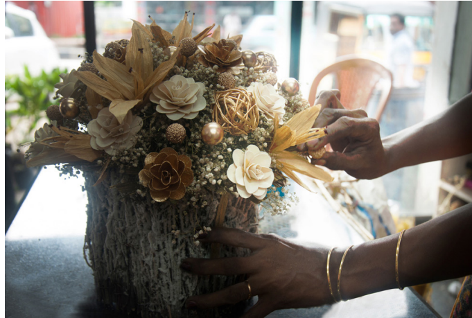
Artisan emerging an embellished article into the foam.