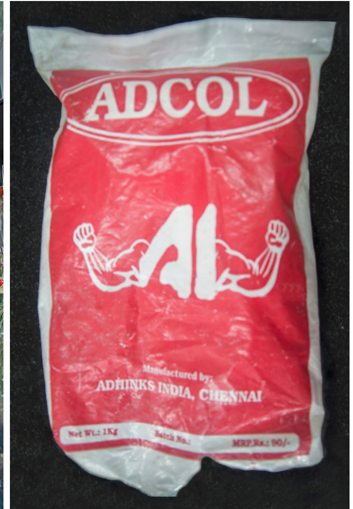
Adcol, an adhesive like fevicol used in sticking the flowers and the other articles to the oasis floral foam permanently.