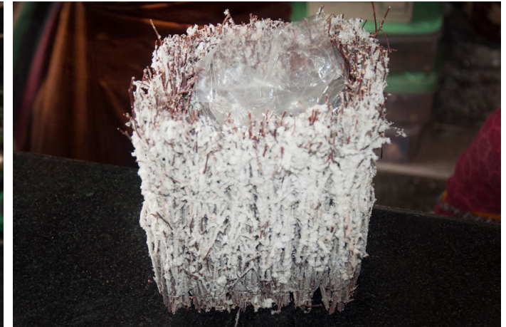
A fancy decorative pot made out of weaved dried stems used for placing the flower arrangement.