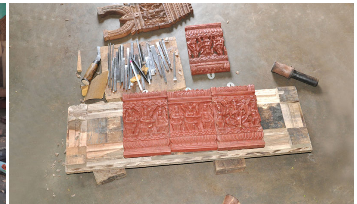
Workplace of a wood carving artisan.