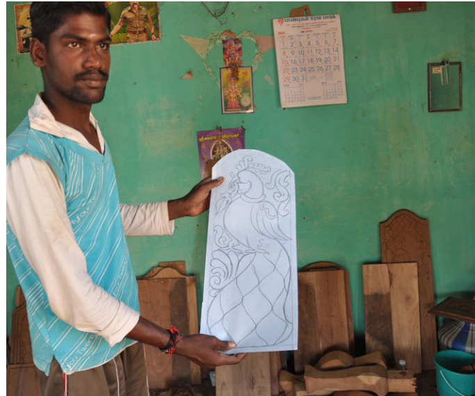
Artisan showing the template of designs to be carved out of the wood.