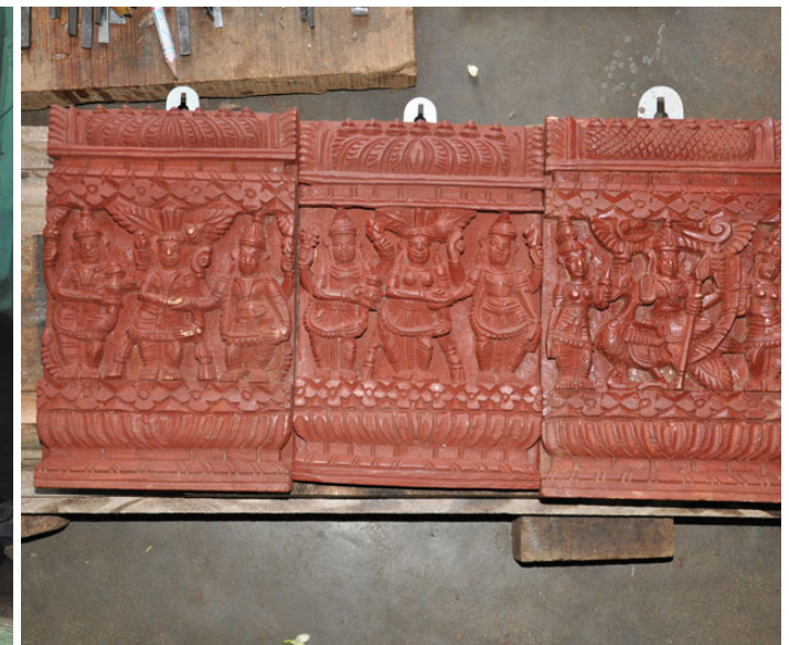
The carved piece are colored with the help of chemical paints.