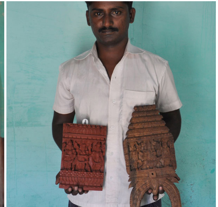
Mainly god and goddess are carved on the wood and hanged/ suspended outside the house for good fortune.