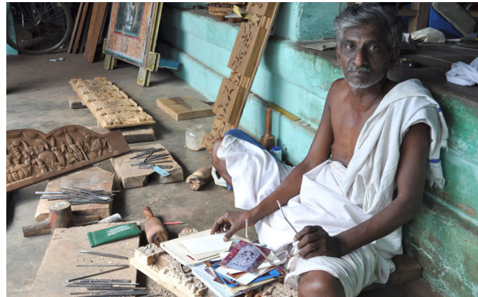
Karaikudi village has housed a number of artisan families who are traditionally involved in wood carving.

Karaikudi and the neighboring towns hold excellent examples of Chettinadu architecture. The people of Chettinadu were traders and financiers who valued high living and maintained old traditions. They built all-embracing houses, which today stand testimony to their taste and love for beautiful things. They brought back Burmese teak and European tiles for their mansions, as well as the inspiration from ceremonial and palace architecture, they incorporated the wealth of wood sculpting and craftsmanship from local craftsmen in their homes. The minute carvings on the doors, carvings of idols on wooden blocks, placed above the doors, named as Surya Pallakai, is the first greeting to any visitor, who enters in to any Chettinad house.