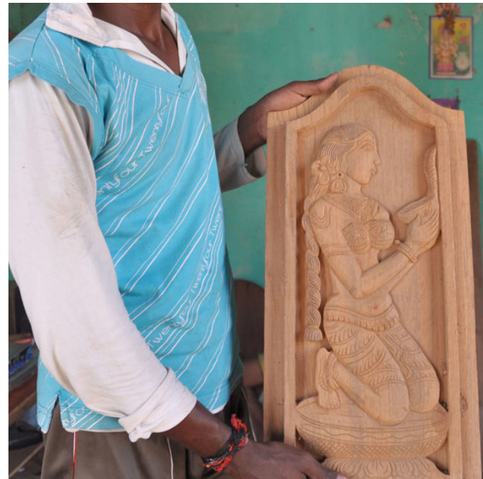
Artisan showing a carved piece.

http://www.dsource.in/resource/karaikudi-wood-carvings/introduction