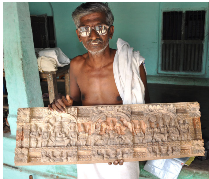
A final intricately carved piece of woods.