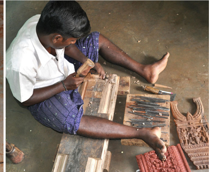
Artisans use various shapes and sizes of chisel to carve the wood.