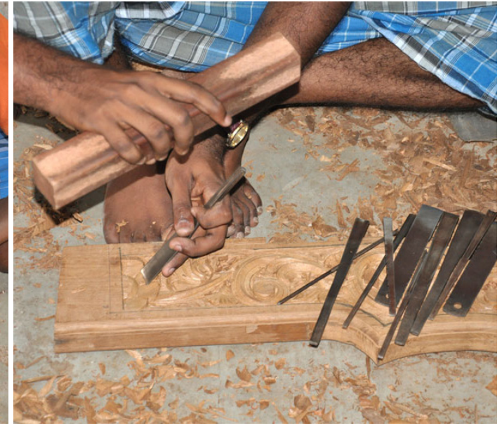
A special wooden hammer is used to carve the wood. These are made by the artisans themselves.