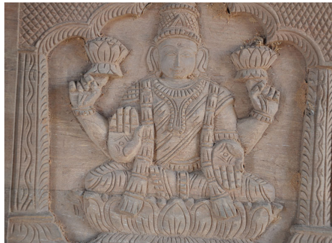
Detailed view of a carving.