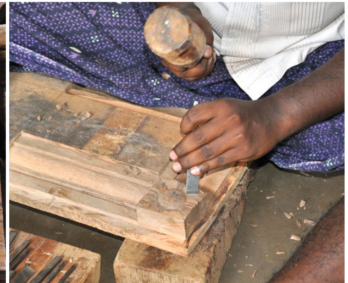
Carver/ artist starts the second round of carving for giving details to the planned motif.