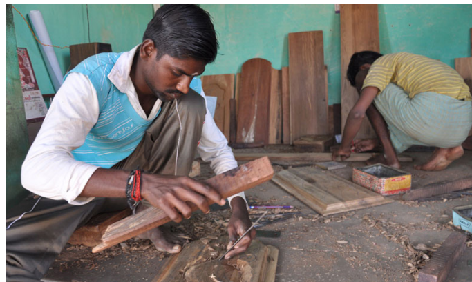
Mainly the family members are involved in the process.