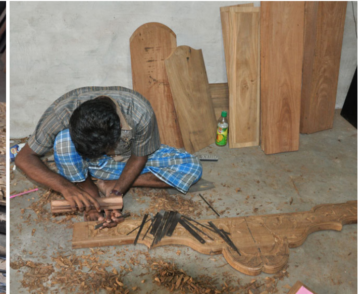
Artisans carving the intricate details.