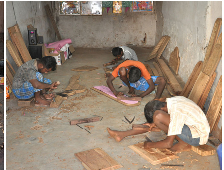
Wood is procured from the market and seasoned before it is used for carving.