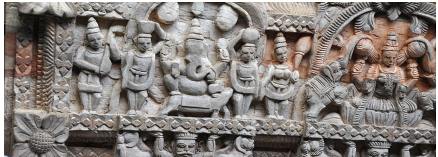
Intricate carving done on a wood plate.