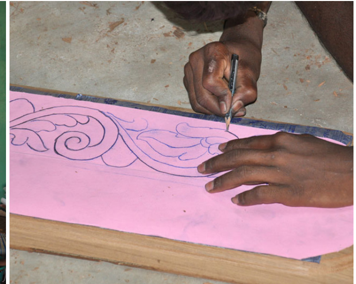
The tracing paper is kept on the wood plate and designs are traced on the surface.