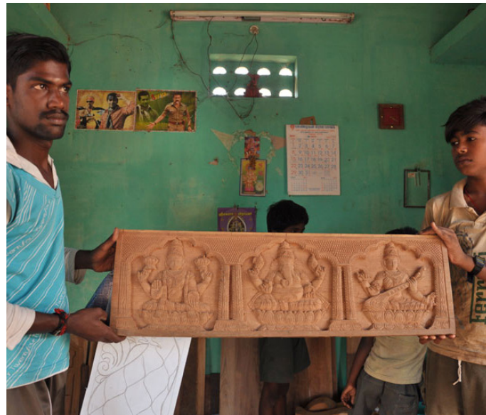
Artisan showing a beautifully carved piece of wood showcasing goddess Lakshmi, Saraswati and Lord Ganesha.

During the ancient days, the Chettinad wood craft was often acknowledged for its magnificent and metaphorical 'Chettinad Nilai' (wooden door frames), which elegantly graced the main entrances of the heritage buildings. Karaikudi is well-known for its treasured 'Surya Pallakai', consisting of exquisite and intricate carvings of images, especially of Gajalakshmi, the Goddess of wealth, and a Kalasam (small pot) with coconut and sprouting mango leaves, embellishing the center of the Nilai, which is the first thing any visitor would worship on entering a Chettinad house. The 'Nilai' is crafted by the 'Aasaris' (carpenters) who produce delicately carved sculptures, statuettes and artifacts. Carvings of miniature birds and floral patterns which were less than an inch took a year or two to complete due to the intricate work. Creative workmanship was found in making of the 'Vahanas' (vehicles to gods) and 'Vellerukku Ganesha' (root of a medicinal plant), which were carved by another group of artisans near Pillayarpatti' temple.