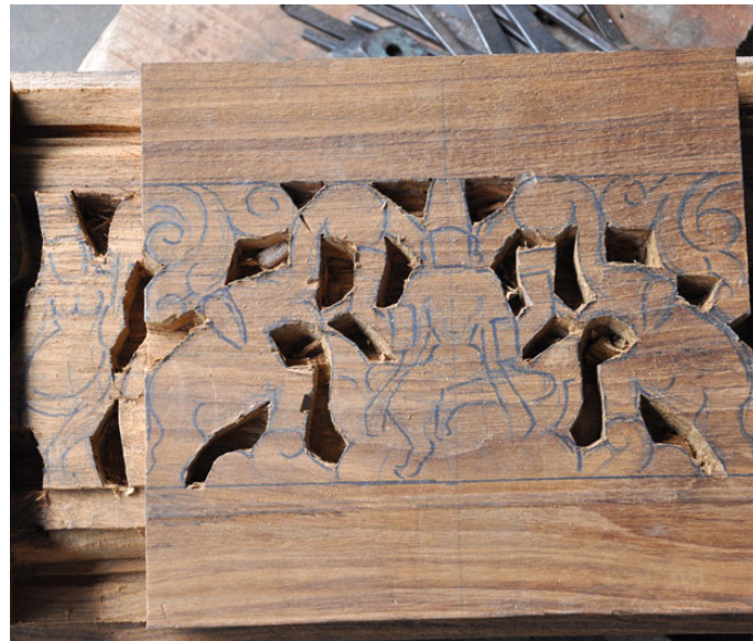
Wood after the initial carving. Thereafter again the sketching is done to mark the details.