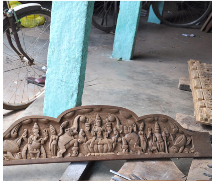
Wooden plate after detail carving has been done. Face is carved at the end.

http://www.dsource.in/resource/karaikudi-wood-carvings/making-process