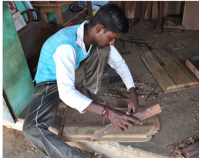
Various tools which are made by the artisans manually are used while carving.