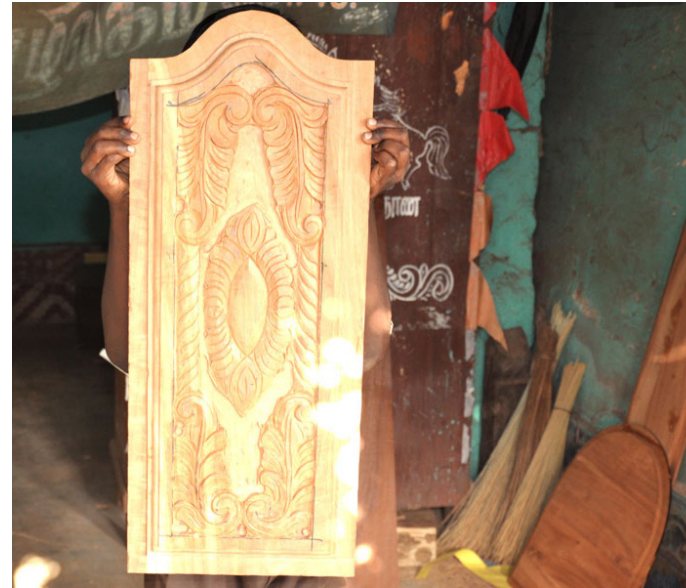
A piece carved to be used in doors.

http://www.dsource.in/resource/karaikudi-wood-carvings/products