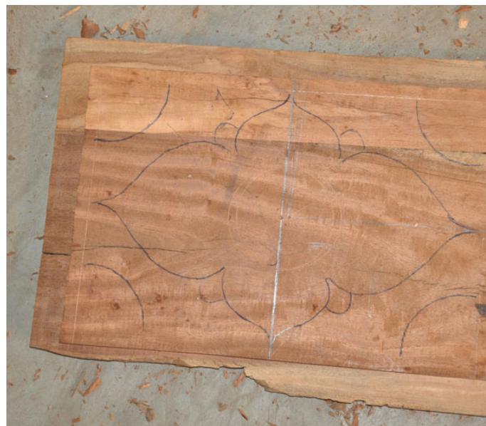
Rough sketch of the design.