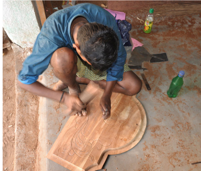
Carving starts by removing the extra wood.

http://www.dsource.in/resource/karaikudi-wood-carvings/making-process