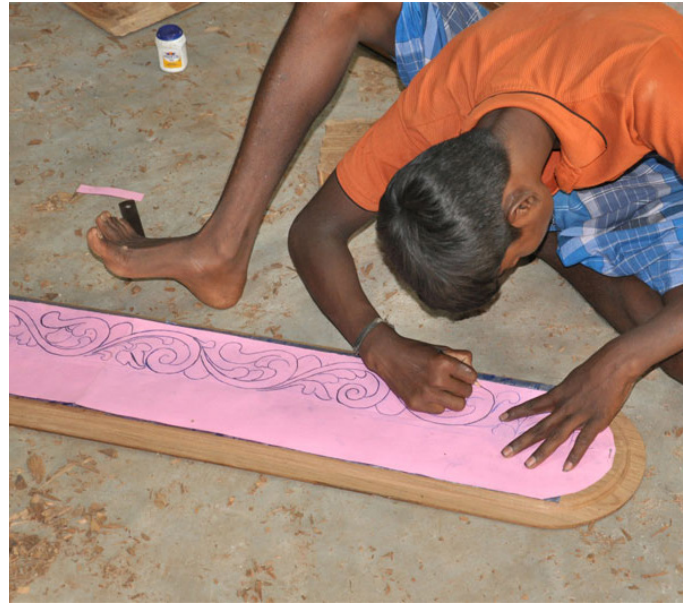
Carvers/ artisan use paper to trace the designs on the wood.

http://www.dsource.in/resource/karaikudi-wood-carvings/tools-and-raw-materials