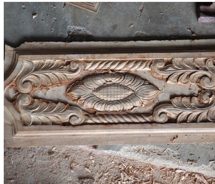
Intricately carved floral motif to be used on windows.