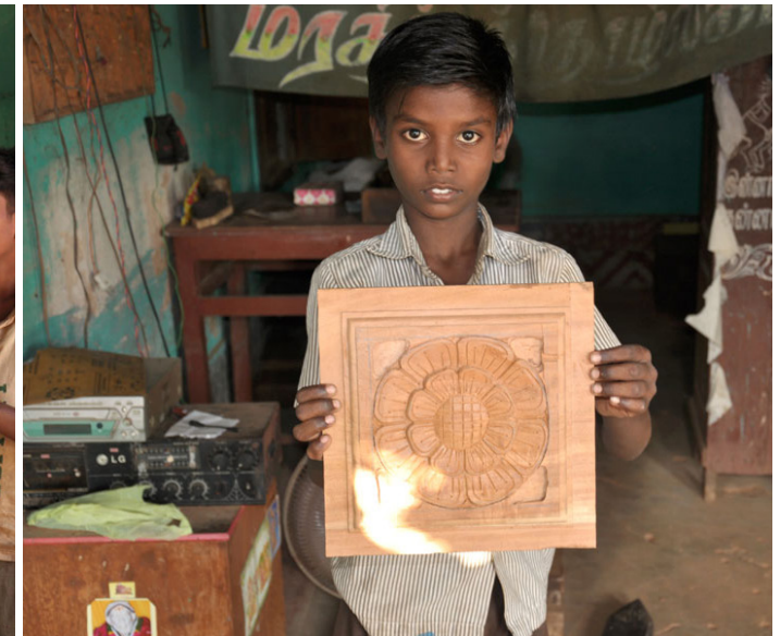
A wooden tile of floral motif on it.