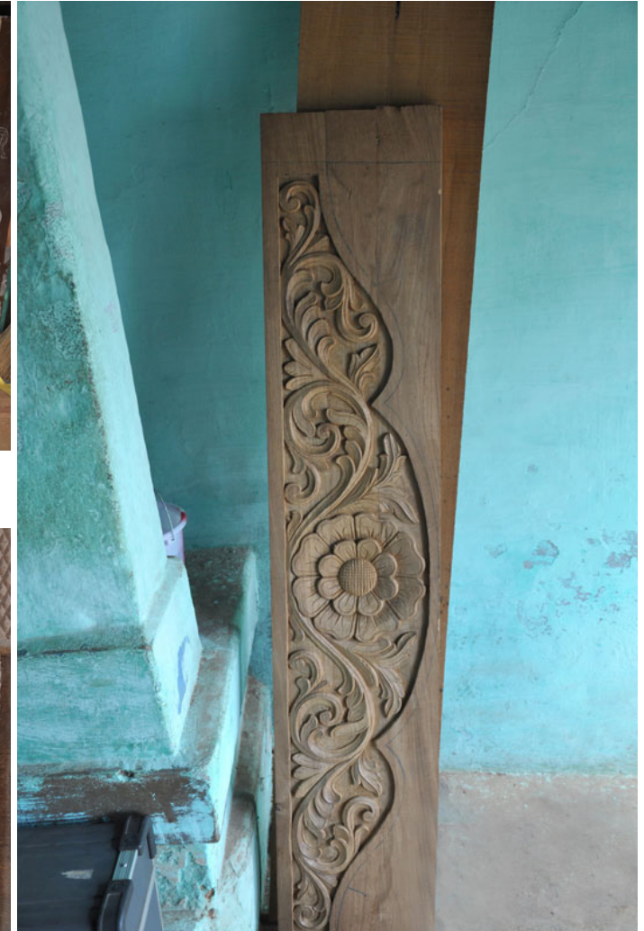
A carved wood mainly used on the top of the door or entrance.