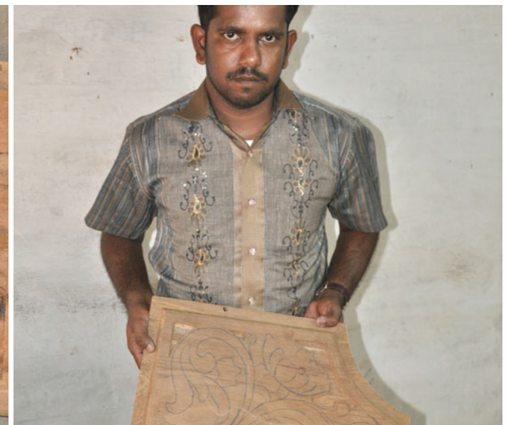
Gradually the intricate motifs are made on the wood surface.