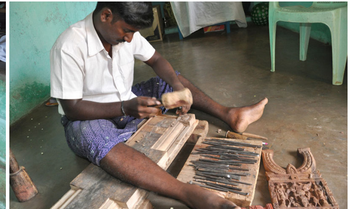
Artisans work in small workshop inside their houses. vibrant hues.