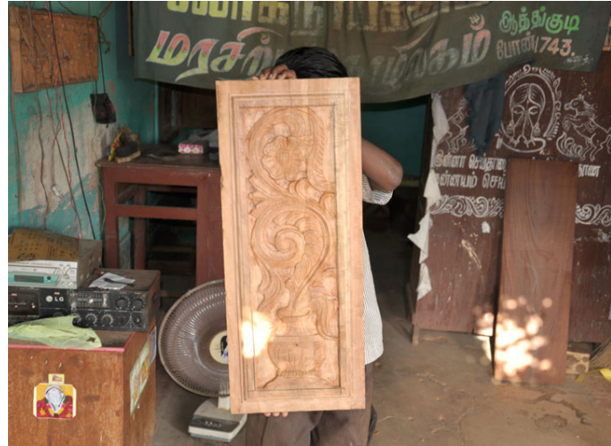
These patterns are today used for making doors and other wooden products.

http://www.dsource.in/resource/karaikudi-wood-carvings/products