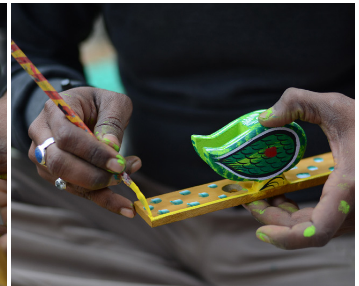
Making border to the plank.