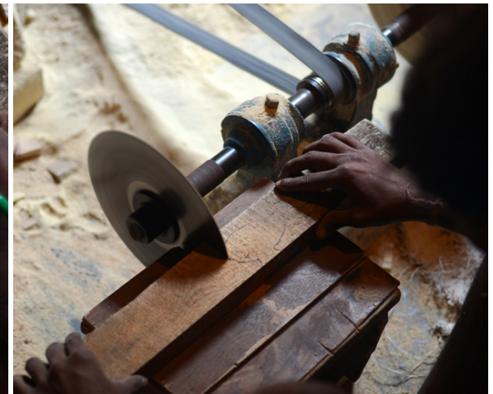
Sliced into individual units using a cutting blade.