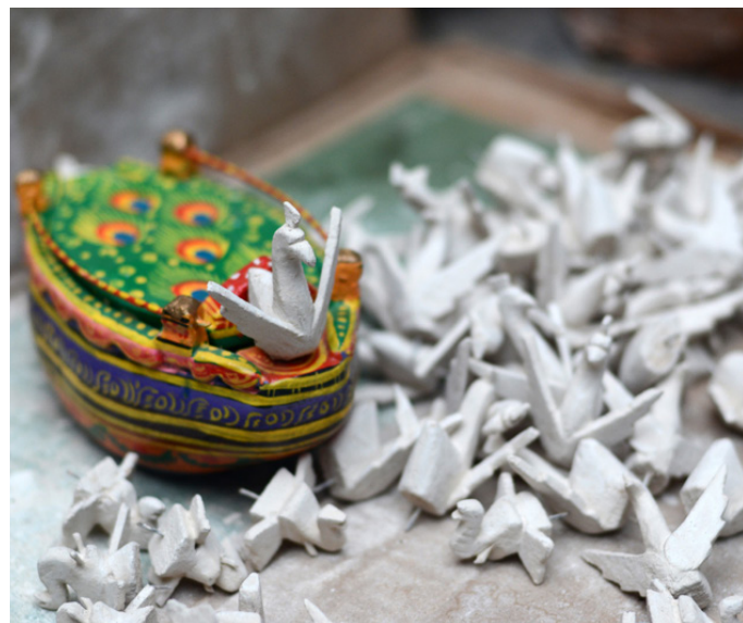
Peacock body on a painted boat.