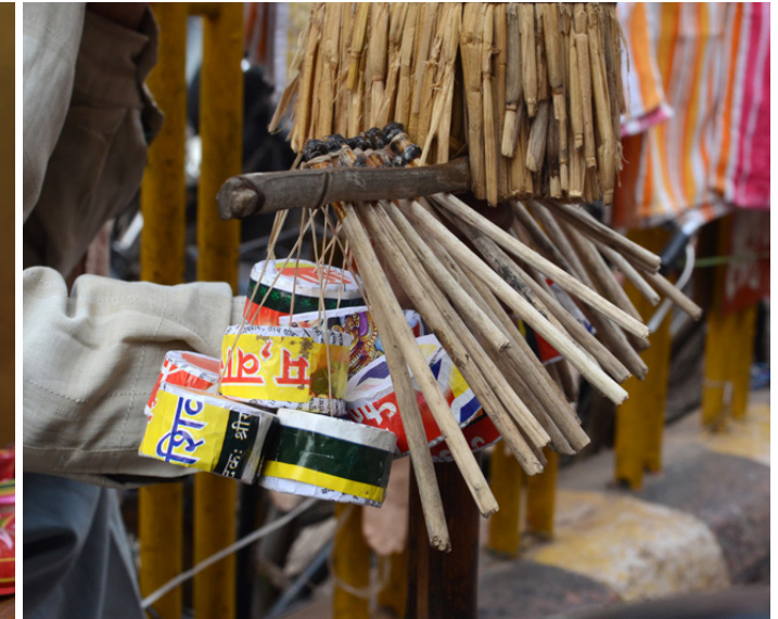
A very local toy which makes noise, being sold by a hawkker.