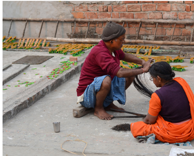
Elderly involved in lighters tasks.