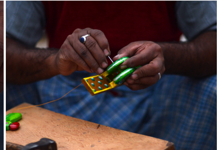
Passing a nail through drilled hole in front of the torso.