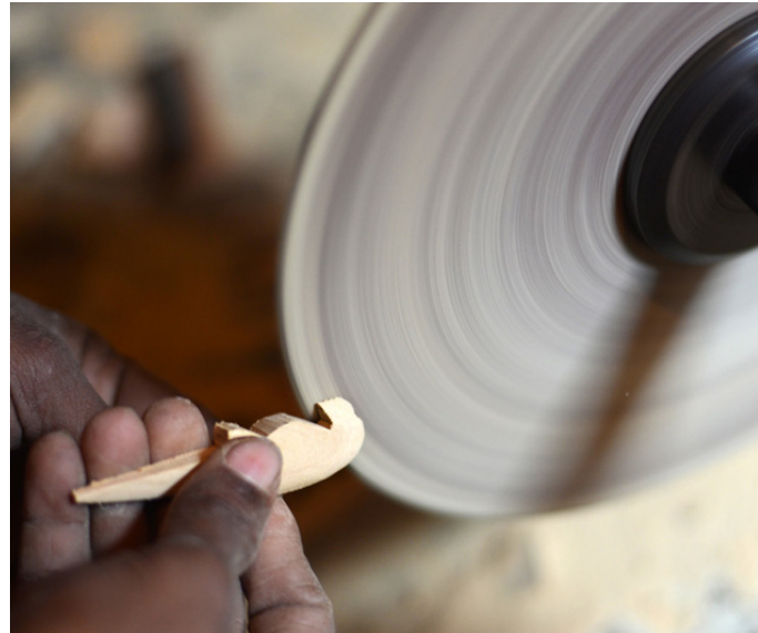
Filing the parrot.

http://www.dsource.in/resource/making-parrot-toy/process/cutting-and-filing