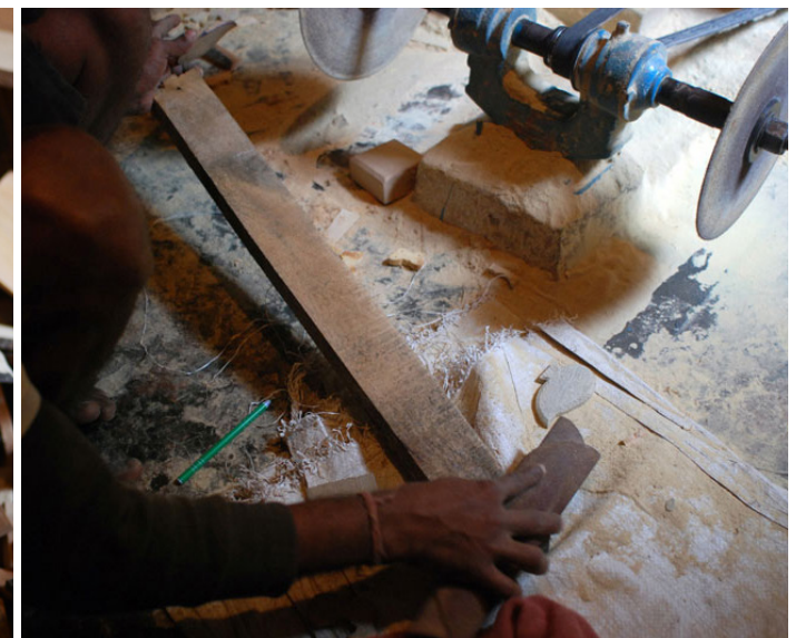
Cleaning with sand paper to remove splinters.