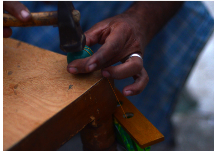
Fixing the nail with a hammer.

http://www.dsource.in/resource/making-parrot-toy/process/assembling-parrot