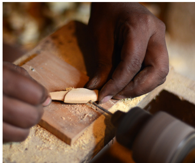
Drilling hole in parrot.