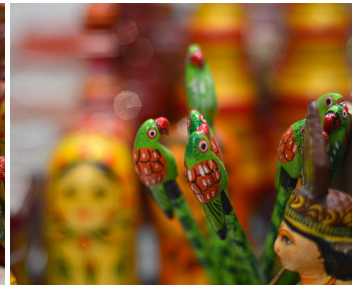
Wooden parrot pencils on display in a shop.