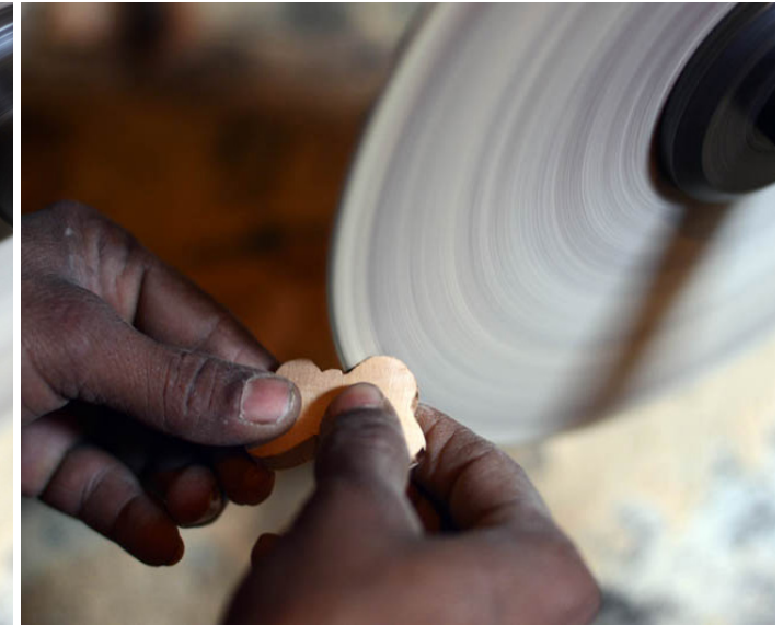
Filing the Butterfly.