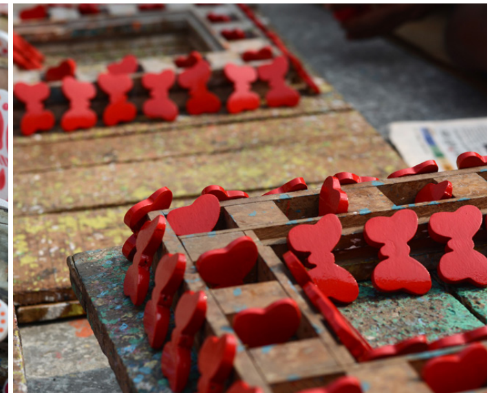
Butterflies are painted red.