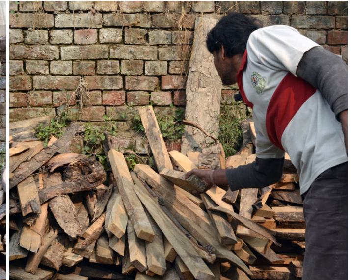
Selecting the appropriate size and shape of wood.