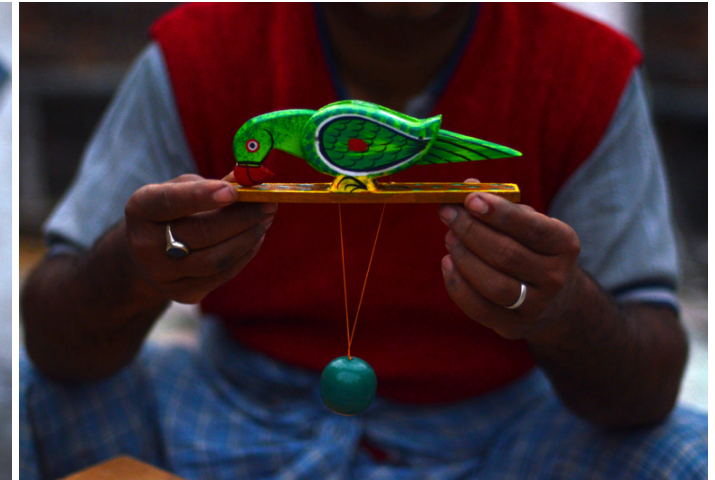
Ball hangs as a pendulum to oscillate and create movement in head and tail.