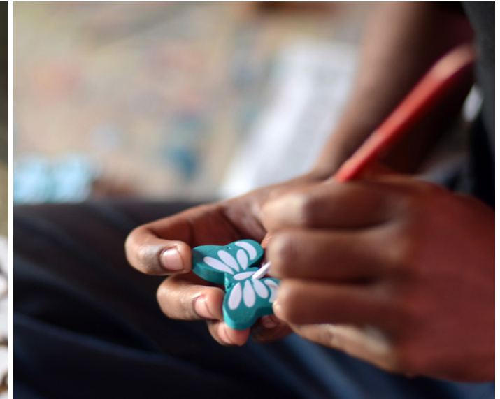
A few with patterns.