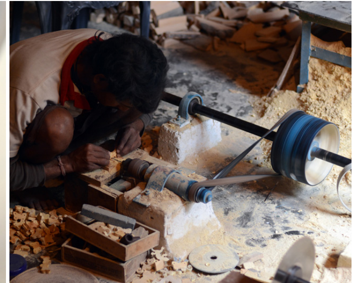
Drilling parrot and butterflies.