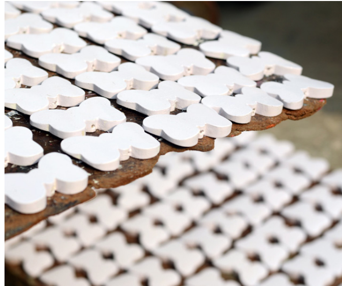
A set of butterflies painted white.

http://www.dsource.in/resource/making-parrot-toy/process/paint-workshops