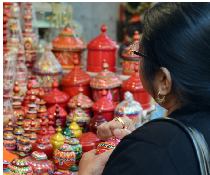
Woman at a stall buying 'Sindoore Dani', container to keep the red colour.