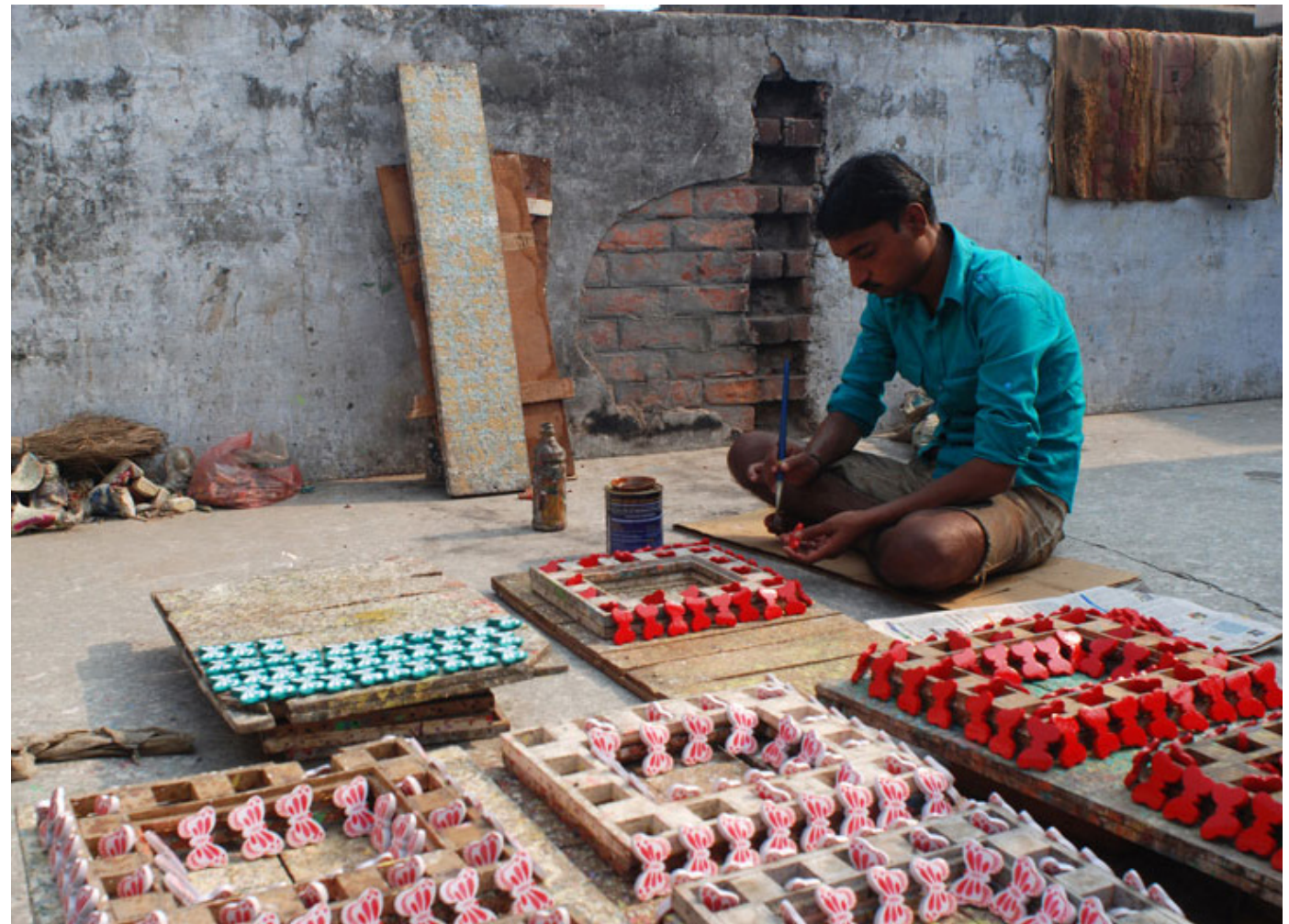
Craftsman painting on the terrace.

Once the parts of Parrot-Toy are assembled together, completed with painting and varnishing of the products; the finished toys and accessories reaches the retailers and wholesalers, where these toys are assembled and small units are re-touched with paints, if any damage occurs. This retouching is done at the 'Paint workshops' which are near the Ghats of Varanasi.