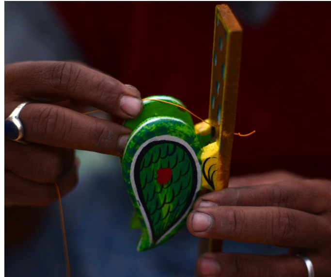
Passing out the other end of string through one hole of the base of torso unit.

http://www.dsource.in/resource/making-parrot-toy/process/assembling-parrot