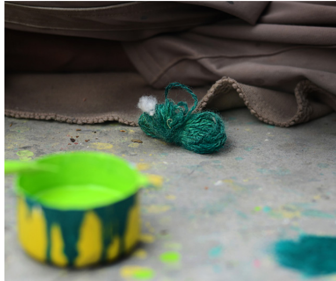
Wool is used for creating textures.

http://www.dsource.in/resource/making-parrot-toy/process/painting-parrot