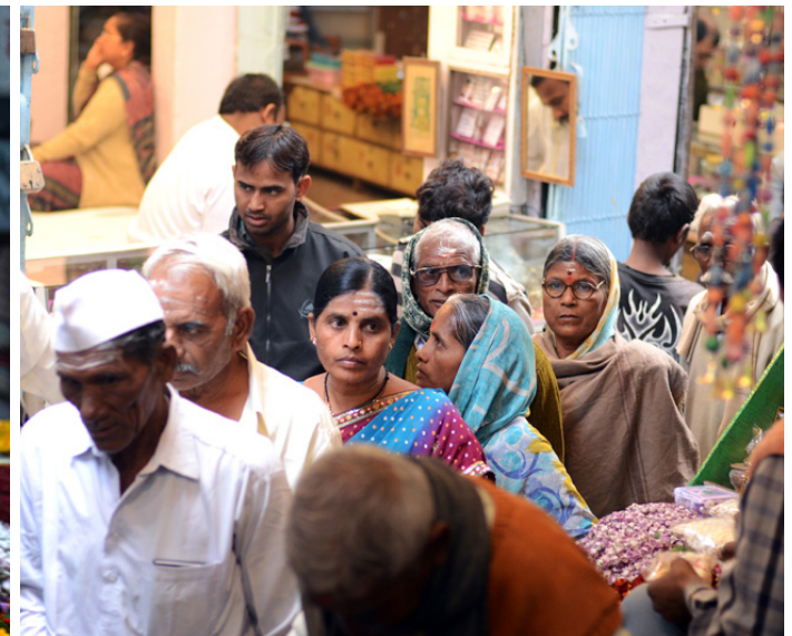
Devotees standing in a queue to the temple.