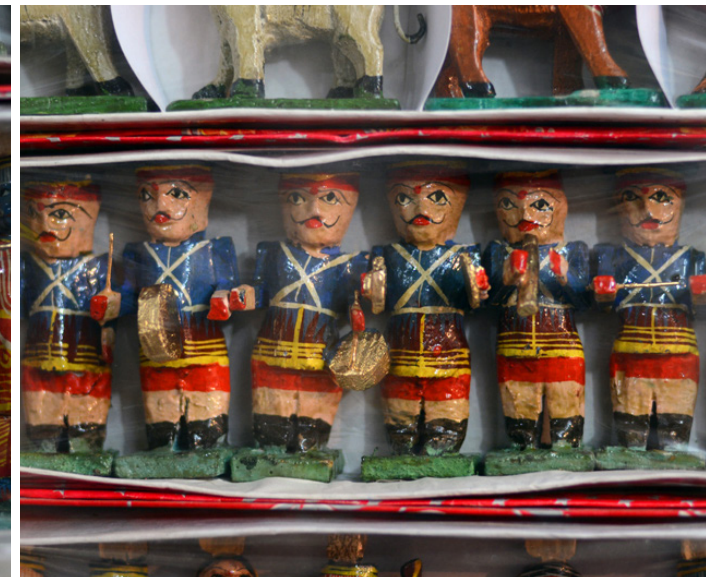
Set of contemporary orchestra.