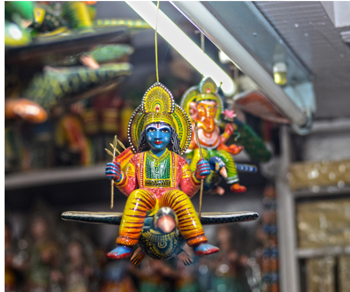
Mythological figure of flying Gods.

http://www.dsource.in/resource/making-parrot-toy/place