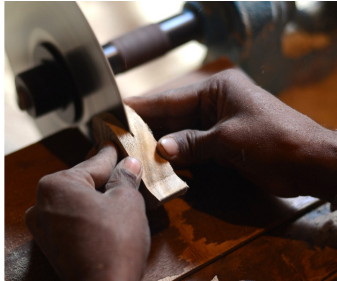
Slicing each block into two halves.

http://www.dsource.in/resource/making-parrot-toy/process/cutting-and-filing