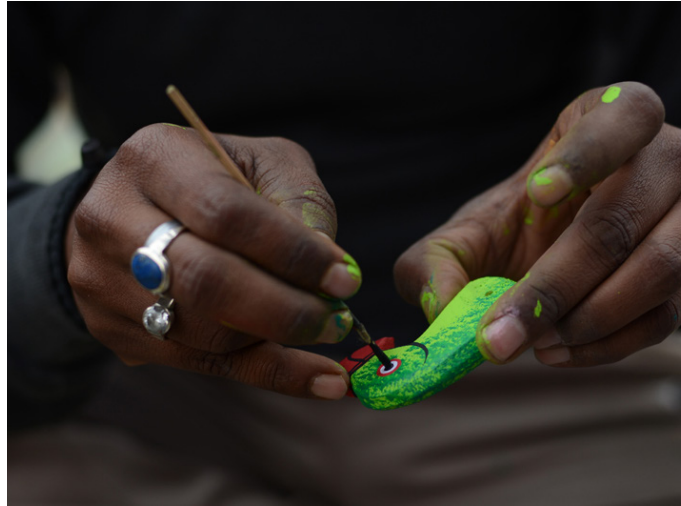
Painting black concentric over white circle.

http://www.dsource.in/resource/making-parrot-toy/process/painting-parrot