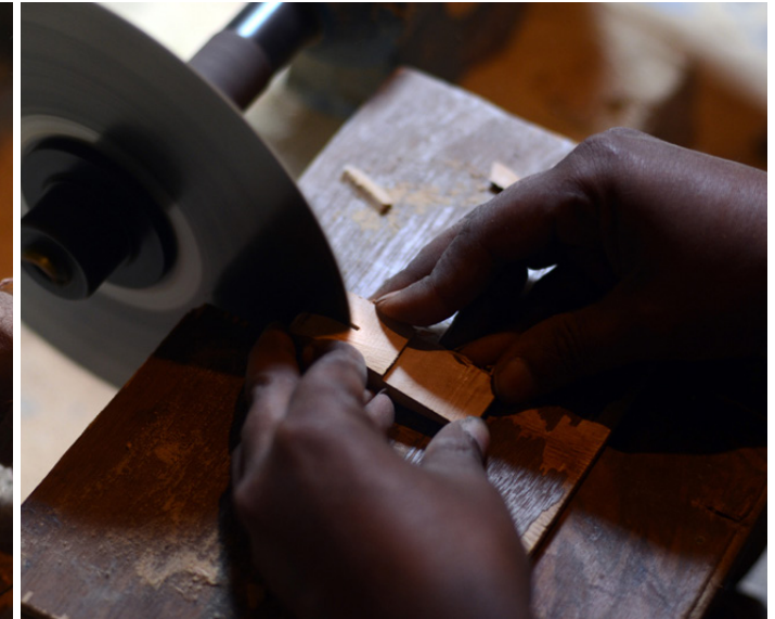
Slicing the block into two halves.