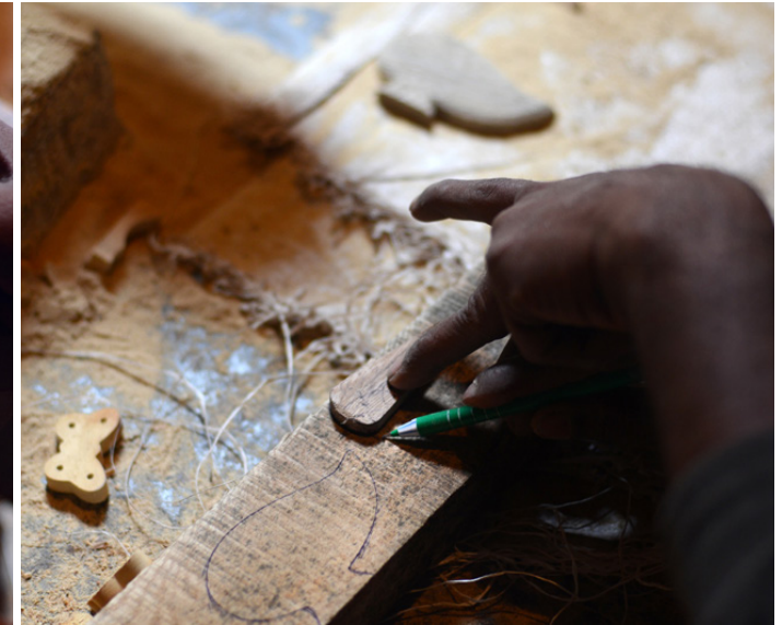
Stencils being used for cutting marks.