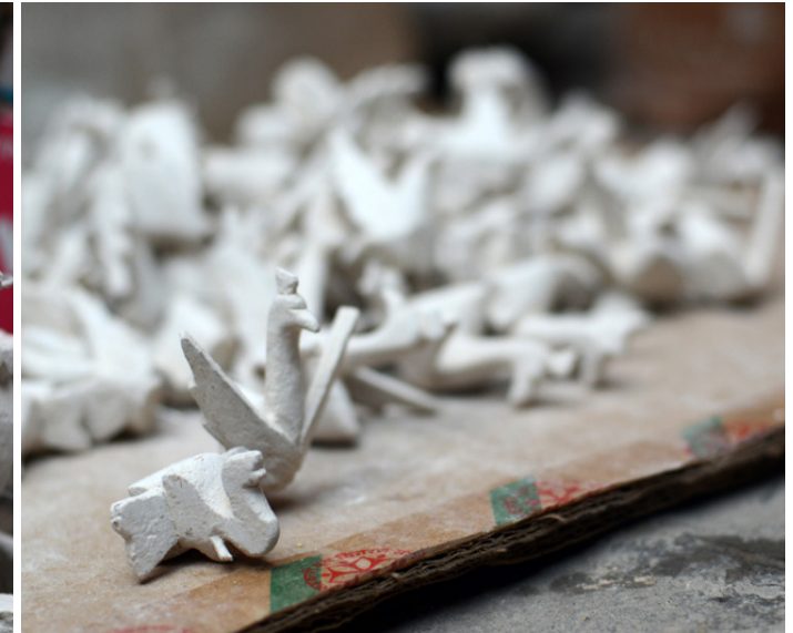
Peacock and elephant heads, unpainted.