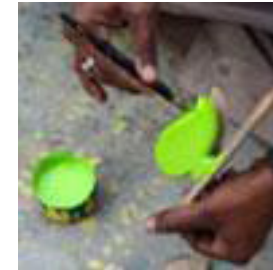
Painting of the Parrot