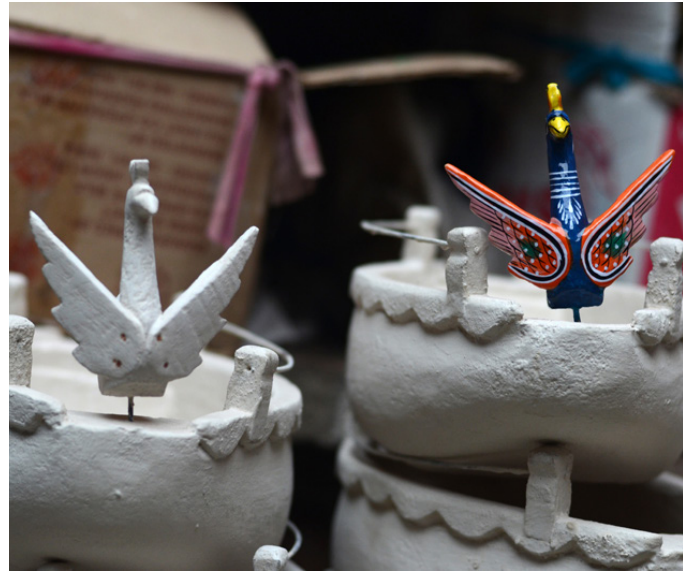
Animal head at one end on the boat.

http://www.dsource.in/resource/making-parrot-toy/people