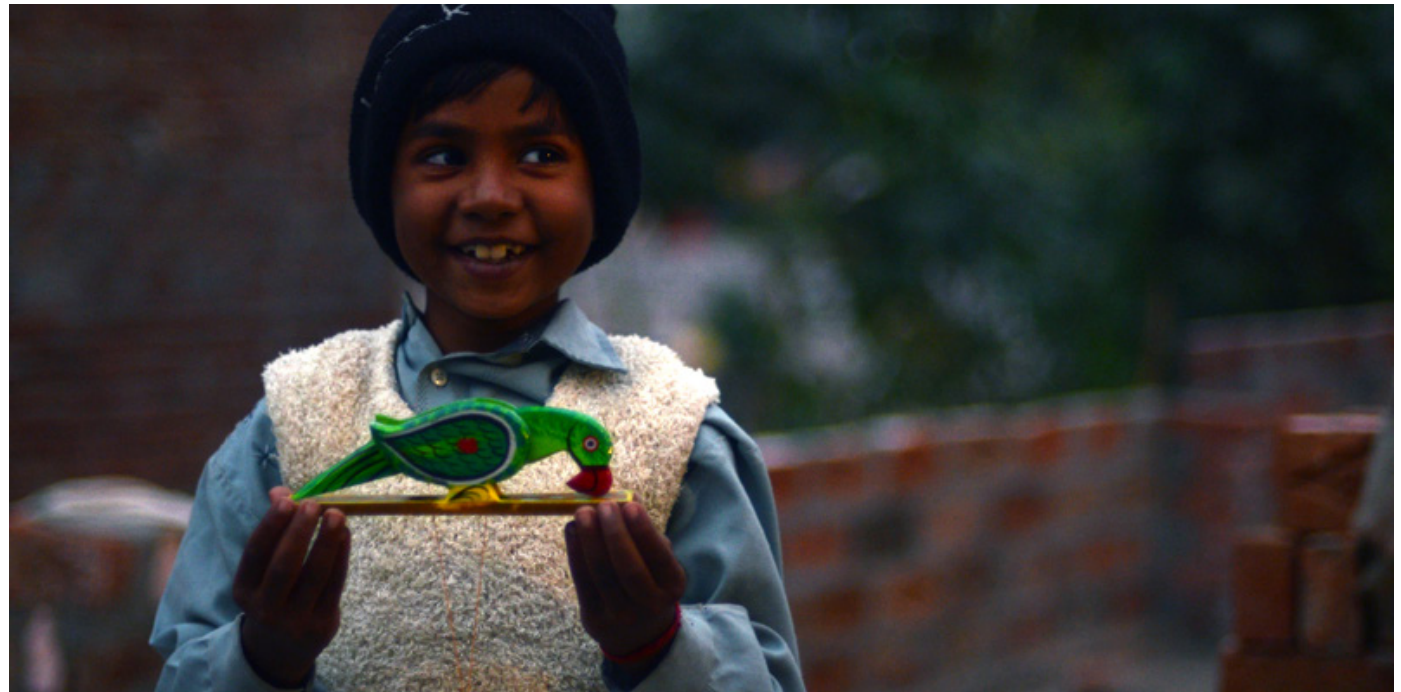
A boy with wooden parrot.