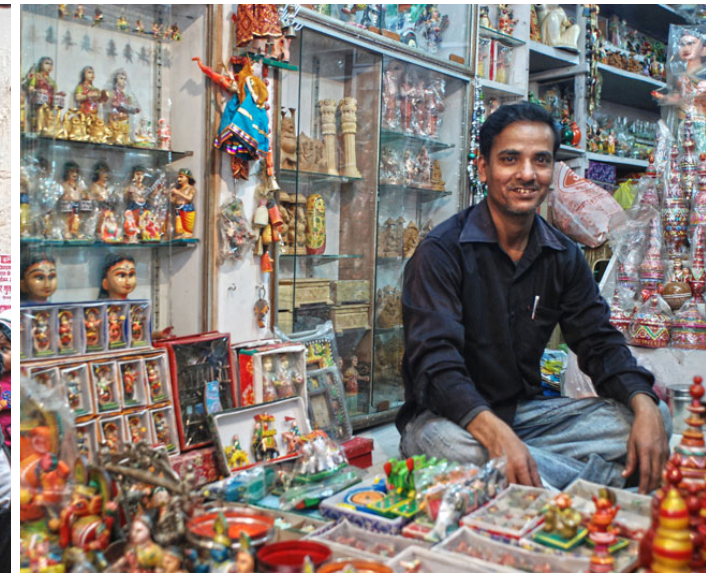
One of the shop in temple street bustling with beautiful colourful wooden toys.