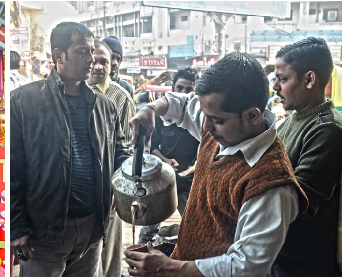
Early morning tea, served in clay cups called 'Kulhad'.