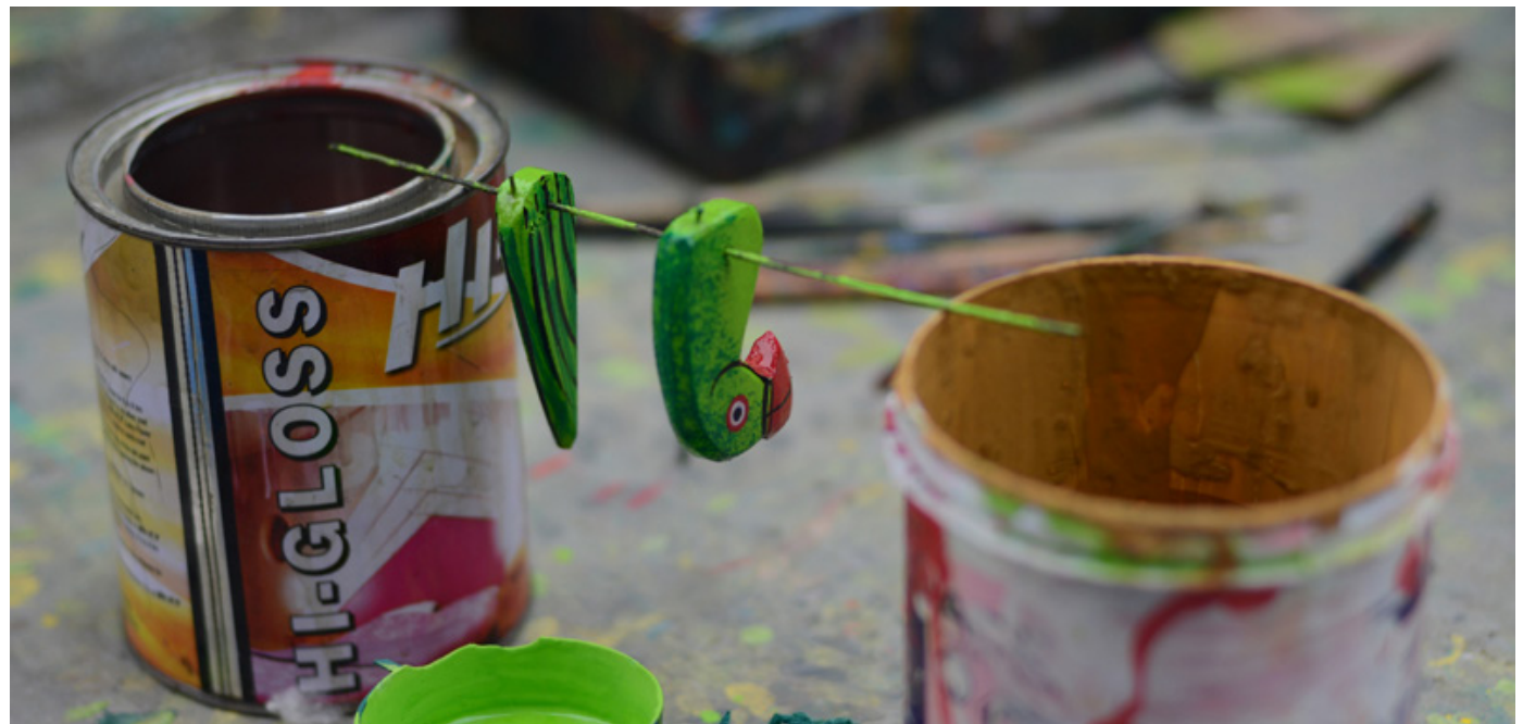
Left for drying.