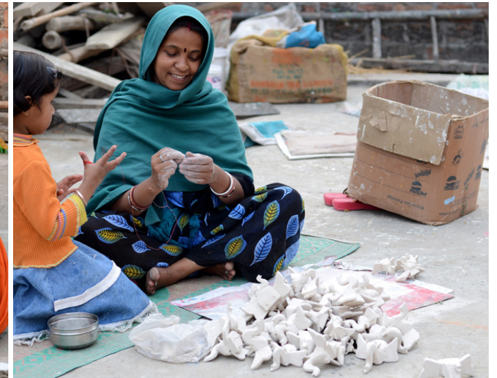
Mother and daughter.