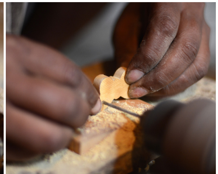
Drilling hole in butterfly.