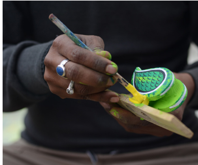
Painting yellow for claws.

http://www.dsource.in/resource/making-parrot-toy/process/painting-parrot