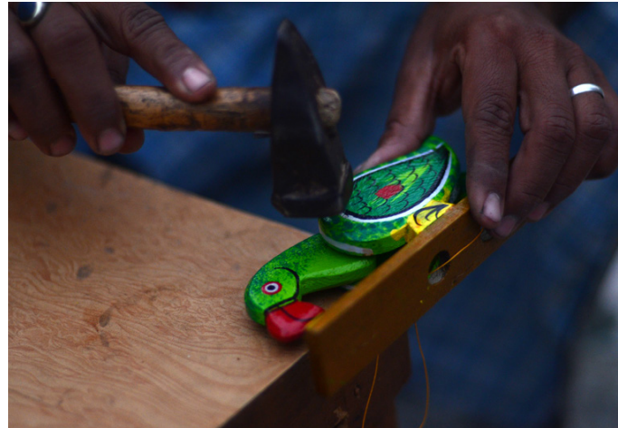
Fixing the nail firmly onto the un-drilled torso wall.

http://www.dsource.in/resource/making-parrot-toy/process/assembling-parrot