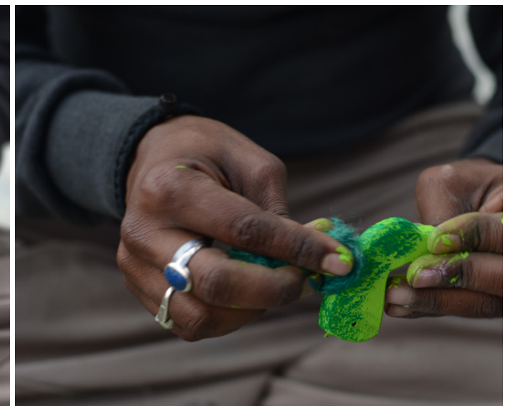
Creating texture on head.