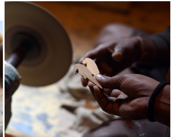
Passing sliced wood to file.