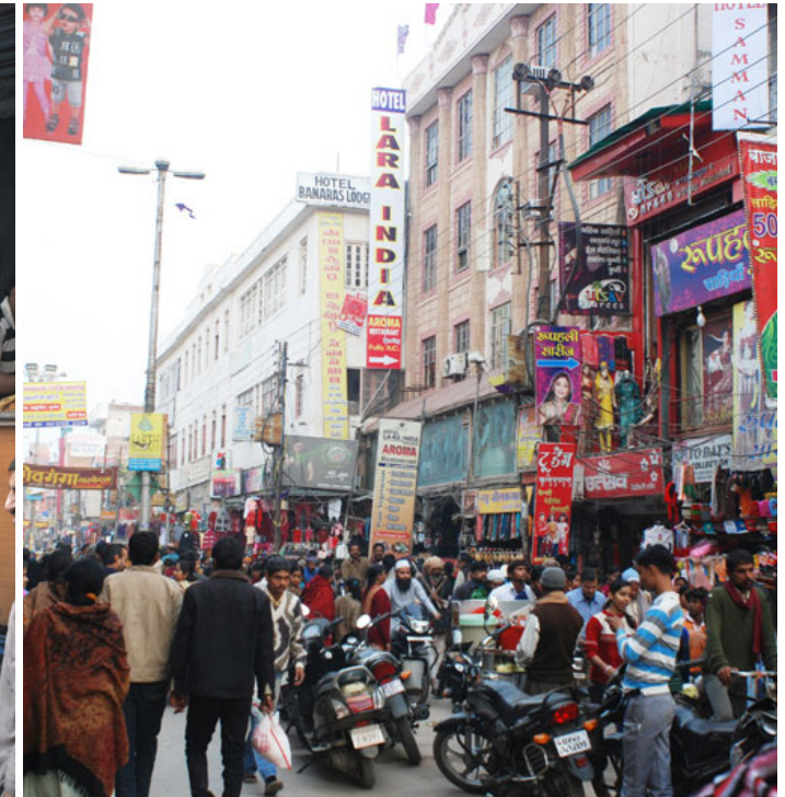
Food joints on road sides on busy streets of Gadauliya.