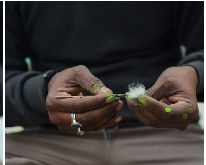
Making a cotton bud by wrapping cotton at the tip of a stick.