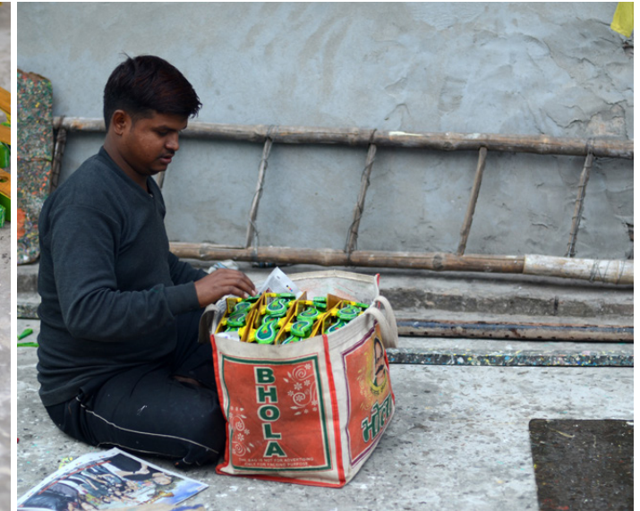
Collecting all dismantled parts of parrot in a sack.