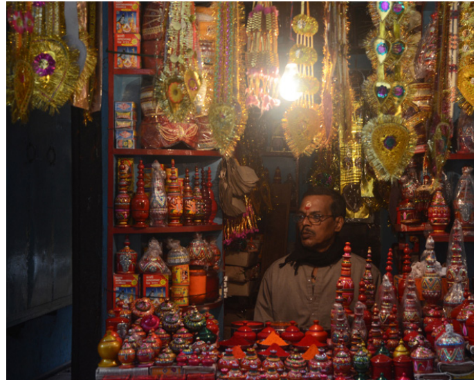
Shops specifically selling wedding articles, like garlands of currency note and Holy red colour, generally used in Hindu custom by married women.

http://www.dsource.in/resource/making-parrot-toy/place