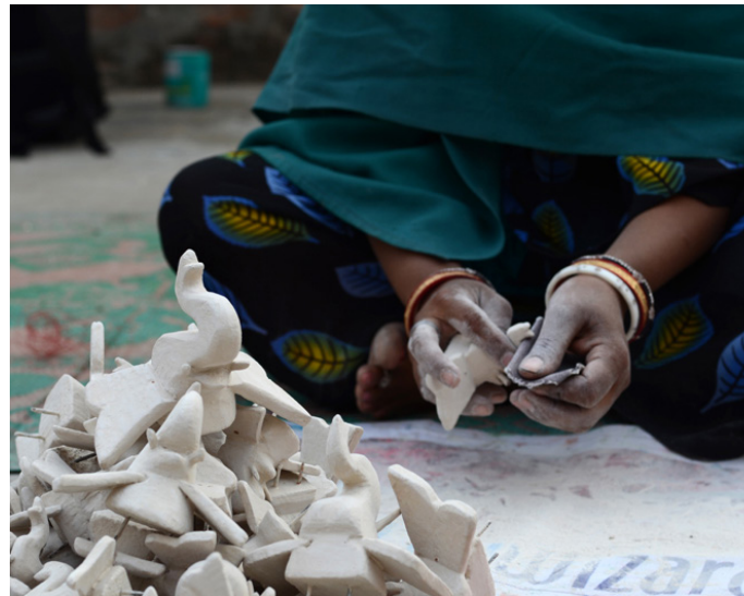
Lady dealing with filing work of animal heads.