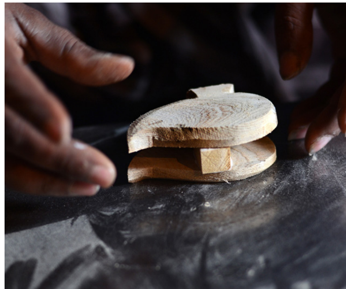
Pasting the other part of torso.