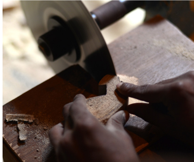
Shaping the head.

http://www.dsource.in/resource/making-parrot-toy/process/cutting-and-filing