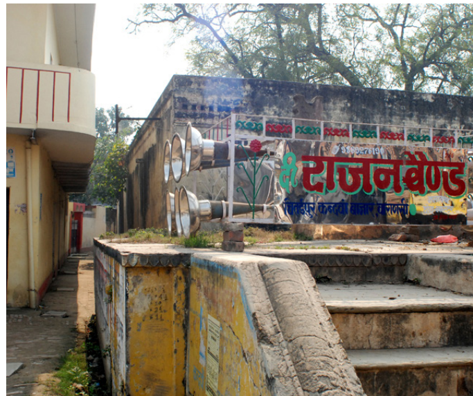
Entrance to Raju's house's street.