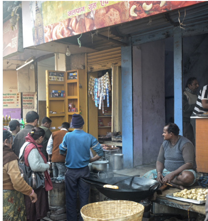
Food joints on road sides on busy streets of Gadauliya.

There are number of temples on the banks of Ganga. Dedicated to Lord Shiva, Kashi Vishwanath Temple is the most famous one. Situated in Gadauliya, near Dasaswamedh Ghat, it is also a tourist place where people come to rest in peace and feel the spirituality in the air.