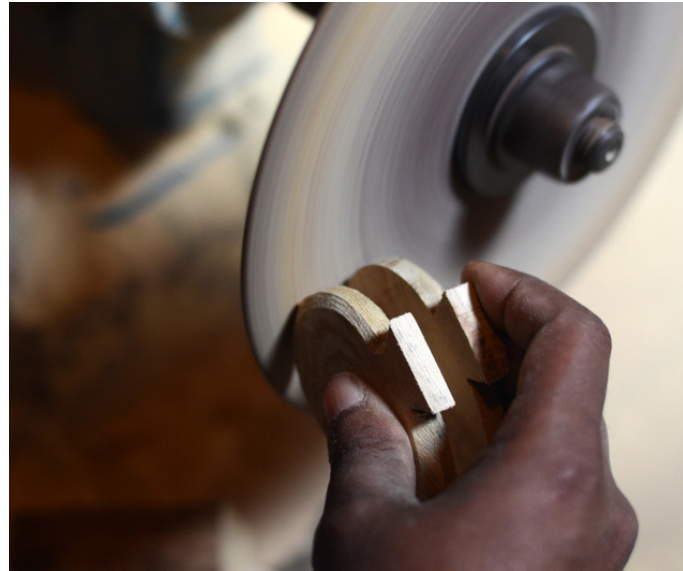
Filing the combined unit.

http://www.dsource.in/resource/making-parrot-toy/process/cutting-and-filing