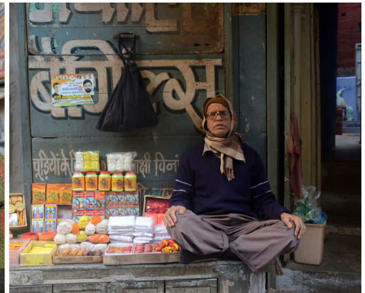
Stalls to sell articles for daily processions.