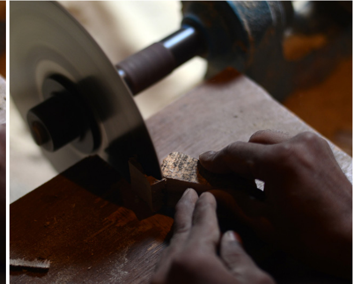
Shaping the tail.