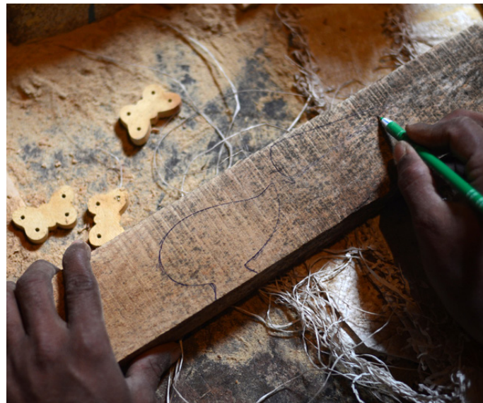
Visible cutting marks.