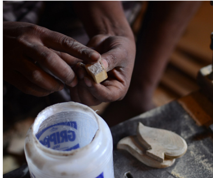
Applying glue to a small cuboid.