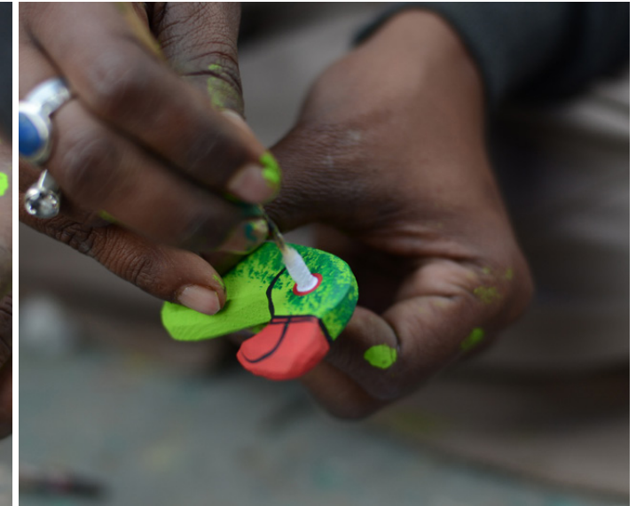
Painting white concentric over red circle.