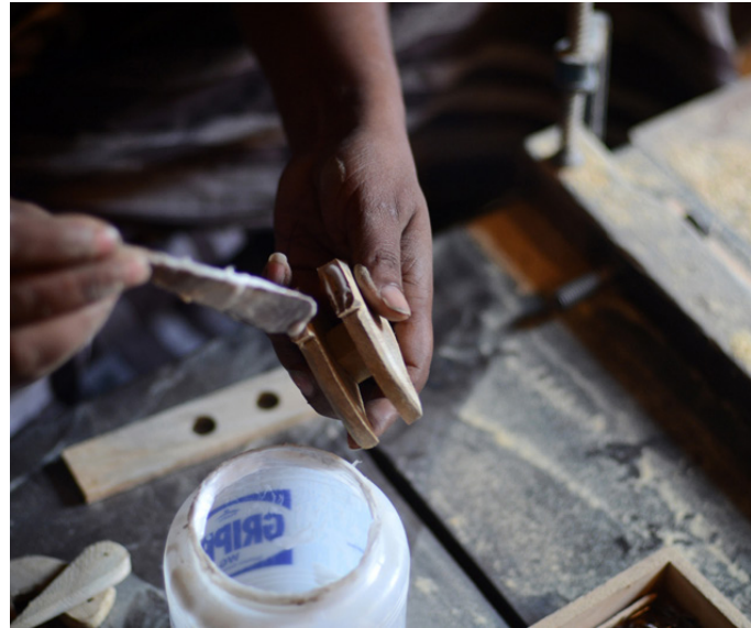
Applying glue to the base of torso unit.

http://www.dsource.in/resource/making-parrot-toy/process/cutting-and-filing