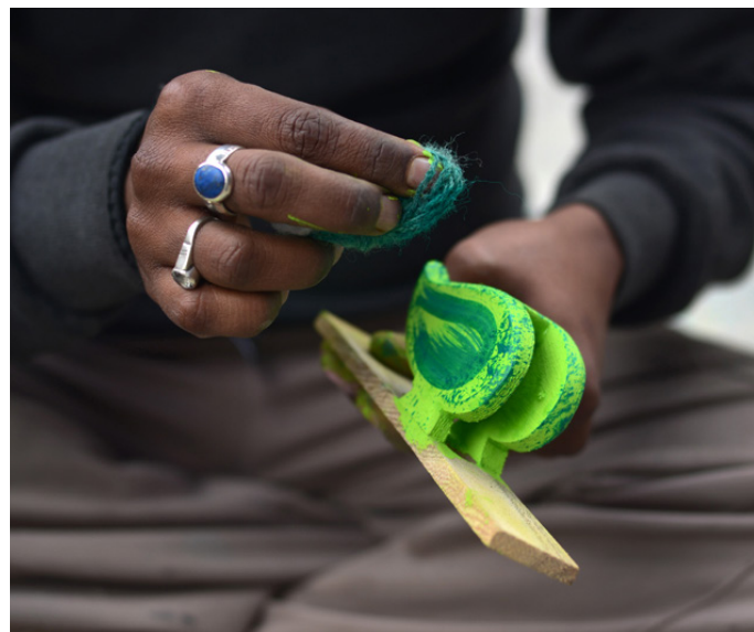
Creating texture on torso unit.