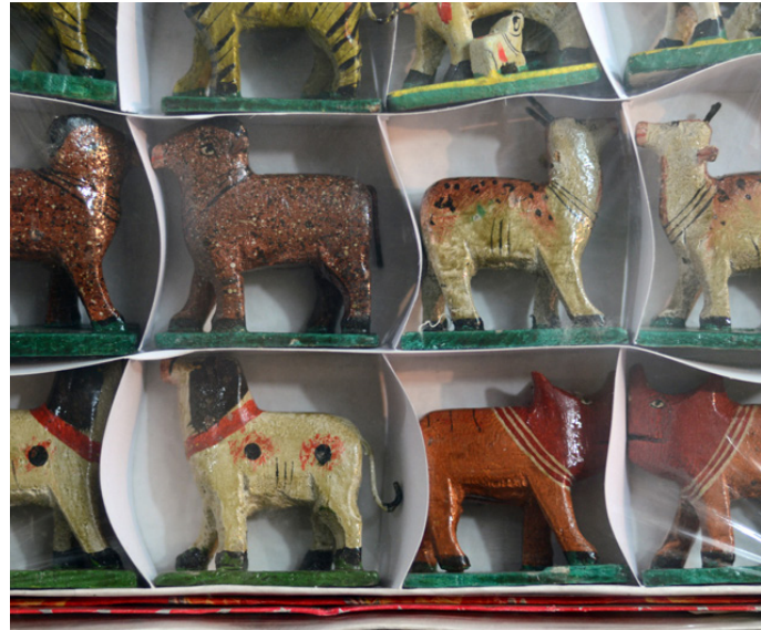
Set of animals.

http://www.dsource.in/resource/making-parrot-toy/place