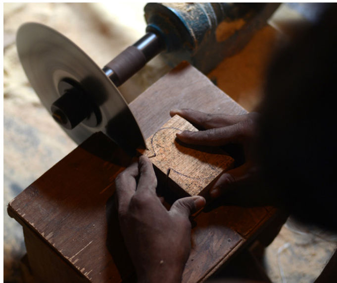
Shaping the torso.