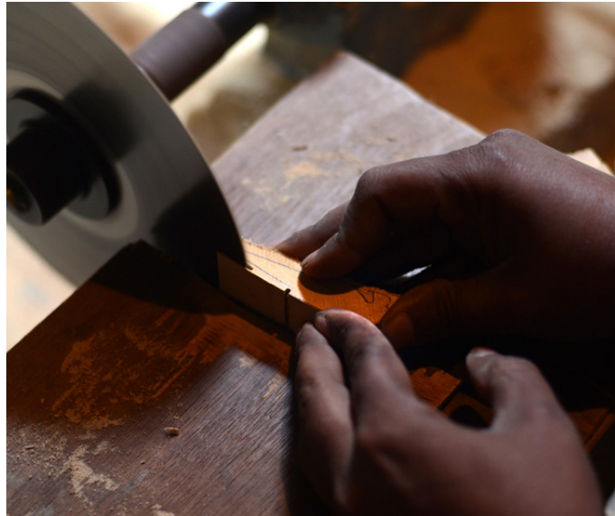
Cutting out the unwanted portion.

http://www.dsource.in/resource/making-parrot-toy/process/cutting-and-filing