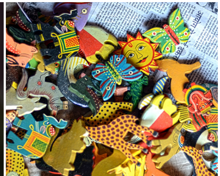
Different kinds of small animals, birds, mythological figures etc.