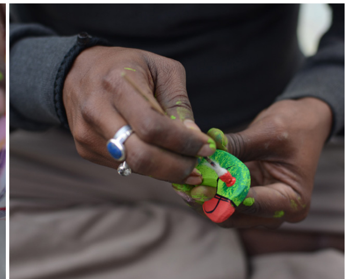
Making eye with red colour.