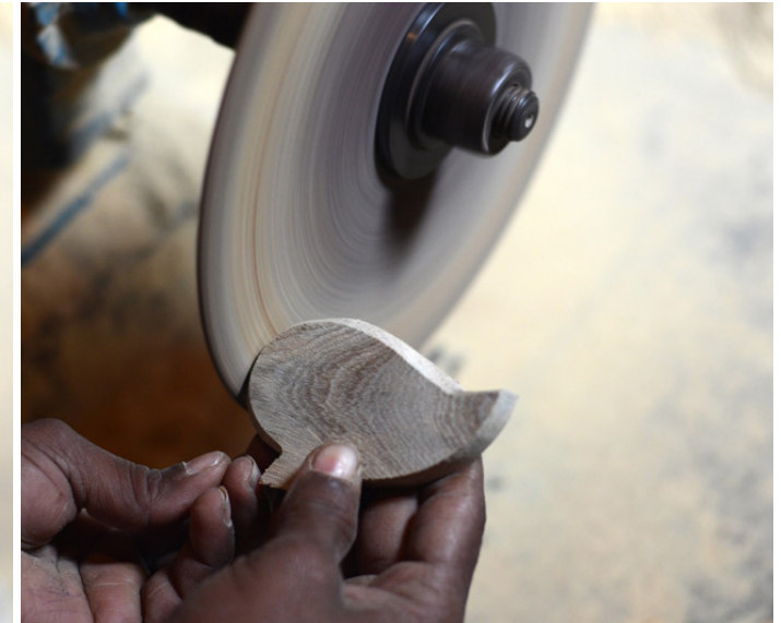
One side of finished torso.