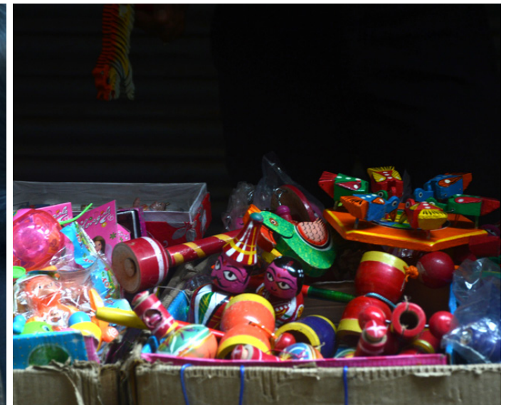
Wooden toys at a stall.