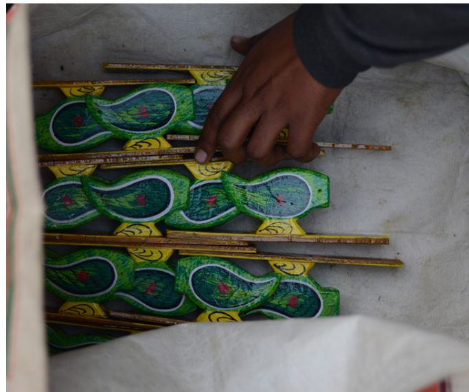
Stacking the torso unit in a sack.