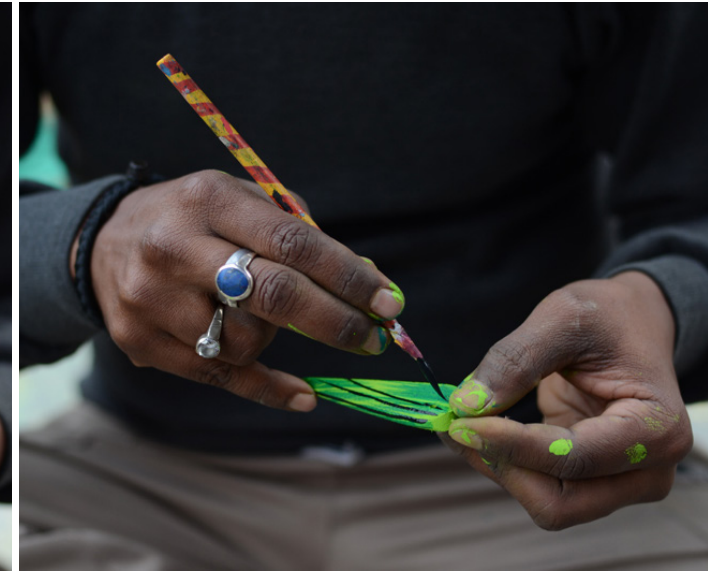
Detailing the tail.