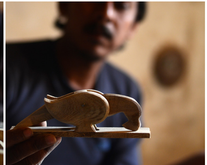
Unpainted wooden structure.