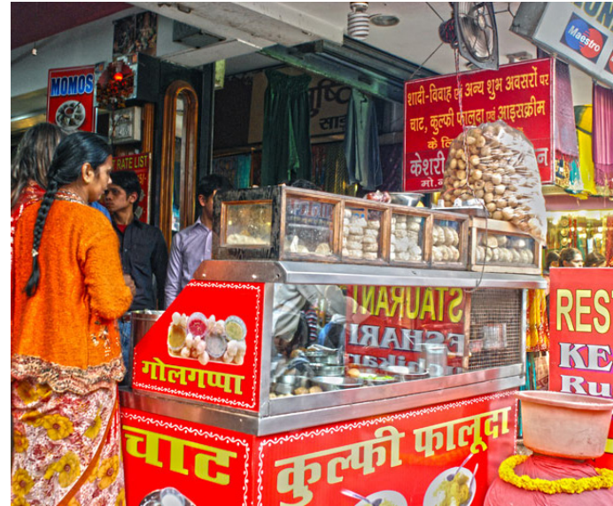
Food joints on road sides on busy streets of Gadauliya.

http://www.dsource.in/resource/making-parrot-toy/place