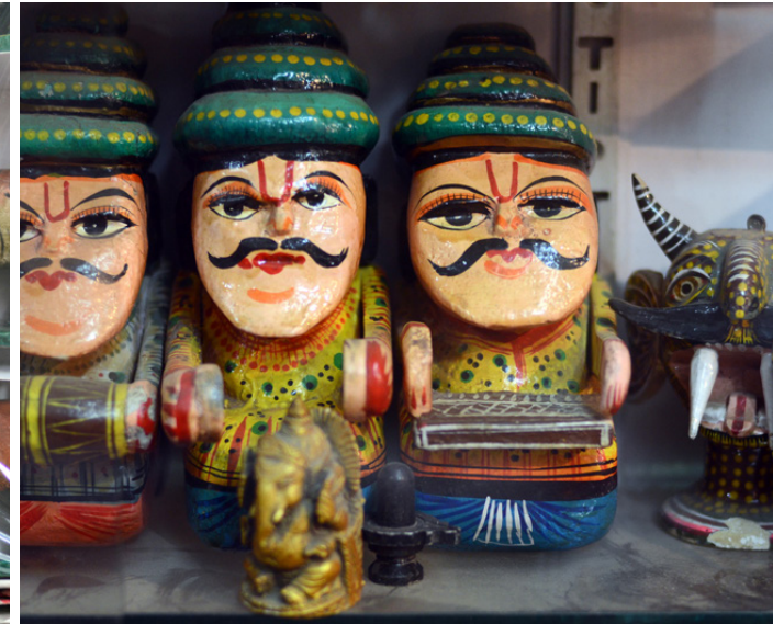
Set of local folk musicians.