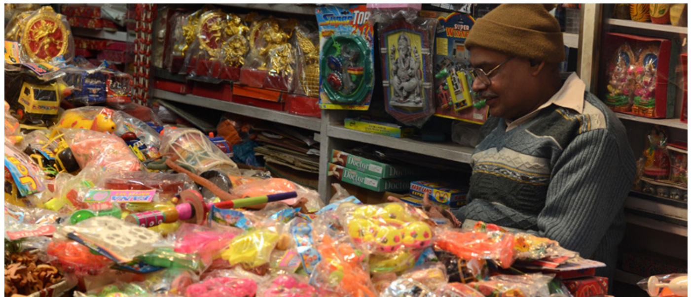
Shop selling traditional wooden toys and contemporary plastic toys.