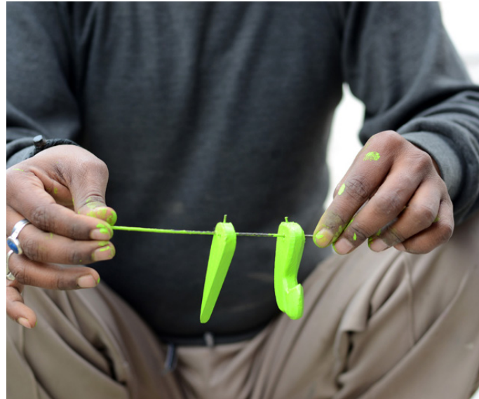
Head and tail being dried on a wire.

http://www.dsource.in/resource/making-parrot-toy/process/painting-parrot