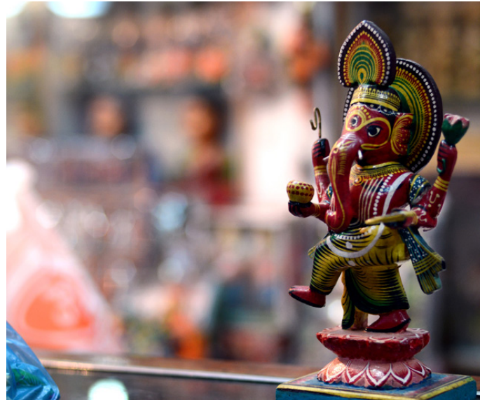
Lord Ganpati standing on one leg.

http://www.dsource.in/resource/making-parrot-toy/place