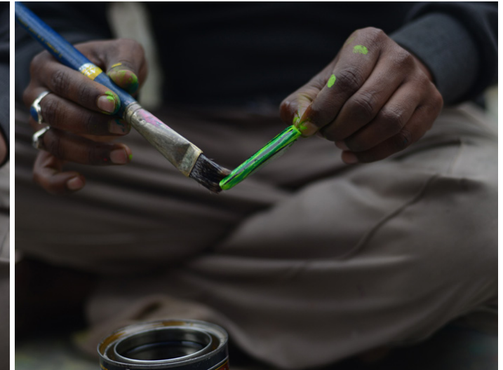
Varnishing the tail.