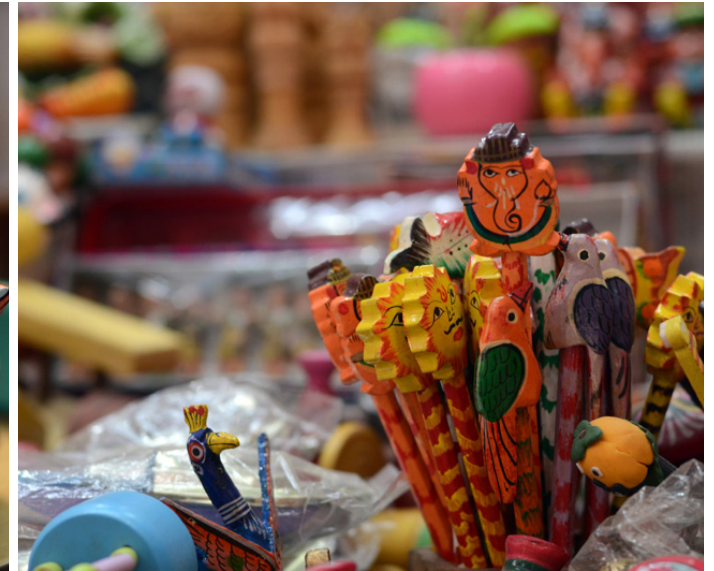
Decorated pencils with miniature figures at the ends.