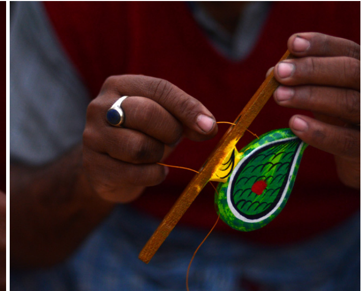
Passing the sting back in through second hole from the bottom of the base.