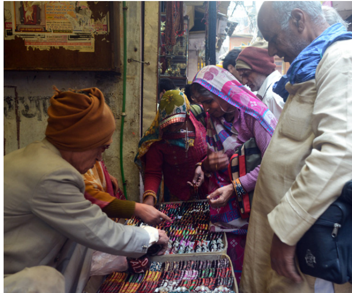
Women buying famous lacquer bangles at a stall.