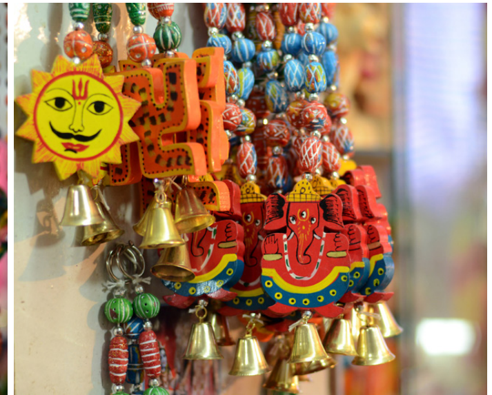
Wall hangings with different mythological symbols like sun, Ganesha and Swastika sign accompanied by brass bells.