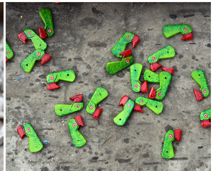
Parrots' head drying in shade.