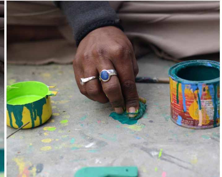
Soaking wool into green paint.