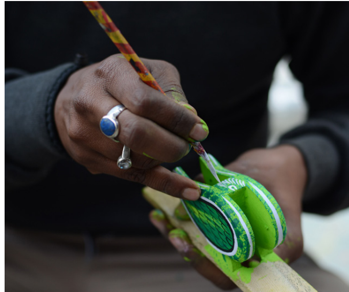
Decorating the top with motifs.

http://www.dsource.in/resource/making-parrot-toy/process/painting-parrot