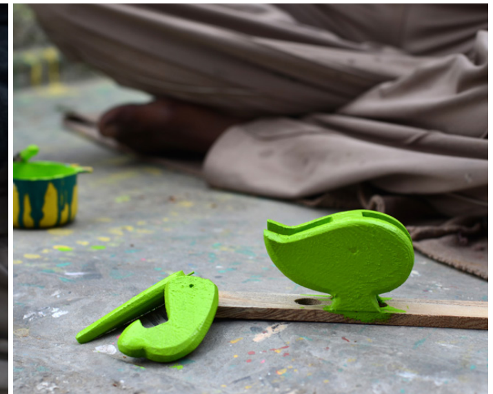
Left for drying.