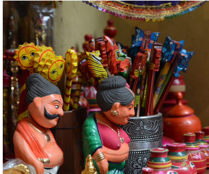
Display outside a shop.

http://www.dsource.in/resource/making-parrot-toy/place