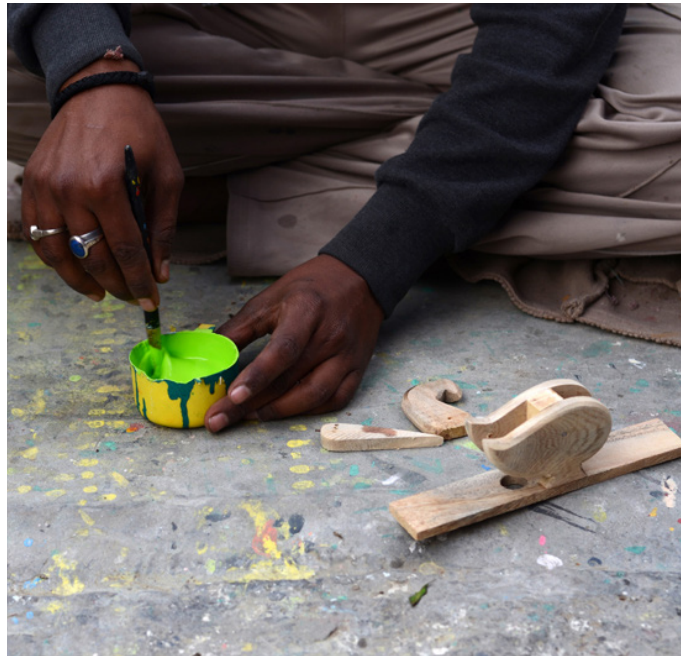
Mixing fluorescent green paint.