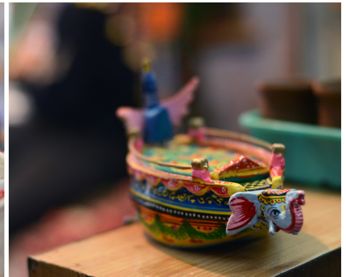
A boat with elephant head at one end.