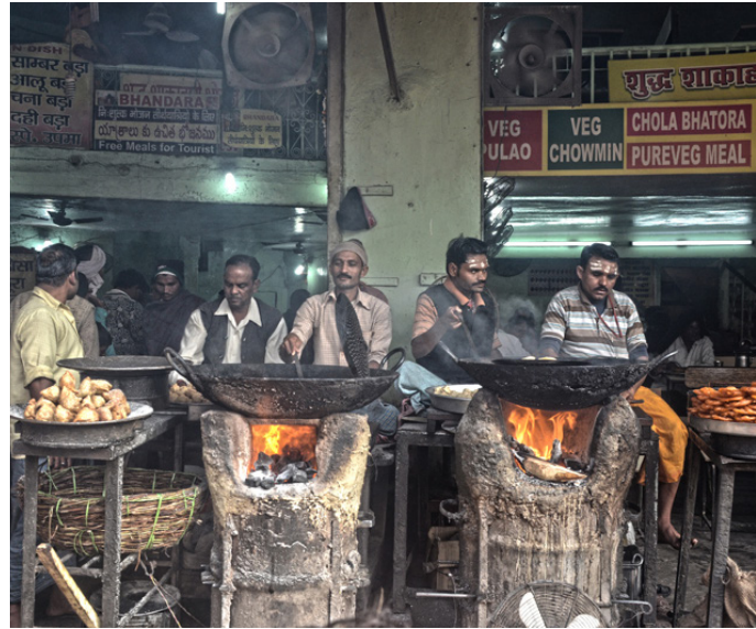
Open kitchens on roadside, preparing savories and sweets.

http://www.dsource.in/resource/making-parrot-toy/place