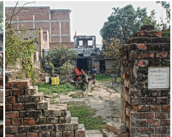
Entrance to Raju's house.