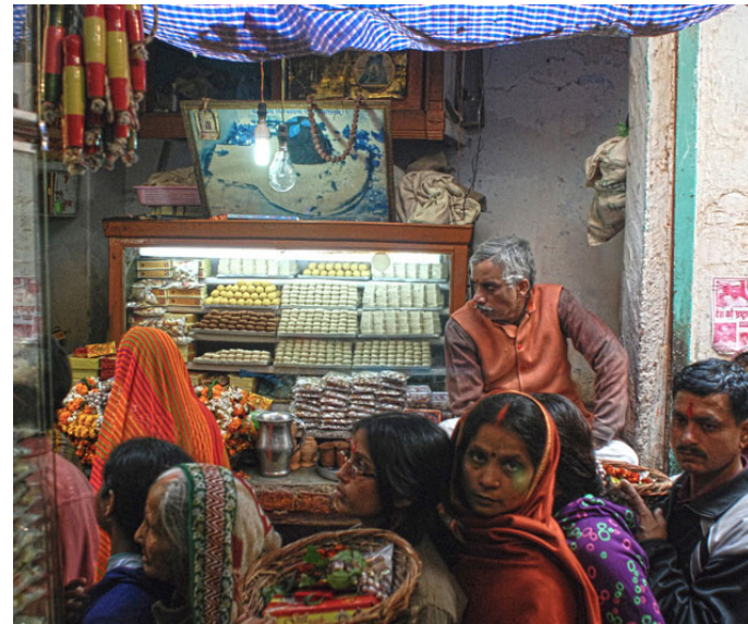
People from different states and regions come here to visit the temple.

http://www.dsource.in/resource/making-parrot-toy/place