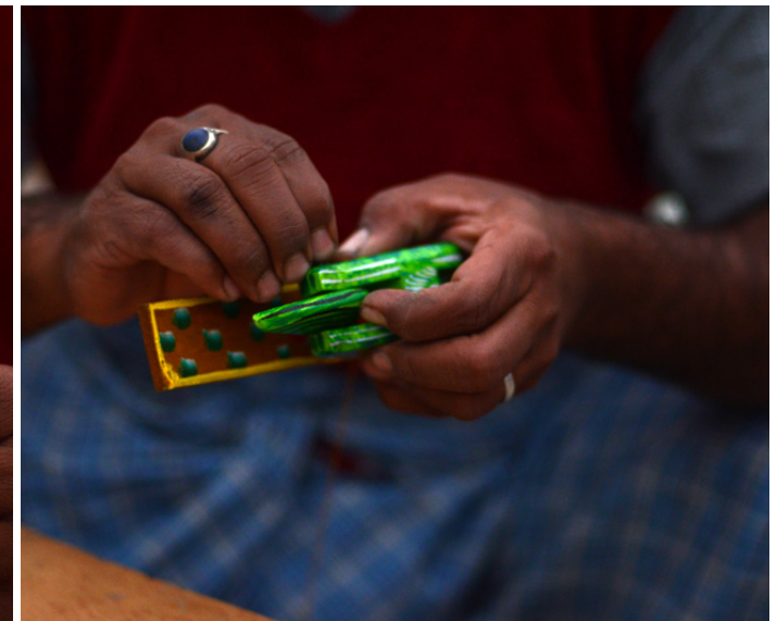
Passing a nail from drilled hole in torso and the tail, together.