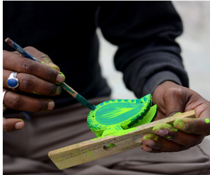
Creating patterns on the torso unit.

http://www.dsource.in/resource/making-parrot-toy/process/painting-parrot