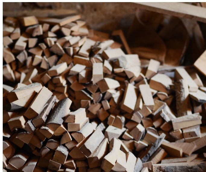
Sliced wooden blocks on 6 inches length.