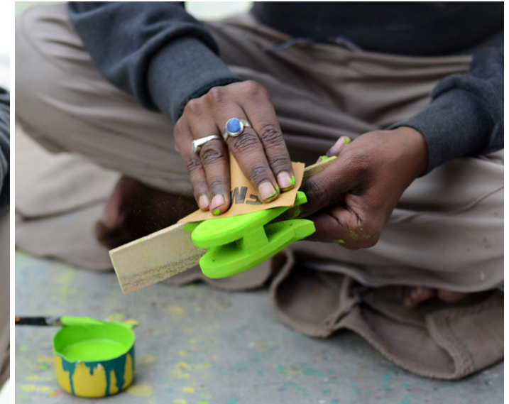
Filing the dried surface using sandpaper.