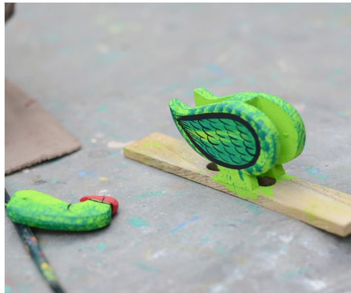
Left for drying.