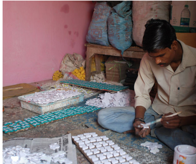
A few sitting inside a room and painting.

http://www.dsource.in/resource/making-parrot-toy/process/paint-workshops