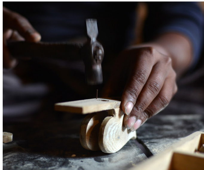
Nailing the plank to the torso.