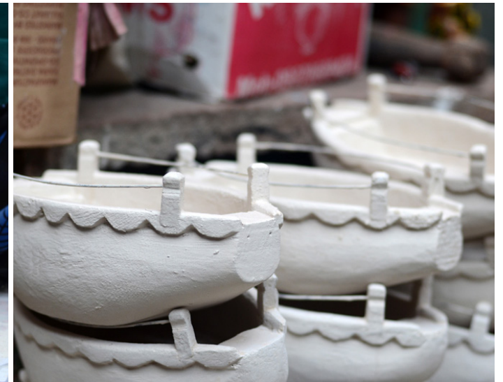
Boats made out of wood.