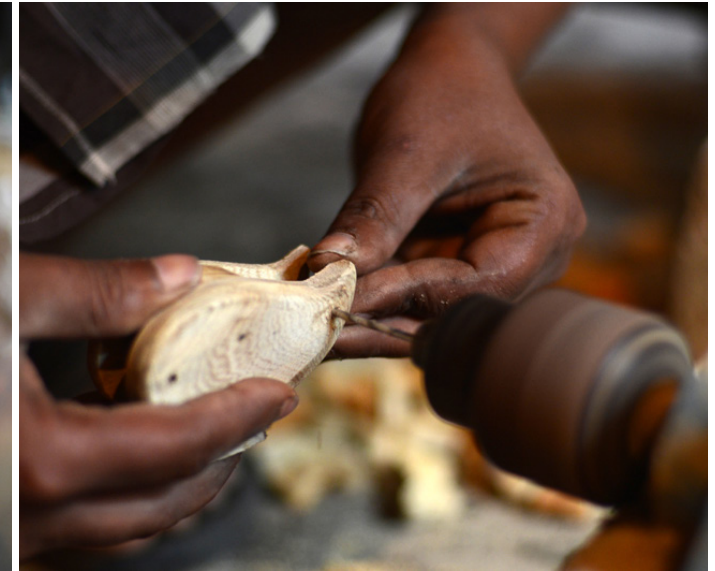
Drilling the other end.