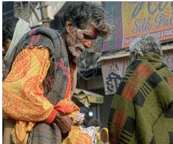
Saints in the vicinity of Ghat.