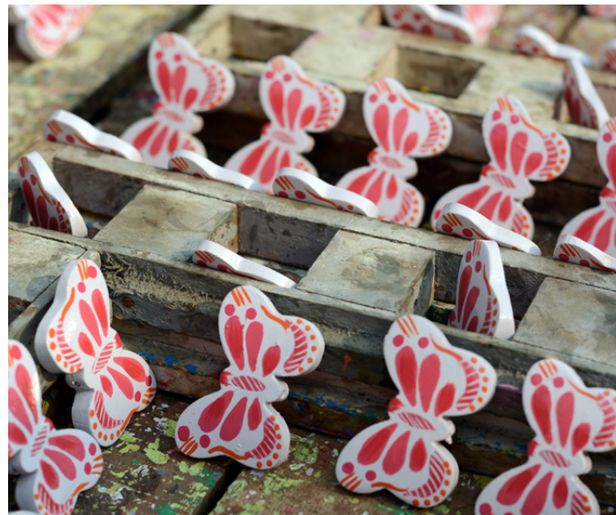
These colourful wooden butterflies are left in sun to dry.