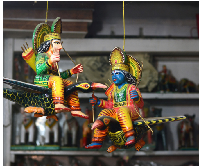
Figures suspended from the ceiling.