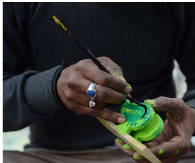
Decorating with black colour.