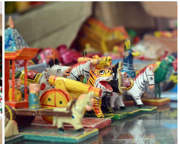
Wooden chariots displayed in a shop.