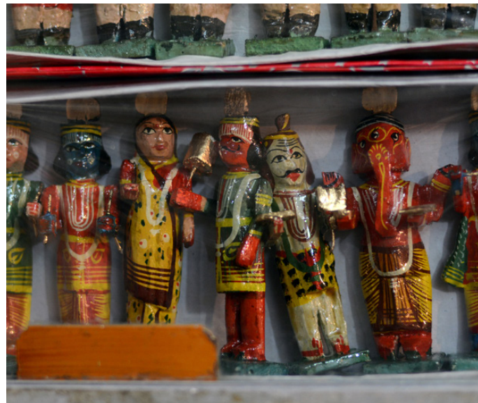
Set of Gods.