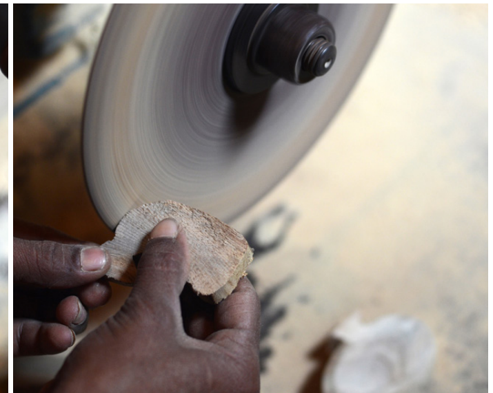
Filing the head.