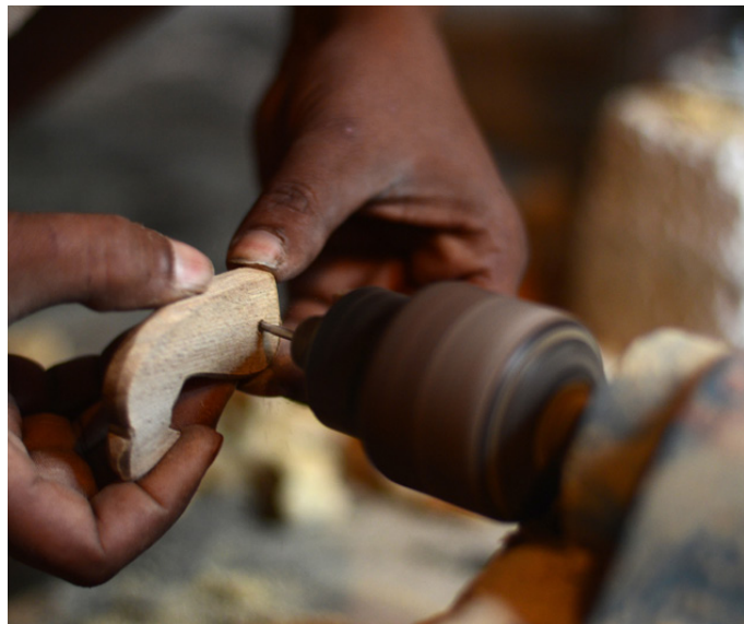
Drilling a hole in head.