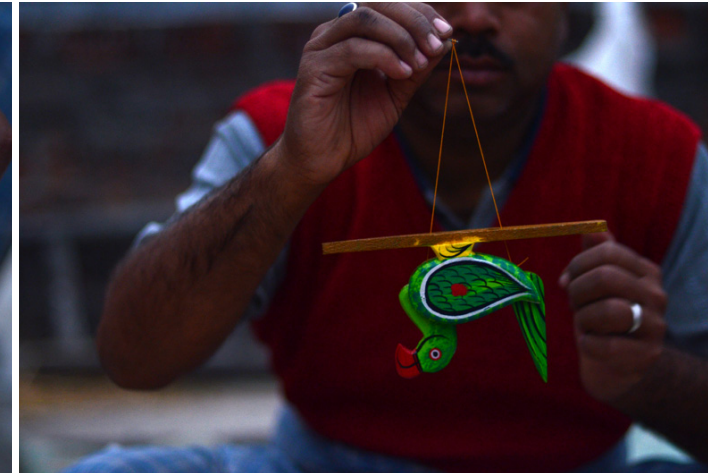
Tying both the loose ends on a nail.