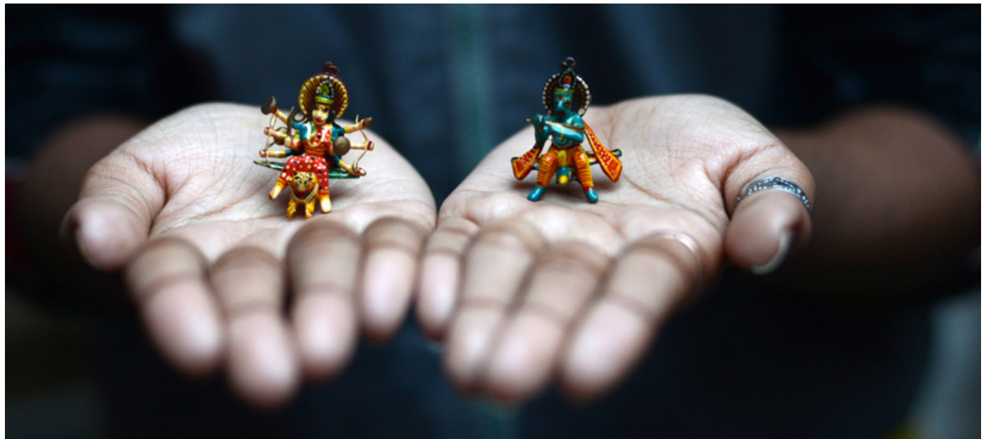
Intricate and really small sized sculptures of Gods and Goddesses.