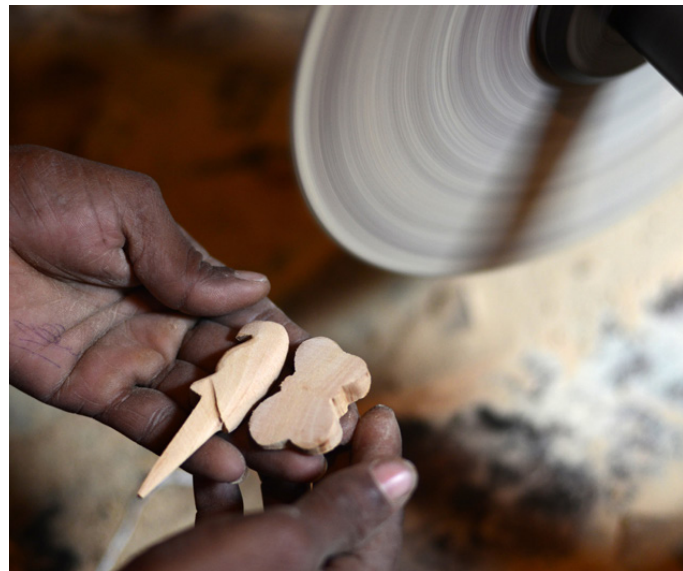
Artist showing the filled parts of parrot and butterfly toys.