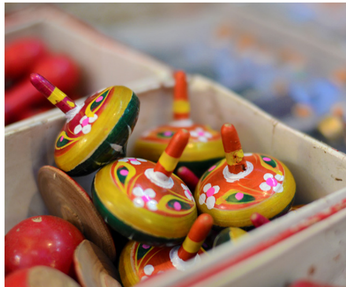
Decorated spin tops.