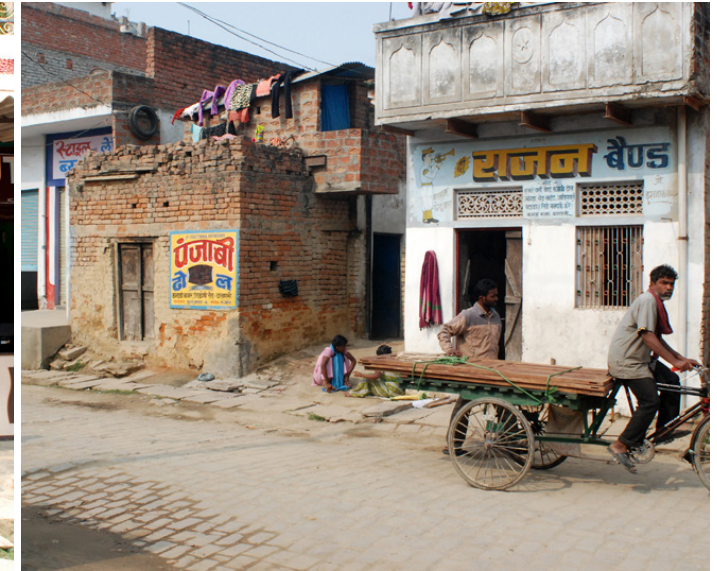
Houses in the street.