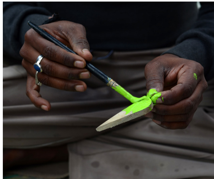
Painting the tail.