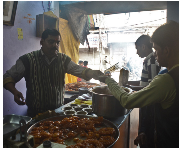
Sweets and savories' shop.