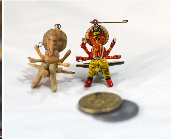
Small idols made out of wood, no larger than a five rupee coin.