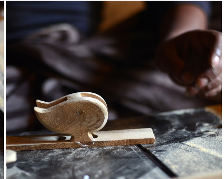
Pasting the unit on a rectangular plank having two holes.