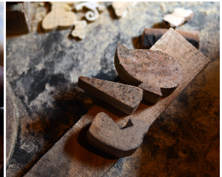
Head, tail and torso blocks.