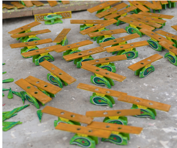
Torso units drying in shade.

http://www.dsource.in/resource/making-parrot-toy/people