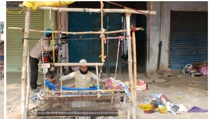
Handloom worker on the street.