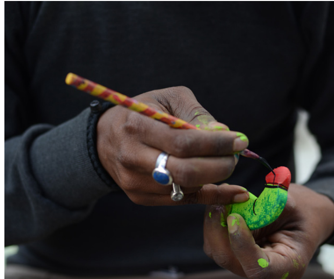
Detailing the beak.

http://www.dsource.in/resource/making-parrot-toy/process/painting-parrot