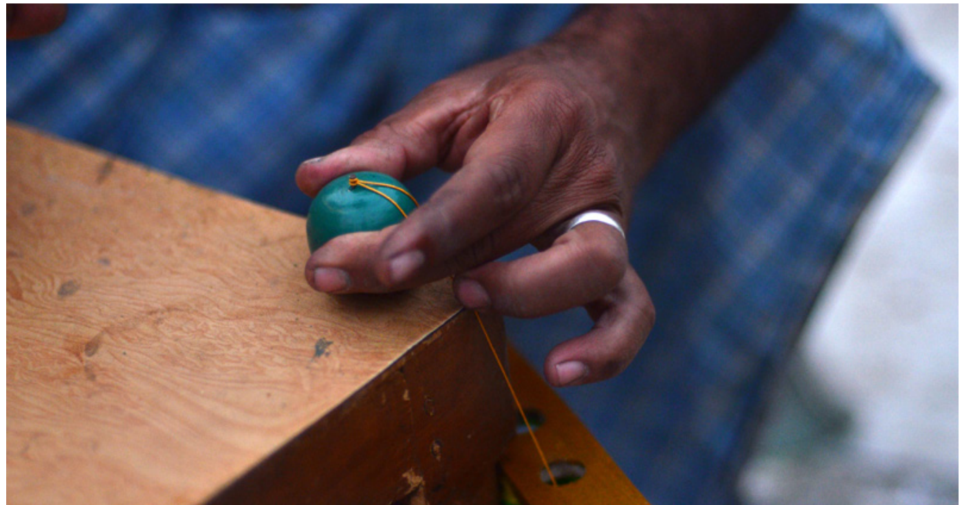
Nailing the loose ends on a wooden ball.