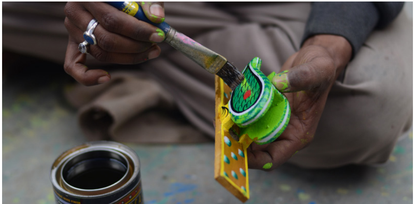
Varnishing the torso.