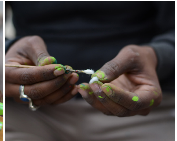
Making cotton bud.