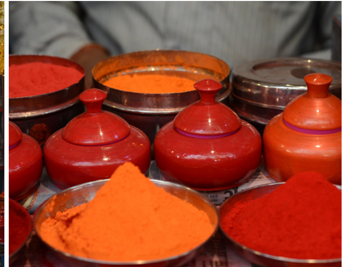
Holly red colour called 'Sindoore' for married women.