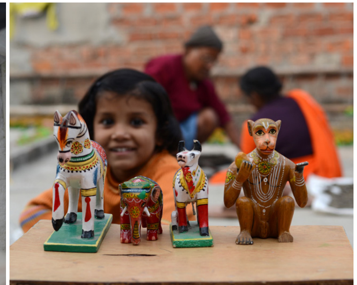
A girl with her wooden toys.