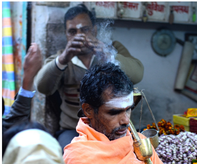
A procession passing by Kashi Vishwanath Temple street.