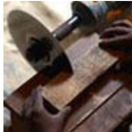
Cutting and Filing

Wooden toy makers are the few craftsmen, who are pursuing the art of toy making. A set of artists are only skilled to make wooden toys. One of the most famous toys made by these artisans is the "Parrot-Toy", which is adapted in different styles.