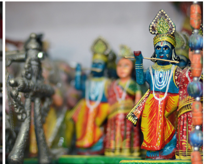
Lord Krishna with his flute.