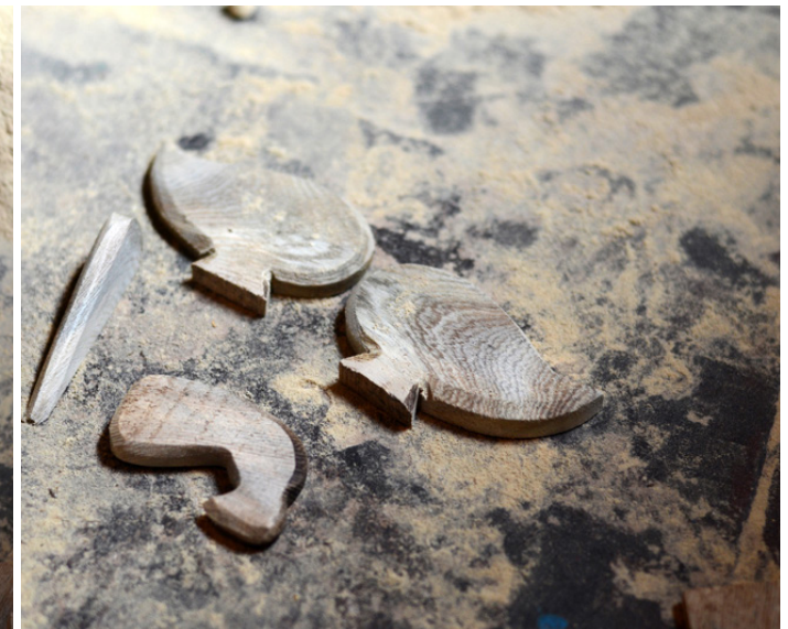
Finely smoothed and shaped parts.