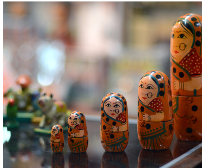
Wooden dolls displayed in a shop.