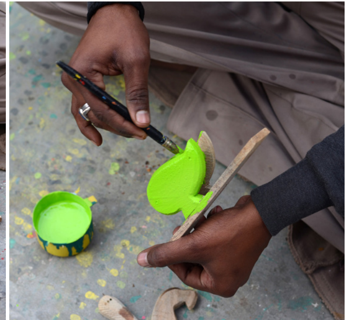
Painting torso unit.