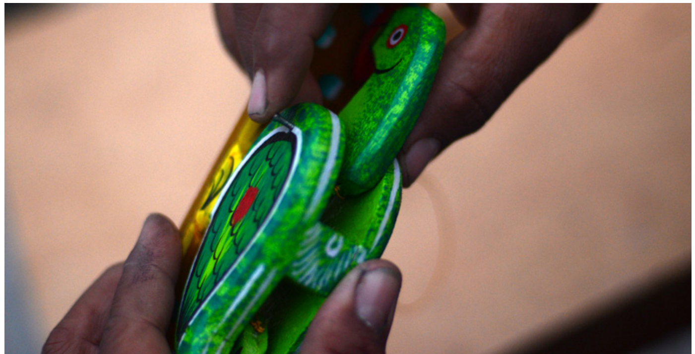
Passing a nail from drilled hole in torso and the head, together.