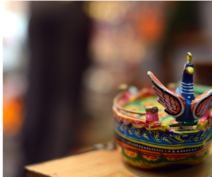
Peacock head on the other end.

http://www.dsource.in/resource/making-parrot-toy/place