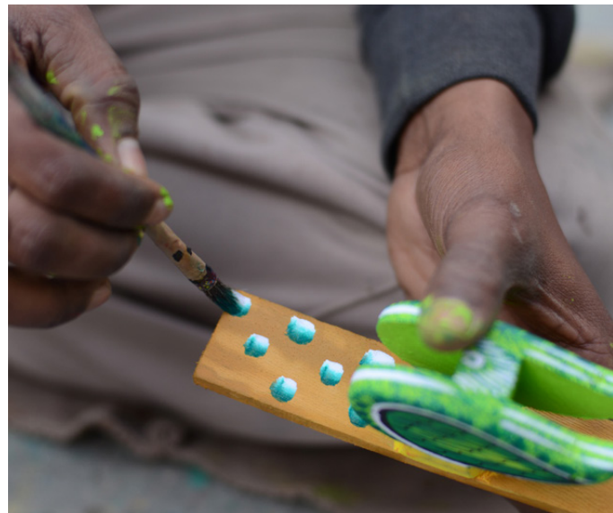
Creating patterns on ochre plank.