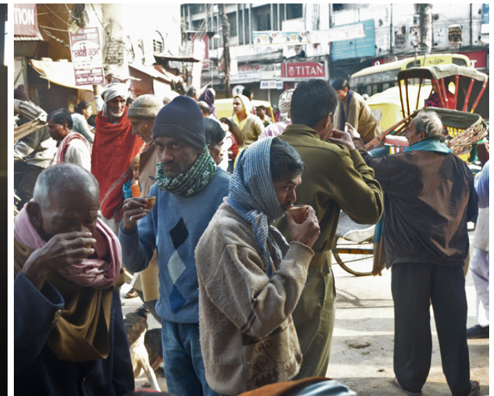
People sipping tea in 'Kulhads' on a winter morning at crossroads 'Chowk'.