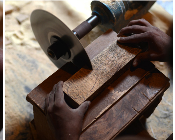
Torso of parrot.