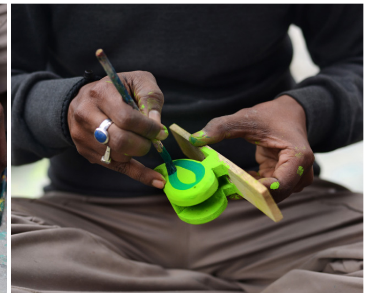
Decorating the torso.