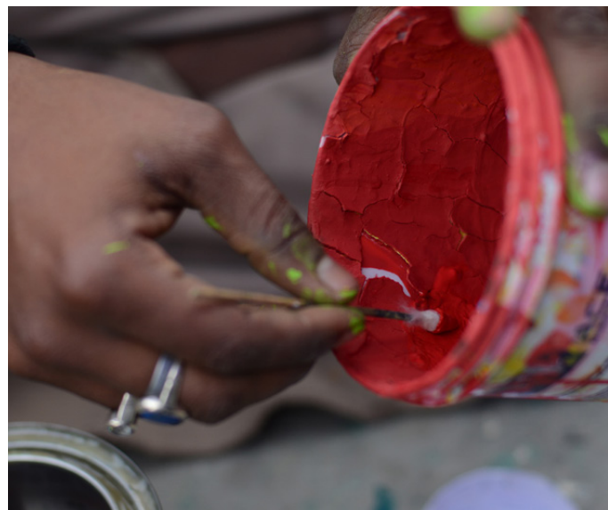
Picking red colour using cotton bud.