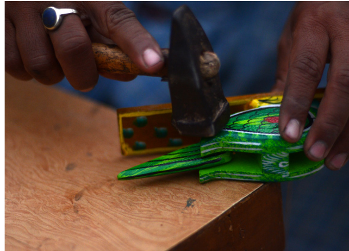
Fixing the nail firmly onto the un-drilled torso wall.

http://www.dsource.in/resource/making-parrot-toy/process/assembling-parrot