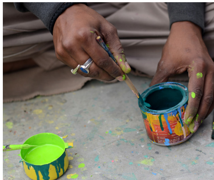
Preparing dark green paint.