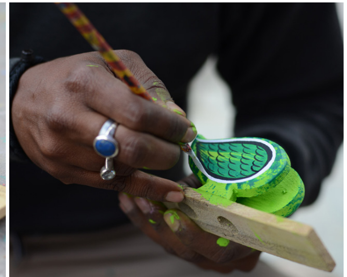
Decorating with white colour.