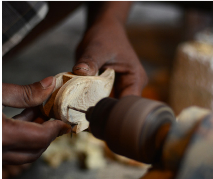
Drilling on one end of the torso.

http://www.dsource.in/resource/making-parrot-toy/process/cutting-and-filing