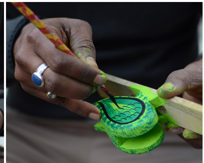
Making patterns on the torso unit.