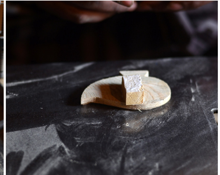
Pasting cuboid to one part of torso.