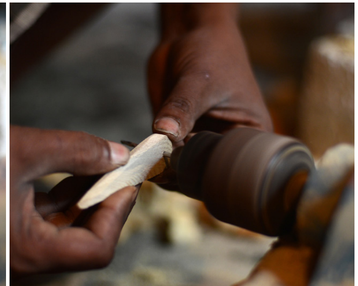
Drilling a hole in the tail.