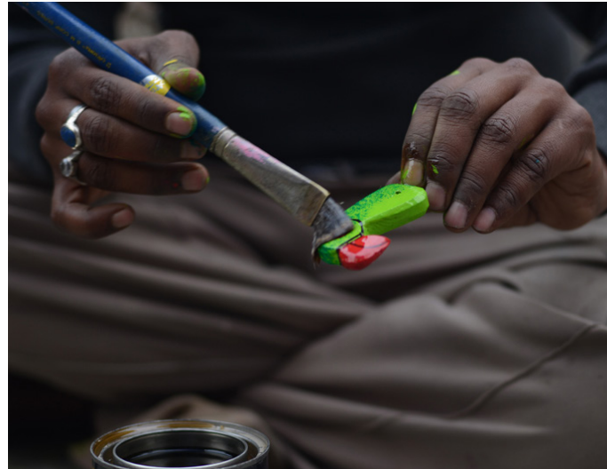
Varnishing the head.

http://www.dsource.in/resource/making-parrot-toy/process/painting-parrot