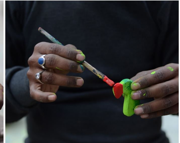
Painting the beak.