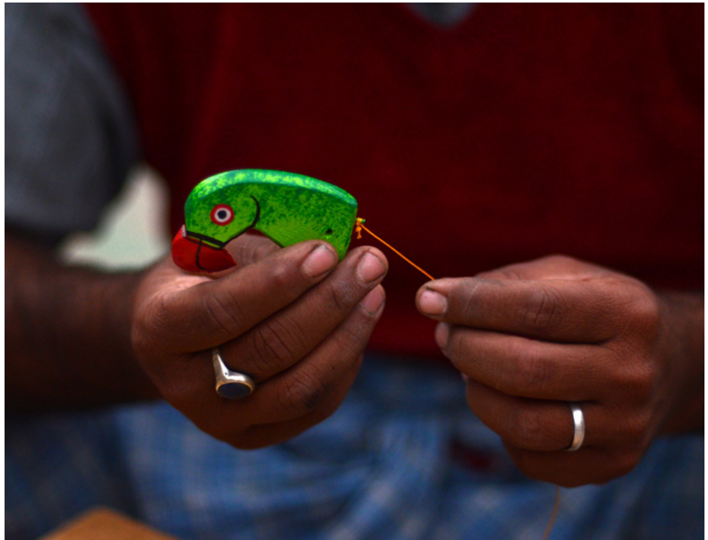
Tying one end of a string at the bottom of the head on a nail.

After completing the process of Cutting, Filing, Painting and Varnishing the surfaces of all the components; the Head, Torso, Tail of the Parrot-Toy and a wooden weight are assembled by using a cotton string.