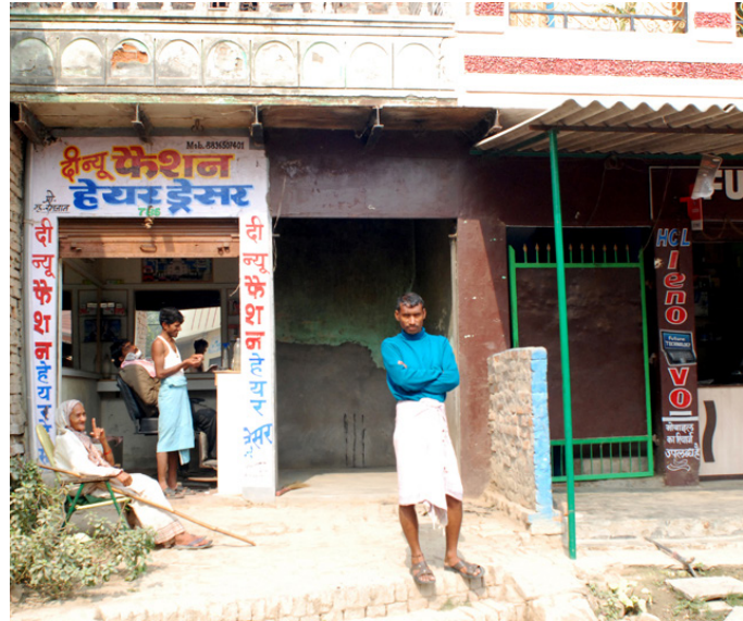
Hair dressing salon.

http://www.dsource.in/resource/making-parrot-toy/people