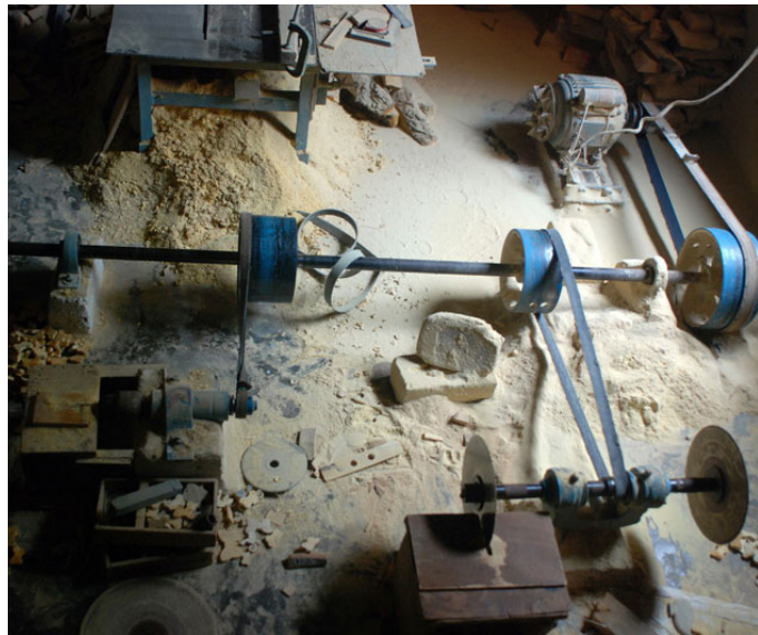
Workshop with an intelligent set up. Single motor runs cutting and filing wheels together.