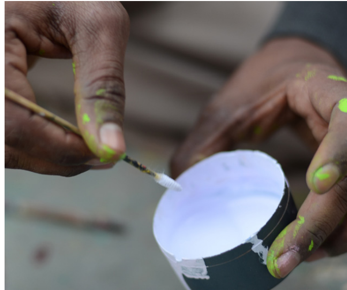
Picking white colour using cotton bud.

http://www.dsource.in/resource/making-parrot-toy/process/painting-parrot