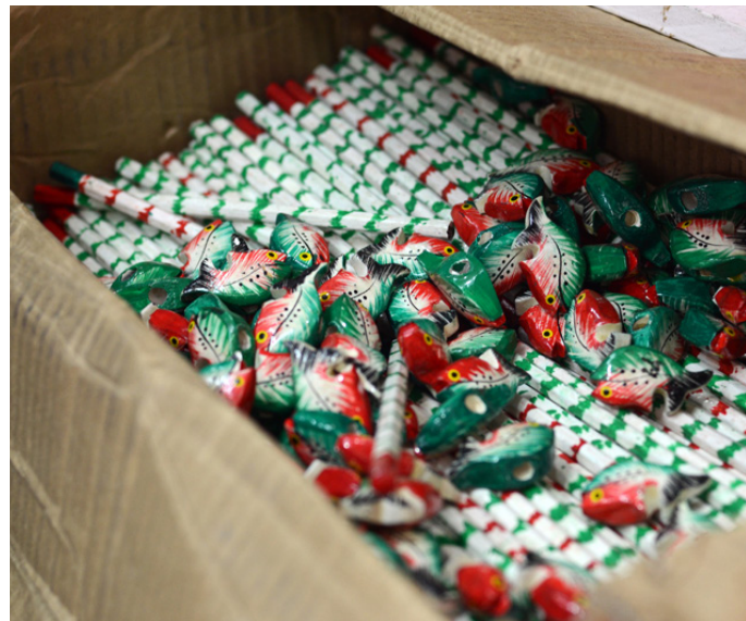
A box containing pencils painted similar to their accessory, fish.