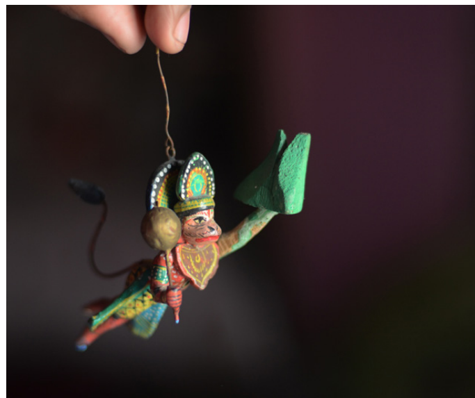
Tiny idols of God.