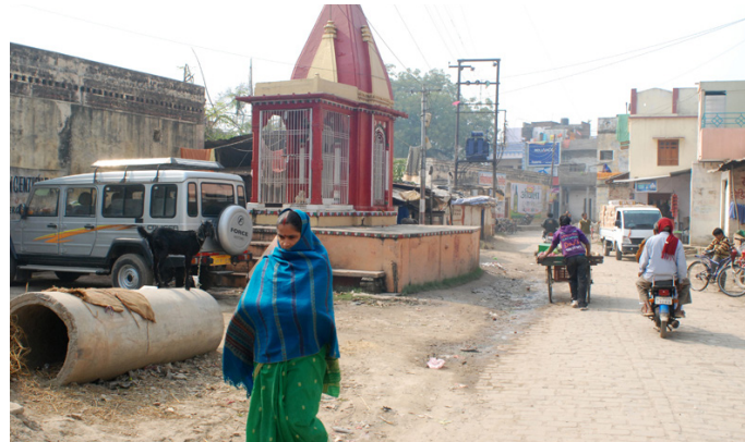
Street outside Raju's house.