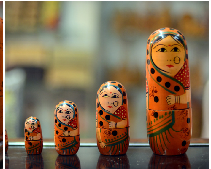
Very famous wooden toy, a set of ascending figures.