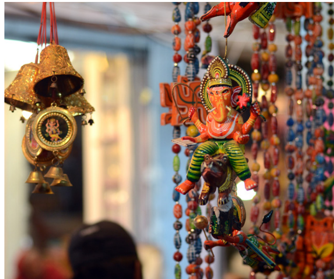
Decorative wall hangings made with different types of figures and motifs.

http://www.dsource.in/resource/making-parrot-toy/place