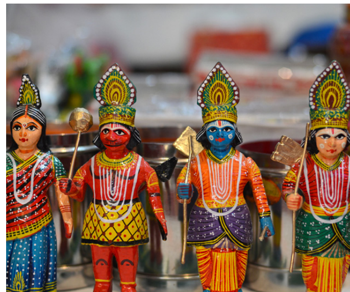
Idols of mythological figures at display.