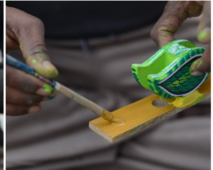
Painting the plank ochre.