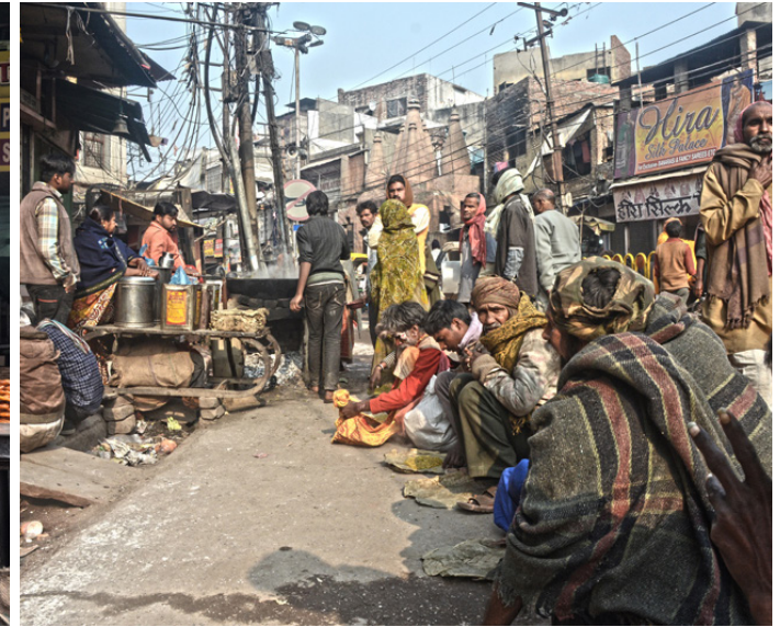
People eating free food, generally organised by devotees.