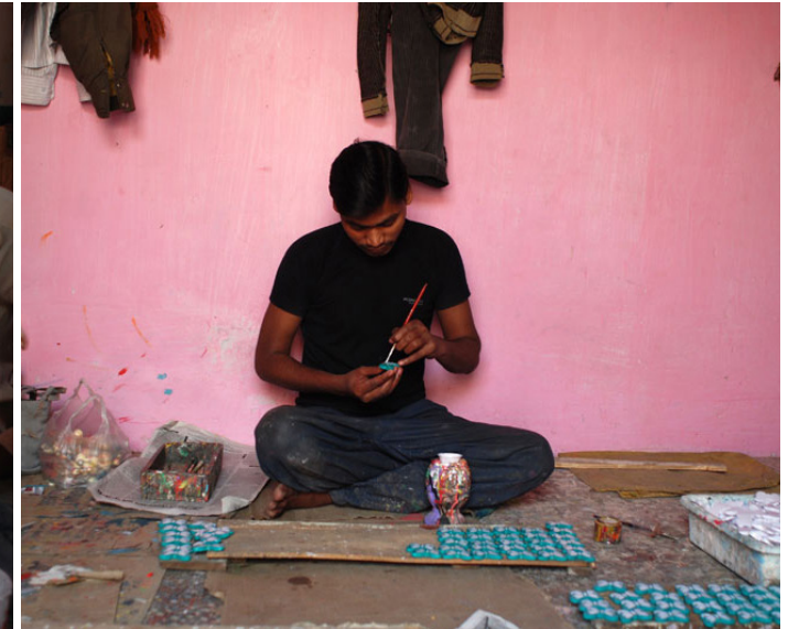
Everyone is busy finish the consignment.