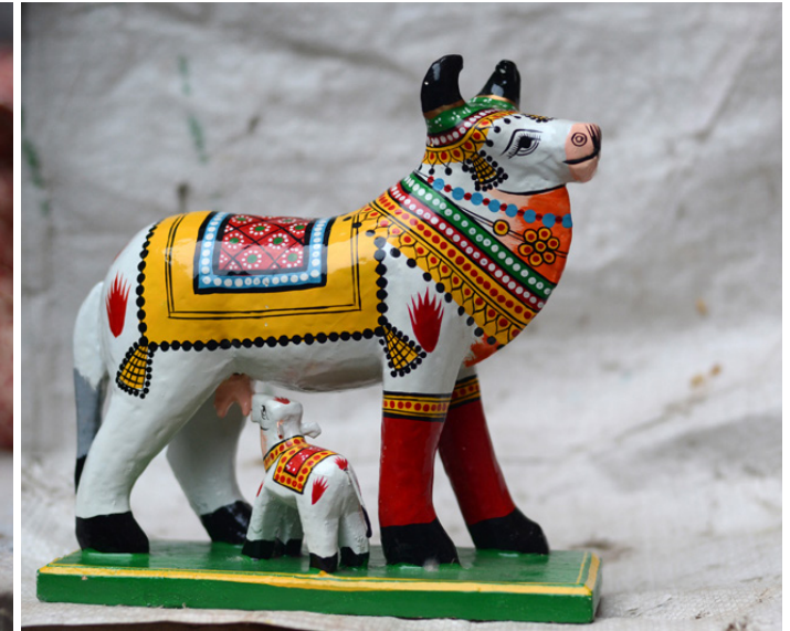
Cow with a calf.