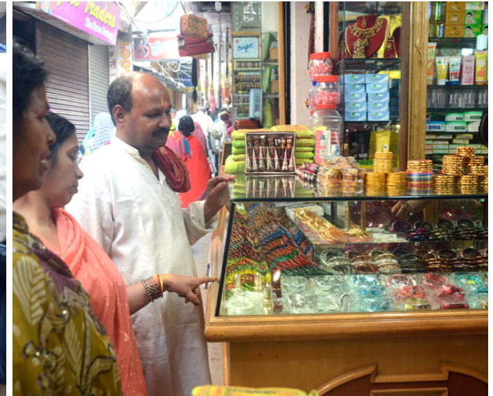
Bangles being sold at a fancy stall in the same street.