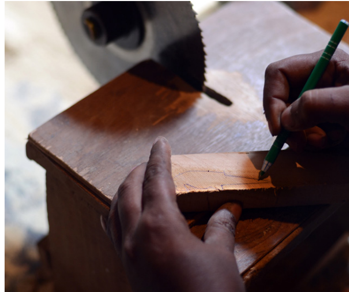
Making the drawing of a parrot on a 6 inches block.

http://www.dsource.in/resource/making-parrot-toy/process/cutting-and-filing