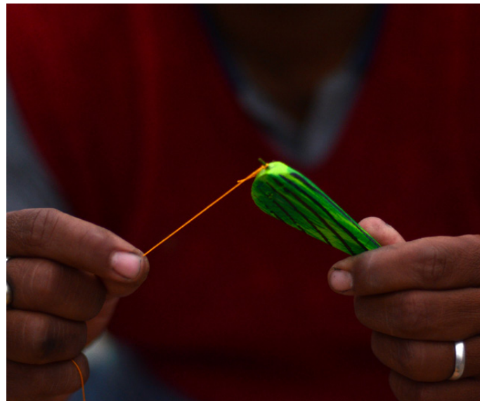
Tying the other end of string to the tail, using a nail.