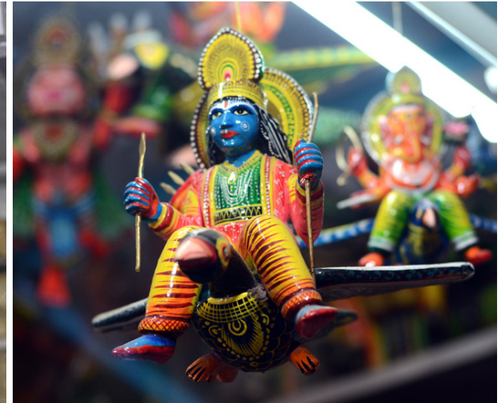
Flying mythological figures displayed.