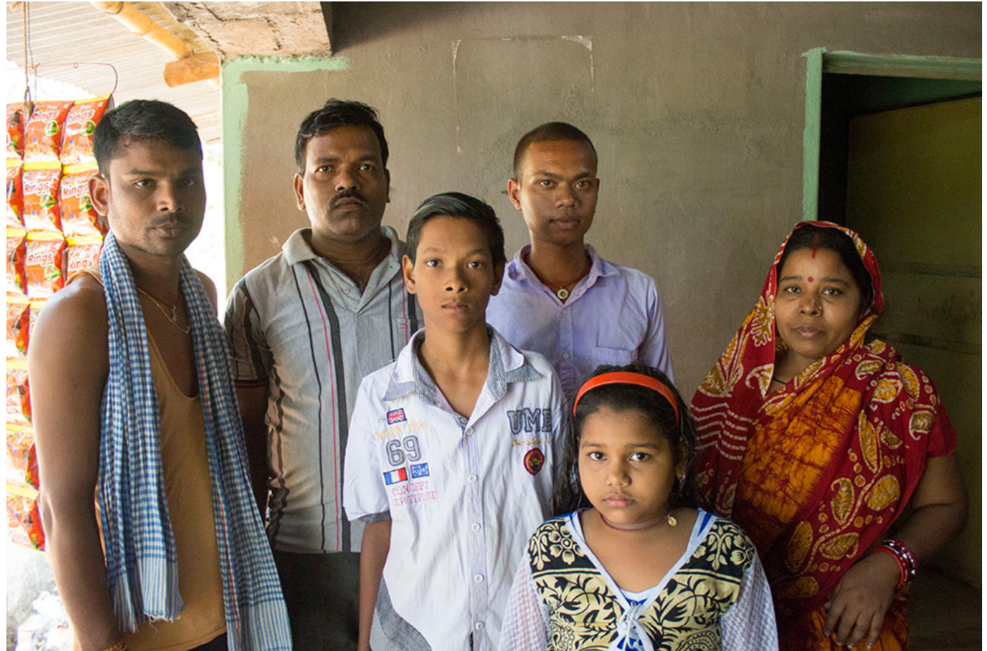
Artisan's family who work on making of tribal jewelry.