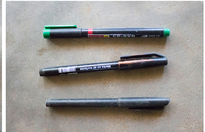
Marker is used for making the margins on the metal.