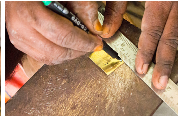
Further they are marked for the design purpose.