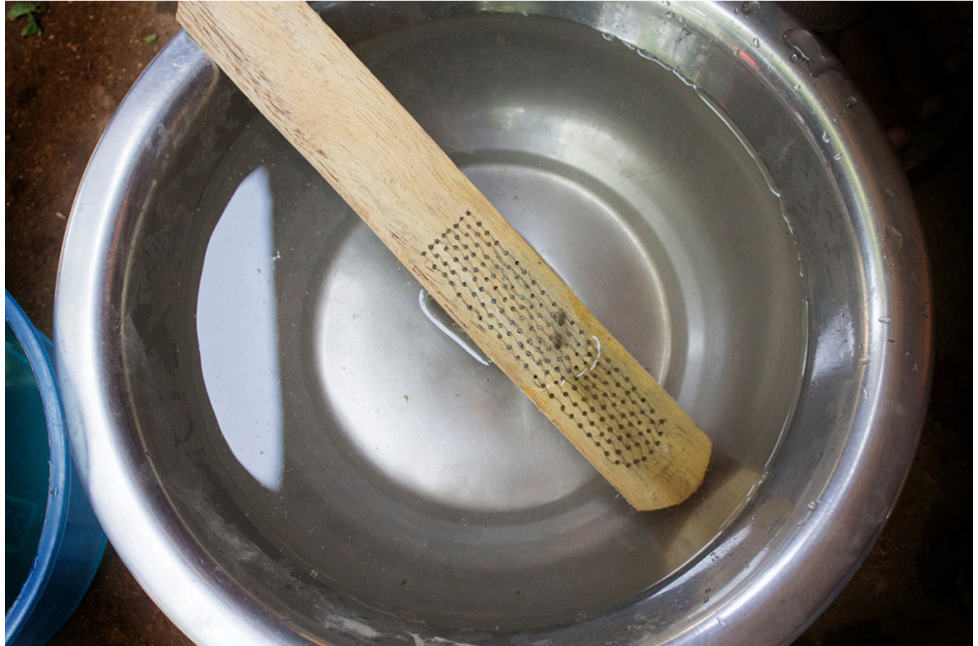
Brush that is used for scrubbing the surface of the metal product.