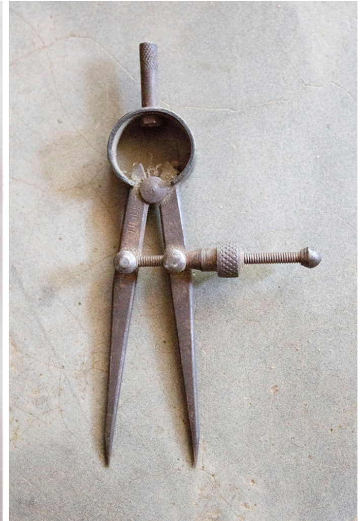
Compass is used for measuring the diameter of the design.