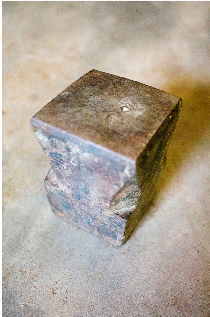
Metal stand used as the support.