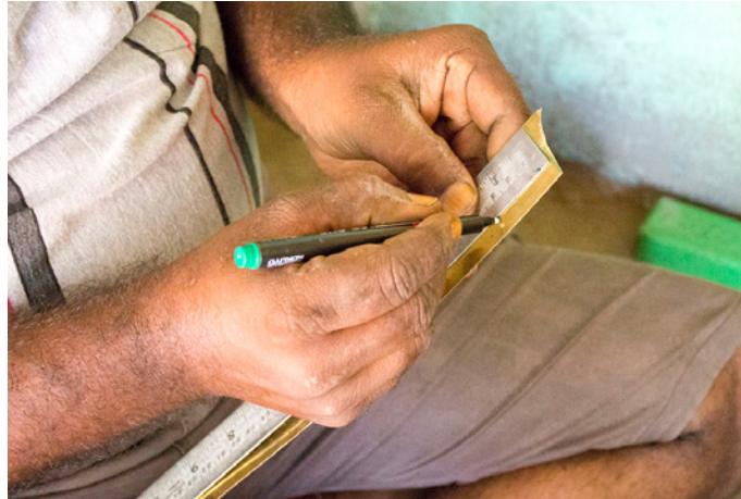
Using scale required measurements are marked on the metal.