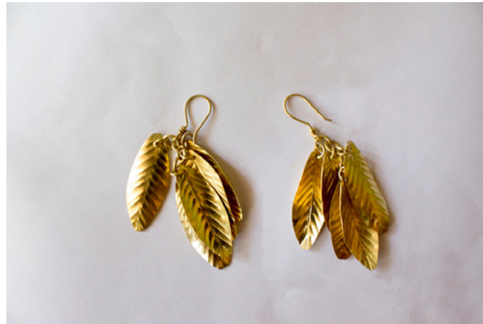
Bunch of leaves made of metal is adorned as an earring.