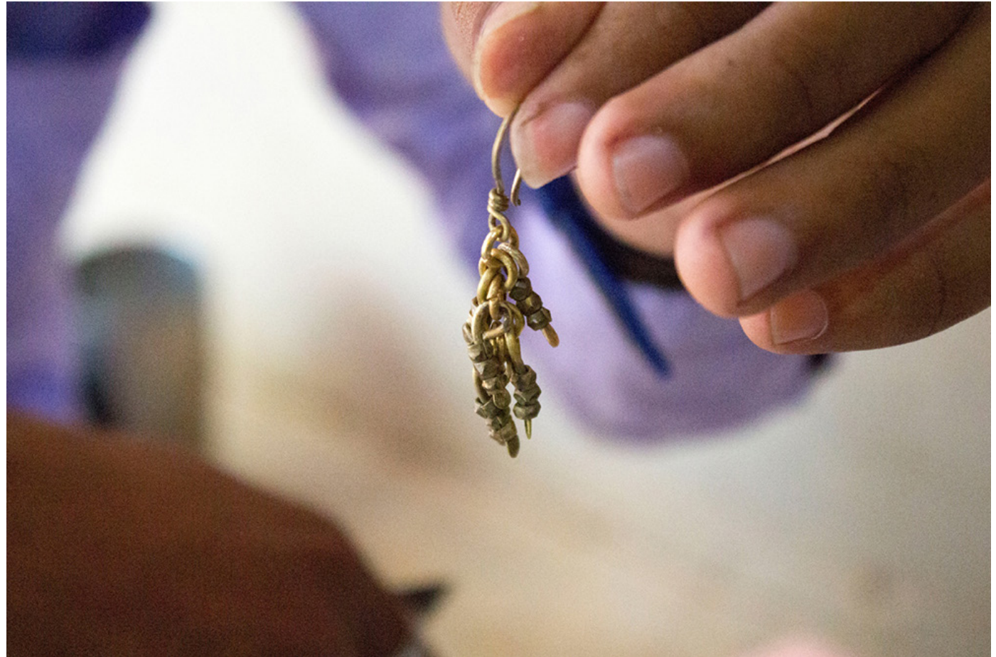
Earring made by linking the metal rings together.