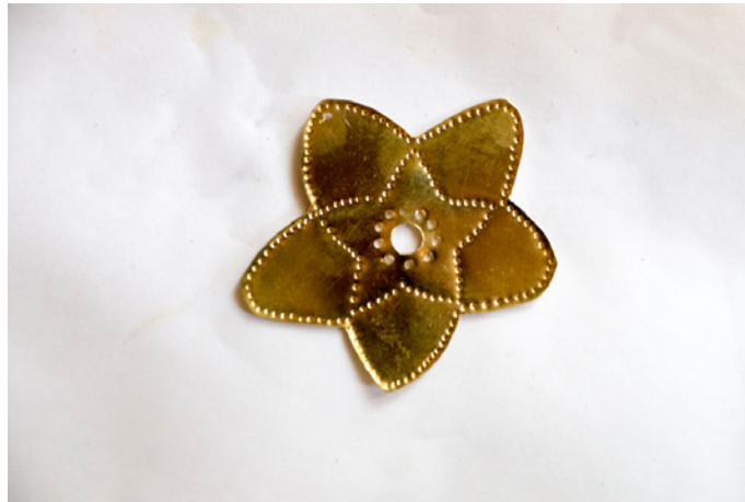
Star shaped tribal jewelry.