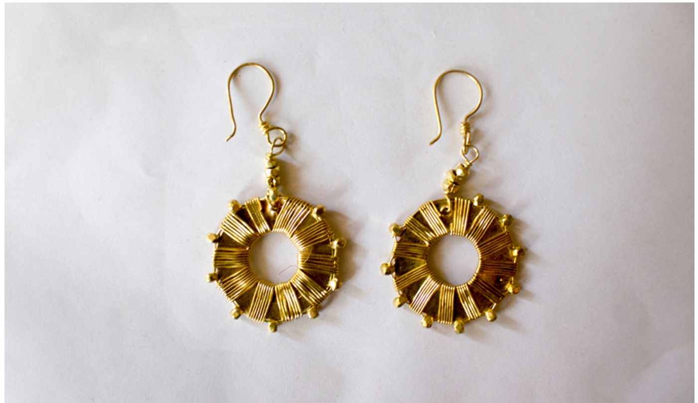
A pair of earring.

Varieties of earring are made namely wheel shaped brass earrings, twisted spring brass earrings, leaf earrings, square brass tribal earrings, spiral shape earrings. The price will be depend on the design.