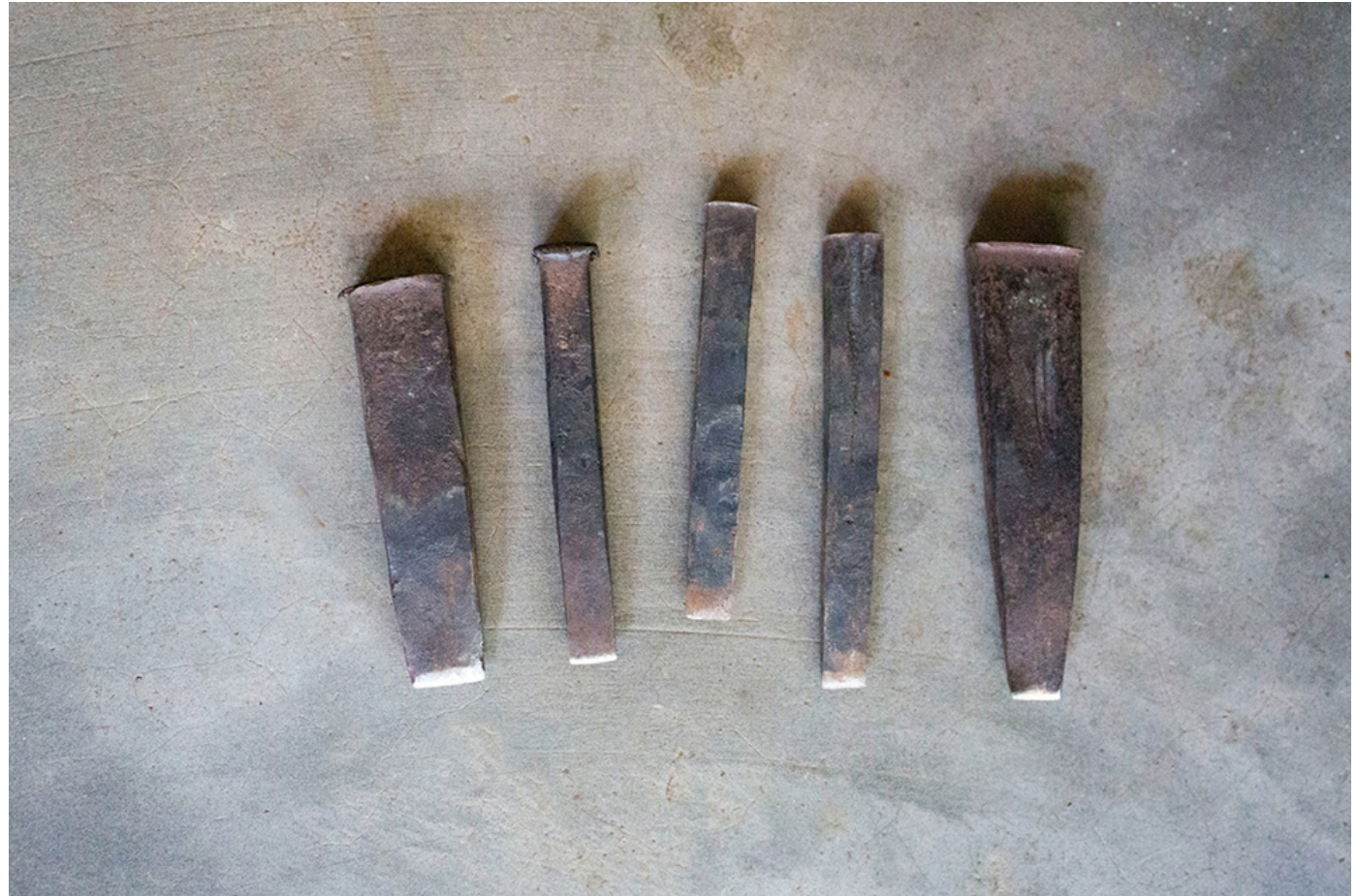
Small chisels are used for embossing the designs.