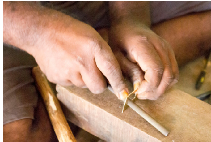
When necessary the excess of metal is cut off and the surface is smoothened using file tool.