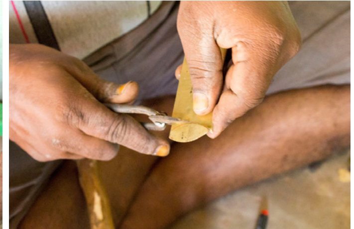
As per the makings the metal sheet is cut.