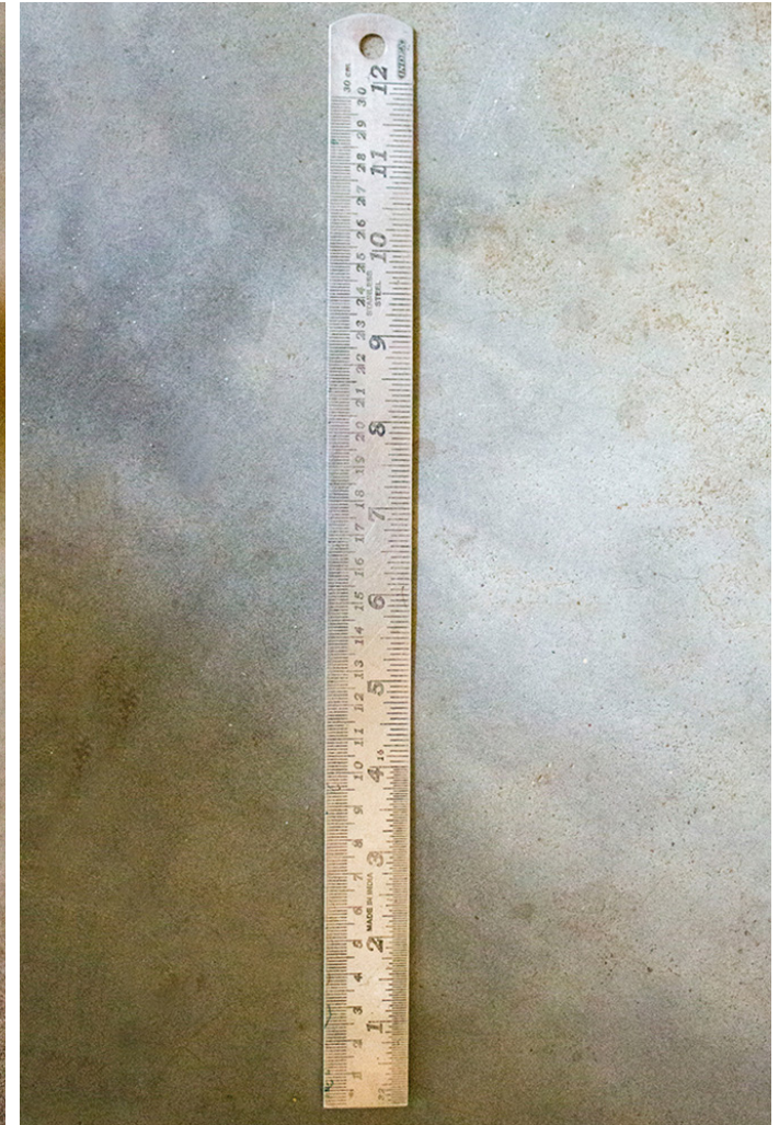
Scale is used for measuring.