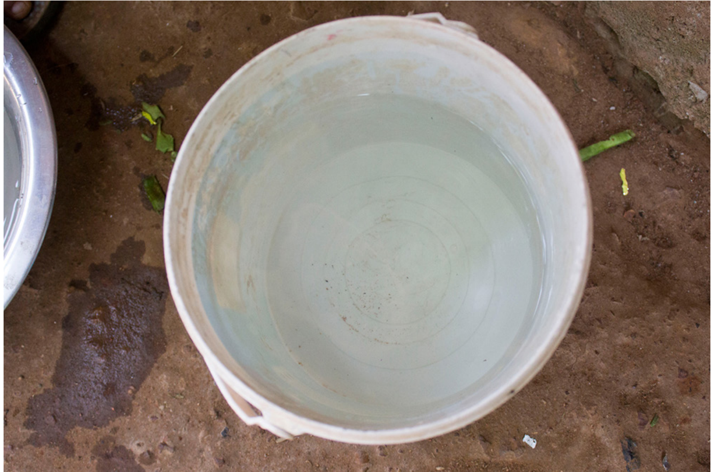
Water is mixed with nitric acid to dilute the solution.