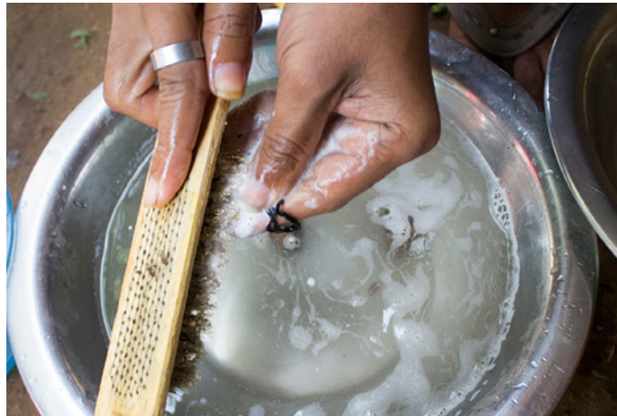
Then the surface of the metal product is rubbed with the brush that acts as a natural polish.