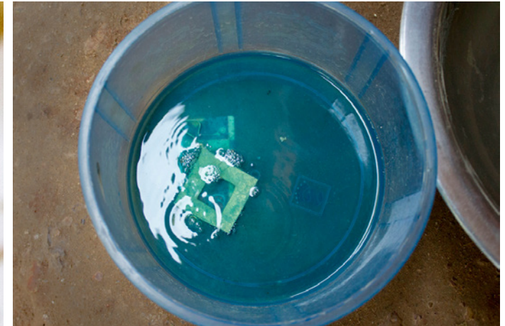
Further the metal jewelry is soaked in nitric acid with water.