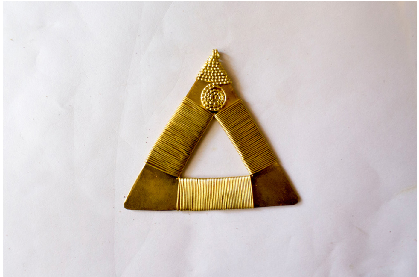
Intricately designed metal pendant.