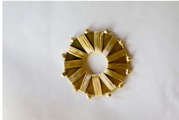
Pendant that is worn by women.