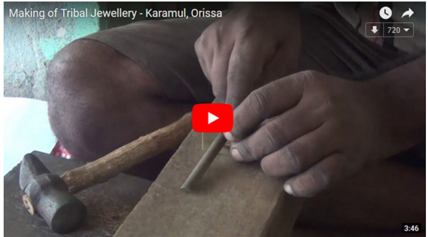
Making of Tribal Jewellery - Karamul, Orissa