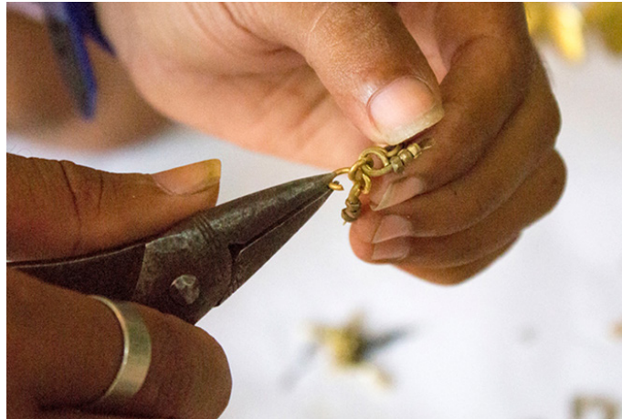
A metal hook is attached to the metal earring.

http://dsource.in/resource/making-tribal-jewellery-karamul-orissa/making-process