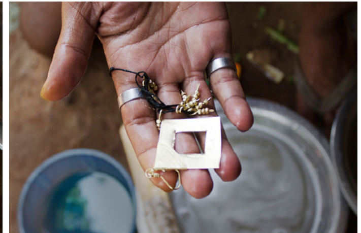
A bright and beautiful tribal metal jewelry is thus prepared!