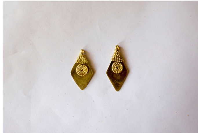
Various sized pendants for women.

http://dsource.in/resource/making-tribal-jewellery-karamul-orissa/products