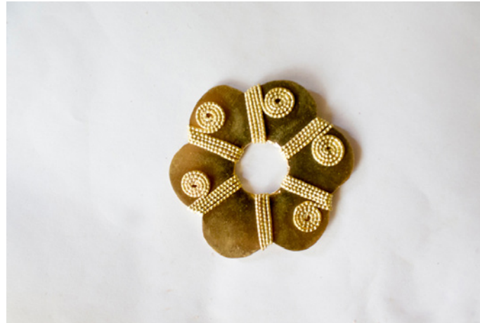
A typical tribal pendant.