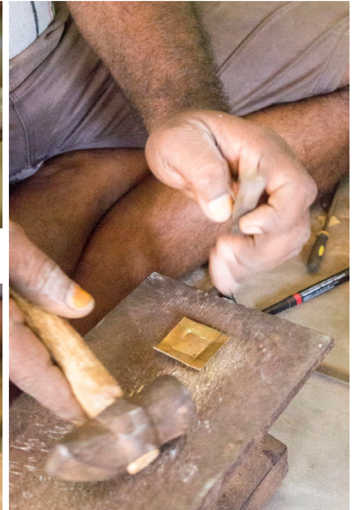
A glimpse of the impression made using chisel.