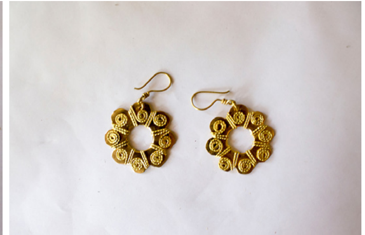
Earrings made by using floral design.