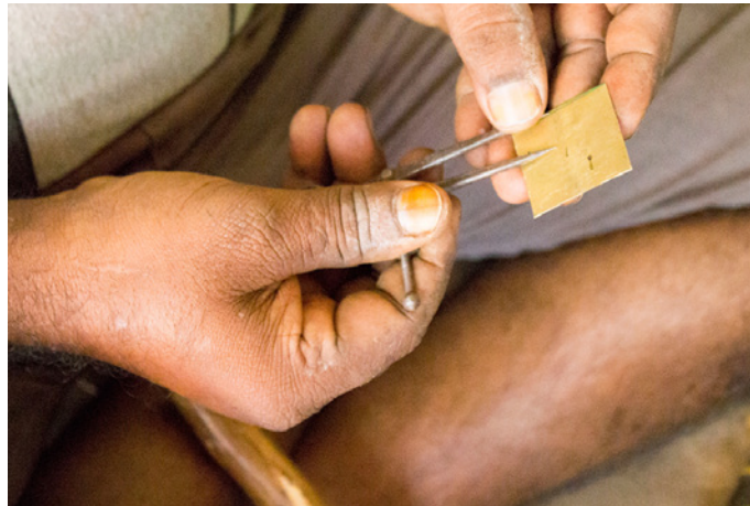
On the next level, for design purpose the dimensions are measured using compass.