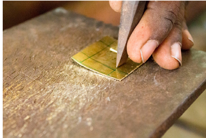
On the markings impressions are made using chisel.