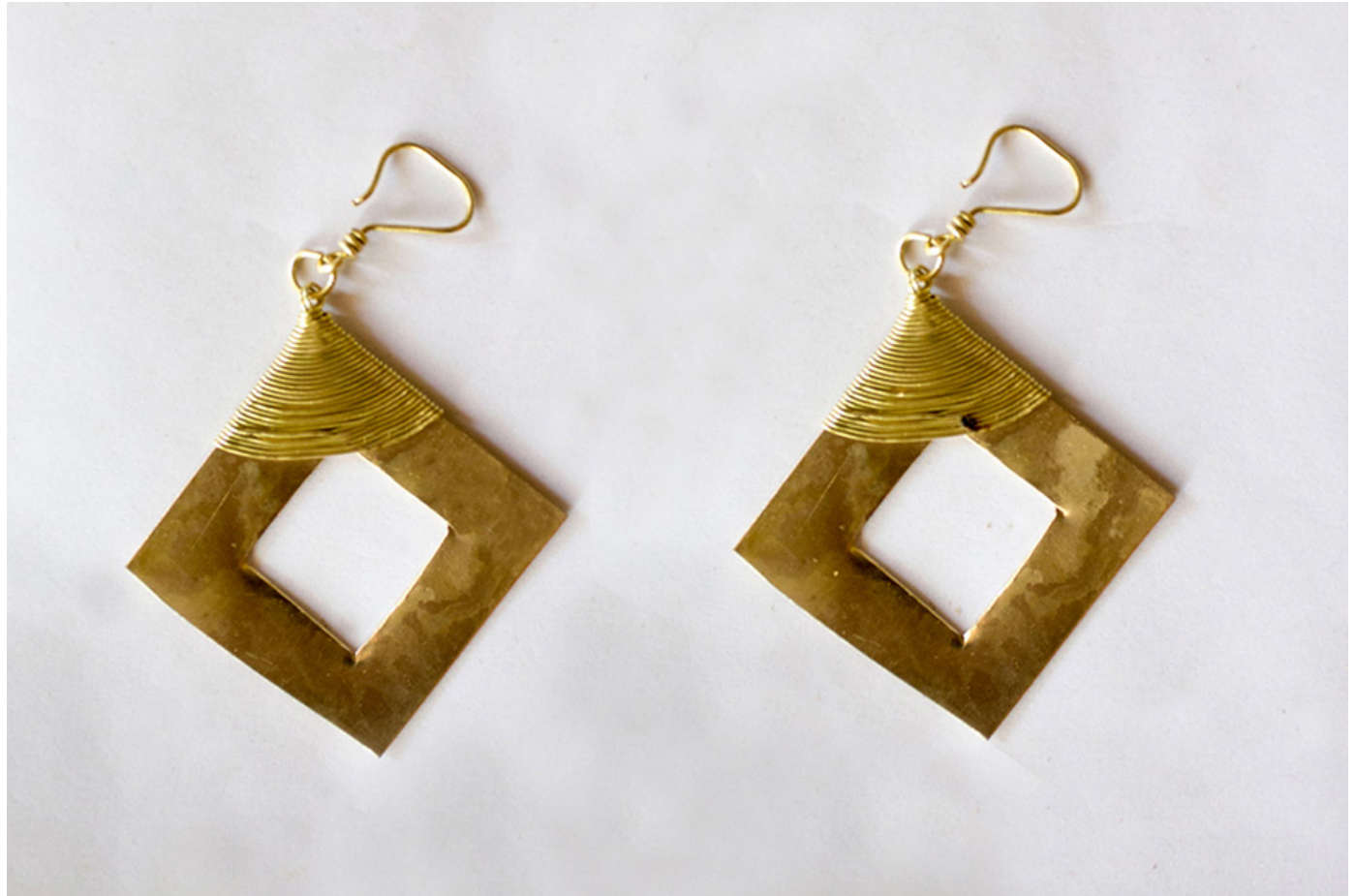
An antique collection of tribal jewelry.