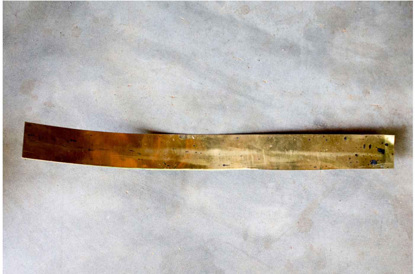
Metal sheet is the main material that is used for making tribal jewelry.