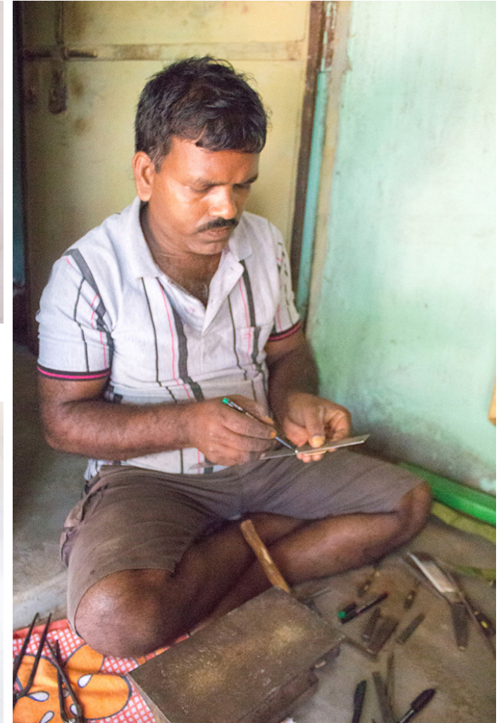
Craftsman engrossed in making tribal jewelry.