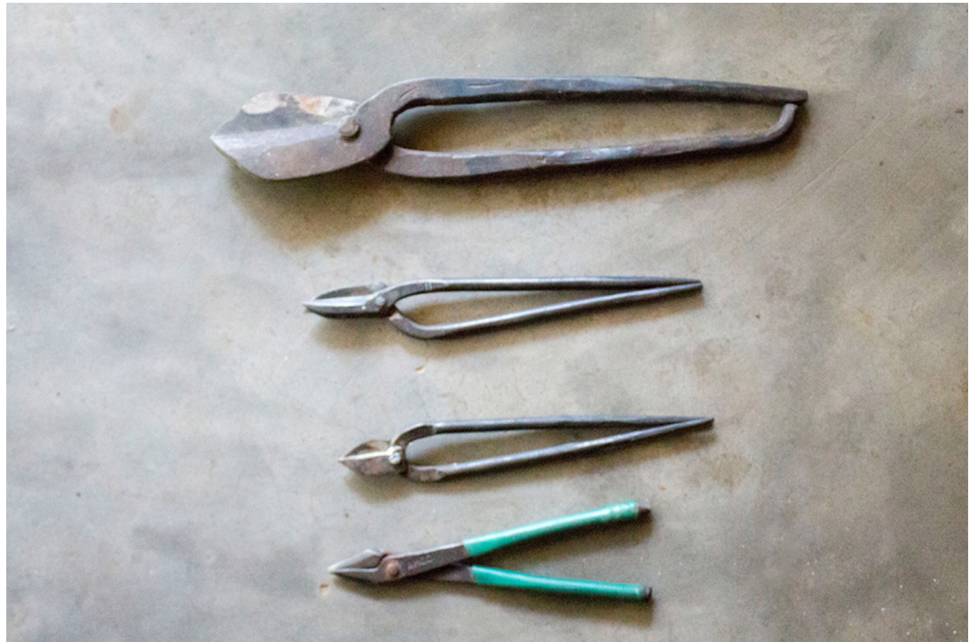
Various sized cutters are used for cutting the metal sheet.