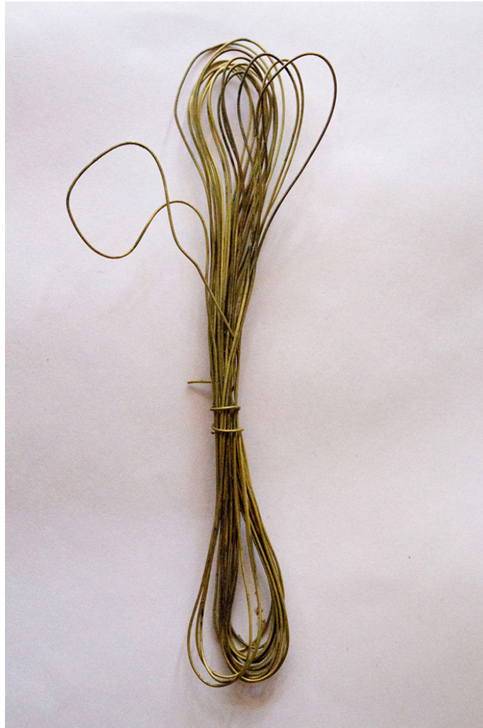
Metal wire is used for making the hook of the earring.