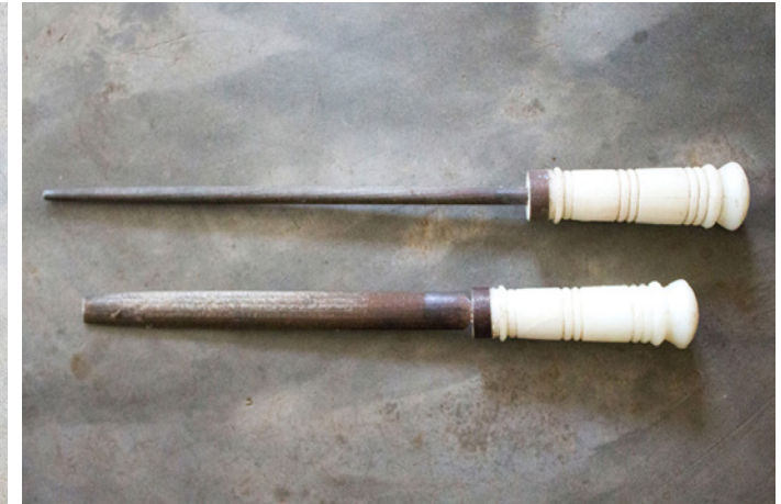
File tool is used for smoothening the surface.