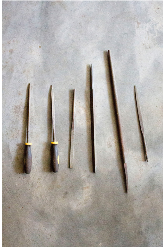
Small sized, sharp pointed chisels are used for designing purpose.