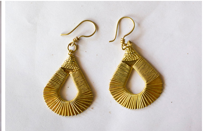
Intricately made metal earrings by winding the metal wires in a unique method.