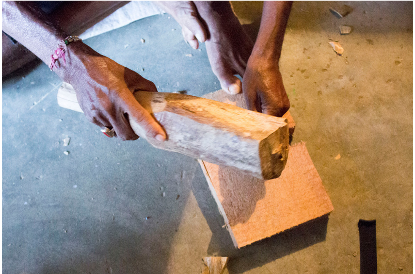
On the markings, the wood is slightly etched.