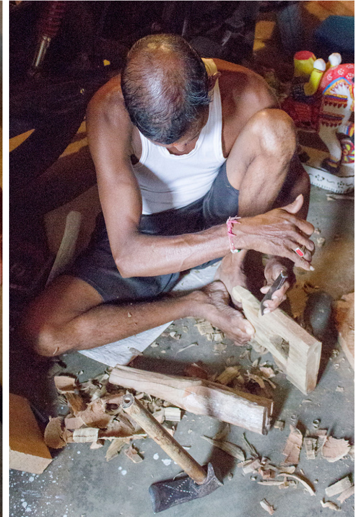
Further the wooden is initially shaped.