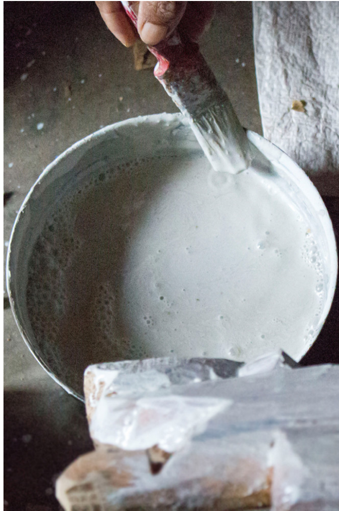
A paste of primer (mixed with water) is used for coating on the wooden toy.