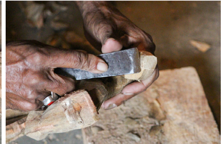
The sharp edges are smoothed.