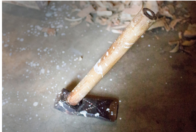
Axe is used for cutting the wood.

http://www.dsource.in/resource/orian-wood-en-toys-sonpur-orissa/tools-and-raw-materials