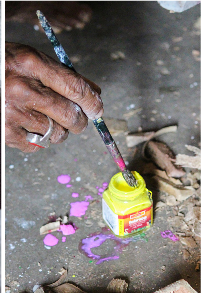
Paint and the paintbrush are used for enameling the toy.