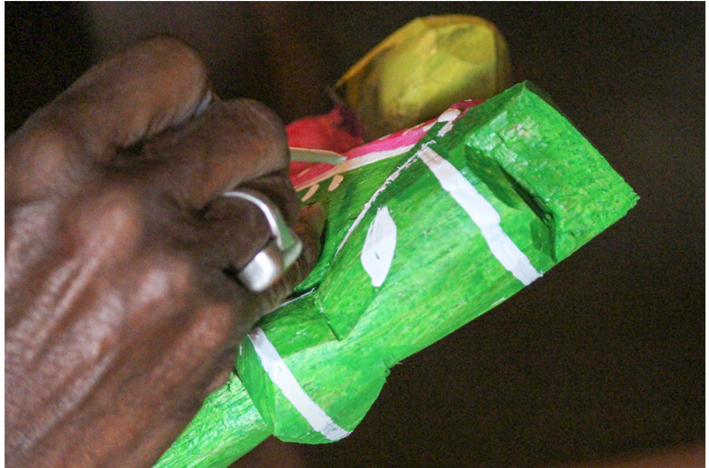
Fine details are given by enameling.