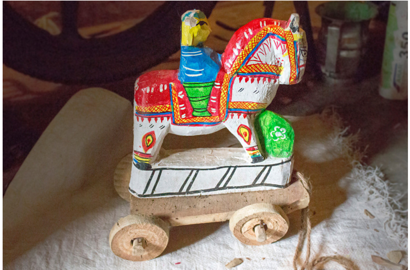
Beautifully enameled, multicolored Orian wooden toy.

These toys range in sizes from 6 inches to 2ft. The cost of most of these artifacts start from about INR100.00 and can go up in the thousands depending on the level of detail that has been requested by the customer.