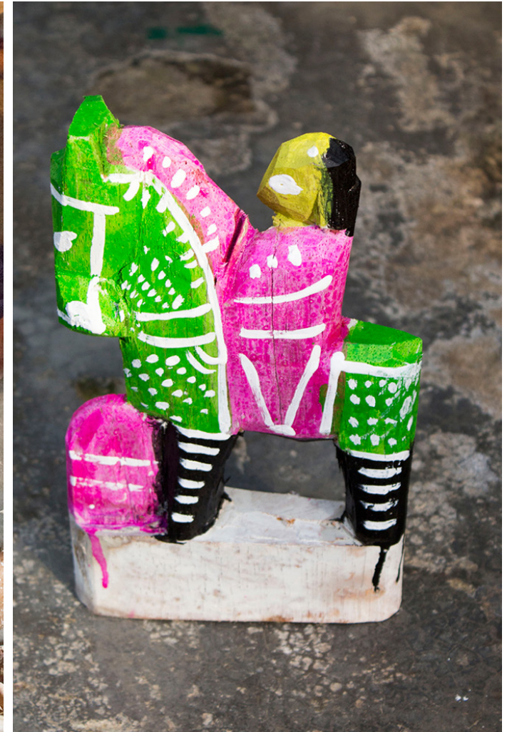
Thus the final product gets prepared.