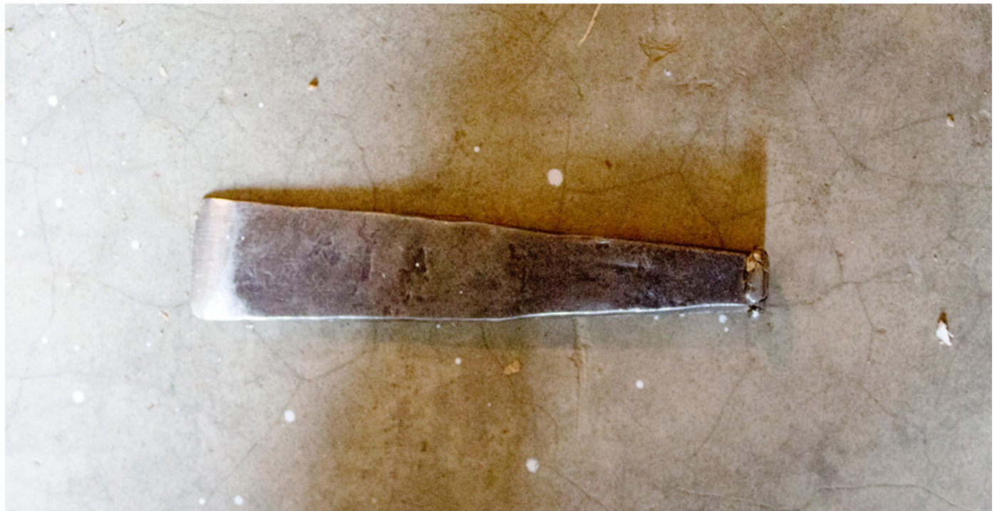
Chisel is used for scrapping out the excess of wood.