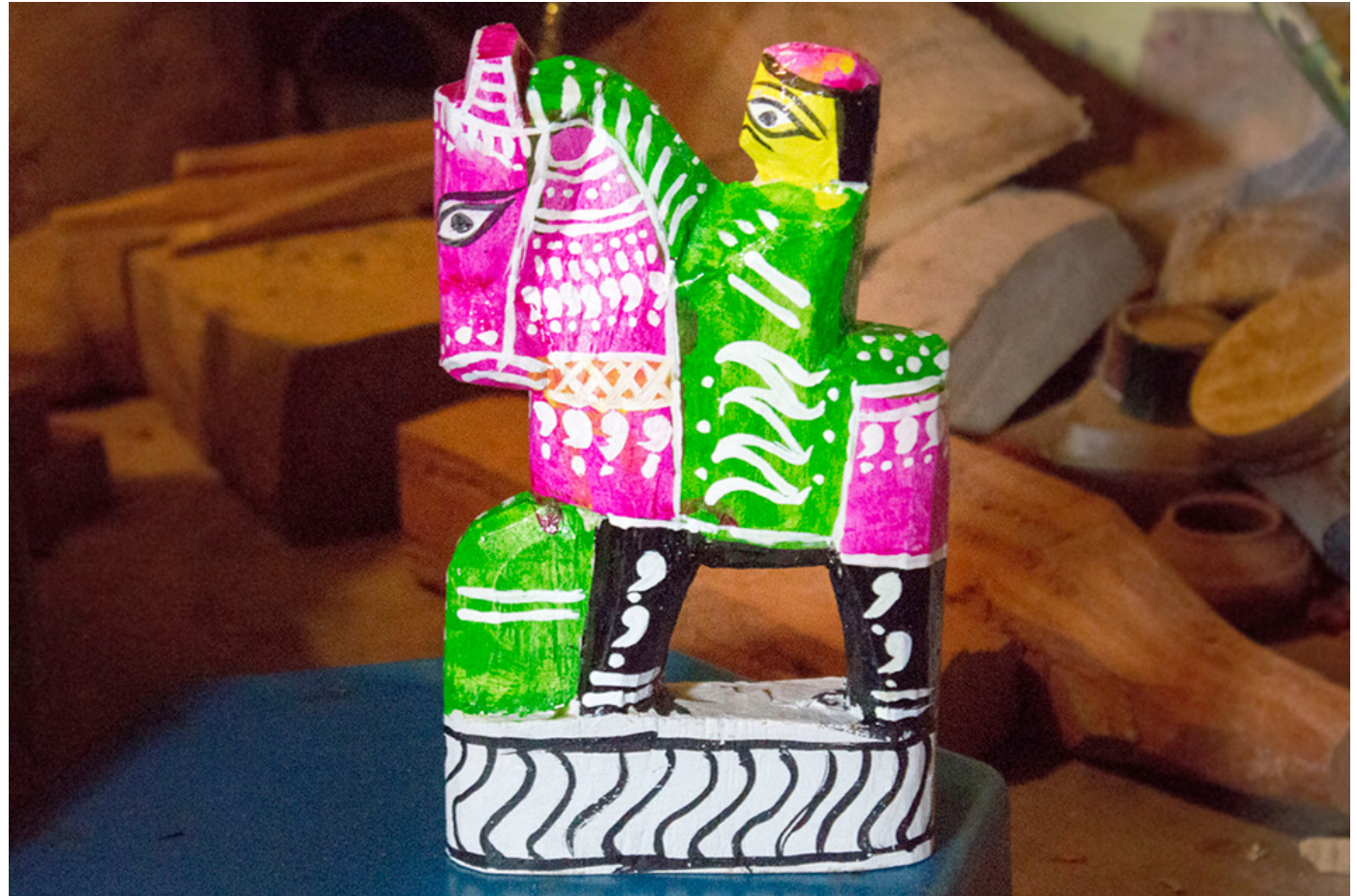
Bright and dashy Orian wooden toy that attracts every craft/art lover.