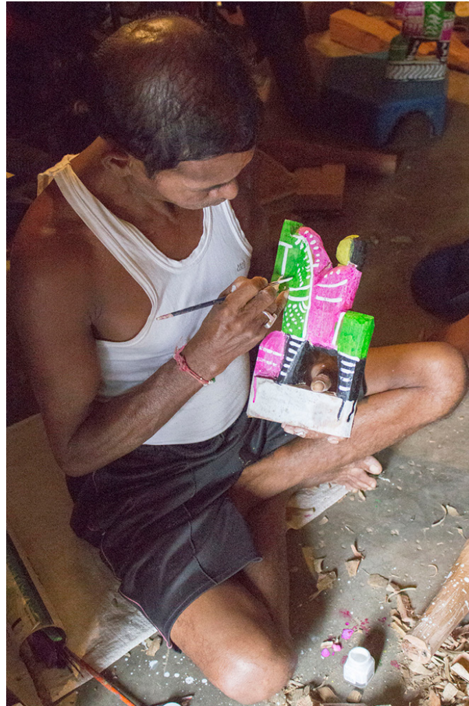
Once the base color is completely dried, the fine details are made.