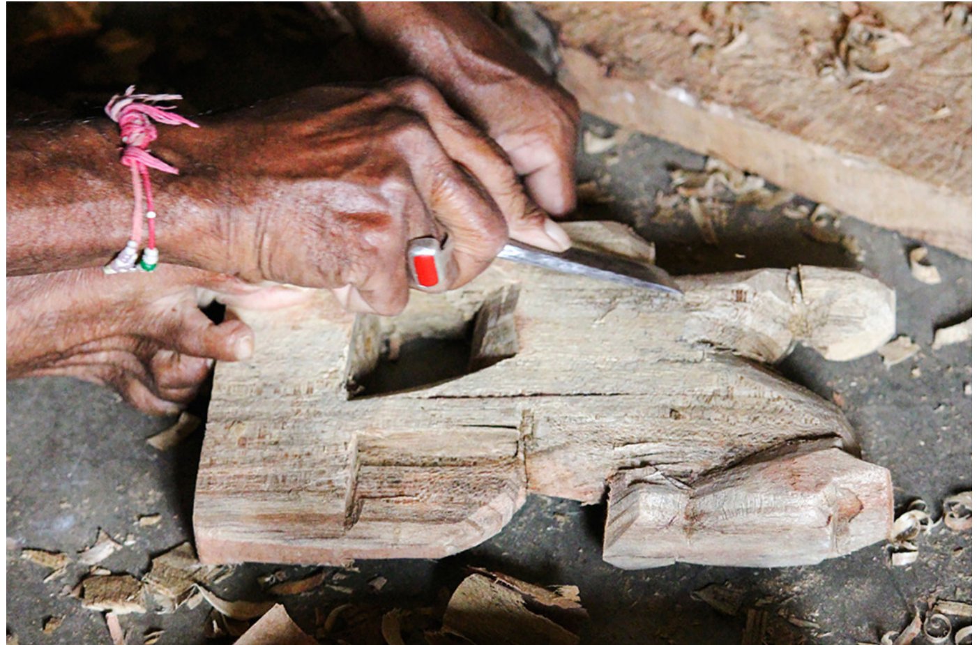
Layer by layer wood is removed to shape the toy.