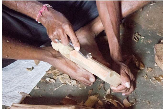
Layer by layer excess of wood is scrapped off.

http://www.dsource.in/resource/orian-wood-en-toys-sonpur-orissa/making-process