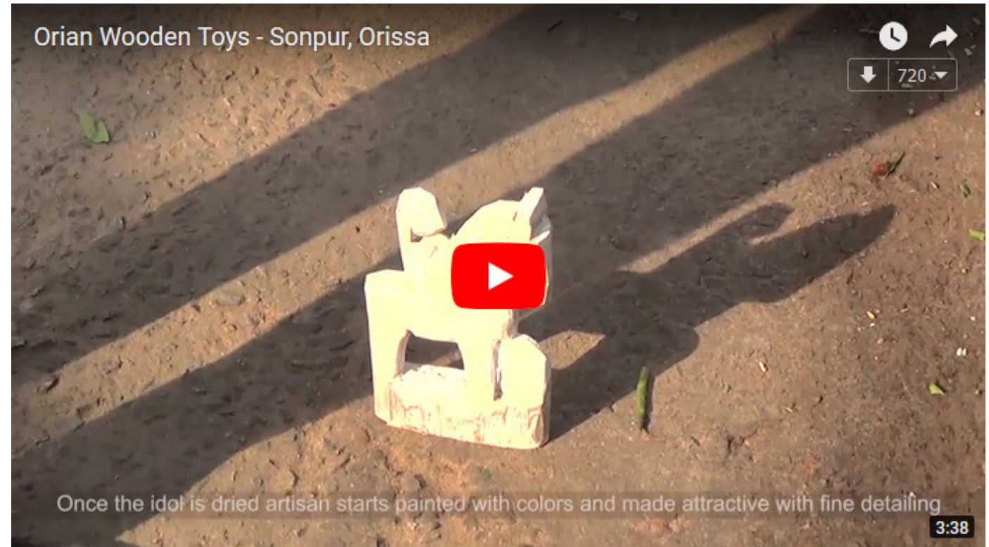
Orian Wooden Toys - Sonpur, Orissa