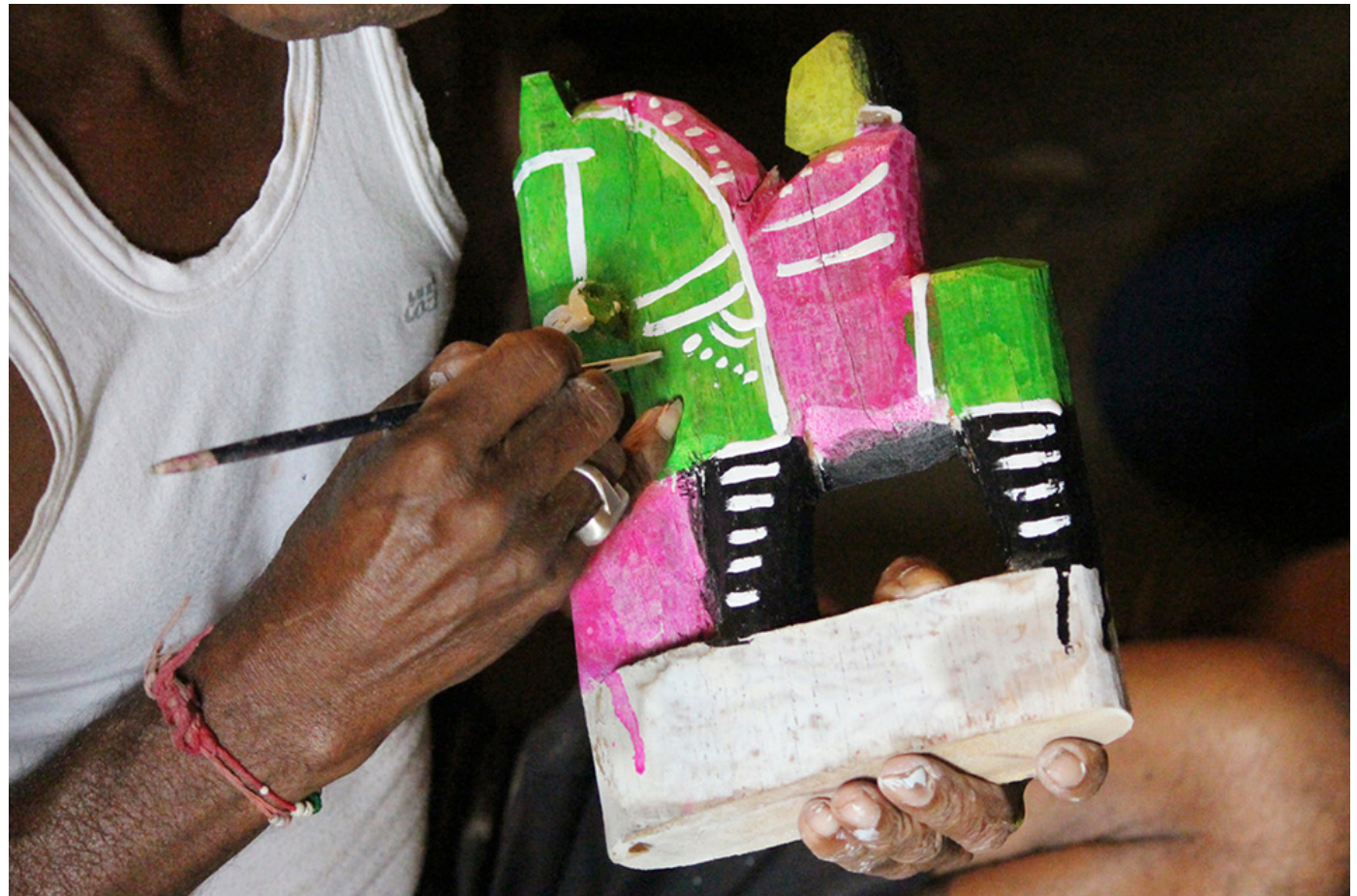
Orian wooden toys that are being enameled by the artisan.

In today's world where plastic toys are found everywhere in many different forms, these toys are a nice throw back and have a nice natural feel to them. If not to play with they are very adorable just to admire at.