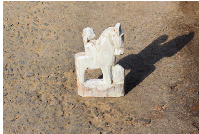
Once the desired shape of the toy is rendered the further process gets initiated.