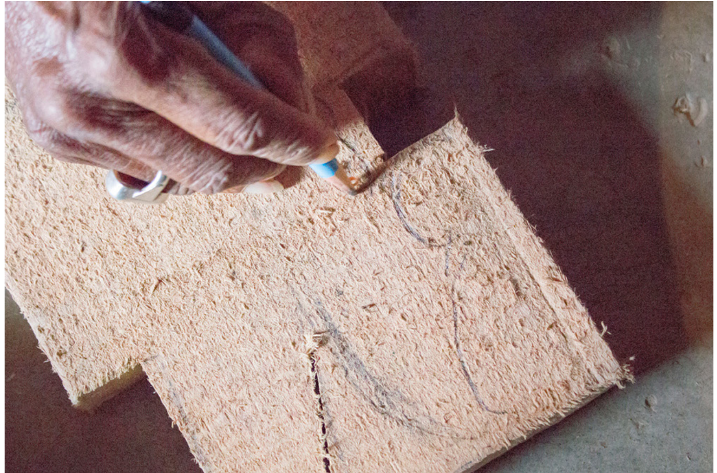
Selected wooden plank is marked as per the design of the toy.