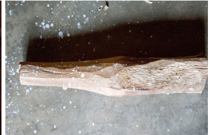
Wooden chunk is used for hammering purpose, instead of hammer.