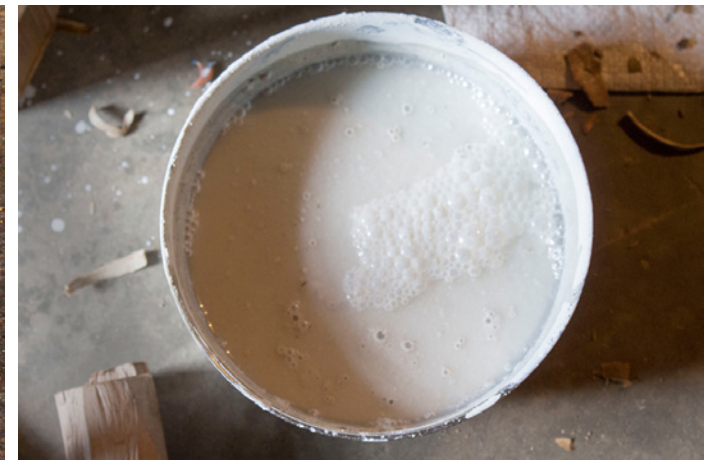
Primer with mixed water and diluted to get the required consistency.