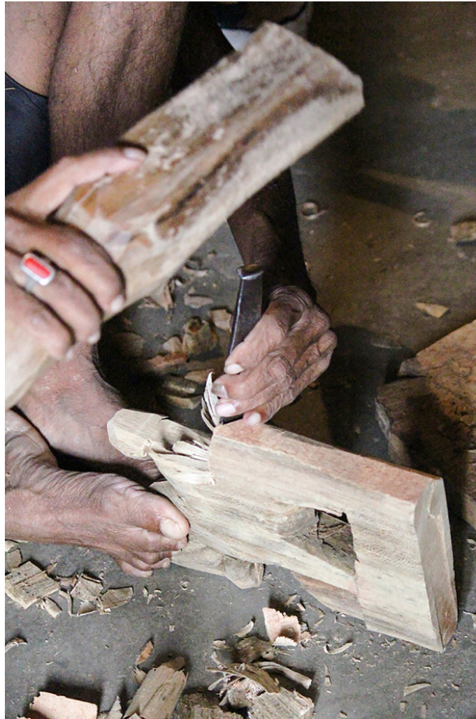
Wood is chiseled as per the design of the toy.