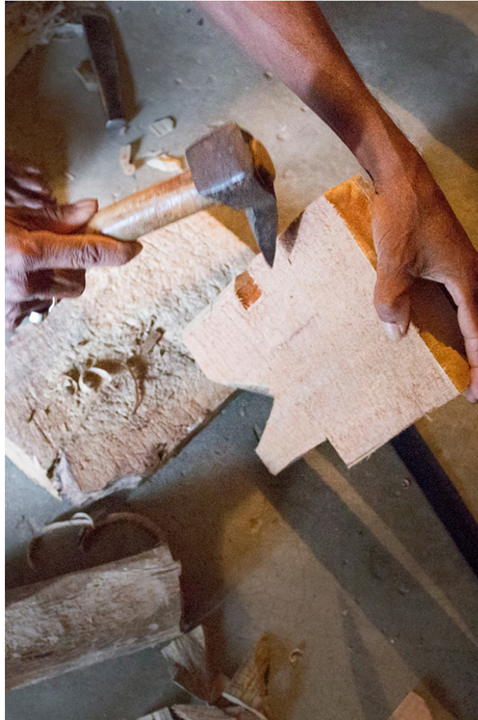
Most of the extra wood is then chopped off.