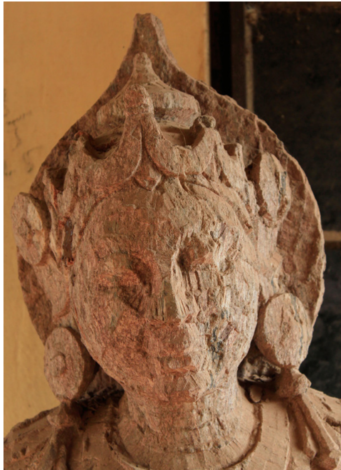
Half finished sculpture yet to be beautified and adorned with embellishments.

Unlike sculptors of other places, the artisans of Orissa are at home with a variety of materials. They handle the ultra soft white soap stone with equal facility as the slightly harder greenish chlorite or 'Kochilapathara' and the still harder pinkish Khandolite and the hardest of all the black granite 'Mugunipathara' by just using tools like hammer and chisel. Whether the stone is hard or soft the outline is first drawn on the stone and then is accordingly cut. The motifs used are not uncommon and the carvings on the temples also provide models.