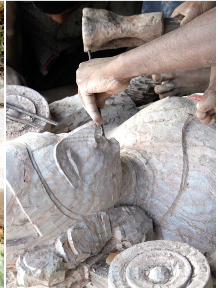
A sculptor giving the final touches to the sculpture with light hammering.