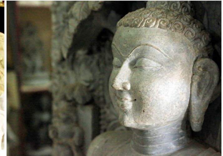
A statue of Buddha exhibiting the marvellous talent of the sculptors and the exquisite beauty of the stone craft.