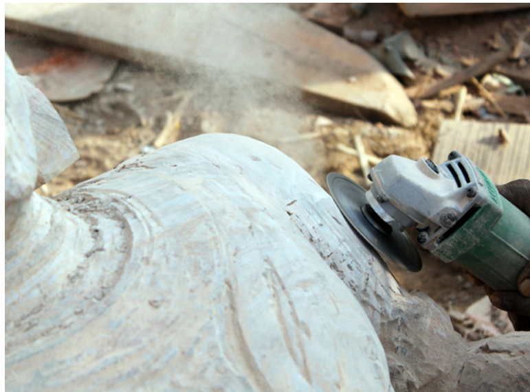
Grinding the stone using an automated grinder lessening the labour involved and cutting out time involved.