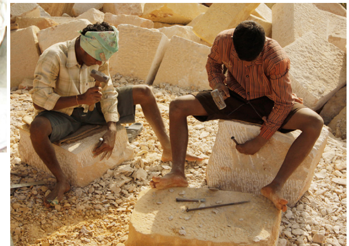
Sculptors shaping a block of stone in a desired form carefully hammering and scooping the extra material out.