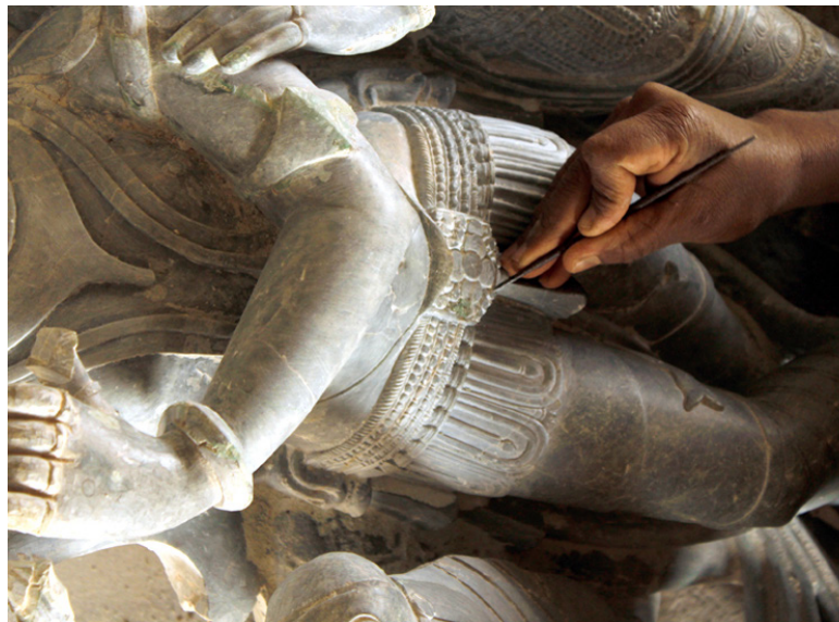
An artist painting the idol after it has been carved to give it the final finishing touches.