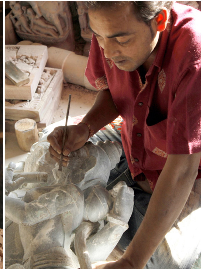
An artist polishing the statue before being painted after it has been carved out.