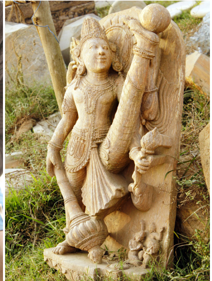
A fully carved idol of one of the gods from the Hindu mythology.