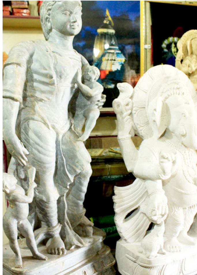
Some of the sculptures displayed at a shop in Orissa to attract the tourists from all over the world.