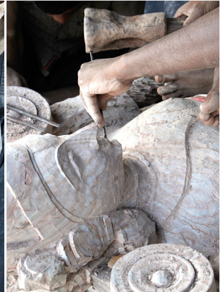
The idol still incomplete being lightly hammered to achieve the shape as desired.