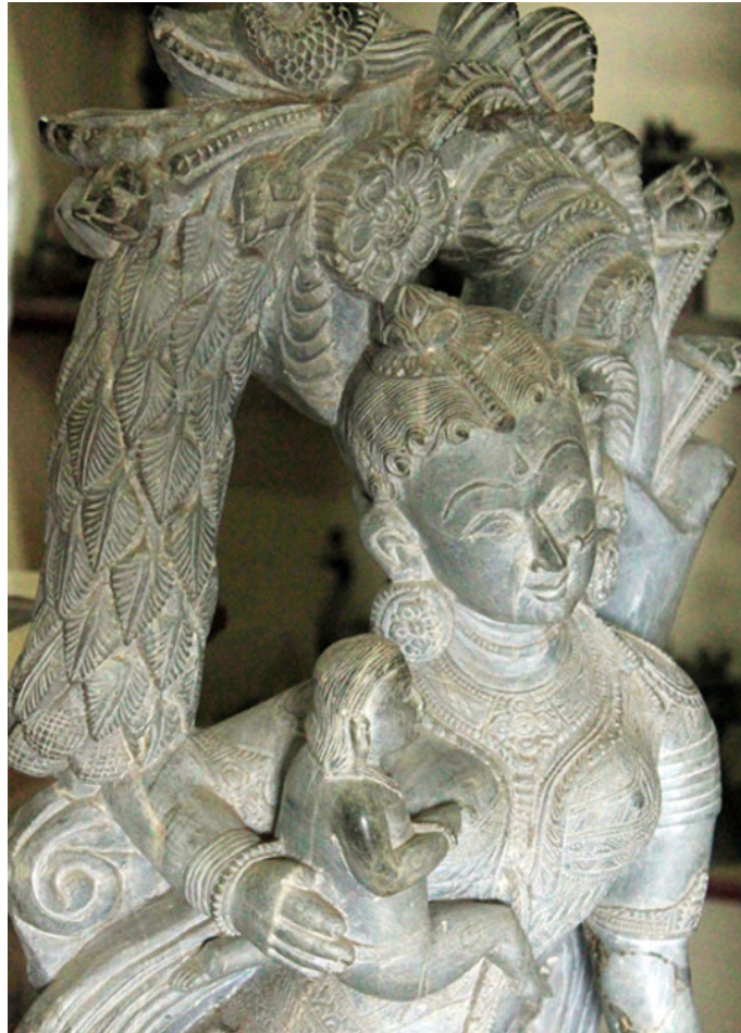
One of the sculptures exhibiting the excellence of the sculptors of Orissa.