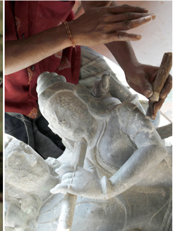
One of the sculptors sculpting the half finished piece of art.