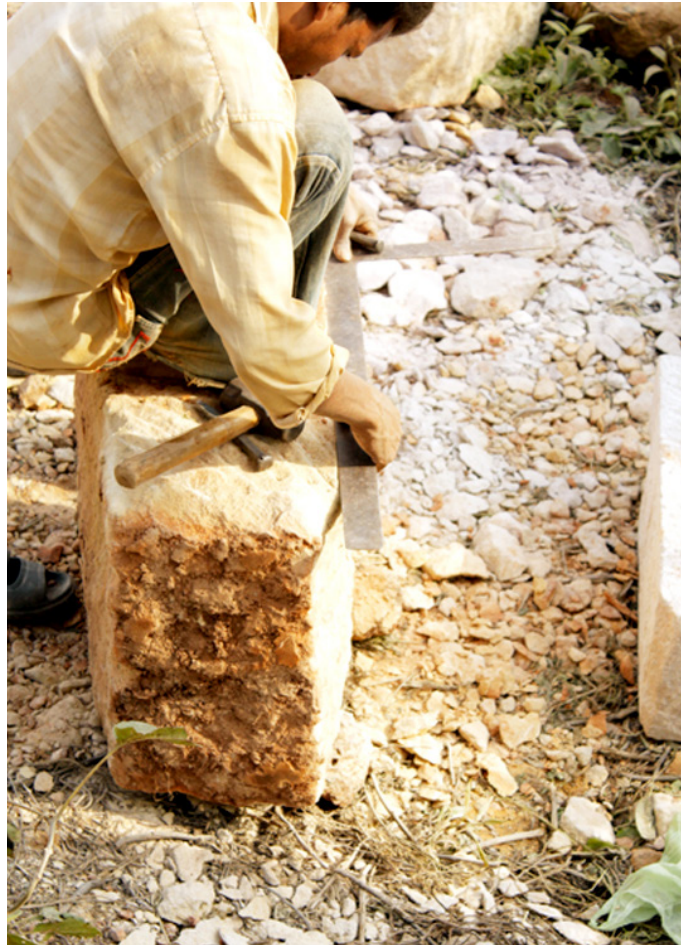
A sculptor measuring the stone before shaping it as desired.