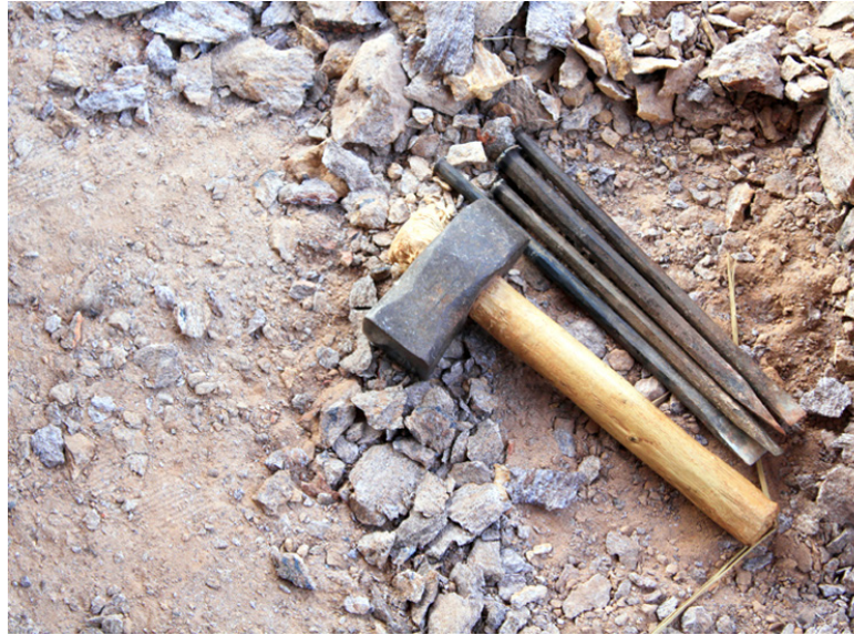
All different kinds of tools used in the stone carving process including a hammer, chisel, and different kinds of files.

http://dsource.in/resource/orissa-stone-carving/tools