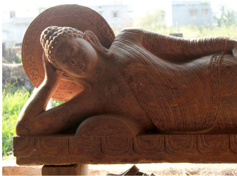
An exotic statue of the Buddha gratifying the eyes.

http://dsource.in/resource/orissa-stone-carving/romancing-stone