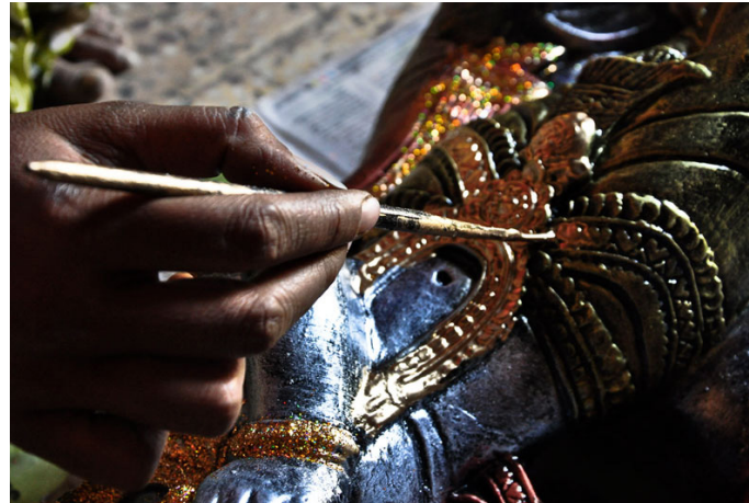
The ornaments of the Idol are painted using gold color to enhance the product.

http://www.dsource.in/resource/plaster-paris-idols-ahmedabad/making-process