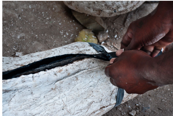
After joining the rubber mold, is tightly tied with rubber strap.