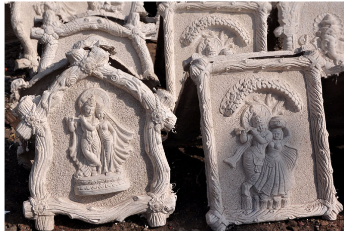
Different forms of Lord Krishna and Radha are framed.