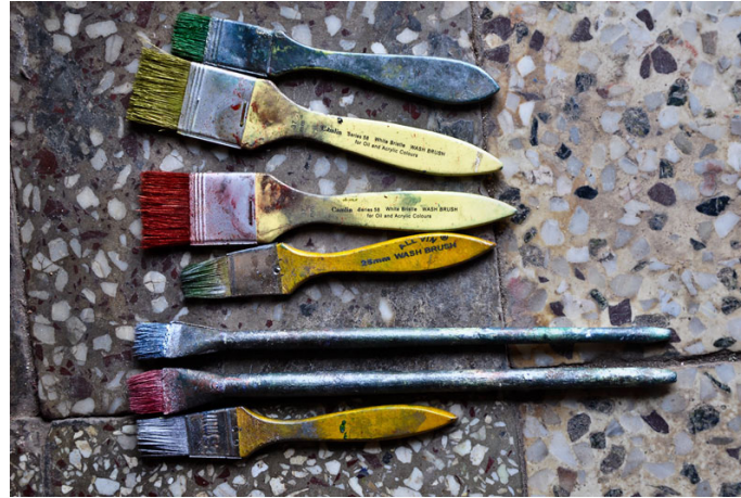
Various size and type of brushes are used to paint.

http://www.dsource.in/resource/plaster-paris-idols-ahmedabad/tools-and-raw-materials