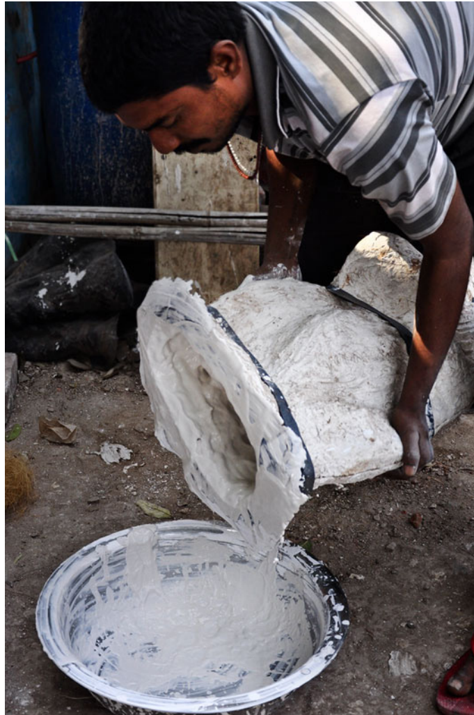
The excess pop in the mold is removed.