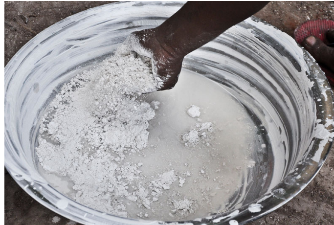
POP powder is mixed with water to make paste.

http://www.dsource.in/resource/plaster-paris-idols-ahmedabad/making-process