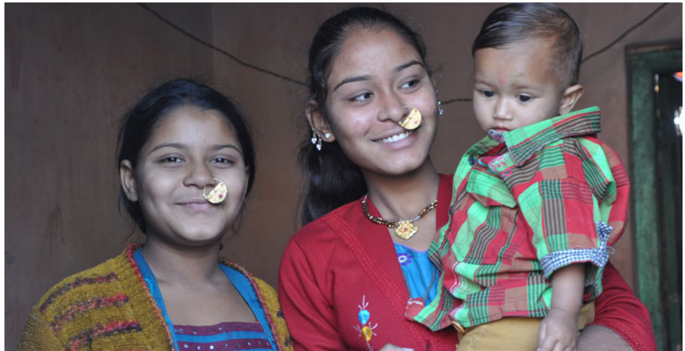
Artisans of POP idol making.