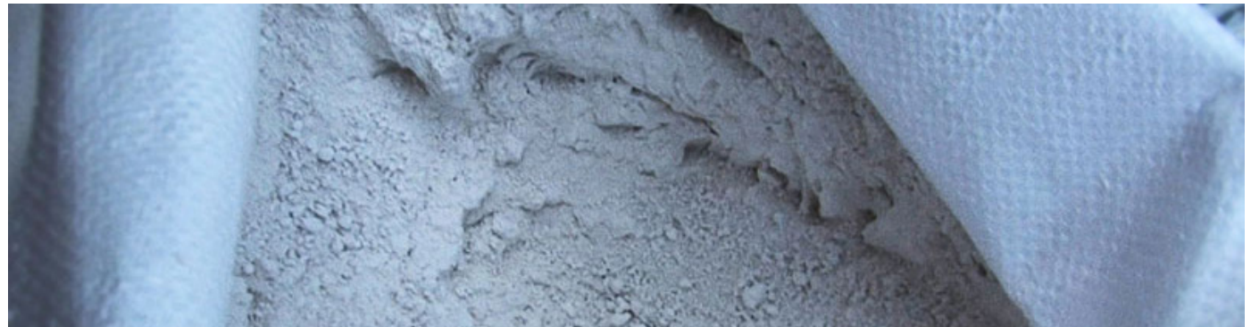
Powder of POP.

Beautifying the Idol-Sand paper is used for sanding the surface to make smooth. Idol is painted with black color, which is the mixture of (black water, color, varnish and kerosene). Different sizes of brushes are used while painting the idols. After black color glaze, the idol is blown up with glittering gold, copper, silver and chromatic colors. Painting of Pop idols consists of several steps, which add value.