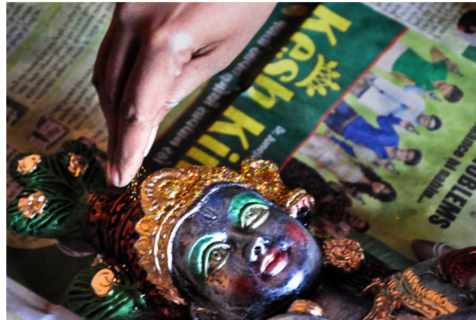
The glitter is added on the ornaments to emboss the product.