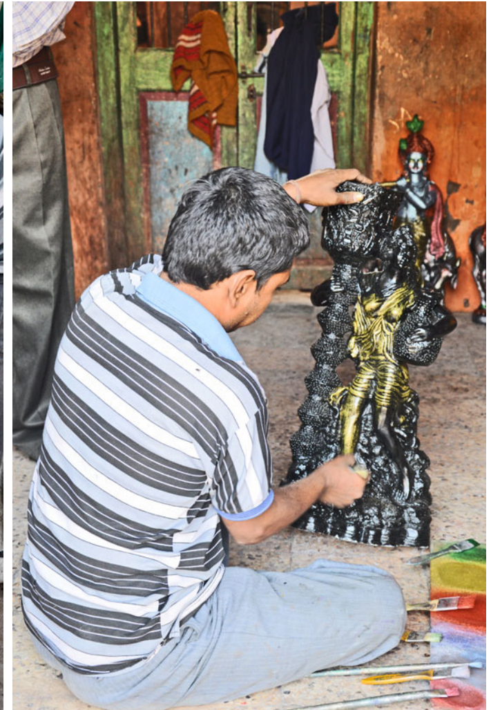
Dark Black color is coated over the white color POP base.