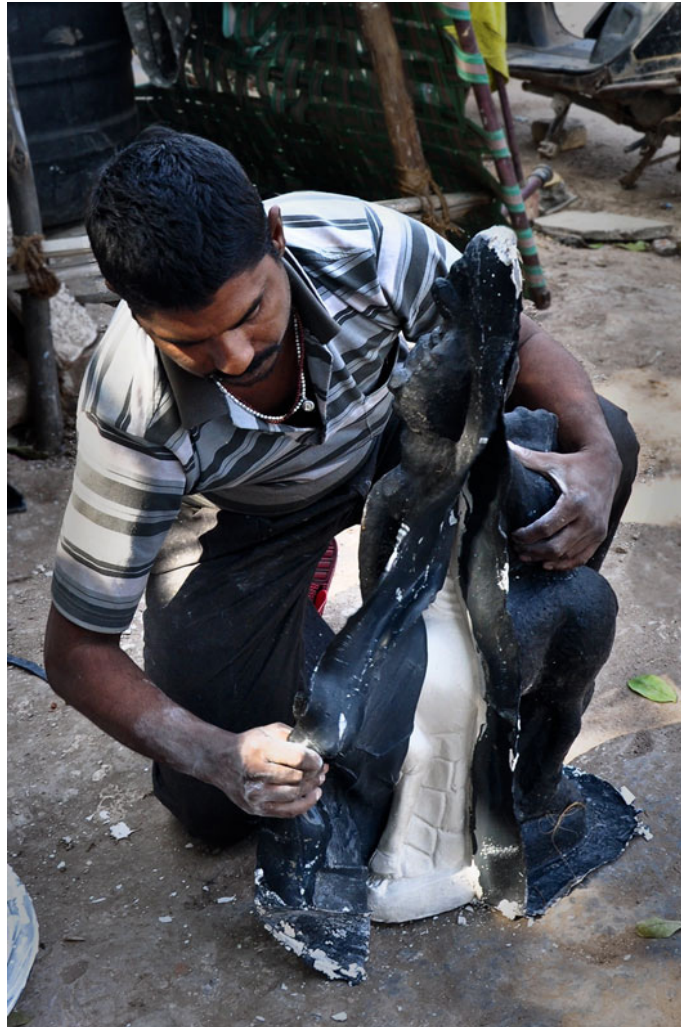
After drying the rubber mold is removed to reveal the idol.