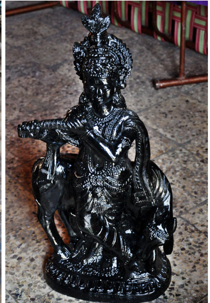
Black color, which is a mixture (varnish, black water color and kerosene) is coated to the Idol of lord Krishna.