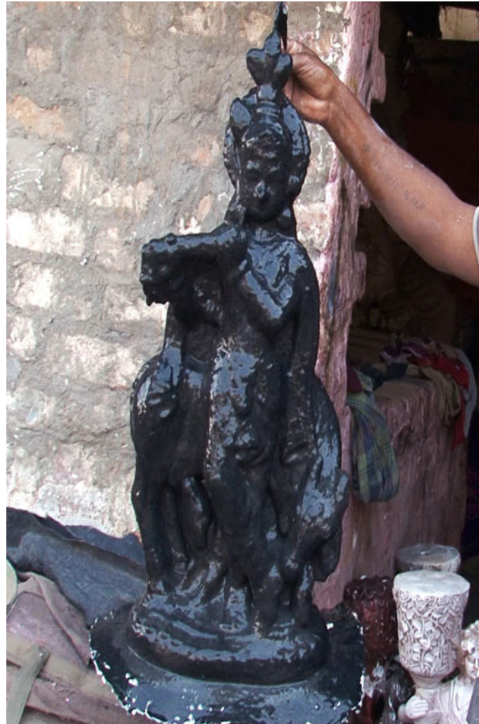
Black rubber mold is used to form the shape of the product.