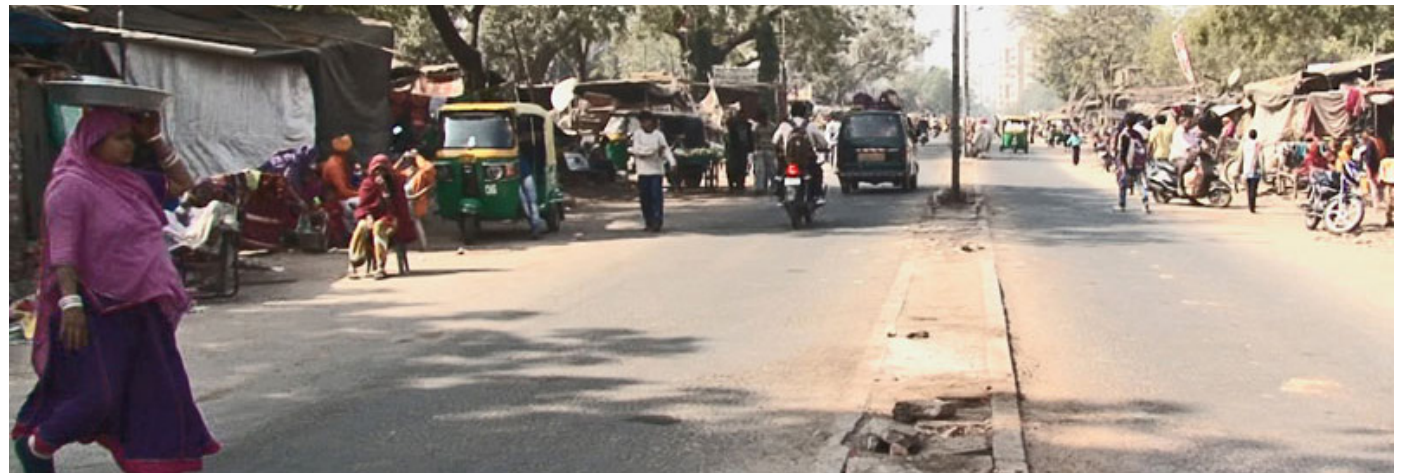
Gulbai Tekra is a famous place in Ahmedabad for making POP Idol.

The artisans are highly involved in producing different kinds of PoP idols to supply to the local people and market needs. The idols of PoP products are available both in traditional as well as contemporary designs. The products made are used for worship as well as decorations at home. Rubber-molding technique is used produce PoP idols. Vivid colors are used to paint the idol after retrieving from mold which enhances the attractiveness of the products. The young men and women are involved in making these idols. They supply Ganesh idols to Mumbai and many other places in Gujarat.