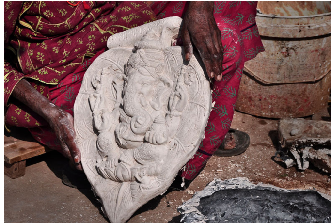
Wall hanging of lord Ganesh used as home decorator.

http://www.dsource.in/resource/plaster-par-is-idols-ahmedabad/products