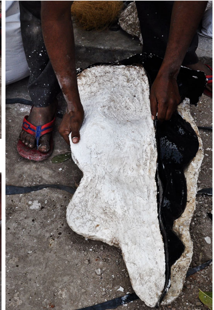
Two parts of mold are tied together.