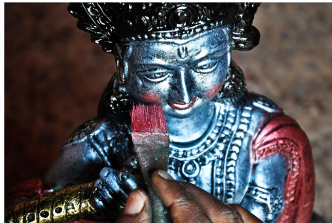
Light pink color is used as a cheek gloss to the Idol.