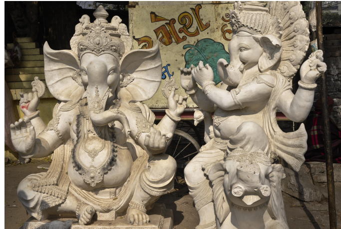
Idol of Ganesh statue is dried in the sunlight.

http://www.dsource.in/resource/plaster-paris-idols-ahmedabad/introduction