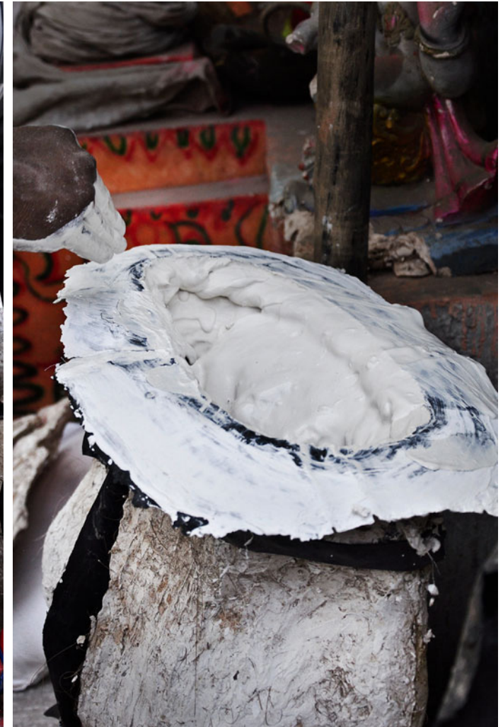
The paste is allowed to set in the mold for 30 mins.