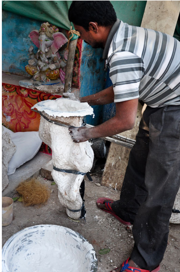
Two parts of mold are tied tightly, with the use of tier tube strips.