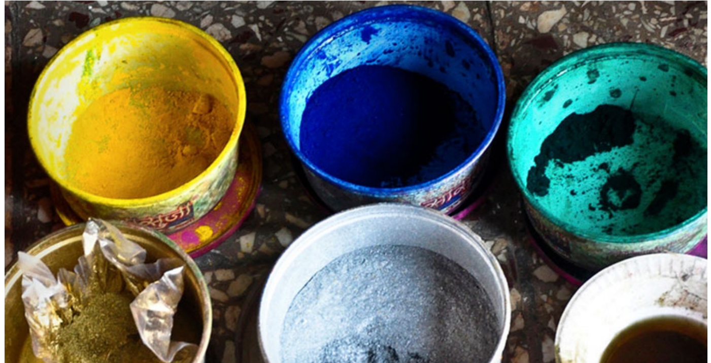
Different types of bronze colors and varnish are to paint the Idol.