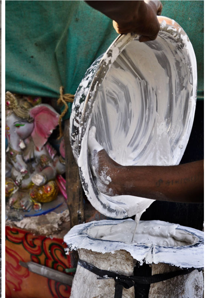
The POP paste is poured into the mold.