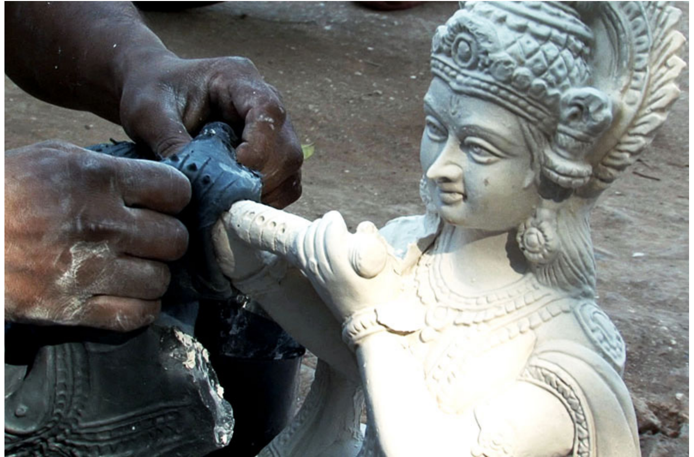
Black rubber is removing safely to maintain the detail.