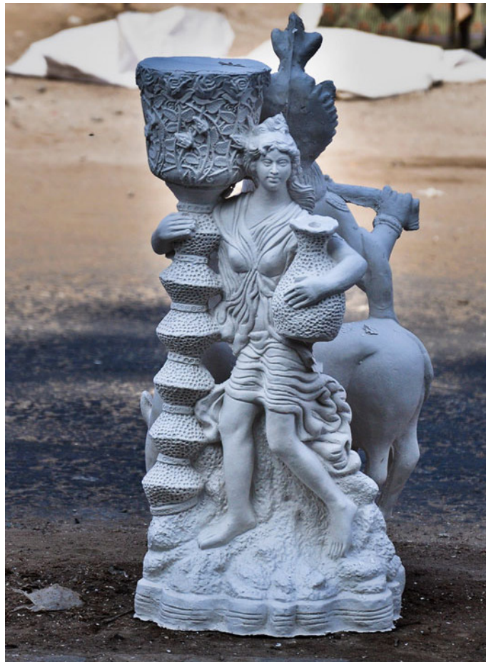
Art piece of Women holding Vases.

The products available vary in different sizes and ranges. The artisan prepares 10 idols each day. Size of the products varies from 1 ft. to 5 ft. and the cost of the products starts from Rs. 150/- and to Rs. 5000/-.