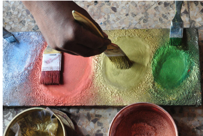
Color powder, Varnish and kerosene are mixed in the ratio of 1:3 and applied on the product.

http://www.dsource.in/resource/plaster-paris-idols-ahmedabad/making-process