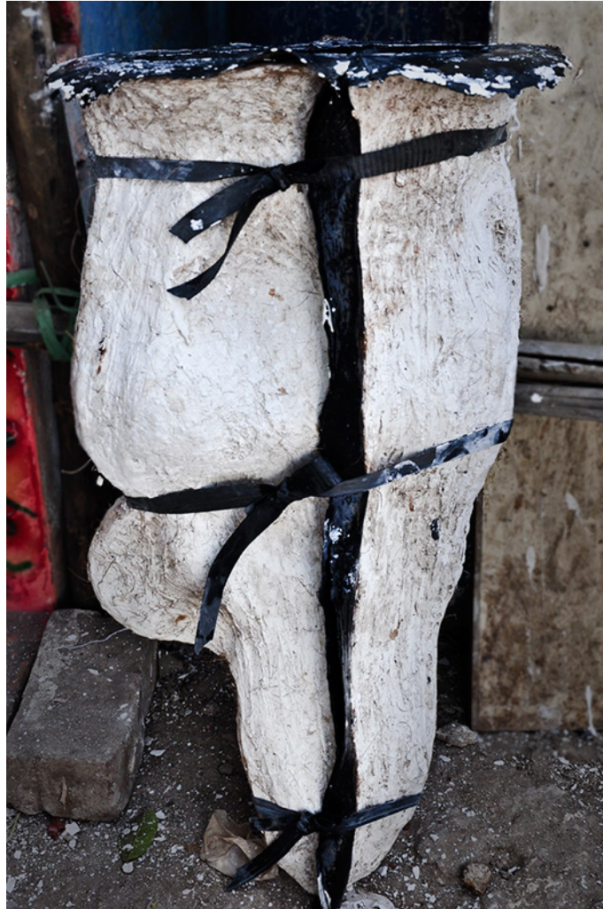
Rubber and coir mold is tied and kept for molding.