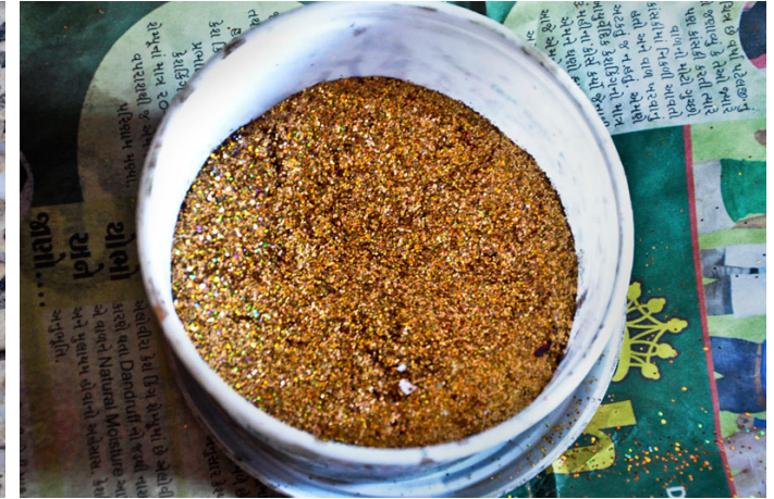
Golden glitter is used to enhance the luster of the product.