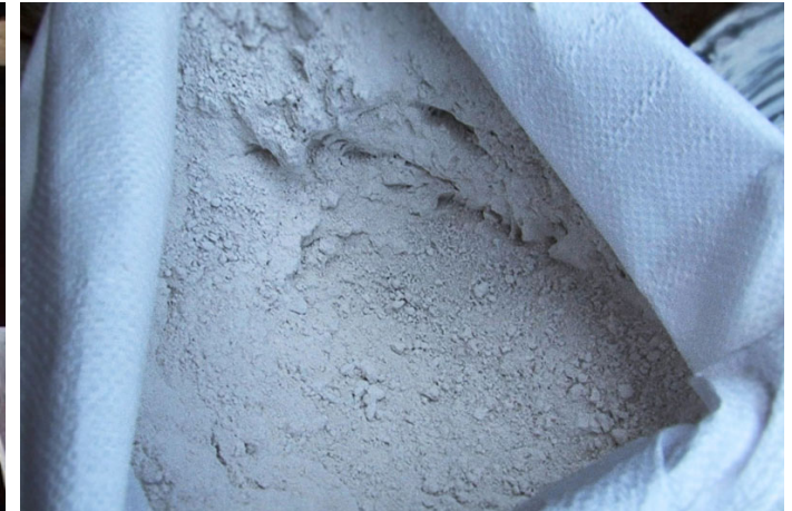
Plaster of Paris(pop) is a raw material to make the Idols.