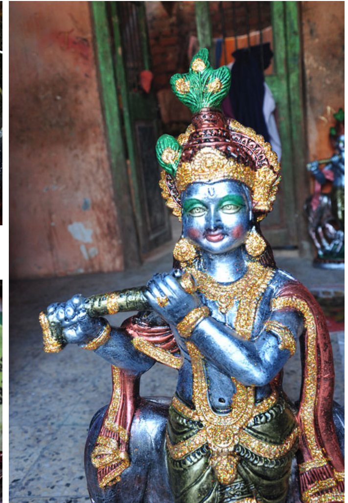
The final Product of the Lord Krishna.