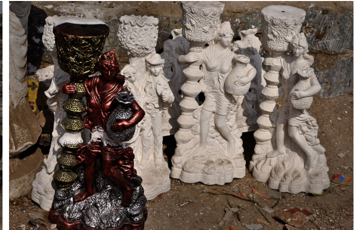
Copper, silver and gold bronze colors are used to decorate POP products.