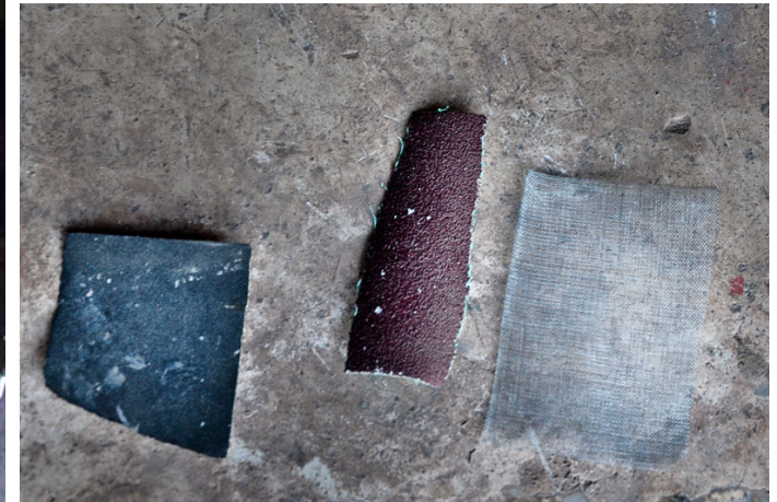
Types of Sand paper used to smoothen the surface of PoP.