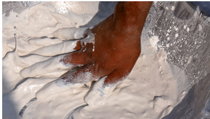
POP powder is mixed with water to make paste.

Painting: The prepared idol after detailing work over is then sent for painting process. Painting is done with glitter/shiny colors as well as normal Asian paint colors. Initially, the idol is painted with black Japanese color and then the glitter/shiny colors are painted by spraying on it. The jewels of idol are embellished with gold color, facial expressions are with copper color and eyes are with silver color. Finally, bronze color is used to highlight the facial features. Pink, golden yellow, ice blue, red, green colors are also used to decorate the products.