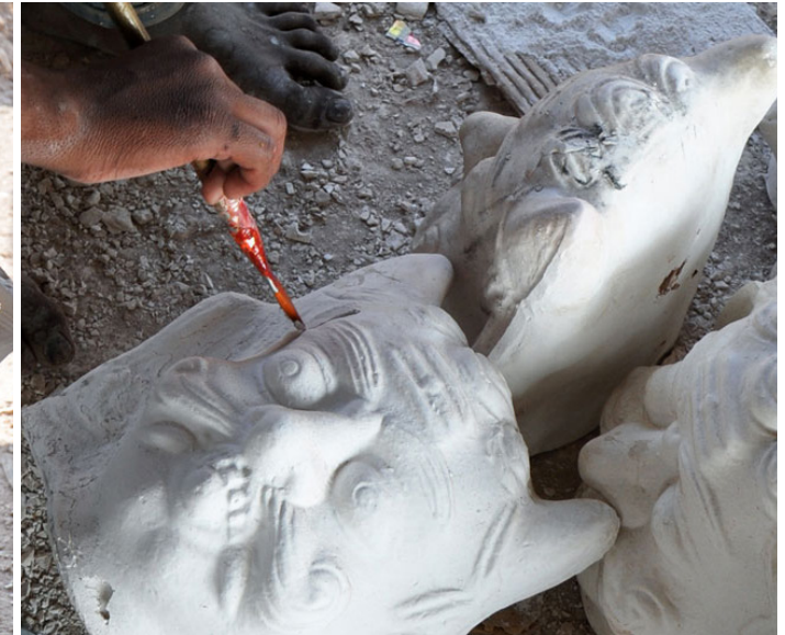
Filling the gaps with POP paste – the gaps are formed during casting process.