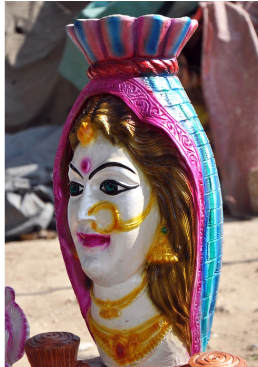
A flower vase made of POP is decorated in different colors.

Mariyappan Palya near Mysore road is located in Bangalore. The area is well noted for POP idol making activities. Idol makers belong to the same family root and migrated from Rajasthan and have settled in Bangalore for last several years. The artisans are highly engaged in producing different kinds of POP (Plaster of Paris) idols to cater to the local and market needs. The range of their collection is available in traditional as well as contemporary styles. All the POP products are ideal for home and garden decoration purposes. Artisan uses readymade mold which is made of rubber for casting process. POP solution is poured into the rubber mold and dried. The idol after retrieved from the mold is attractively painted using different colors and gold glitters. One can see the streets of Mariyappan Palya filled with sparkling products in glittering gold and silver sheen.