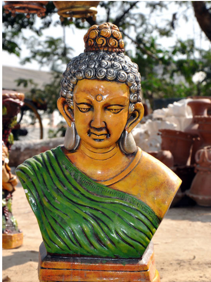
Colorfully painted image of Gotham Buddha.

Beautiful idols of gods like lord Ganesha, lord Krishna and sun God are available in glittering gold, copper and silver shades. Products also include the idols of animals like elephant and deer. Idols of elephant are available in different sizes in intricate patterns. Huge flower vases are available with different motifs. Intricate flower motifs are created on almost all products. Face of a village woman is beautifully depicted on few vases. Laughing Buddha in different postures, faces of demon, beautiful decorative garden pieces and wall decorators also included in the product category. Few other readymade clay and ceramic products are also imported from other places to cater to the local needs in Bangalore.