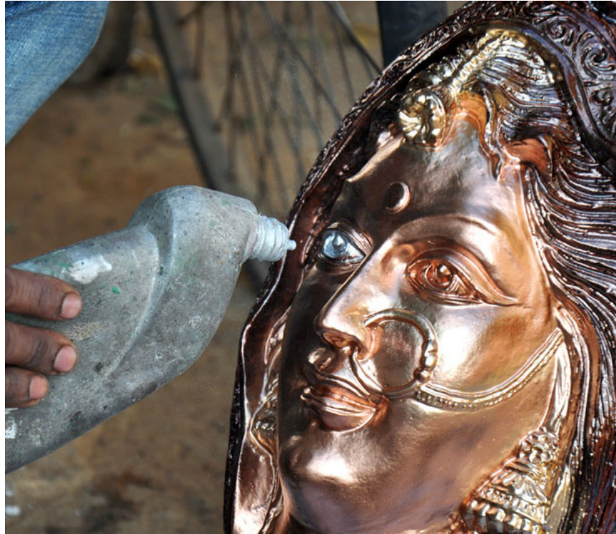
Eyes are decorated with silver color.