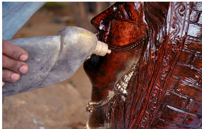
Gold color is sprayed to embellish the jewelry.