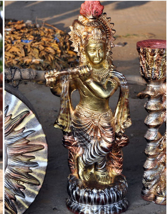
Lord Bala Krishna image in gold and silver sheen.