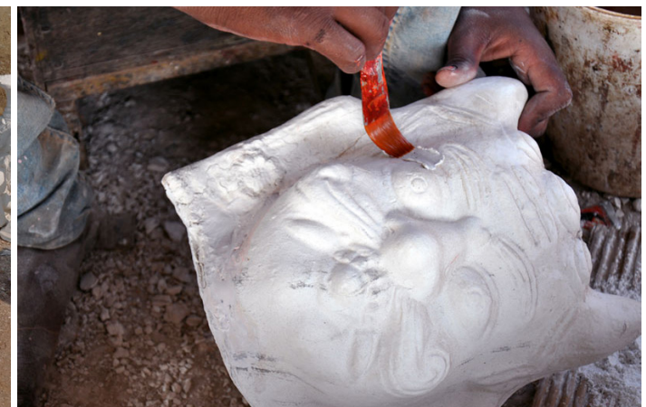
The gaps and cracks are being filled with POP paste.