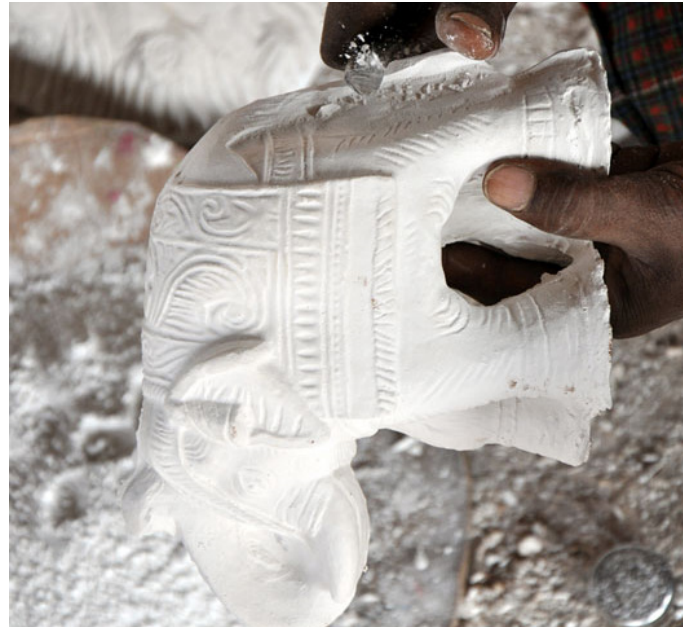
Artisan is removing the extra POP and shapes the idol into fine edges.

http://www.dsource.in/resource/plaster-paris-idols-bangalore/making-process