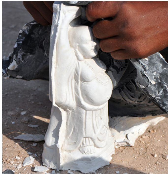
After drying the rubber mold is removed to reveal the idol.