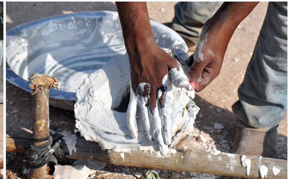
Again thick POP paste is poured into the mold.