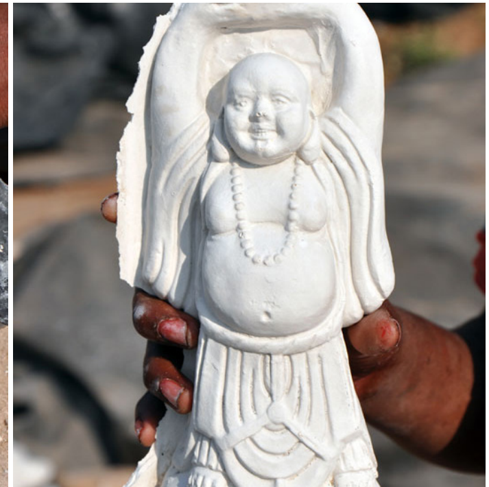
The closer view of the casted idol.