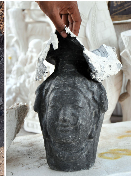
Rubber mold is used for POP casting.