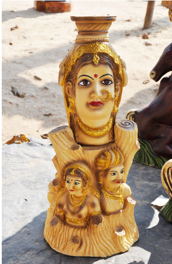
Flower vase depicting village woman.