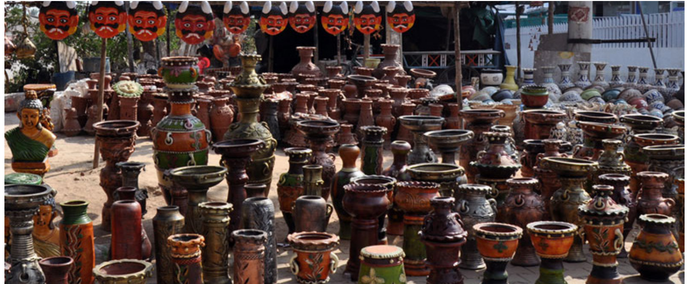
Dark colors are attractively painted over white background.

http://www.dsource.in/resource/plaster-paris-idols-bangalore/introduction