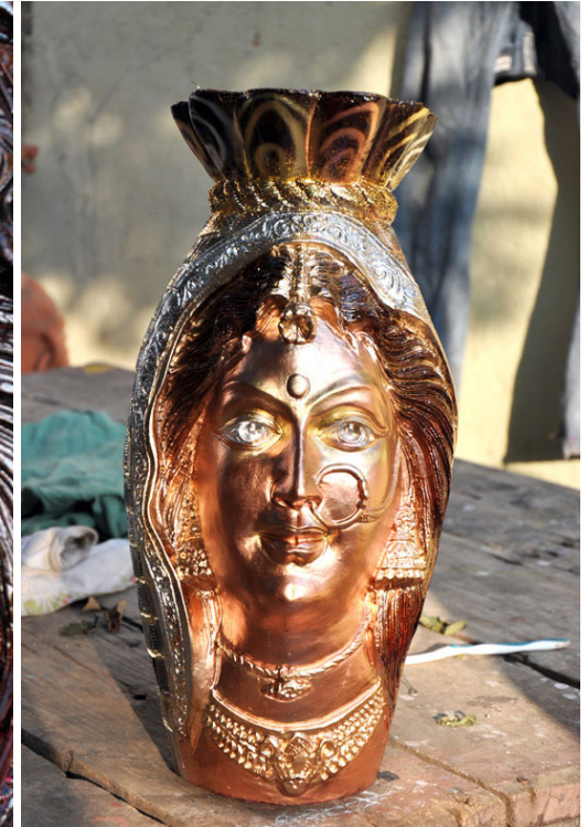
The painted product is kept for drying.