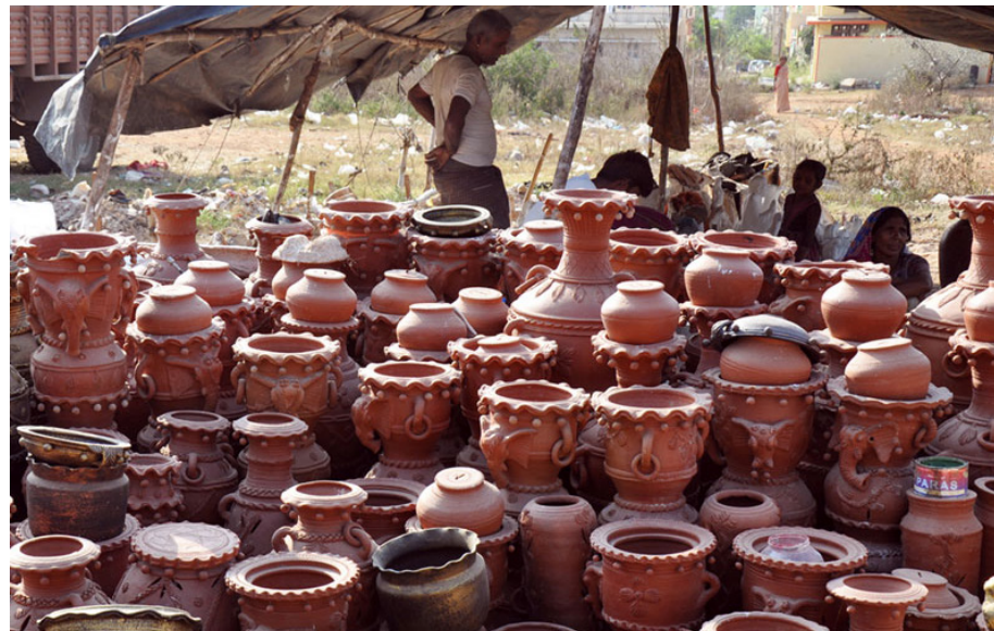
Dark colors are attractively painted over white background.