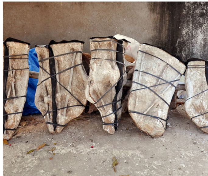
Different size and shapes of molds are used in POP casting.