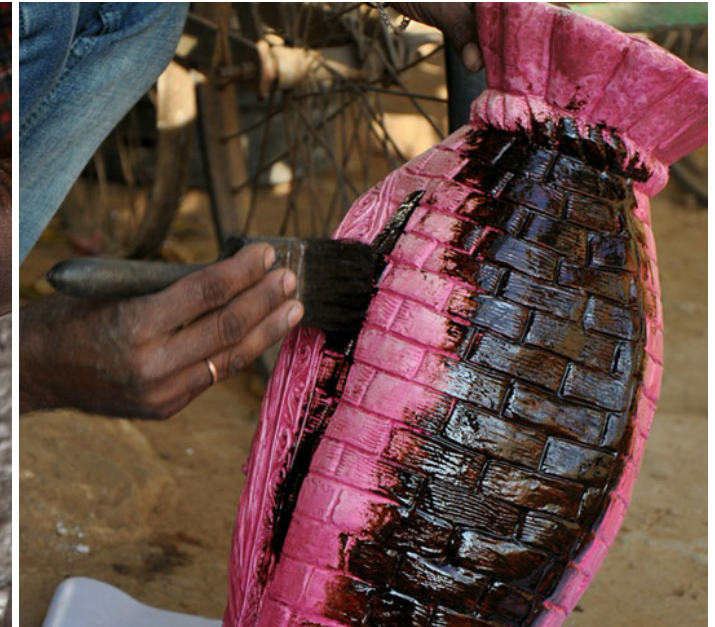
Black Japanese paint is coated on the idol.