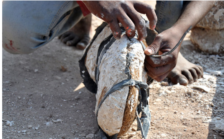
After placing rubber mold, the mold is tightly tied with rubber strap.

http://www.dsource.in/resource/plaster-paris-idols-bangalore/making-process