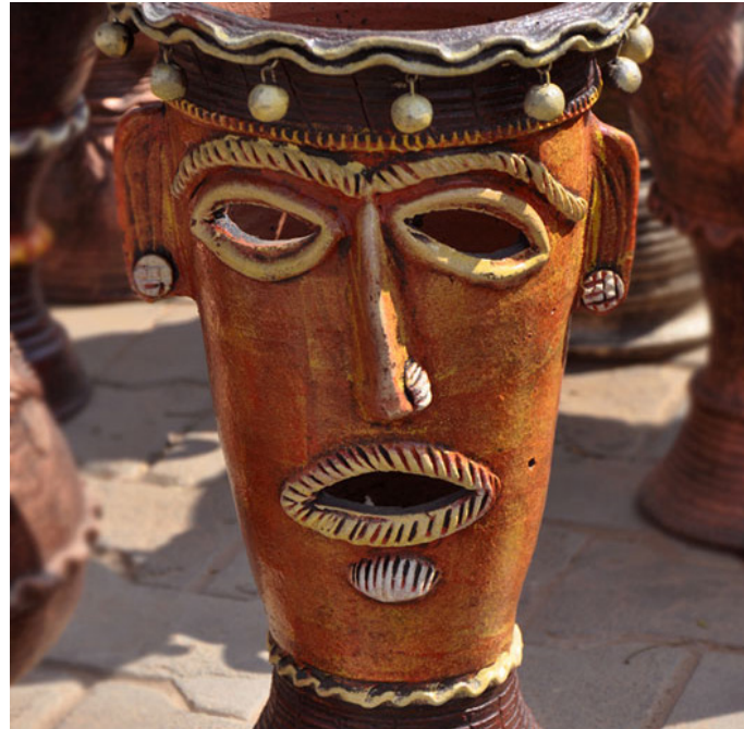
Typical garden decorator in darker hues.