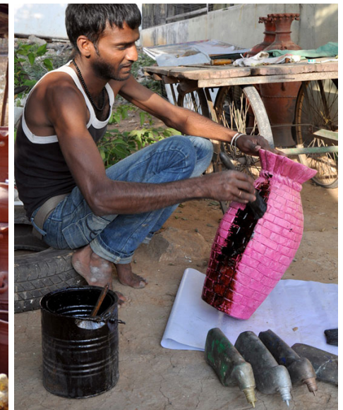
Glittering copper, silver and gold colors are used to decorate POP idols.