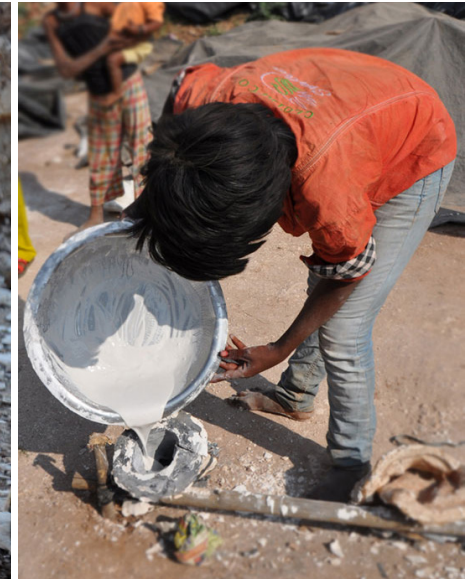
The POP paste is poured into the mold.