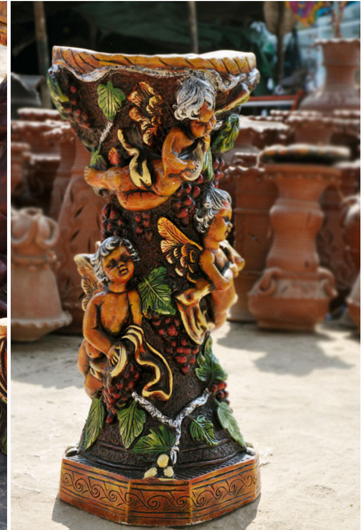
A stand casted in POP depicting angels.