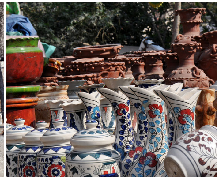
Dark colors are attractively painted over white background.