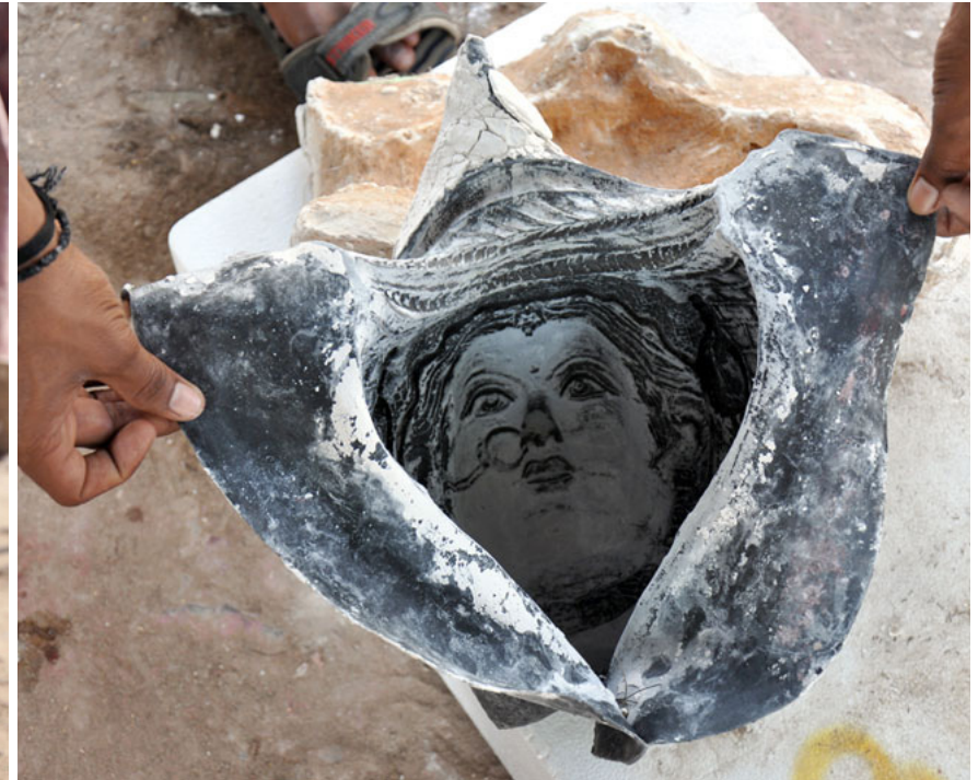
The rubber mold with detailed impression used in POP casting.