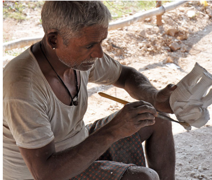
Skilled artisan engaged in detailing process.

http://www.dsource.in/resource/plaster-paris-idols-bangalore/introduction