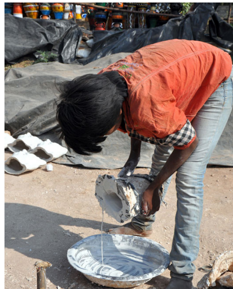
The excess solution in the mold is removed.