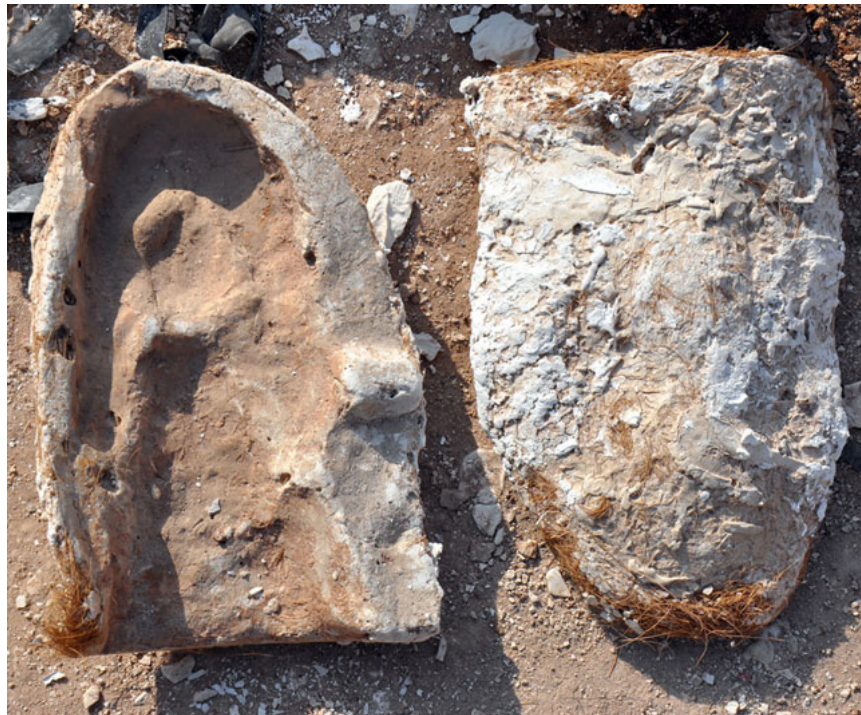
Mold made of coir and POP.

Plaster Of Paris is the main basic raw material used in idol production process. Normal water is used to mix with POP powder to make solution. The slurry POP solution is poured into rubber mold which is covered by POP mold. The POP mold which is used to cover the rubber mold is made by mixing POP paste and coconut coir. Once idol is revealed/extracted, the detailing works are done with scrapers and chisels. Finally, the idol is painted with black Japanese oil which is made by mixing Tar, varnish and kerosene. After coating black color, the idol is embellished with glittering gold, copper, silver and bronze colors. Different sizes of brushes are used while painting the idols.