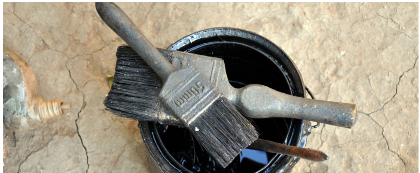
Japanese black paint is used to paint on the idol.