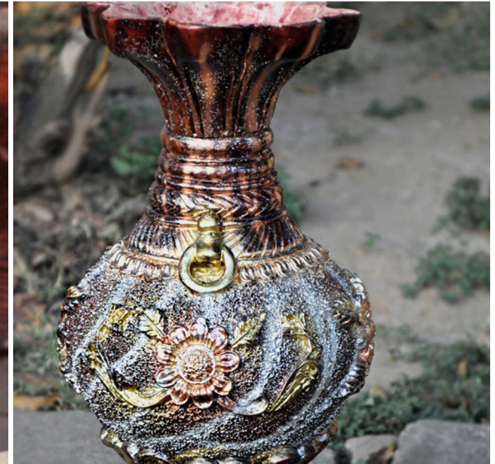
Flower vase is beautifully casted in floral motifs.