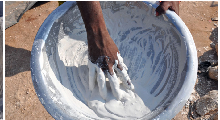
POP powder is mixed with water to make paste.