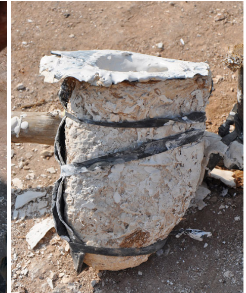
The mold is filled with POP paste and then tightly tied using rubber strip.