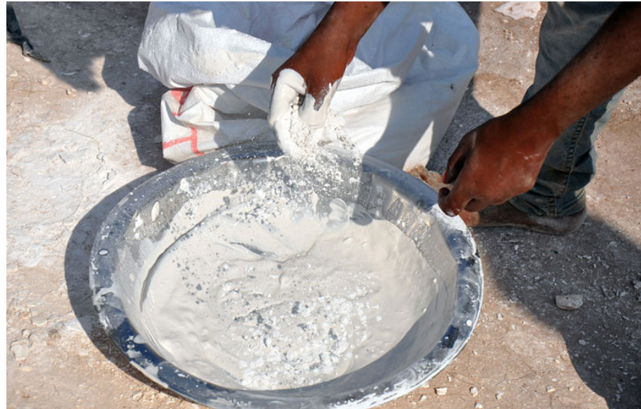
POP paste is made by mixing water and POP powder.

http://www.dsource.in/resource/plaster-paris-idols-bangalore/tools-and-raw-materials