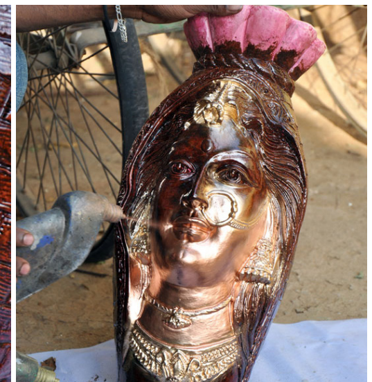
Copper color is sprayed to the face.