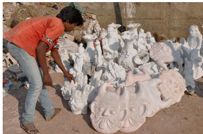
Idols are kept for drying under sunlight.