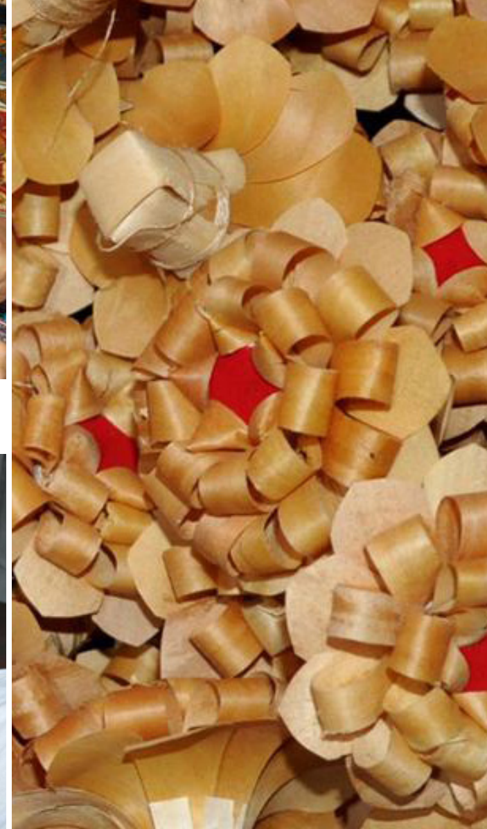
Sandalwood flowers used in garland making.