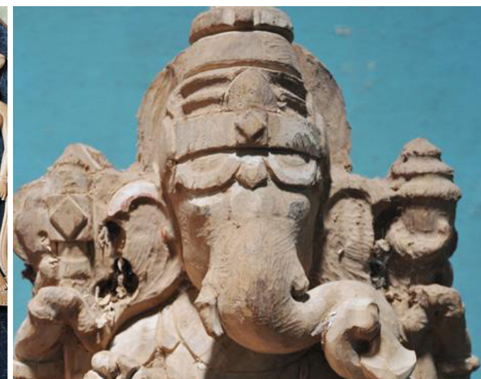
Huge idol of lord Ganesha.