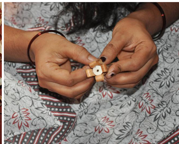
Arranging the strips of wood to make flowers.