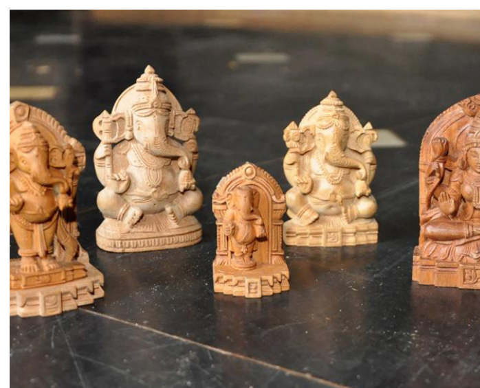
Different postures of deities ready to adorn the spaces.