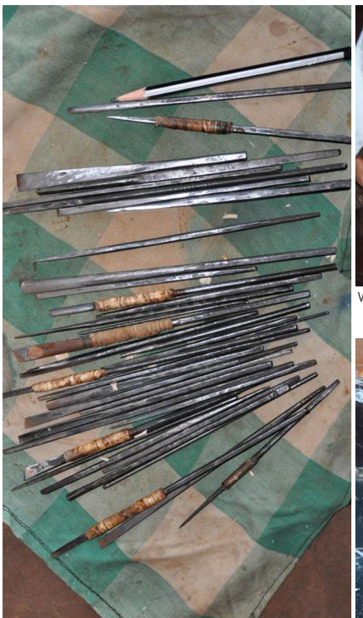
Different types of carving and scraping tools.