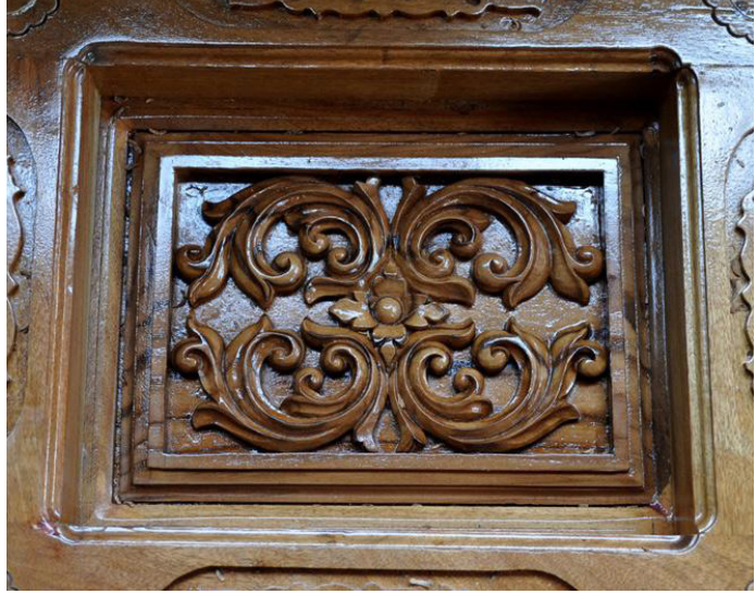
Door panel in intricate floral design.