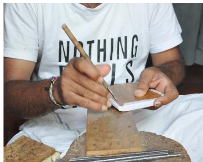
Expensive sandalwood is carefully carved to avoid damages.