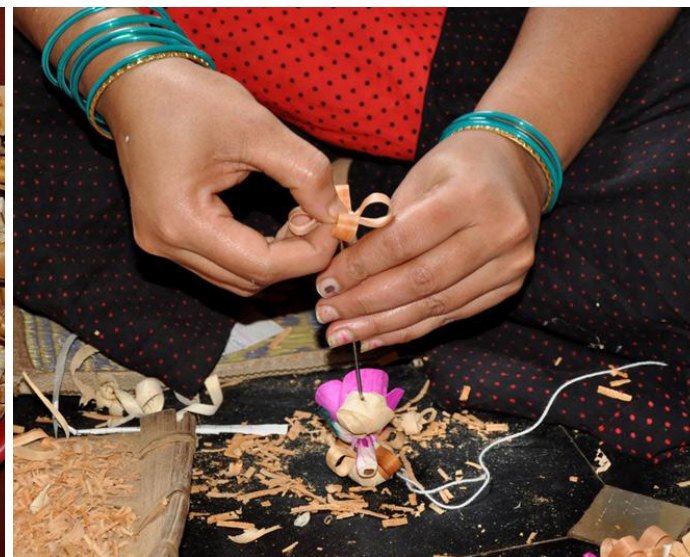
Artificial flowers are added to the garland.