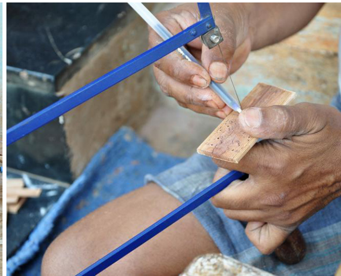
A coping saw is used to cut intricate external shapes.