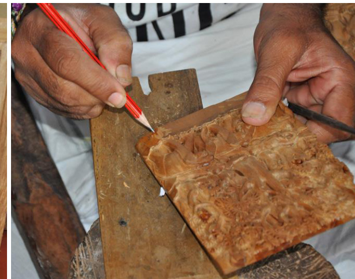
Few designs are directly marked with pencil on the surface of wood.