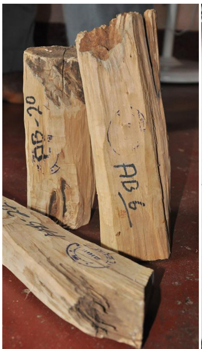
Sandalwood and other varieties of wood used as raw material.