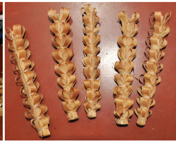
Parts of garland are made separately and joined.