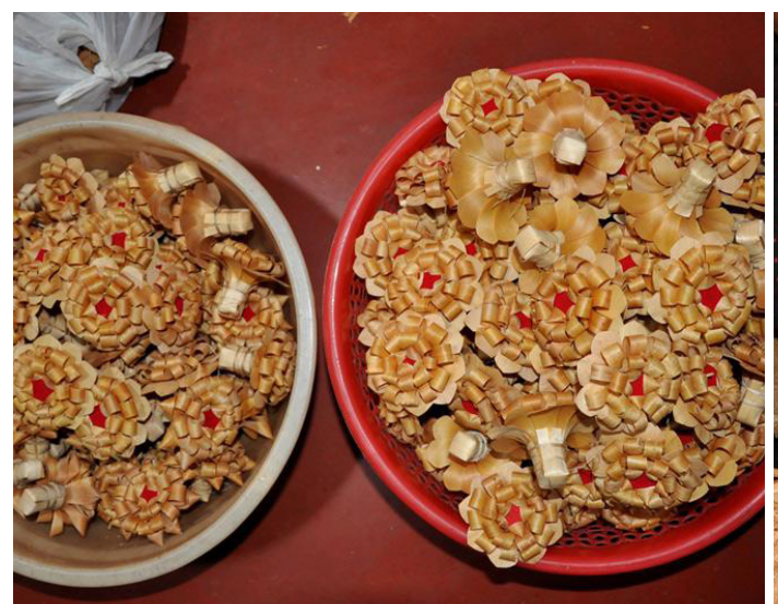
Manually stitched sandalwood flowers.