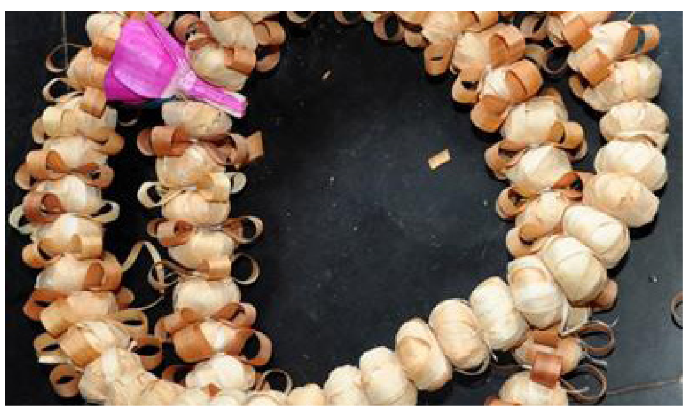
A different type of garland as innovations also happens as per the market demand.