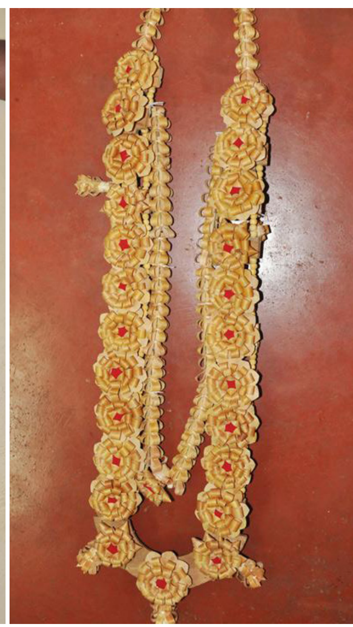
Typical sandalwood garland.