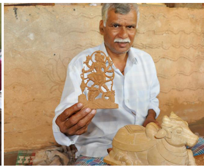
Master craftsman with his product.