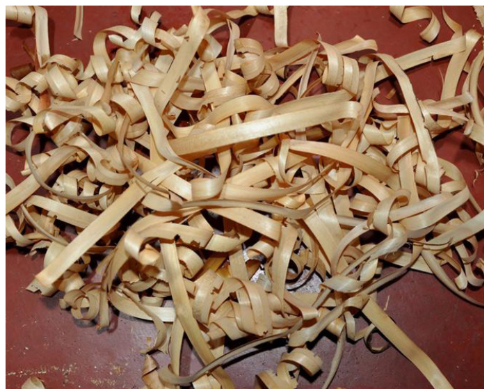
Strips of sandalwood are used to make garlands.

Sandalwood has unique identity by its fragrance and its softness. It is used in many rituals by many religions .The artisans of Sagara creatively make sandalwood garlands. These garlands are used as religious offering to gods during festivals and also in ritual functions. To make these garlands, the waste wood is cut into thin small strips of inch in length. These strips are creatively stitched with the help of needle. The parts of garland are made separately and tied together. Bright colored artificial rose flowers and shiny velvet cloth are added to enhance the look of garland.