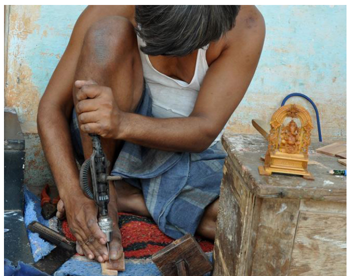
Artisan working with drilling tool.