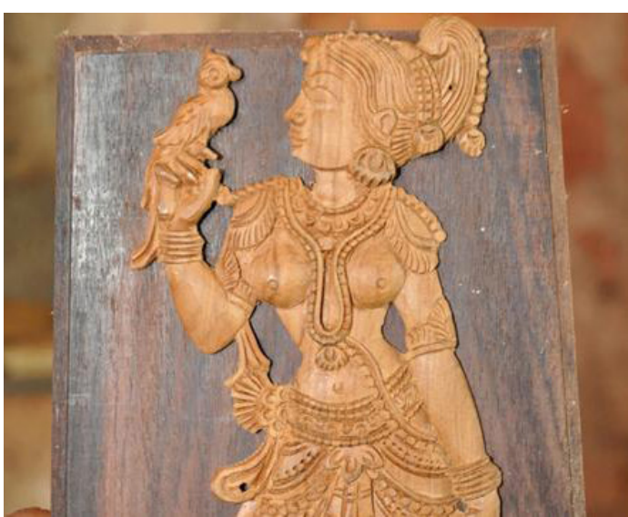
The finished product is framed.