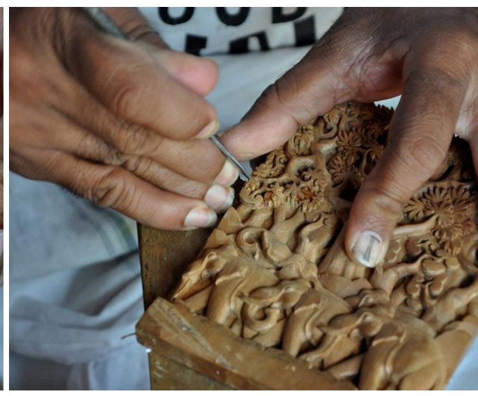
Minute carvings are done with sharp tool.