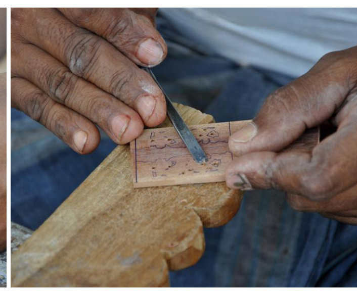
Uneven surface is smoothened.