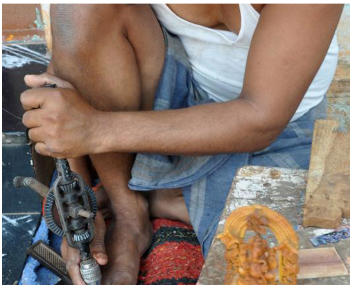
Automated drilling tool used to carve minute detailing.