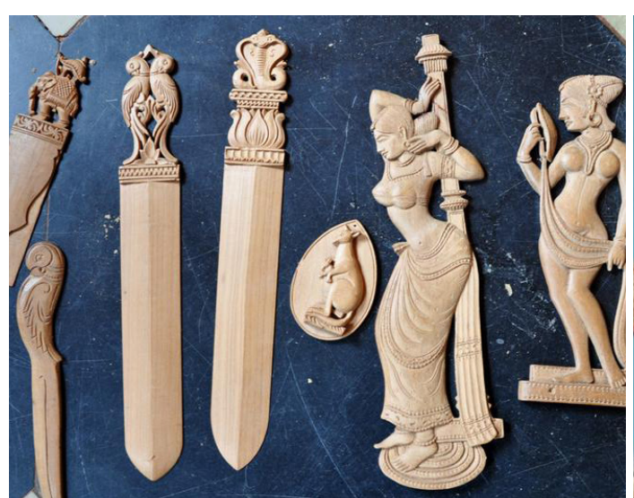
Collection includes page markers, page cutter, key chain and idols.

Among all products, the typical Sandalwood garland is the unique products made using thin layers of sandalwood. Finished sandalwood products are exported to all over India and abroad. Most of the products like idols of deities, chariots, elephants, candle stands and garlands are marketed to Cauvery Emporium in Bangalore. Work is completely based on orders. Jewelry box is carved from fragrant sandalwood in such a way that each side of the box has carvings in animal and floral motifs.