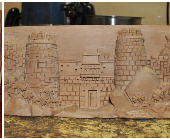
Bas-relief depicting fort.