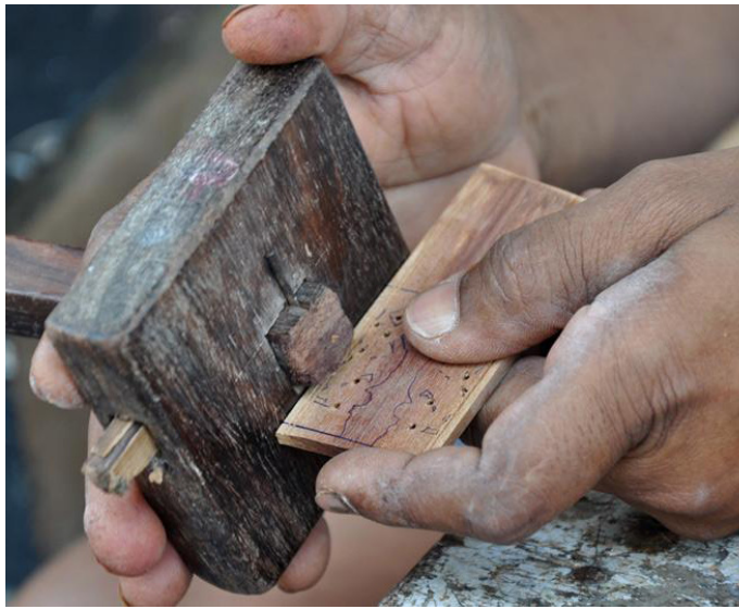
Border of frame is equally drawn with specific tool.