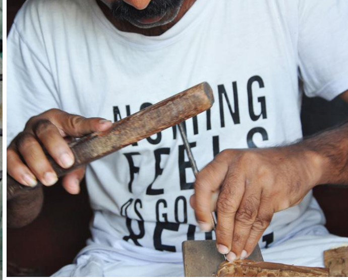
Wooden mallet and chisel is used in carving process.