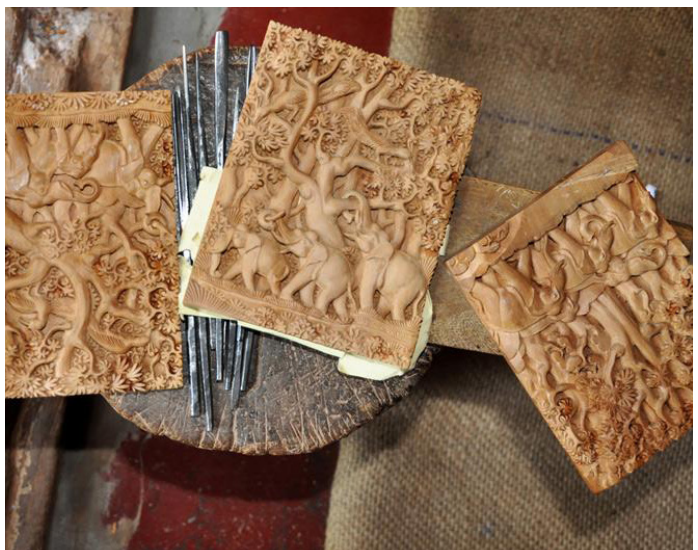
Popular motifs of the relief carvings are flowers, plants, birds and animals.