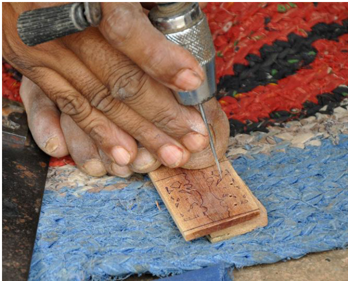
The design is marked on small chip of sandalwood and drilled to make frames.