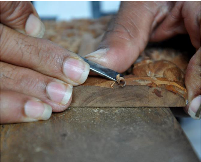
The excess wood is removed as per marked design.