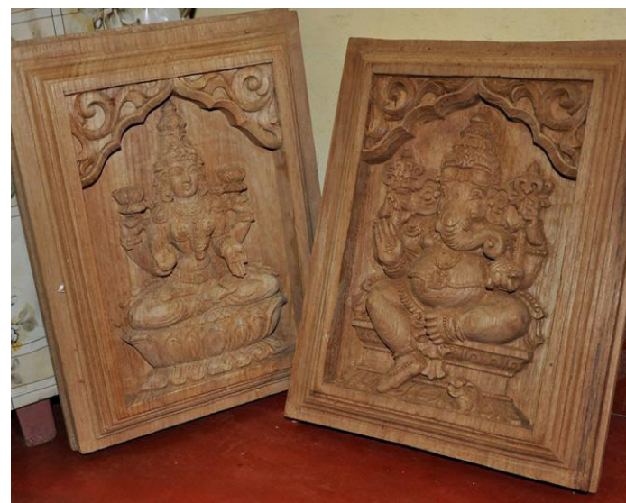
Panels in Goddess Lakshmi and lord Ganesha.