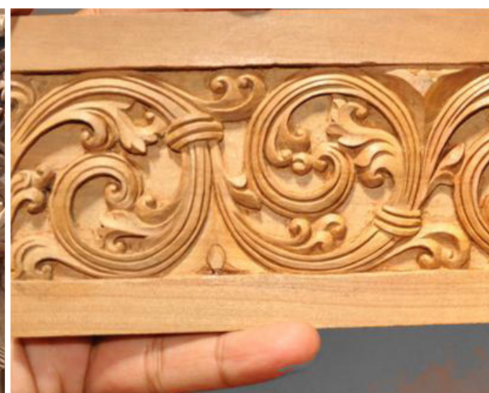
Wooden tile carved in floral motif.