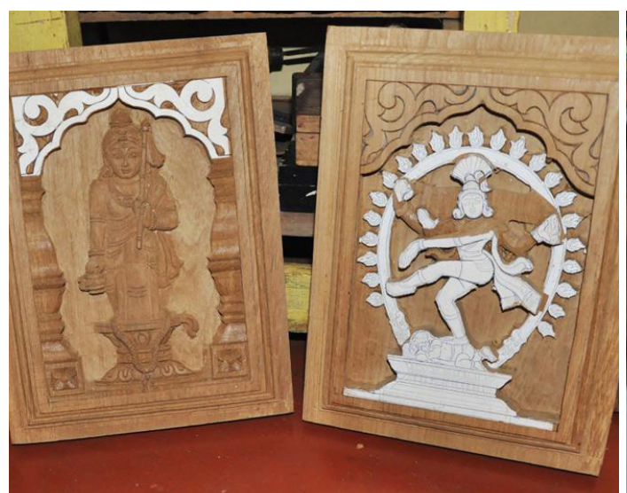
Sketch reference is fixed to wood panel.

Sandalwood is very soft in nature which allows artisan to create intricate carvings. There are two types of carving methods are practiced-manual method carving and automated method of carving which is done using hand drilling machine. Wooden blocks are first cut into required size. After cutting, the artisan draws the design or motif of final product on white plain paper. This reference design is pasted on wooden block. The unwanted portions of wood are removed and the rough carving is done based on the sketched outlines. Major carvings are done using the wooden mallet and the chisel. Once the basic shape is carved, minute and intricate designs are carved with sharp edged shaping tools. After carving, the outer surface of the product is smoothened. Few frames are made with flat thin wooden piece using hand drilling machine. The design is directly marked on the surface of the wood. Minute elaborated motifs are achieved by drilling and cutting with the help of hand drilling machine. Once cutting is done, the sharp edges are smoothened. Finished wood article is fixed to a decorative wooden frame as a final stage.