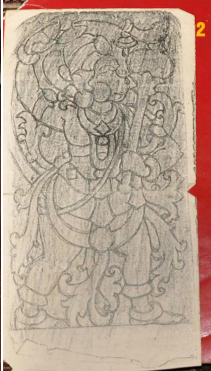
Sketch reference used while carving.