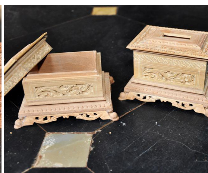
Jewelry box is one of the fast selling products.