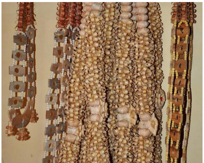
Unique sandalwood garlands from latest collection.