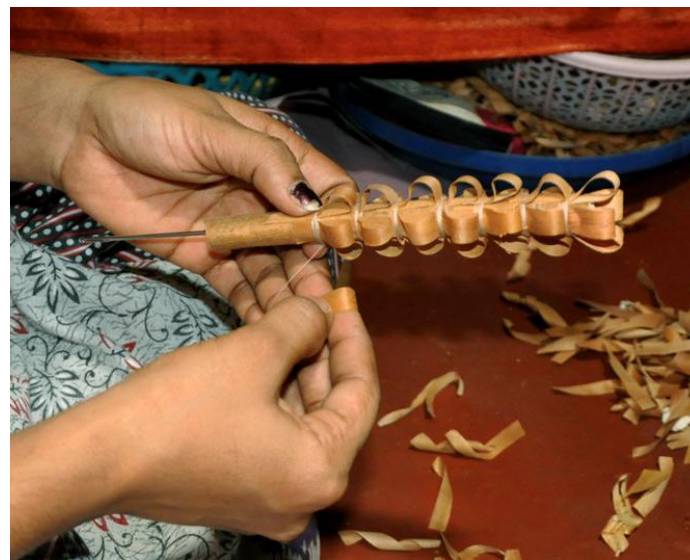
Design pattern is arranged and tied with thread.