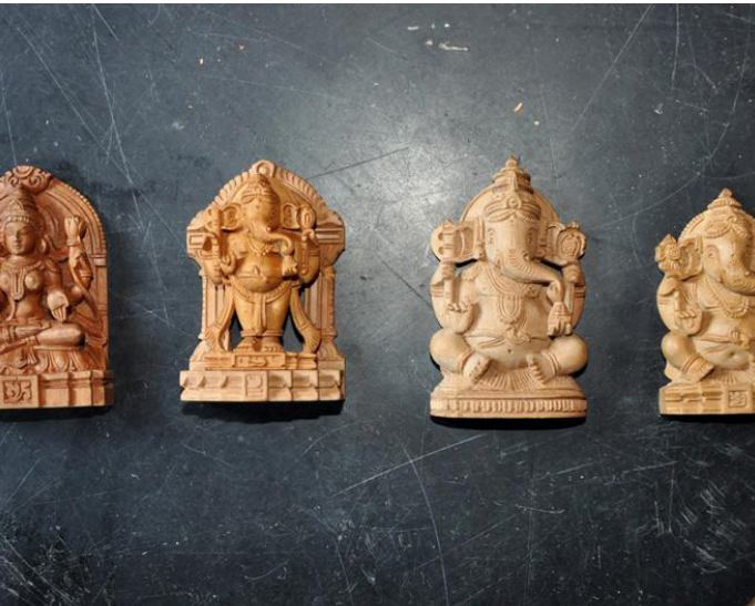
Small idols of deities carved with Sandalwood.