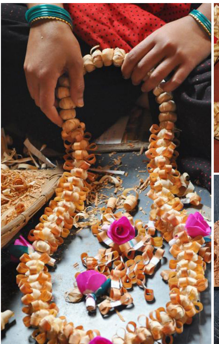
Beautiful garland is made using thin strips of sandal-wood.