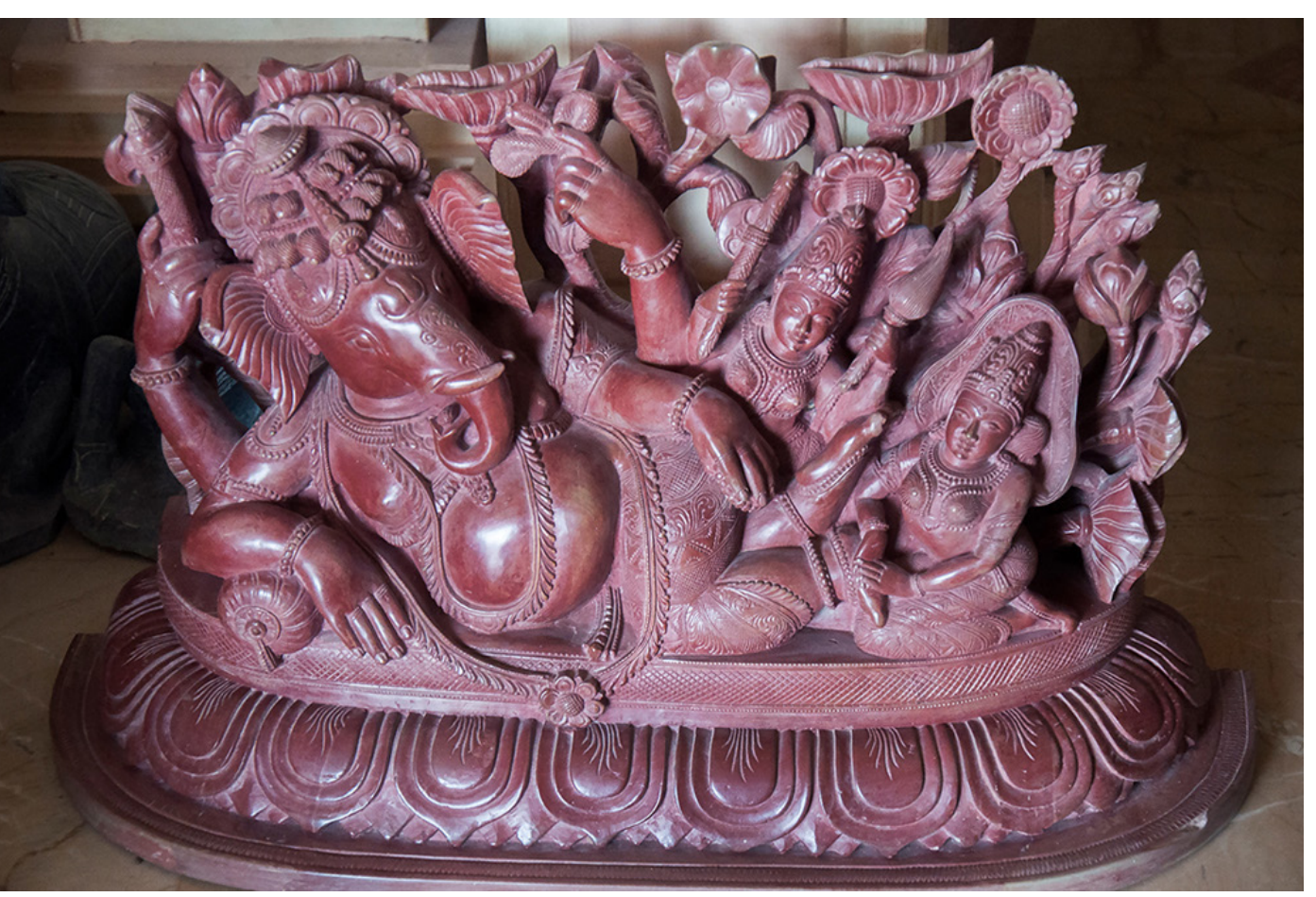
Lord Ganesha idol was carved by using red granite with a fine finish.

Introduction Tools and Raw Materials Making Process Products Video