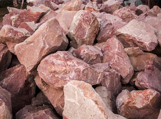
Soapstone, Black and Red granite are mainly use for the sculptures.