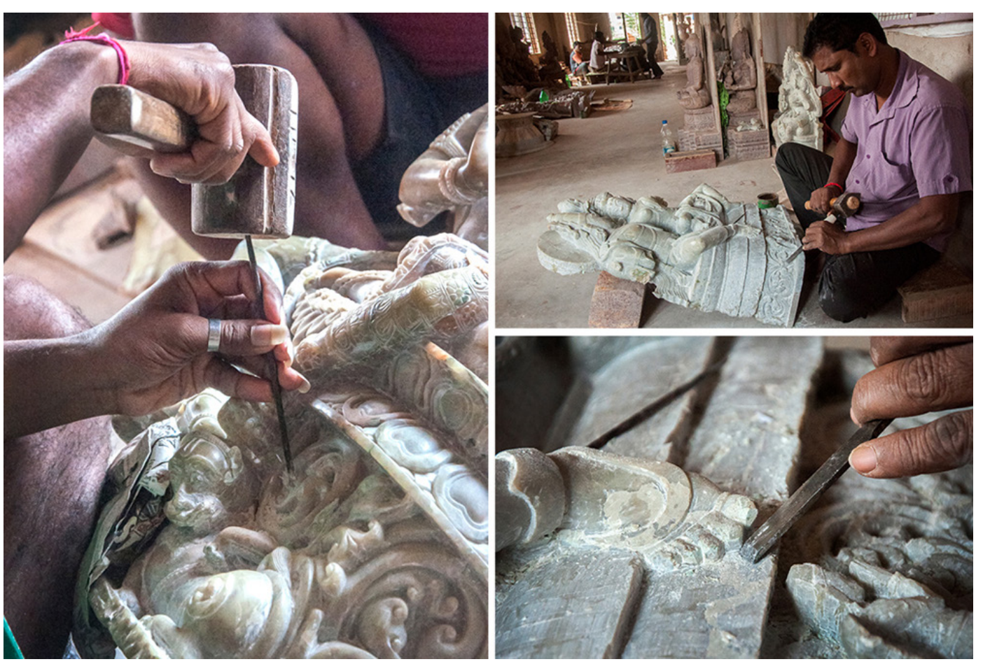
Fine details are created using flat chisels and hammers of various size.

Introduction Tools and Raw Materials Making Process Products Video