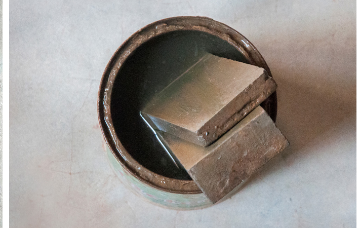
Sharpening stones or water stones are used to grind and hone the edges of chisels.