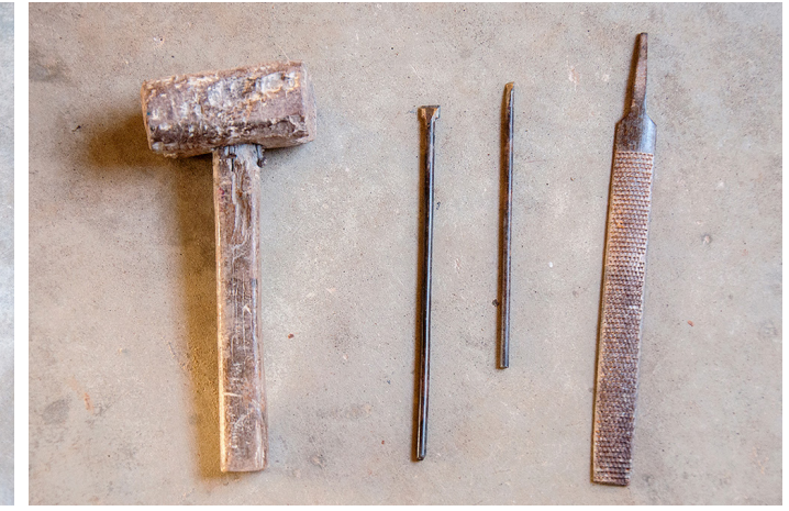
Diamond tip chisel tool and Metal file tool used to smoothen the surface texture.