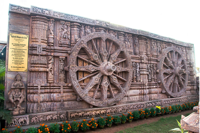
Delightfully carved a part of Konark temple sculpture was displayed in Raghunath Arts & Crafts Center.