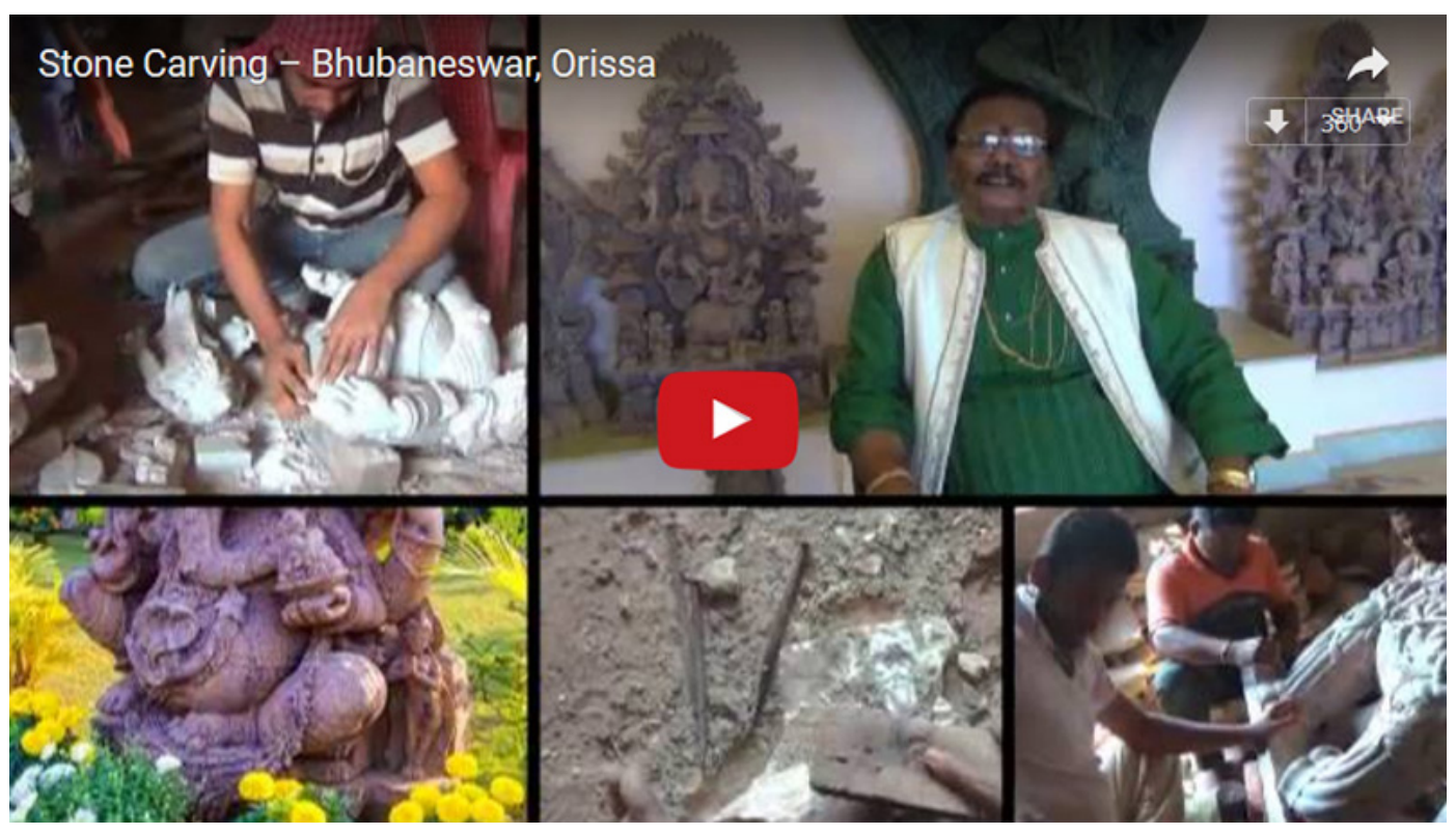
Stone Carving - Bhubaneswar, Orissa