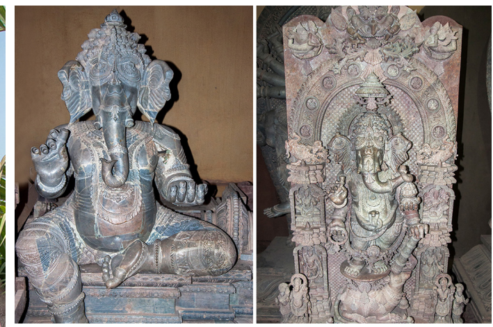
Using granite artisan carved a Lord Ganesha idol with a different style.