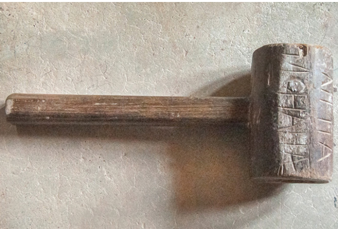
Wooden and Iron hammer used to hammer the chisel while carving the stone.