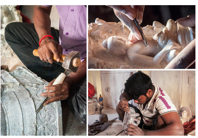
Detailing is done by using different types of tools in different ways.