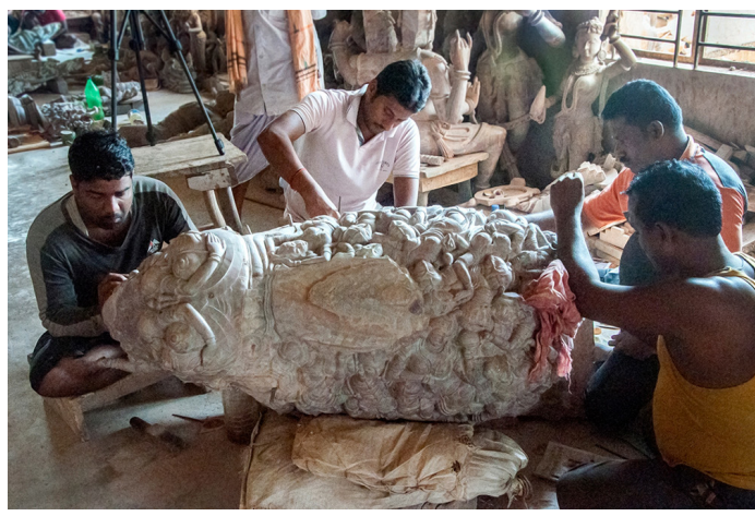
Carefully carving the details of elephant sculpture was done in soap stone.