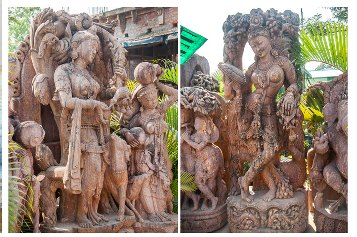
Shilabalika sculpture was done in sand stone with an attractive jewellery designs.