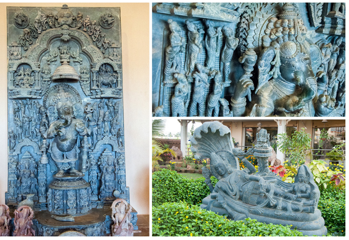
A Story of Lord Ganesha and Lord Vishnu sculpture are done in the black granite.