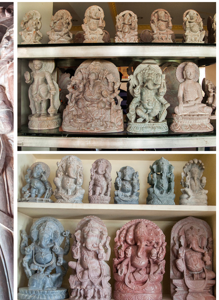
Various styles of lord Ganesha and also lord Hanuman and Buddha is carved in different stones.