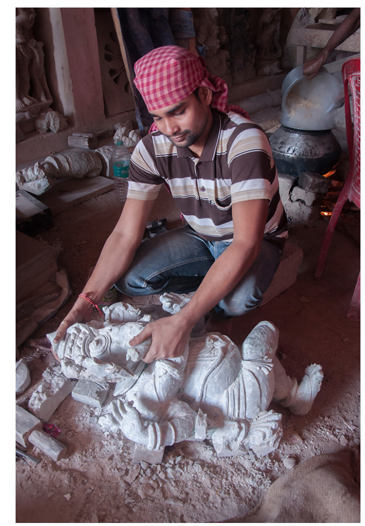
Rough detailed sculpture is joining together to complete the idol.