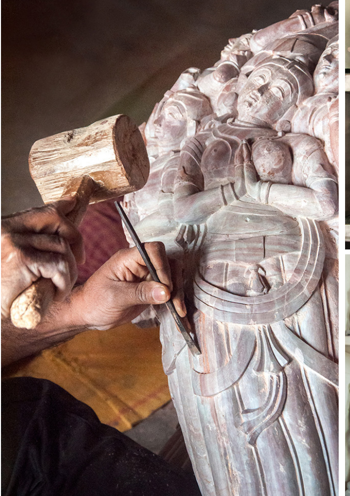
Flat chisel is used to enhance the detailing work.