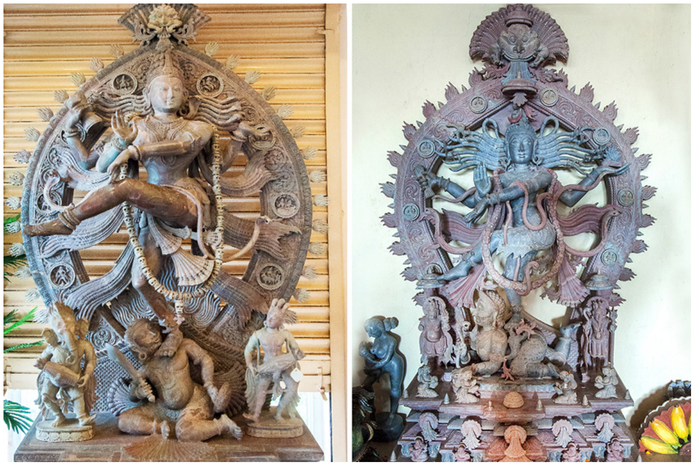
Attractively carved life size Nataraja idols in soap stone and granite.

Introduction Tools and Raw Materials Making Process Products Video