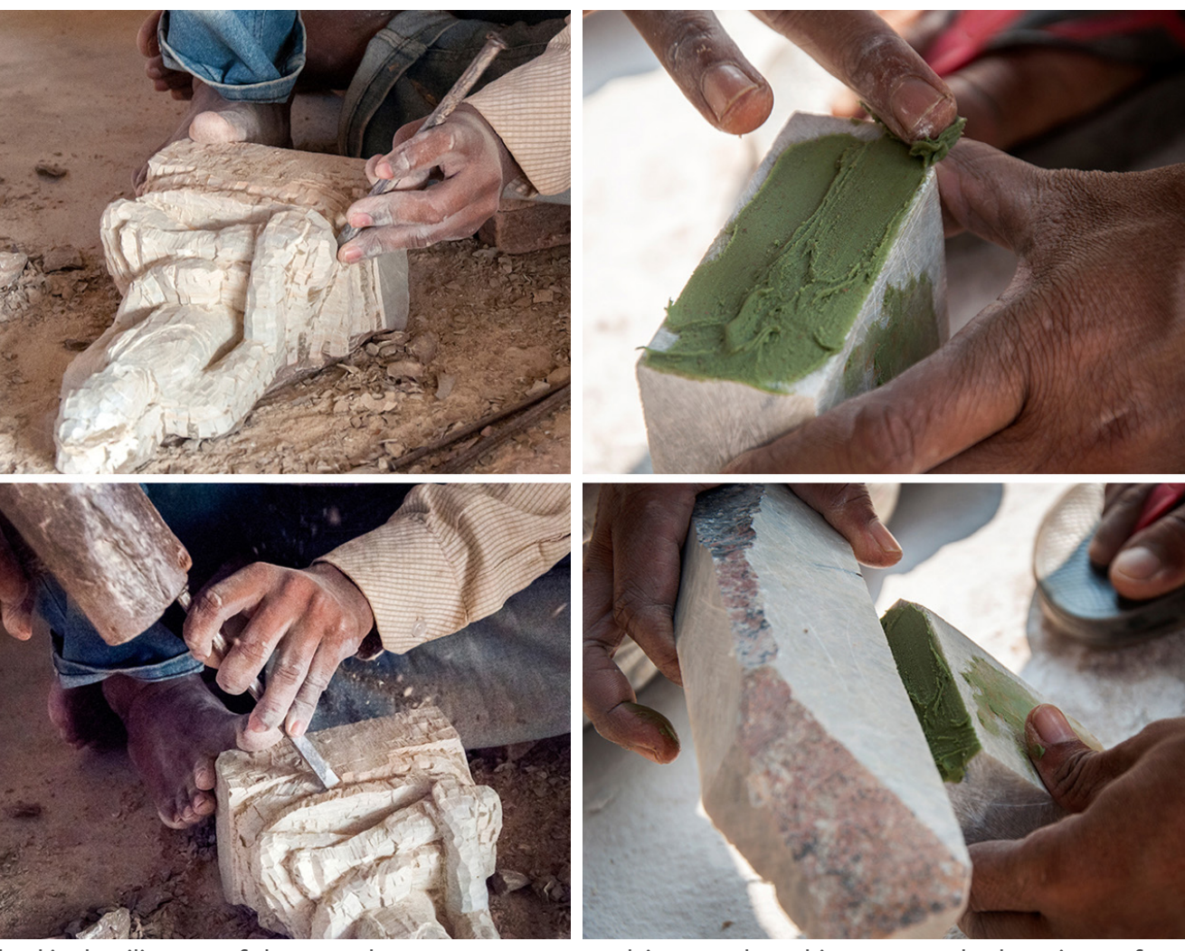
Involved in detailing out of shape on the stone statue.