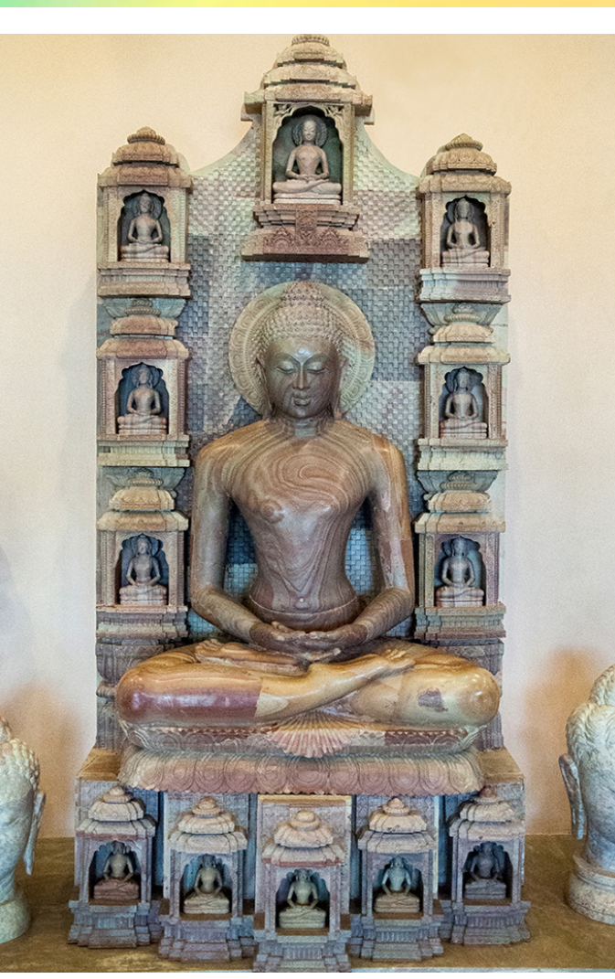
Attractive sculpture of Buddha was done in white granite.