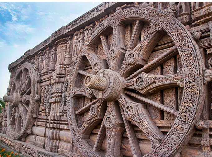
Delightfully carved a part of Konark temple sculpture was displayed in Raghunath Arts & Crafts centre.