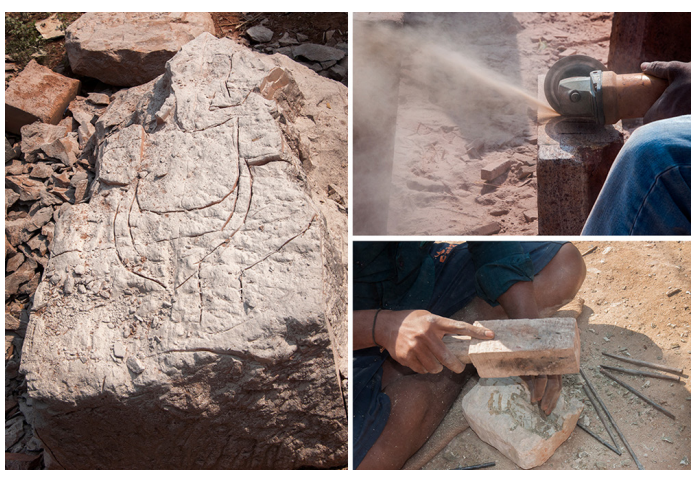
The sketching is done in detail by cutting and chiselling.