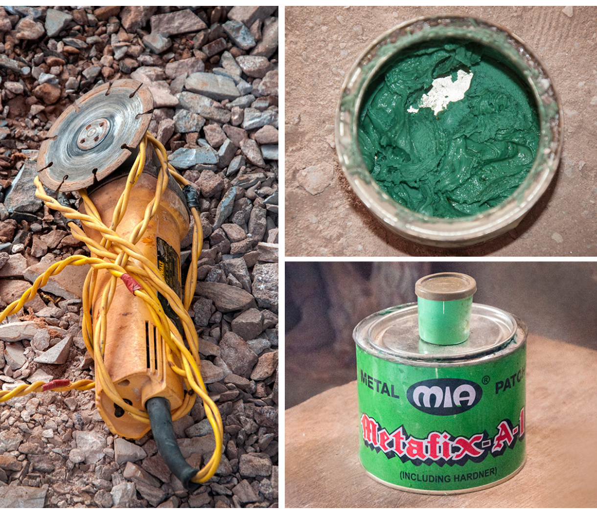
Electric cutting machine to cut the stone and ease the process of carving.