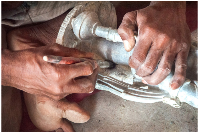
The excess of dust after carving is removed with a help of brush.