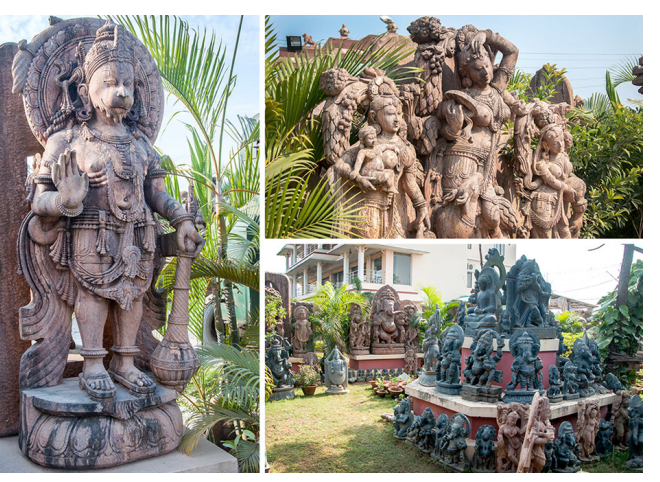
Using sand stone and black granite, beautifully carved Lord Hanuman and other idols.