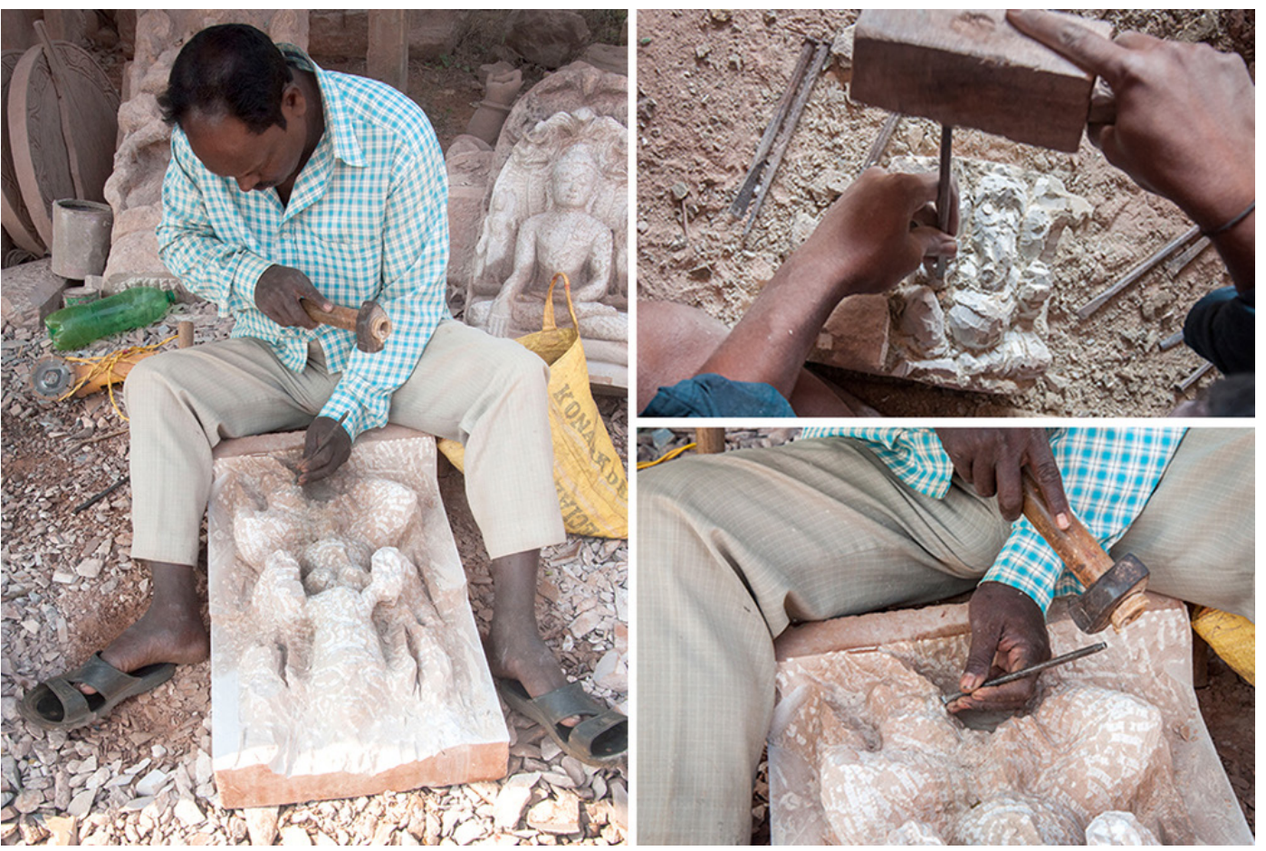
By using hard chisel and hammer, rough detailing are done referred by sketch design.

Introduction Tools and Raw Materials Making Process Products Video