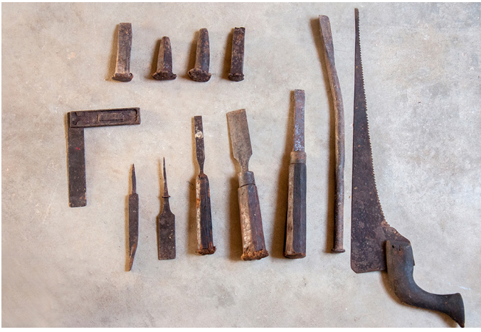
Hard and a wide edged chisel tool use to carve stone and also L shaped scale are used to measure while carving the stone.