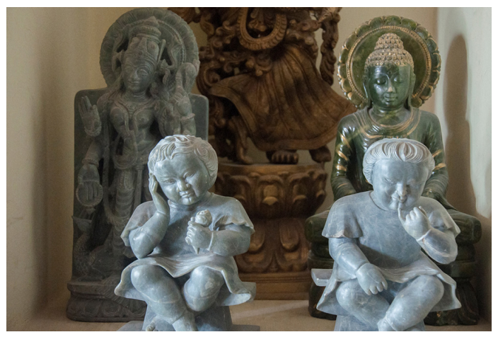
Artisan was carved by using different granite with a different sculptures.