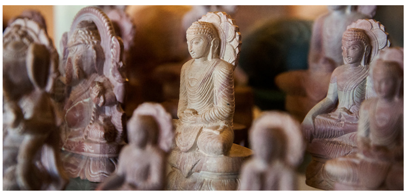
Small size Lord Ganesha and Buddha idols are made in soap stone.

Stone carvings also include household objects like bowls, plates, grinding stones, pillars, beams and brackets for construction of houses. Figures made in solid materials like stone are further classified into categories that explain their technical dimensions: Hard granite stone are used in making temples and household items like grinding stones etc. All the raw material when is carved and bought to a shape, is kept for sale starting from 2 inches to life size and more than that. These sculptures are shipped with stiff packing and are installed according to the customer's requirement. Wax coated sculptures last longer as they are given a fine layer on the object which makes it a water resistant.