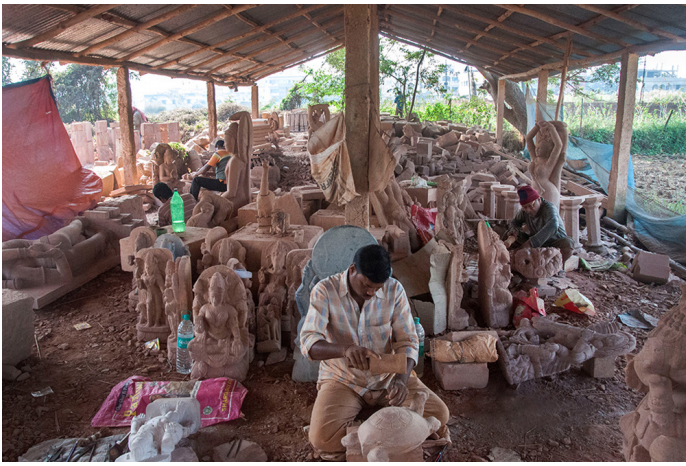
Artisans are dedicatedly involving in working on stone sculpture.