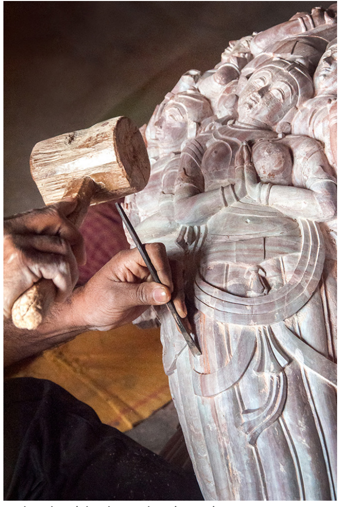
Artisan involving in carving the sculpture on soap stone with the help of flat chisel and wooden hammer.