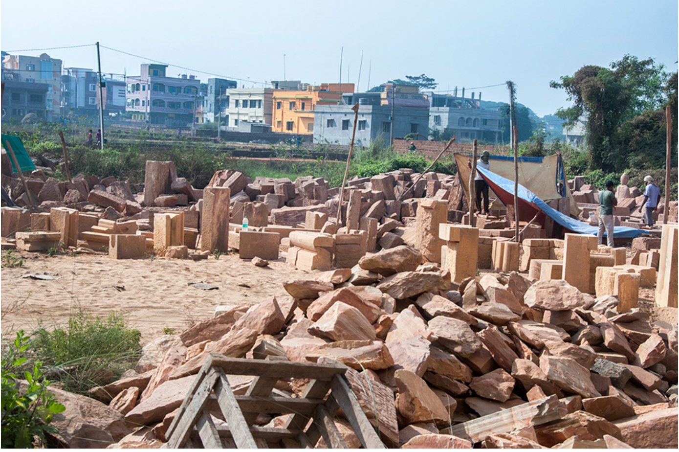
Small and big different stones are set aside in work place.