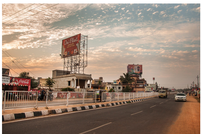
Bhubaneswar to Puri highway road view near Raghunath Arts & Crafts Center.