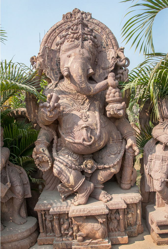
Lord Ganesha idol with a beautiful jewellery design was done in sand stone.