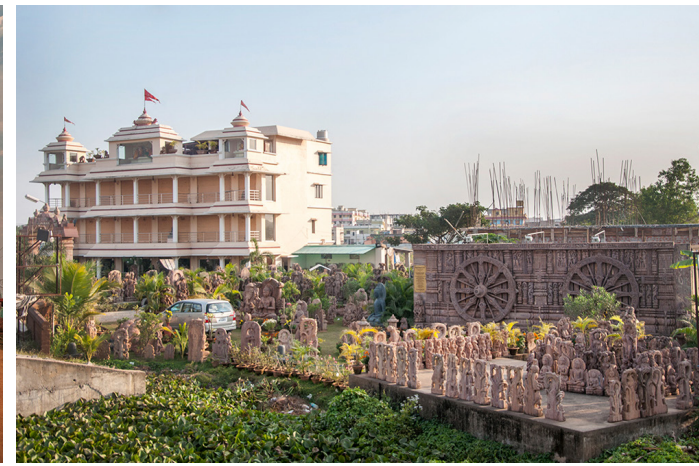
A view of Raghunath Arts & Crafts Center.