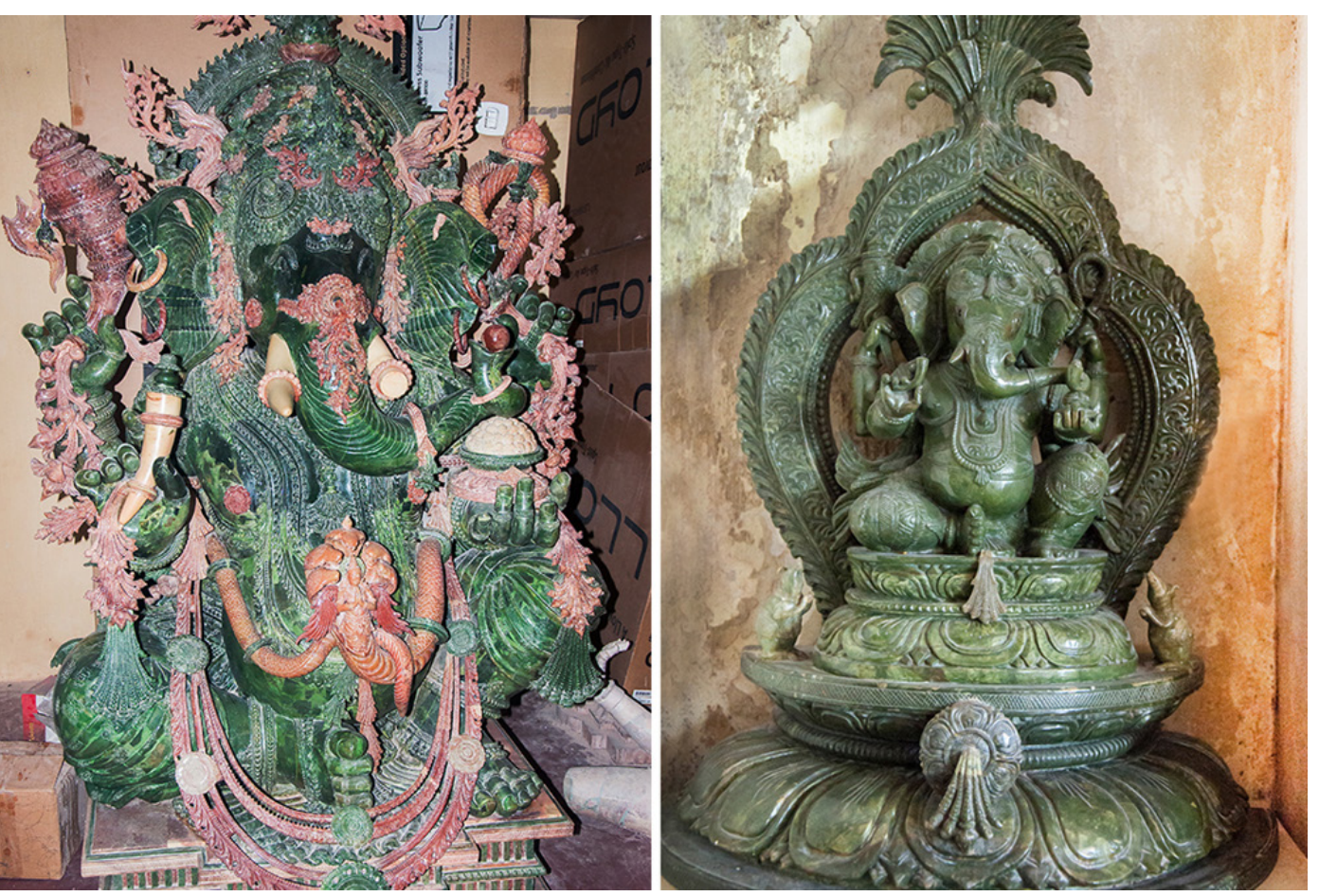
Using three different granite Lord Ganesha was carved with a fine detailing designs.

Introduction Tools and Raw Materials Making Process Products Video