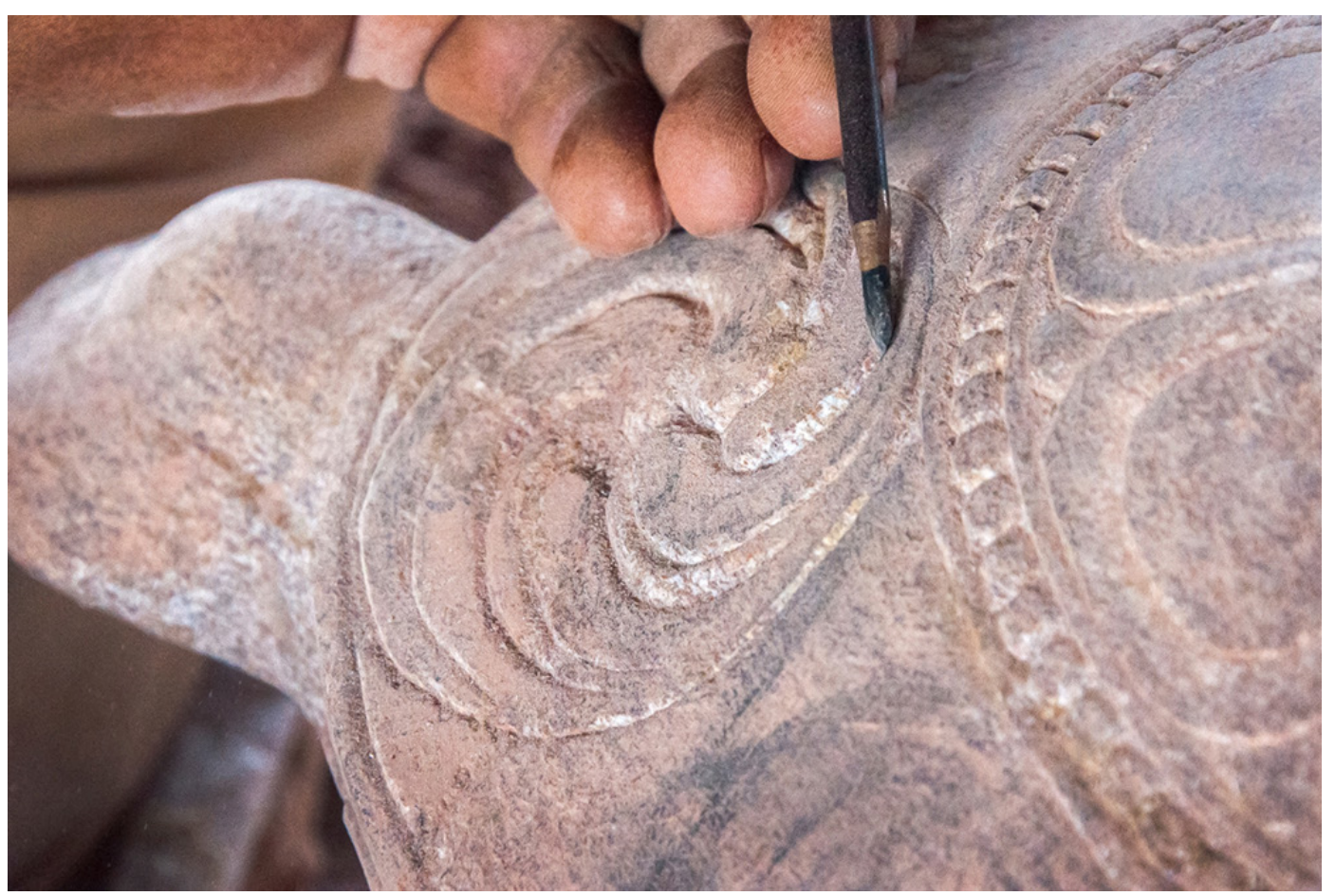
Artisan works on the detailing with the help of pointed chisel.

Introduction Tools and Raw Materials Making Process Products Video