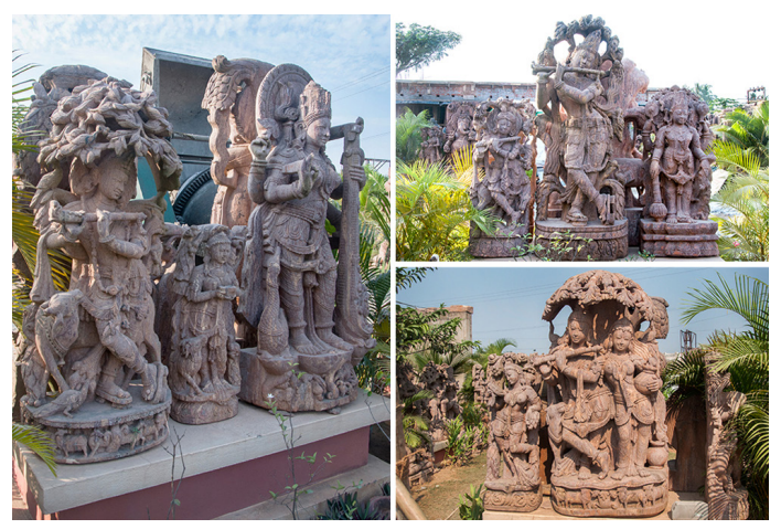
Artisan taken out the attractive idol of Lord Krishna in sand stone.