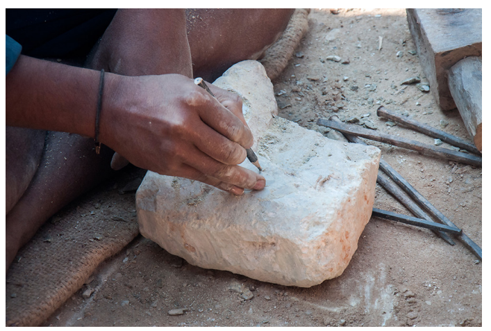
By using pencil, the block of stone is roughly design is marked on it.