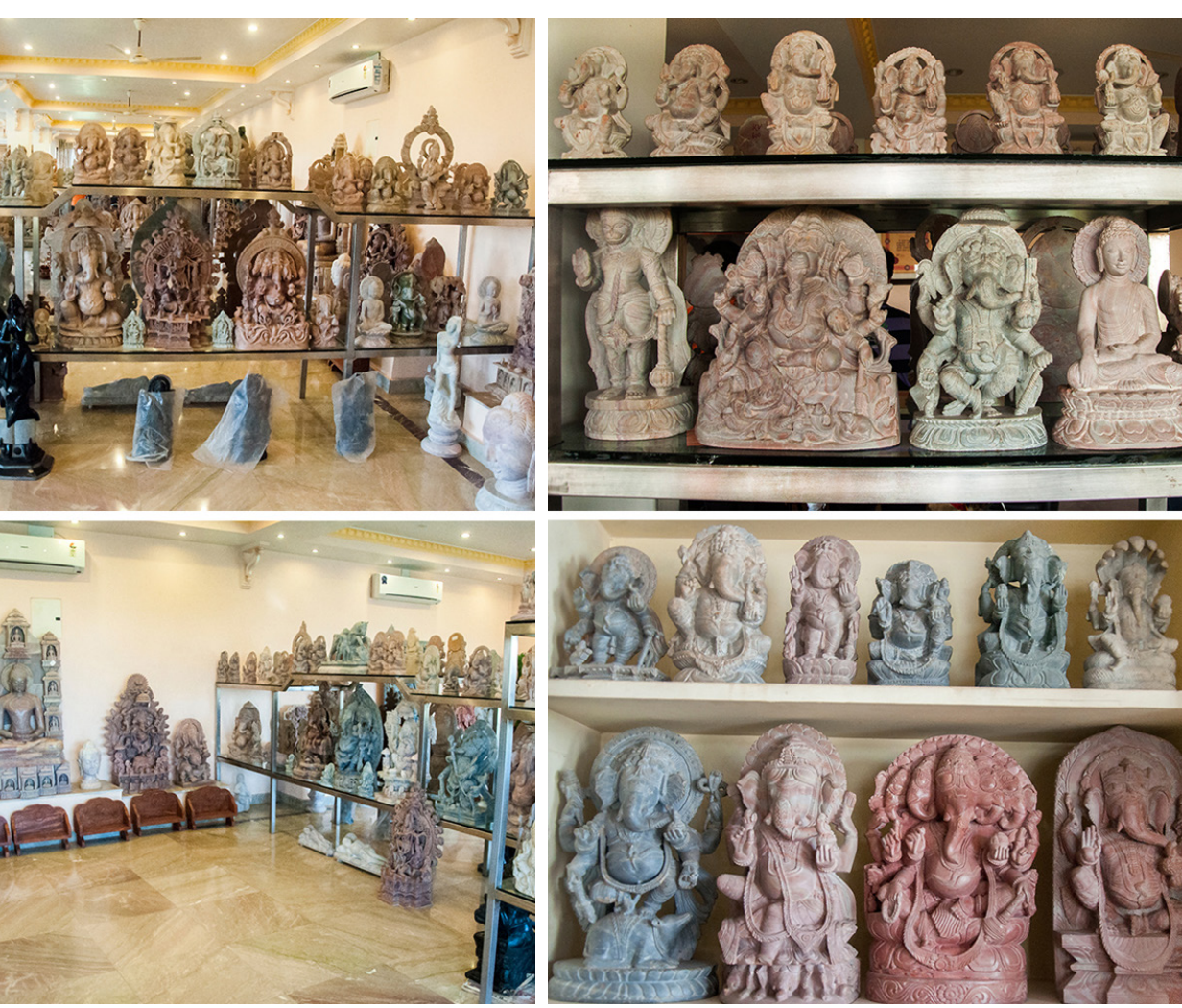
Different types of god and goddess sculptures are displayed in Raghunath Arts & Crafts Centre.