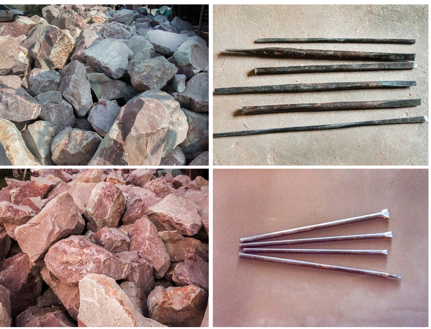
Soapstone, Black and Red granite are mainly use for the sculptures.