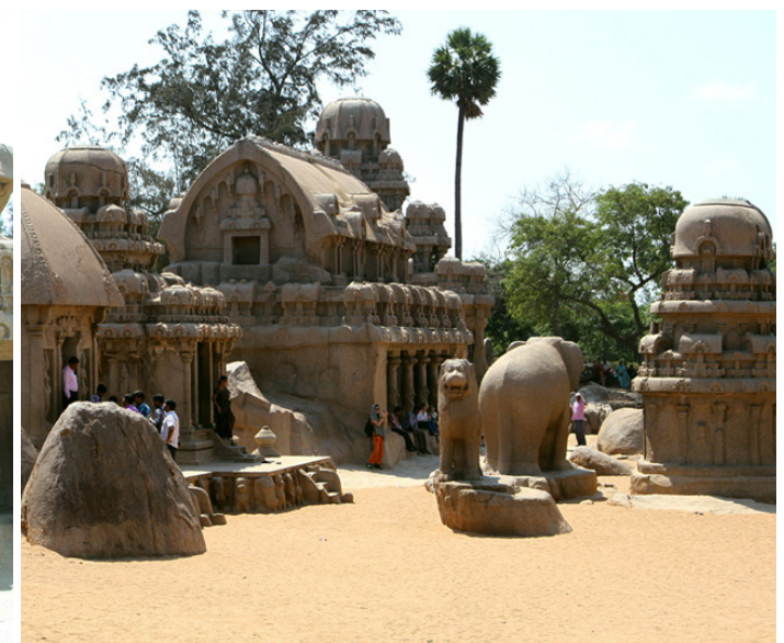
An elephant and lion sculptures placed very next to Nakula-Sahadeva ratha.