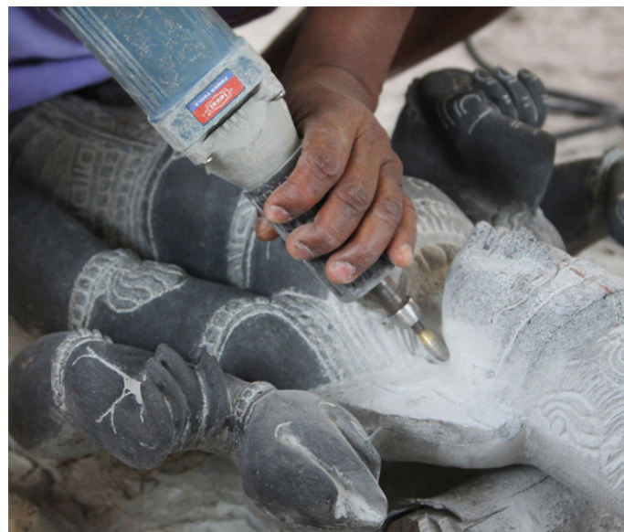
The edges are sharpened to get fine finishing.