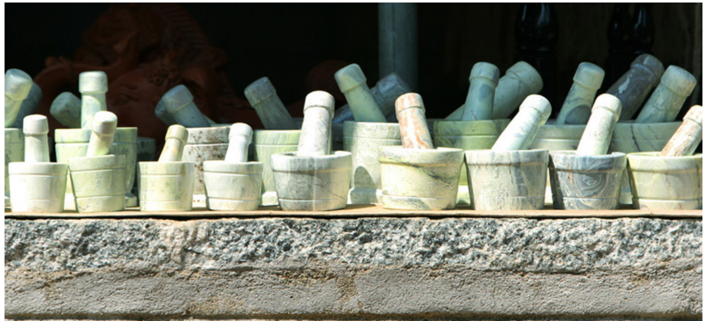
Stone grinders are kept for marketing.