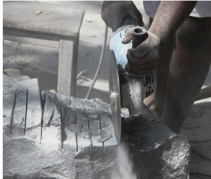
The big block of stone is first cut evenly.

http://www.dsource.in/resource/stone-carving-mahabalipuram/making-process