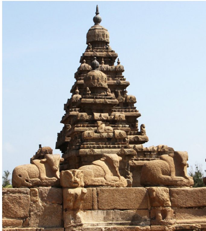
Ancient Shore temple at Mahabalipuram.

The antique stone architecture of Mahabalipuram talks about the stone carving history of Mahabalipuram. The fascinating towers of famous “Shore temple” which is one of the “Seven pagodas” were constructed by King Narasimha Varman in 18th century during Pallava period. The five monolithic Rathas (chariots) are carved in granite and can be seen in pyramidal structures and are named as Dharma raja Ratha, Bhima Ratha, Arjuna Ratha, Draupadi Ratha, Nakul Sahadev Ratha. These Rathas are carved from one single piece of stone which is an interesting attribute. The world famous Arjuna’s Penance which is an episode from Hindu epic Mahabharata is excellently composed with great passion to represent classical essence. Dharma raja Ratha with its highly skilled carvings involves complicated decorative forms. The monolithic rock-cut architecture of Varaha cave temple is a testimony to creative imagination. All these monuments are the outstanding examples of Pallavas art and architecture and remarkable in Indian cultural heritage.