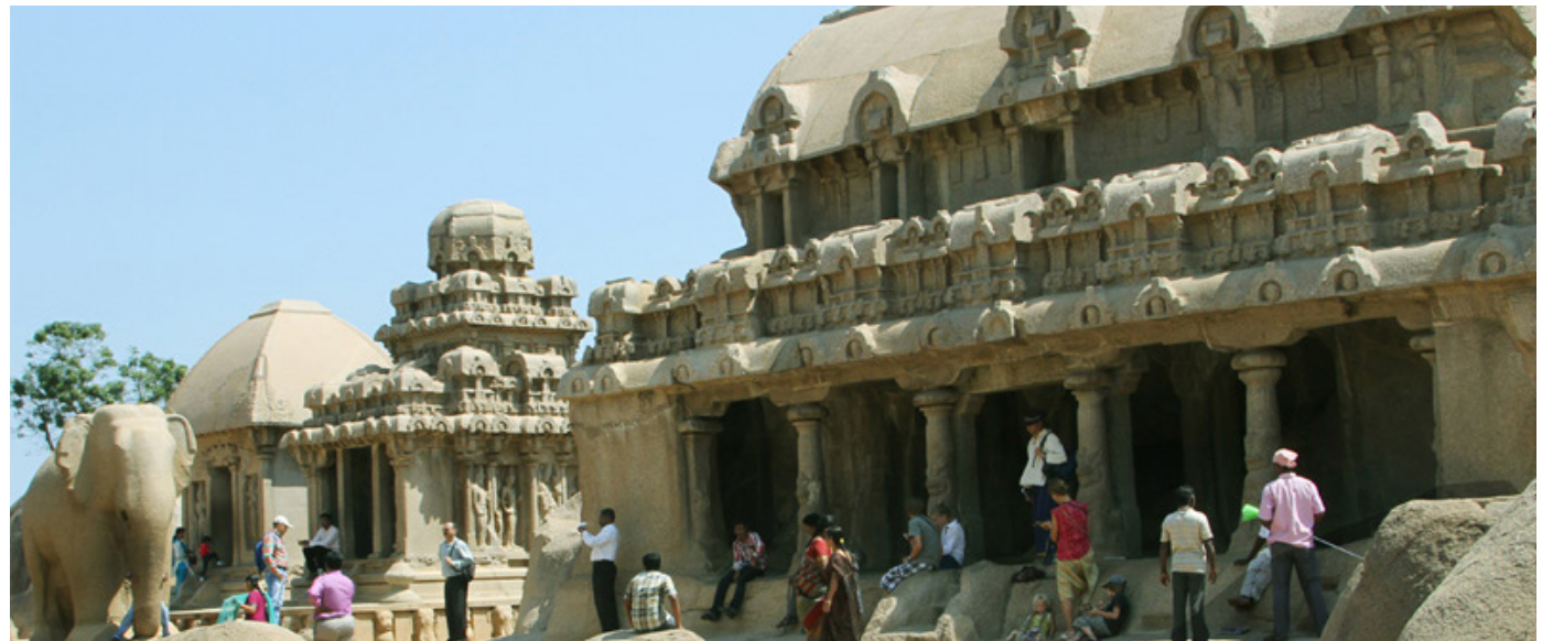
Historical monuments of Mahabalipuram.