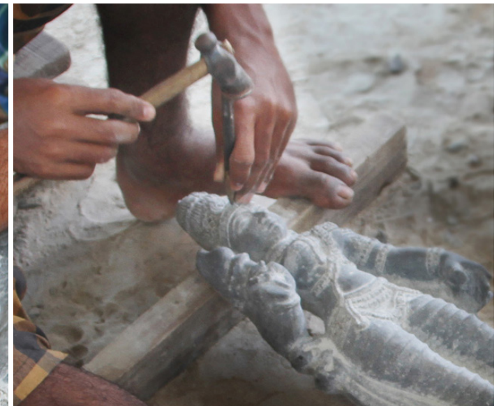
Idol is now ready for polishing.