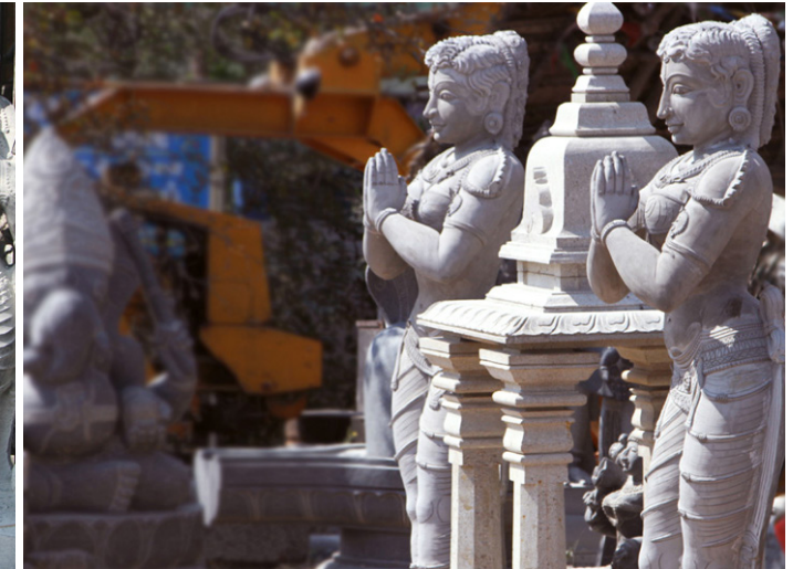
Welcoming idols are mainly used at entrance of the temples to greet the devotees.