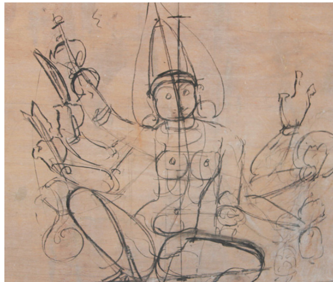
Reference sketch is made before carving.