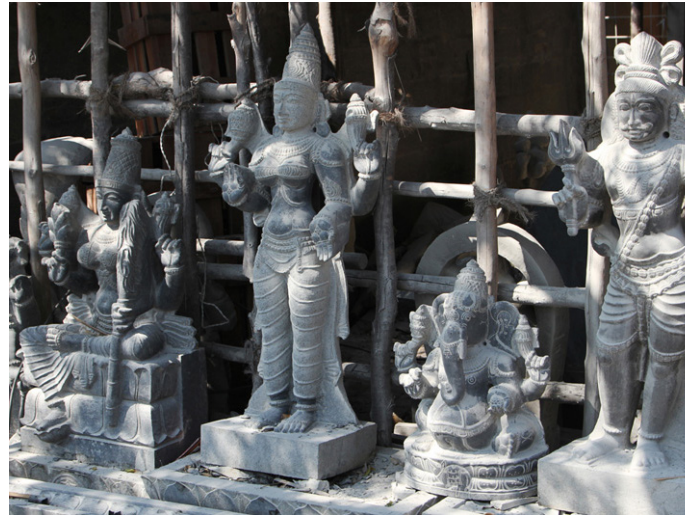
Idols of deities in different poses.

http://www.dsource.in/resource/stone-carving-mahabalipuram/products