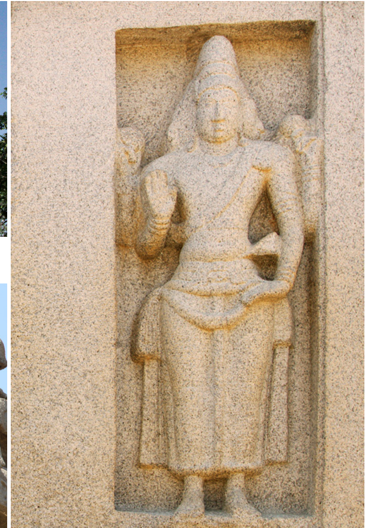
Figures of deities are carved on the walls of Rathas.