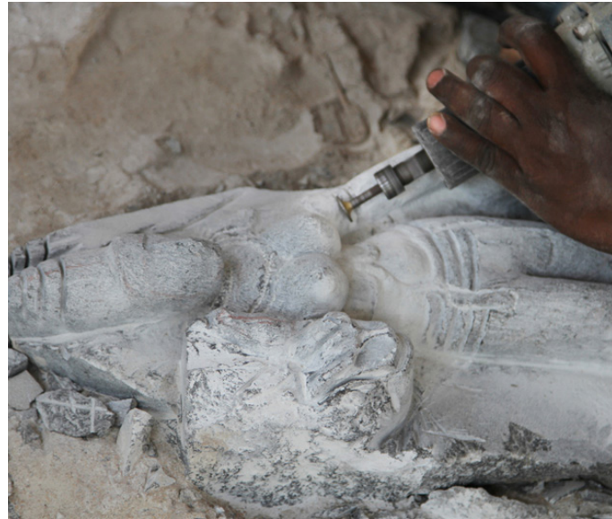
Depth is obtained by minute and detailed carvings.

http://www.dsource.in/resource/stone-carving-mahabalipuram/making-process