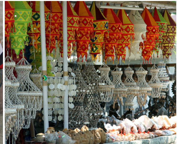
Decorative granite statues and shell products at market place attract visitors.