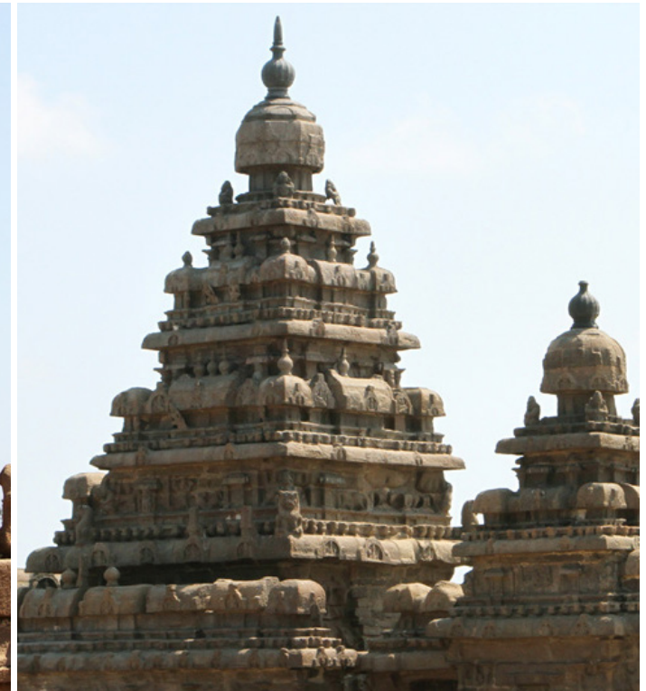
Unique carving can be seen on the towers of shore temple.