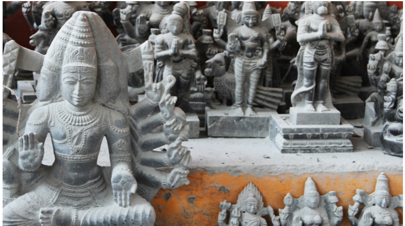
Idol of goddesses carved to cater the surrounding temples.

The magnificent sculptures portray the expertise craftsmanship and also the stone carving history of Mahabalipuram. Every aspect of stone carving is highly attention paid and artistic based. The basic stone is transformed into legendary pieces with elaborated ornament work and detailed facial expressions which gives life to the stone. Few art pieces and lamp shades are interestingly made of stone with Jaali work.