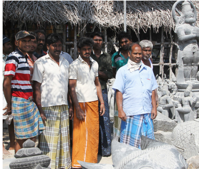
Artisans with their finished products.

http://www.dsource.in/resource/stone-carving-mahabalipuram/introduction