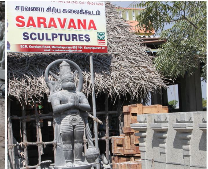
Carved Idol of Lord Hanuman.