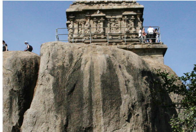
The temple is situated adjacent to old light house at Mahabalipuram.

http://www.dsource.in/resource/stone-carving-mahabalipuram/history-monuments