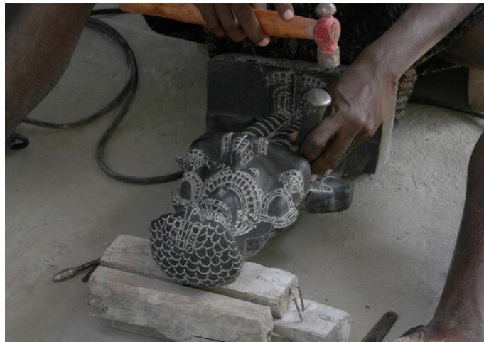
Chisel and hammer plays major role while carving the stone.