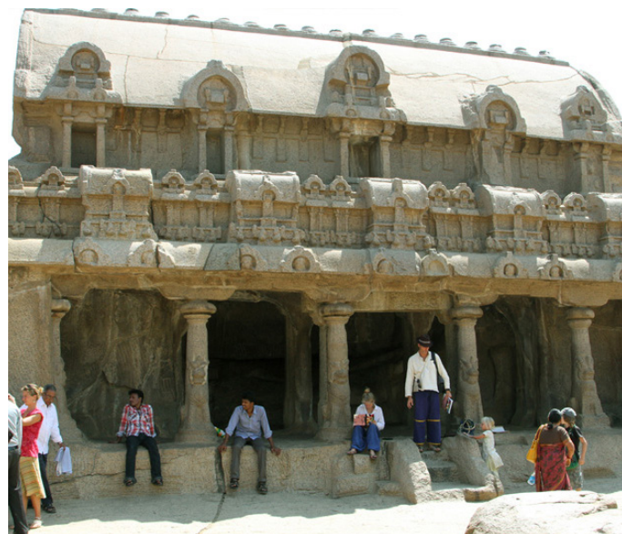
Bhima ratha which is placed next to Dharma raja chariot.