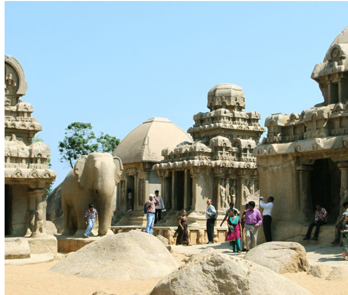
The five monolithic 'Pancha Rathas'-five chariots.

http://www.dsource.in/resource/stone-carving-mahabalipuram/history-monuments