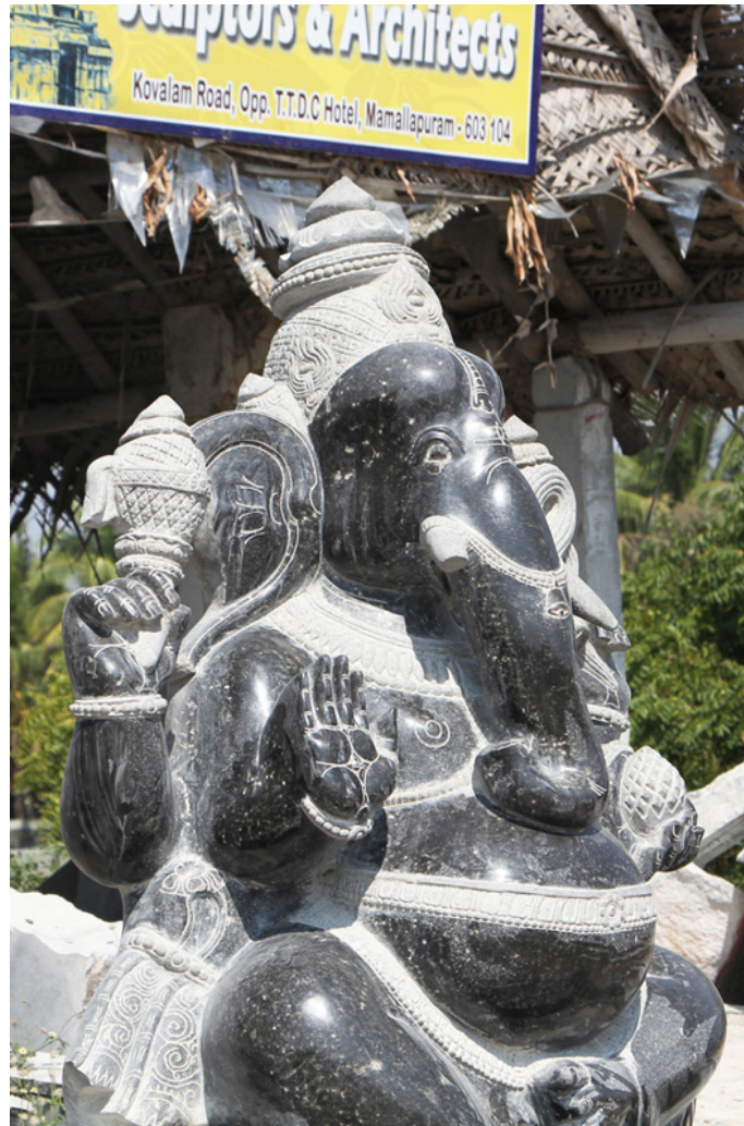
Polished idol of lord Vinayaka with detailed ornamentation.