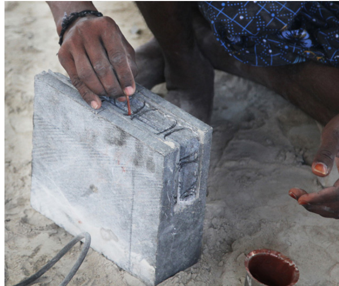
Marked design is highlighted with red oxide solution.

http://www.dsource.in/resource/stone-carving-mahabalipuram/making-process