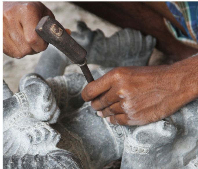
Few other embellishments are made by chiseling.