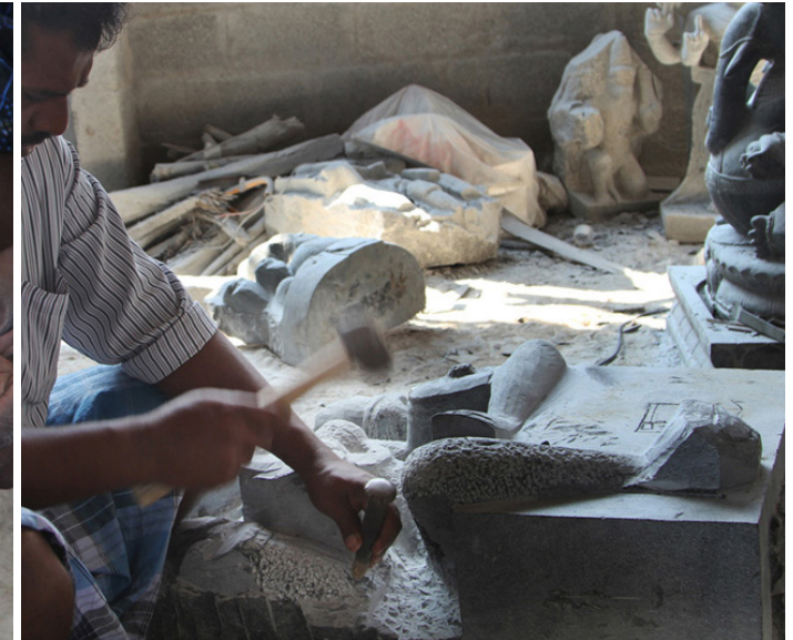
Artisan initiated the carving as per the marked design.