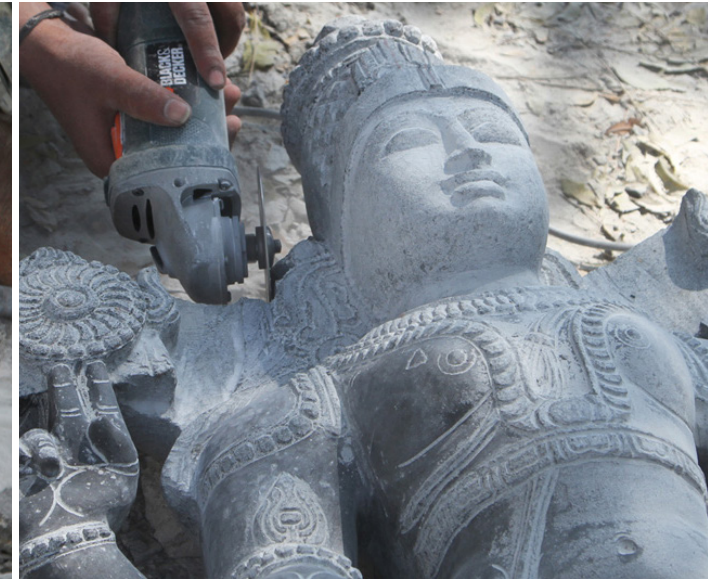
Different types of sharp edged disk blades used to carve sophisticated designs.