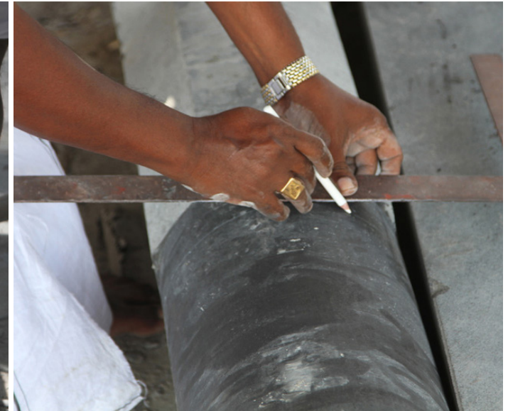
Stone is marked as per the required measurements.