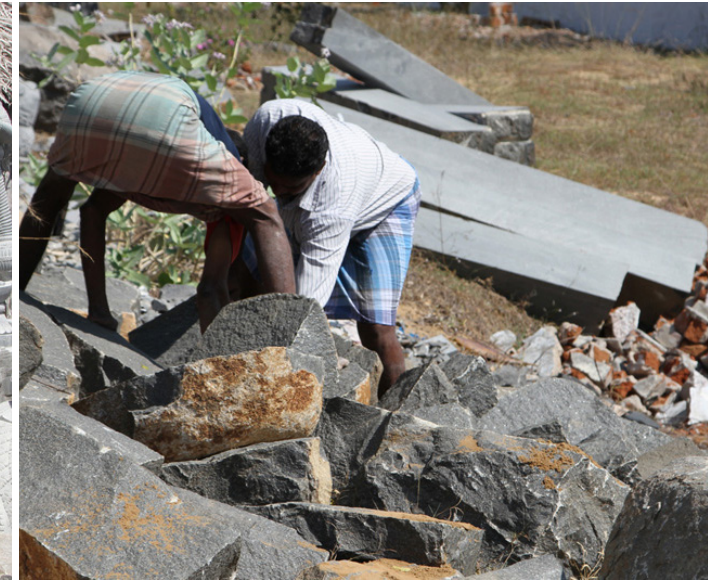
Craftsmen engaged in carrying a piece of Granite stone for design work.