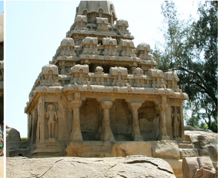
Dharma raja Ratha dedicated to Dharma Raya-one of five Rathas is tallest among all.