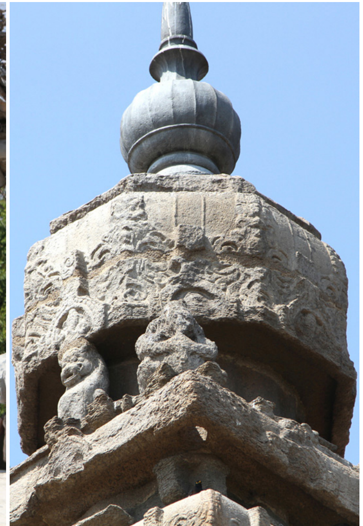
Closer view of tower of Shore temple.