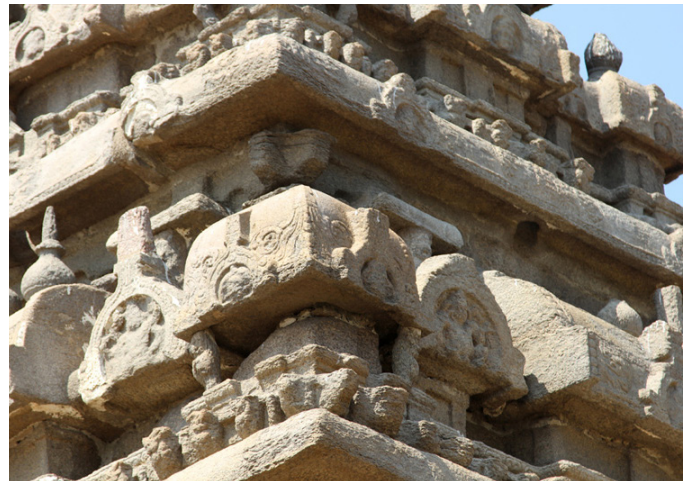
The closer view of sculptures adorning towers of shore temple.