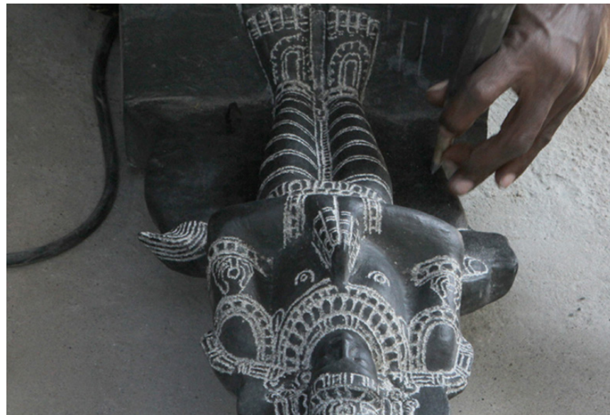
The idol is washed and coated with oil to get glossy look.