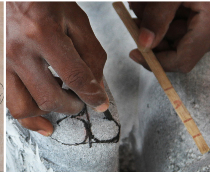
The design is being marked on the flat surface of granite stone.