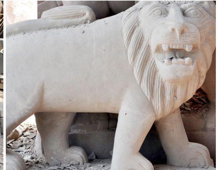
Replica of lion.