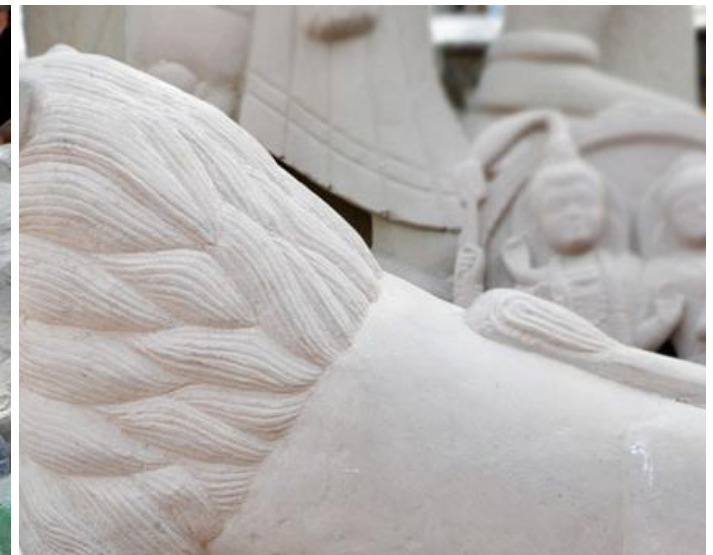
The closer view of smoothening process.