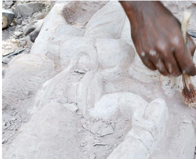
Cleaning the excess stone dust.

http://www.dsource.in/resource/stone-carving-varanasi/making-process