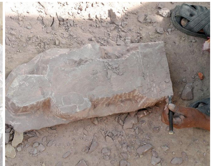
Roughly carved idol.