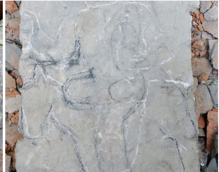
Rough design is sketched on stone.