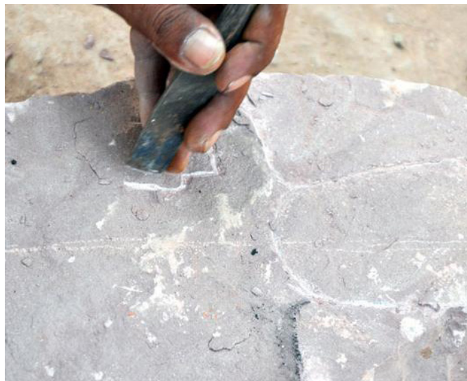
Carving initiated based on the traced lines.