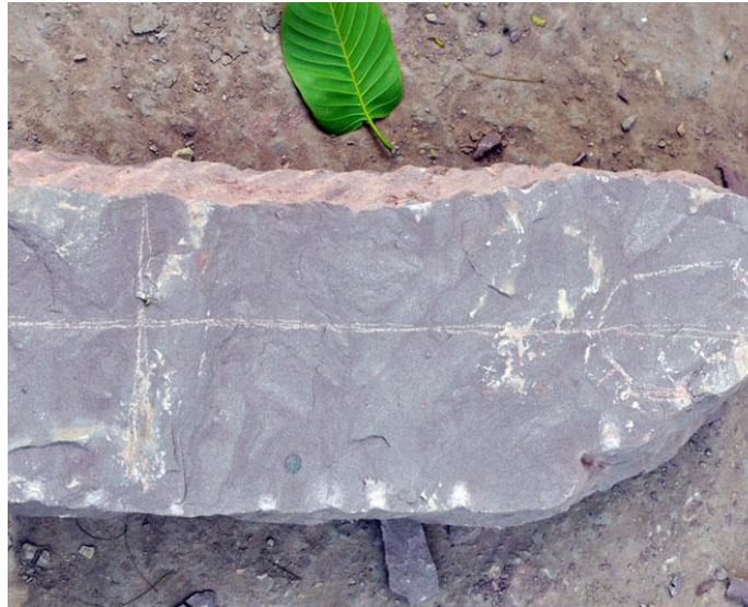
Red stone is the basic raw material.

Red, white and green are the types of stones used as basic raw materials available richly in surrounding places. The artisans of Varanasi procure stone from Chunar which is located 20km away from Varanasi. The references are marked on the stone using charcoal. Hammer locally called as Hatauda is used for hammering. Different types of chisels used for chiseling. Batti is the stone used for polishing after completion of carving. The divider Prakaar is used for scaling. The idol is washed with cold water after its completion. The idols are painted using artificial colors.