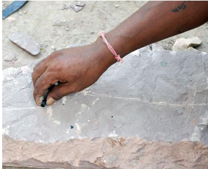
The design to be carved is being sketched on the stone by the artisan in the beginning stage.