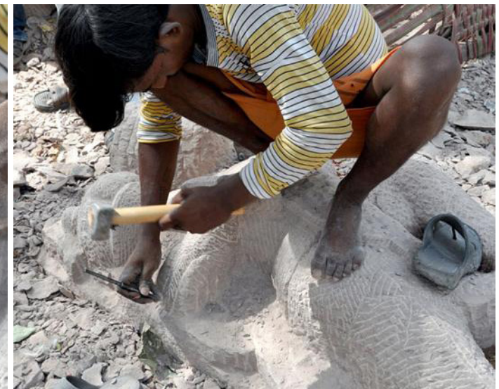
Skilled carver involved in detailing out the shape.