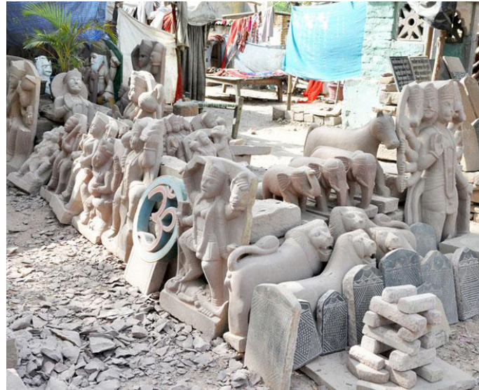
Displayed products at artisans place.

http://www.dsource.in/resource/stone-carving-varanasi/introduction