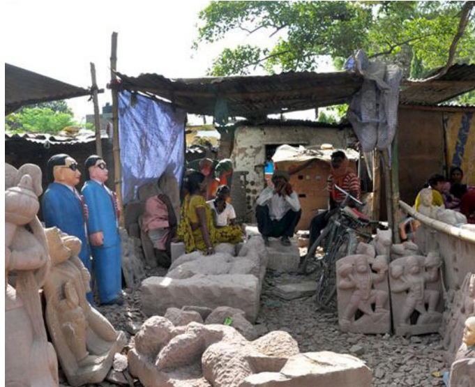
Stone workers at their free time.

http://www.dsource.in/resource/stone-carving-varanasi/introduction