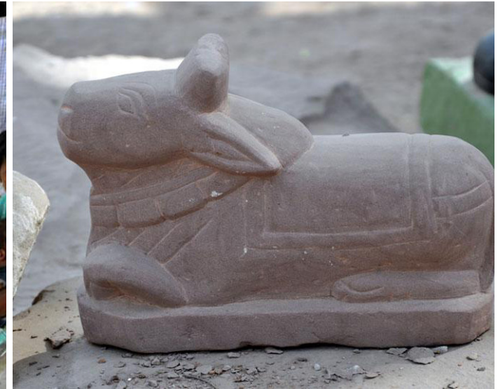
Stool made of cane.