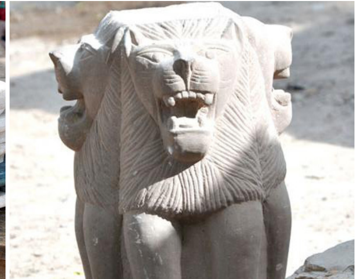
Water used to sprinkle on stone while carving.