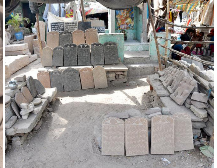
Carved stone slabs.