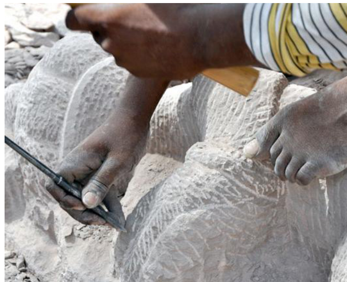
Artisan giving rough detailing on the stone statue.