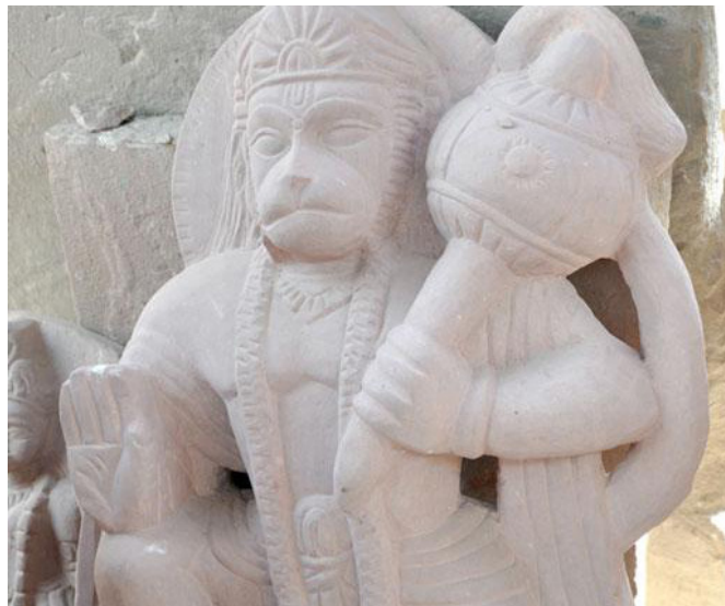
Smoothening the rough surface using Batti- a type of stone.