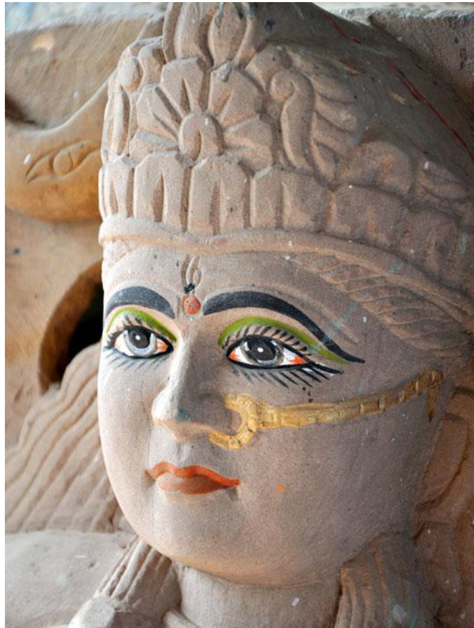
Sofa made of cane with a style of Jaali motif.

Most of the stone products are replicas of gods, goddesses and Hindu mythological characters- some are the images of animals like elephant, horse, name plates and sitting posture of Nandi-ox. House hold items such as Daraiti- stone grinder, Chakla – a circular stone slab to make roti also examples of products. The five faces of Hanuman idol is a regular product. This is produced to cater to needs of temples in surrounding areas. These idols are also exported to Gaya and Patna in Bihar district.