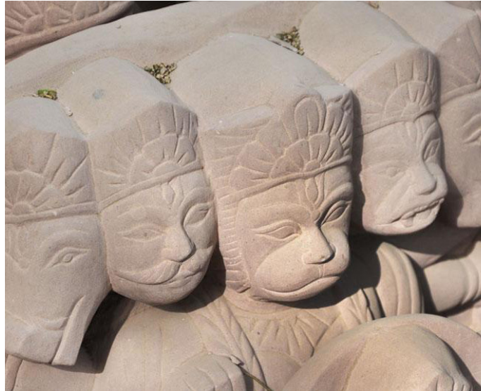
Idol of lord Hanuman carved in red stone.

Varanasi in Uttar Pradesh has very rich deposits of red stone. The experienced stone artisans of Varanasi have been doing stone carving since 50 years. The art has been carried from older generation to retain the tradition. Blocks of red stone is first cut and carved roughly. The detailing is obtained by fine carving. Highlighting facial expressions with artificial colors can be said as special feature in their carving. The stone artisans in Varanasi are called as Girharwal locally. Men involve in carving. Women help in polishing and washing the final idols. In Varanasi, there are nearly 20 to 30 families engaged in stone carving.