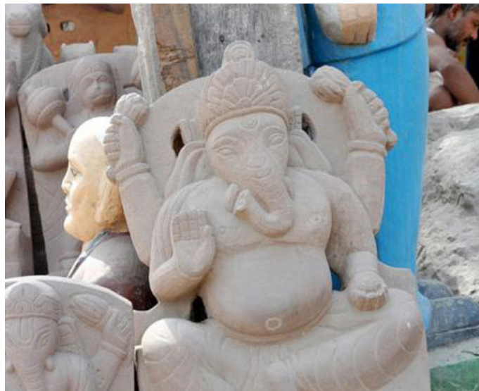
Rough stone used to smoothen the stone surface.