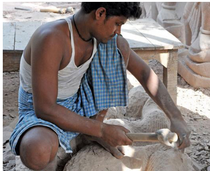
Stone carver involved in carving.