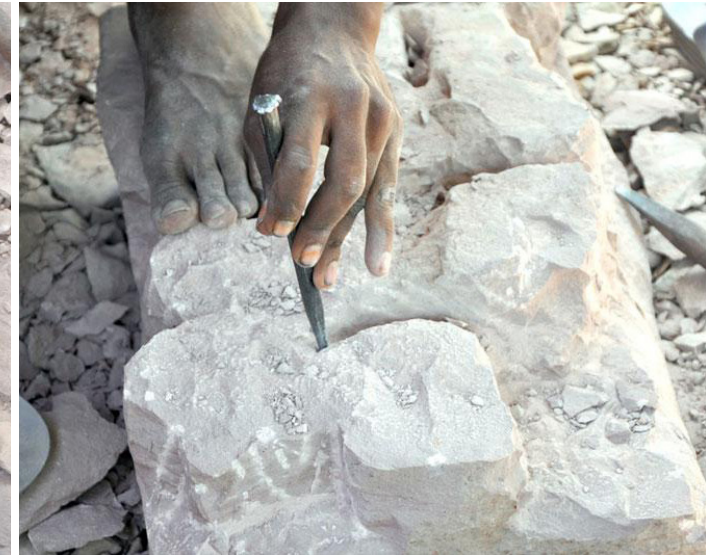
Major carving is done using large chisels.