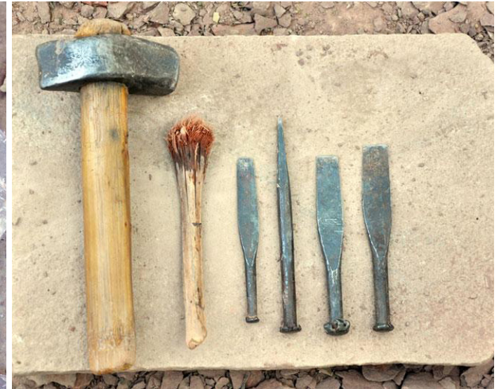
Stem of coconut tree used to clean the stone during carving..