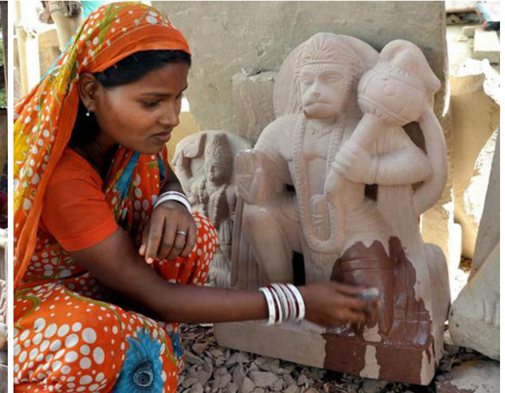
Women involved in polishing process.