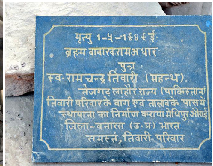
Sofa with different internal weaving pattern.