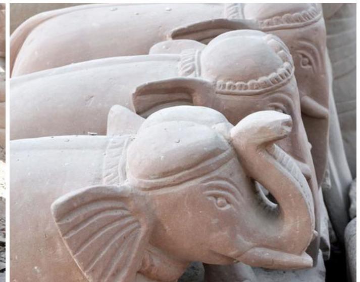
Carved idols of elephants.