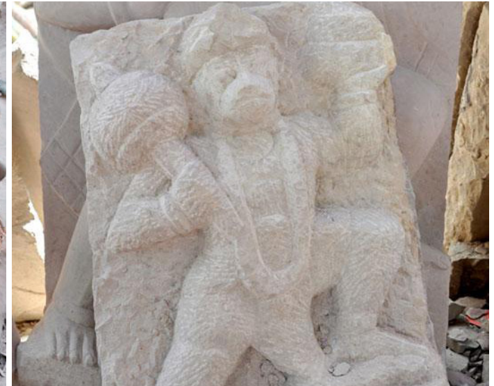
The carved idol is ready for smoothening.