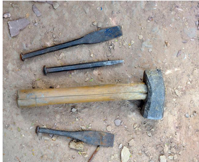
Hammer and chisels are the main tools used in stone carving.

http://www.dsource.in/resource/stone-carving-varanasi/tools-and-raw-materials