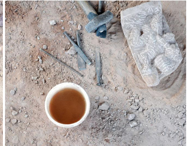
Water used to sprinkle on stone while carving.