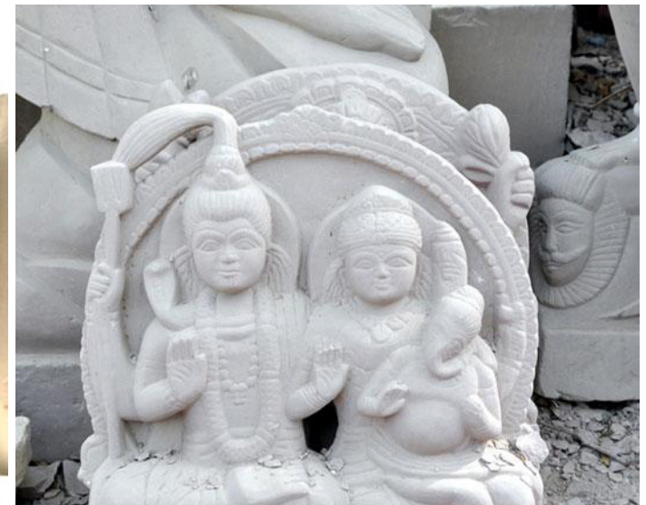
The finished product of deities.