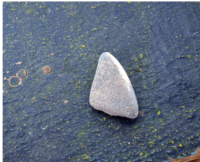
Rough stone used to smoothen the stone surface.