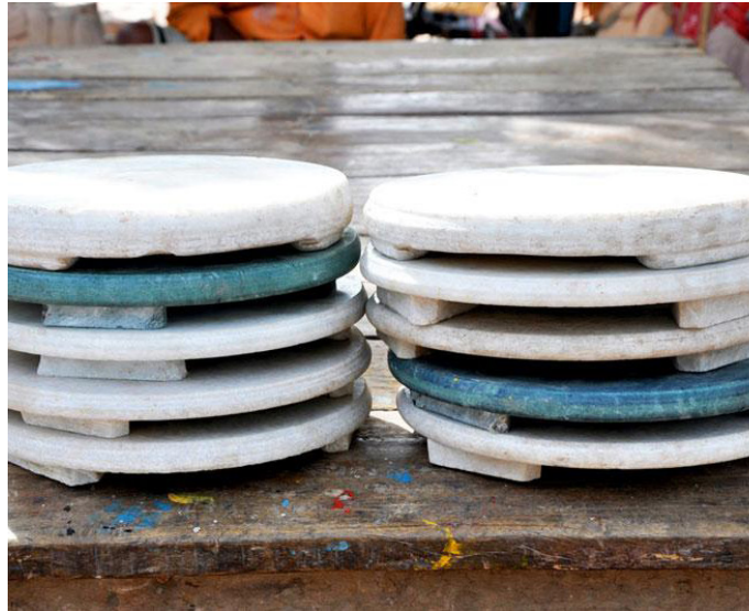
Hammer and chisels are the main tools used in stone carving.