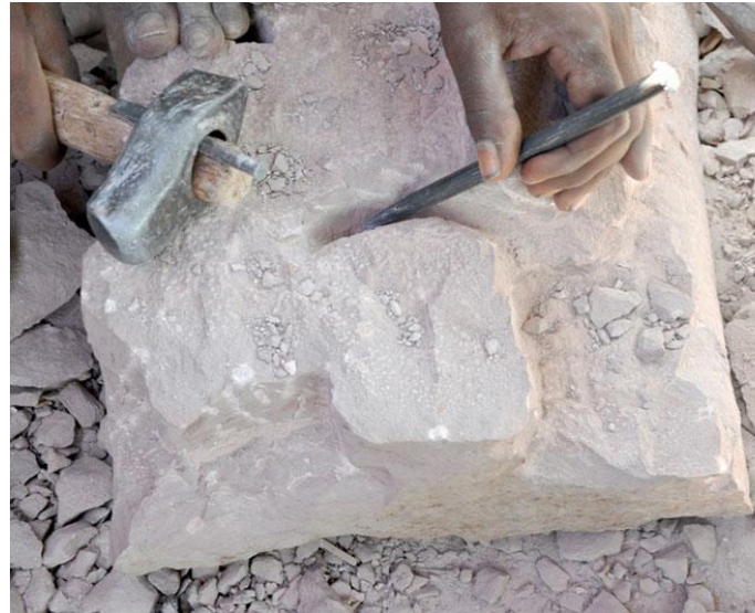
Shapes obtained through the process of hammering and chiseling.

http://www.dsource.in/resource/stone-carving-varanasi/making-process