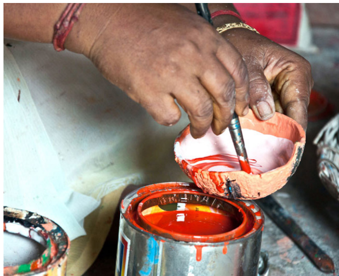
Mixing the red and white oil colors to obtain pink.