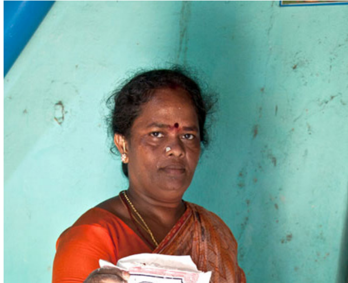
Plaster of Paris.

http://dsource.in/resource/talai-aati-bommai/ tools-and-raw-materials