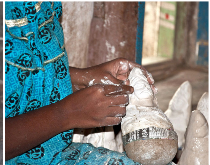
The detailing is done with a sharp edged tool on POP model.