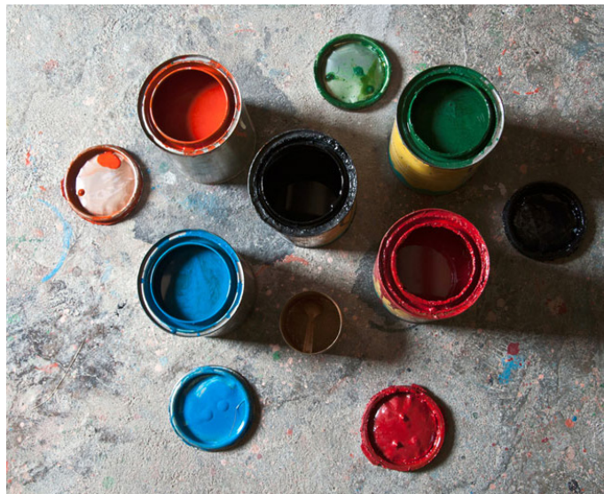
Different colors of oil paints.