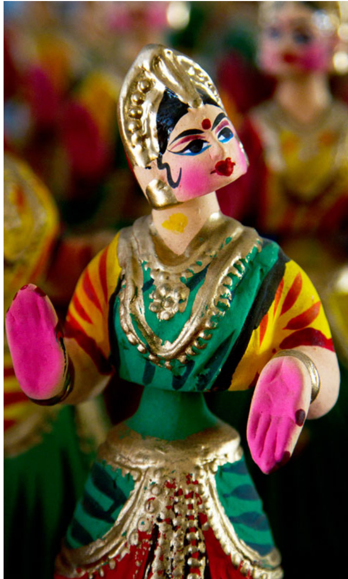
Thanjavur dolls are well known for its fascinating ornament work.