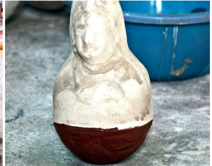
The doll is dried after clay coat coating of the base