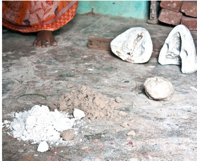
Dough is ready for moulding process.