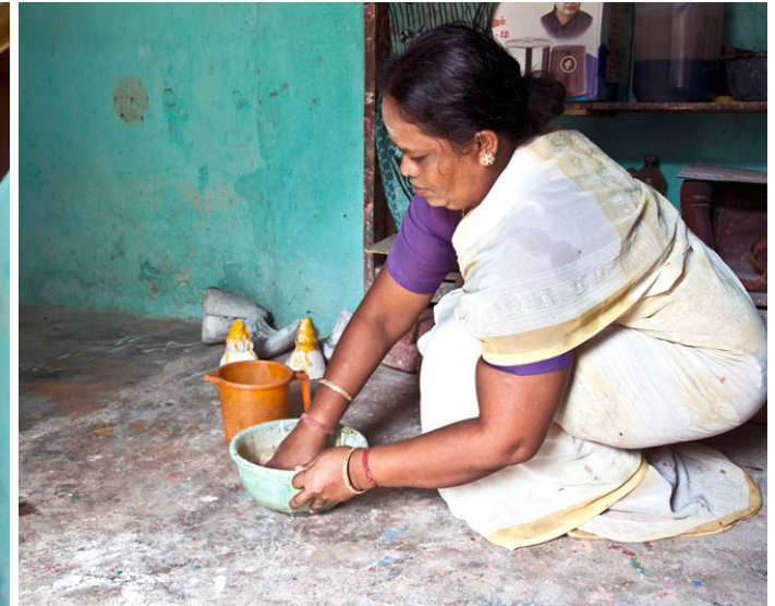
Artisan preparing the POP solution.