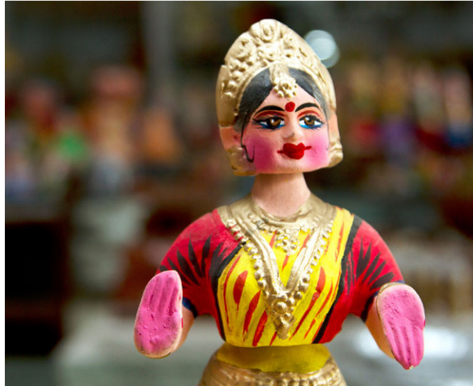
A doll in attractive red and yellow colors.

http://dsource.in/resource/talai-aati-bommai/products