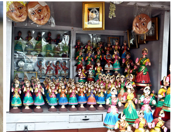
Colorful dolls in bright hues.