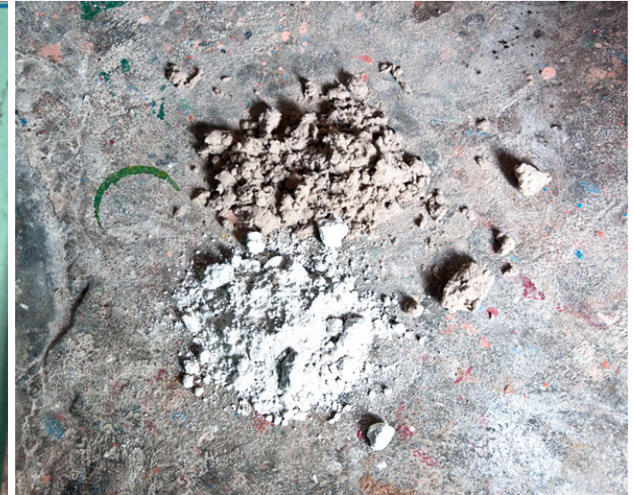
Dough made of clay and POP.