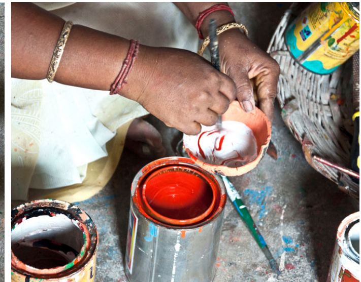
Coconut shell used as container to store color.