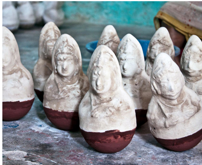
The Thanjavur dolls in the making process.

Thanjavur or Tanjore is the headquarters of the Thanjavur district in Tamilnadu. It is situated in the Cauvery delta, at a distance of 314 Km from Chennai. The traditional head-shaking dolls of Thanjavur are well known by its local name as 'Talai aati Bommai'. These dolls take their original standing position though they are moved in any angle. Handmade dolls are made with clay and Plaster of Paris. Base is completely made of clay in a form of dish. The body of doll is created with the moulds and is attached to clay base. Then the dolls are beautifully painted with bright colors to describe the facial expressions. In Thanjavur, there are nearly 10 to 15 families involved in production of clay dolls. These dolls are used in all ritual functions especially in Kolu-ritual display of Thanjavur dolls celebrated during Dasara festival.