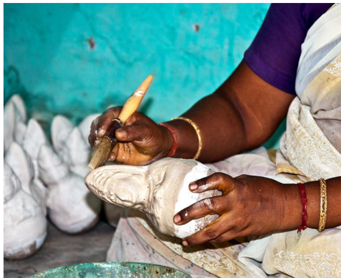
Coating the POP mixture on the body of the doll