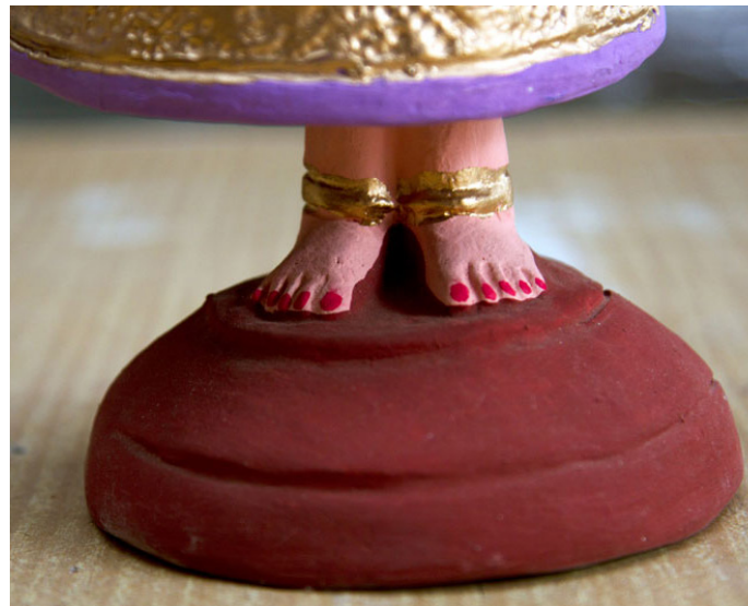
Base of doll is painted with natural red clay.