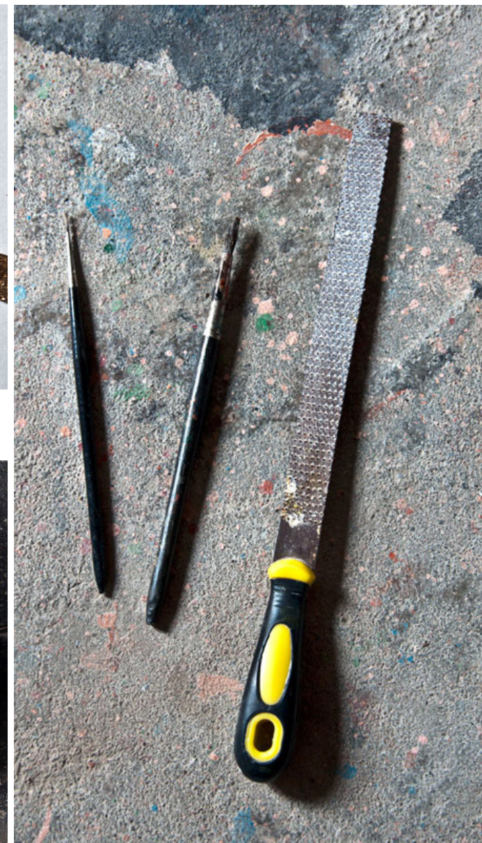
File used for smoothing the various parts of the doll during the making process.