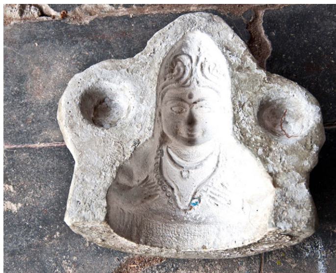
A mould with detailed facial expressions and accessories.