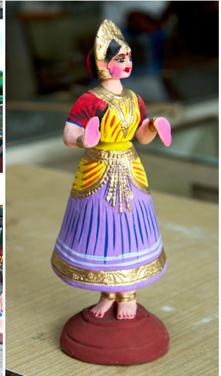
Fascinatingly decorated jewels and clothing.