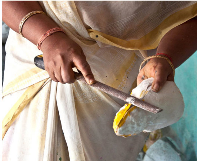
Smoothing process on the surface of doll.

http://dsource.in/resource/talai-aati-bommai/making-process