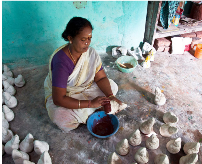
Coating the base with natural clay solution.

http://dsource.in/resource/talai-aati-bommai/making-process