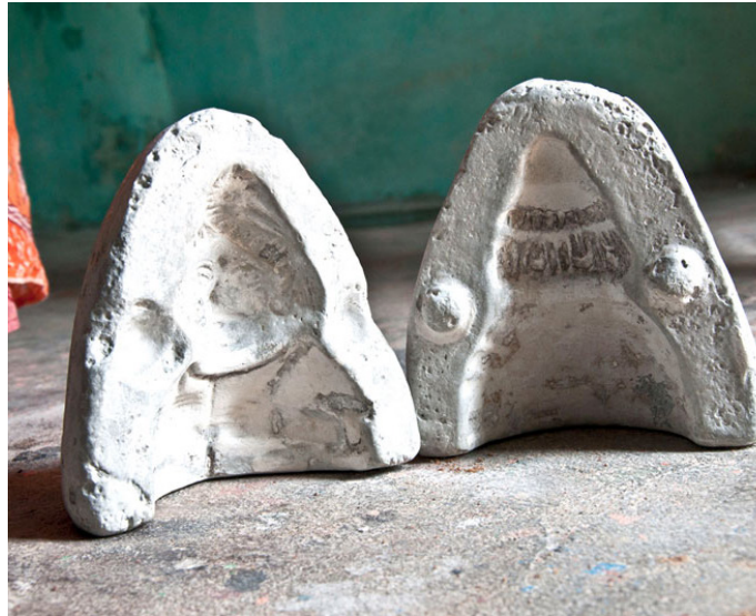
Moulds which are made of POP (plaster of Paris).

Clay and POP (Plaster of Paris) are used in the production process. The base of doll is made with clay and the body is with Plaster of Paris. Moulds are used to create the shape and facial expressions of dolls. Fan is used to dry the prepared dolls. Both natural and artificial colors are used in painting process. A solution which is made of POP is used to coat the dolls before painting. Natural red soil is used to color the base of the doll and oil paints are used for other decorations on the body of the doll. The painting is done using different sizes of brushes.