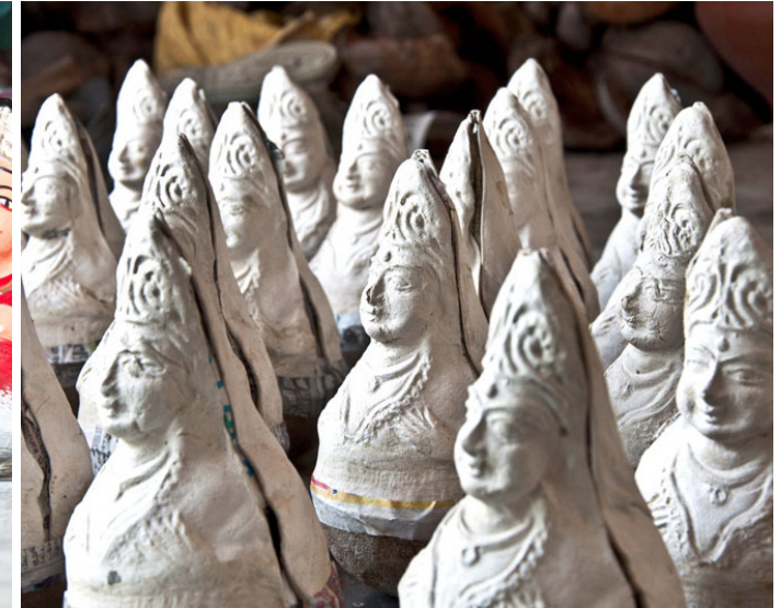
Modeled dolls ready for embellishment works.