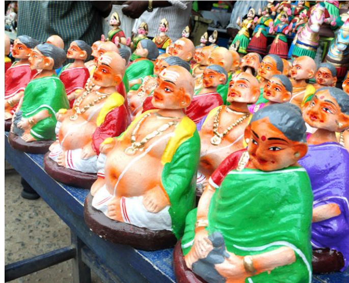
Displayed dolls at Thanjavur market place.

http://dsource.in/resource/talai-aati-bommai/introduction