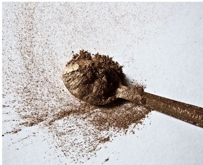
Golden color powder used mainly for ornamentation.

http://dsource.in/resource/talai-aati-bommai/ tools-and-raw-materials