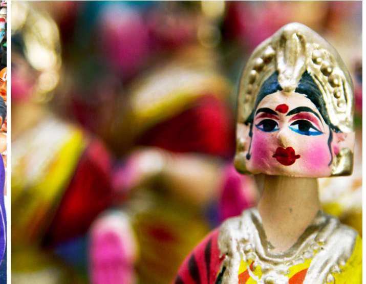
Idol of village women.