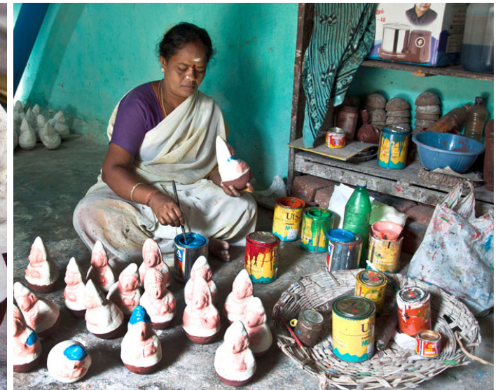
Women involved in doll production/making