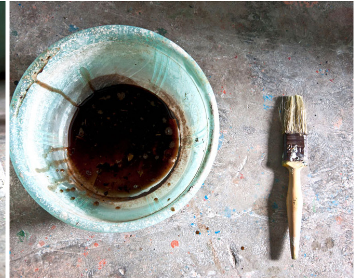
Brush used in painting process.