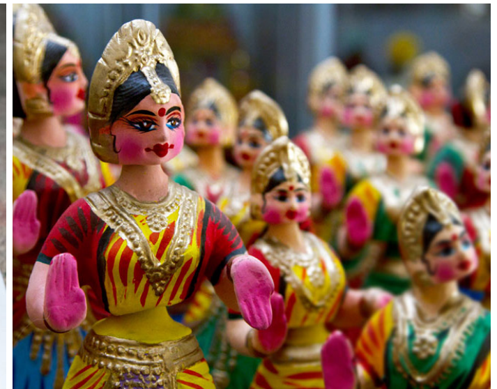
The head shaking dolls ready for the market.