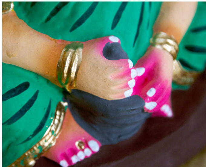
A closer perspective of detailing on the doll's body and its expressions.