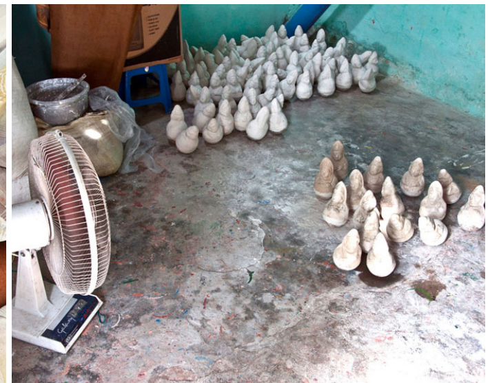
The coated dolls are allowed to dry in the shade.