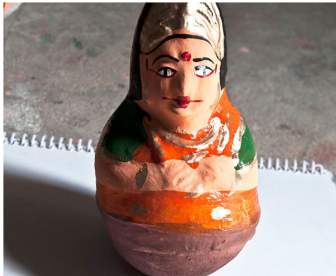
The typical Talai aati Bommai depicting Raani-Queen.

The traditional Talai aati Bommai comes in a pair called Raja and Rani (King and Queen). The specialty of these typical dolls is that the doll shakes when it is tapped and comes to its normal upright position. This happens due to heavy clay base of doll. The Products include mostly Human figures, images of gods and goddesses. Some other products consist/depict scenes from village life as well as ritual processions. The idols of Raja Rani, bride and bride groom are most popular ones among all products. These Talai aati Bommais are highly demanded in October during Dasara festival as they are elaborately exhibited in every house.