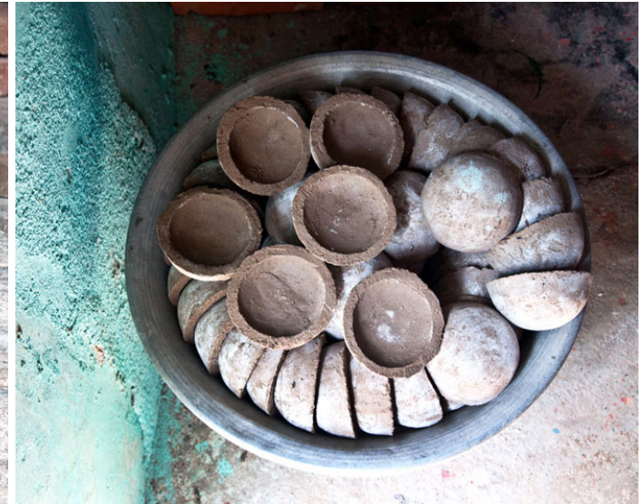
Clay Base is made and allowed to dry.