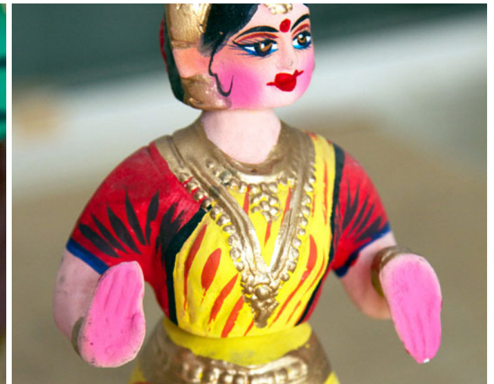
A colorful doll.