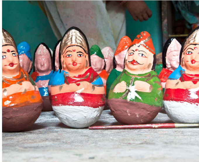
Typical Thanjavur dolls with heavy base made of clay.

http://dsource.in/resource/talai-aati-bommai/introduction