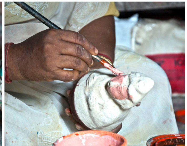
Face of the doll is painted with pink color.