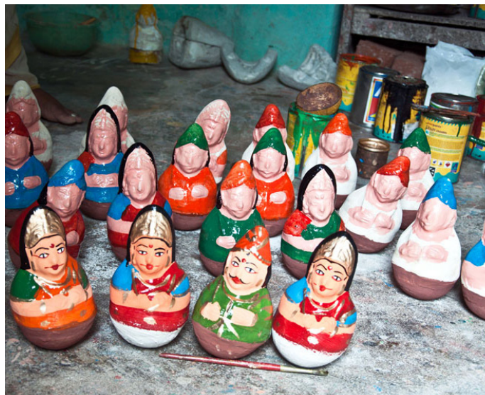
Painted dolls in vivid colors.