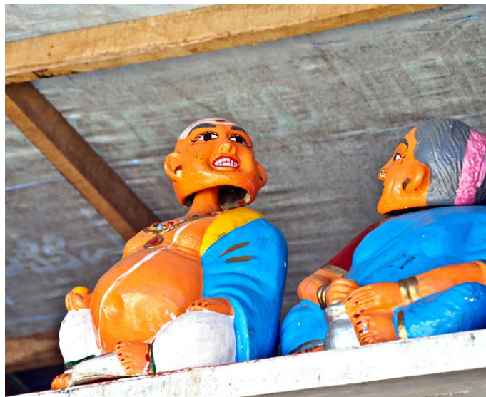
Dolls depicting a scene of daily life.