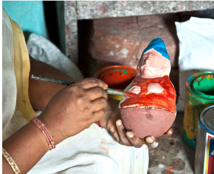
Clothing is painted in dark and bright colors.