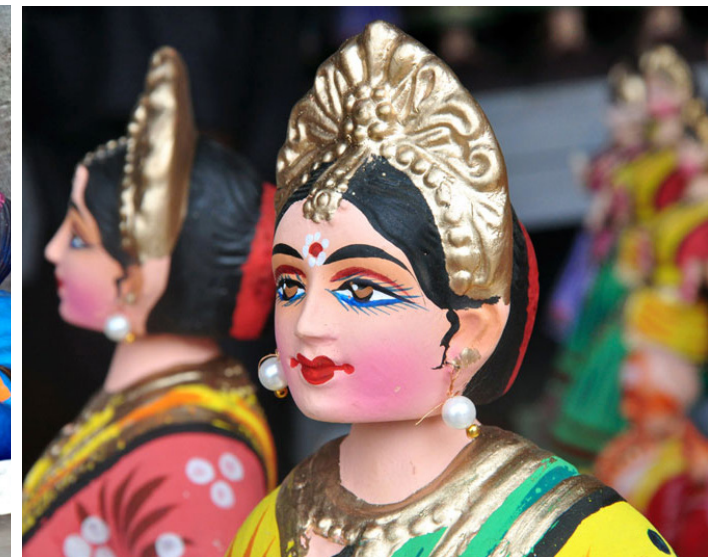
Beautifully painted facial expression.