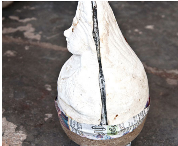
Body made of POP and clay base are attached.