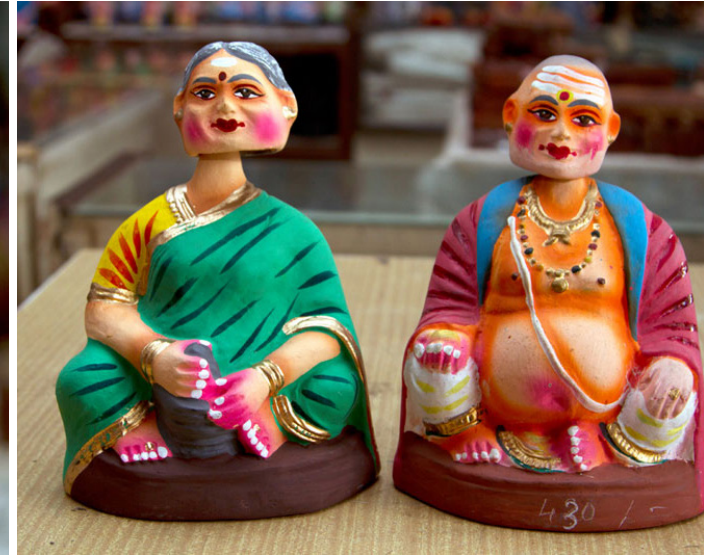
Head shaking dolls depicting daily life.