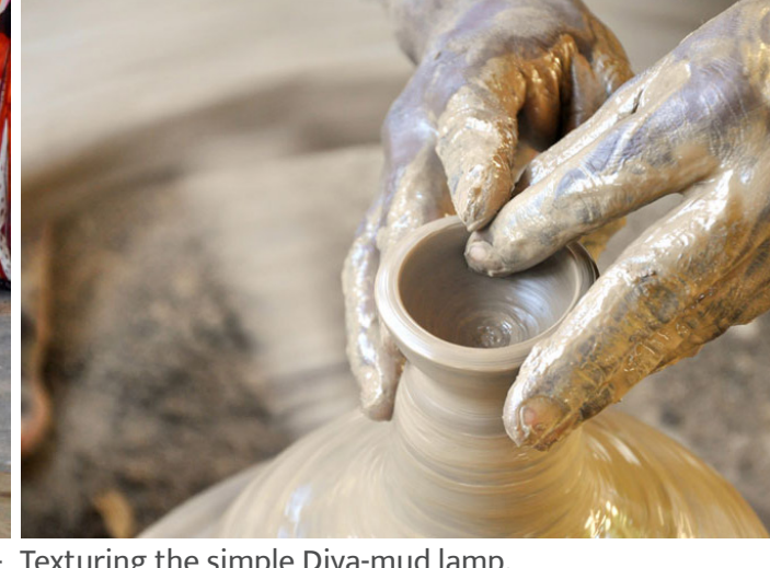
The master craftsman involved in making creative prod- Texturing the simple Diya-mud lamp. uct.