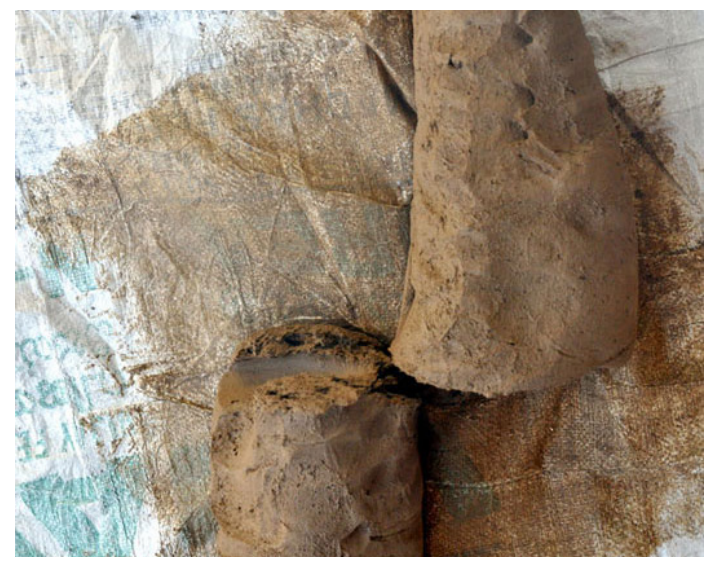
The dough is prepared with clay and sand.