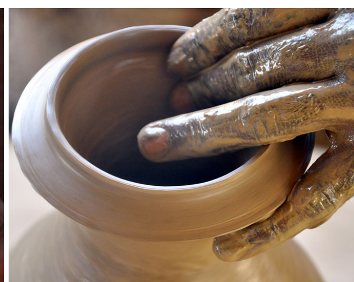
Clay is beautifully being moulded into pot.