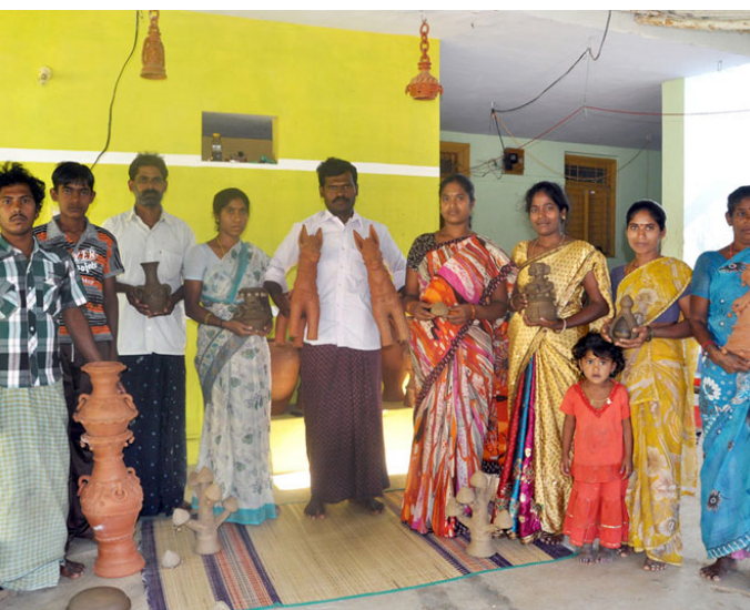
The craftsman with his family.