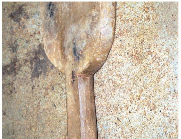
Salapa-wooden bat is used to beat the outer surface of the pot.