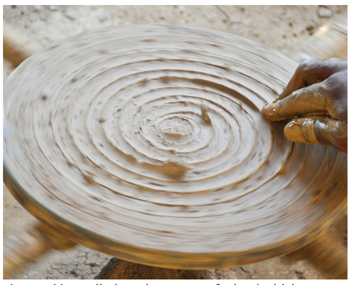
The mud is applied on the center of wheel which acts as an adhesive.