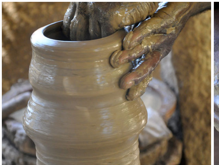
The neck of the pot is being shaped.