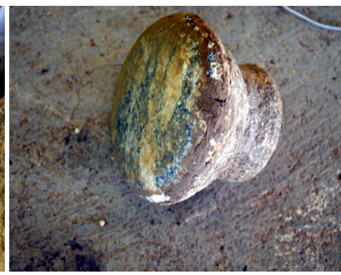
Raayi-A mushroom shaped stone which is used to beat the inner surface of objects.