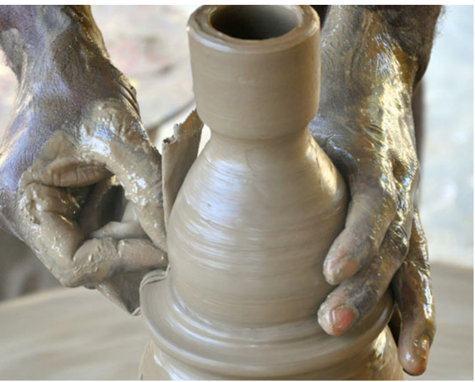
Shaped object is now smoothened.