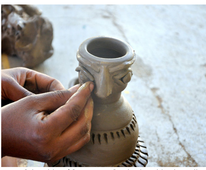
Eyes of the object/ figures are fixed using thin clay rolls.