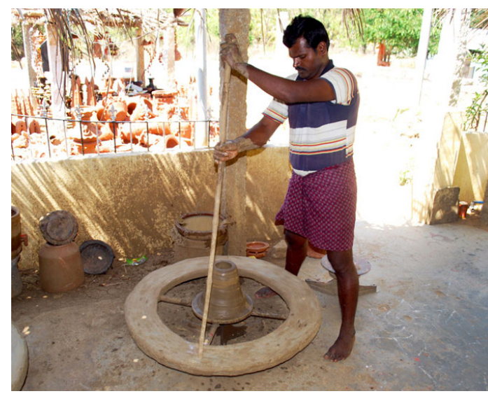
Veduru karra-bamboo stick used to rotate the wheel.