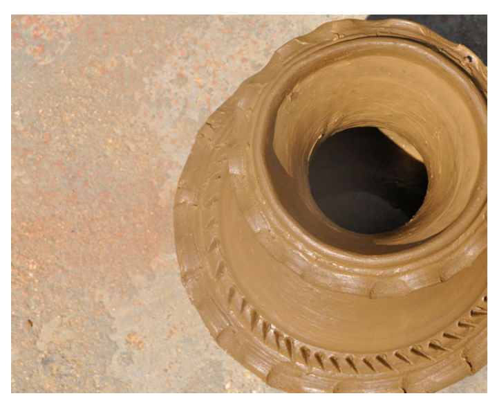
The product then is allowed to dry under the sun.