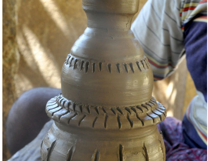
The finished product is then removed from the potter's wheel.