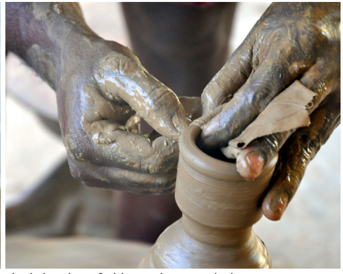
Final cleaning of object using wet cloth.