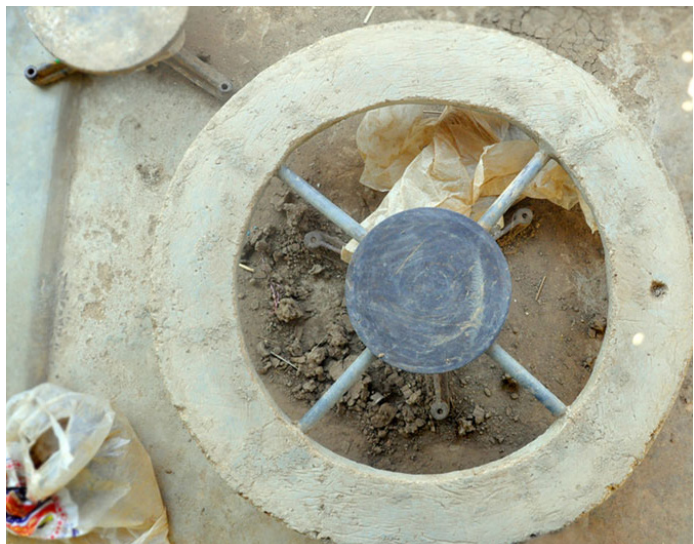
Potter's wheel made of cement.