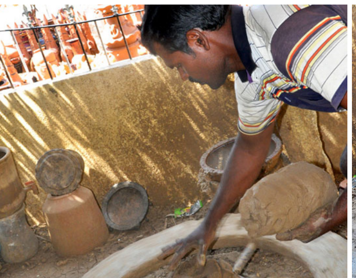
Placing the clay on the center of the wheel.