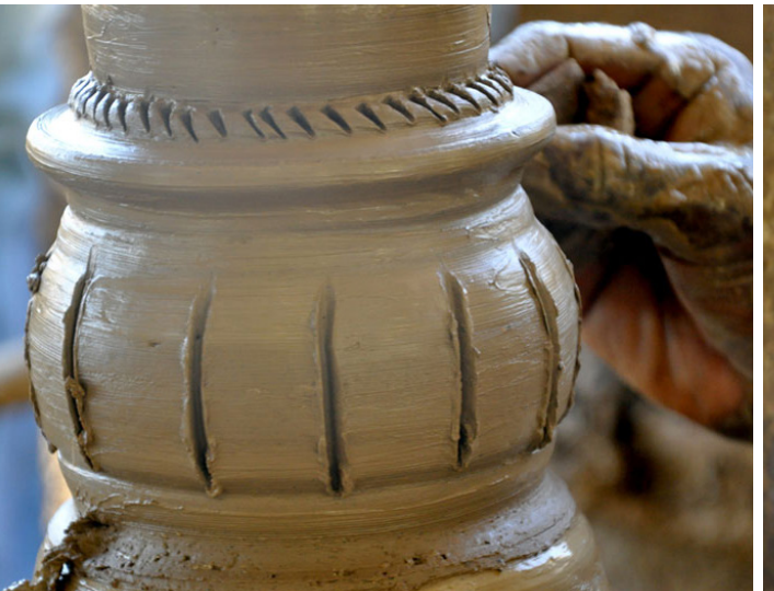
Motifs are created as per the requirement.