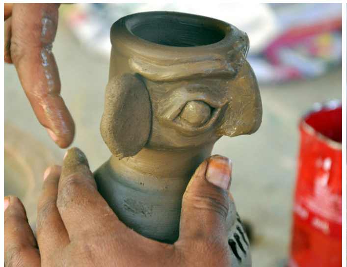
Ears are made separately and fixed.