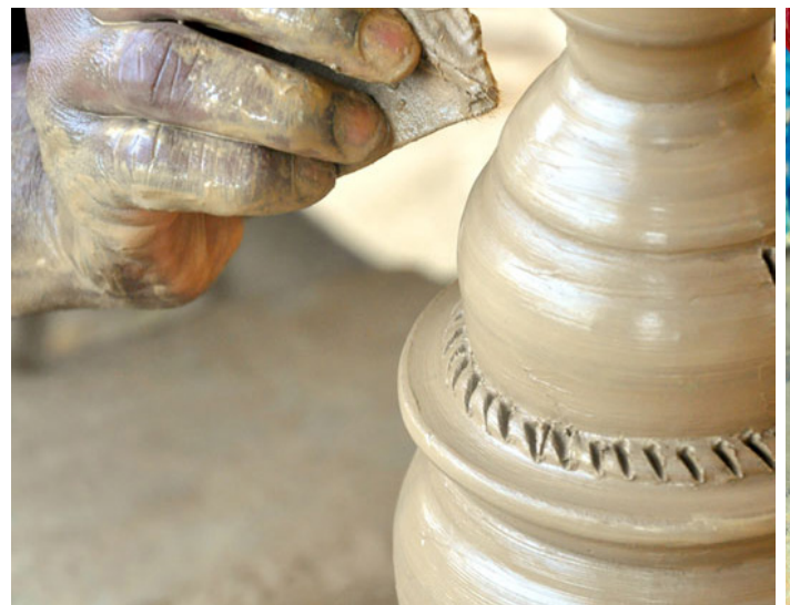
A metal blade used to create the motifs.