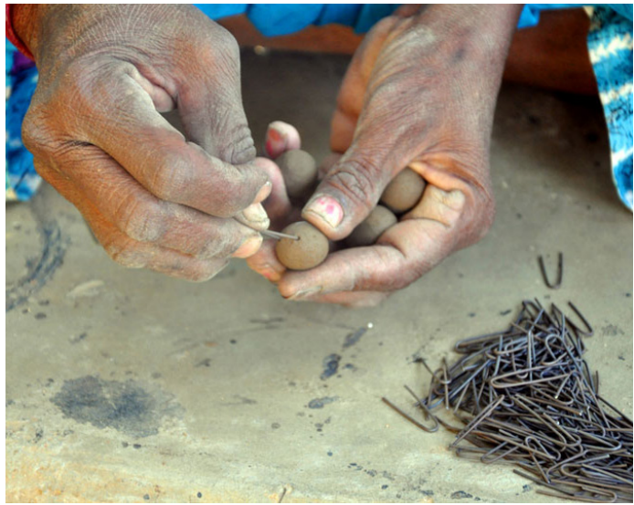
U-shaped iron sticks are inserted into the clay balls and attached to products as accessories