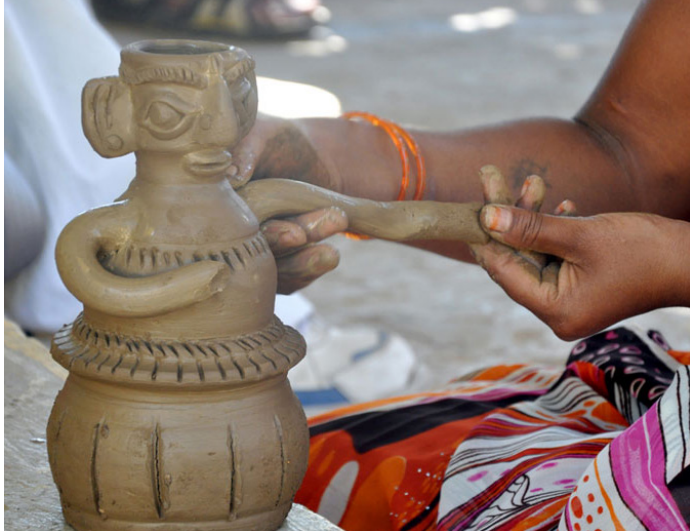
The hands are attached and smoothened.