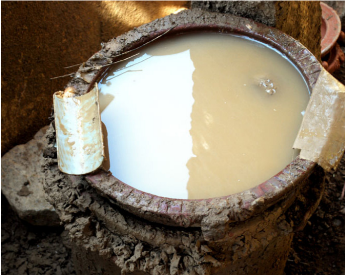
Wet cotton cloth is used to smoothen the surface of the object.