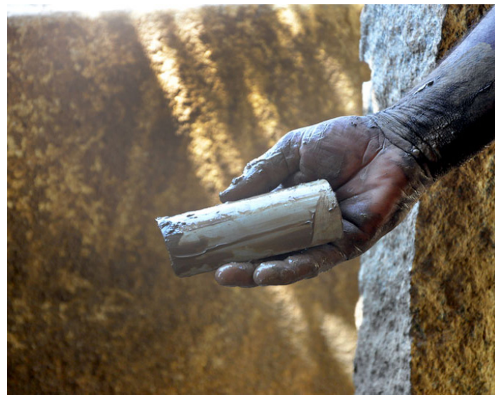
Semicircular piece of plastic used fortexturing the surface of the object.