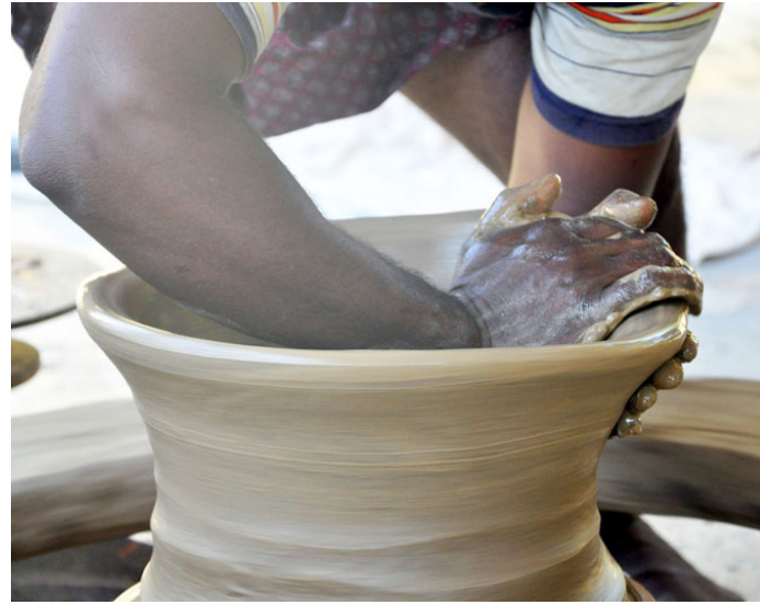
The required form is being shaped.