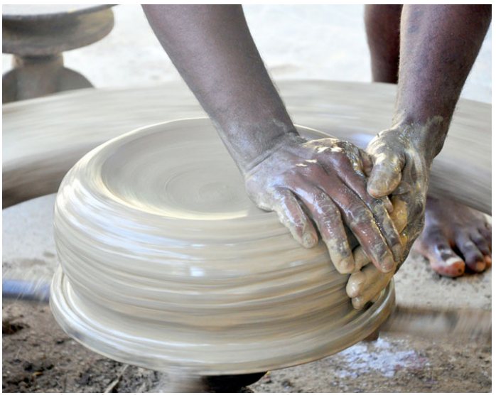
Once the wheel starts rotating, the craftsmen start to Rotating the potter's wheel. shape the clay.