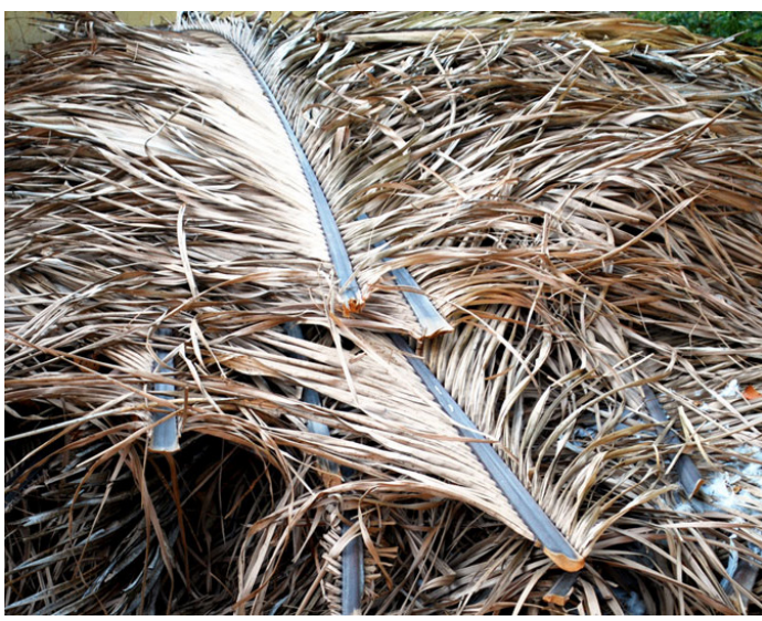
Dried coconut stems are used as fuel.