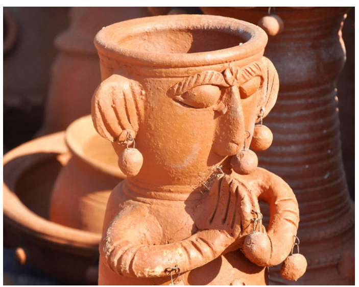
The natural colored garden decorator.

Sadum is a small village located 65km away from Tirupati in Chitoor district in Andhra Pradesh. The ancient earthenware is traditionally practiced by craftsman in Sadum maintaining their own distinctive identity in the products. The practice of terracotta craft has been happening for many generations. The rich clay found in local ponds is very suitable for making clay idols. The finely processed clay is thrown on potter's wheel and then the different parts of the idol are made independently and joined. Finally it is decorated with clay balls and thin clay coils. The craftsmen belong to Kummari community. In Sadum, the men are normally engaged in making the clay objects on potter's wheel, wherein the women folk perform the decoration part. The artisans trained by the government training institutes try to introduce the contemporary designs in the products.