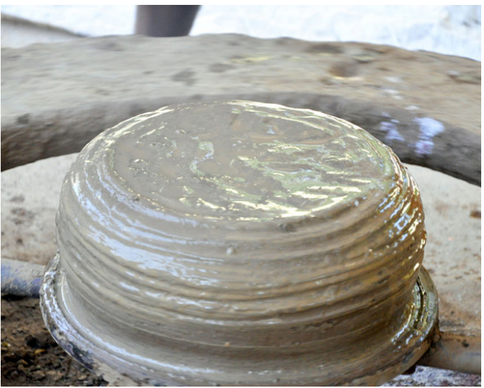
Water is applied before starting the shaping process.