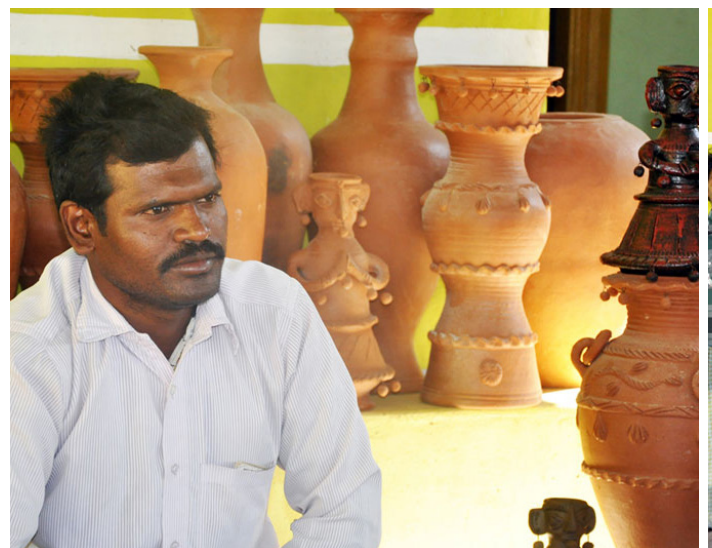
The master craftsman with his decorative artifacts.