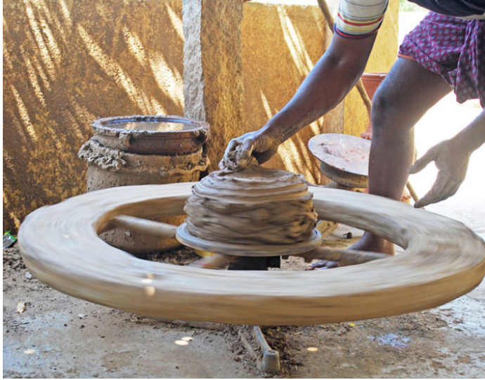
As the wheel rotates, the excess clay is removed.