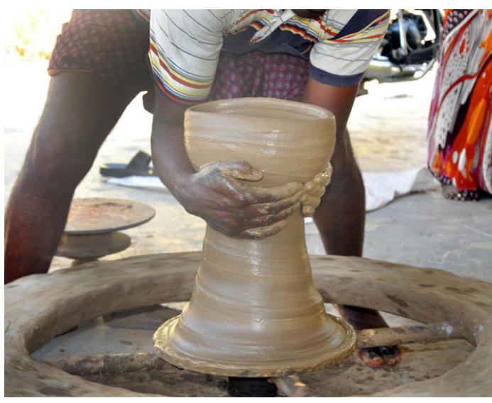
Craftsman stretching the clay vertically.