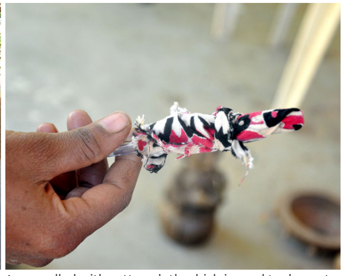
A pen rolled with cotton cloth which is used to decorate the clay objects.