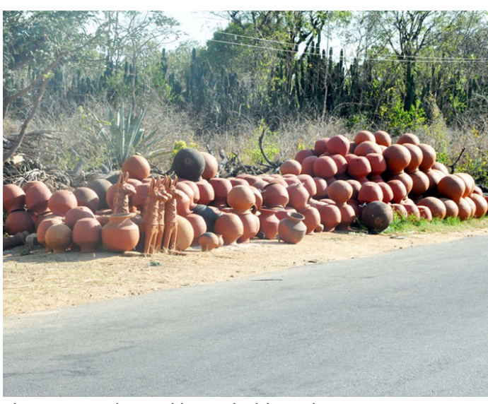
The commonly used household earthen pots.