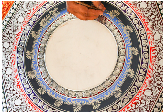
Magnificently preparing the Kinnal wall plate.

As the craft is not very popular among the youth currently, the artisans of Kinnal craft are conducting many workshops and training sessions to teach and educate other young artisans to take forward the art innovatively.