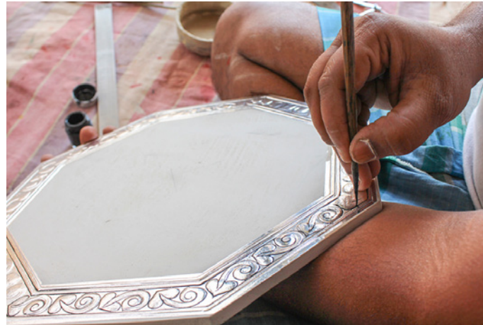
On the designs the outlines are drawn using black paint and thin pointed brush.

http://www.dsource.in/resource/wall-mount-koppal-karnataka/making-process