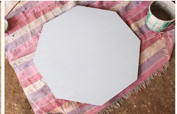
Glimpse of the dried plywood for Kinnal wall plate.