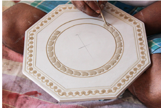
The designs are drawn.

http://www.dsource.in/resource/wall-mount-koppal-karnataka/making-process