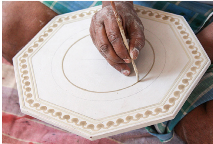
Artist paints on the sketch made on Kinnal wall plate.