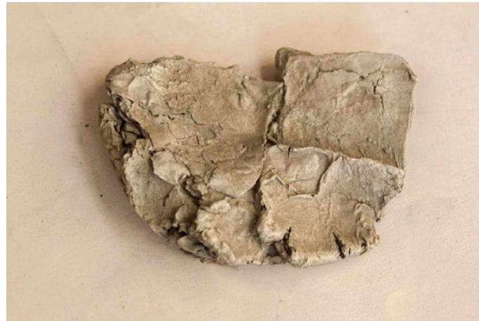
Mixture of lead and fish bone gum.