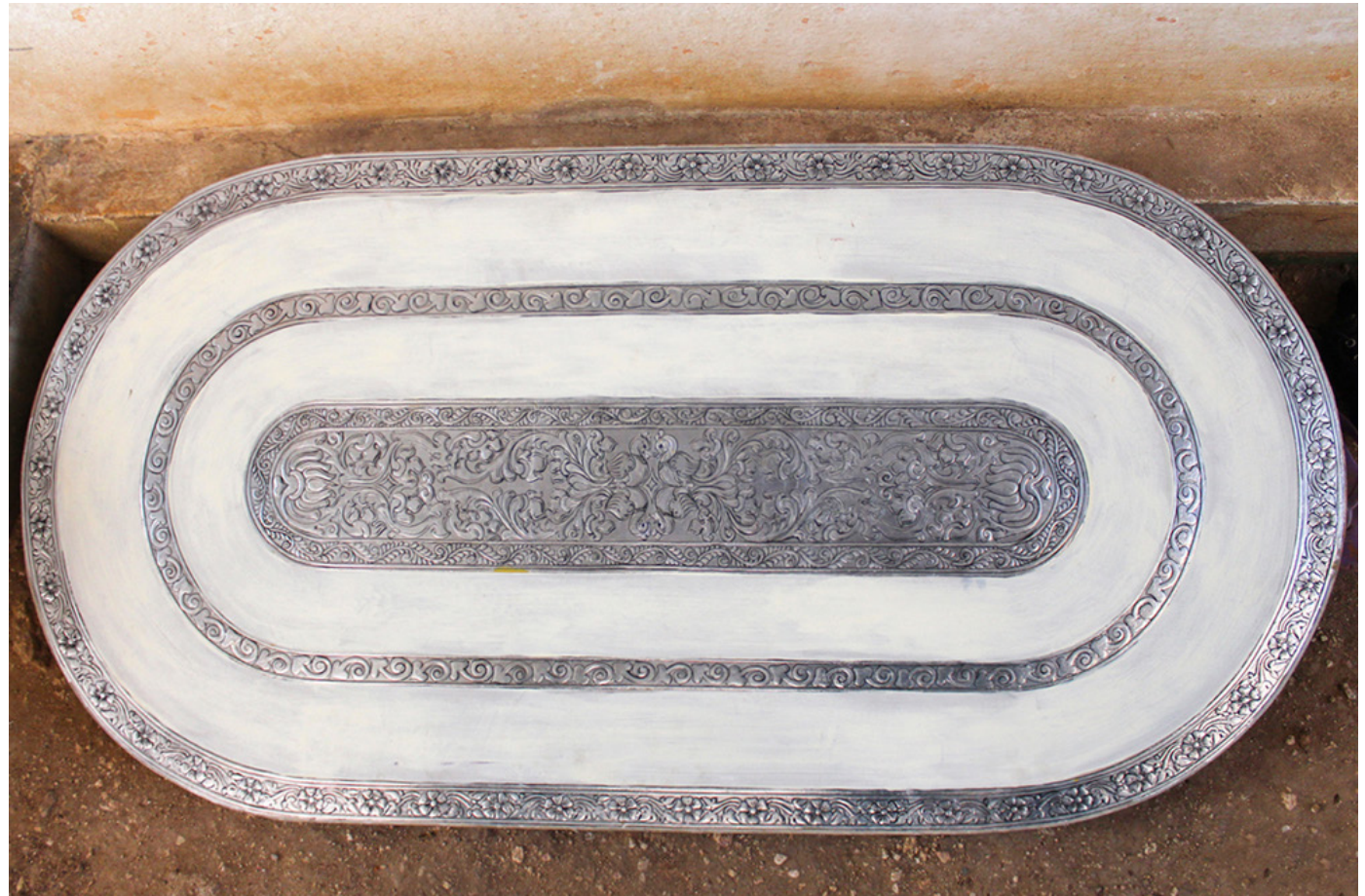
Kinnal wall plate that is made in oval form.

Some of the products of Kinnal craft are Wall hangings, home decorators, table top display, mirrors, phone stand, photo frames, etc. Price depends on material cost and making charges. Price for 1ft wall plate is approximately 400-600 INR. The maximum price of the art plate can go up to 8000-10000 INR for a table top (size 4x4feet).