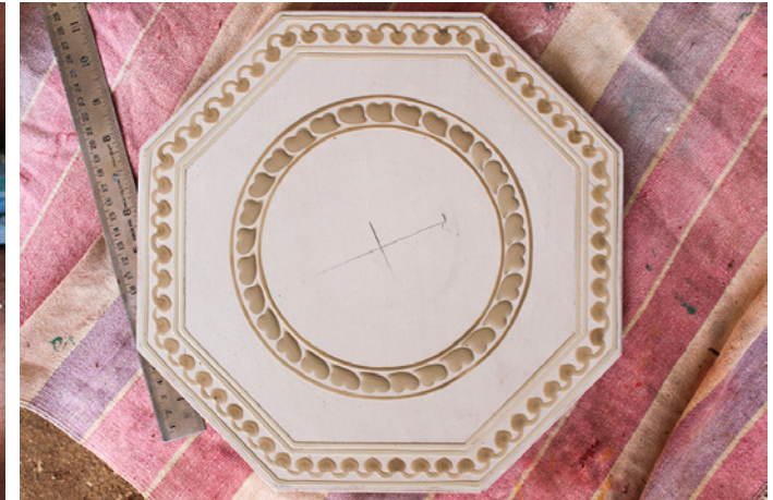
Then the wall plate is allowed to dry completely.