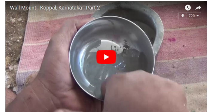
Wall Mount - Koppal, Karnataka - Part 2