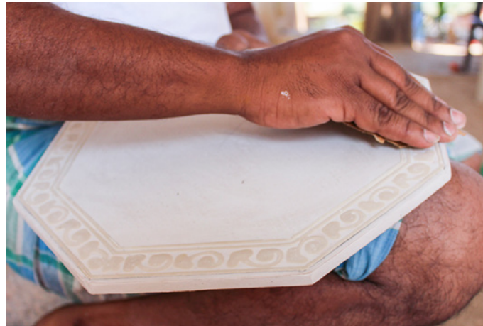
Again it is sanded using sand paper thoroughly.