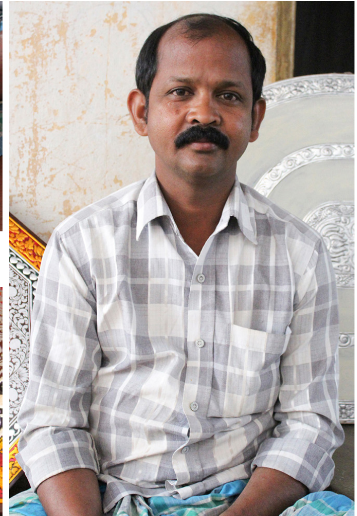
Most experienced artisan of Kinnal wall plate.