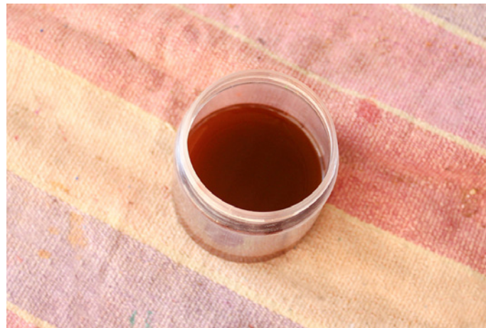
Naturally extracted color.