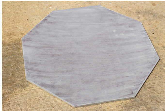
It is allowed to dry in sunlight.