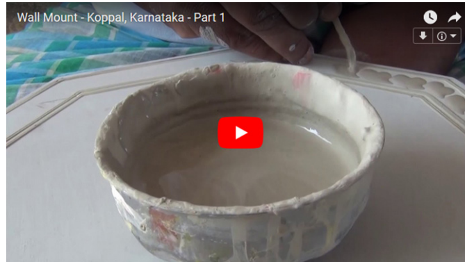
Wall Mount - Koppal, Karnataka - Part 1