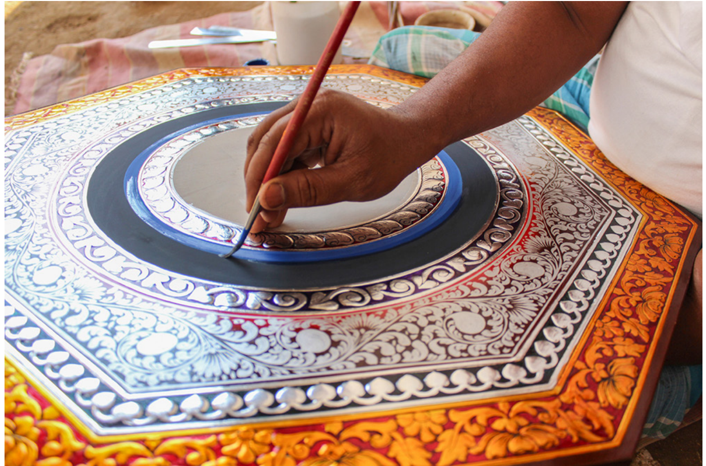
The fine line designs are made using thin paintbrushes.