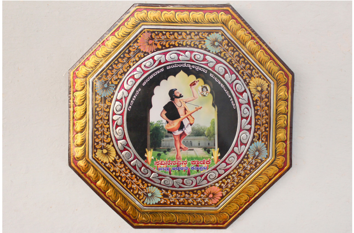
Octagon shaped Kinnal wall plate.