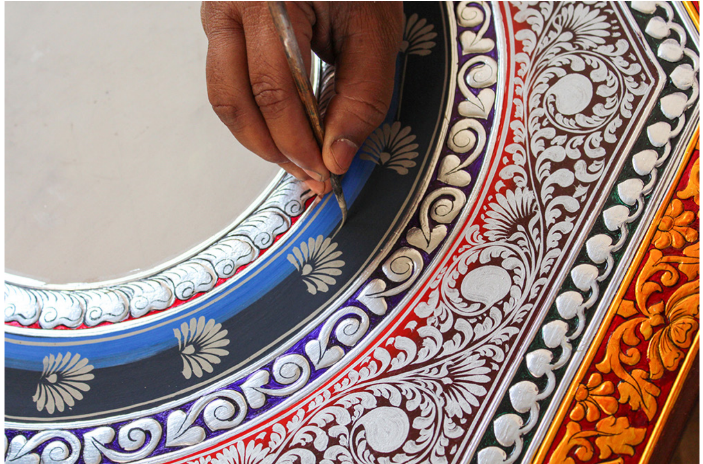
The fine line designs are made using thin paintbrushes.