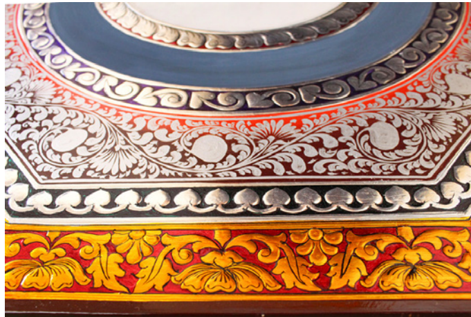
Close up of the Kinnal wall plate.