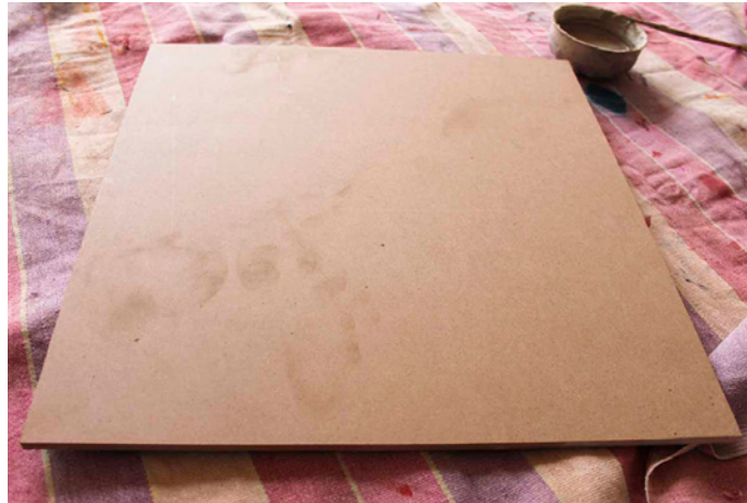
Sufficient width of plywood is selected and the required size of wood is cut.