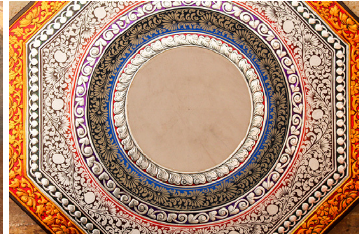
Close up of the Kinnal wall plate.