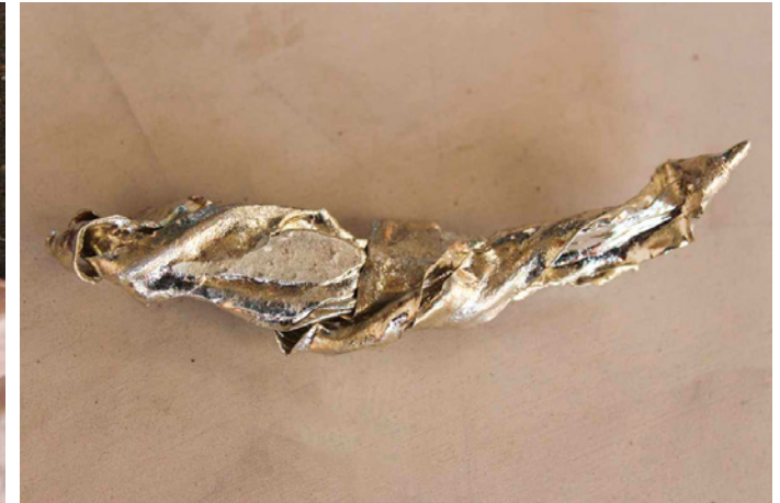
Raw form of Lead.