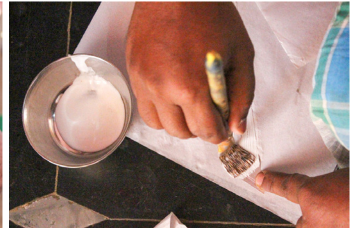
Silver foil is chosen as per the size and the fevicol is applied on the backside.