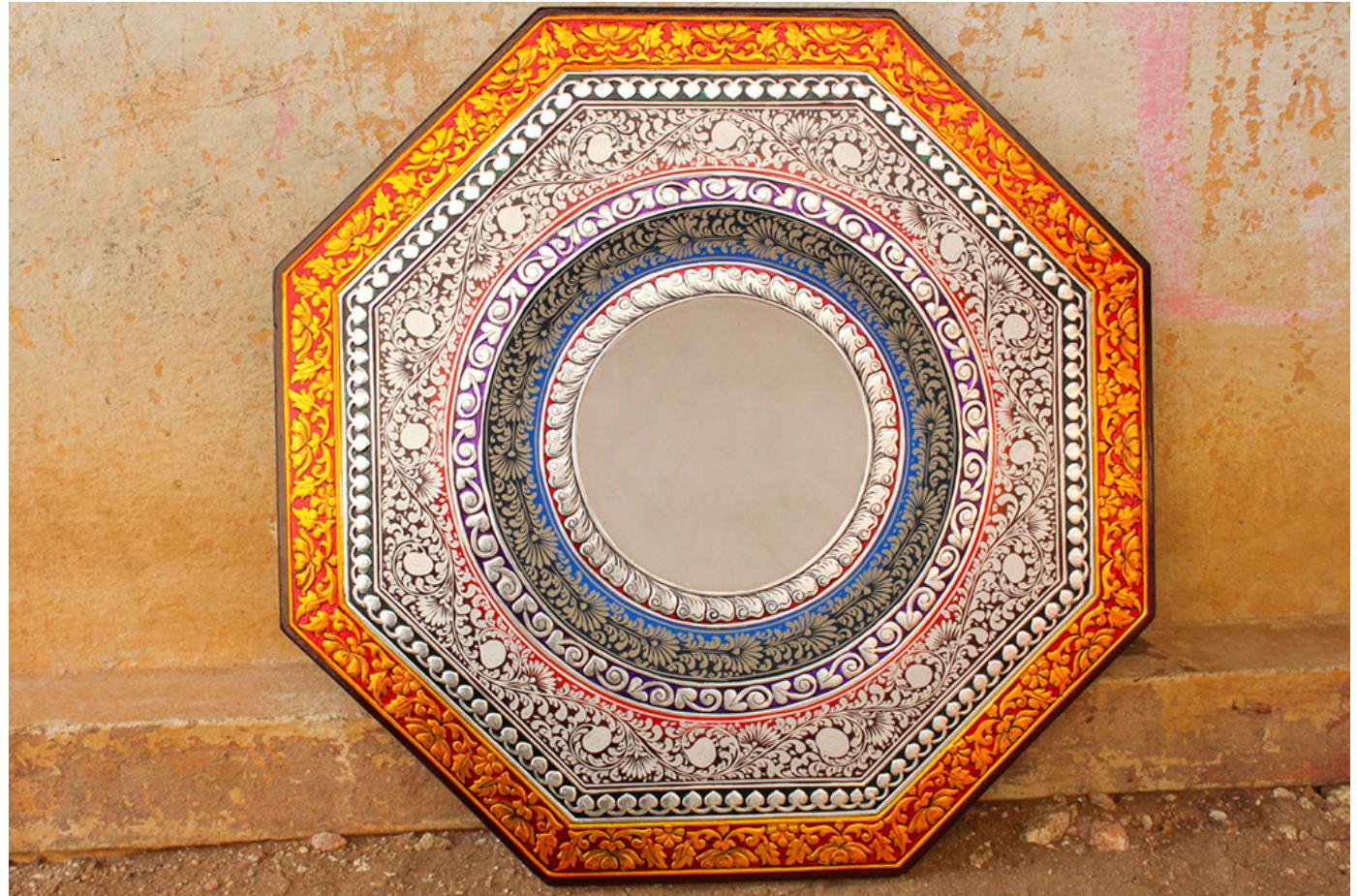
Stunning Kinnal wall plate that is rendered gorgeously using multicolor and unique techniques.