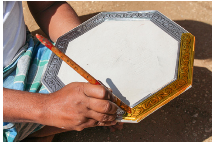
This mixture is applied on the silver foil that is stuck to the kinnal wall plate.