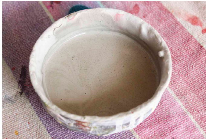
Mixture of chalk powder and adhesive.