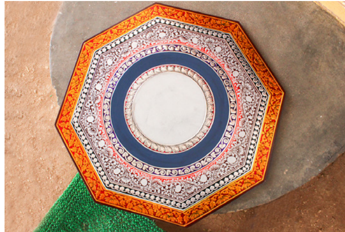
Kinnal wall plate.

http://www.dsource.in/resource/wall-mount-koppal-karnataka/introduction