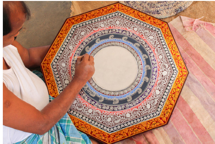
The fine line designs are made using thin paintbrushes.