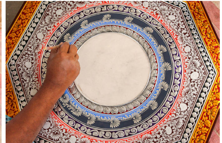
The fine line designs are made using thin paintbrushes.