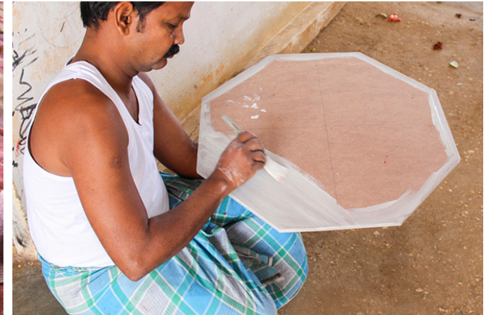
The wood is completely painted.