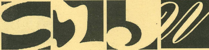
Class of '98: Poetry with typefaces