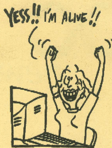
illustration by naga