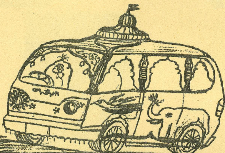
....all that is Indian !