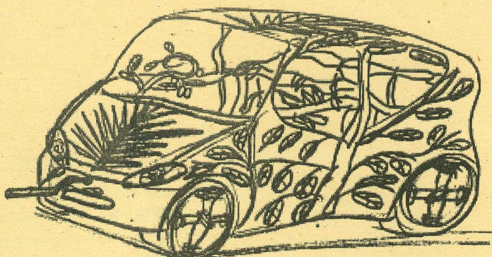
..... the ecofriendly and environment conscious !

A customised styling of four-wheelers for a few of the faculty . Can one identify!!!