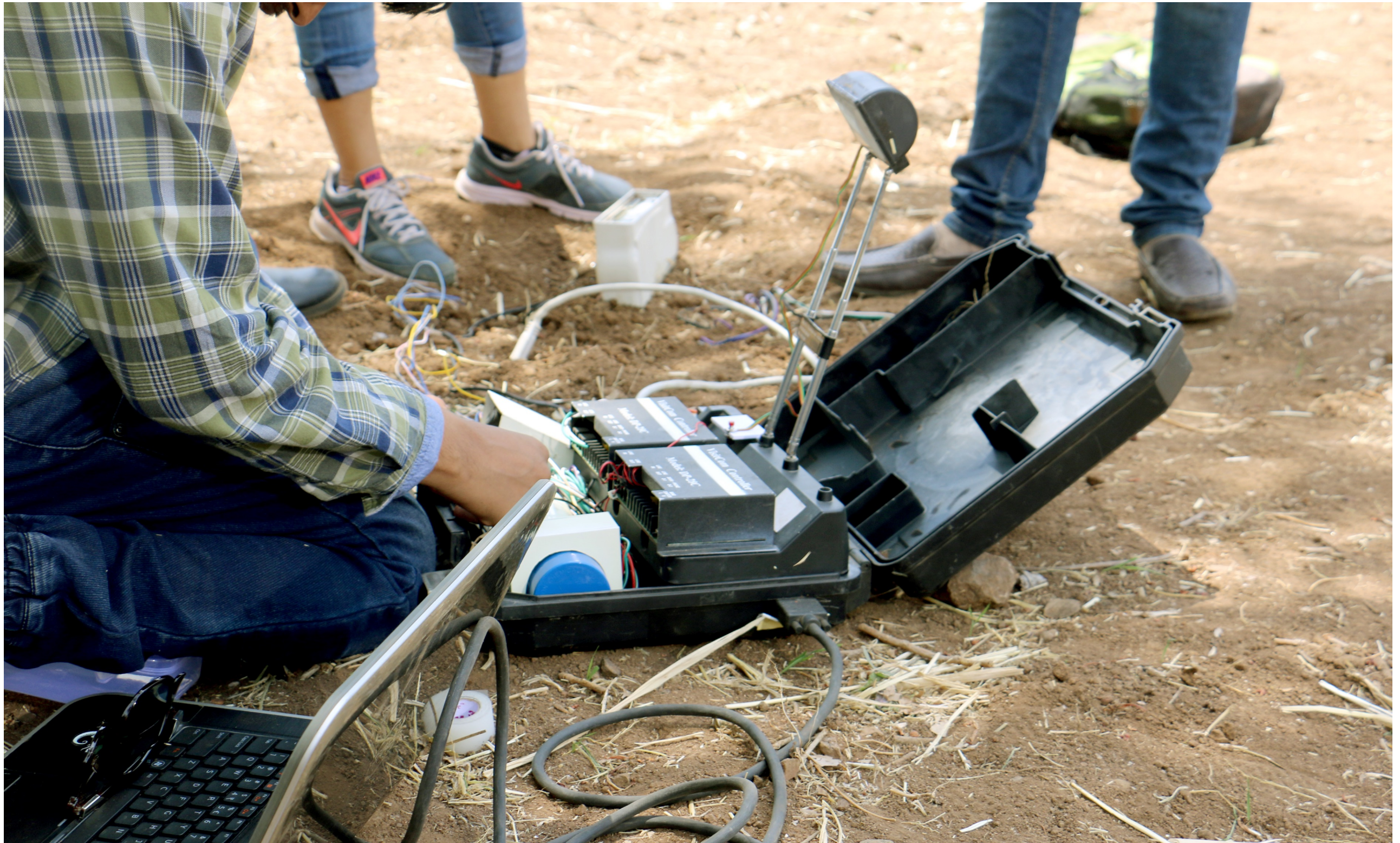
MINI - SEISMOMETER