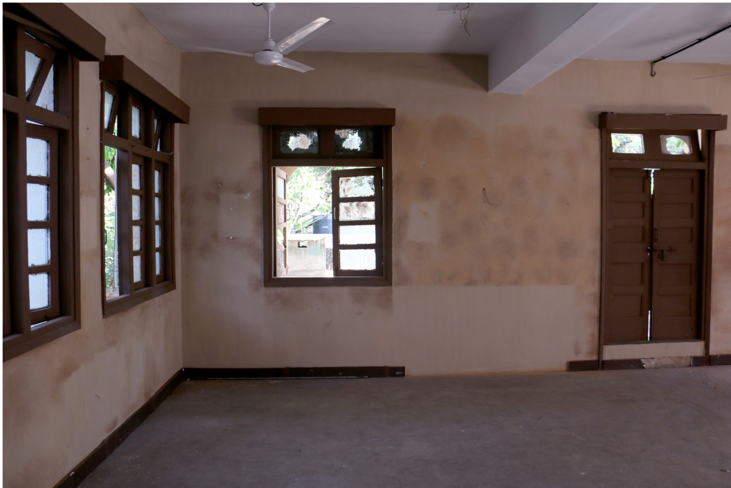
Govt. Seismological office