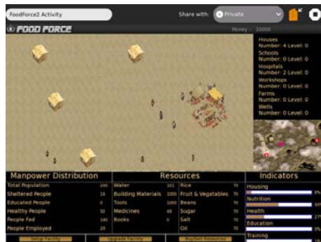
Figure.1 General View of the village in FoodForce2