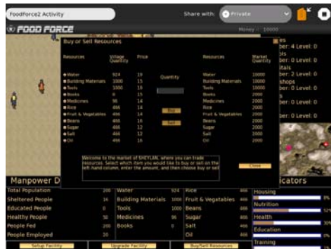
Figure.2 Trading in FoodForceII

The final cornerstone of the play is trading which is crucial to a village's success. The price of the resources is determined by market forces.