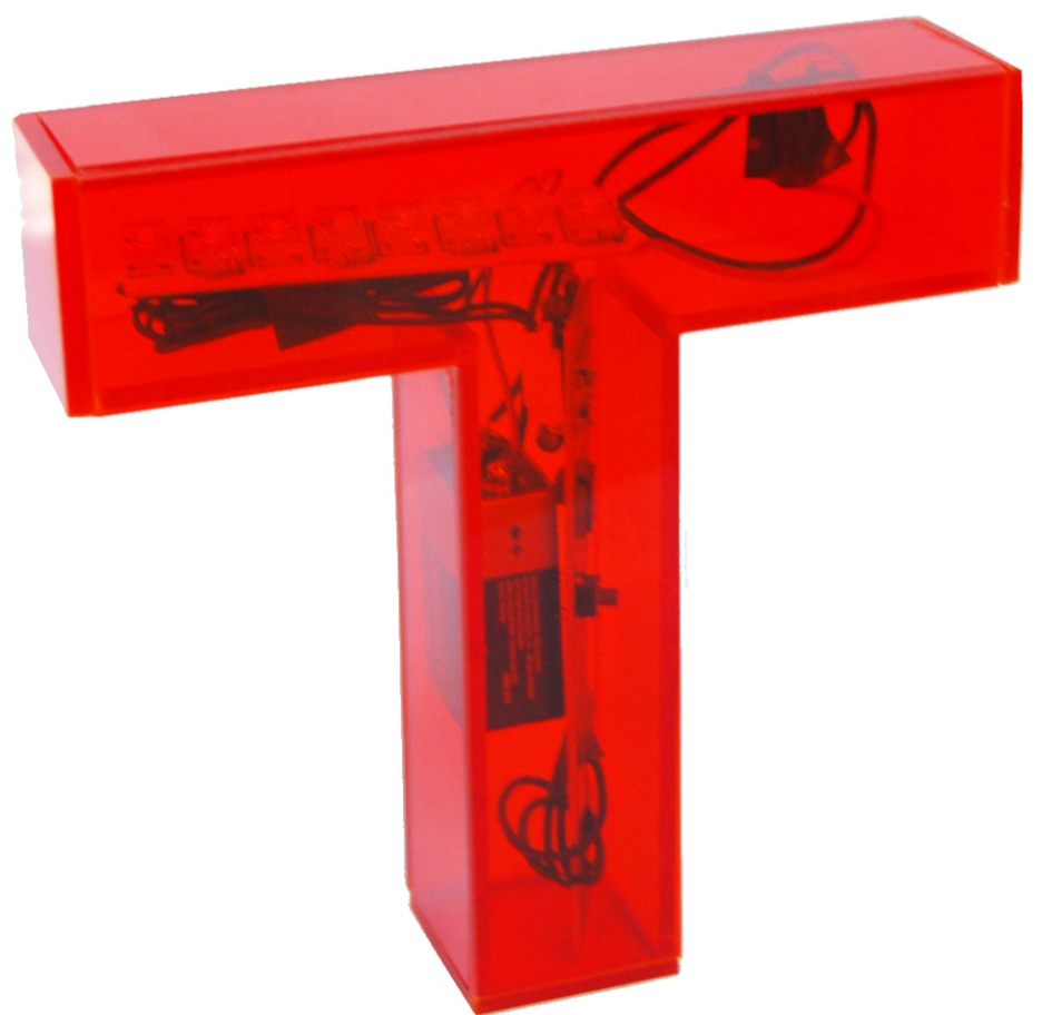
Fig.6.2: Photograph of the final prototype

Spatial orientation and formal learning can go “hand in hand”