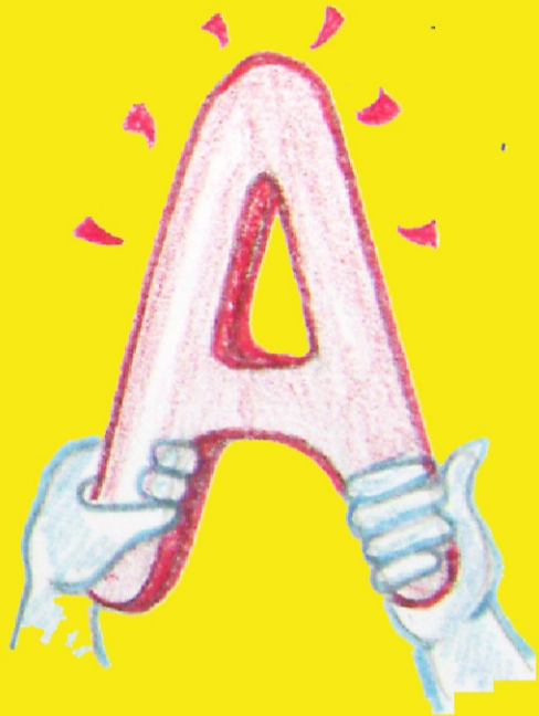
Fig. 6.1: Concept sketches