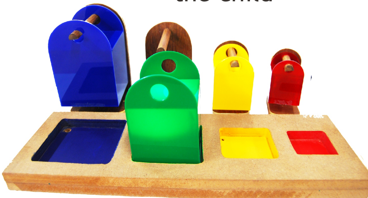
Fig.6.1.2:Photograph of the final prototype

Improves the cognitive and perceptive skills of the child