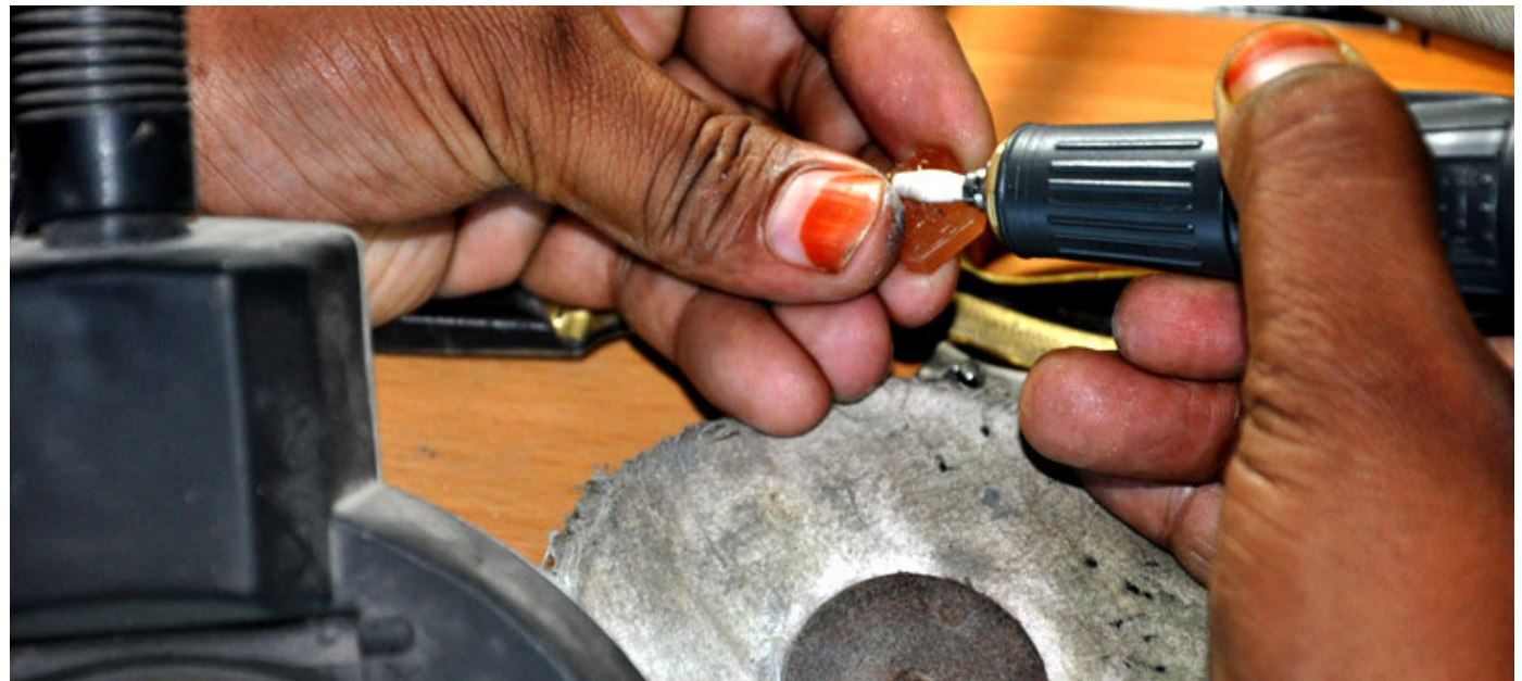
Creating the script on stone using automated drilling tool.

The stone pieces are smoothened using different buffs.