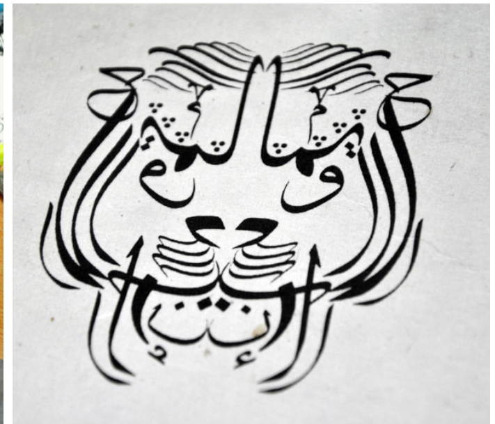
An artist at work and he uses few tools for the purpose. Arabic script illustrating tiger's face.