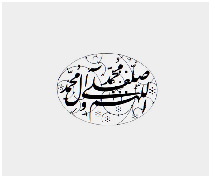
Script used as reference to be carved on stone.