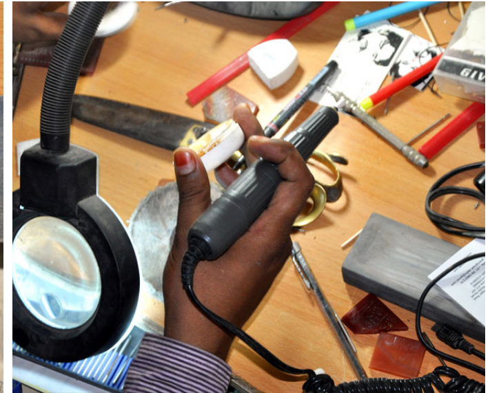
An artist at work and he uses few tools for the purpose. Arabic script illustrating tiger's face.