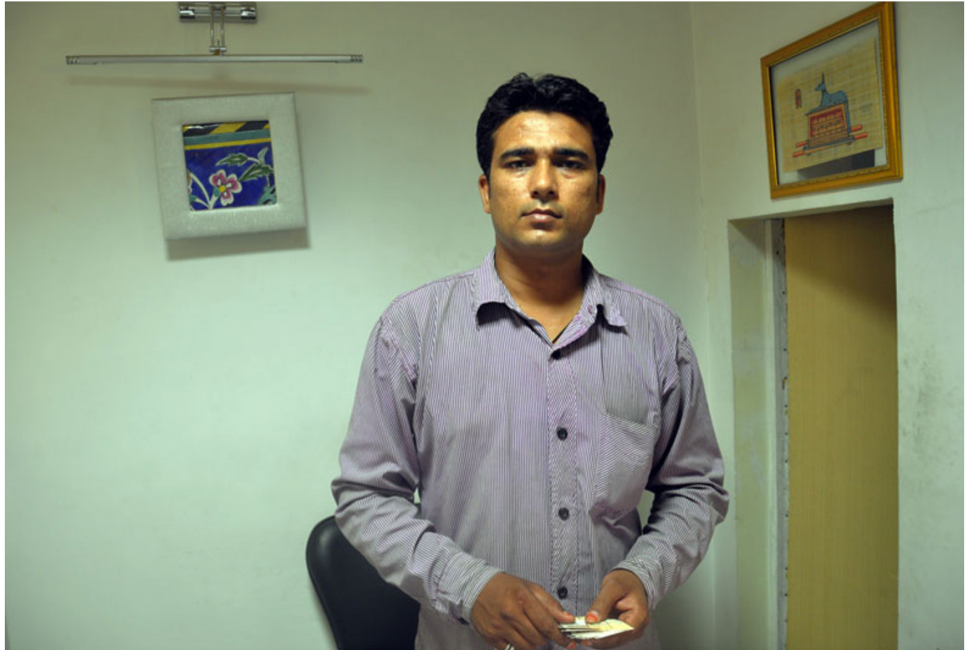
A Calligraphy artist in Quitabat.