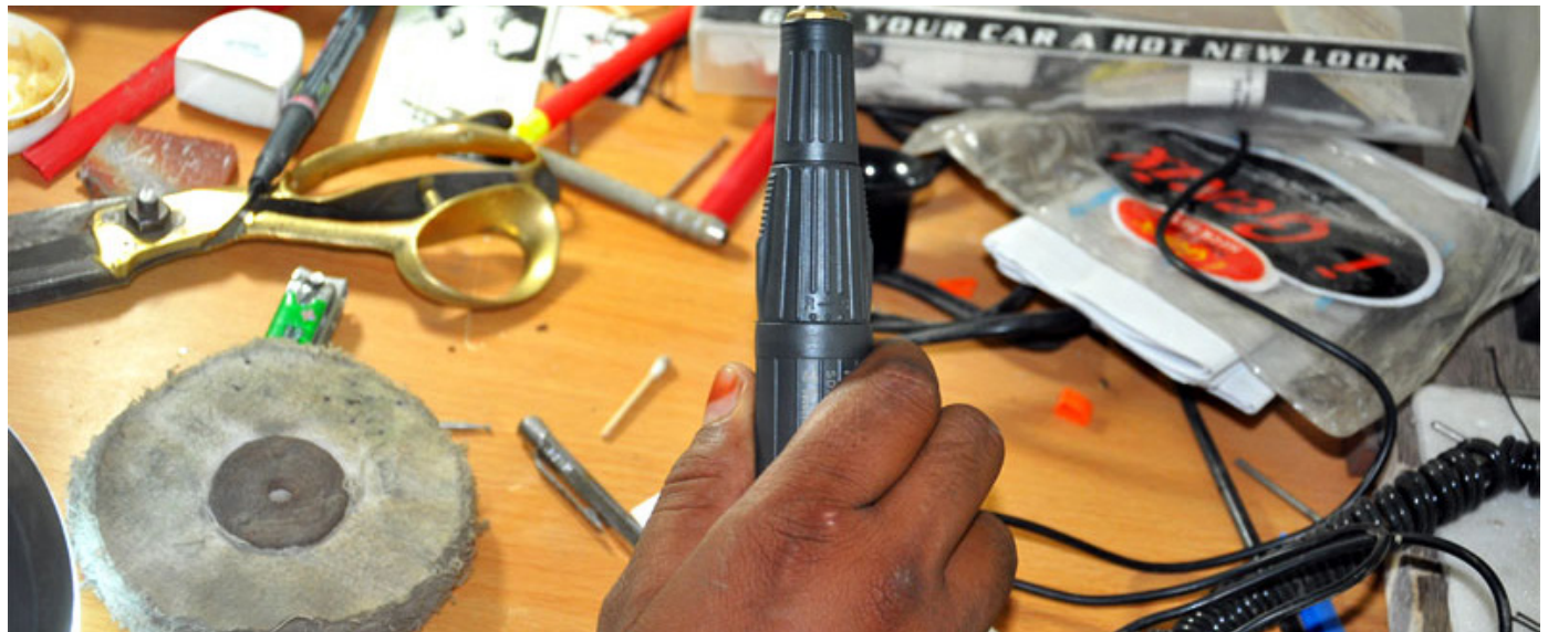
An artist at work and he uses few tools for the purpose.