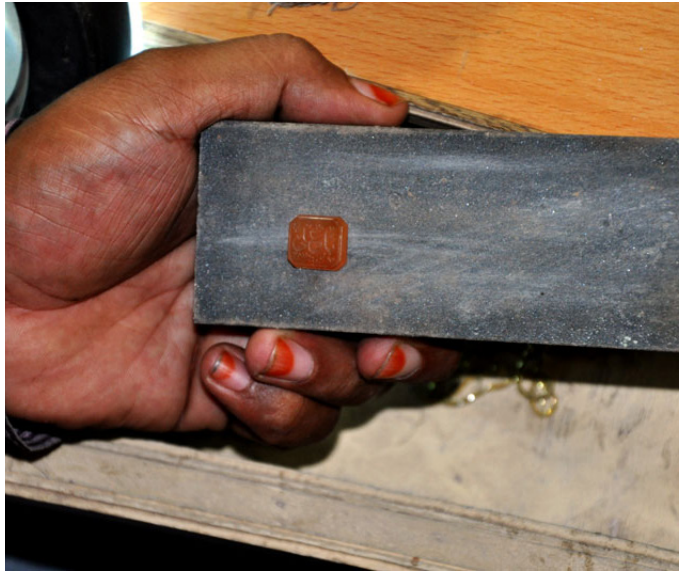
The precious stone is smoothened finally.