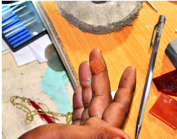
Semi-precious stone with verses written on it.

Quitabat was mainly used to ornament the building during the earlier times. It was also done on jewellerys like rings, pendants, and armlets. Since it was believed that the art had the power to repel bad vibes therefore it was also engraved on weapons like swords, daggers, handles etc. Artists also made monograms and seals using Quitabat. To save people (kings, warriors and kids) from bad luck, verses were written on small papers and packed in worn ornament like pendent. These were called as Taveez