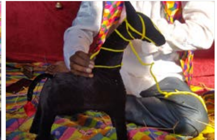
The animal puppet is decorated with contrast colour lace.