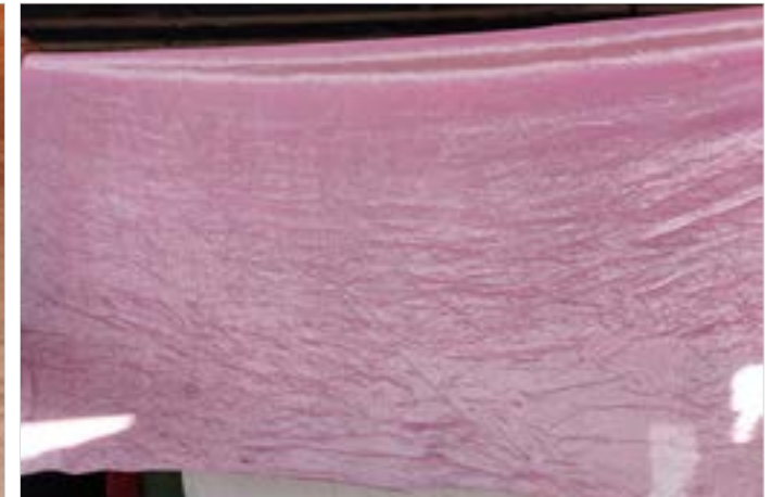
A colourful curtain is used as a background for puppet shows.