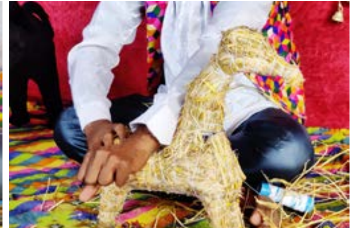
Artist makes sure the firmness of the thread.