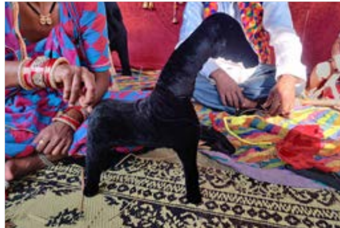
Puppet's body is completely covered with cloth.