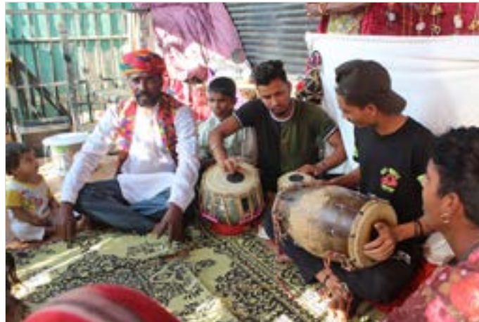
Family members are accompanying during shows.