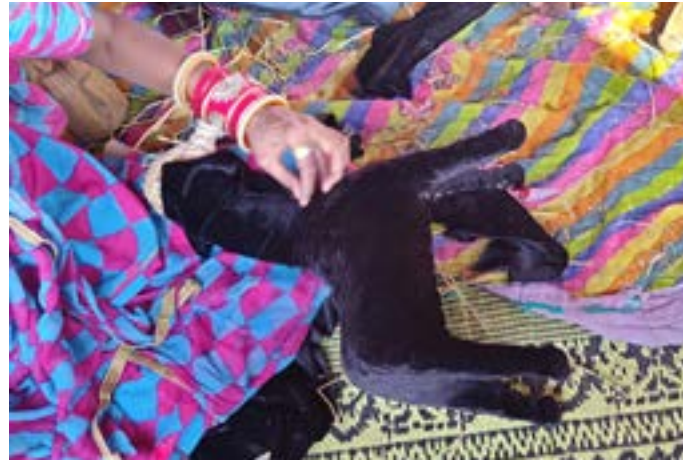
Now comes the neck portion.

https://dsource.in/resource/animal-puppet/making-process