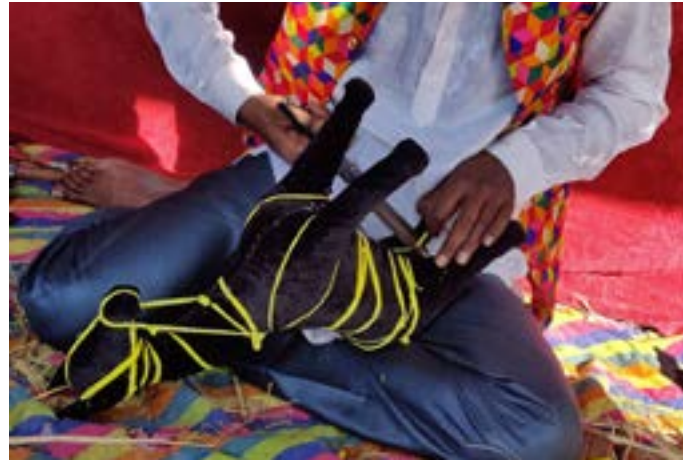
The required lace is wrapped around, and extras are cut.

https://dsource.in/resource/animal-puppet/making-process