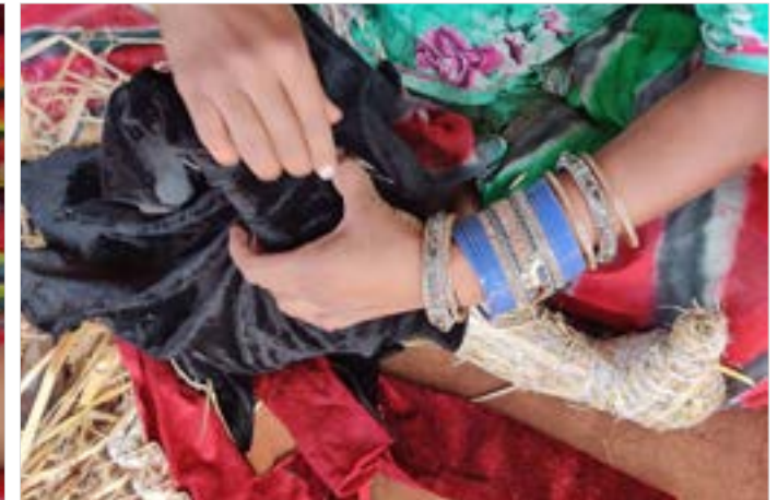
Initially, the legs are covered with cloth.