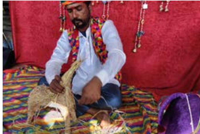
The husk is tied using thread.

https://dsource.in/resource/animal-puppet/making-process