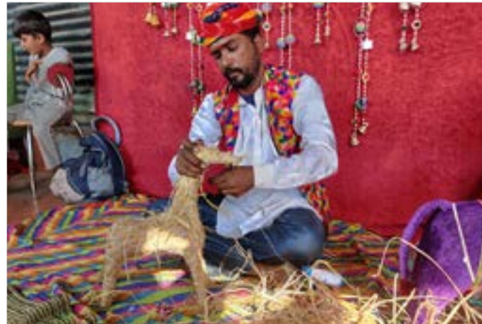
The thread is tied around the mouth.