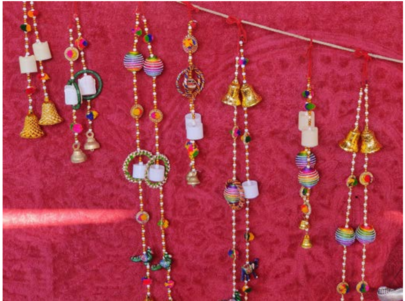
Women artists also make Latkans and Diyas.