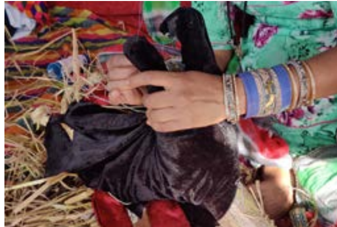
Proper stitching is done using thread.

https://dsource.in/resource/animal-puppet/making-process