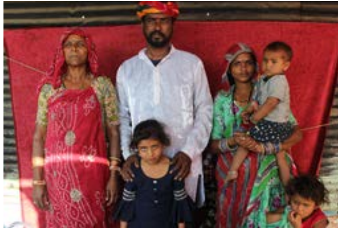
Artist with his wife, mother and daughters.