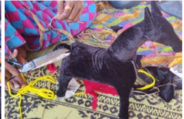
Artist is cutting the extra thread.