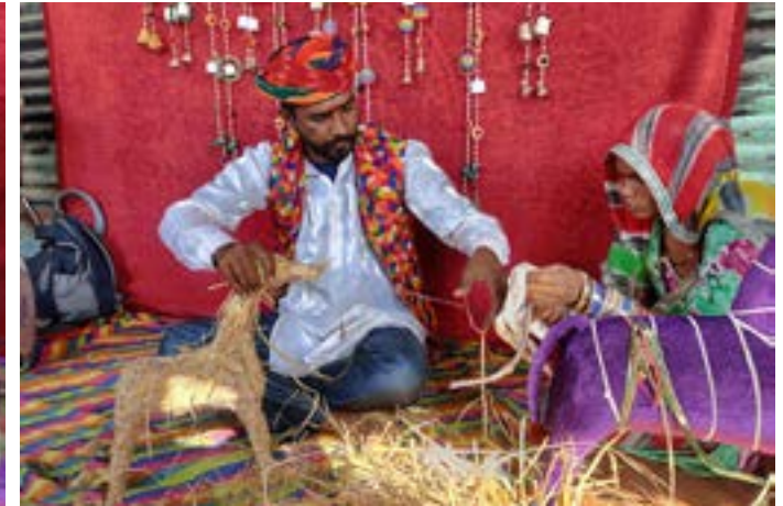
Animal's mouth is formed using a husk.