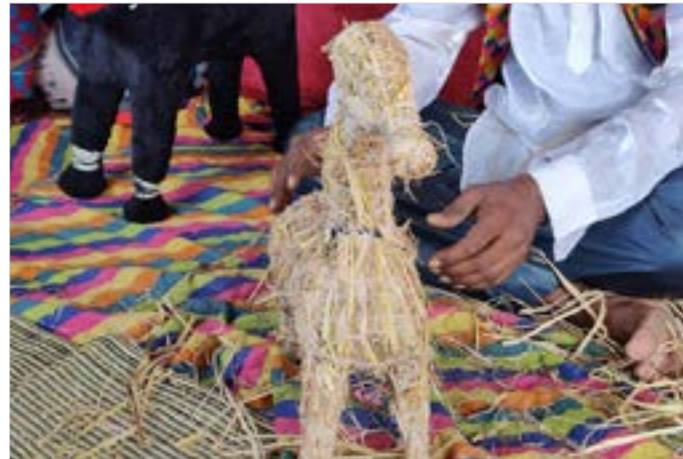
Basic structure front view.