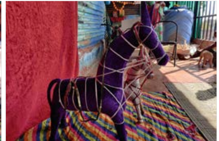
Skillfully decorated horse.