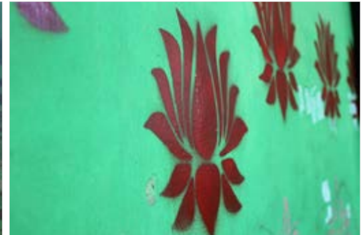
Wall painting by artist Gopal.