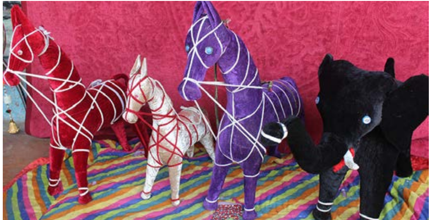
Different types of animals like horses, elephants, etc., are made.

Nowadays, the demand for puppet shows has been declining. Therefore, it's very difficult for artists to survive only on puppet shows. They started a new profession of Dhol performers. They formed a group called 'Nachda Punjab' entertainment group for events. They perform at weddings, ring ceremonies, small events, and birthday parties. Their performance includes Punjabi Dhol, Bhangra Group, Punjabi Boliya Tappe, Punjabi Giddha, and D.J. Mixing LED Dhol. Their group has all Rajasthani cultural programs, including Kacchi Ghodi, Mehendi, sangeet, along with singers and performers.