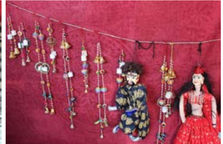
Handmade products made by artist's family members.