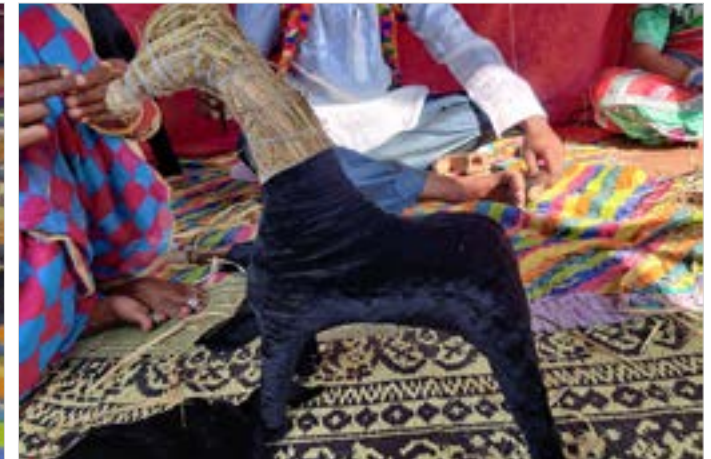
Animal's body partially covered with cloth.