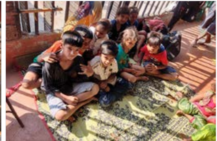
Kids posing for a photoshoot.