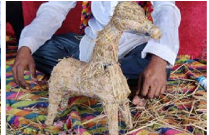
Side view of the body.