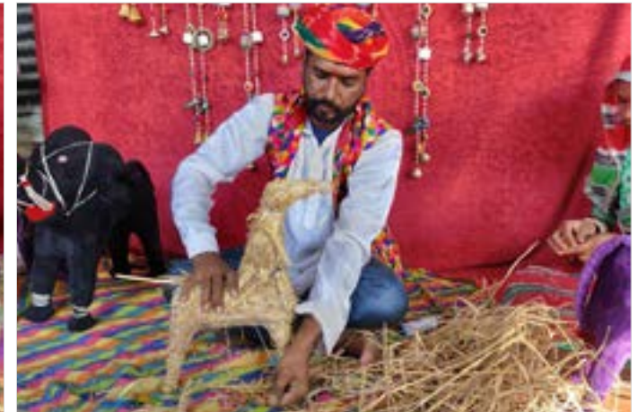
Whole-body is tied using thread.