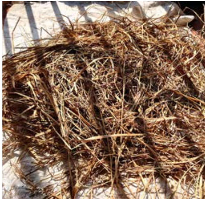
The idols are painted with bright colors to enrich the look.