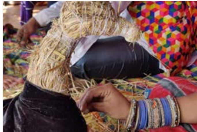
Thread and needle are used to stitch cloth.