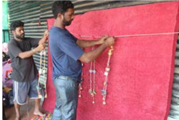
Artist displaying his products.

https://dsource.in/resource/animal-puppet/products