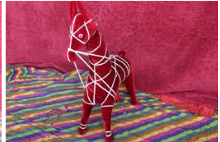
Red colour horse.