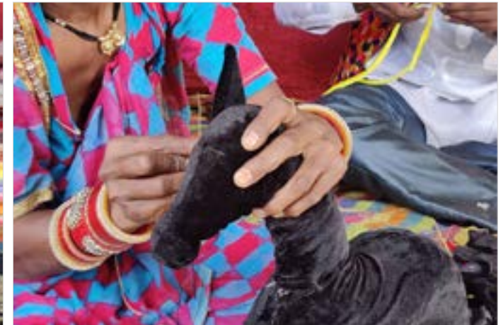
Ears are made separately and attached.