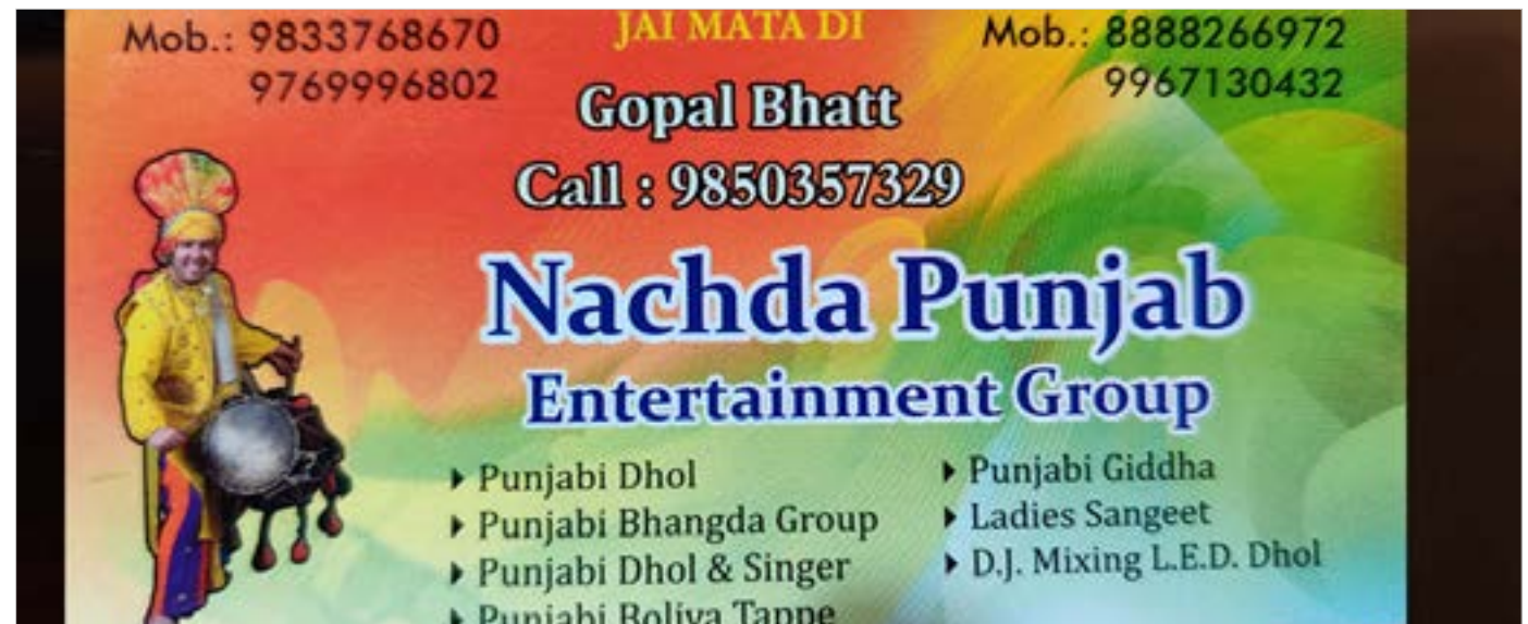
Gopal's visiting card.