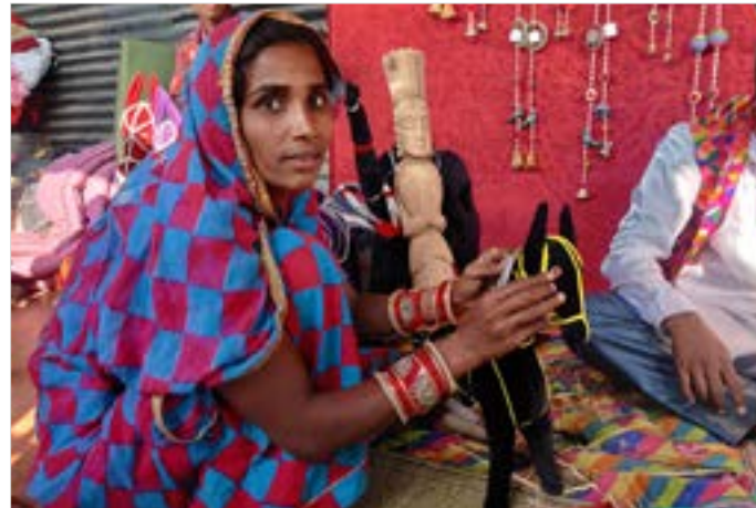
Eyes are also pasted separately using buttons.