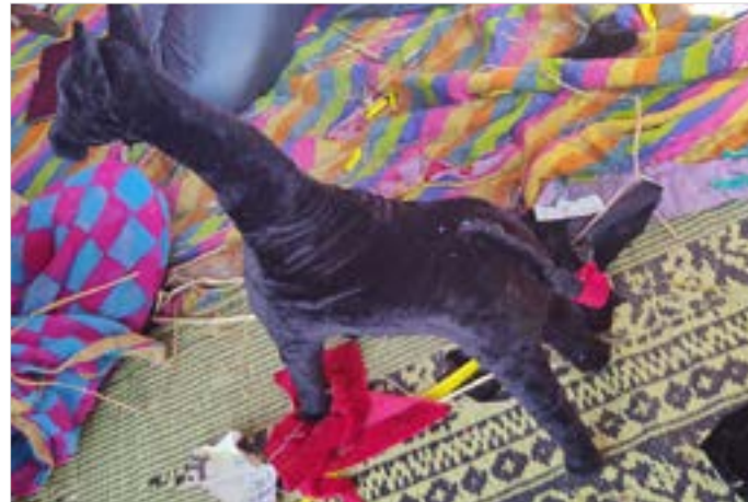
View after the tail is attached.