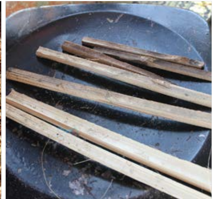
These figures depict the different forms of God Shiva and Goddess Parvathi.