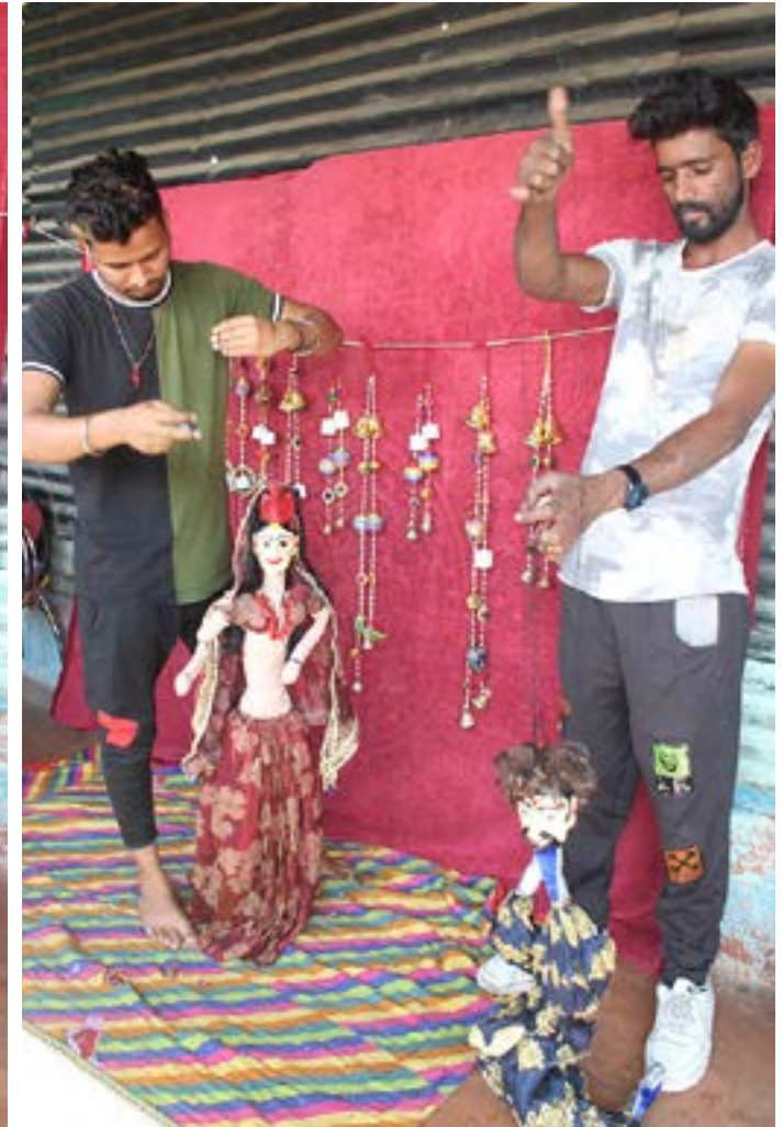
Artists displaying wooden puppets.