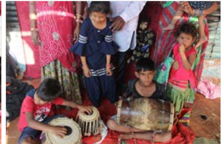
Children learn music from their elders.