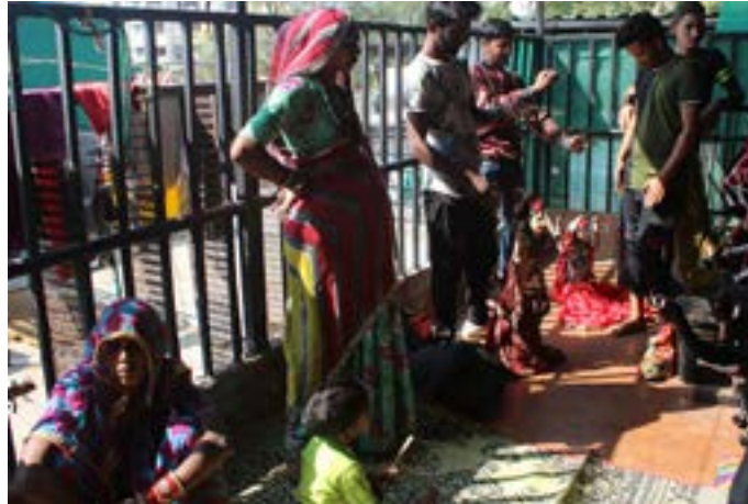
A glimpse of family members.