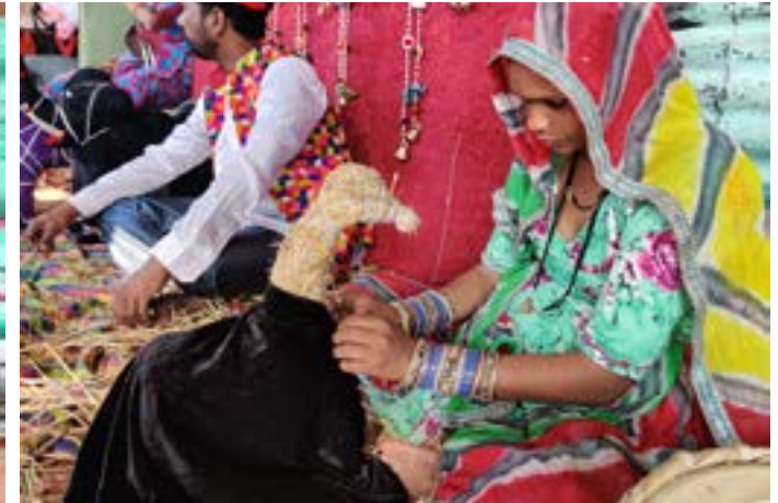
The woman artist measures the cloth before stitching.