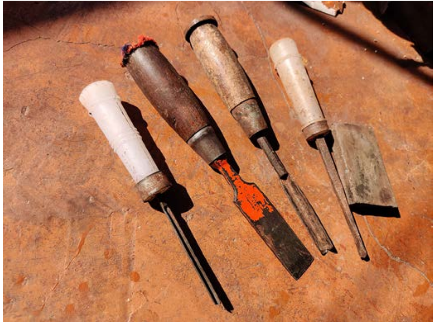
Chisels and customized tools.