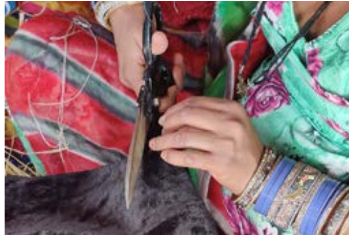
Colourful cloth is cut into the required size.

https://dsource.in/resource/animal-puppet/making-process