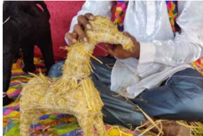
Tying the thread firmly.

https://dsource.in/resource/animal-puppet/making-process