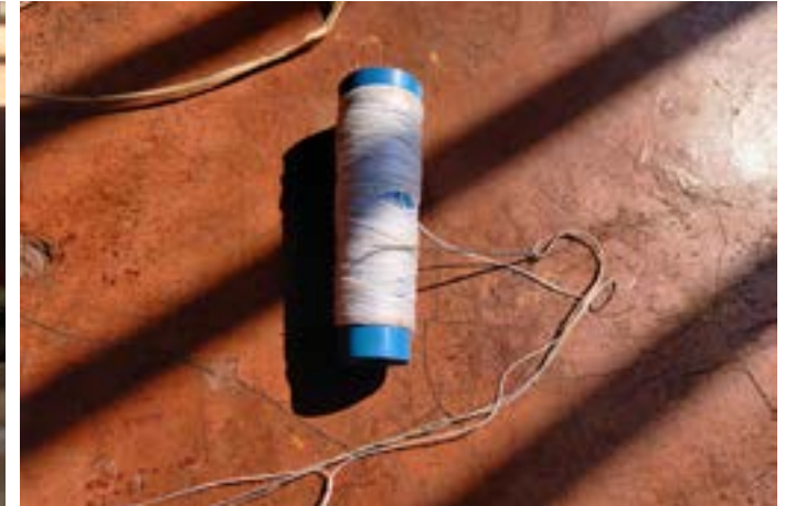
Needle and thread.