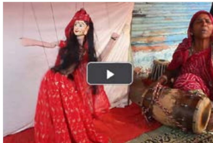
Nandlal Puppet Show