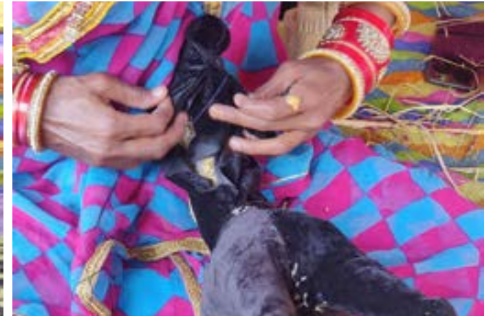
Neck and mouth covered with cloth.