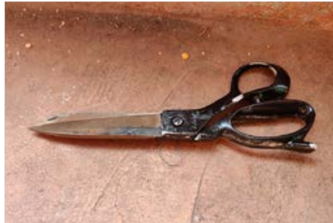
Scissor is used for cutting.