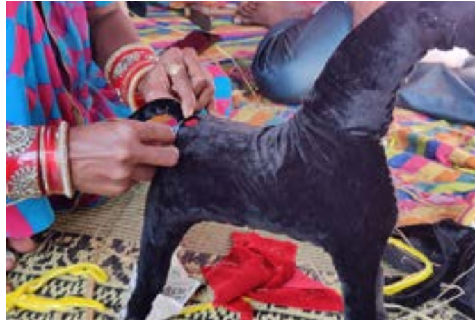
The tail also joined separately.

https://dsource.in/resource/animal-puppet/making-process