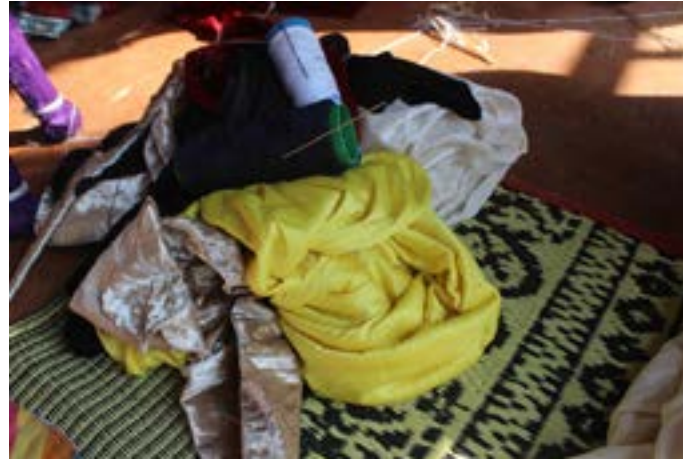
Different colours of clothes are used for making a puppet.

https://dsource.in/resource/animal-puppet/tools-and-raw-materials