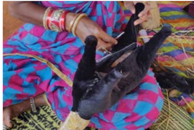
The middle body is also stitched with a cloth.