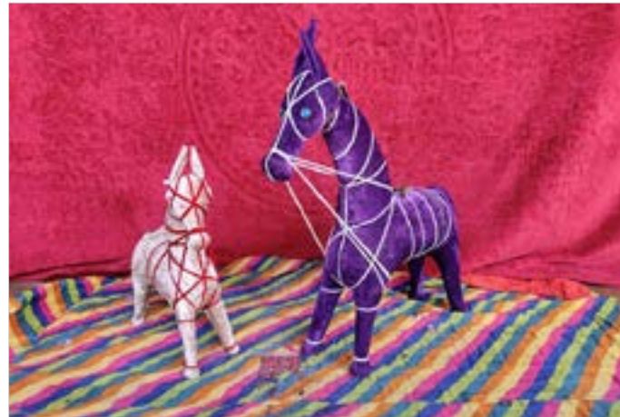
Small and big horse.