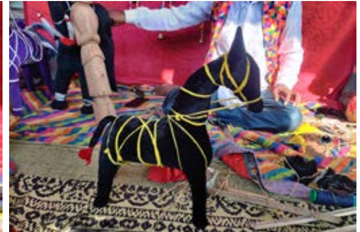
Attractively embellished horse.