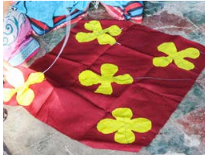
Artisan makes a single random stitch at the initial stage for the grip purpose.