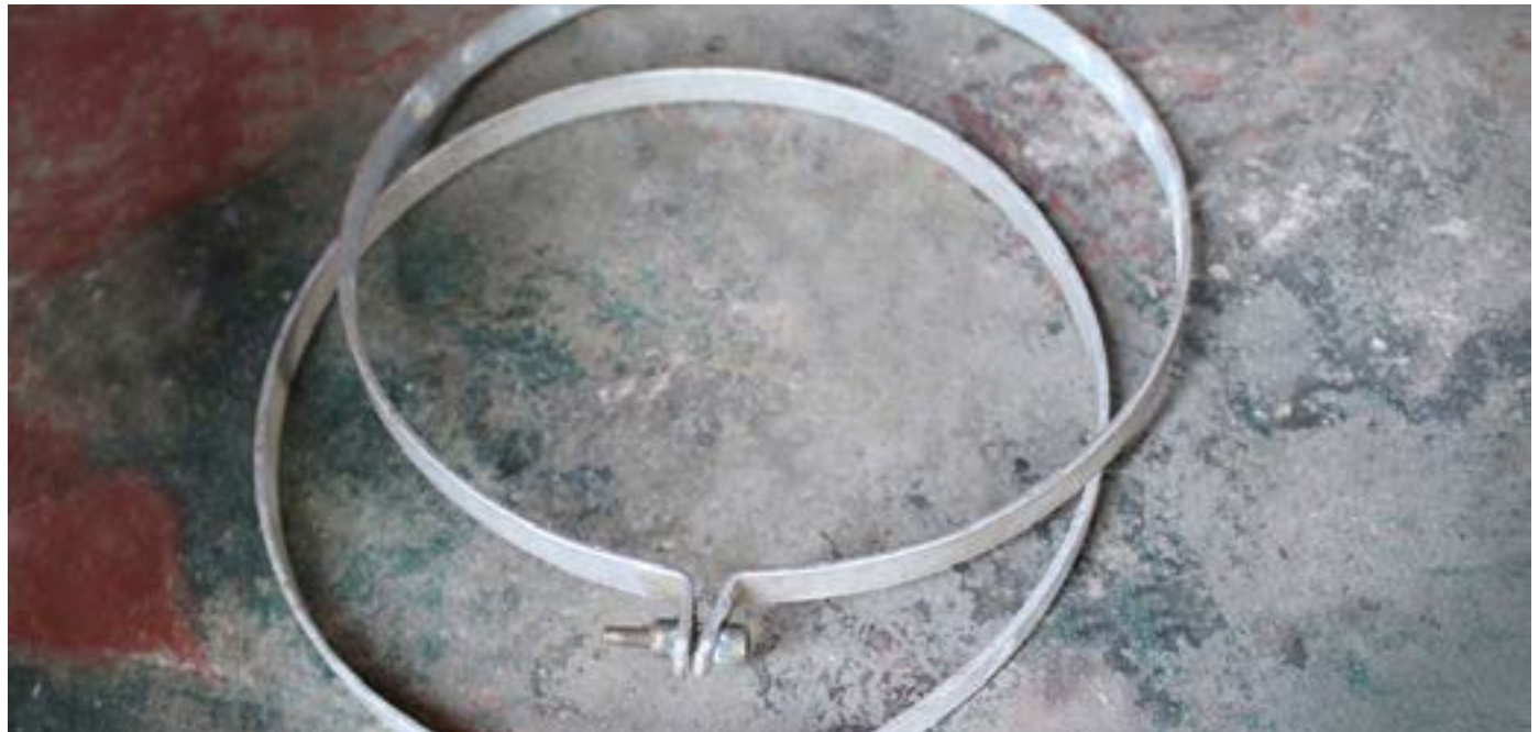
Metal embroidery hoop rings that are used to hold fabric firmly while doing embroidery.