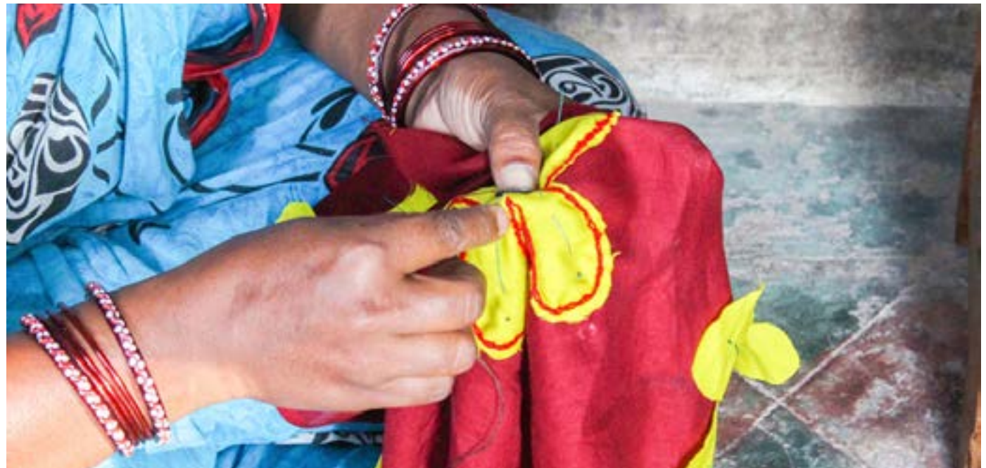
Once the embroidery is done, the metal hoop ring and the random stitch is removed.