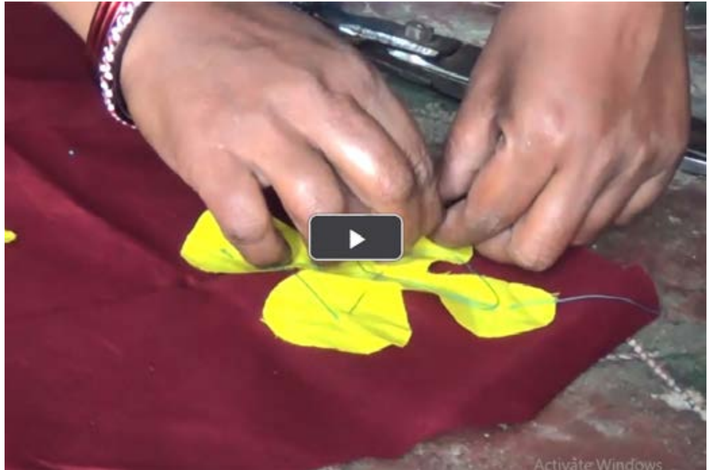
Applique Work - Sonpur, Orissa