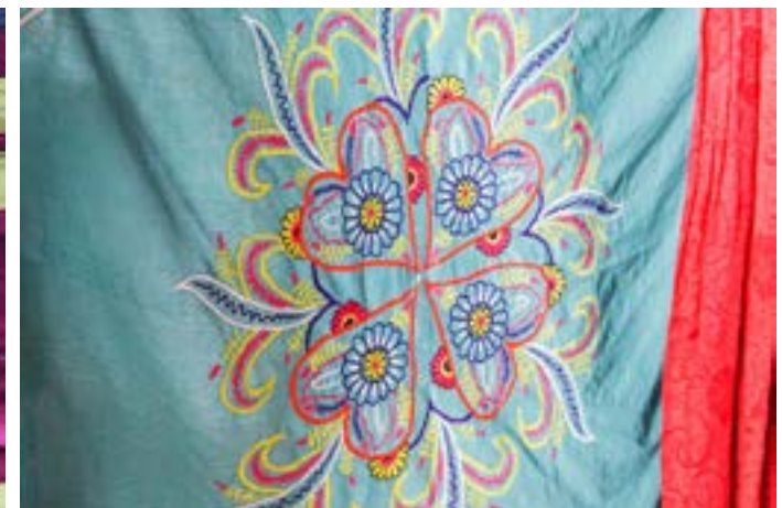
Close-up of the textile on which embroidery work is done to complete the applique work.