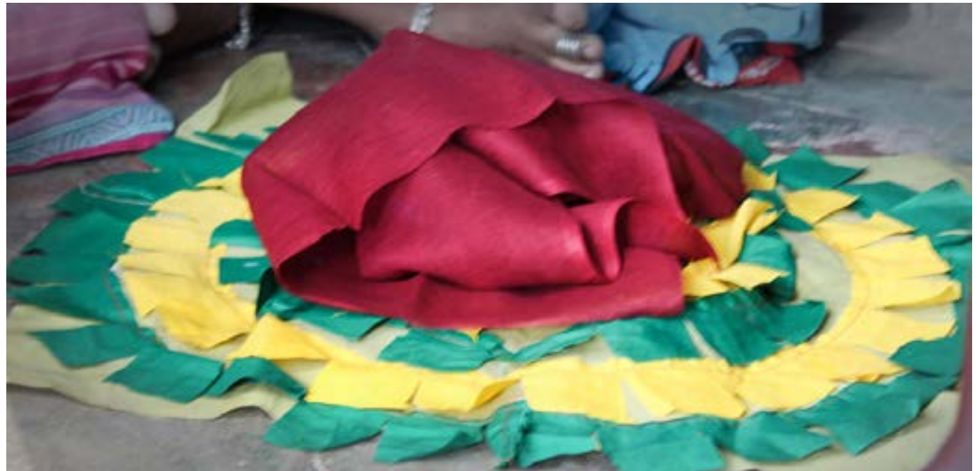
Varieties of fabric used for preparing applique work.