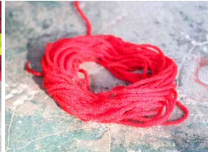
Thread is used for sewing the fabric bits to the base cloth.