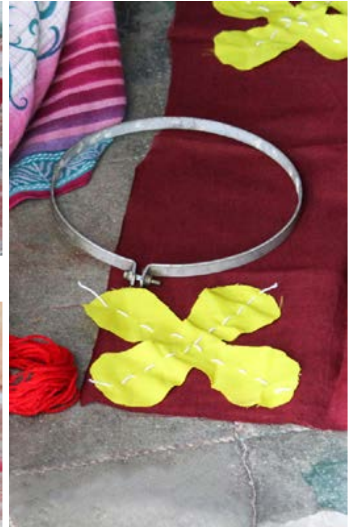
Close-up of the stitched fabric piece.