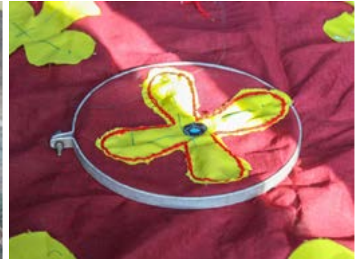
Glimpse of the embroidery made on a specific part of the applique work.