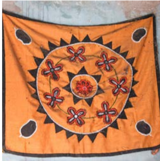
Multicoloured applique work.