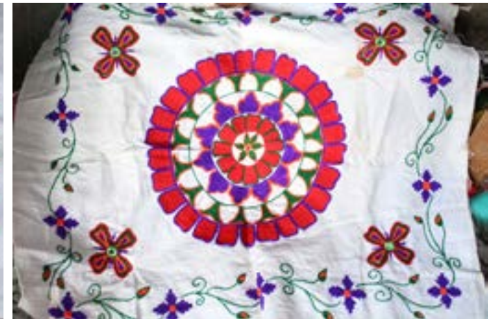
Multicoloured applique work with suitable embroidery.