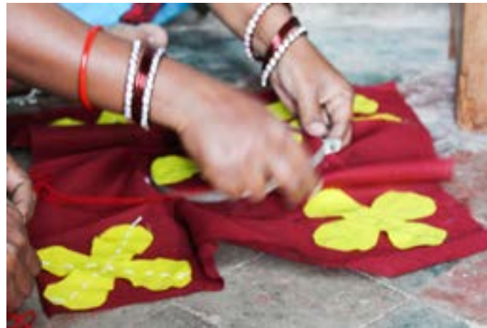
Then the cloth is fixed to the metal embroidery hoop ring.