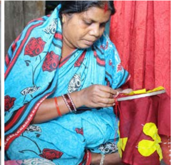
Artisan working on applique work.