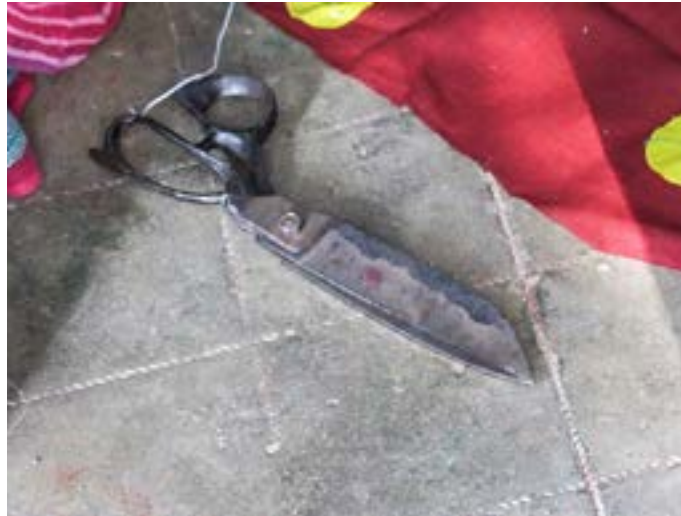
Scissor is used for cutting the fabric.

https://dsource.in/resource/applique-work-sonpur-orissa/tools-and-raw-materials