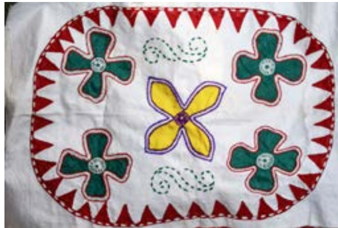
Floral designed wall hanging made of applique work.