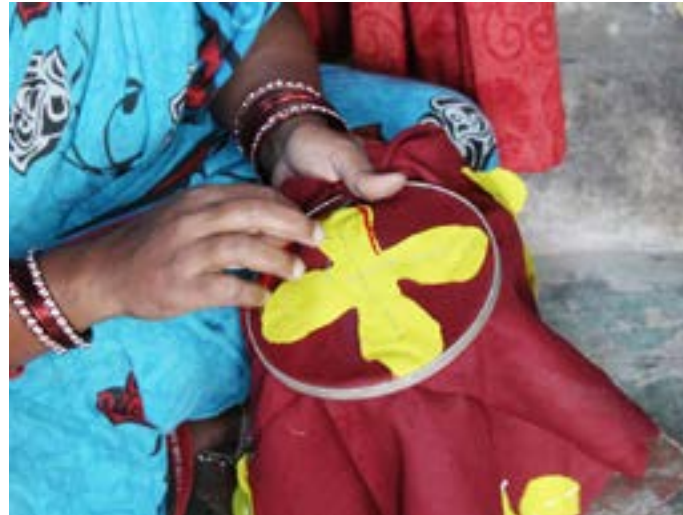
The artisan further initiates to make embroidery.

https://dsource.in/resource/applique-work-sonpur-orissa/making-process