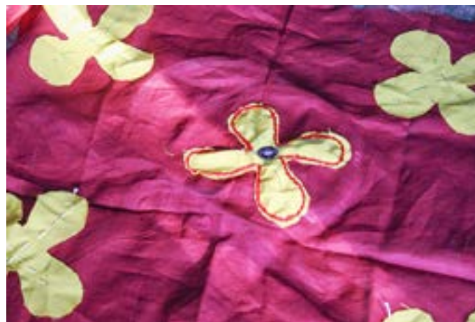
Floral designed applique work.