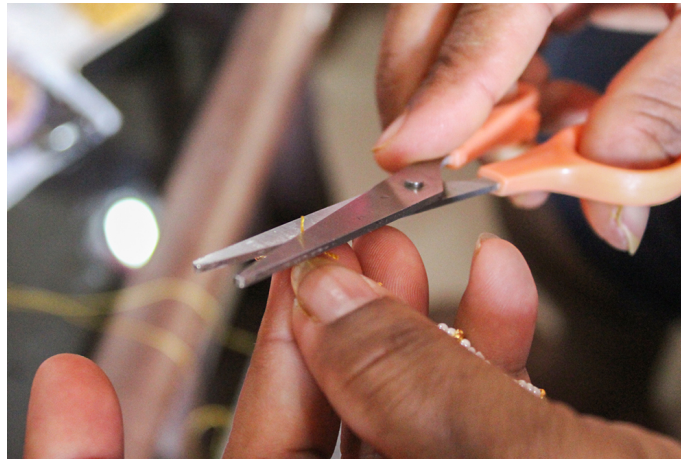
A scissor is used to cut the thread to the required size.