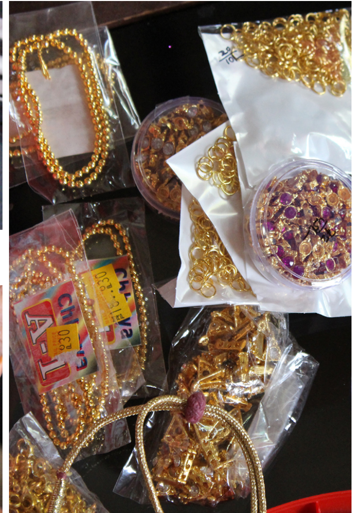
Gems are used to decorate, and hooks are used to attach the bracelet.