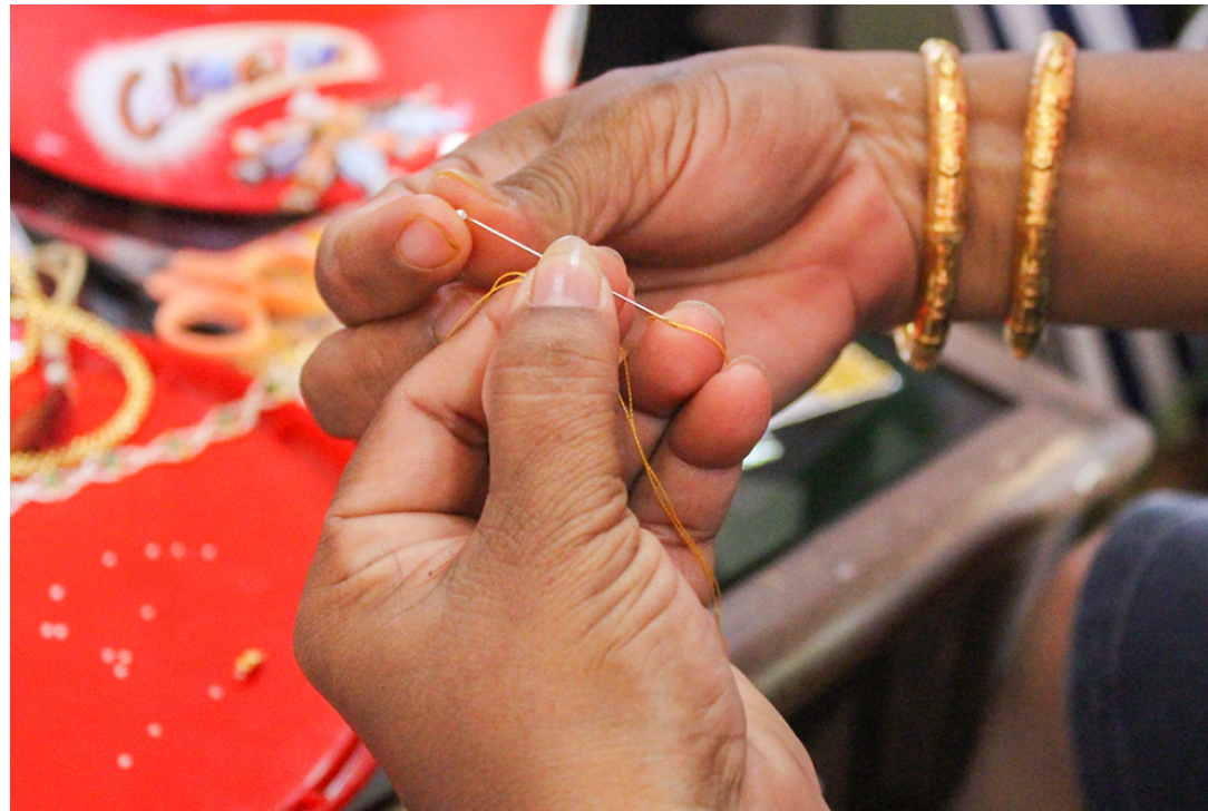
Pearls are inserted into the nylon thread.

Artisan Mrs. Violanta D'souza from Goa makes the two-strand bracelet using crisscrosses. Initially, seed beads are bought. The required length of thread for the bracelet is taken. Thread is inserted in the needle, and double strands of thread are taken for each side using a different needle. On one end of the bracelet, both side strands are tied together to the clasp. Later one by one, approximately ten beads are inserted through the needle on the left side of the bracelet (thread). Likewise, the other (right) side of the bracelet (thread) also follows the same pattern. When the strand set is ready, these strands are got together, and the beads are inserted in a crisscrossing manner. Thus, forming a pattern of a small circle. Further, the same pattern is carried throughout repeatedly. At the end of the bracelet is the hook tied. And in every small circular pattern that is formed in the bracelet is decorated with the artificial diamond by sticking them in-between the two strands of the bracelet or sometimes even they (diamonds) are tied to both the strands together. Thus, the bracelet making process gets completed, and the beaded bracelet is kept ready for sale.