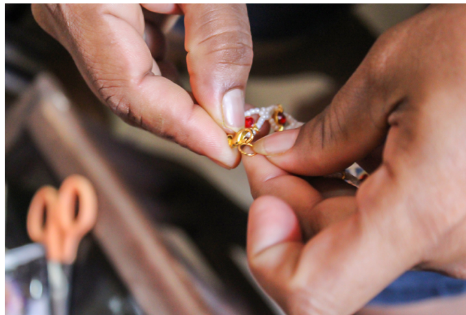
A ring is placed at the other end to lock the bracelet.