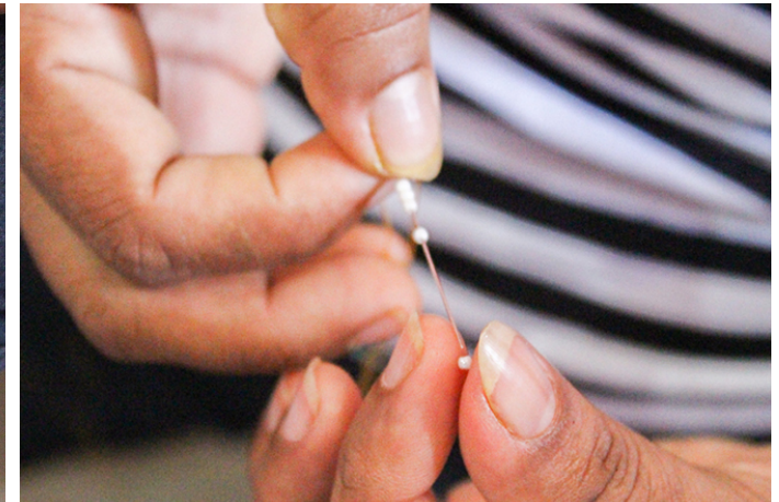
Few more pearls are inserted.