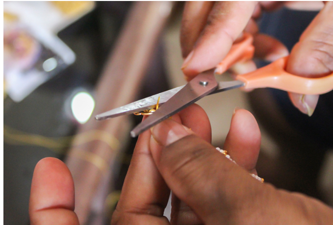
The excess thread is trimmed.