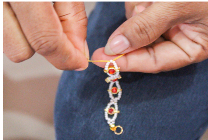
The threads are tied together to keep the pearls in place.