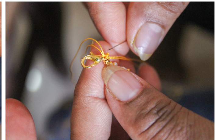
A hook is tied at the end of the bracelet.