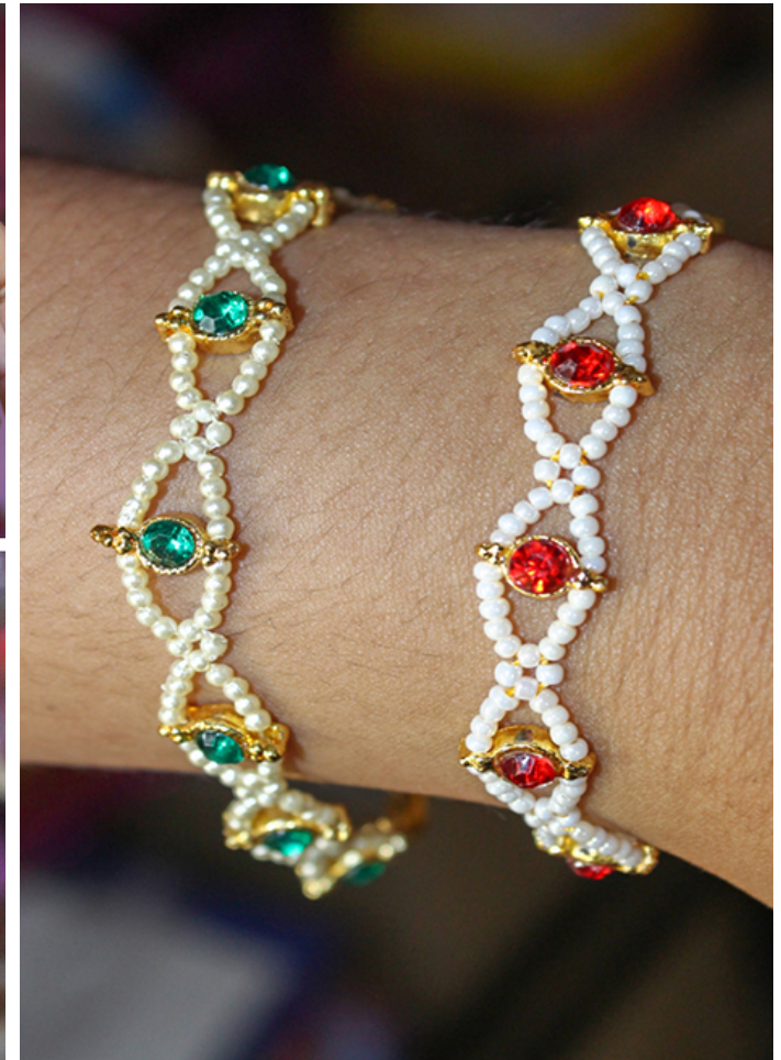
Beautifully made pearl bracelet.