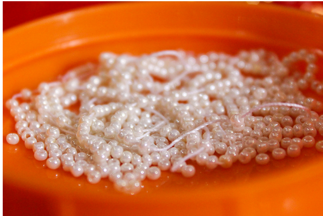
Pearls are the primary raw material for bracelet making.