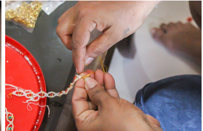
A small piece is placed at the end of the design.