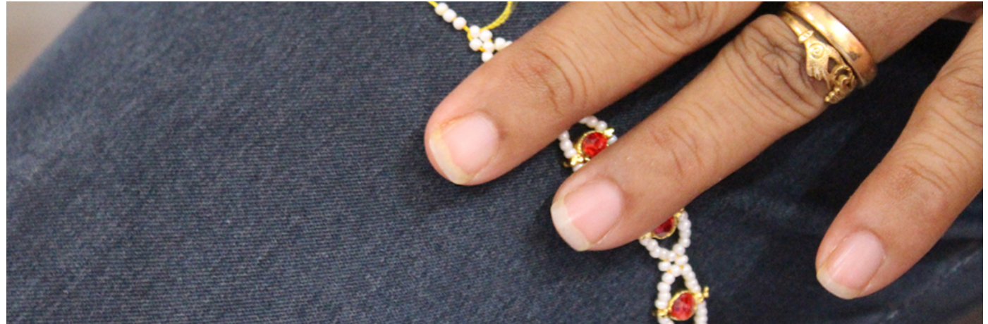
The pearls are inserted in the required quantity according to the design.

https://dsource.in/resource/bracelet-making-goa/making-process