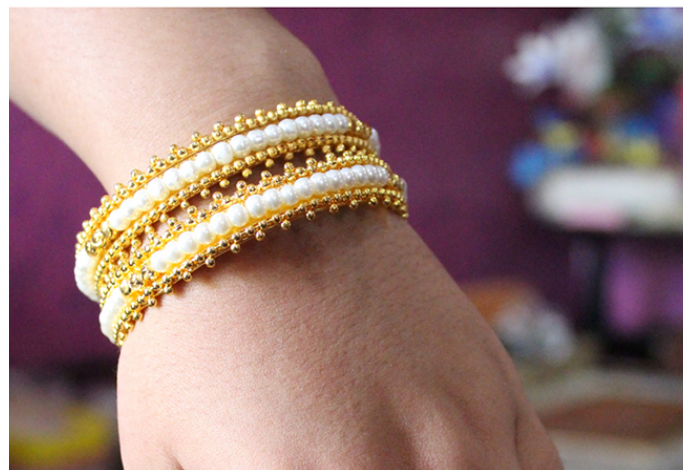
Beautifully made bangles with golden colour pearls.