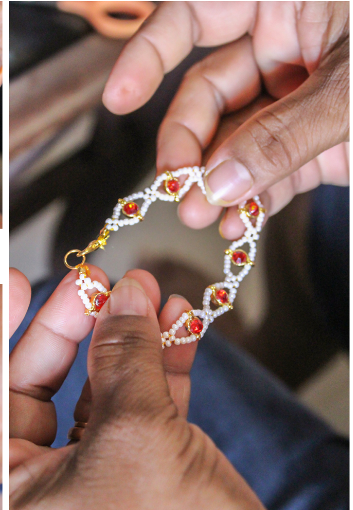
Beautifully made bracelet.