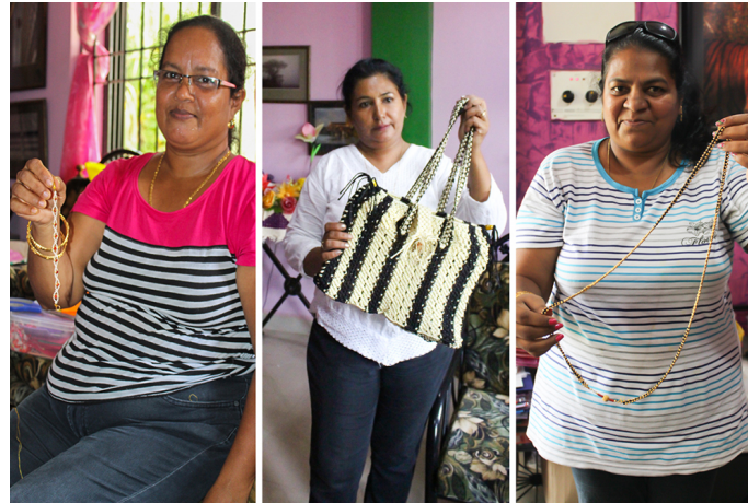
Artisans are showcasing their handcraft products.

https://dsource.in/resource/bracelet-making-goa/introduction