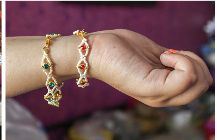
Beautifully hand-made bracelet with attractive gems in-between.