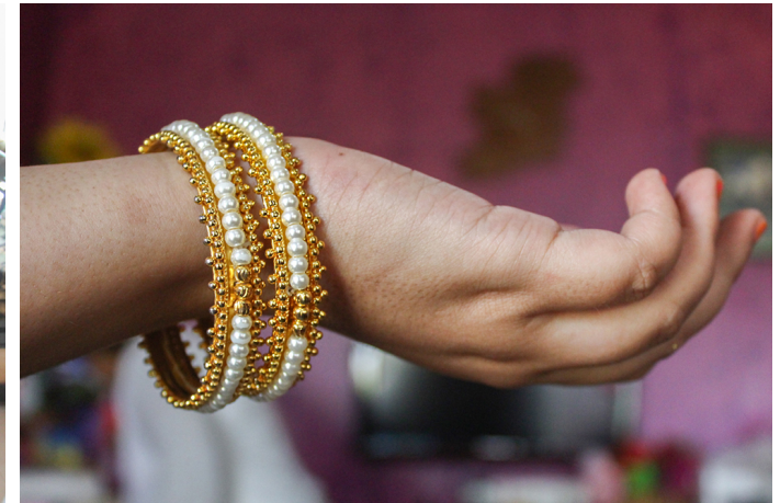
Attractive bangle made with pearls placed on it.