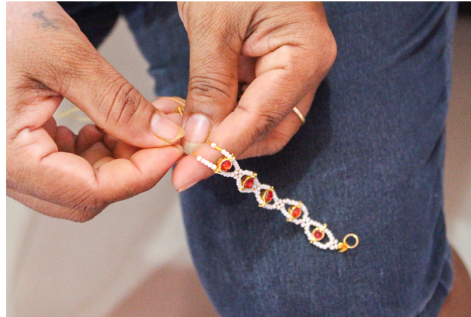
The pearls are arranged according to the design.

https://dsource.in/resource/bracelet-making-goa/making-process