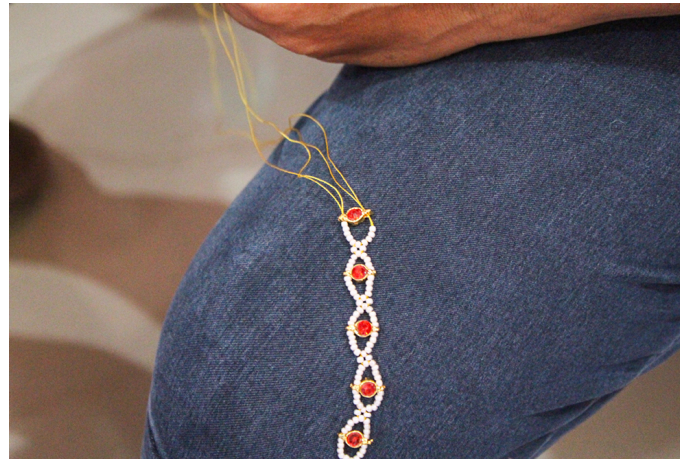
Gems are inserted in-between to make it attractive.