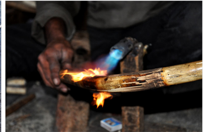
Kerosene lamp used for heating the thicker cane.