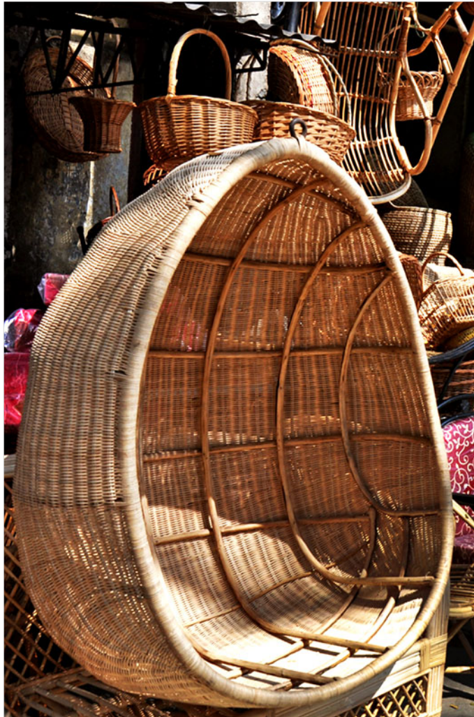
Cane furniture displayed for sale.