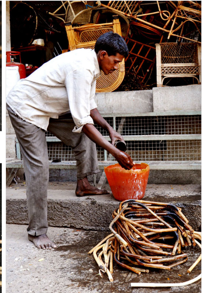
Water is frequently sprinkled to retain the moisture.