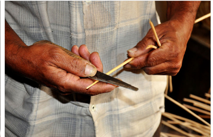
The edge part of thin cane is being sharpened slightly.