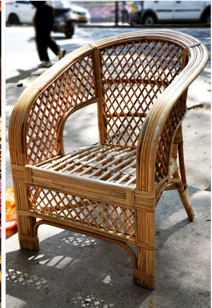
Chair made of thick cane.