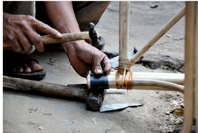
Rubber strips are tightly tied to enhance the outer look and also to strengthen the lower/ base structure