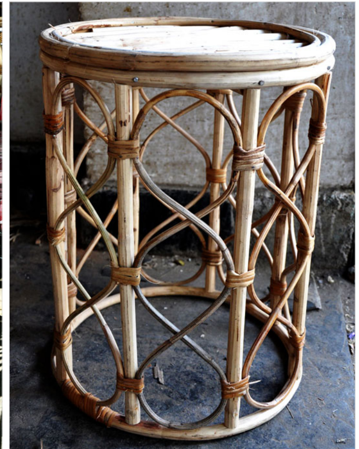
Stool made of cane.