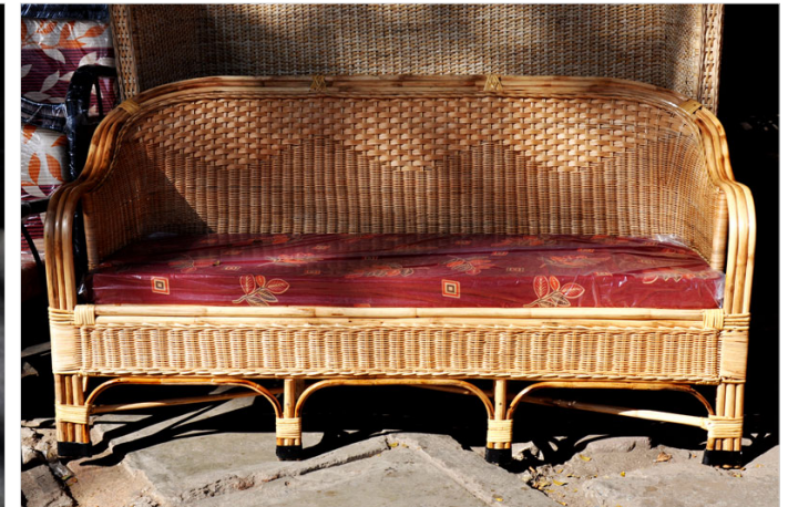
Sofa with different internal weaving pattern.