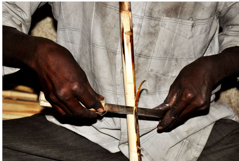
Artisan smoothening the outer surface of cane- peeling off the outer skin.

Cane is first soaked in water until it attains moisture and it is weaved around the frame with thin processed cane. Different motif patterns are created while weaving. After completion of weaving, the end parts are joined with nails. Finally, the furniture is polished using natural polish. Three coats of polish are given to attain fine glossy look of cane furniture.