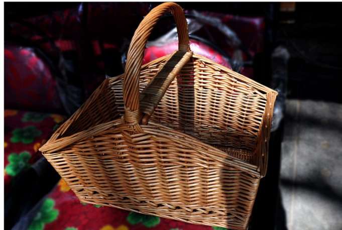
Huge fruit basket with handle in unique style.