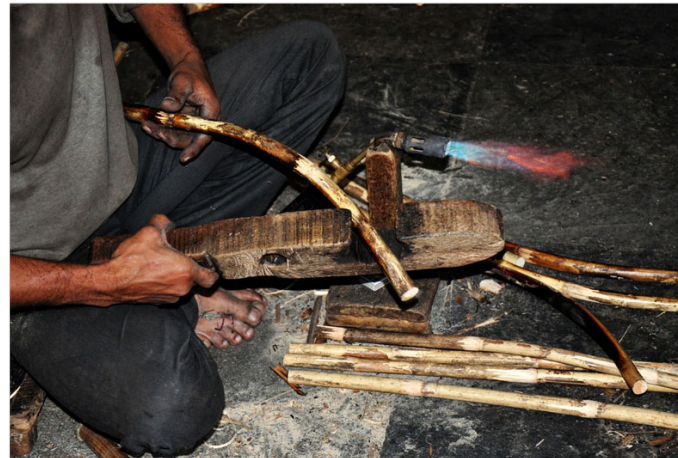
A wooden shaping tool used to bend and shape the heated cane.