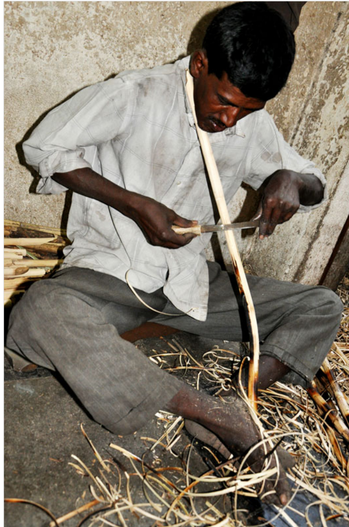
Artisan involved in removing the outer surface (skin) of cane after heating it.