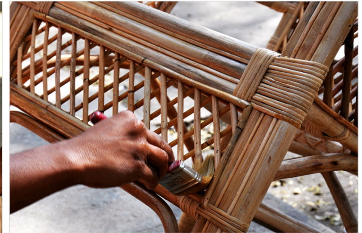
Natural polish is applied for glossy look.