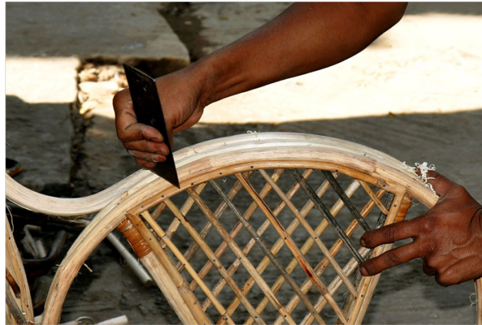
Surface of cane furniture is being smoothed before polishing.

https://dsource.in/resource/cane-furniture-bangalore/making-process