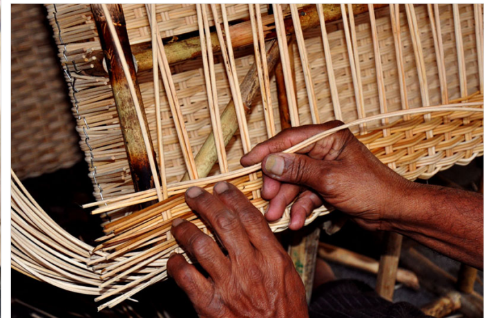
Three-ply cane is being inserted in criss cross manner.