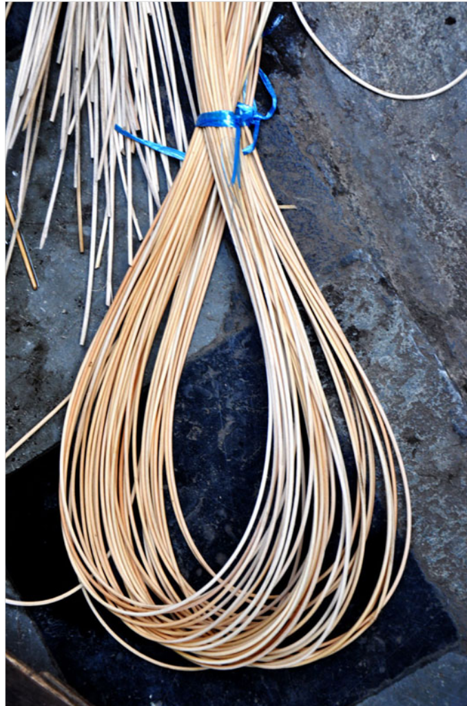
Thin processed cane.