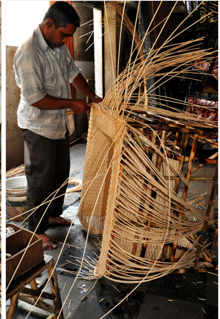
Soft thin cane is flexible for weaving and creating patterns.