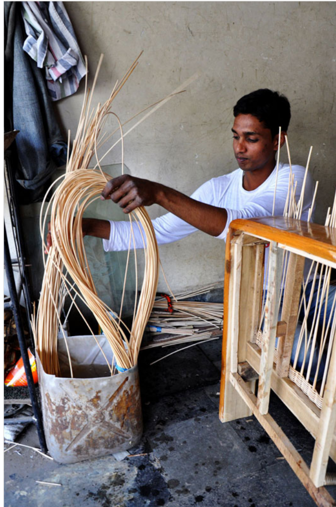
Thin processed cane is soaked in water to start weaving process.