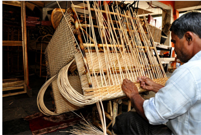
Cane is weaved around furniture frame.

https://dsource.in/resource/cane-furniture-bangalore/making-process