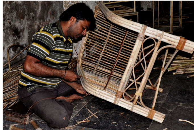
Thin flattened cane is used to bind the cane furniture frame.

https://dsource.in/resource/cane-furniture-bangalore/making-process