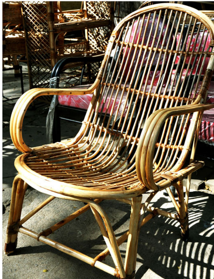
A perfect eco-friendly cane chair.

The ranges of cane products include sofas, chairs, vegetable and fruit containers of different shapes and sizes. Cane containers are available in circular, oval and swan shapes. Roti containers, stools and other creative and trendy products are also available. All these containers are weaved with cane and colored with rose wood (color polish) for good outer look and classy appeal.