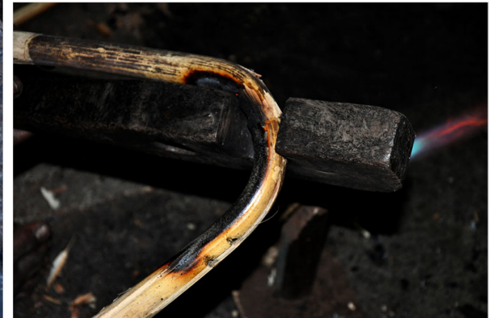
Wooden tool used to bend the thicker cane.