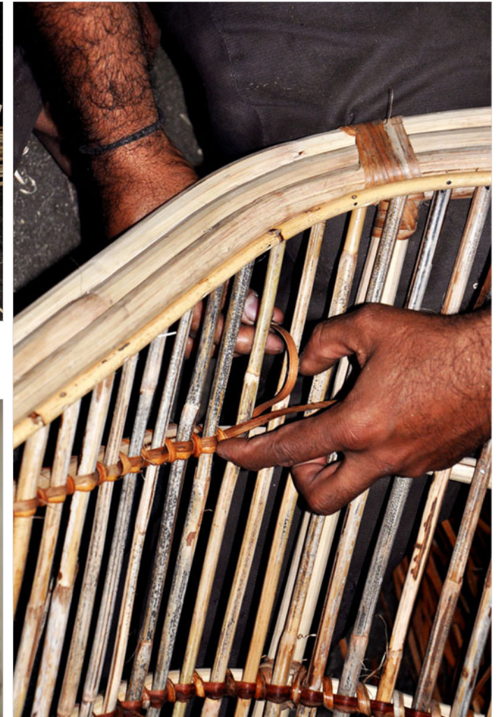
Adding flattened cane to furniture gives better support/ strength to the entire structure.