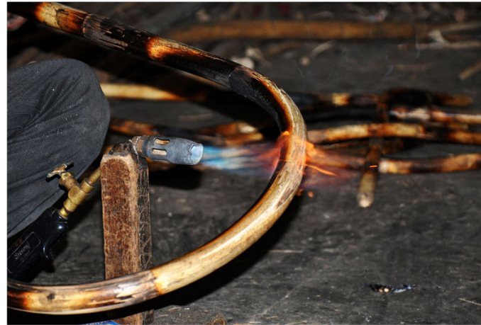
Cane is being bent by heating it with the help of kerosene lamp.

https://dsource.in/resource/cane-furniture-bangalore/making-process