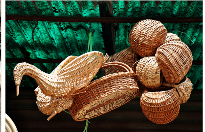
Cane baskets and fruit containers of different shapes.