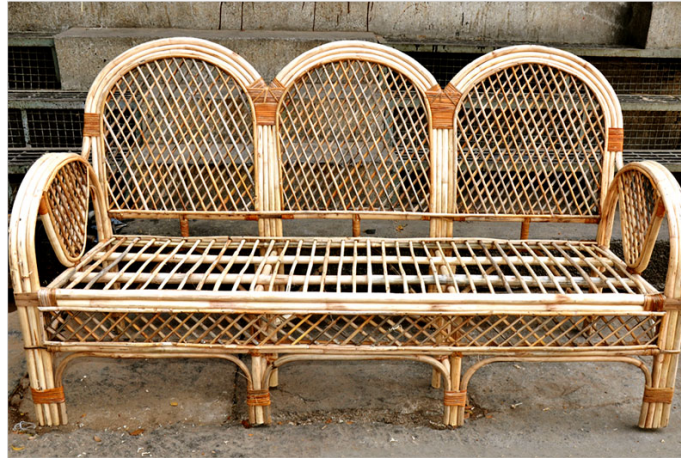
Sofa made of cane with a style of Jaali motif.

https://dsource.in/resource/cane-furniture-bangalore/products