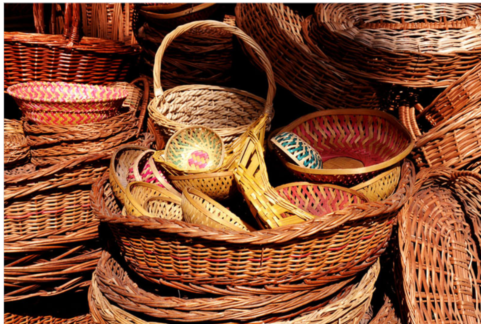
Different types of baskets and trays made of cane.

Malleswaram, Shivaji Nagar, K. R. Market and Jeevan-bheema Nagar in Bangalore are the well noted areas with availability of cane furniture and other cane products. Bangalore being a modern market, cane artisans regularly improve their creative skills to produce new range of cane products in unique patterns to meet the latest trend.