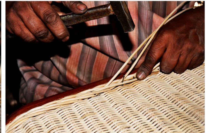
After weaving, the edges/ ends are joined by nailing.