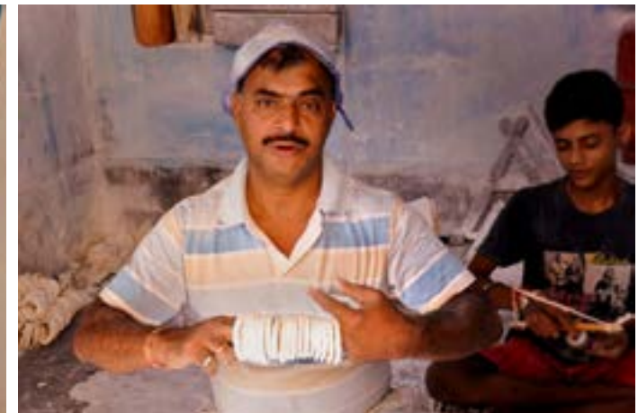
An artisan displaying finished conch bangles.