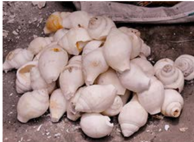
The banded tulip conches.