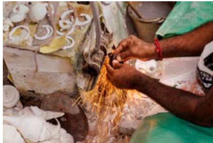
The cutting machine is used to cut the shells into ring shapes.