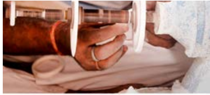
Artisan involved in the conch bangle making process.