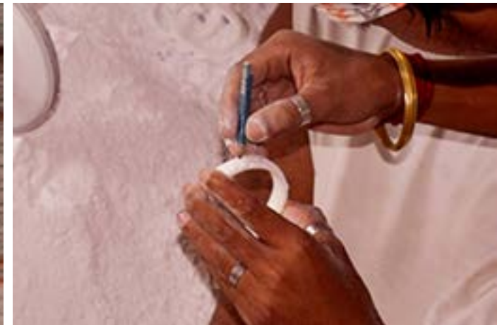
Artisan drawing designs over the bangle surface with a pencil.