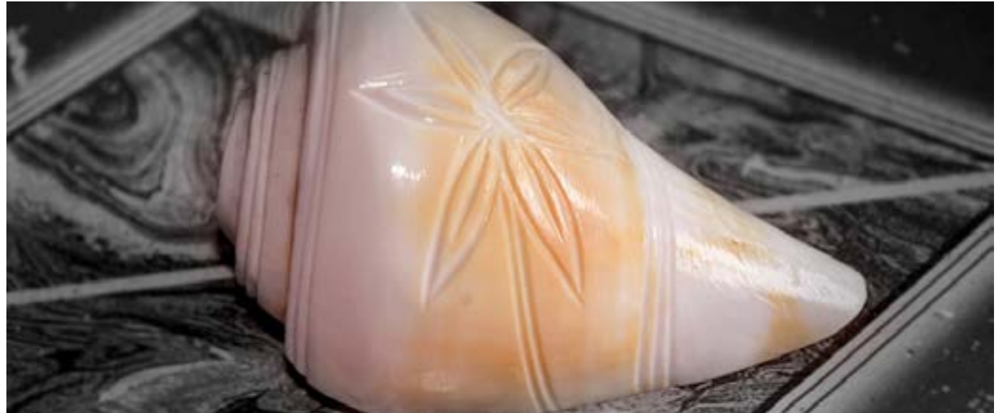
Flower design carved on conch surfaces.

https://dsource.in/resource/conch-shell-bangles-kolkata/products