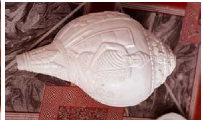
A Sage impression statue and flower designs are carved on the conch surface.