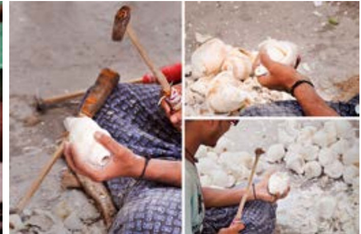
Artisan hitting the conch shells with a hammer to remove the cut parts.