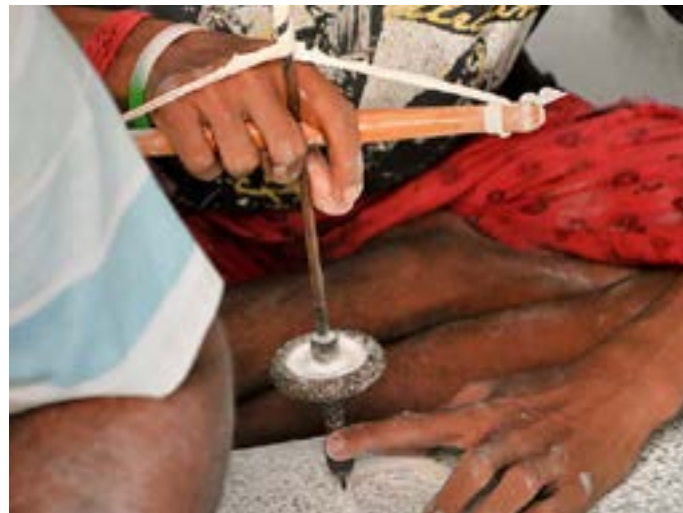
Artisan making carvings on the bangles using a drilling tool.