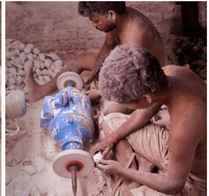
Artisans are involved in the polishing process.