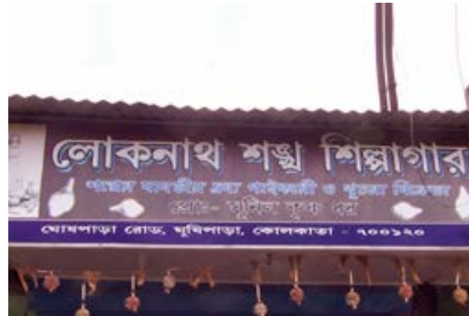
A board with the name of the shop “Lokenath Sankha Shilpagar”, located at Ghushipara Road, Barrackpore, Kolkata.

https://dsource.in/resource/conch-shell-bangles-kolkata/introduction