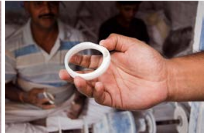
A ring shape made out of conch.