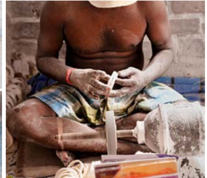
Artisan polishing edges of the bangles with a grinding machine.