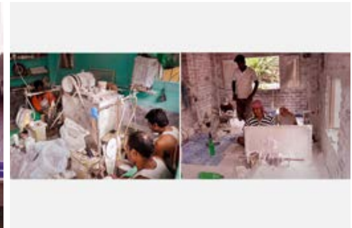
The work area where conch bangles are made.