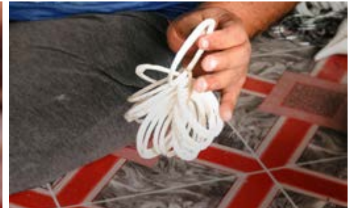
Artisan presenting a beautiful conch bangles bunch.