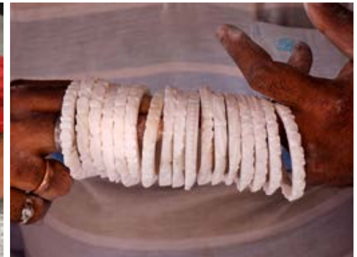
Different varieties of conch bangles on display.