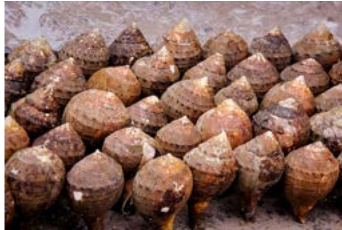
Brown colored Florida fighting conch shells.

https://dsource.in/resource/conch-shell-bangles-kolkata/tools-and-raw-materials