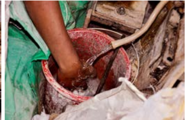
Water and a bucket were used to wash the conch shells.