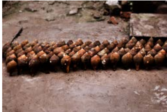
Raw conchs aligned on a floor.

https://dsource.in/resource/conch-shell-bangles-kolkata/introduction