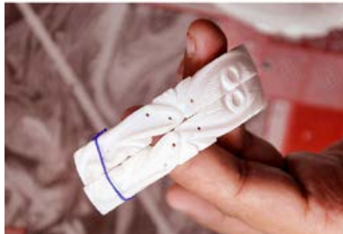
Beautiful conch bangles on display.