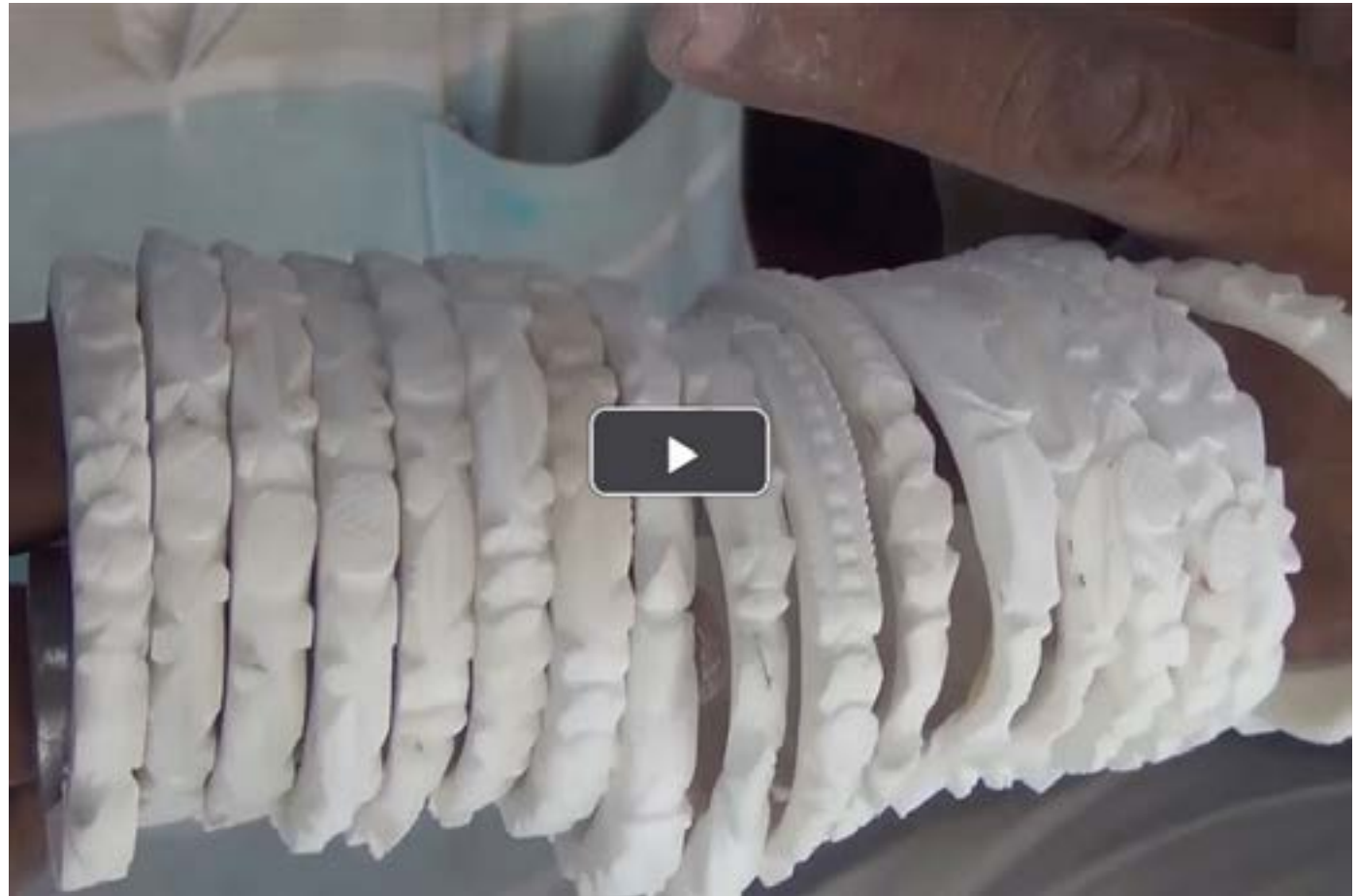
Conch Shell Bangles - Kolkata