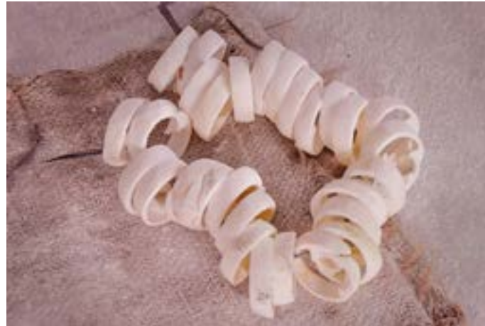
Conch shells cut into a bangle shape.

https://dsource.in/resource/conch-shell-bangles-kolkata/making-process