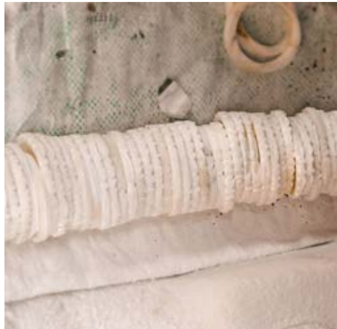
Conch bangles in different forms.