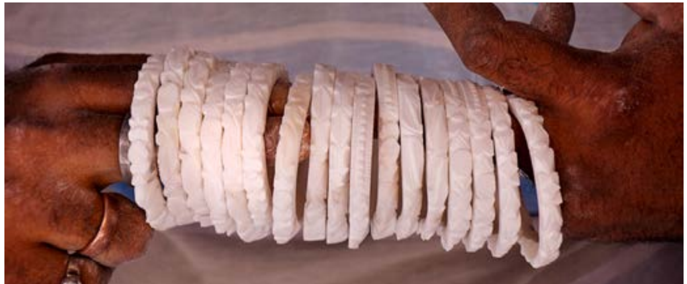
Different types of conch bangles on display.