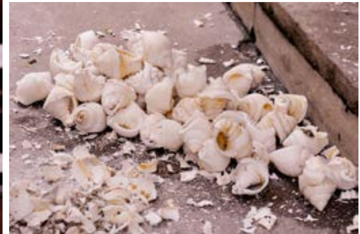
A set of broken conch pieces.