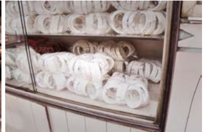
Conch bangles packed to be supplied to retailers.