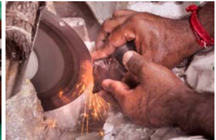
Sharpening stone to sharpen the blades.