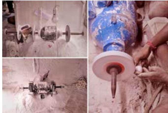
The rubbing machines used in the conch bangle making.

https://dsource.in/resource/conch-shell-bangles-kolkata/tools-and-raw-materials