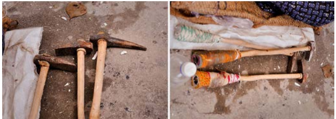
The long hammer used in breaking the conch.