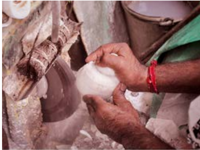
Artisan cutting the conch shells using a mechanical blade.