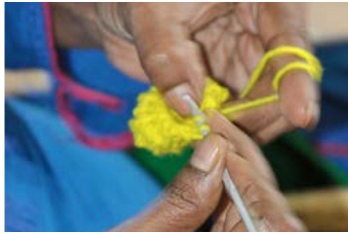
Turning the row by leaving one chain stitch, inserting the hook in the stitch, yarn over, and pulling up the loop.