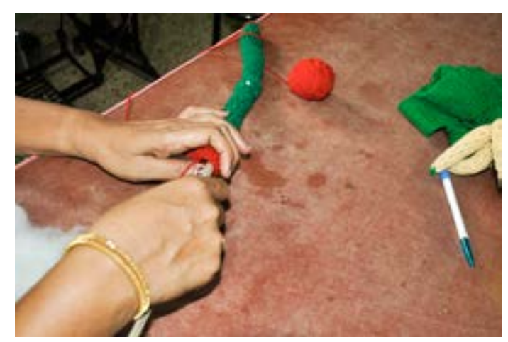
The same process is repeated to stuff the green colour yarn roll.