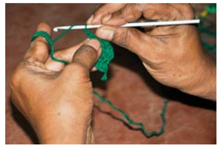
Knitting starts with the crochet needle and woolen thread.