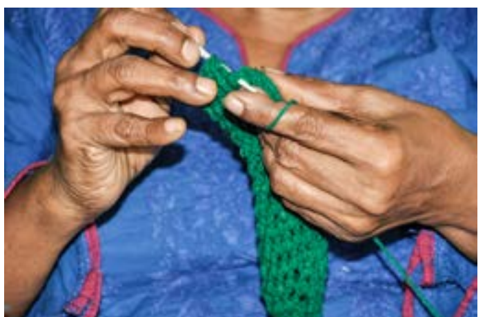
She was drawing through a loop of slipknot by repeating it several times.