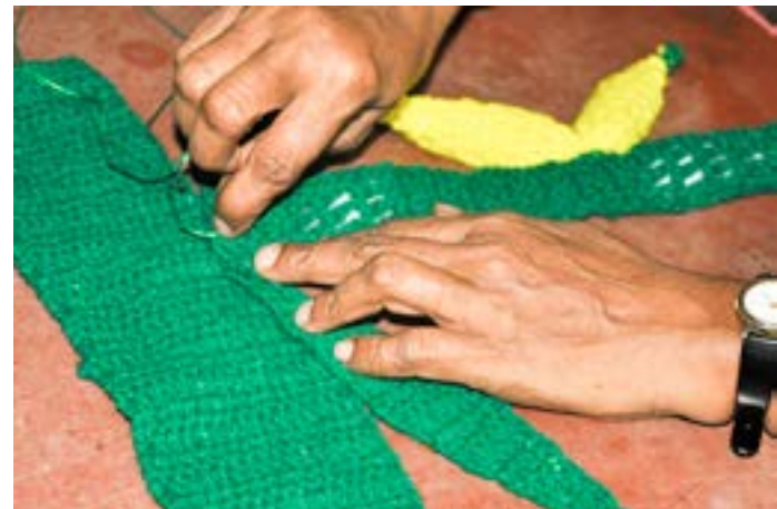
Chain or mat shaped crochet is stitched to get leaf shape.