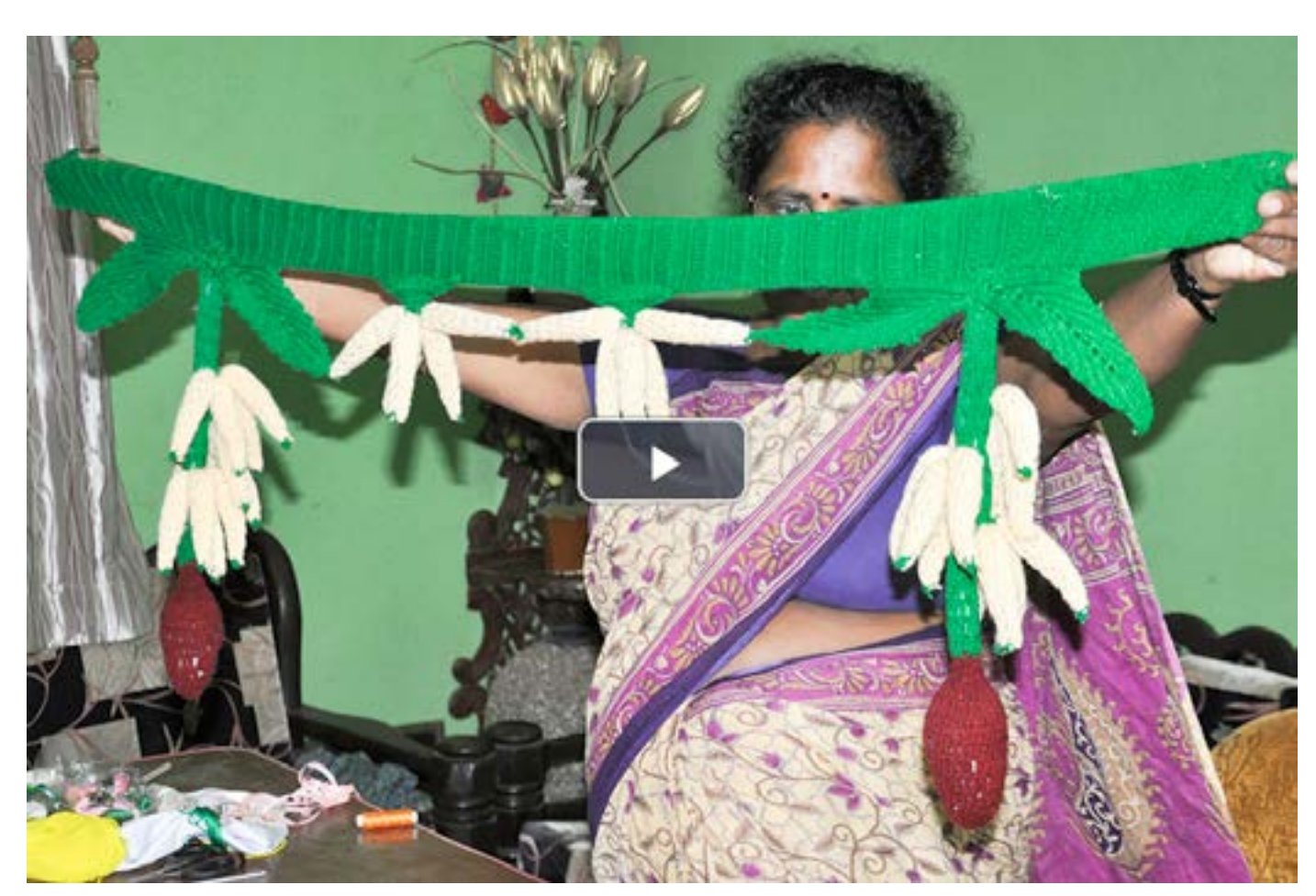
Crochet Toran - Panjim, Goa