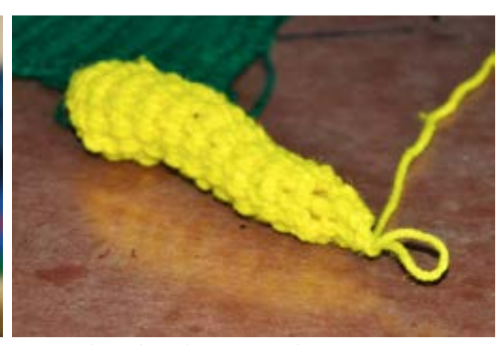
Banana-shaped crochet is formed.