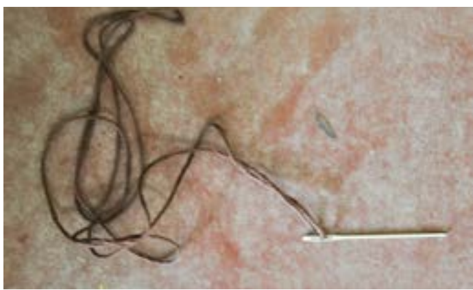
Needle is used to sew the woolens.