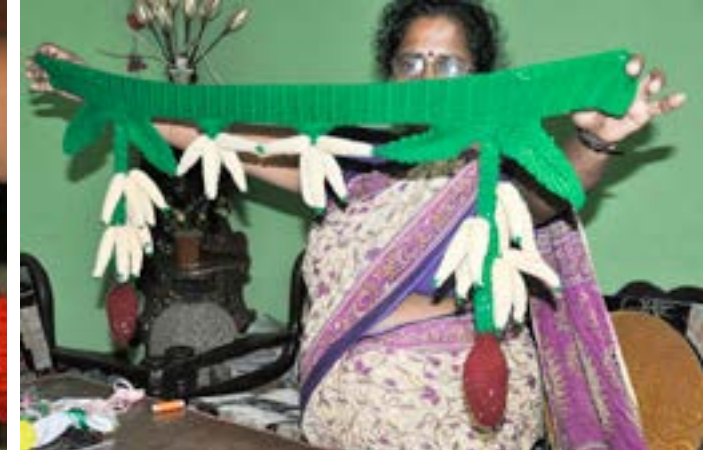
Woolen crochet is affordable, very easy, and less time-consuming to make at home.