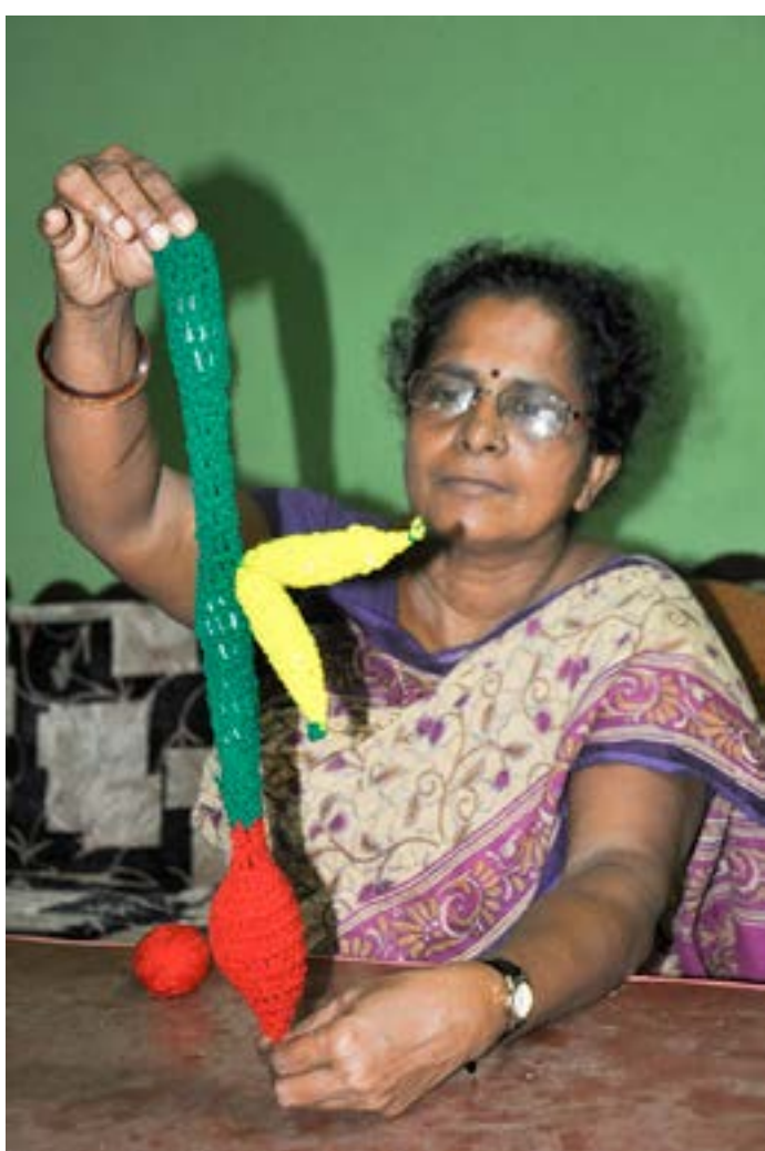
\label{lem:artisan} \mbox{ Artisan displays the semi-finished crochet. }