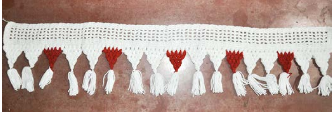
White and red coloured pattern crochet used for door hanging.