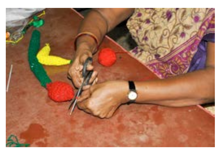
Red flower bud-shaped yarn and banana-shaped yarn are stitched to the green colour stem.