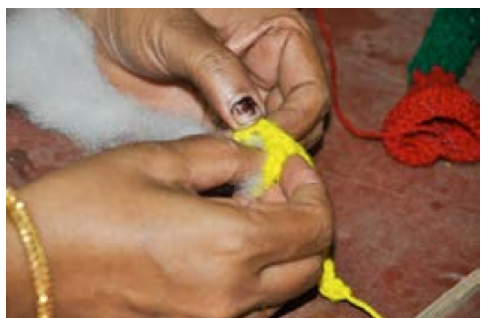
Cotton is used to stuff inside a banana shape.