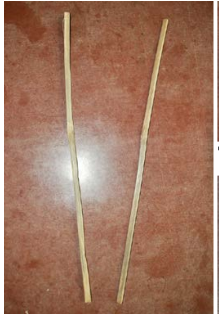
Sticks are used to stuff the cotton.