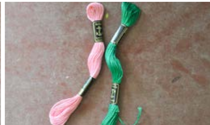
Woollen threads are used to sew.