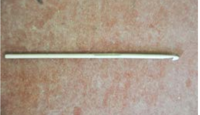
Knitting needle is used to knit the crochet.