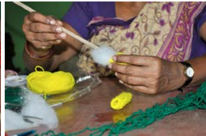
The shape of the banana is formed with the help of cotton stuffing.