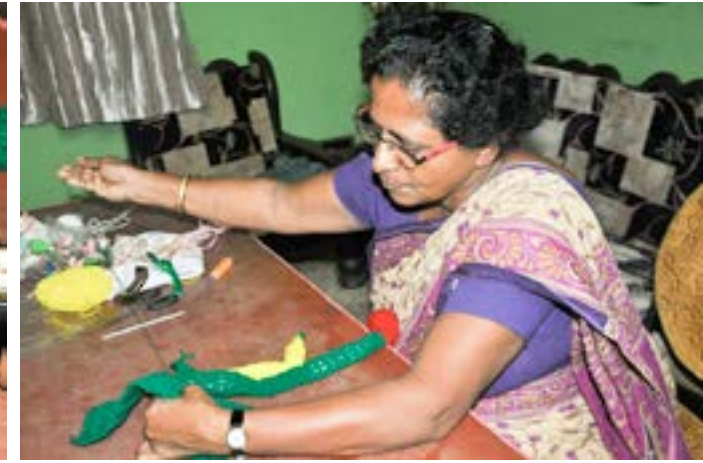
Stitching in process.