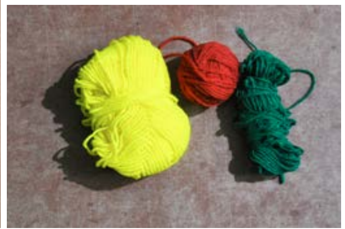
Wool is the primary raw material used for knitting.