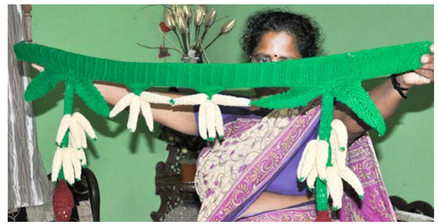
The artisan displays a replica of the banana stem.