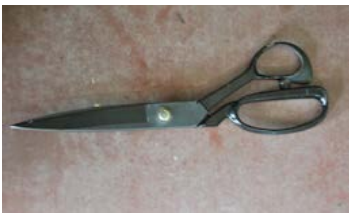
Scissor is used to cut the threads.