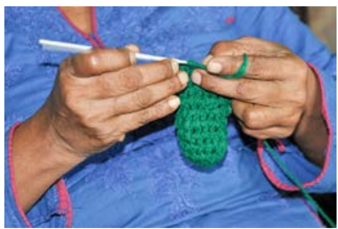
Artisan making a chain stitch by slipknot and hook technique.