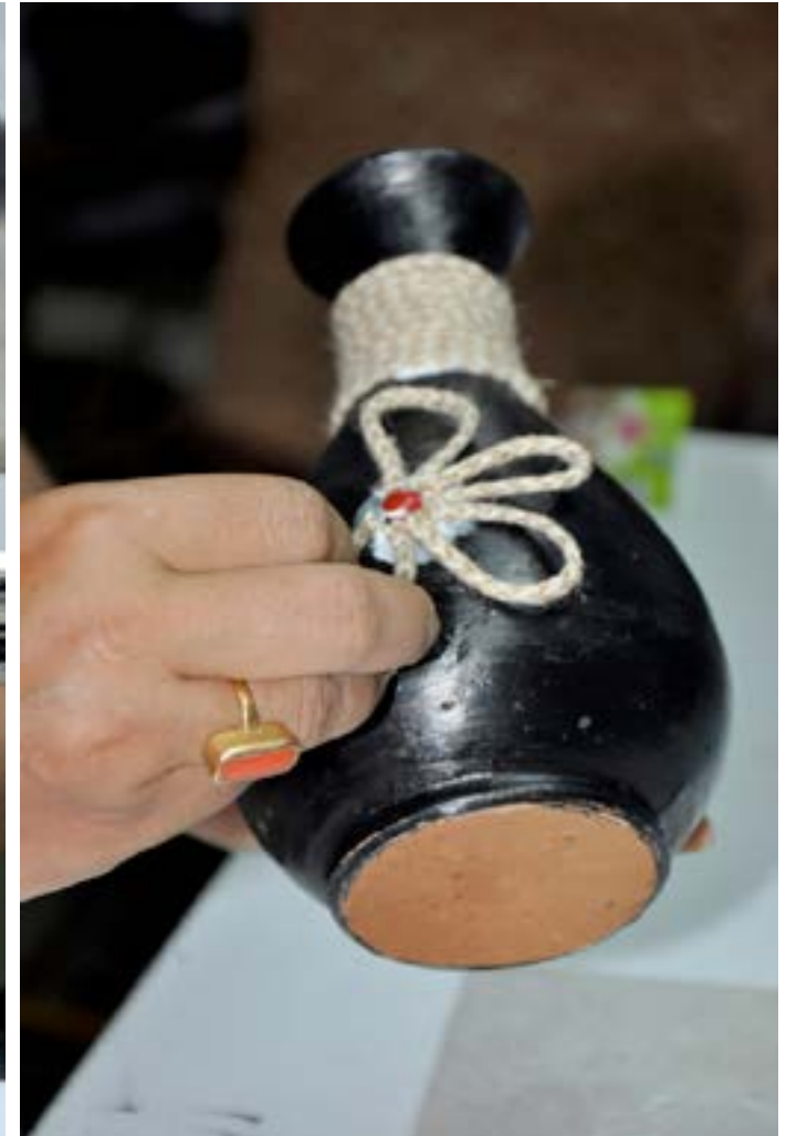
Creative patterns being made using jute thread and beads.