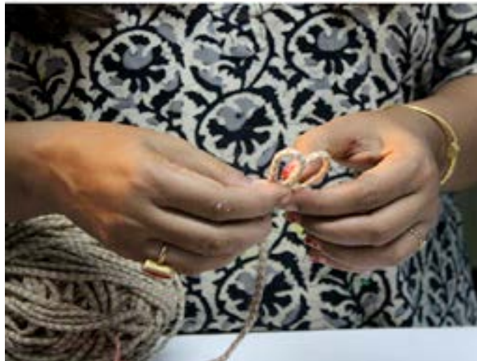
Jute thread being cut and shaped into an intended form.