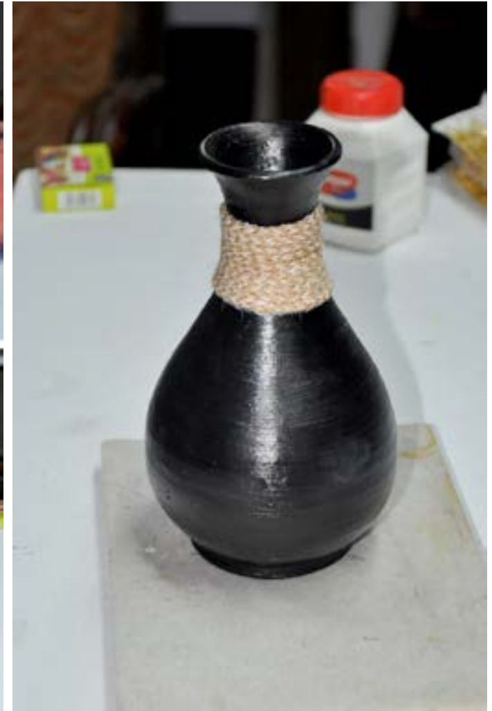
Pot left to dry.