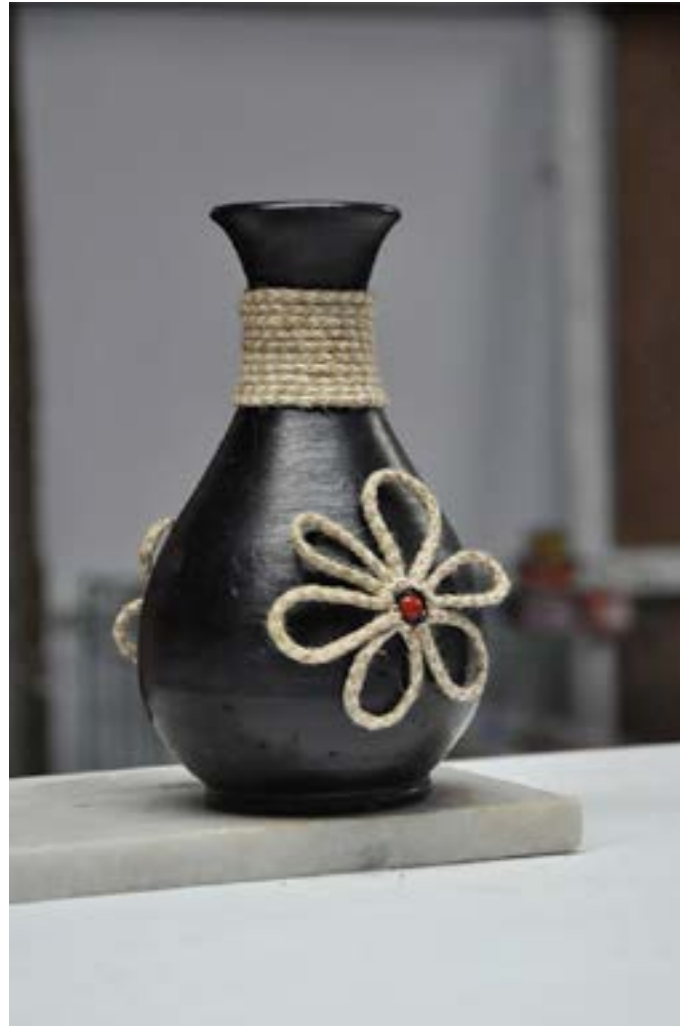
Terracotta pot beautifully decorated with jute thread.