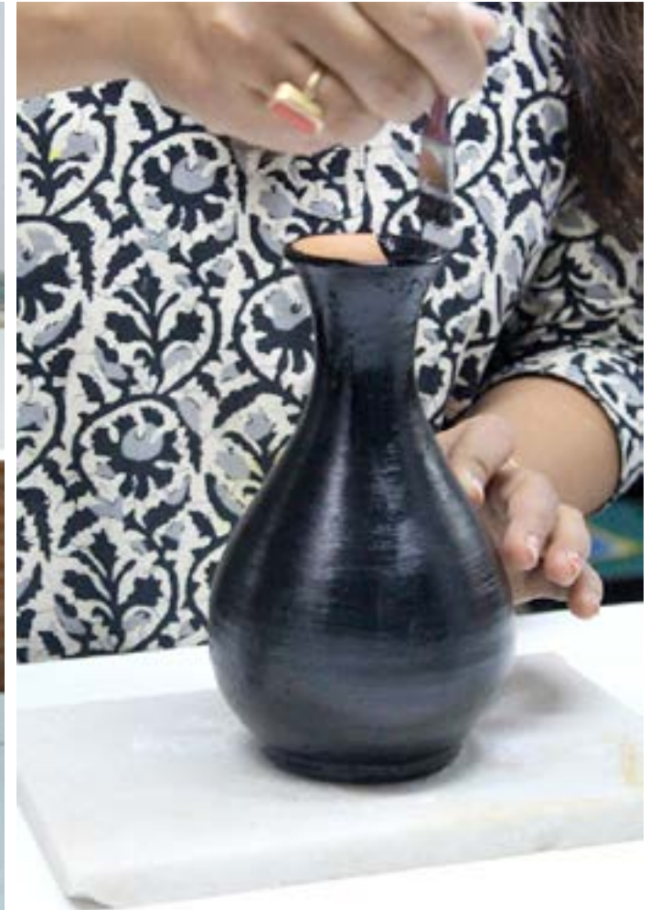
The interiors of the pot are being painted.