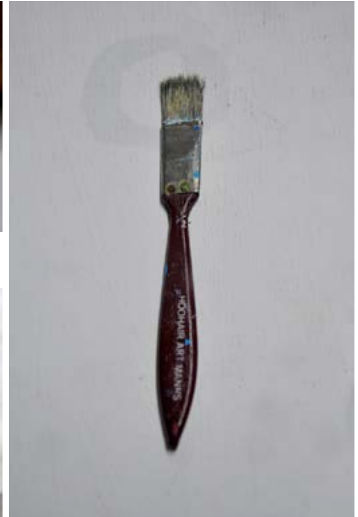
A paintbrush is used for painting purpose.