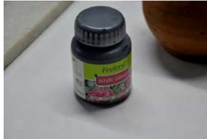
Acrylic colors are used to paint the decorative piece.

https://dsource.in/resource/decorative-pot-kolkata/tools-and-raw-materials