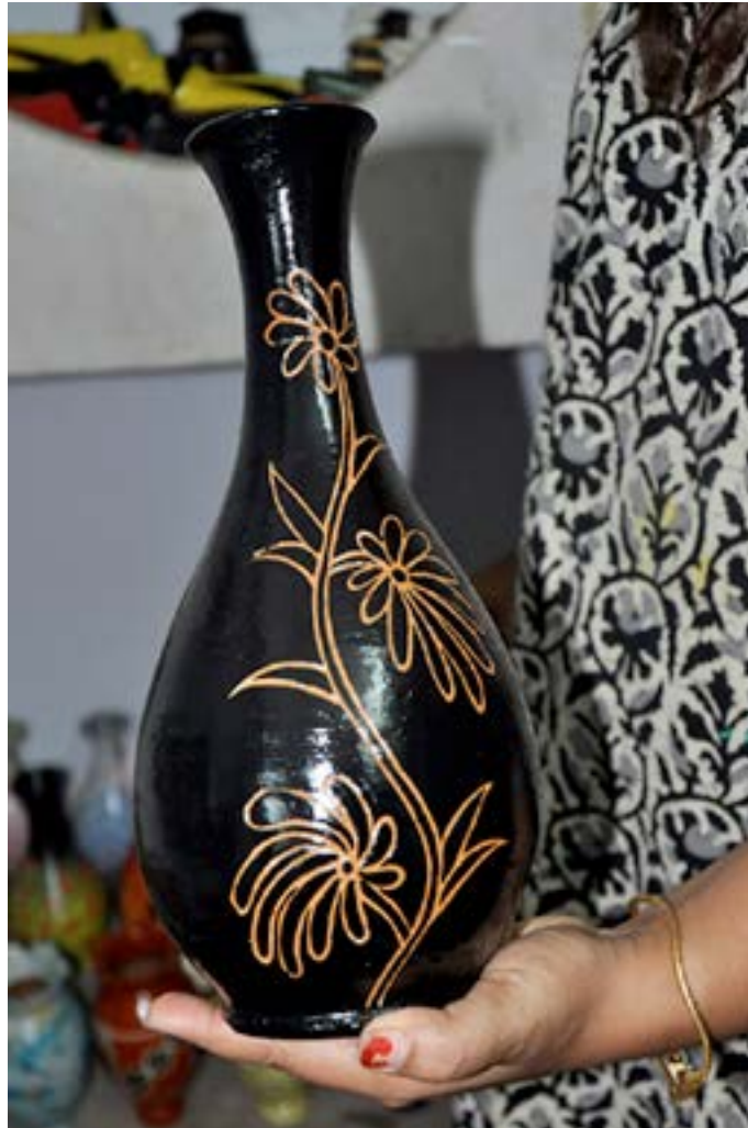
Pots with flower design and illusion signs.