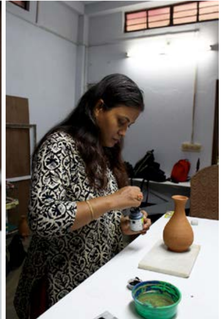
Artisan working on the decorative pot with utmost commitment.