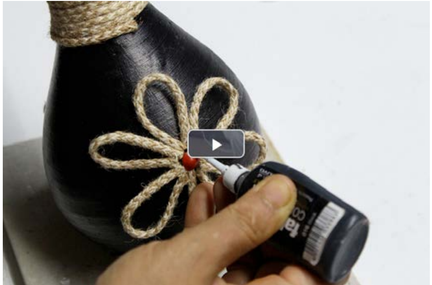
Decorative Pot - Kolkata