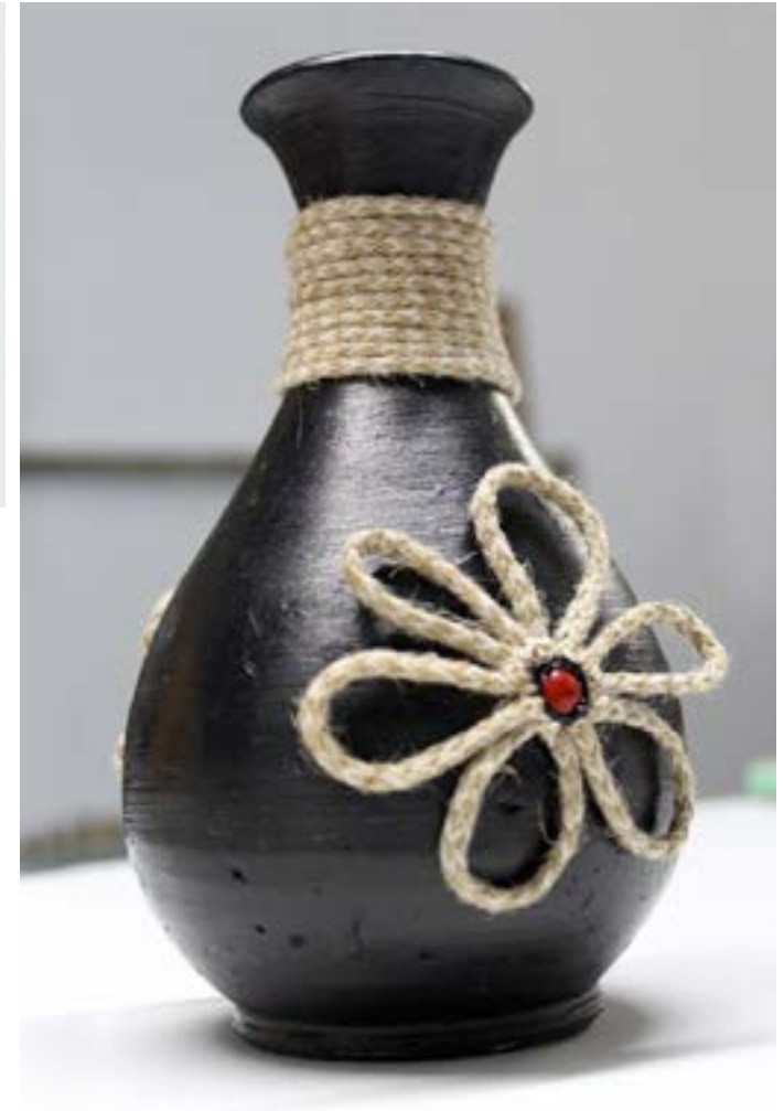
Beautifully decorated terracotta vase.