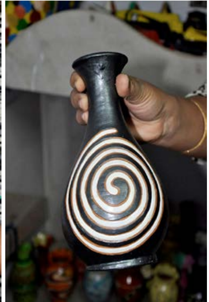
Terracotta pot with spiral design.