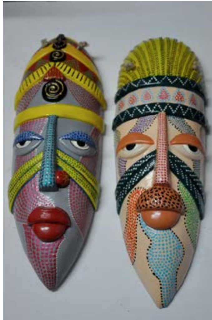
A Terracotta mask is painted with different patterns.

Products made by Mrs. Debanti Sen and the team include terracotta masks, terracotta vases, m-seal jewelry, jute products, and shola products. Here the cost of the products ranges from INR 600 to INR 1,200, which defers as per the product type, size, detailing given, and raw materials used. The minimum size of the vase is often 6 inches, while the maximum goes up to 18 inches.