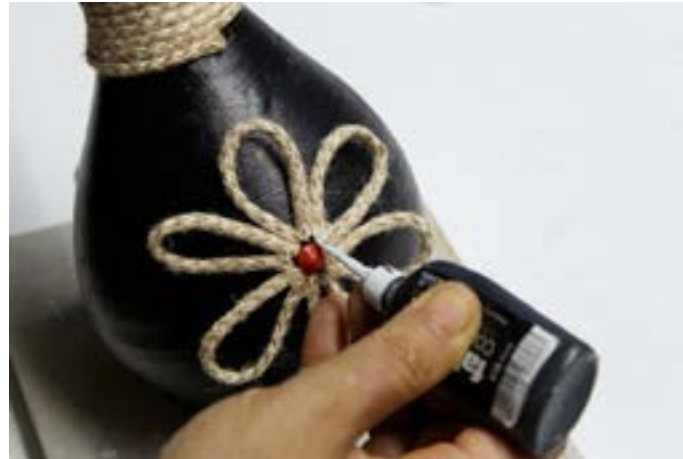
Additional designs added using acrylic paints.

https://dsource.in/resource/decorative-pot-kolkata/making-process