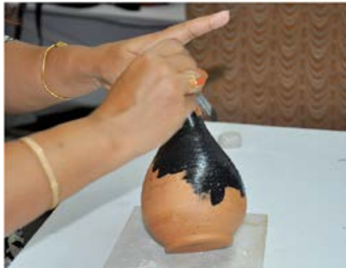
Black acrylic paint being applied over the pot using a paintbrush.