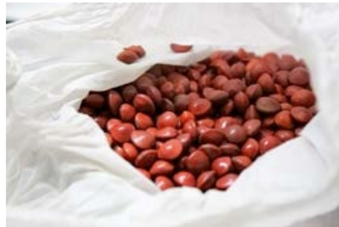
Beads used to add beauty to the pot.