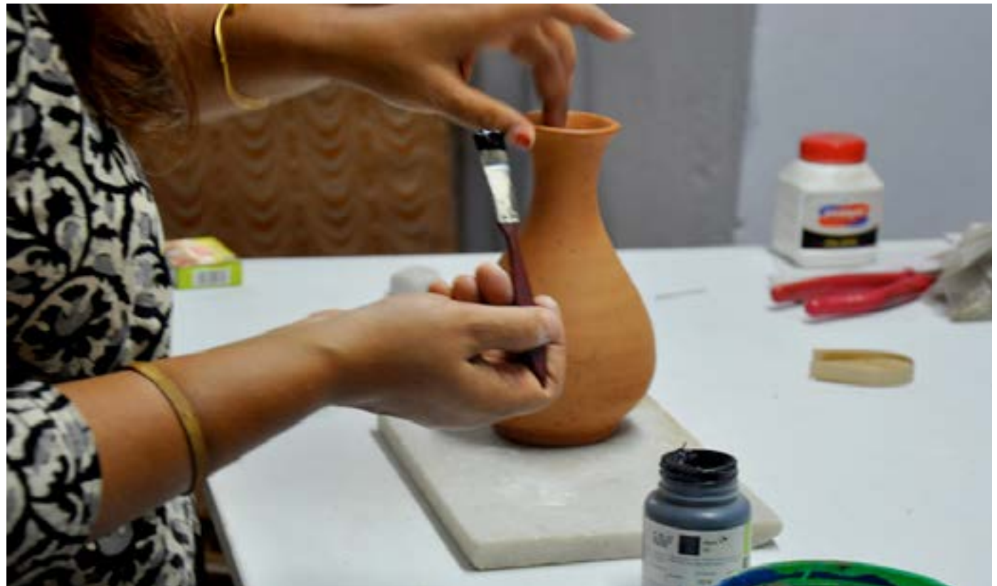
Artisan working on a flower vase.

At Debanti Sen's workshop, decorative vases are made out of a clay vase. Taking the vase as a base structure, the artisan starts with the painting process. Here the body of the vase is painted with the intended color using acrylic paints and paintbrushes. Once the whole body is painted, it is left to dry for 20 to 30 minutes. Later the dried vase is comfortably held by the artisan to apply adhesives around the neck, followed by rolling of twine strings over them. It is taken care that more than eight rolls are made, and they are fitted tightly to the vase. After this, the artisan proceeds to the middle portion, where a decorative red stone is glued to the center portion for added beauty. Now artisan cuts a twine string into twelve pieces using scissors, and these pieces are attached to the vase in the shape of a flower using an adhesive. The same procedure is followed on the other end of the pot. Once done, black acrylic paint is applied to the center bead in the shape of a circle, thus completing the vase painting process.