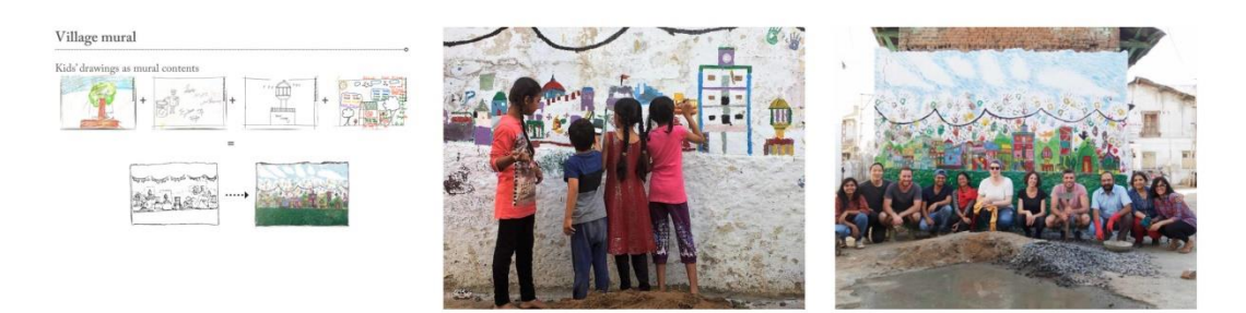
Figure.5 Images explaining the process behind the mural.

We started by asking children to draw the image of their village to know more about the community. All the drawings were collectively converted into graffiti. They then drew a version of the village which puts together the diverse visions of designers, villagers and most importantly children, and by doing this the authorship to the place was established.