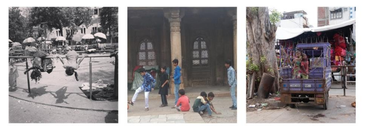
Figure.2 Restrictive play: Children adding playful character to the most mundane elements.

The first stage was to study how the child was neglected in the precinct. Due to lack of open spaces and encroachments in the old city, overtaken by vendors, buyers and vehicular movements where the child is forgotten. It is surprising to see how children adapt and rehabilitate these spaces by adding a playful character to the most mundane elements, out of their curious and uninfluenced nature.