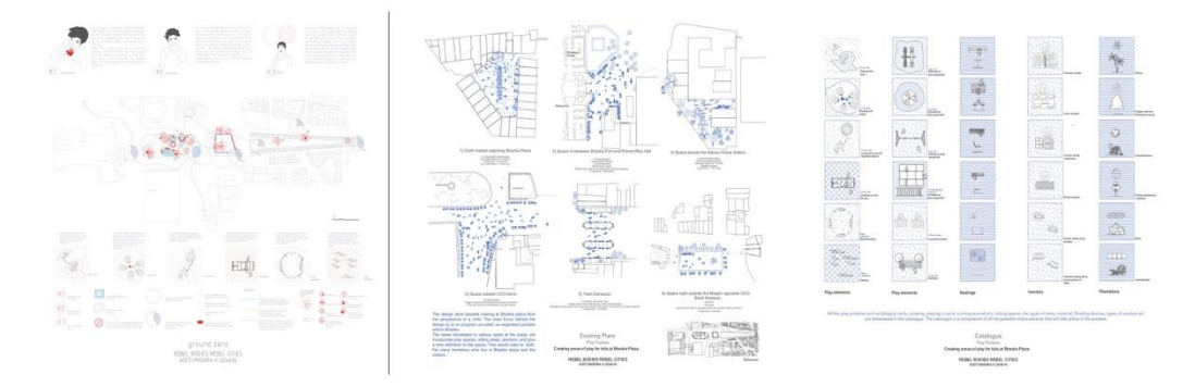
Figure.4 Designing urban devices. (Source: author's student)

And at the third stage, in the design exercise students were asked to identify pockets which could be formless islands left by road engineers and demolition workers, and other wastelands which could be redesigned to better suit children activities. Following proposals were developed by students to cater to the particular needs, aesthetics, and behaviour of the inhabitants.