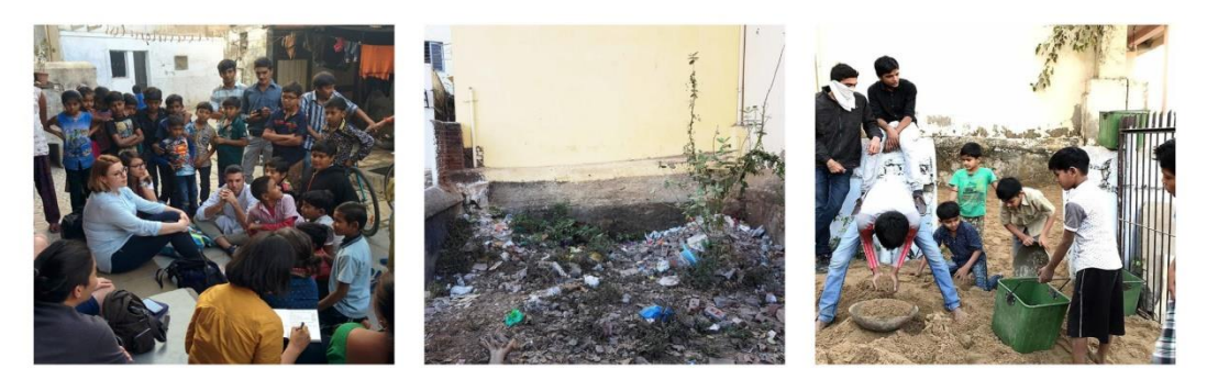
Figure.7 Images explaining the process behind the revitalising of the wasteland.