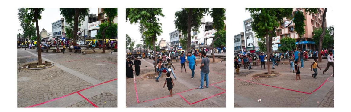
Figure.3 Activating the voids for children's active participation.

And at the third stage, in the design exercise students were asked to identify pockets which could be formless islands left by road engineers and demolition workers, and other wastelands which could be redesigned to better suit children activities. Following proposals were developed by students to cater to the particular needs, aesthetics, and behaviour of the inhabitants.