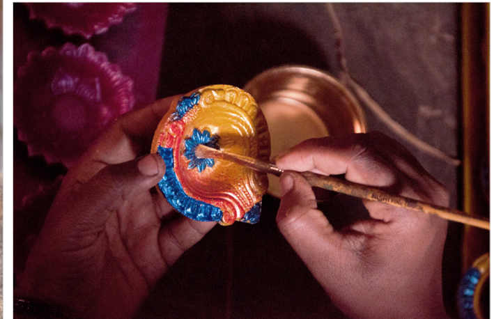
Diya being coloured.