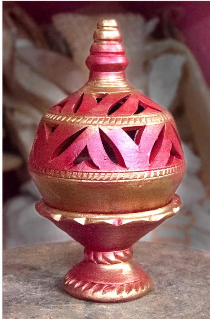
Traditional lamps are used to decorate homes during the Diwali festival.