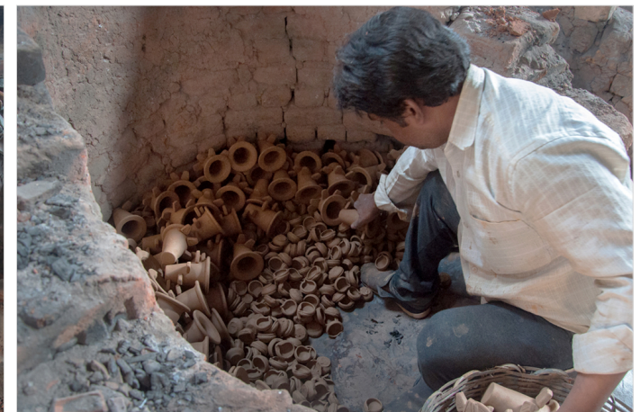
Artisan arranging diyas for burning.