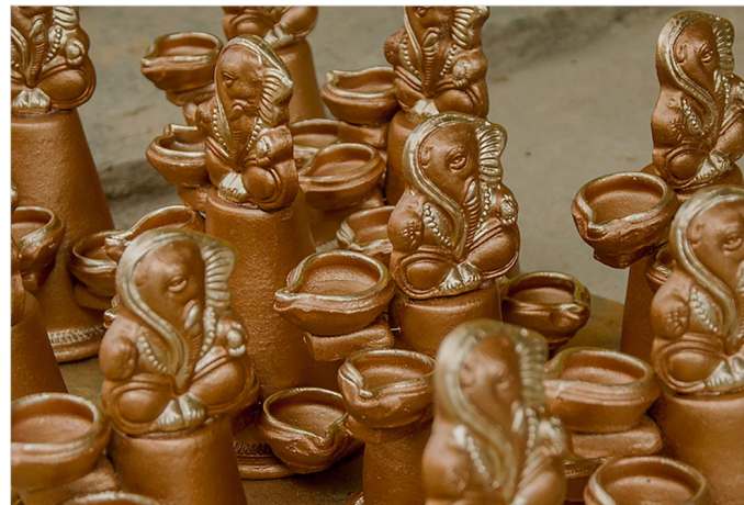
Beautifully made diya stands attached with the idol of Ganesh.