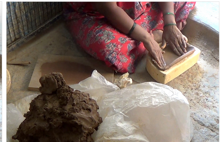
The clay slab is placed on the mould and pressed until it gets the shape of the mould.