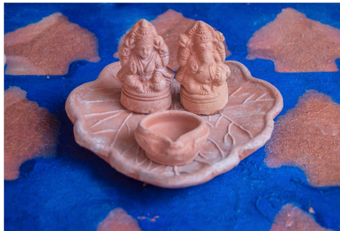
Lakshmi and Ganesha diya for Diwali festival is ready.