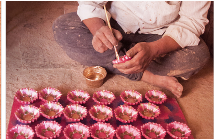
Inside area of diya is further decorated with multiple colours.