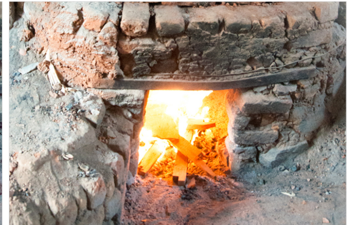
Burning process- 600 to 700 degrees temperature is maintained for 6 hours.