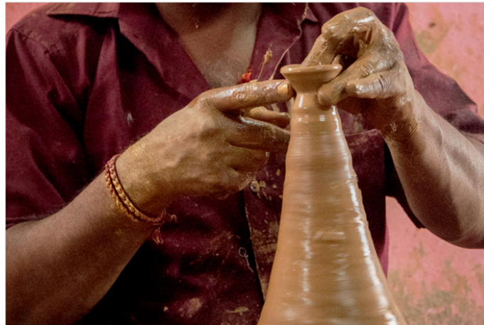
The clay is getting shaped to a diya form.