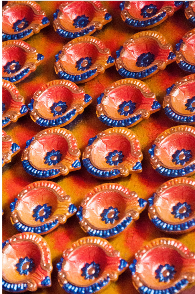
Diya is enhanced with attractive colours.