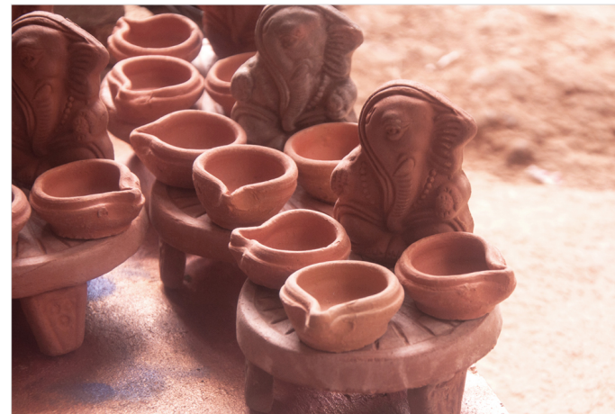
After all the arrangement the final set is kept under the sunlight.