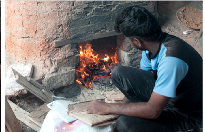
The gap between the bricks are closed with clay to avoid heat dissipation.