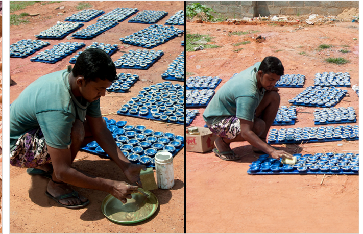
Artisan is mixing glittering particles with gold colour and applying with a sponge.