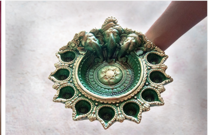
Composing Ganesha idol with diya.