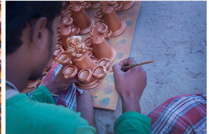
Artisan is giving final finishing touch to diya with the golden closure.