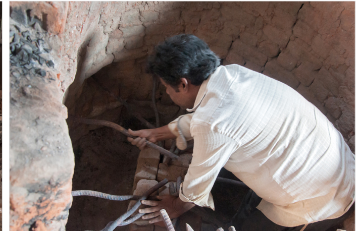
Arranging the iron rod as a base for baking process.