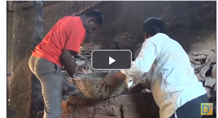
Diya Making Part 2