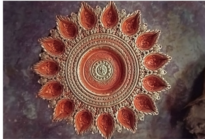
Attractively decorated diya painted with gold & orange colour.

https://dsource.in/resource/diya-making-diwali-bengaluru/products