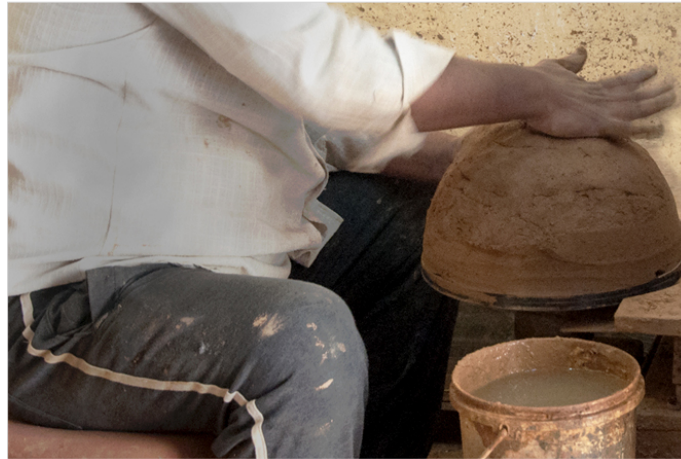
Clay dough is placed in the centre of the turning Machine.