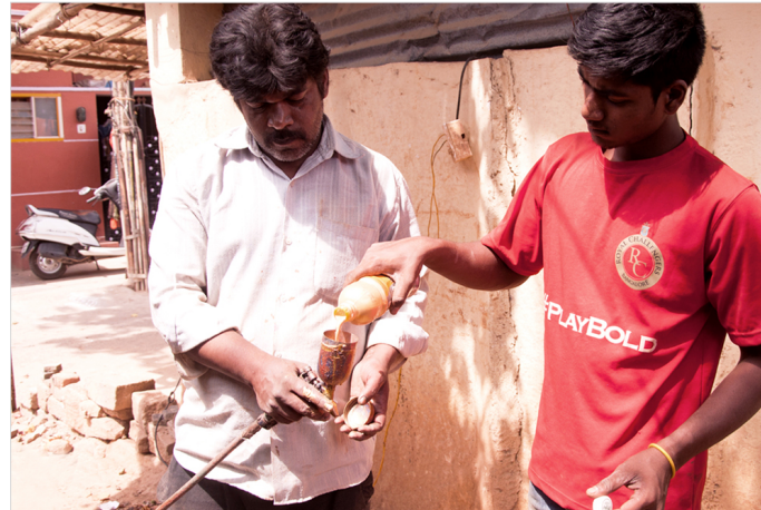
Artisan pours the colour inside the spray gun for the colouring process.