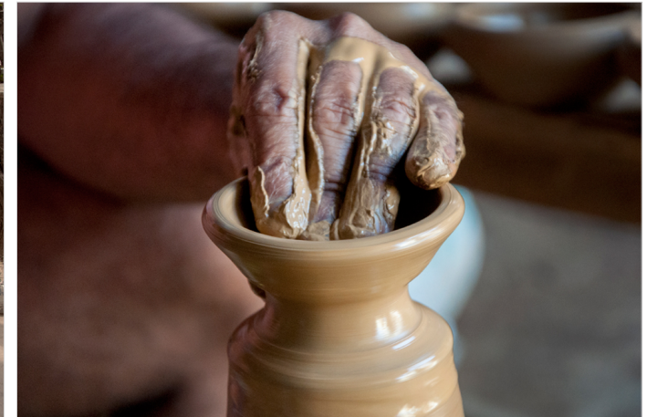
Artisan shapes the clay to a diya form. Artesian making diya using clay on a spinning wheel.