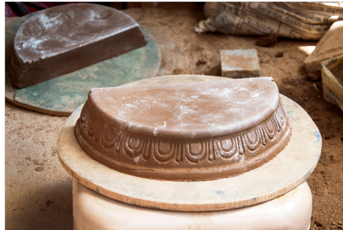
Now the product is allowed to dry outside under the shade for two days.