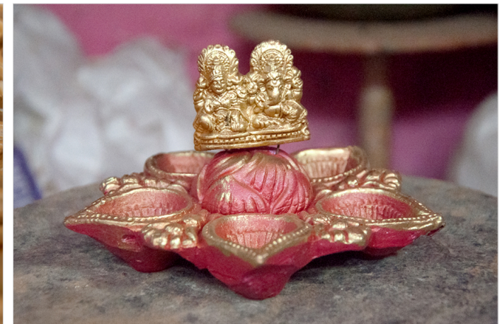
A colourful diya attached with Lakshmi and Ganesha.