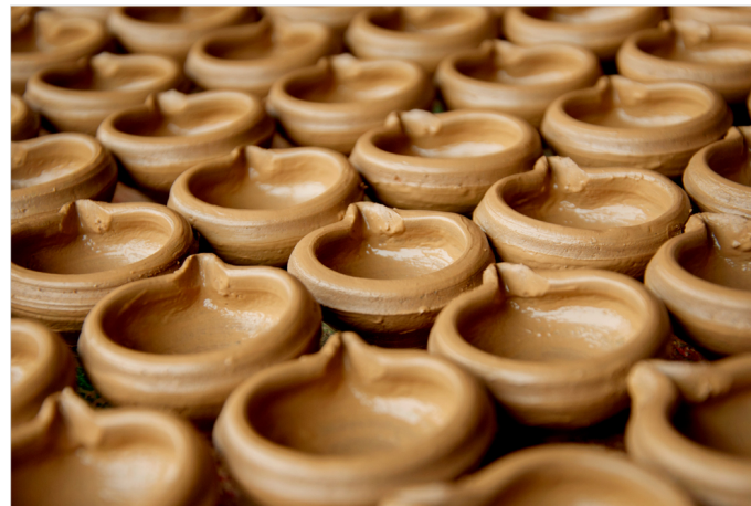
Diya kept under the sunlight for dry.