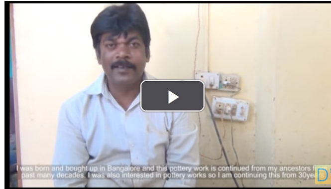
Diya Making Part 1