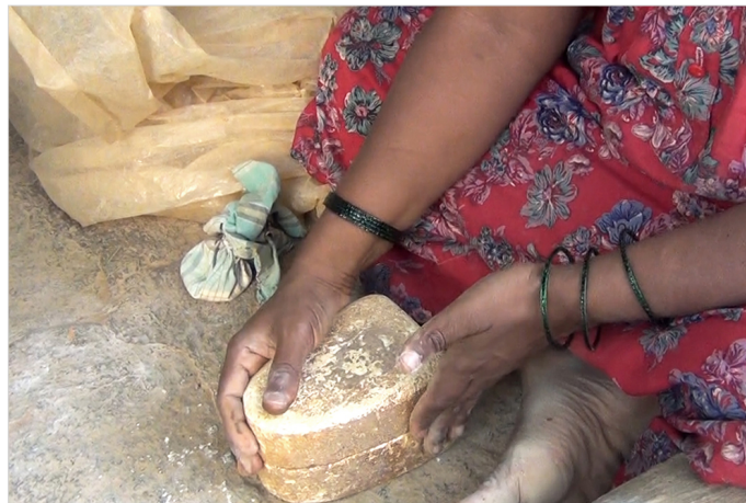
Both half of the mould is pressed for 15 seconds to get a proper shape.