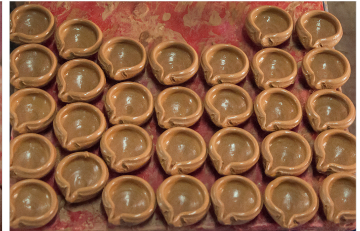
Diyas arranged in rows after shaping.