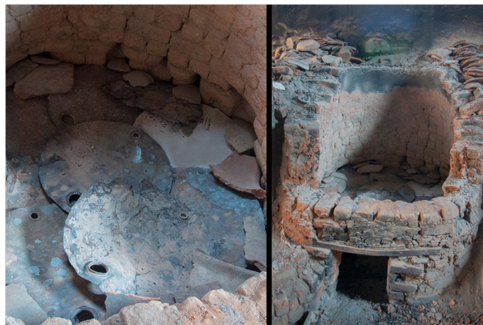
Iron plates are arranged on iron rods.