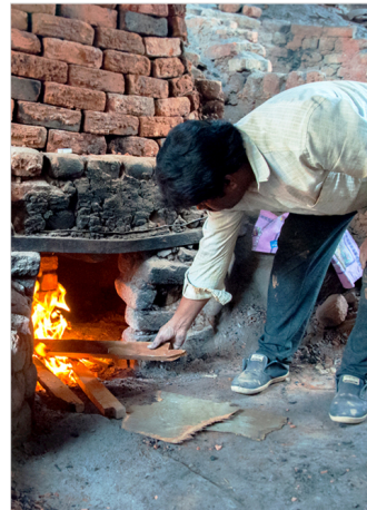
Waste plywood pieces are used for the burning process.