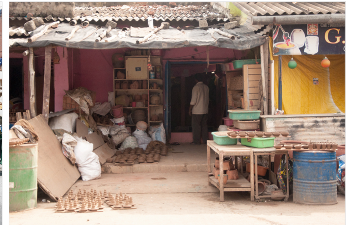
Pottery work places for artisan.