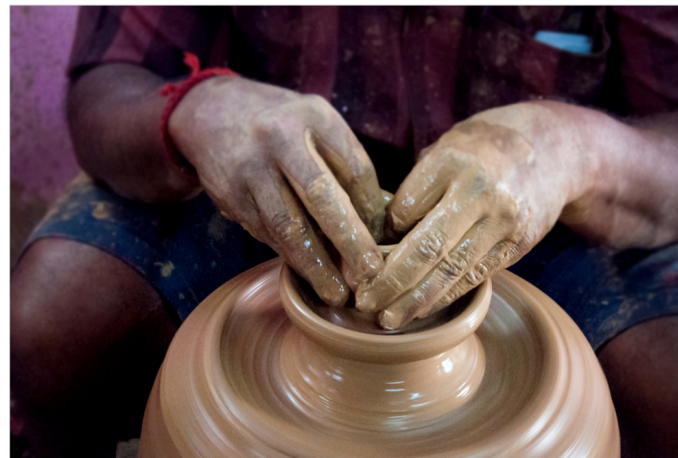
Artisan pulling out the clay to make the structure for diya.