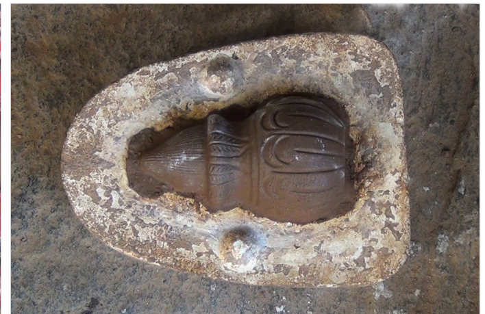
Product is shown in half of the mould.