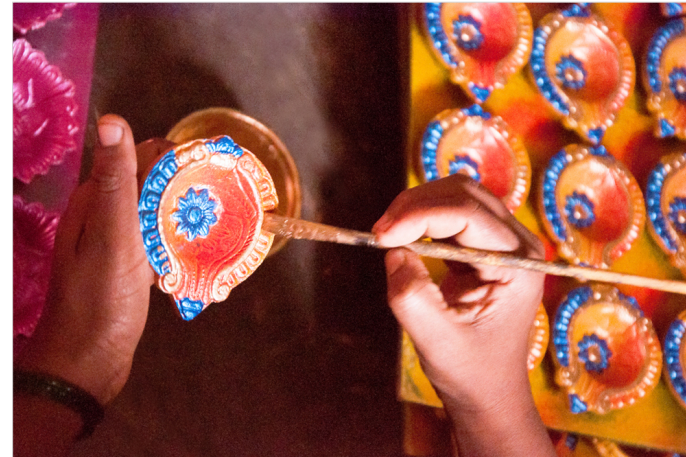
Artisan beautifully painting diya with the different colours.

https://dsource.in/resource/diya-making-diwali-festival-pottery-town-bengaluru/making-process/coloring-process