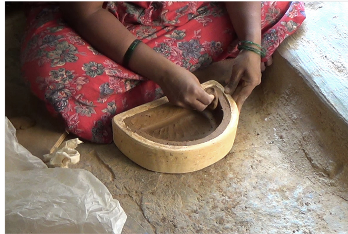
It requests to mention even thickness all over.

https://dsource.in/resource/diya-making-diwali-festival-pottery-town-bengaluru/making-process/diya-mould