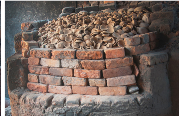
All diyas are arranged properly inside the kin.