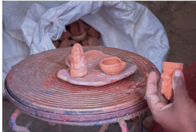
Artisan is sticking Ganesha and Lakshmi idols on that plate.