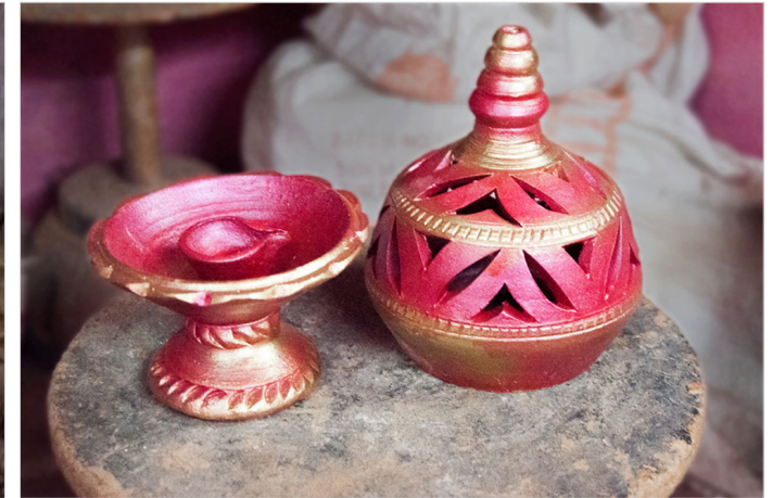
Traditional lamps used to decorate home during Diwali festival.