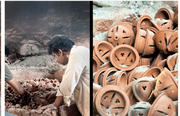
Diyas are allowed to cool and taken out.