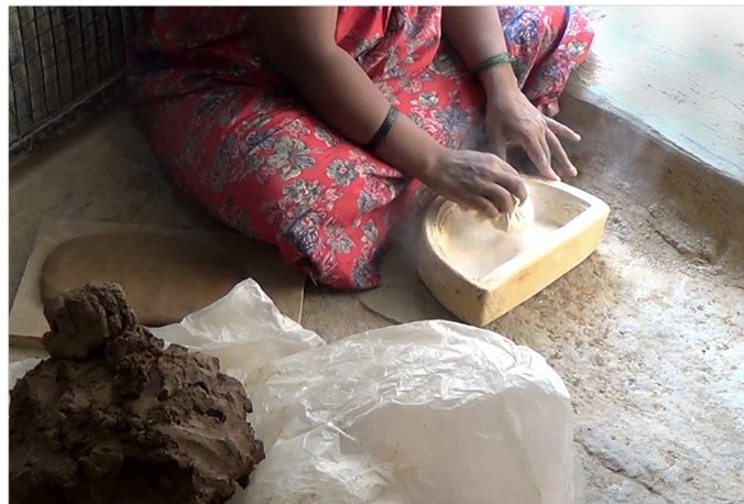
Chalk powder is spread to avoid stickiness while removing the clay models.