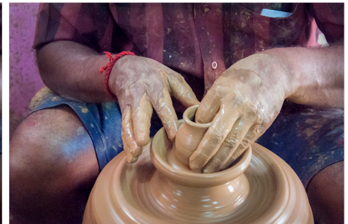
Shaping the lamp.