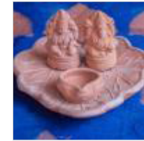
Diya in Mould