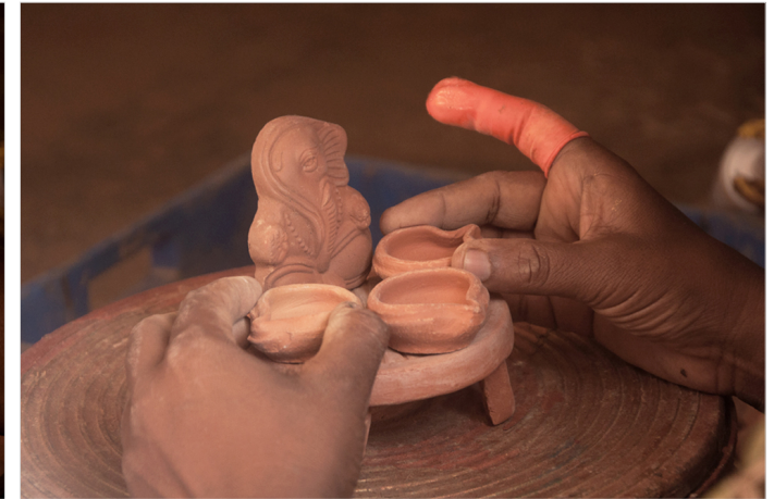
Artisan beautifully arranging diyas with the idol of Ganesha on the stand.