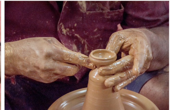
The product is cut with the sharp tool.