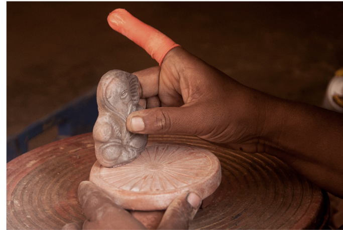
Artisan sticking Ganesha idol on the mud stand.

https://dsource.in/resource/diya-making-diwali-festival-pottery-town-bengaluru/making-process/diya-mould