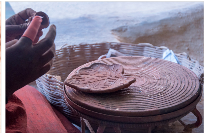
Leaf shape mud plate.