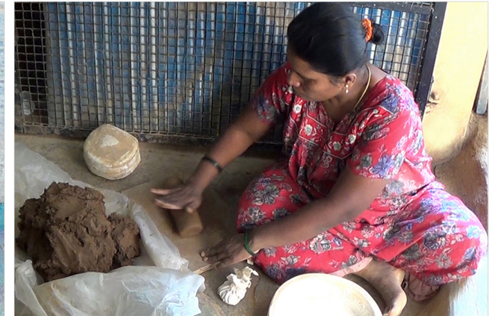
The clay is kneaded to make the wet slab.