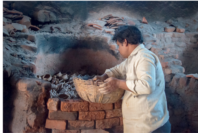
The delicate and expensive diyas are arranged on the top very carefully.

https://dsource.in/resource/diya-making-diwali-festival-pottery-town-bengaluru/making-process/baking-process