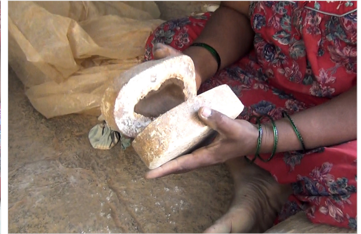
Clay is filed with little pressure to reach the cavities.