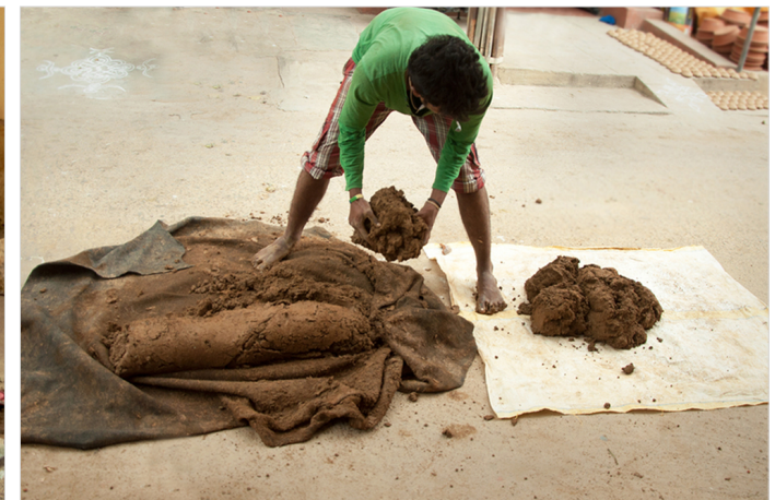
After kneading, clay is kept separately.