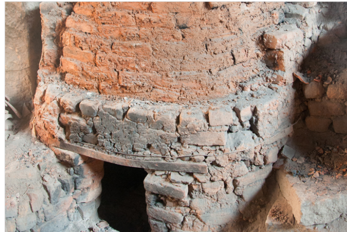
Burning process kin left overnight for cooling.