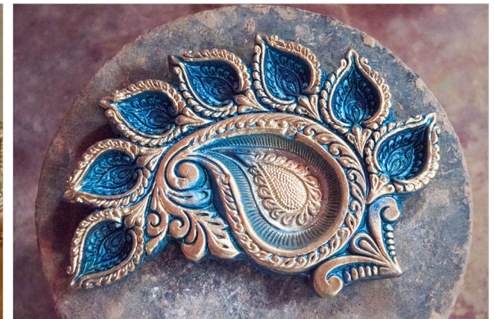
Colourful diya made with flower shape.