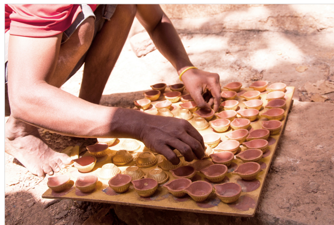
Artisan arranging diya to colour the other side.