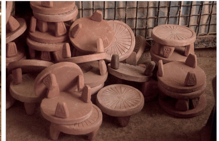
Diya stand made with the clay.