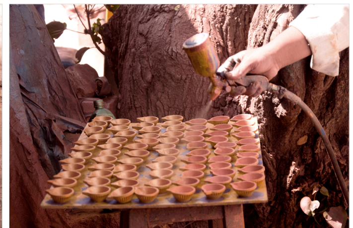
The front side of diyas is getting coloured.