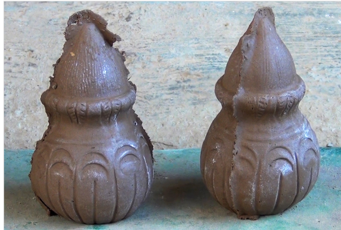
The final product is ready after removing both half of the mould.