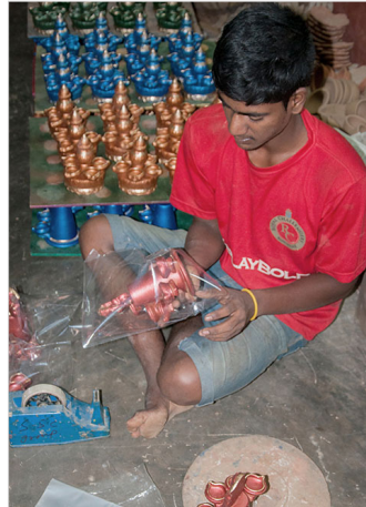
Artisan packing diya inside the plastic cover.