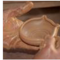
Making of Diyas

https://dsource.in/resource/diya-making-diwali-festival-pottery-town-bengaluru/making-process