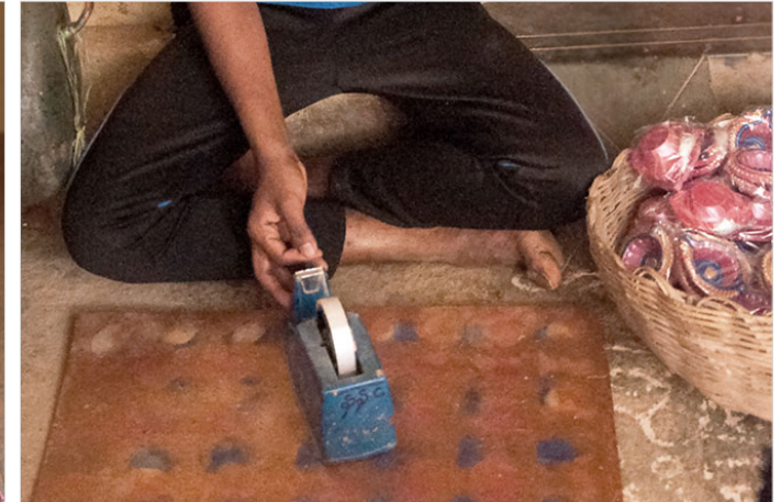
Artisan wrapping products with the help of cello tape.