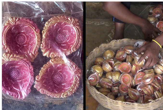
The final product are ready to serve in the market.