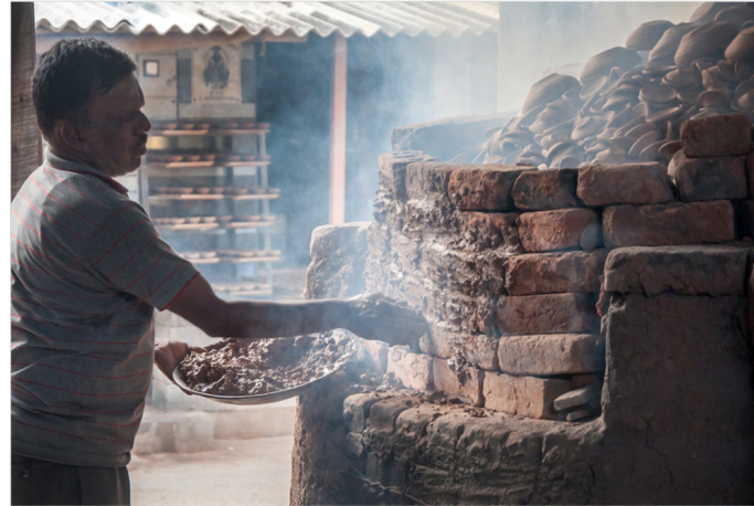
The gap between the bricks are closed with clay.

https://dsource.in/resource/diya-making-diwali-festival-pottery-town-bengaluru/making-process/baking-process