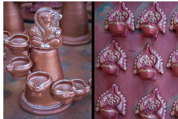
Final product is ready by artisan.