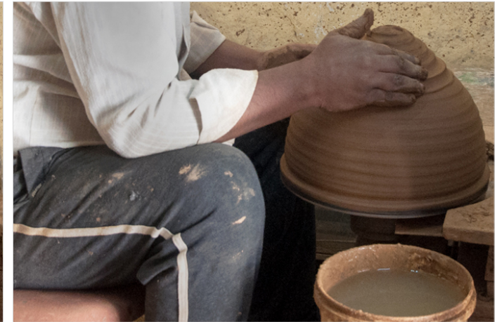
Artisan is giving shape to Clay dough using a turning Machine.