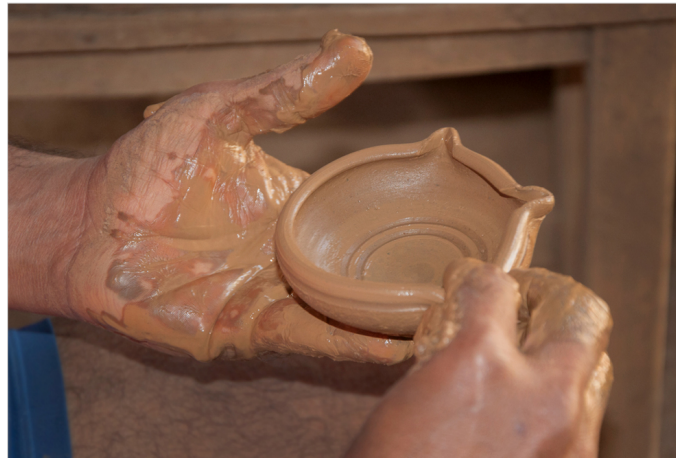
Giving shape to the lamp.