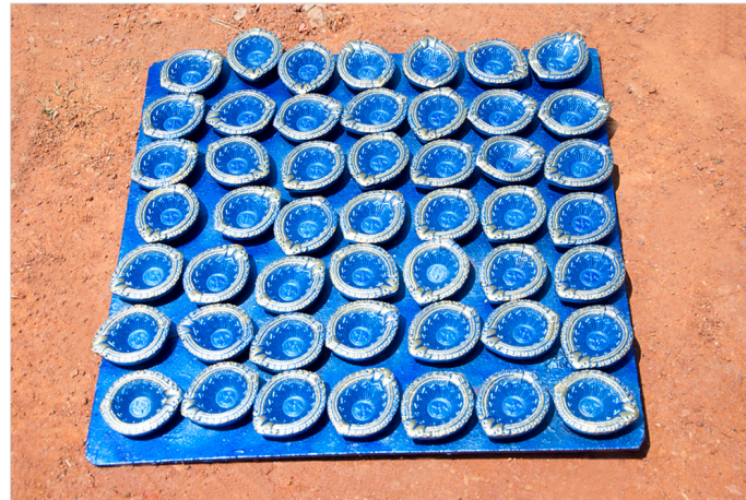
Diyas kept under the sunlight for drying.