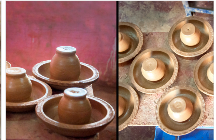
Product is allowed to keep under the sunlight.