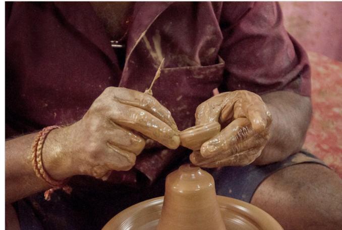
Diya is getting shaped.

https://dsource.in/resource/diya-making-diwali-festival-pottery-town-bengaluru/making-process/making-diyas