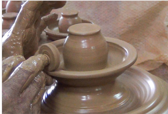
Creating design on the lamp with customized tool.