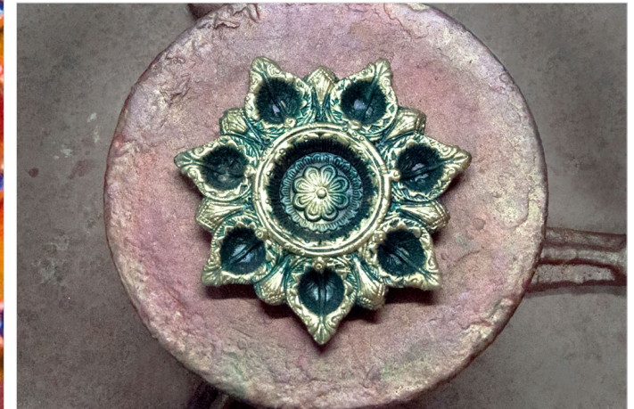
Diya embellished with gold shade.