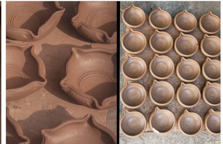
Shaped product kept under the sunlight.