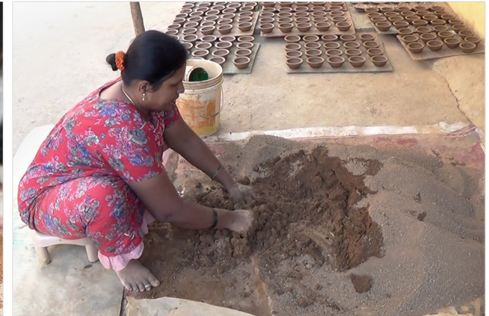
The clay and water mixed well to remove air bubbles.