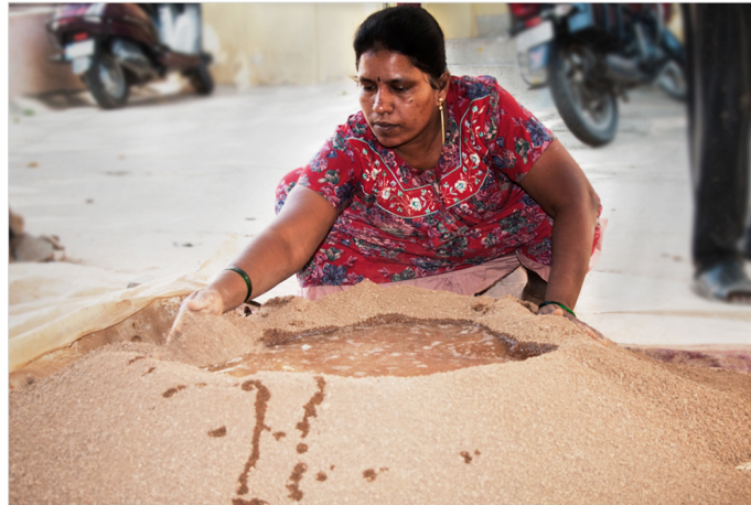
Artisan mixing water with the dry mud to get clay.