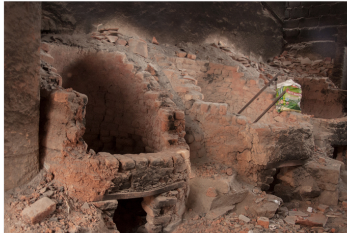
The place where diyas are baked.