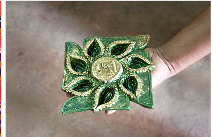
Swastika shaped diya.