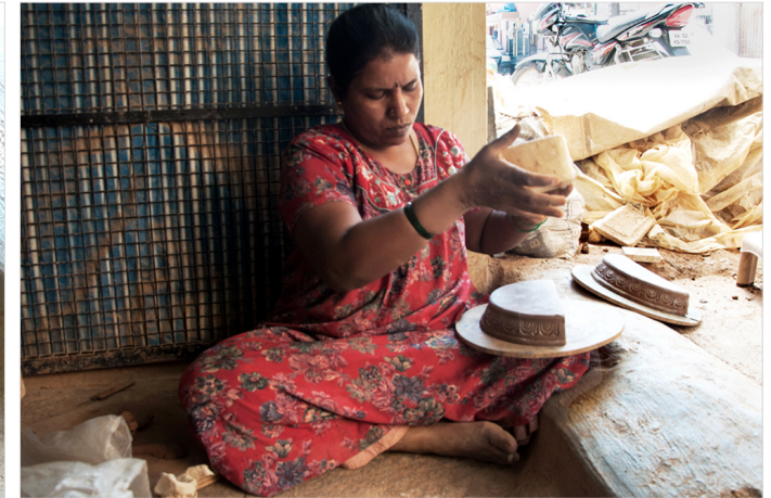
The product is carefully removed from the mould.