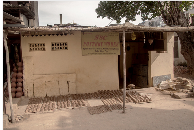
Work place where diyas are prepped.

https://dsource.in/resource/diya-making-diwali-festival-pottery-town-bengaluru/introduction