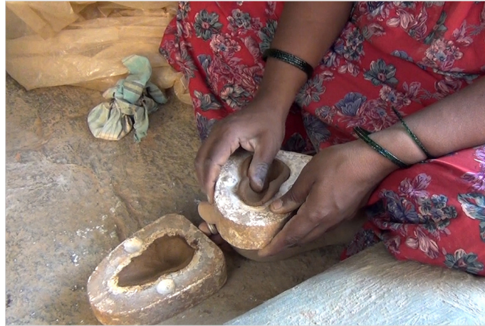
Artisan filing clay both half of the mould.