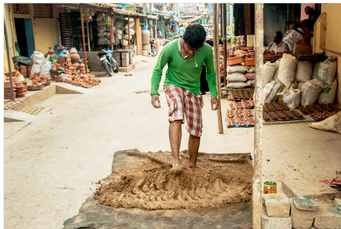
The clay is needed to enhance inner flexibility.