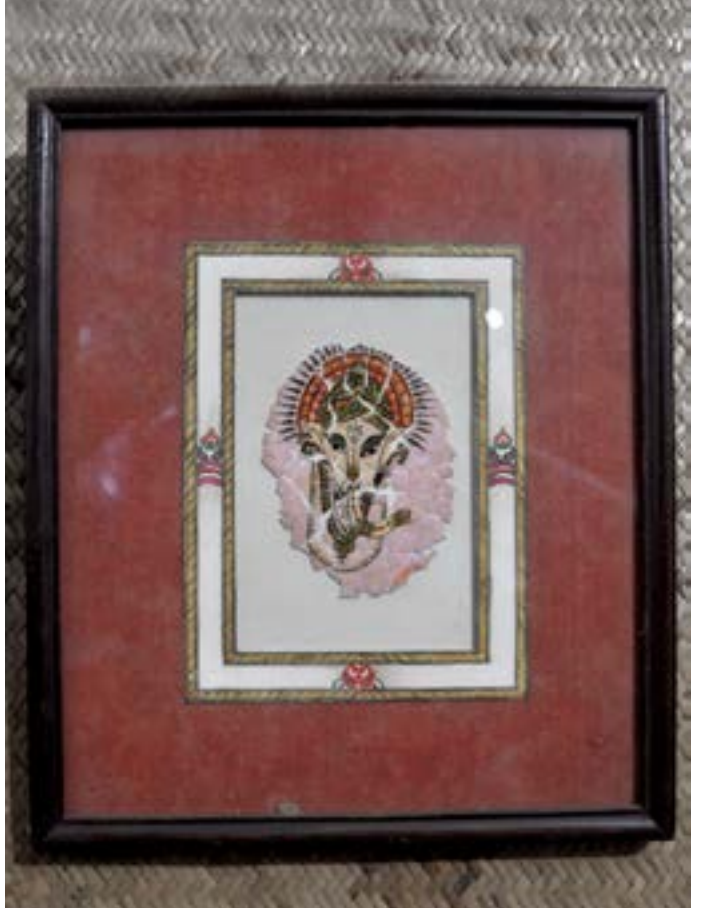
A wall hanging depicting Lord Ganesh is made out of eggshells.