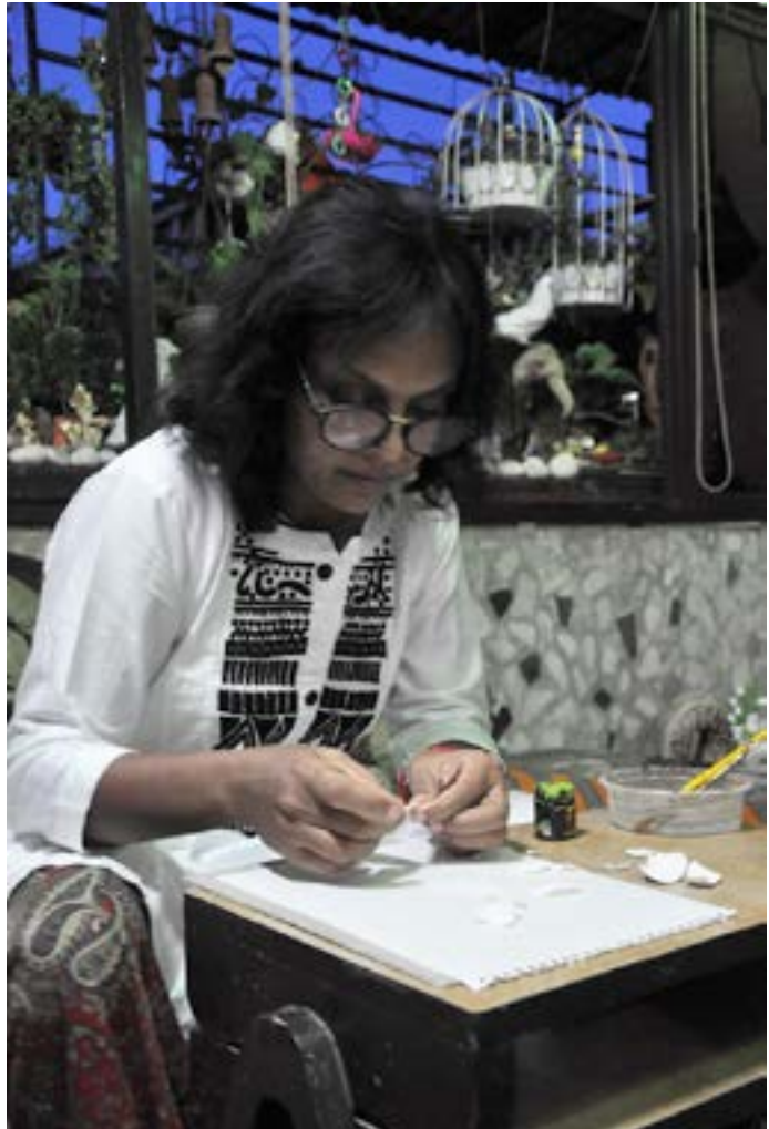
Artisan involved in the eggshell painting process.