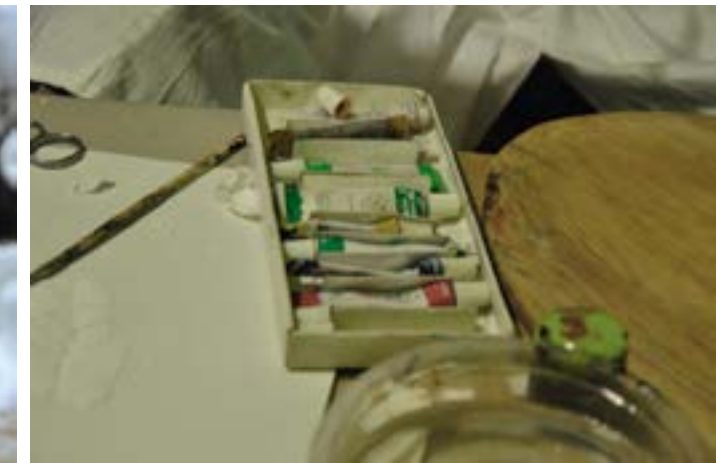
Watercolor is used as the base color.