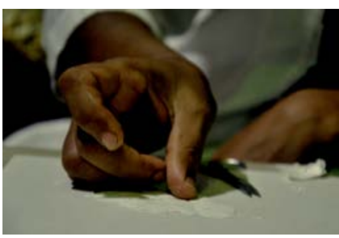
Eggshells are glued and pressed for natural cracks.