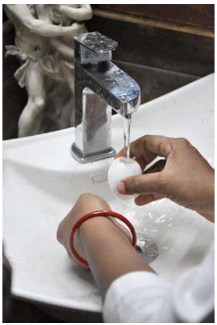
The shell being washed and dried.