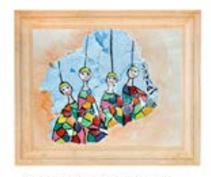
Eggshell painting is cut into appropriate size and framed using wooden or glass frames.