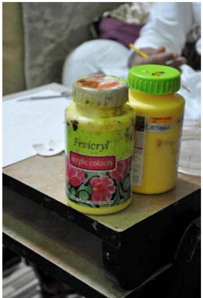
Acrylic colors are used to make designs over the eggshells.