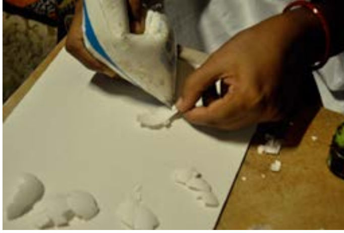
The adhesive used for gluing the shell to the chart paper.