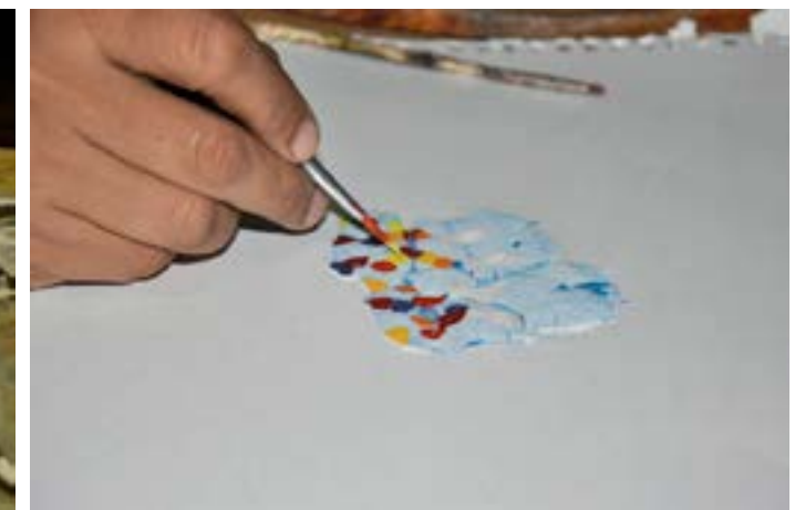
Various colors are mixed for unique color combinations. While painting, the artisan starts with the body part of