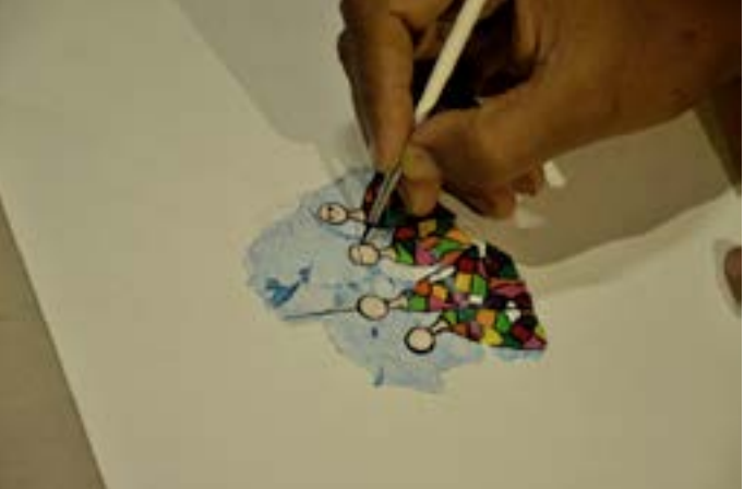
Artisan giving an outline to the pattern drawn using a round painting brush.