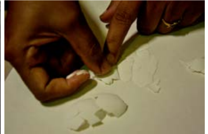
Artisan pasting the eggshell on a chart paper to make the art.