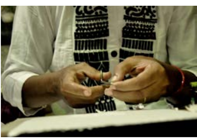
Shells being trimmed into the required size using a scissor.