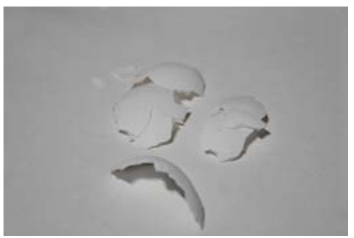
Eggshells are used as the basic raw material.