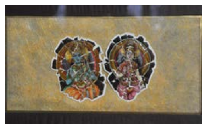
Eggshell painting depicting Lord Vishnu and Lakshmi.