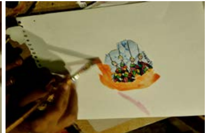
The background color is given to make the main characters stand out in the painting.