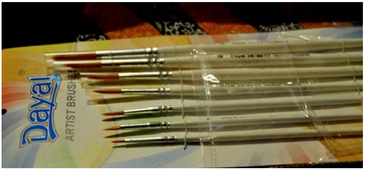
Different sizes of brushes are used for painting.