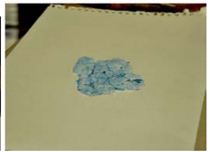
Shell base being painted with blue watercolor paint.