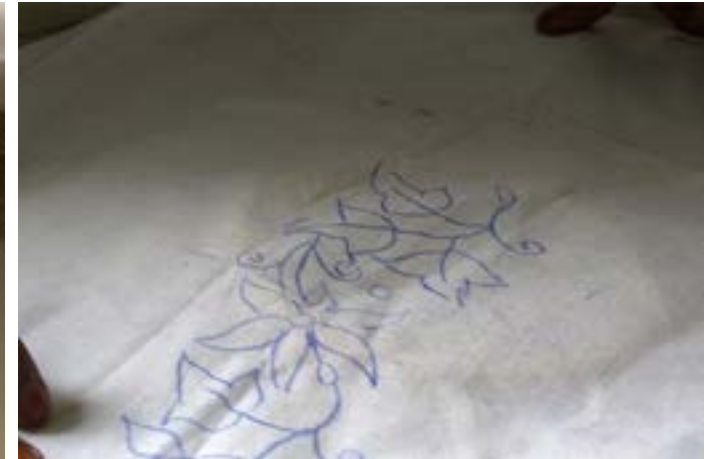
The designed white cloth is set as per requirement over the hoop.