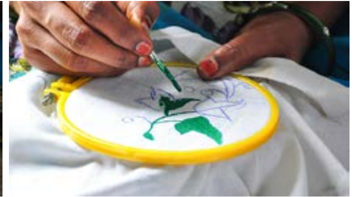
Artisan painting the leaves part with green for more contrasting colours on the fabric.