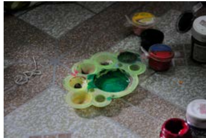
A Paint pallet is used to mix small amounts of paint and water.