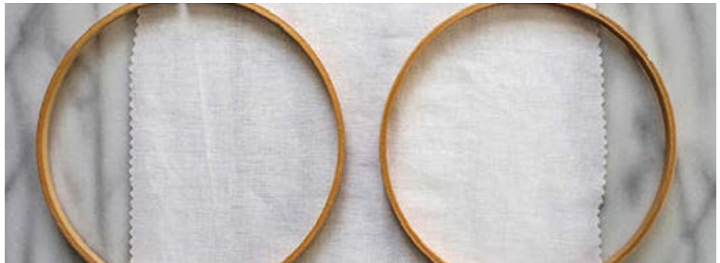
Embroidery hoop and frame with a piece of measured white cloth, are pivotal to the fabric painting.