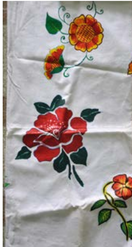
Multiple flower designs arrayed on the fabric.

Fabric cloths are painted with beautiful floral patterns by artisans, which are later stitched to produce various types of garments.