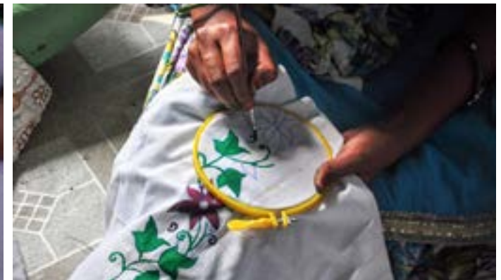
Artisan gently using brush strokes to attain required results.