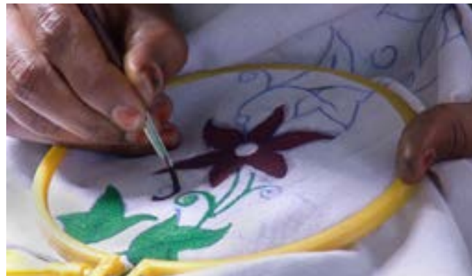
Artisan applying brown colour to the flower and a small part of the stem.