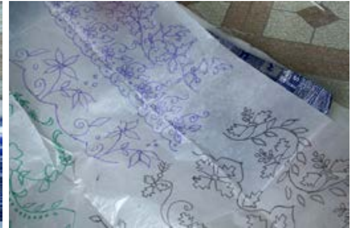
Over the carbon paper, a tracing paper with the intended designs are laid.