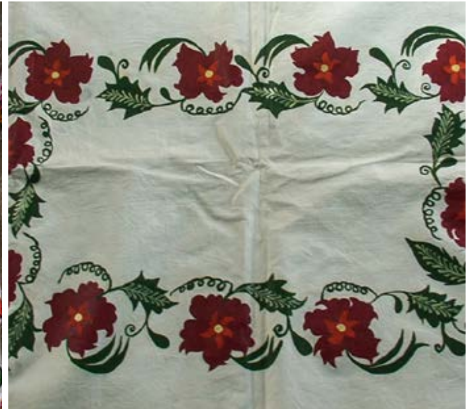
Red-coloured flowers with leaves give sentience to the art on the cloth.