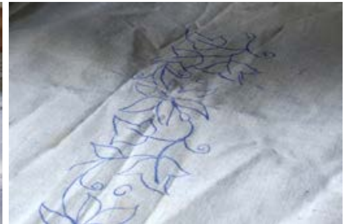
After drawing, the artisan removes the tracing paper and carbon paper from the cloth.