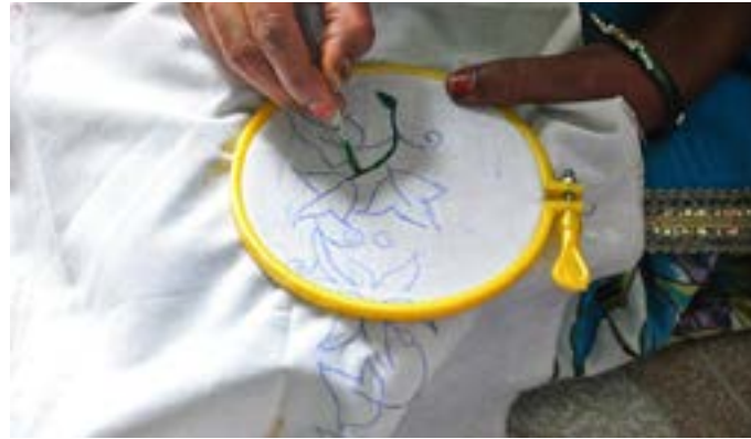
Artisan painting the stem with green paint.