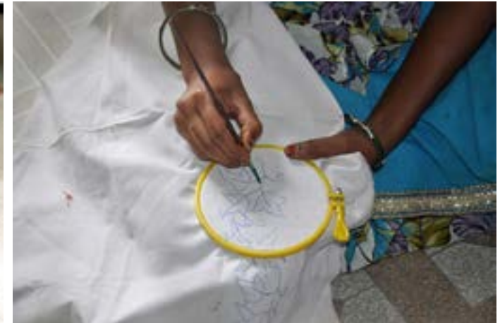
Artisan using a paintbrush to outline the periphery of the design drawn.