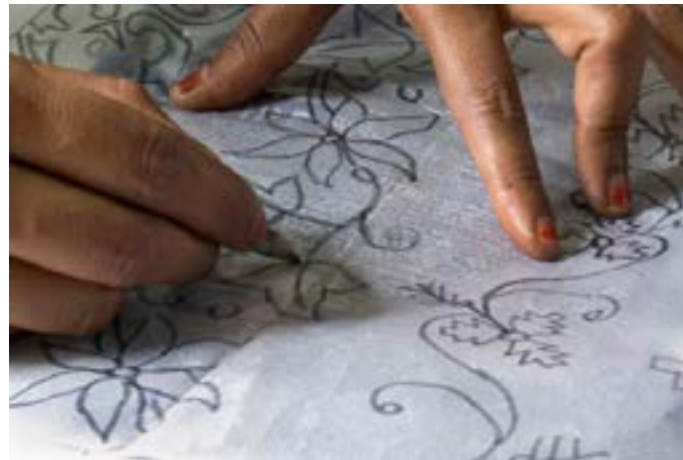
Artisan drawing design over the tracing paper using a pencil.