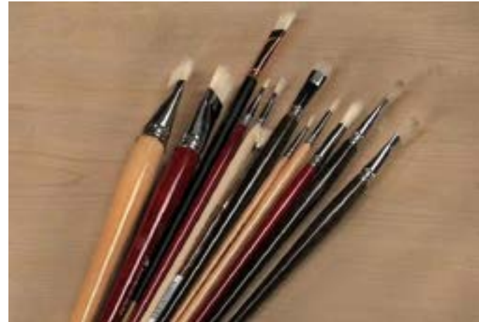
Different-sized paint brushes for painting as per the pattern.

https://www.dsource.in/resource/fabric-painting-yadgiri-karnataka/tools-and-raw-materials