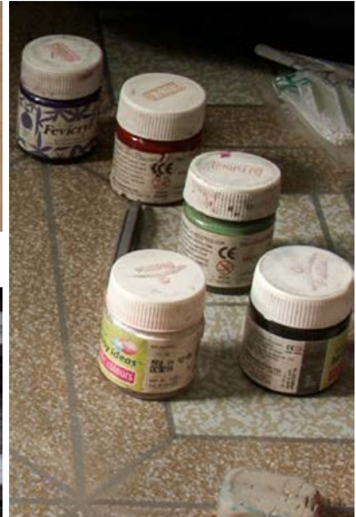
Multiple fabric paint colours are used to highlight the designs.