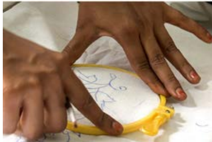
The frame is set on the design for the firmness of the cloth.