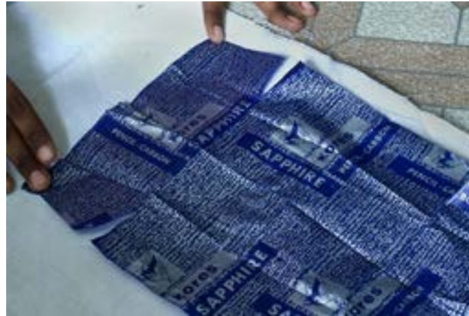
A carbon paper is being placed on the white cloth.

https://www.dsource.in/resource/fabric-painting-yadgiri-karnataka/making-process