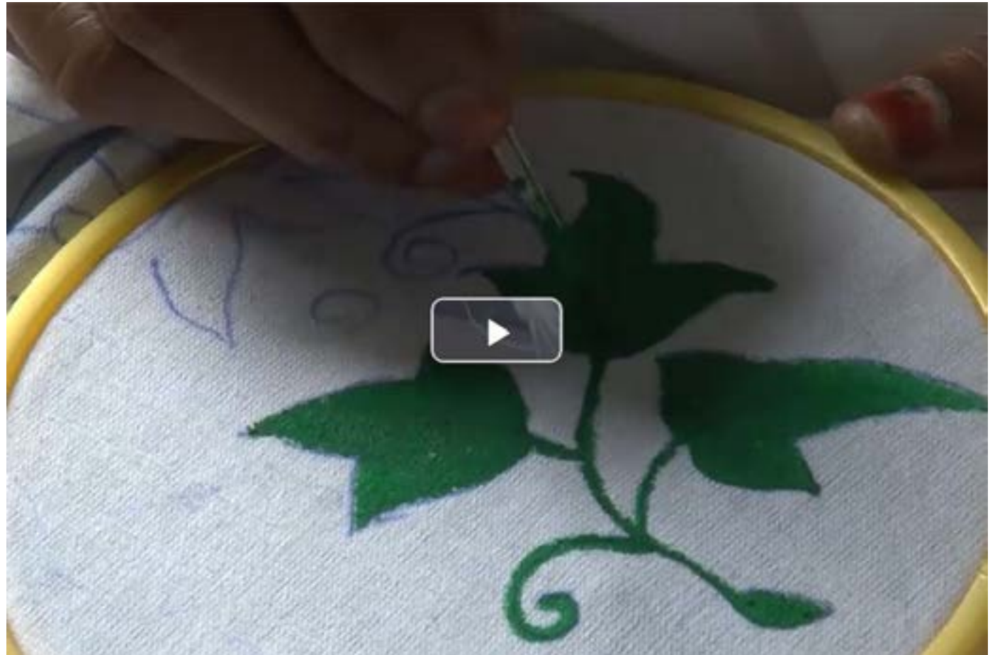
Fabric Painting - Yadgiri