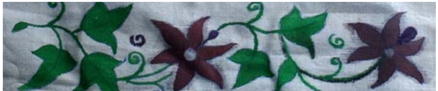
A glimpse of finished work.