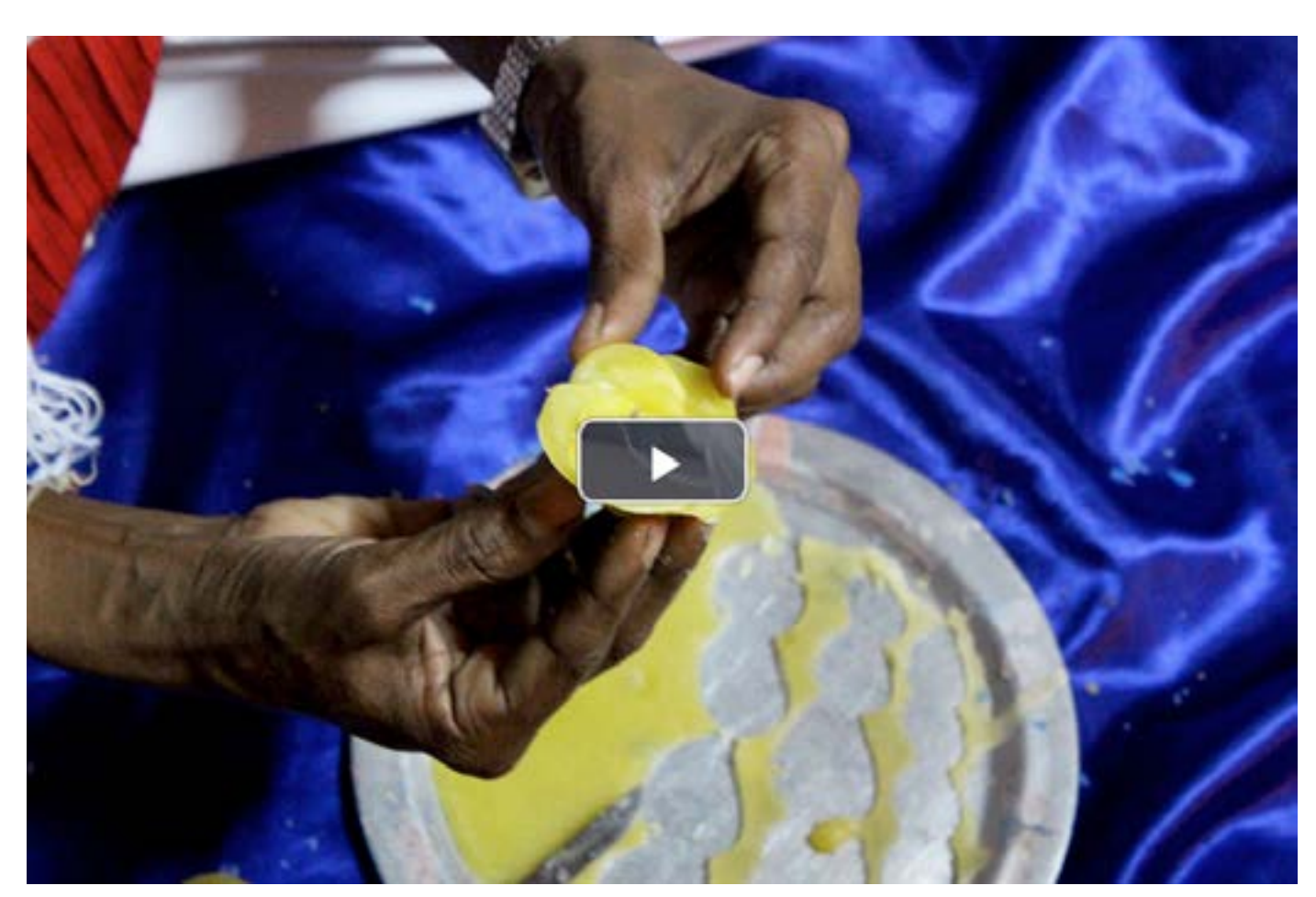
Flower Candle Making - Shiroda, Goa