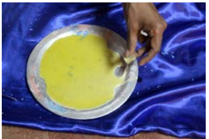
Wax is allowed to cool down until the required consistency is obtained, which eases the process of molding.