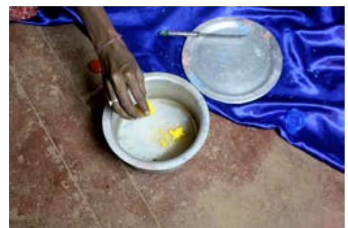
Colour is added to boiled hot wax.