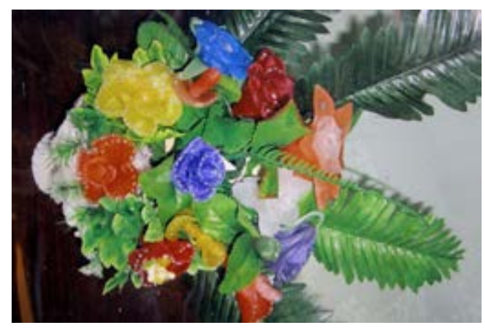
A bouquet of colourful wax flowers.

Artisan named Mrs. Sharmila from Shiroda village makes flower candles. She makes attractive candle art from wax. Flowers, colourful candles, candles in bowls, glasses are few items made from this art. A wide range of colourful and aromatic candles are also made. The price ranges from INR 20 and above.