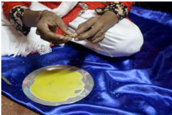
Wax is cut as per the chosen design into required size, shape and folded accordingly.