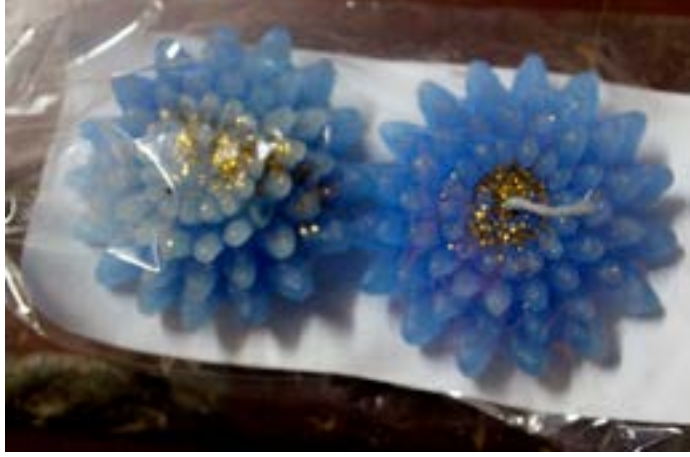
Flower candles are very popular during Diwali festival and other celebrations.