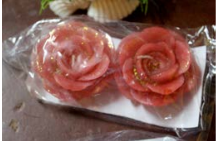
Some candles are so realistic, can be mistaken for looking like flowers.