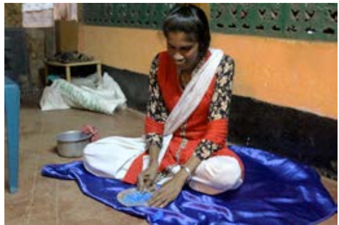
Artisan is involved in candle art making process.