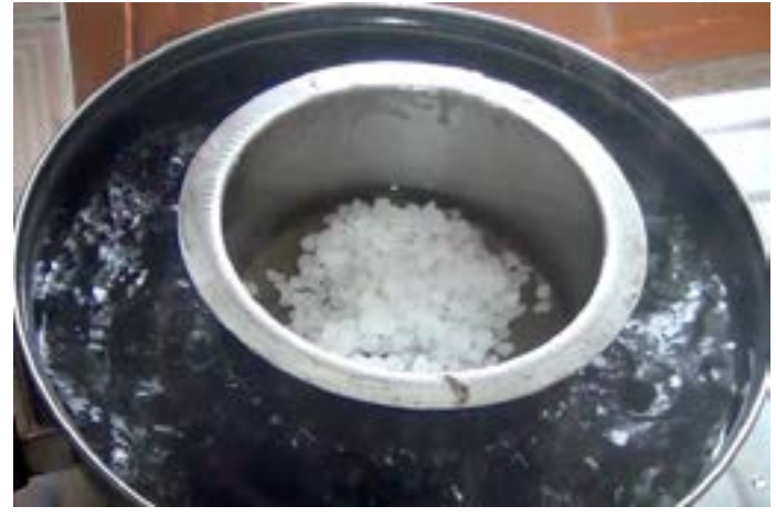
Solid wax is melt using double boiler to avoid burning of wax.