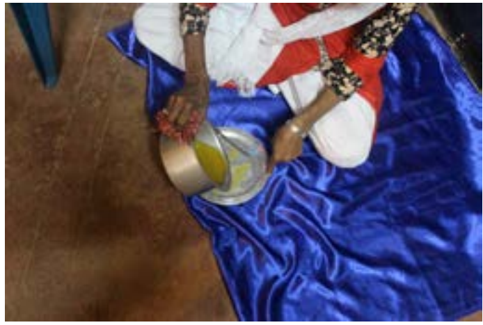
Dyed wax is poured in the plate and allowed to cool for 5 to 8 minutes.