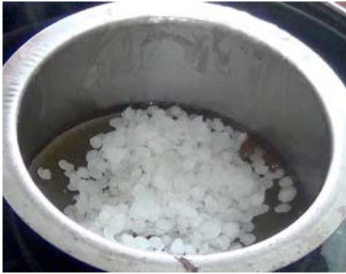
Wax is the primary raw material used for making candle art.