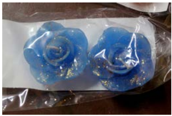
Flower shape candle used as decorative element in modern household.