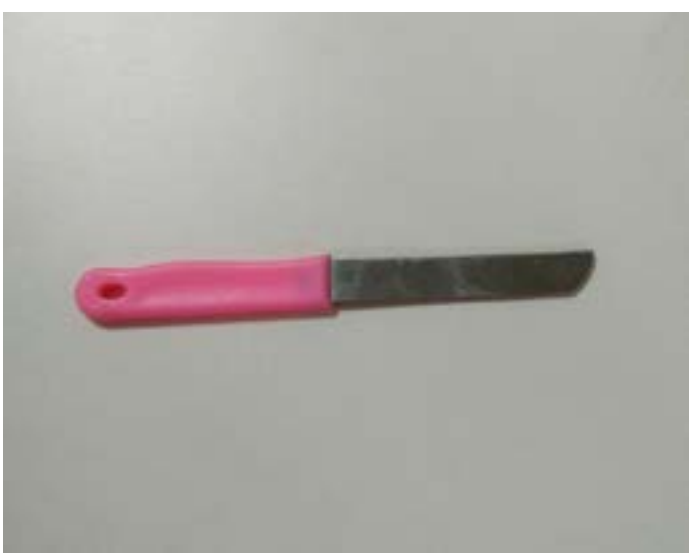
Knife is used for cutting the shapes from melted wax.