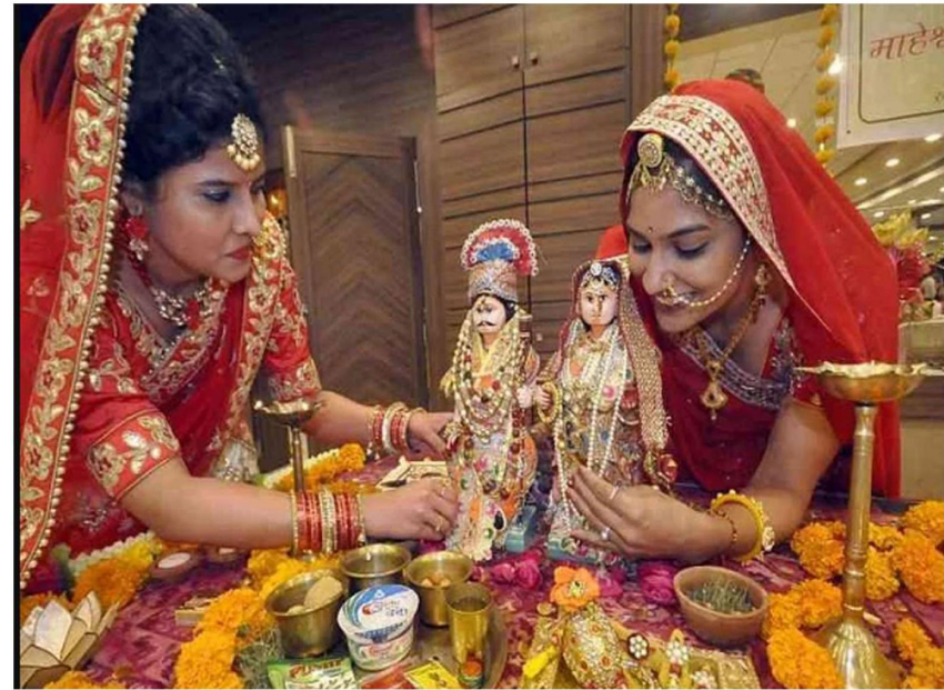
Fig 18: Preparation for the last day of Gangaur

17 th day- The customary gift hamper of Sinjara is sent by to married woman from their houses on the second last day of the festival consisting of clothes, money, sweets and jewellery.