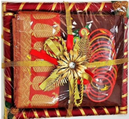
Fig 14: Example of a Sinjara hamper