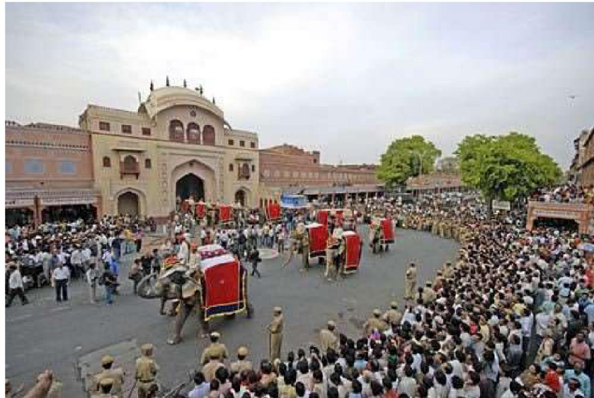
Fig 7: Jaipur Gangaur procession near the city palace

their heads. Bands baaja are also a part of this procession as they sing traditional and folk songs. The event ends with the immersion of the idols in a bawdi or johad (step wells), bidding farewell to Goddess Gauri and Lord Shiva. Often, people from distant corners of the town also join to witness this colourful affair. In Rajasthan, some tribes also hold Gangaur as an auspicious event for choosing future life partners.