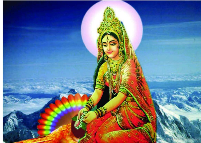
Fig 3: Parvati, the wife of Shiva

The term "Shakti" has always held a special status in the Hindu religion. Shakti refers to an exclusively feminine principle and is perceived in all phenomena of life. The originator of life on Earth, it is responsible for the movement of all things, be it the cosmic objects or the various forces of nature. Deprived of Shakti, all creation on the planet will be rendered inept. Numerous ancient Indian texts, like the Vedas, Puranas and Epics bear citation of this cosmic power, recognizing its godly form as Parvati, the wife of Hindu God, Shiva. Over the ages, Shakti has been synonymous to a myriad of forms and identified under many names, one of which is Gauri. And as is suggestive by the name, the notable Gangaur festival is observed in honour of this very manifestation of Shakti (Gauri). [2]