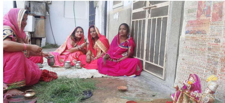
Fig 17: Gangaur pooja and katha listening

Goddess Gauri was shocked to see him. Mahadevji mocked her "You were ashamed to bring me along as I was in the form of a Yogi. But you are not feeling ashamed to eat food with a shoemaker." Gauri got annoyed, and told Mahadevji that this is the type of prank he should play on his friends, and not on her."