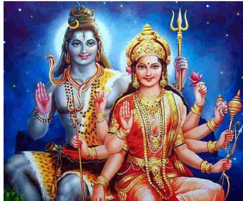
Fig 2: Divine couple of Lord Shiva and Parvati

The word Gangaur is made up of two words, “Gana” or “Gan” is the synonym for Lord Shiva and “Gaur” which stands for Gauri or Parvati. They’re considered an ideal couple and Gangaur worship symbolizes “Saubhagya” or marital bliss.