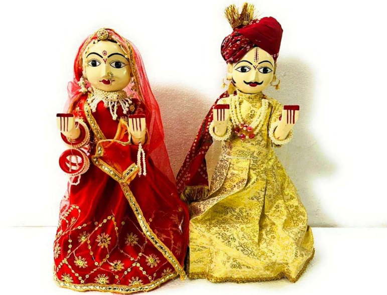
Fig 13: Beautifully dressed clay idols of Gan and Gaur

adorned in new attire and jewellery with ornaments specially made for this festival idols.