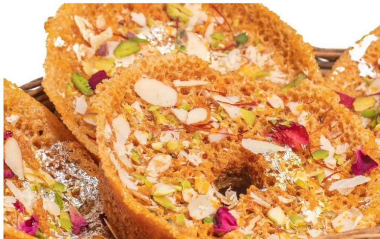
Fig 15: Sweet dish of "Ghewar"

Decorating hands and feet with beautiful designs made out of Mehndi (myrtle paste) is also done during Gangaur. Almost all Hindu cultural festivals include applying mehndi with the festivities.