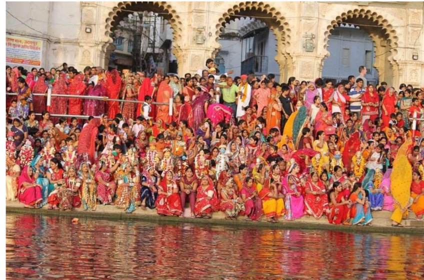
Fig 8: Udaipur Gangaur Ghat immersion of idols

Udaipur, the traditional procession starts from the City Palace, and several other places, which passes through the city. There're processions involving beautiful palanquins, chariots, bullock carts and even performances by various folk artists. On the last day of Ganagur, these idols of Gan and Gaur are immersed in Lake Pichola from this Ghat.