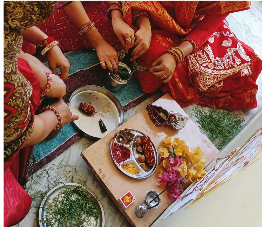
Fig 10: Pooja samagri in a typical household

Plain white paper, mehndi, kajal, rice, moli, brass kalash full of water, flowers, green grass (dub, jawara) & Gangaur's geet book.