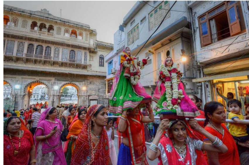
Fig 6: Last day of Gangaur procession

Gangaur is traditionally celebrated all over Rajasthan with special significance for the women of the Thar desert region i.e., Bikaner, Jodhpur, Jaipur, etc. It is also celebrated in some parts of Uttar Pradesh, Madhya Pradesh, West Bengal, Haryana and Gujarat.