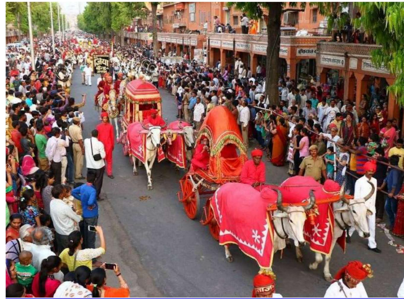
Fig 1: Gangaur procession in the city bazaar of Jaipur

Gangaur is one of the most awaited and vibrant festival for the women of Rajasthan. It is celebrated with great fervour and enthusiasm over the state. It is a huge local festival for both married women and young maidens to celebrate harvest, spring, marital harmony and child bearing.