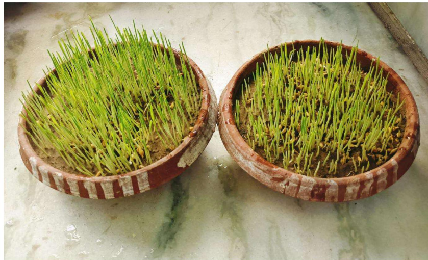
Fig 12: Wheatgrass or Jawara sown in earthen pots

Jawario is a shallow earthen bowl and is used for sowing wheat in the ashes collected after the festival of Holi. Then during the Gangaur festival women carry this vessel on their head singing songs and throw it in a well. The vessel is made on wheel and is never decorated. [3]