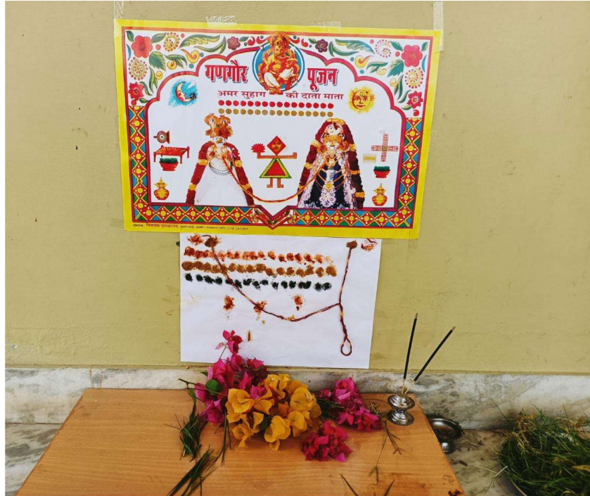
Fig 11: Everyday Gangaur pooja setup

Women can't drink or eat anything before performing this pooja every day of Gangaur. Some women observe fast all days of Gangaur while some women fast on the last day of Gangaur.