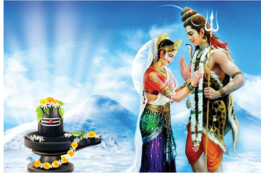
Fig 9: Shiva Parvati Vrat Katha about the Gangaur worship

Reading aloud of Vrat Katha is mandatory for the devotees as part of the ritual. Following is one of the common Vrat Kathas read during the pooja: