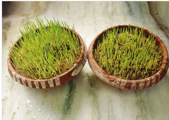
Wheatgrass or Jawara sown in earthen pots.

Jawario is a shallow earthen bowl and is used for sowing wheat in the ashes collected after the festival of Holi. Then during the Gangaur festival women carry this vessel on their head singing songs and throw it in a well. The vessel is made on wheel and is never decorated. [3]