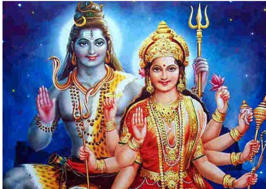
A divine couple of Lord Shiva and Parvati.

The word Gangaur is made up of two words, “Gana” or “Gan” is the synonym for Lord Shiva and “Gaur” which stands for Gauri or Parvati. They’re considered an ideal couple and Gangaur worship symbolize “Saubhagya” or marital bliss.