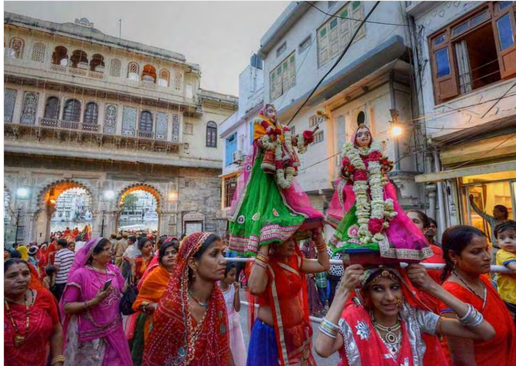
Last day of Gangaur procession.

Gangaur is traditionally celebrated all over Rajasthan with special significance for the women of the Thar desert region i.e., Bikaner, Jodhpur, Jaipur, etc. It is also celebrated in some parts of Uttar Pradesh, Madhya Pradesh, West Bengal, Haryana and Gujarat.