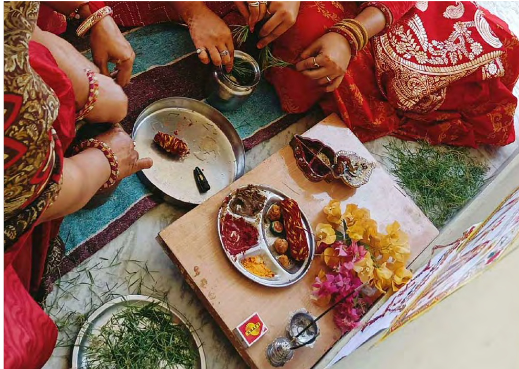
Pooja samagri in a typical household.

Plain white paper, mehndi, kajal, rice, moli, brass kalash full of water, flowers, green grass (dub, jawara) and Gangaur's geet book.