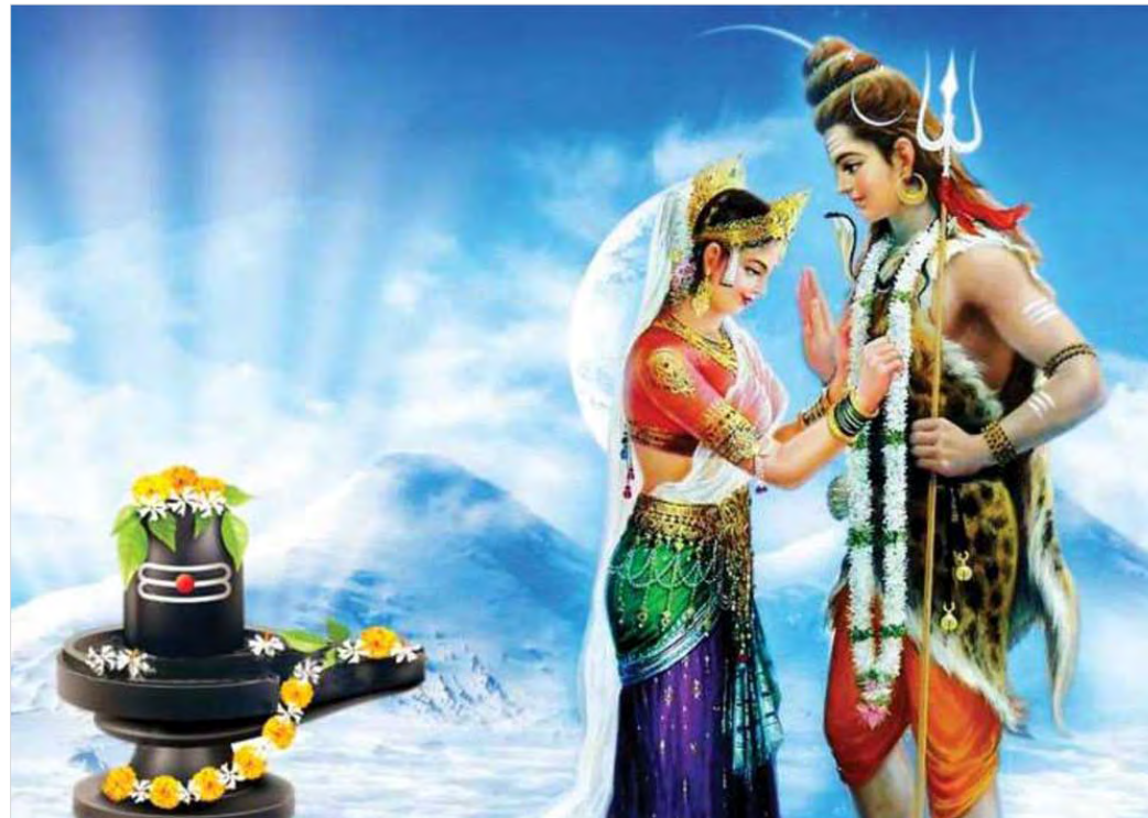
Shiva Parvati Vrat Katha about the Gangaur worship.