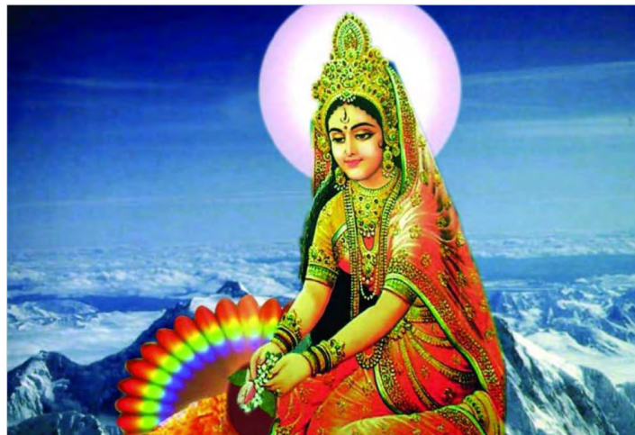
Parvati, the wife of Shiva.

The term "Shakti" has always held a special status in the Hindu religion. Shakti refers to an exclusively feminine principle and is perceived in all phenomena of life. The originator of life on Earth, it is responsible for the movement of all things, be it the cosmic objects or the various forces of nature. Deprived of Shakti, all creation on the planet will be rendered inept. Numerous ancient Indian texts, like the Vedas, Puranas and Epics bear citation of this cosmic power, recognizing its godly form as Parvati, the wife of Hindu God, Shiva. Over the ages, Shakti has been synonymous to a myriad of forms and identified under many names, one of which is Gauri. And as is suggestive by the name, the notable Gangaur festival is observed in honour of this very manifestation of Shakti (Gauri). [2]