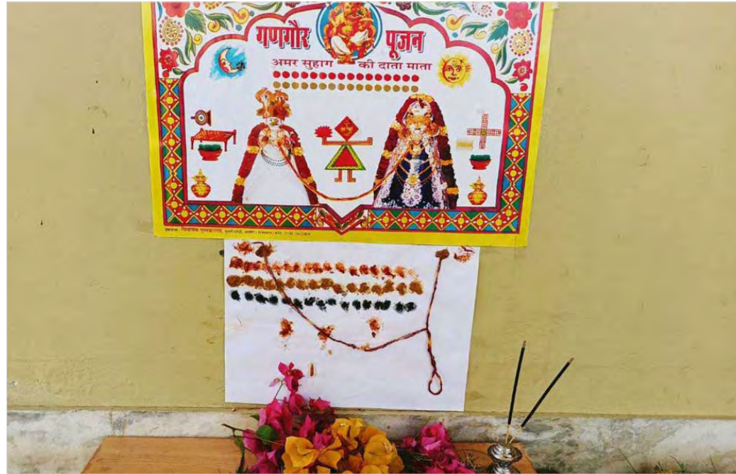
Everyday Gangaur pooja setup.

Women can't drink or eat anything before performing this pooja every day of Gangaur. Some women observe fast all days of Gangaur while some women fast on the last day of Gangaur.