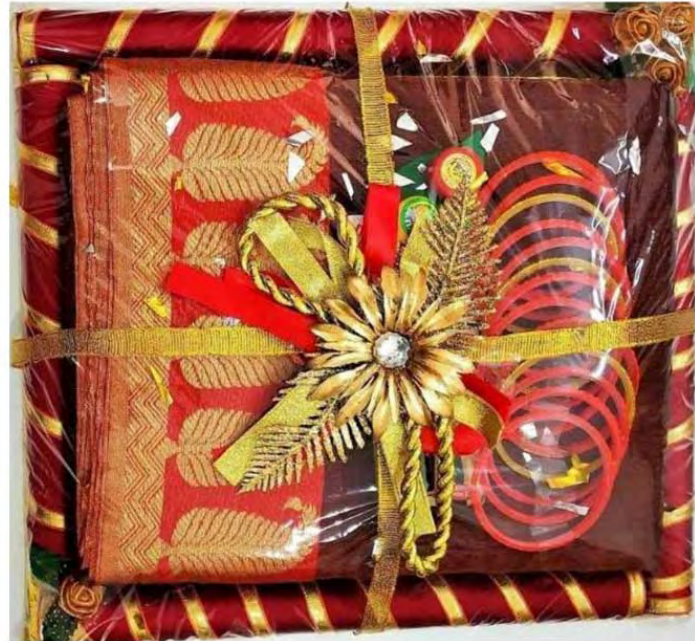
Example of a Sinjara hamper.

Married woman receives gift hampers from their parents known as Sinjara, which comprises of clothes, jewellery items, makeup items and a sweet dish called Ghewar is characteristic of the Gangaur festival. Women utilize this hamper to get ready on the final or main celebration day. People buy ghewar for themselves and to distribute it among relatives and friends.