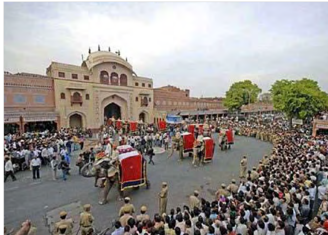
Jaipur Gangaur procession near the city palace.

Rajasthan, particularly Jaipur is widely known for its grand and vibrant culture and celebration of events, and the Gangaur festival is no different. Various fairs are seen in different corners of the state, with intriguing processions and celebration. Traditionally, a group of women beautifully dressed in exquisite attires and jewellery, process around the town with the beautified idols of Shiva and Gauri placed on their heads. Bands baaja are also a part of this procession as they sing traditional and folk songs. The event ends with the immersion of the idols in a bawdi or johad (step wells), bidding farewell to Goddess Gauri and Lord Shiva. Often, people from distant corners of the town also join to witness this colourful affair. In Rajasthan, some tribes also hold Gangaur as an auspicious event for choosing future life partners.