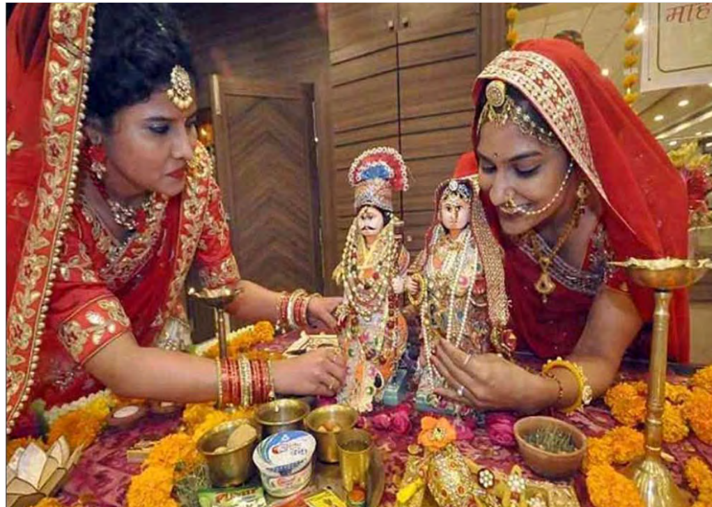
Preparation for the last day of Gangaur.

17th day- The customary gift hamper of Sinjara is sent by to married woman from their houses on the second last day of the festival consisting of clothes, money, sweets and jewellery.