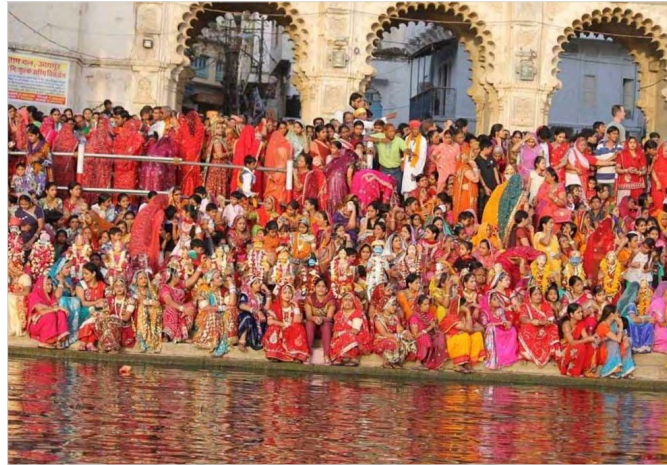
Udaipur Gangaur Ghat immersion of idols.

Udaipur has a Ghat named Gangaur Ghat dedicated to this festival situated on the side of Lake Pichola. This ghat is the prime location for celebration of festivals Like Gangaur, Teej and many others. In Udaipur, the traditional procession starts from the City Palace, and several other places, which passes through the city. There're processions involving beautiful palanquins, chariots, bullock carts and even performances by various folk artists. On the last day of Ganagur, these idols of Gan and Gaur are immersed in Lake Pichola from this Ghat.