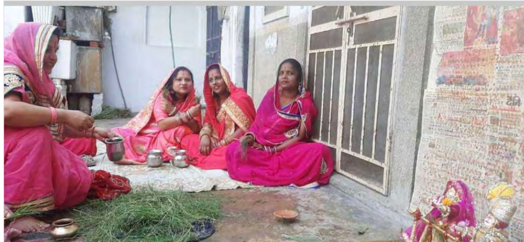
Gangaur pooja and katha listening.

Goddess Gauri was shocked to see him. Mahadevji mocked her "You were ashamed to bring me along as I was in the form of a Yogi. But you are not feeling ashamed to eat food with a shoemaker." Gauri got annoyed, and told Mahadevji that this is the type of prank he should play on his friends, and not on her."