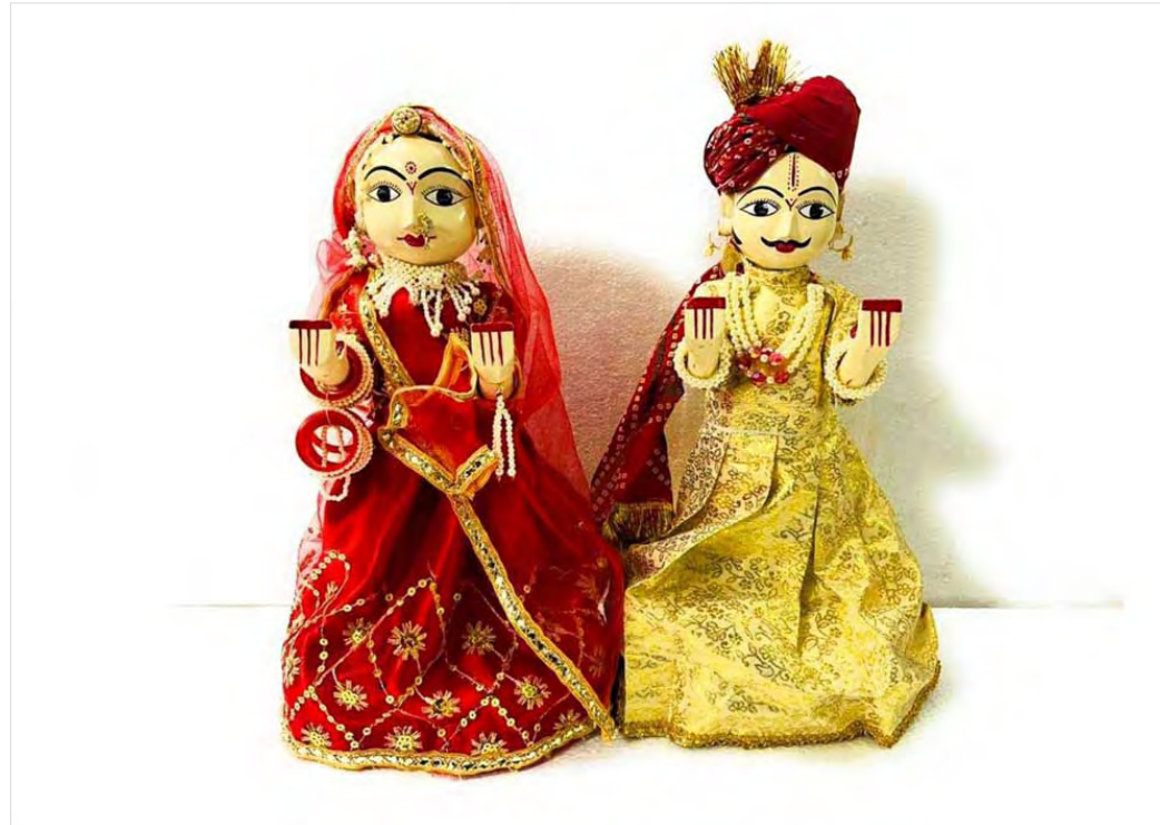
Beautifully dressed clay idols of Gan and Gaur. (Image source)

Clay or wooden idols of Shiva and Gauri are decorated and worshipped during the full course of the festival. These figures are then placed with wheat grass and flowers, wheat plays an important role in the rituals as it signifies harvest. These idols are dressed and adorned in new attire and jewellery with ornaments specially made for this festival idols.