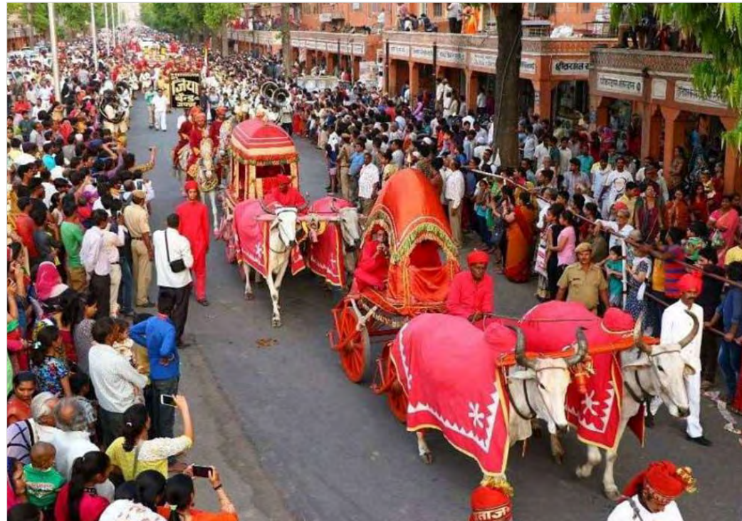
Gangaur procession in the city bazaar of Jaipur.

Gangaur is one of the most awaited and vibrant festivals for the women of Rajasthan. It is celebrated with great fervour and enthusiasm over the state. It is a huge local festival for both married women and young maidens to celebrate the harvest, spring, marital harmony and childbearing.