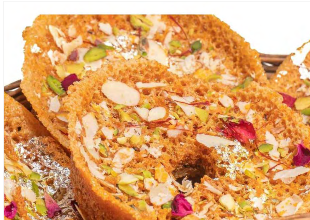
Sweet dish of "Ghewar".